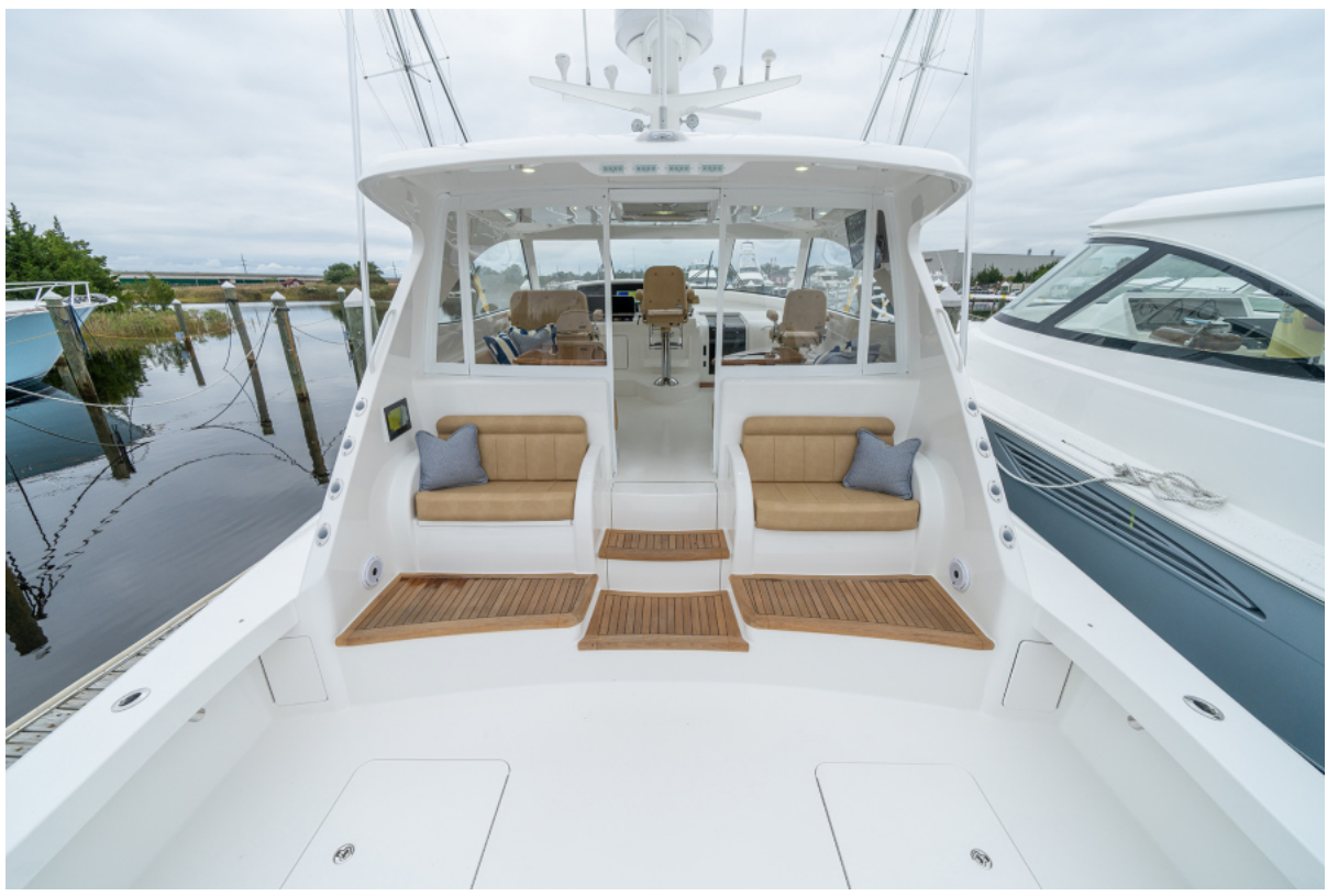
2024 54 Viking Sport Coupe Cockpit