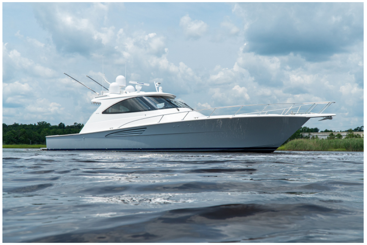
2024 54 Viking Sport Coupe