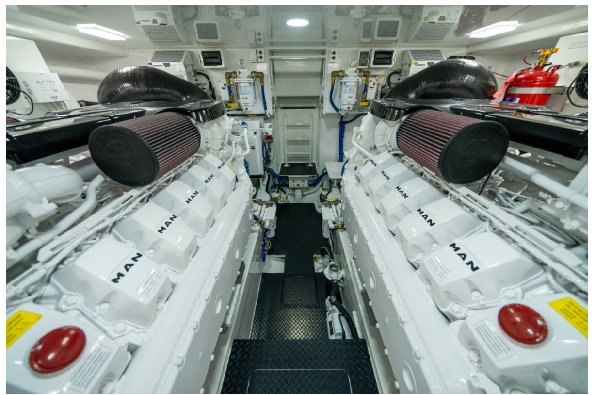
2024 54 Viking Sport Coupe Engine Room