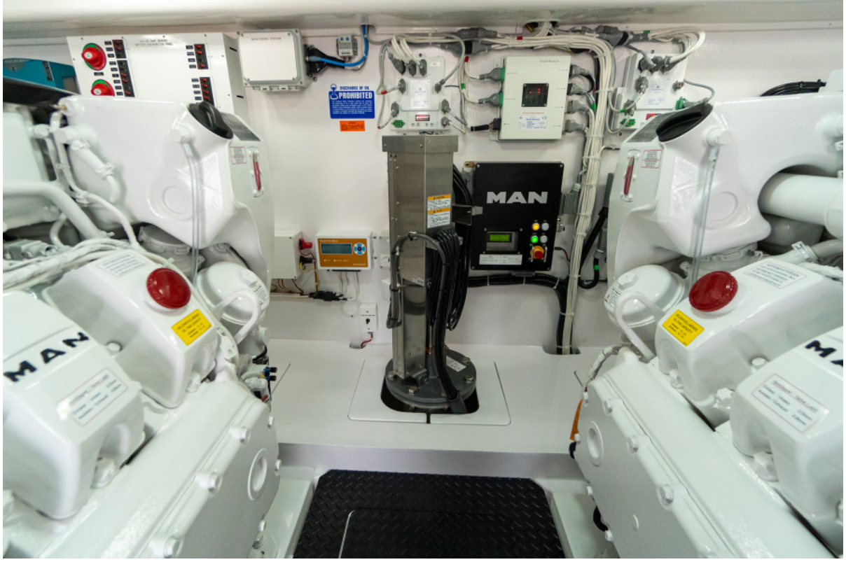
2024 54 Viking Sport Coupe Engine Room