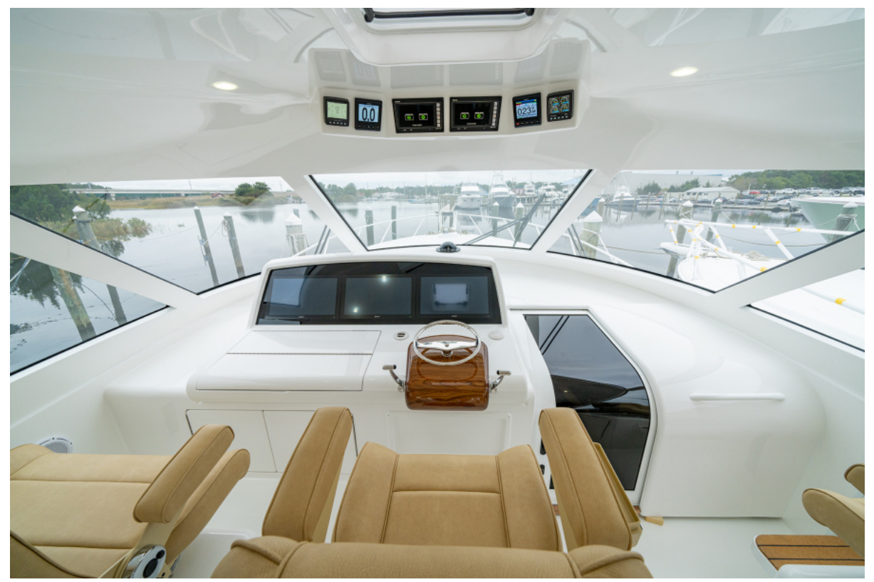
2024 54 Viking Sport Coupe