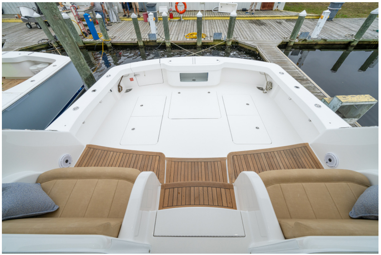
2024 54 Viking Sport Coupe Cockpit