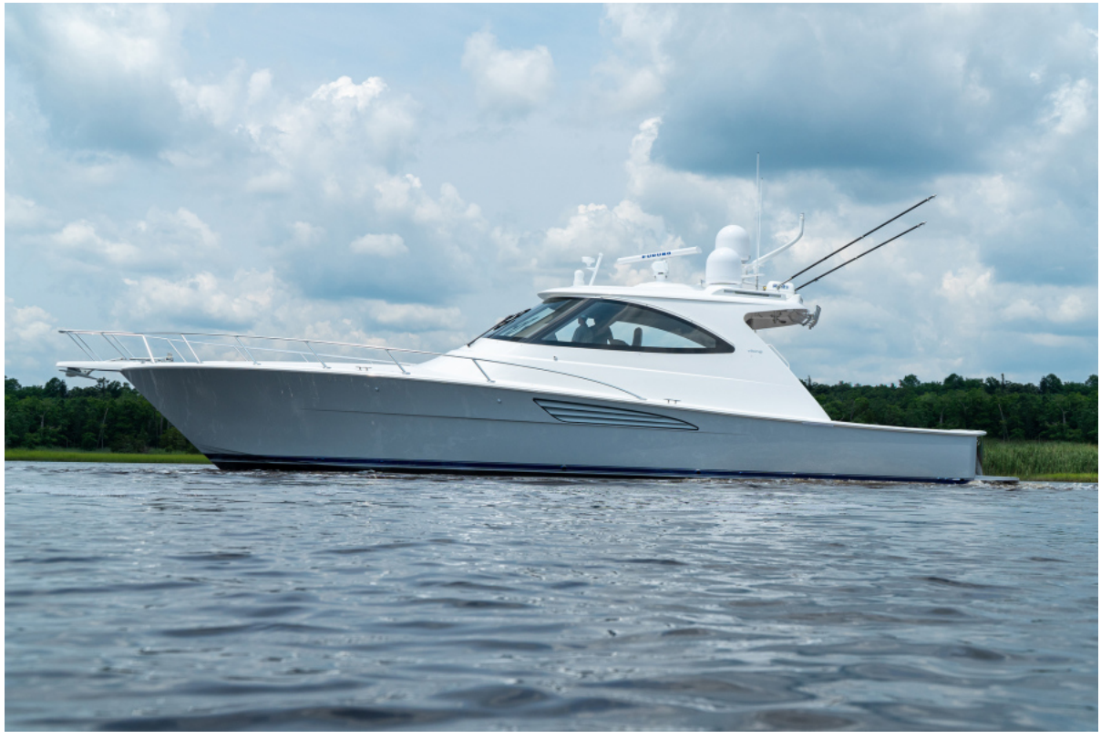
2024 54 Viking Sport Coupe