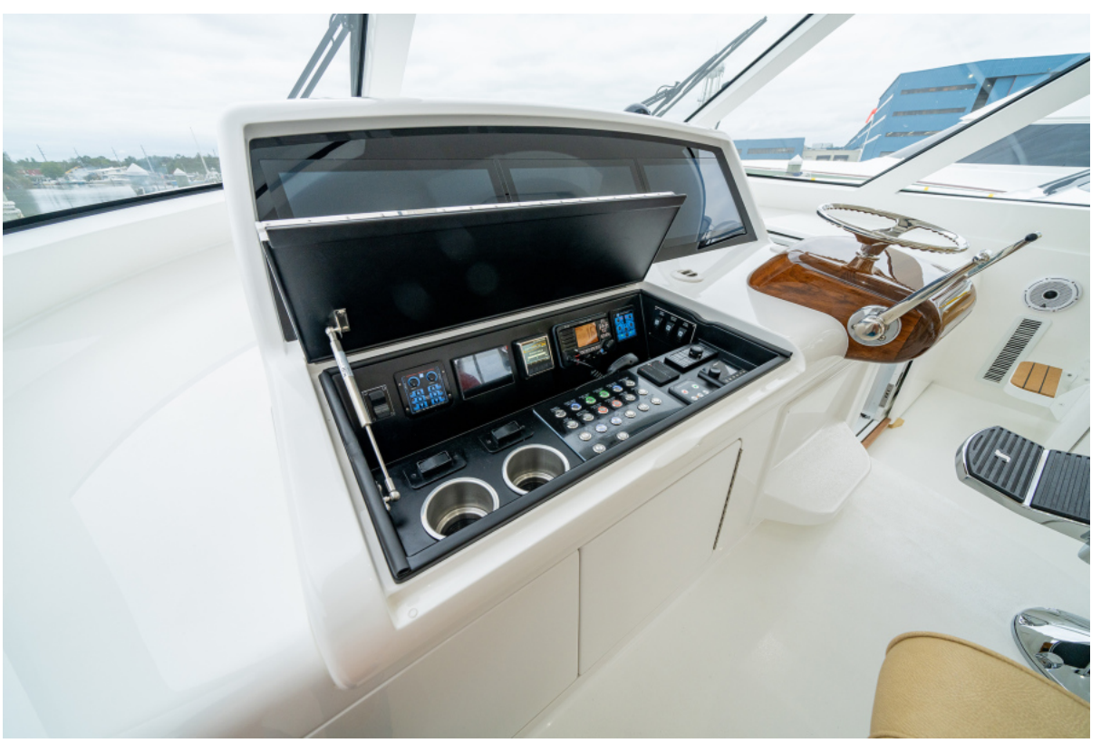
2024 54 Viking Sport Coupe