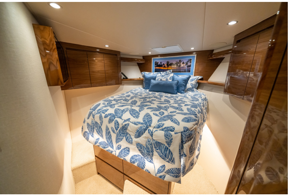
2024 54 Viking Sport Coupe