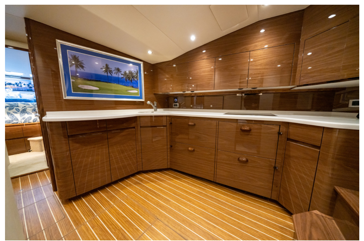
2024 54 Viking Sport Coupe Salon