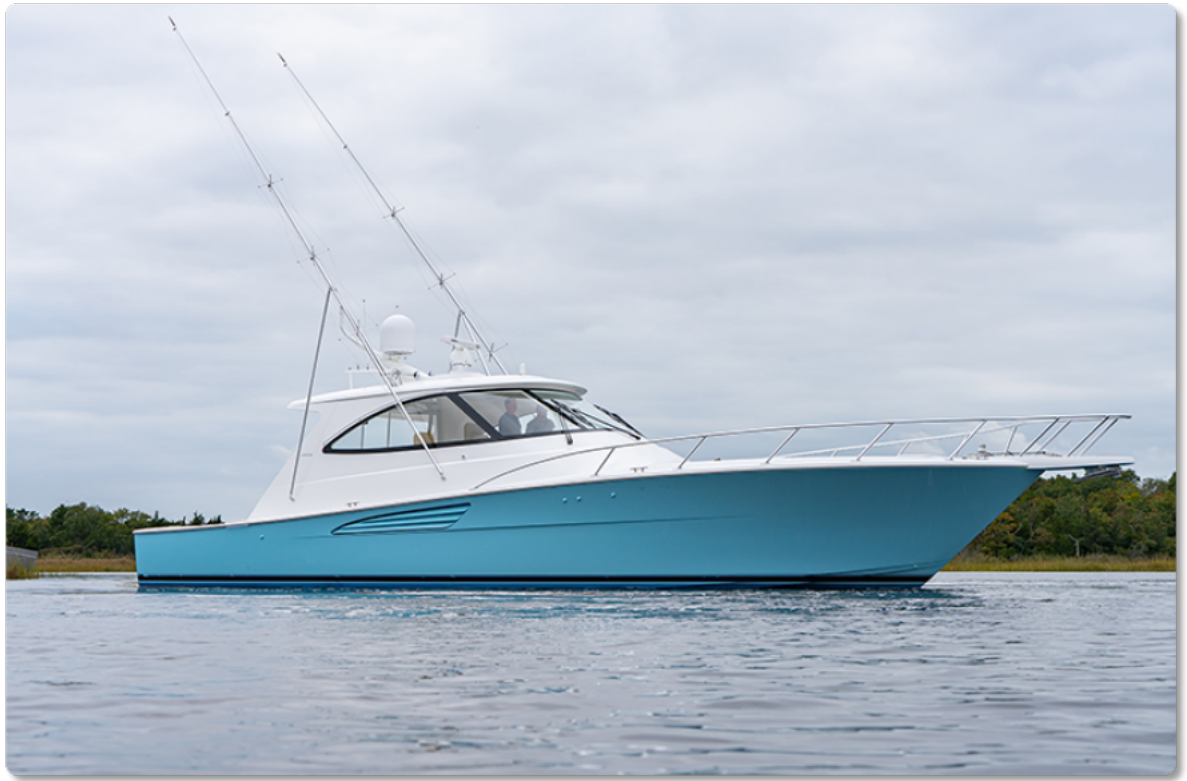
2023 Viking 54 Open