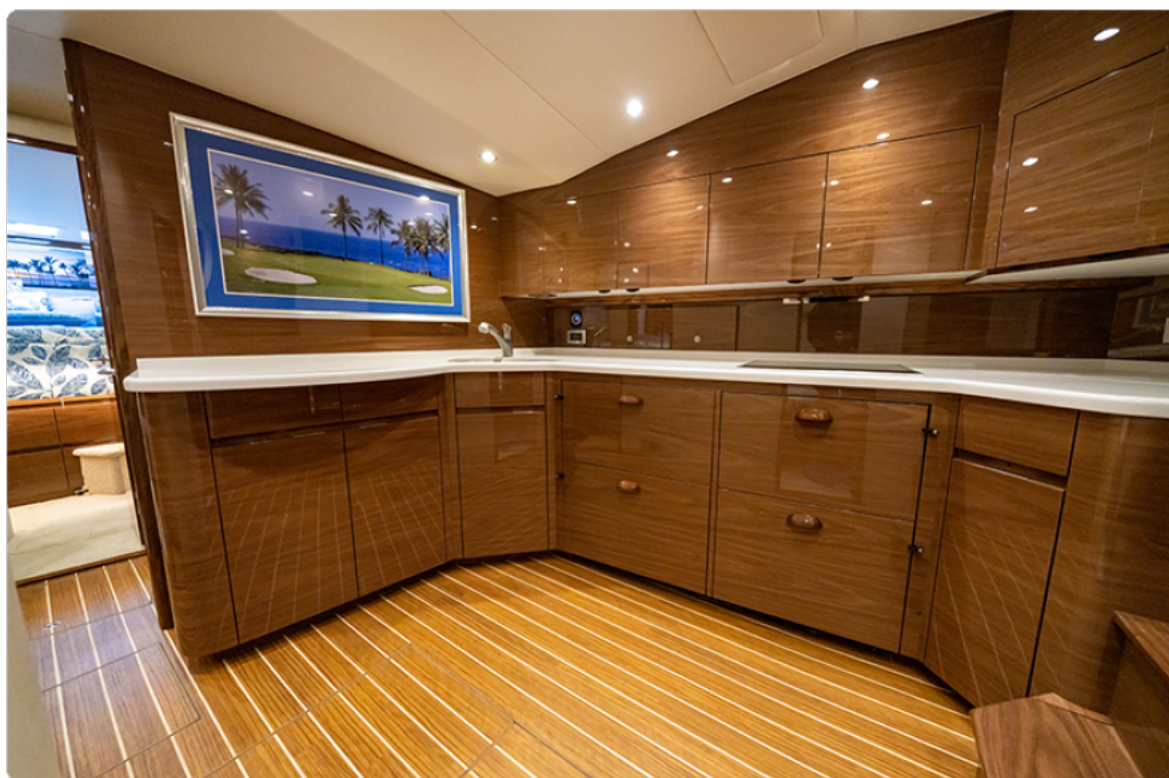
2023 Viking 54 Open Galley