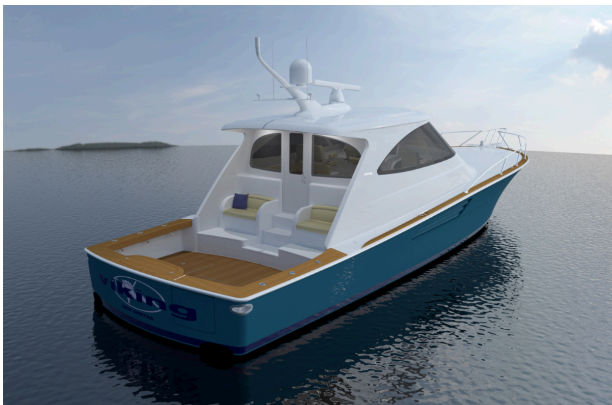
2023 Viking 54 Open Rendering