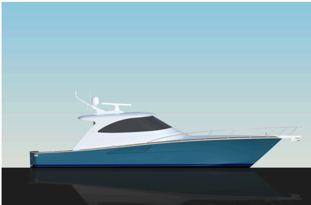
2023 Viking 54 Open Rendering