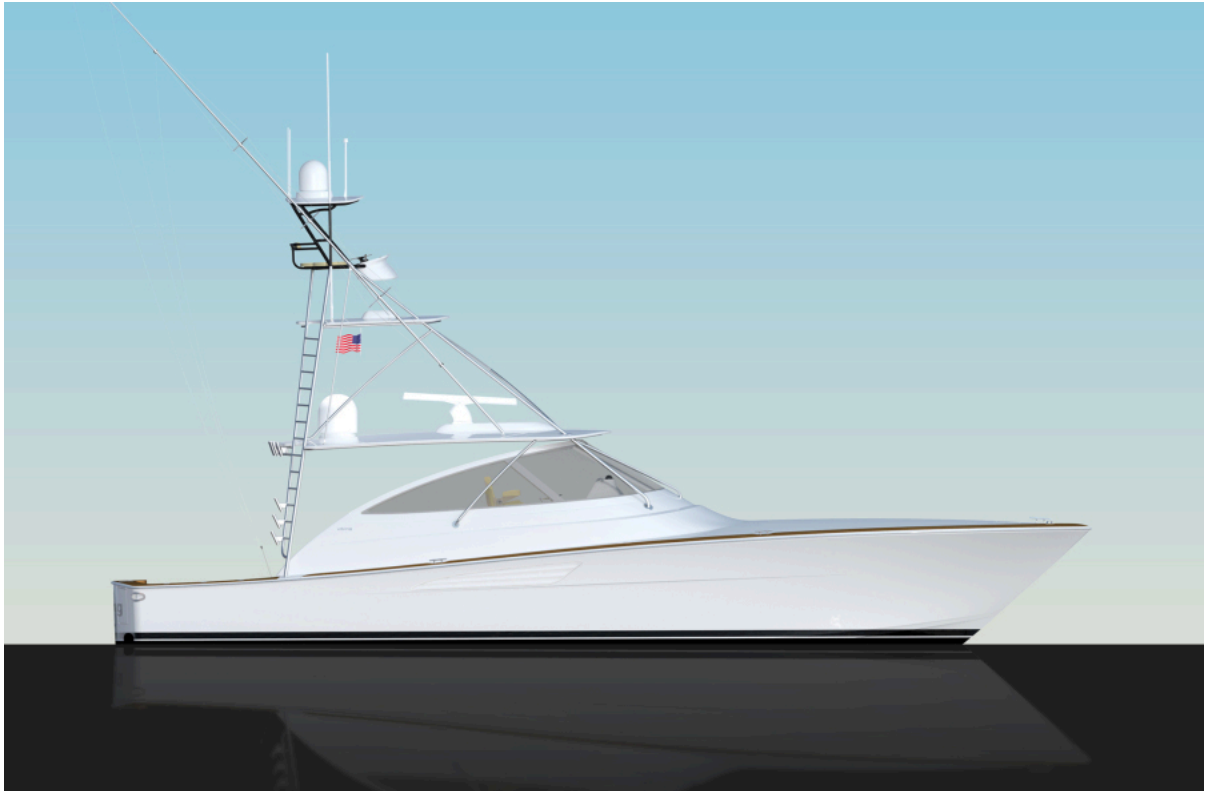
2023 Viking 54 Open Rendering