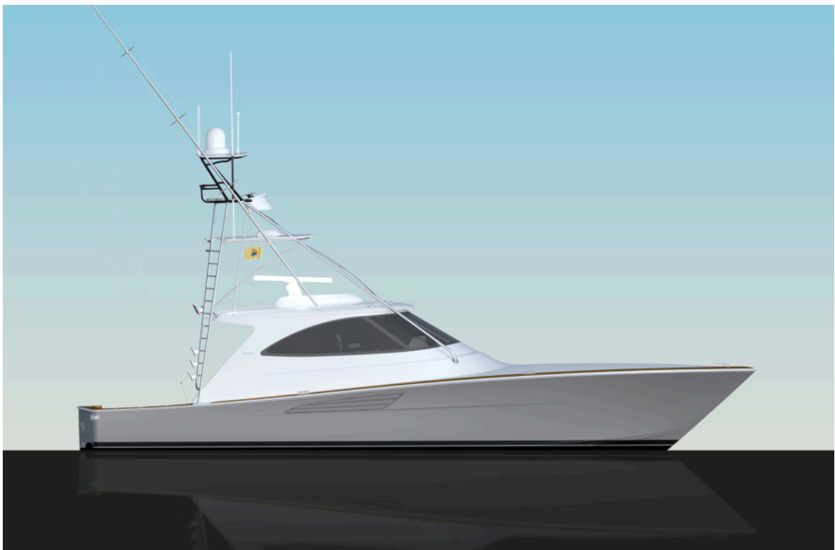
2023 Viking 54 Open Rendering