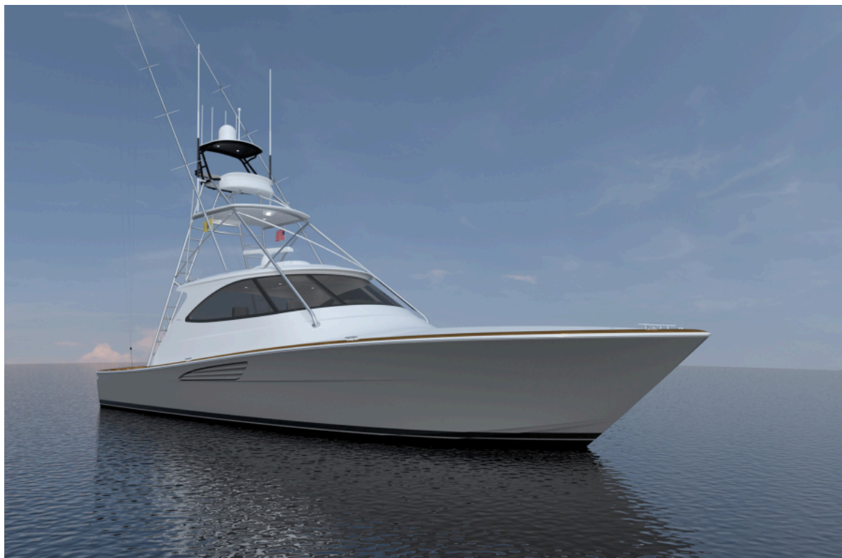
2023 Viking 54 Open Rendering