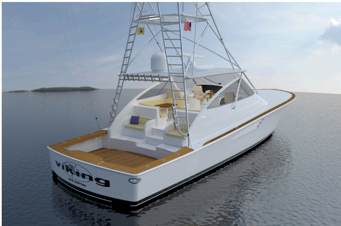
2023 Viking 54 Open Rendering