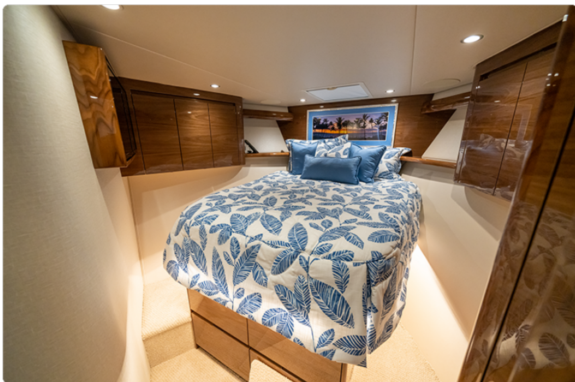
2023 Viking 54 Open Cabin