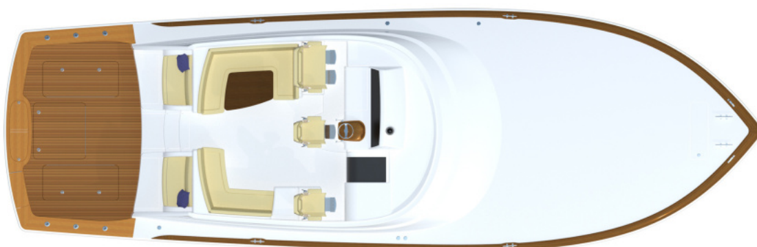
2023 Viking 54 Open Rendering