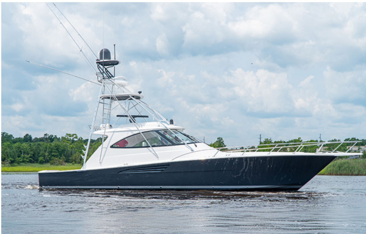
2023 Viking 54 Open