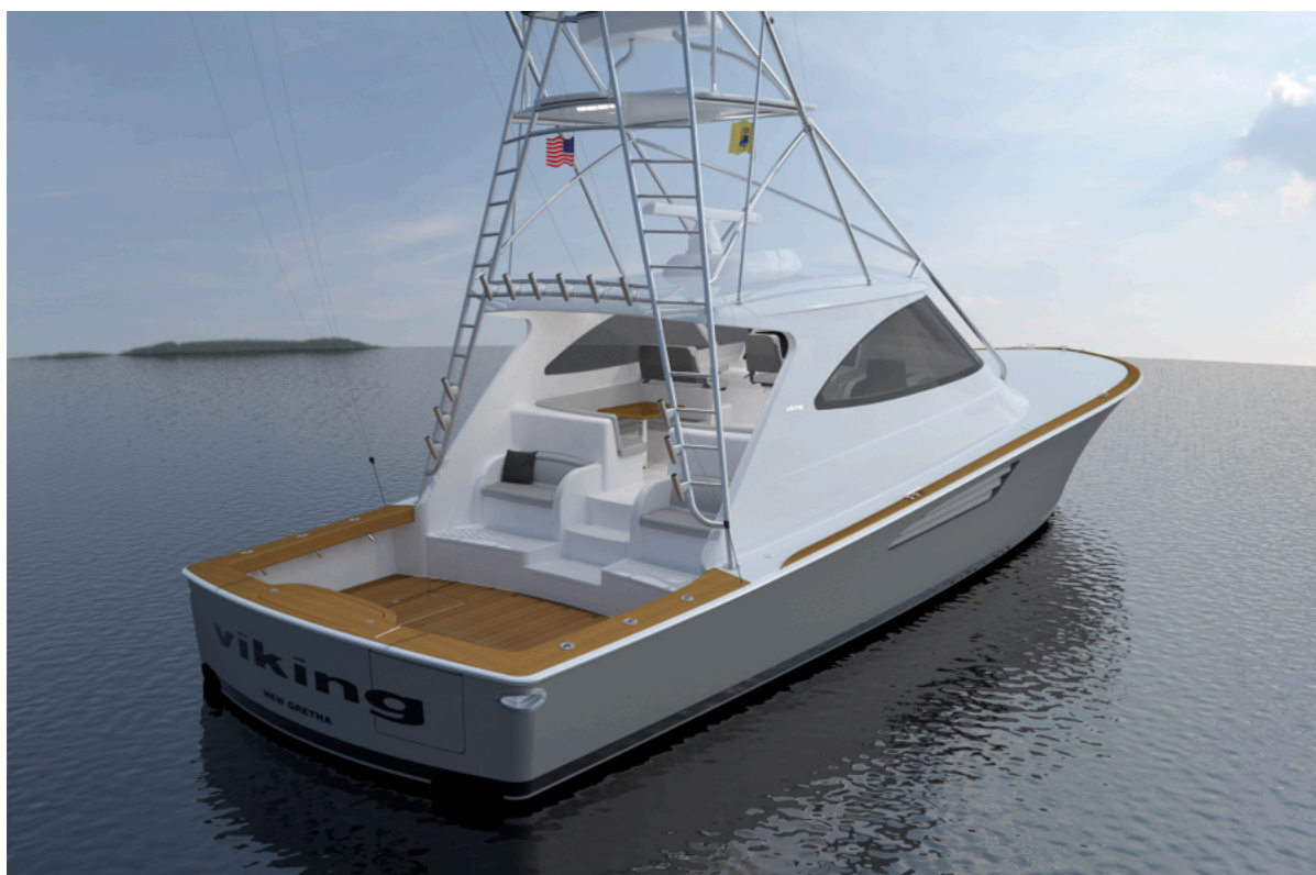
2023 Viking 54 Open Rendering