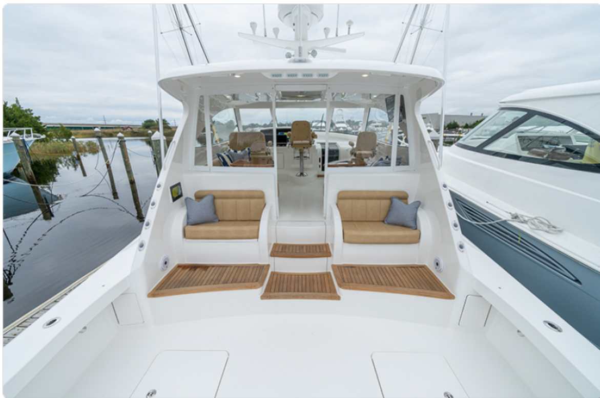
2023 Viking 54 Open Cockpit