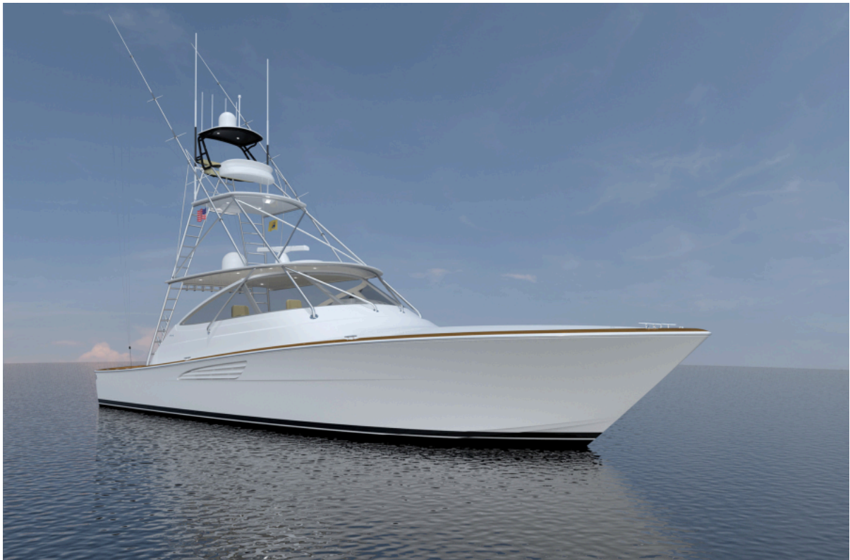
2023 Viking 54 Open Rendering