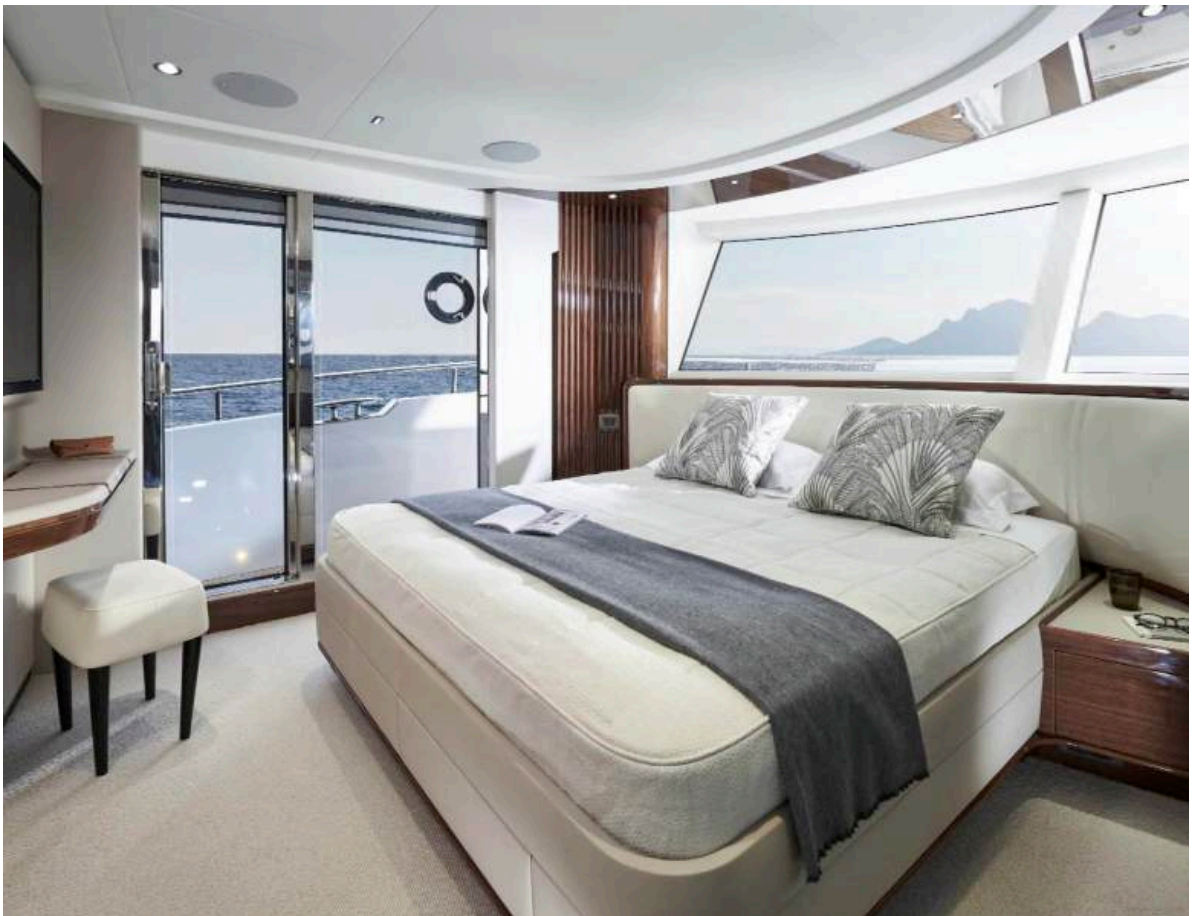
Optional Main Deck Master