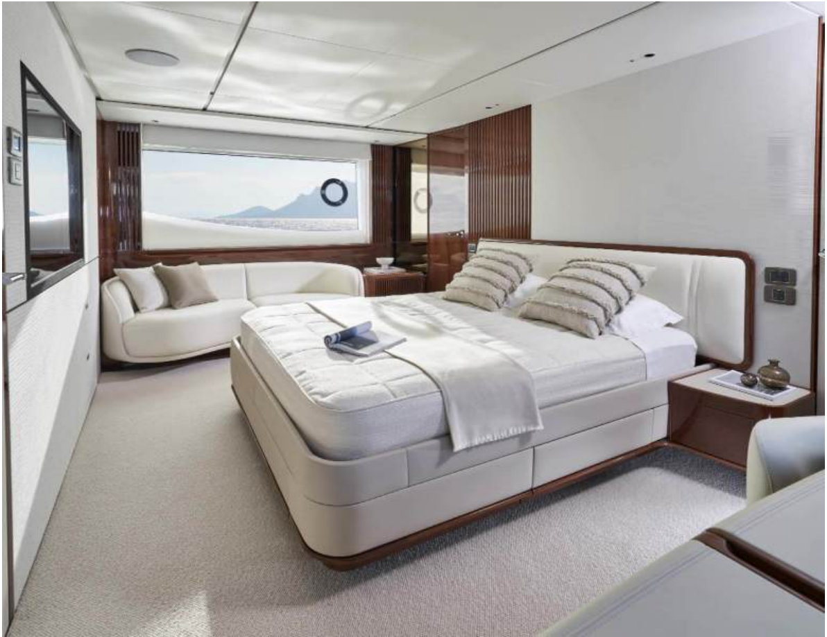
Lower Deck Master