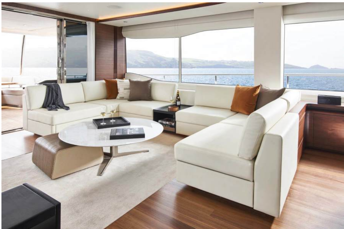
salon- walnut satin