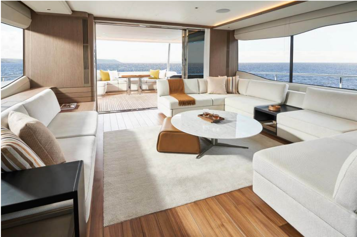
salon - silver oak