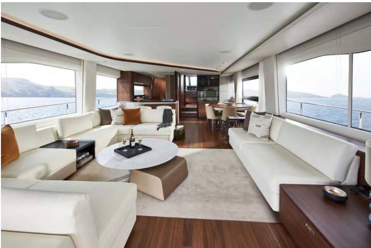
salon -walnut satin