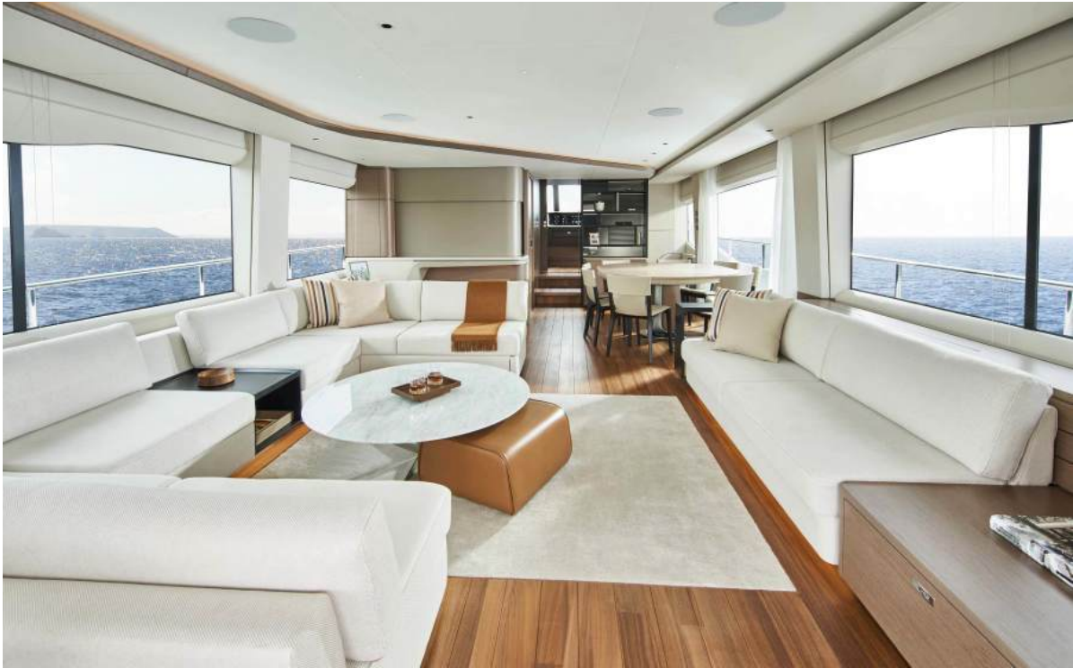
salon- silver oak