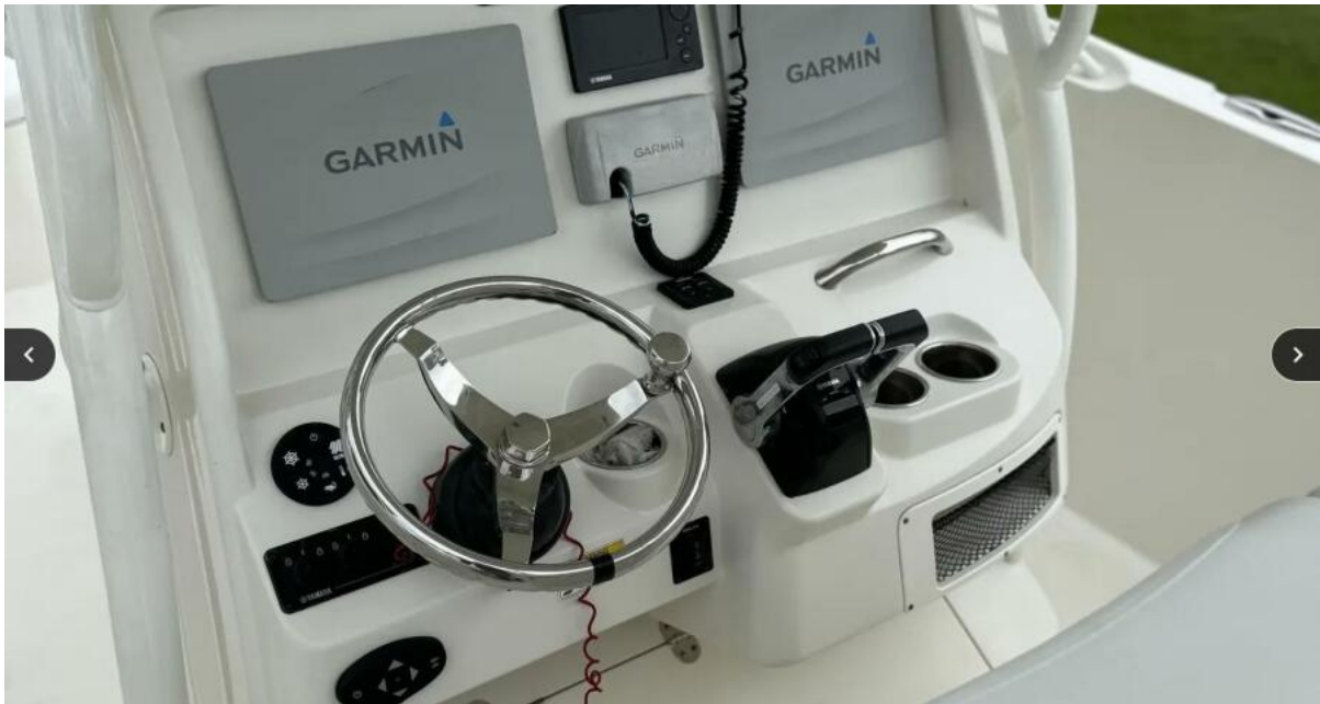
2016 Sailfish 290 CC 2016 Sailfish 290 CC