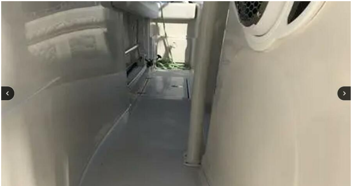
2016 Sailfish 290 CC 2016 Sailfish 290 CC