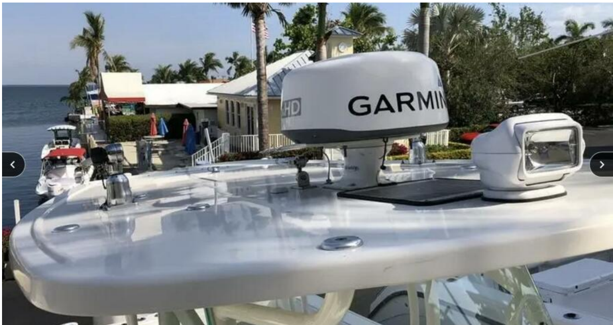
2016 Sailfish 290 CC 2016 Sailfish 290 CC