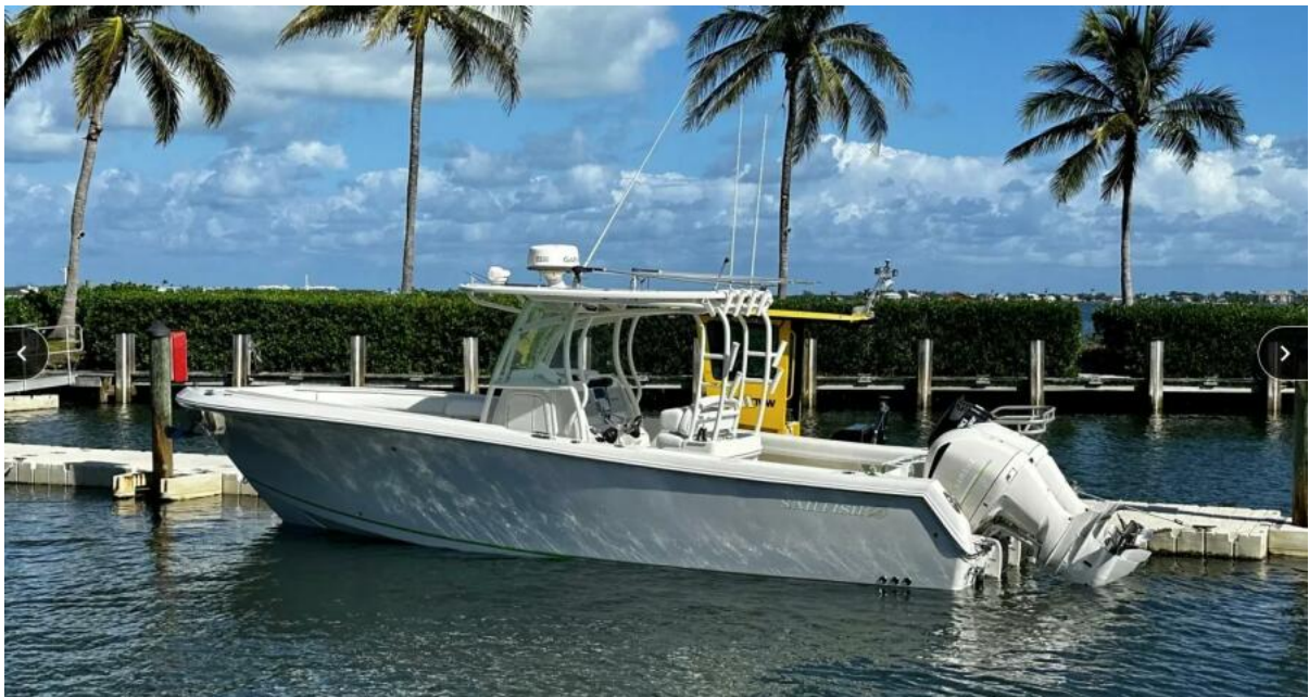
2016 Sailfish 290 CC 2016 Sailfish 290 CC