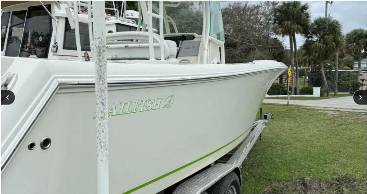
2016 Sailfish 290 CC 2016 Sailfish 290 CC