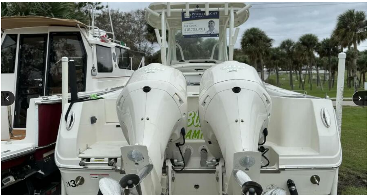
2016 Sailfish 290 CC 2016 Sailfish 290 CC