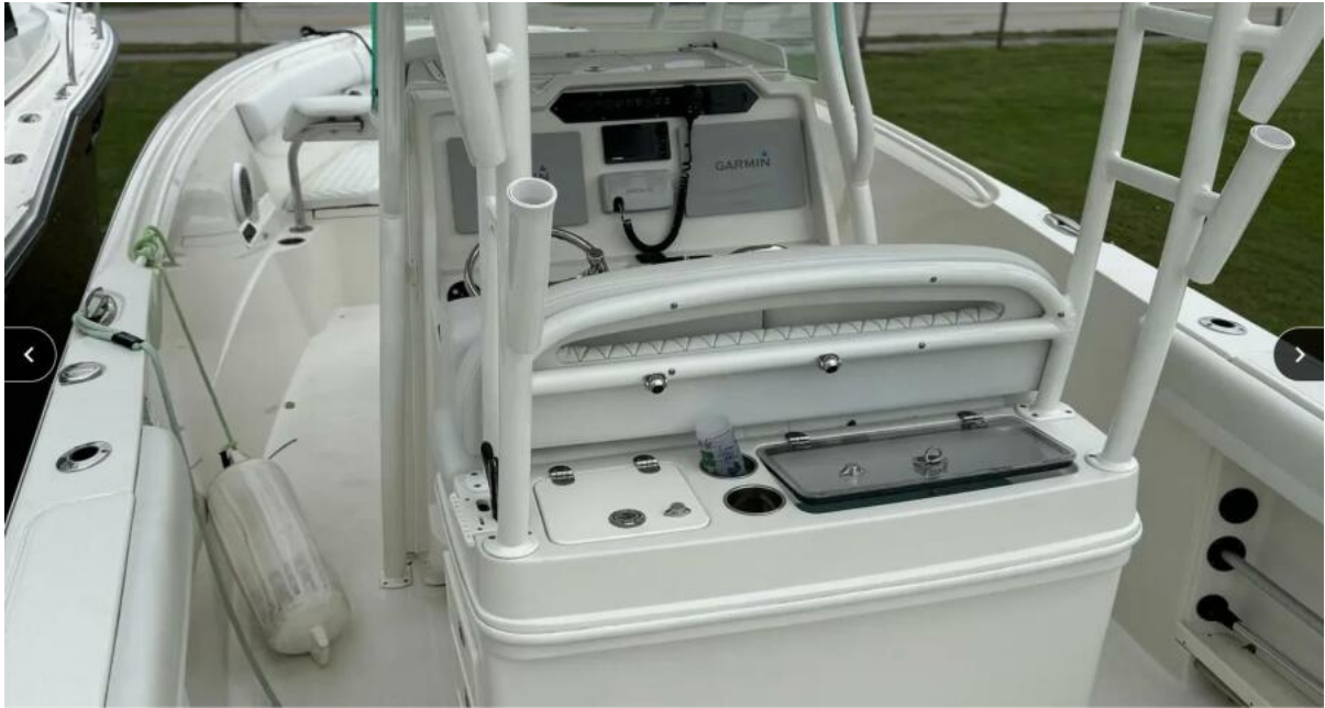
2016 Sailfish 290 CC 2016 Sailfish 290 CC