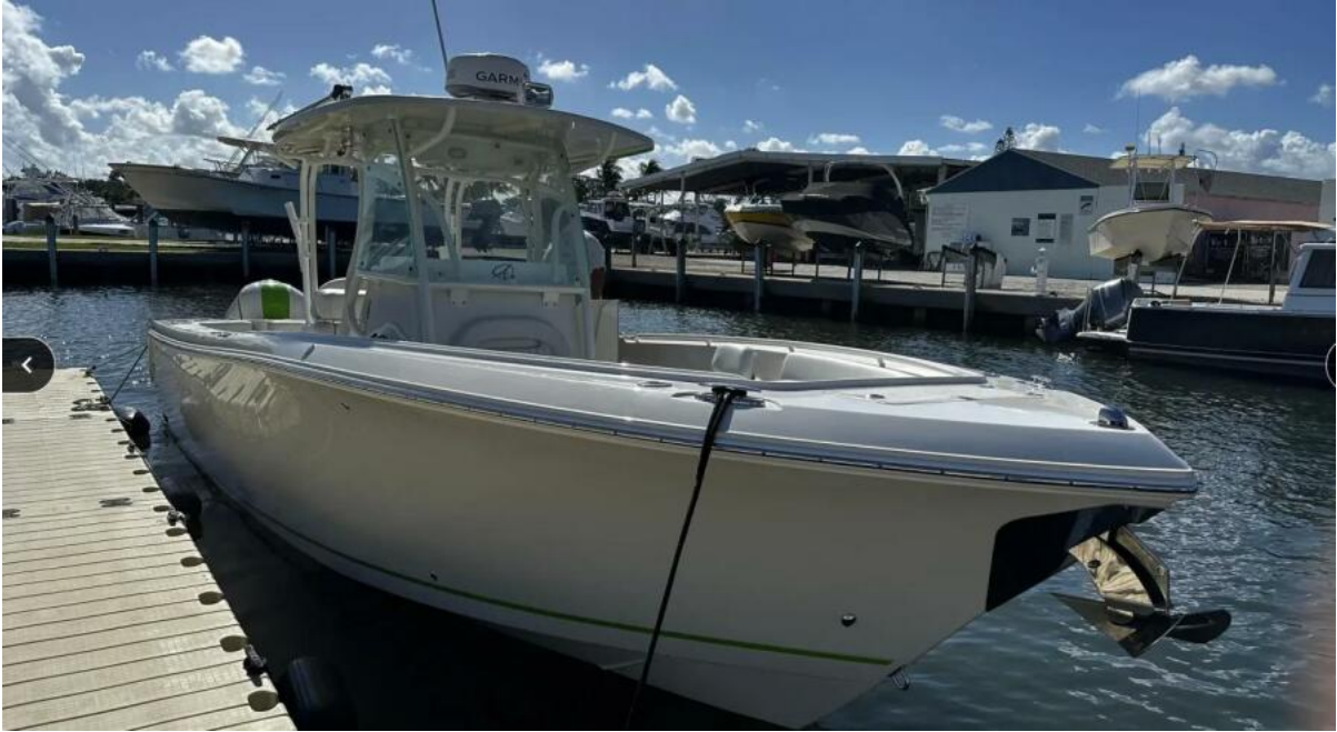
2016 Sailfish 290 CC 2016 Sailfish 290 CC