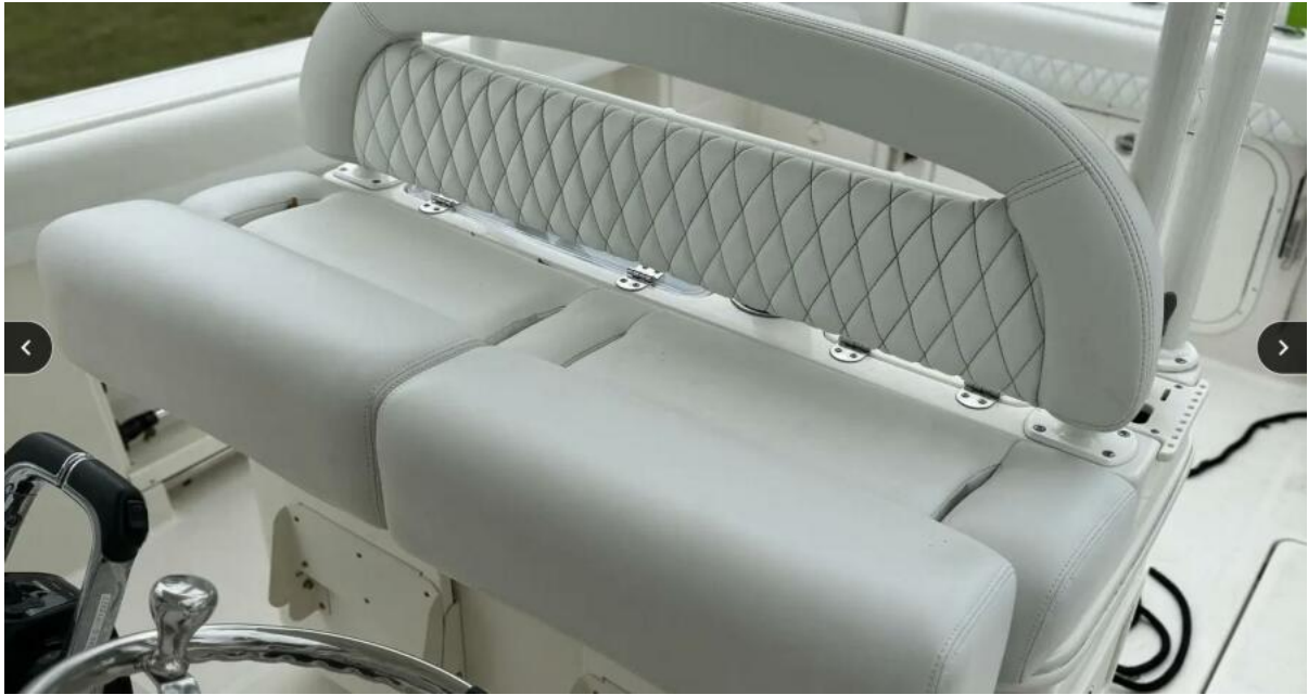
2016 Sailfish 290 CC 2016 Sailfish 290 CC