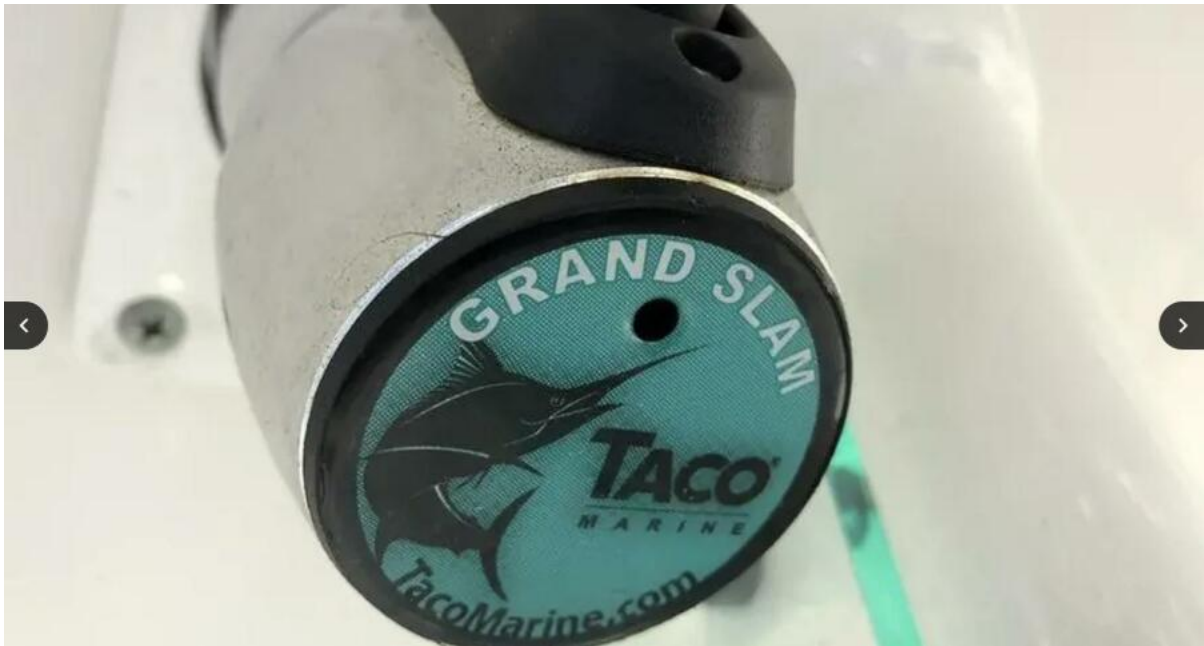
2016 Sailfish 290 CC 2016 Sailfish 290 CC