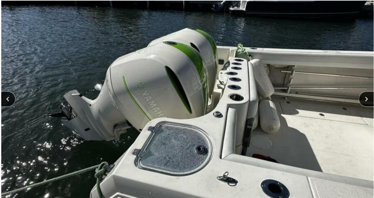
2016 Sailfish 290 CC 2016 Sailfish 290 CC