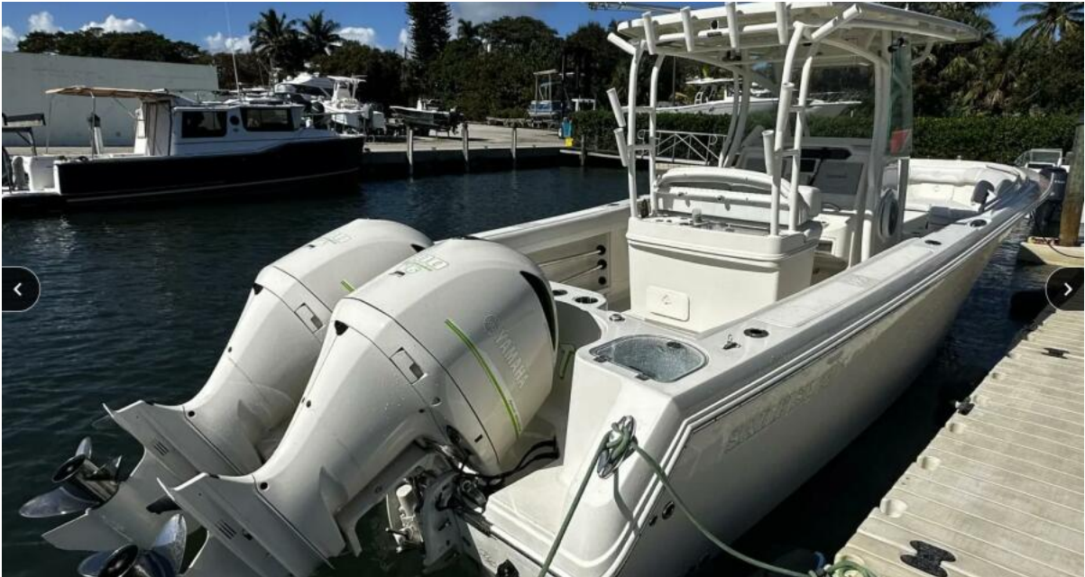
2016 Sailfish 290 CC 2016 Sailfish 290 CC