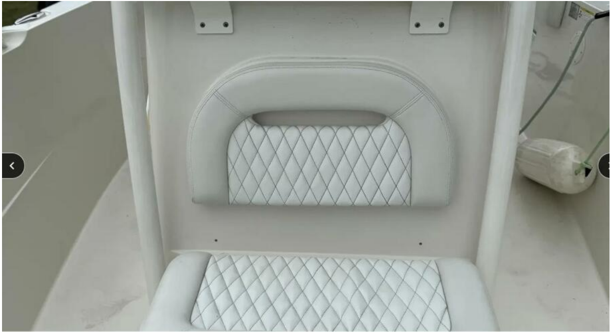
2016 Sailfish 290 CC 2016 Sailfish 290 CC