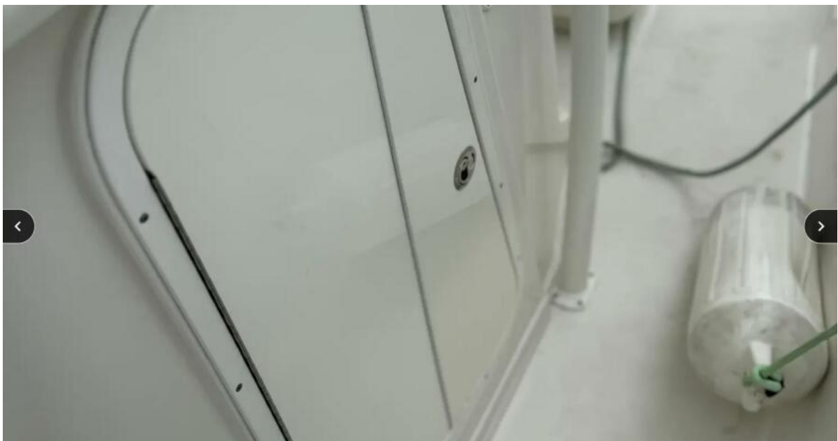
2016 Sailfish 290 CC 2016 Sailfish 290 CC