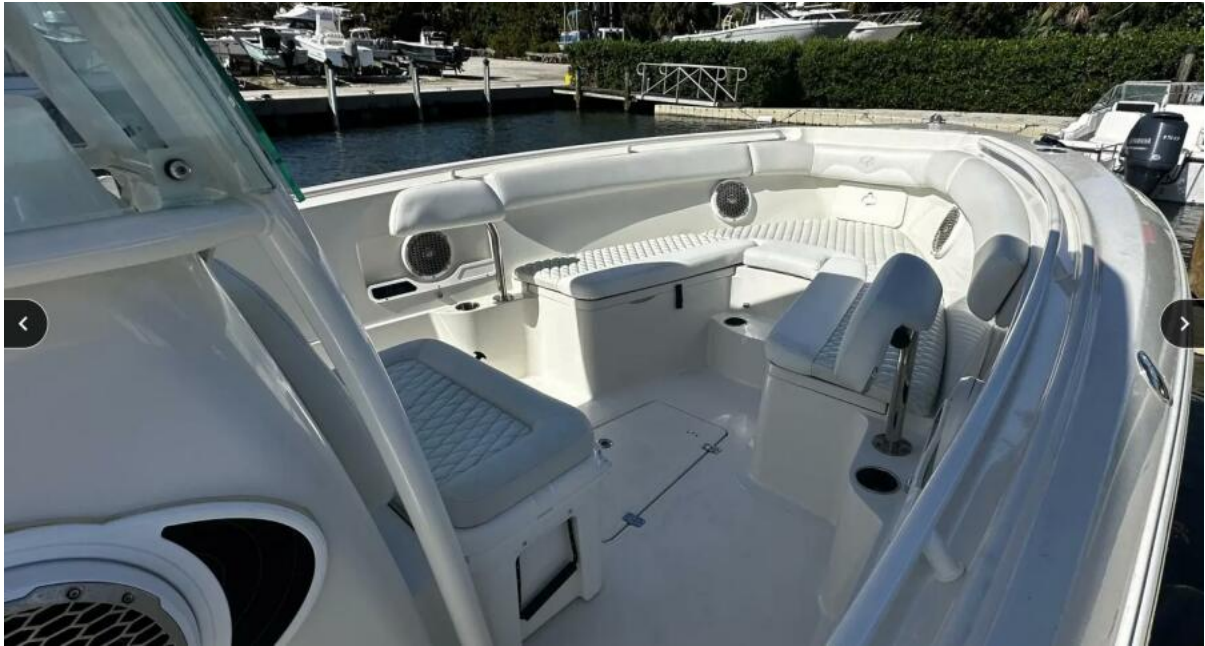
2016 Sailfish 290 CC 2016 Sailfish 290 CC