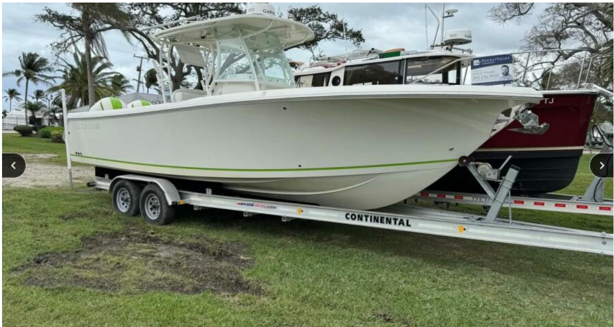
2016 Sailfish 290 CC 2016 Sailfish 290 CC