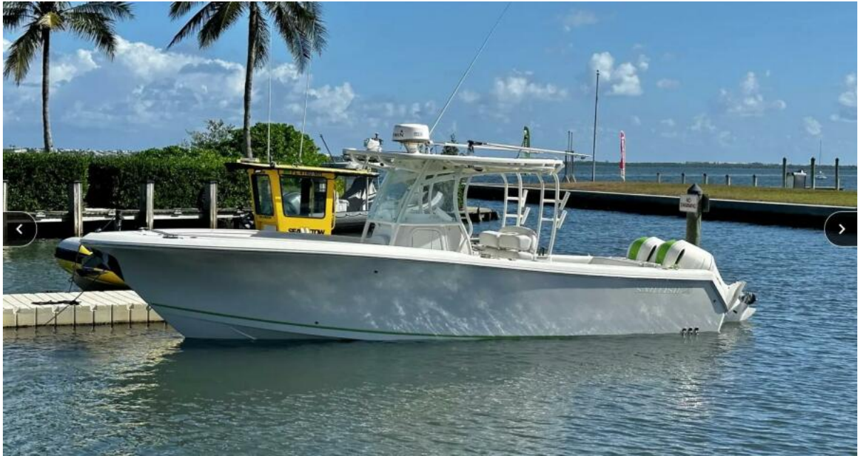
2016 Sailfish 290 CC 2016 Sailfish 290 CC