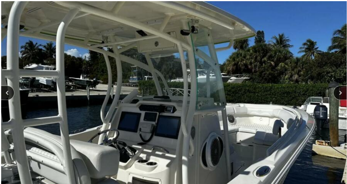
2016 Sailfish 290 CC 2016 Sailfish 290 CC