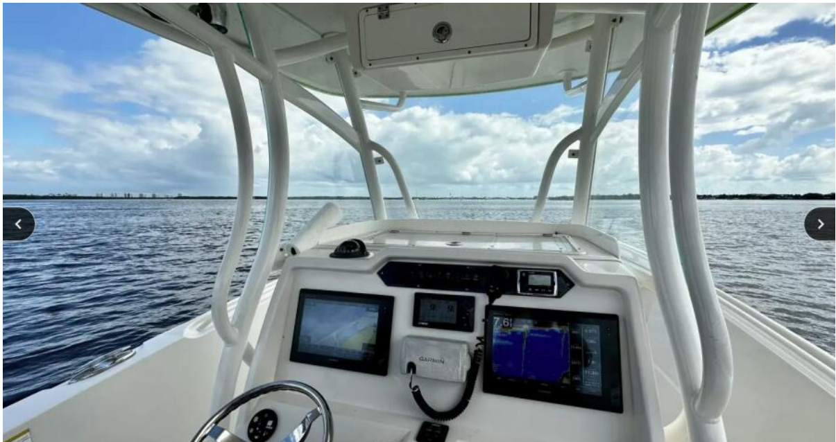
2016 Sailfish 290 CC 2016 Sailfish 290 CC