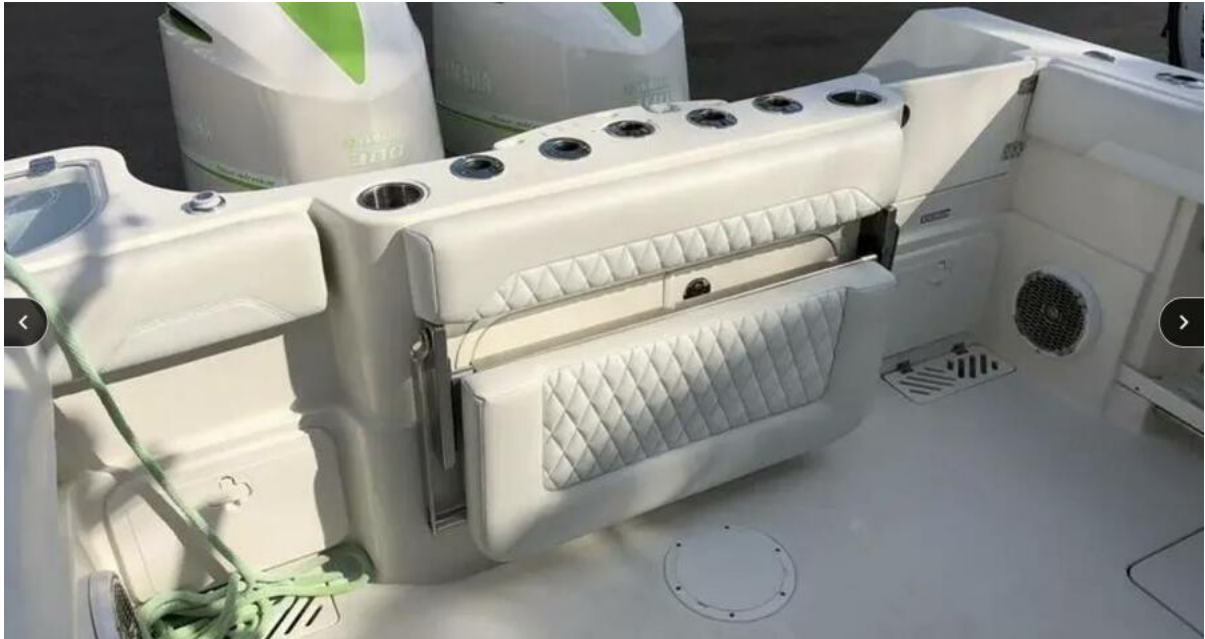
2016 Sailfish 290 CC 2016 Sailfish 290 CC