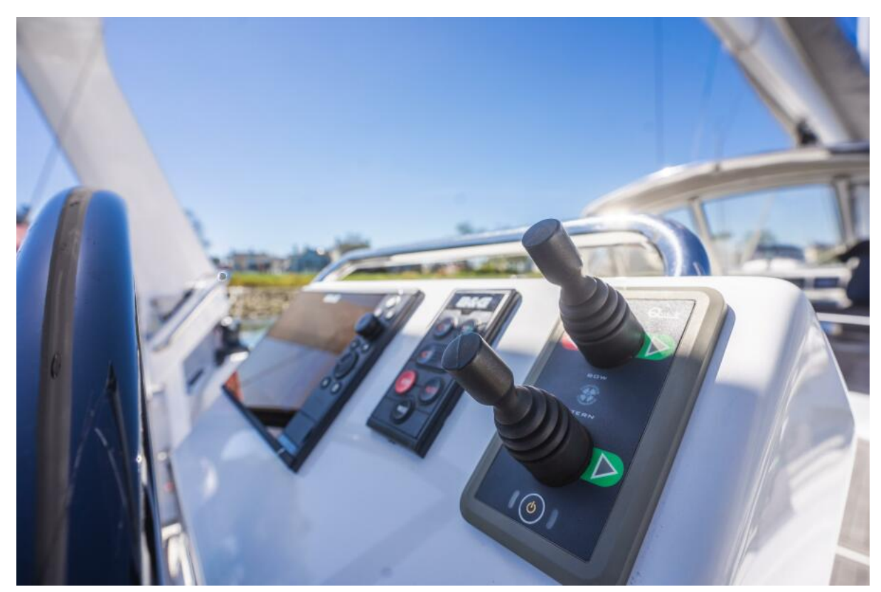
Starboard Helm Pod