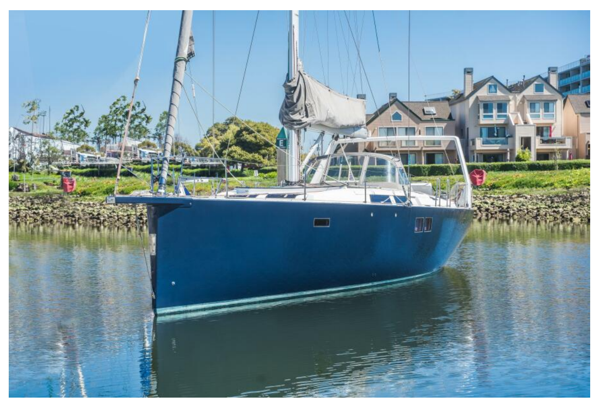
OUTREMER, 50' (15.24m) Hanse 2017