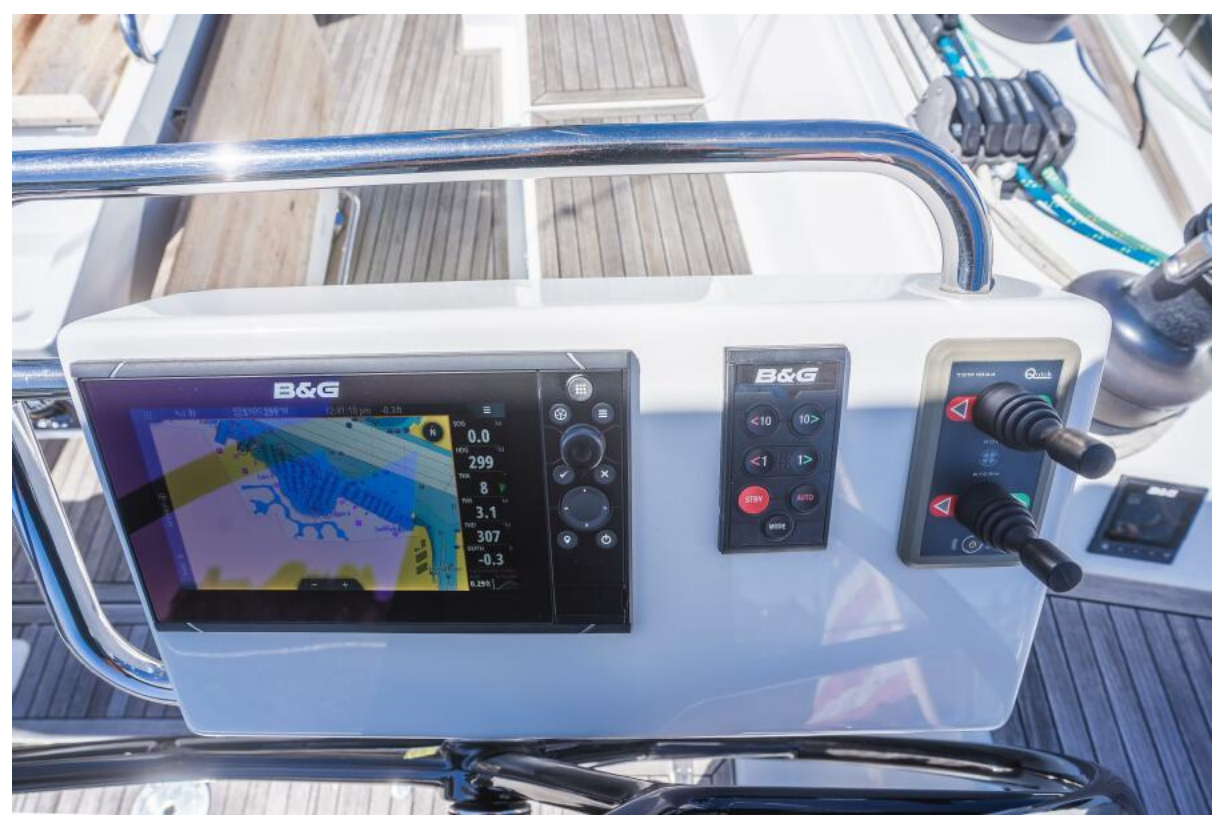
Starboard Helm Pod