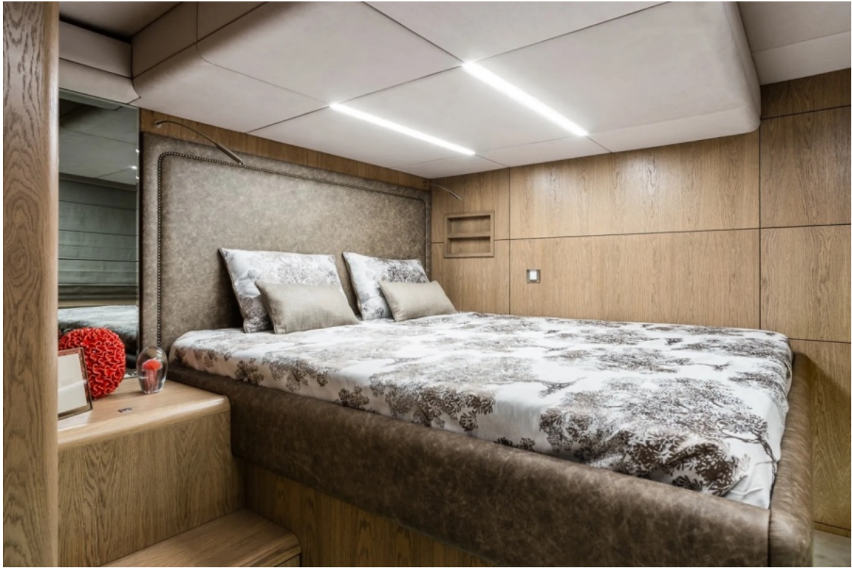
Used Sail Catamaran for sale 2017 Sunreef 88 DD - LITTLE GIANT