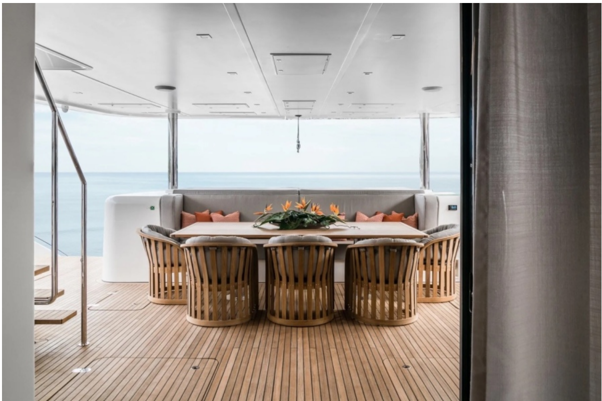
Used Sail Catamaran for sale 2017 Sunreef 88 DD - LITTLE GIANT