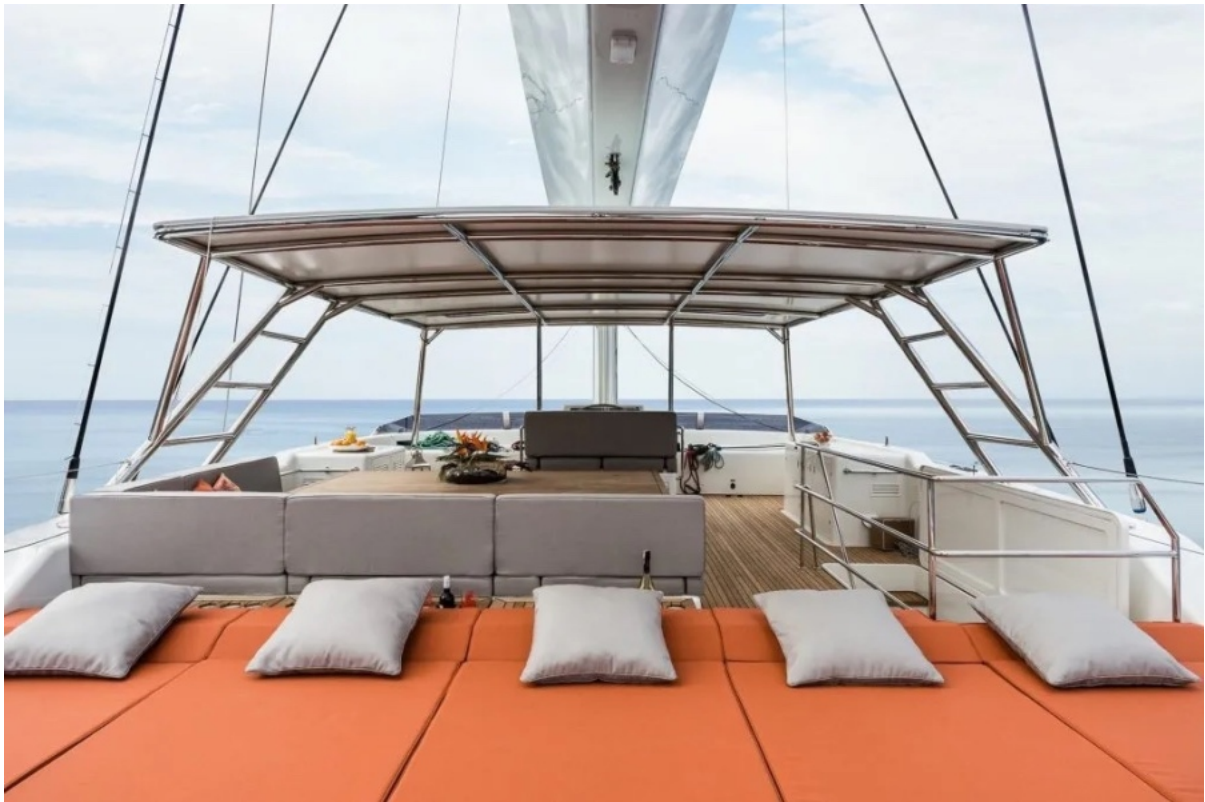
Used Sail Catamaran for sale 2017 Sunreef 88 DD - LITTLE GIANT