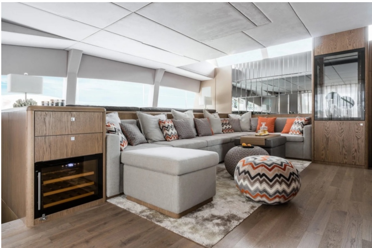
Used Sail Catamaran for sale 2017 Sunreef 88 DD - LITTLE GIANT