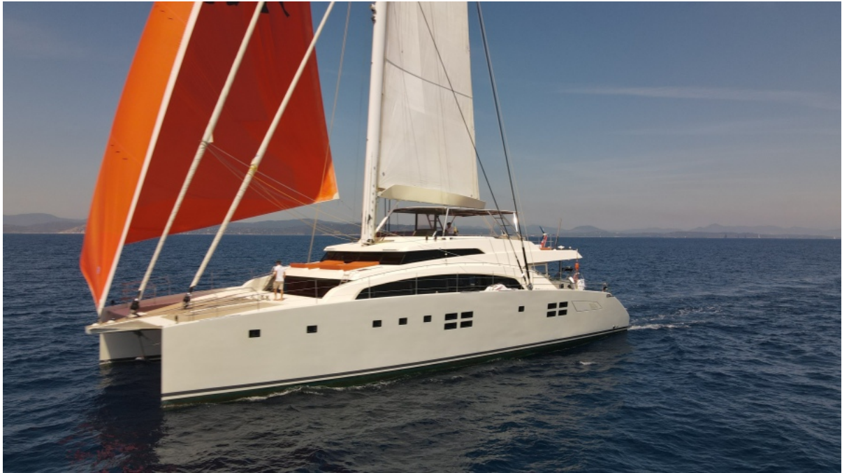
Used Sail Catamaran for sale 2017 Sunreef 88 DD - LITTLE GIANT