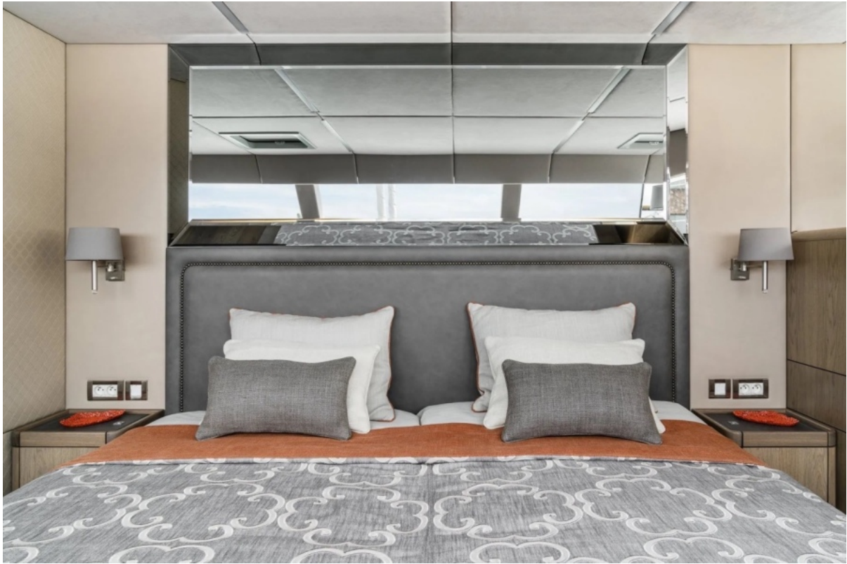
Used Sail Catamaran for sale 2017 Sunreef 88 DD - LITTLE GIANT