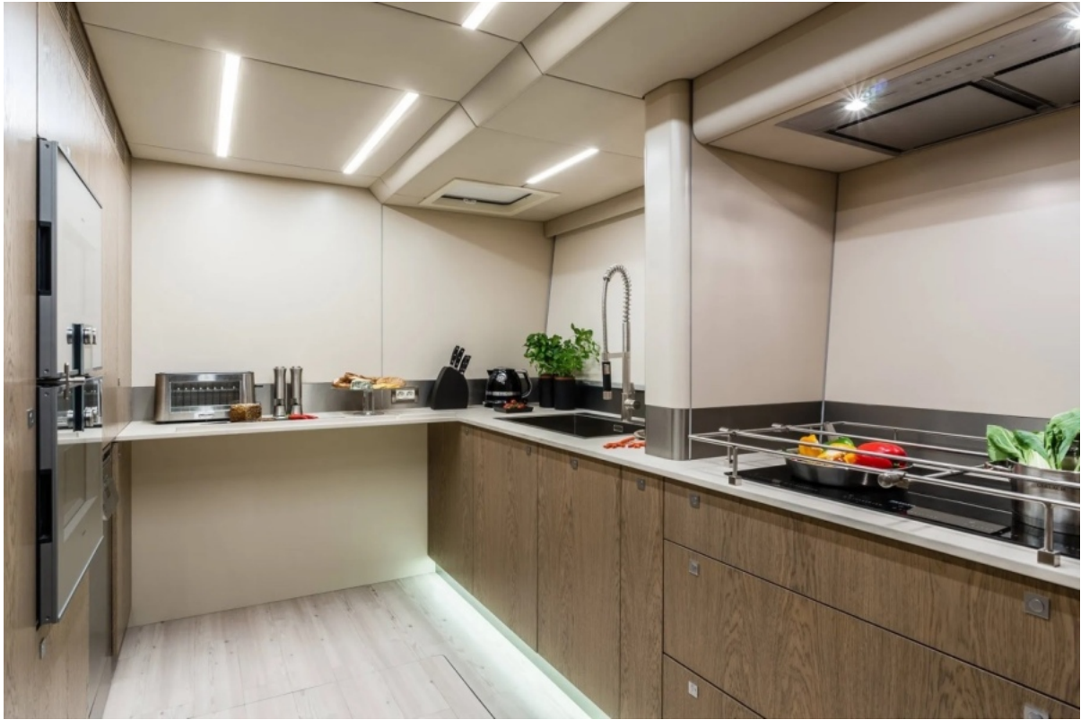
Used Sail Catamaran for sale 2017 Sunreef 88 DD - LITTLE GIANT