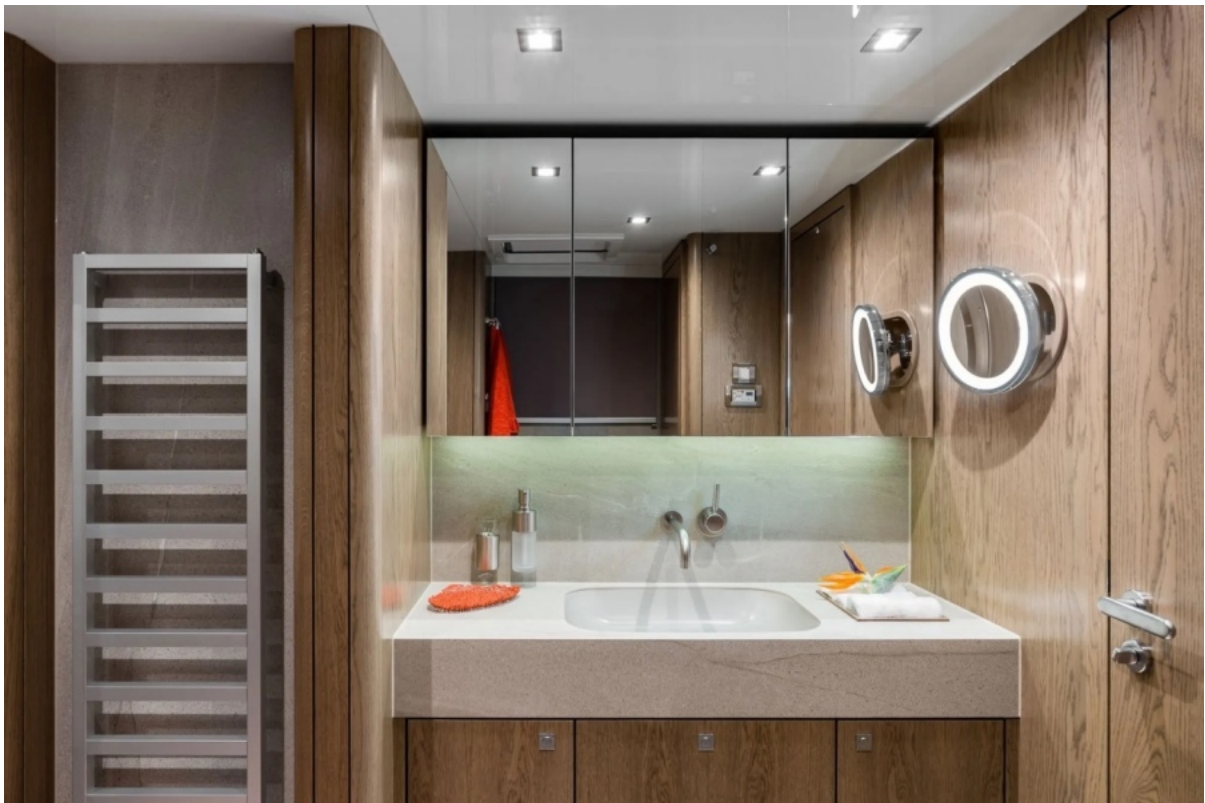
Used Sail Catamaran for sale 2017 Sunreef 88 DD - LITTLE GIANT