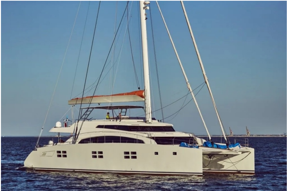
Used Sail Catamaran for sale 2017 Sunreef 88 DD - LITTLE GIANT