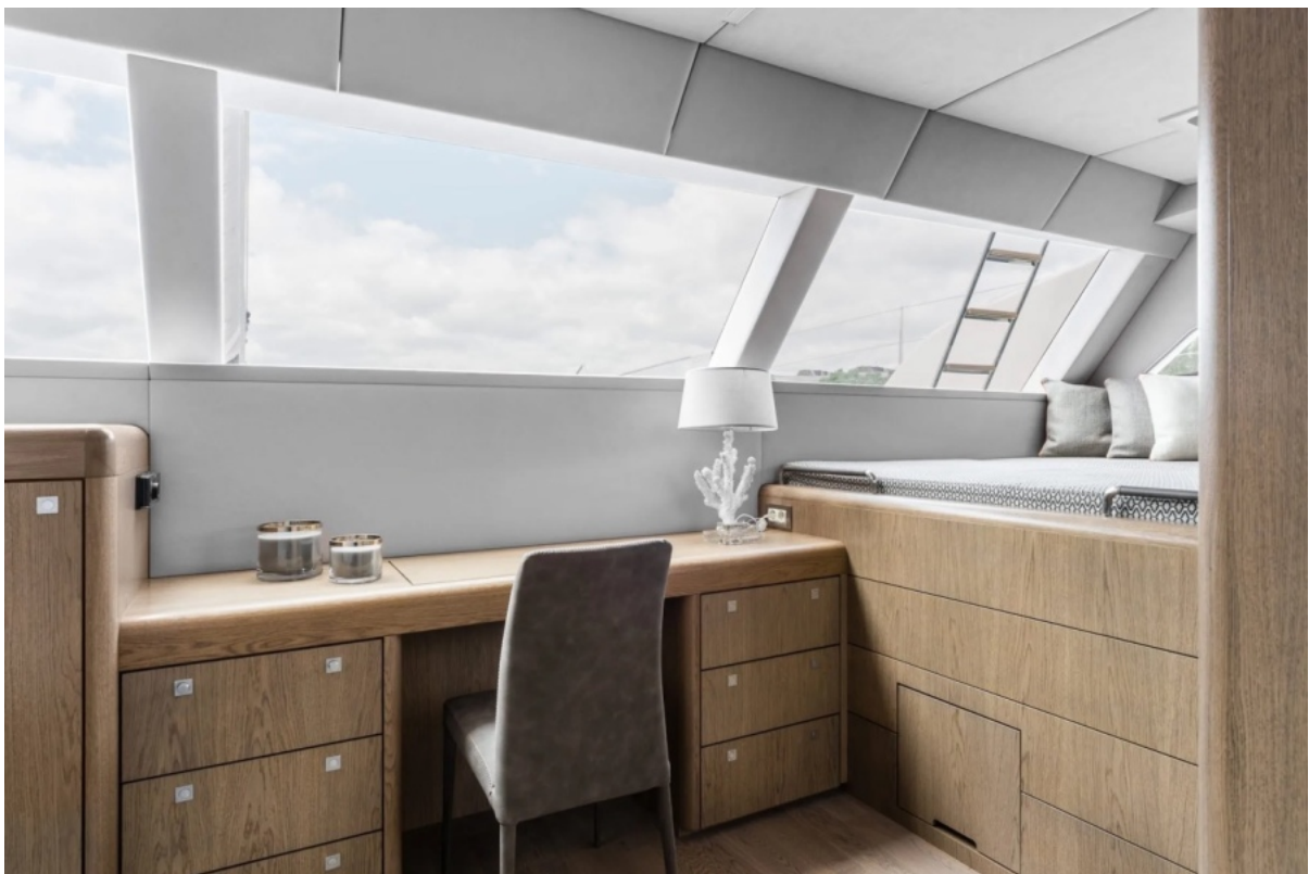
Used Sail Catamaran for sale 2017 Sunreef 88 DD - LITTLE GIANT