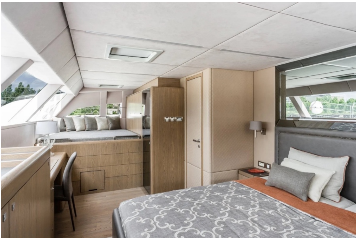
Used Sail Catamaran for sale 2017 Sunreef 88 DD - LITTLE GIANT