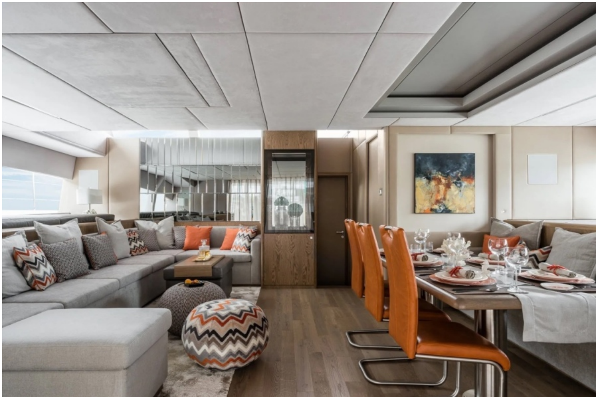
Used Sail Catamaran for sale 2017 Sunreef 88 DD - LITTLE GIANT