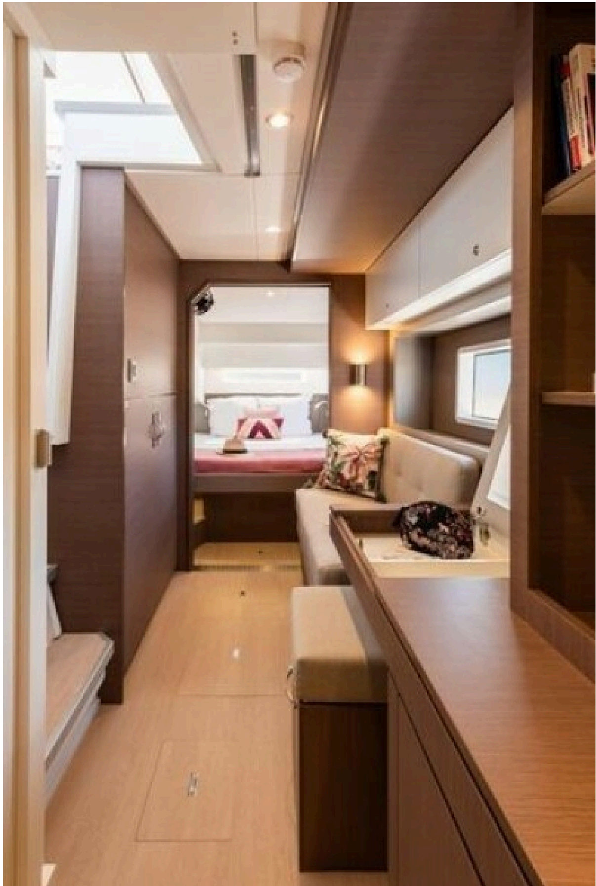
New Sail Catamaran for sale 2024 BALI CATAMARANS Bali 4.2 - BIMINI