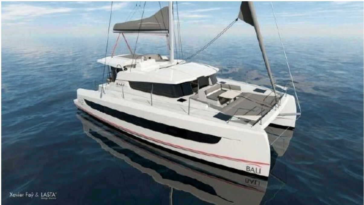
New Sail Catamaran for sale 2024 BALI CATAMARANS Bali 4.2 - BIMINI