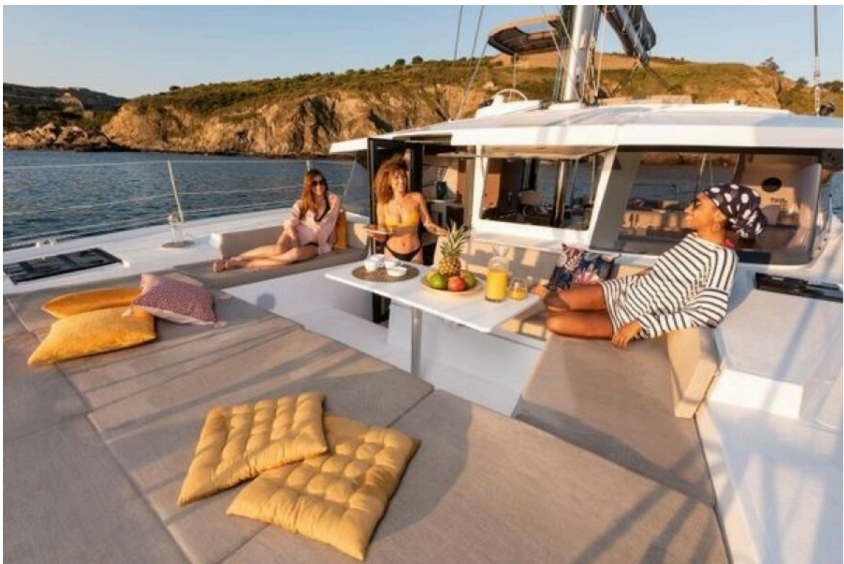
New Sail Catamaran for sale 2024 BALI CATAMARANS Bali 4.2 - BIMINI