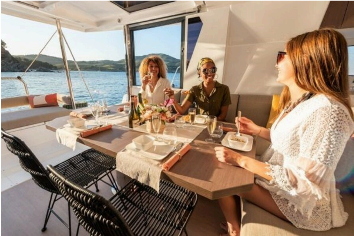
New Sail Catamaran for sale 2024 BALI CATAMARANS Bali 4.2 - BIMINI