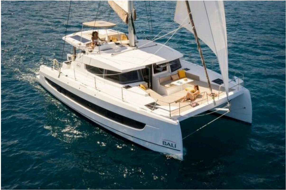
New Sail Catamaran for sale 2024 BALI CATAMARANS Bali 4.2 - BIMINI