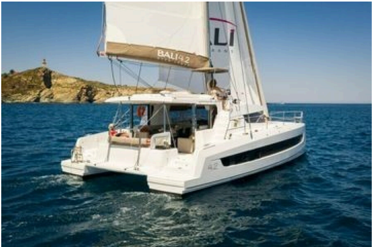
New Sail Catamaran for sale 2024 BALI CATAMARANS Bali 4.2 - BIMINI