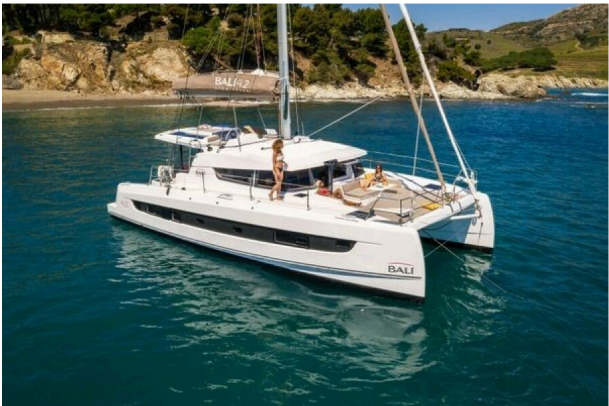
New Sail Catamaran for sale 2024 BALI CATAMARANS Bali 4.2 - BIMINI