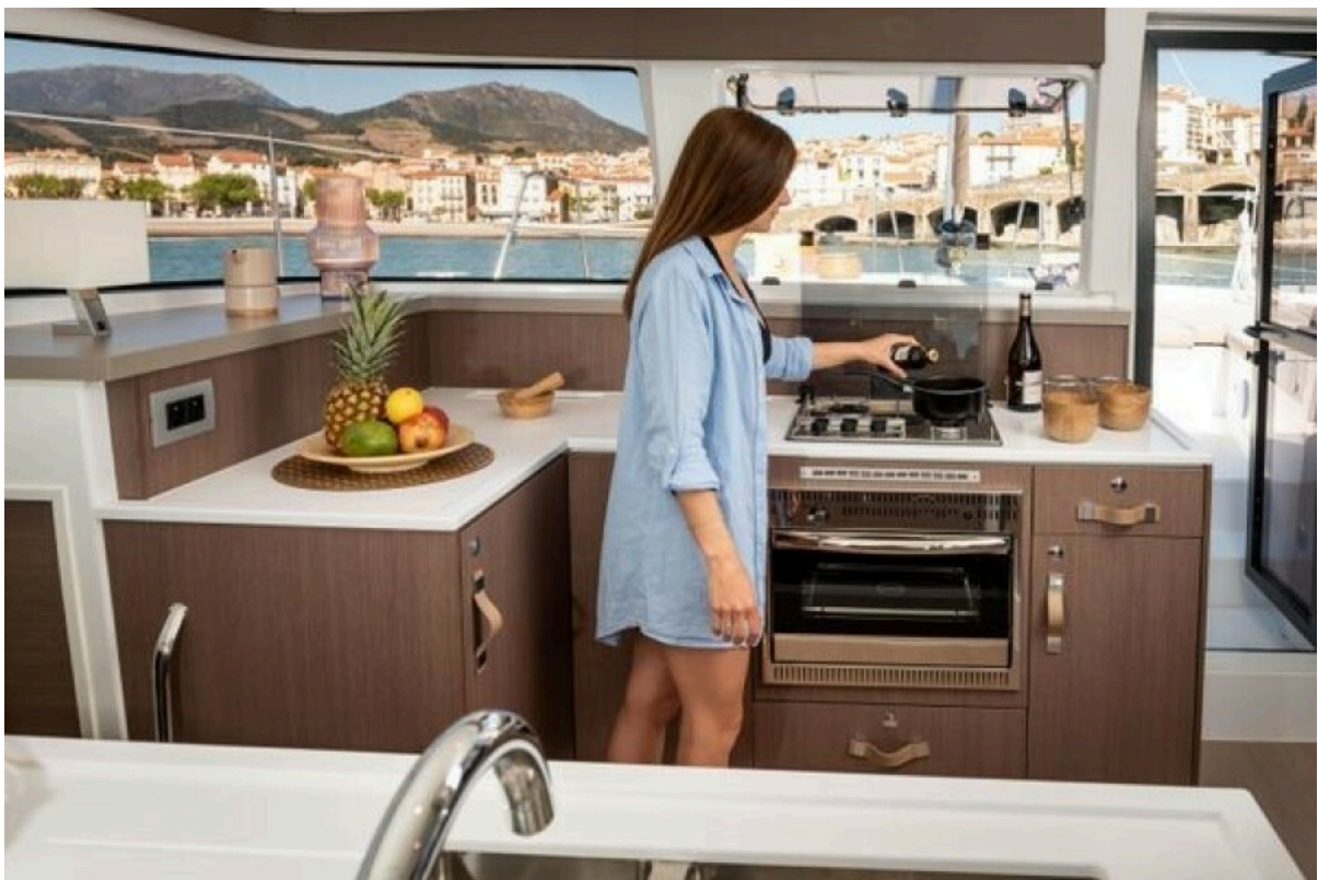
New Sail Catamaran for sale 2024 BALI CATAMARANS Bali 4.2 - BIMINI