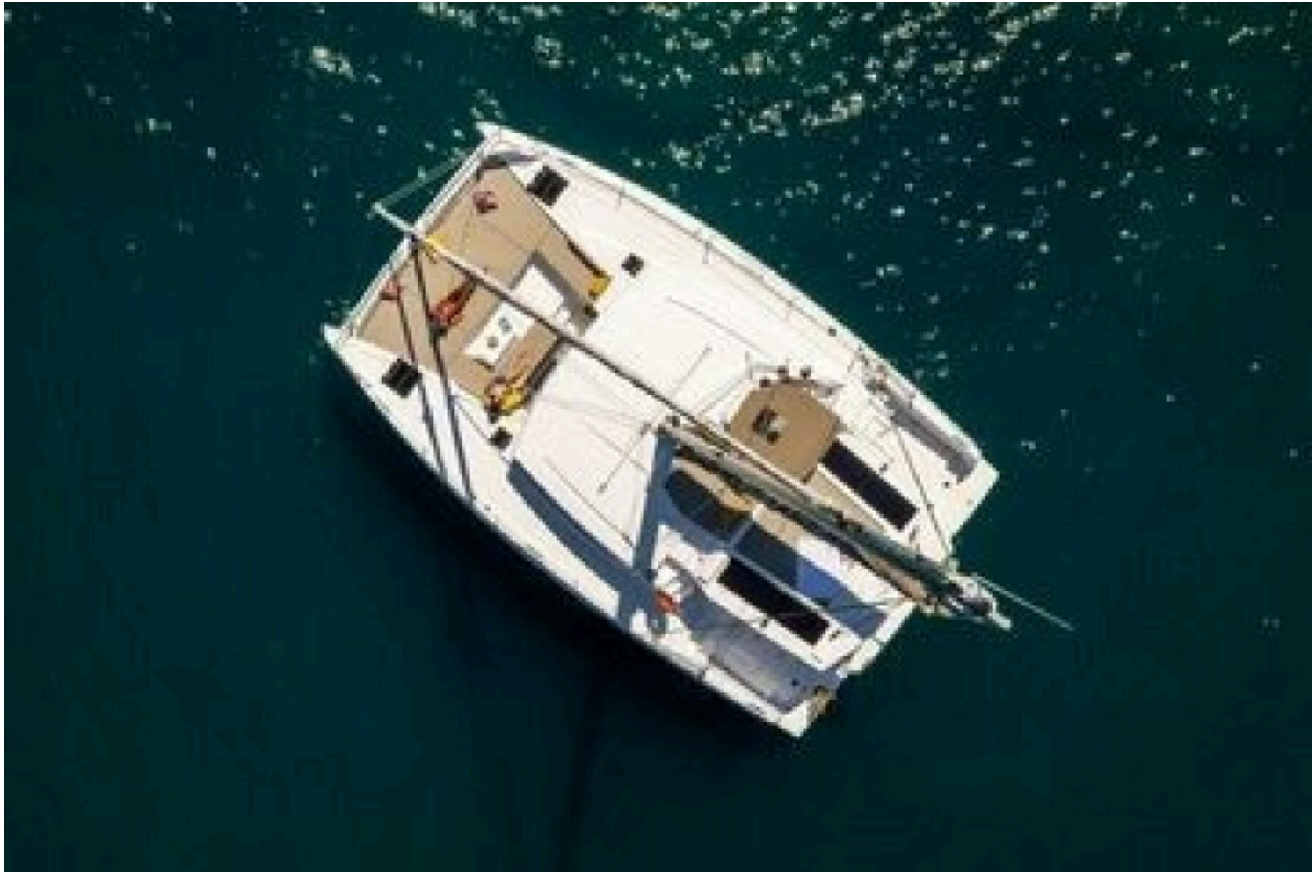
New Sail Catamaran for sale 2024 BALI CATAMARANS Bali 4.2 - BIMINI