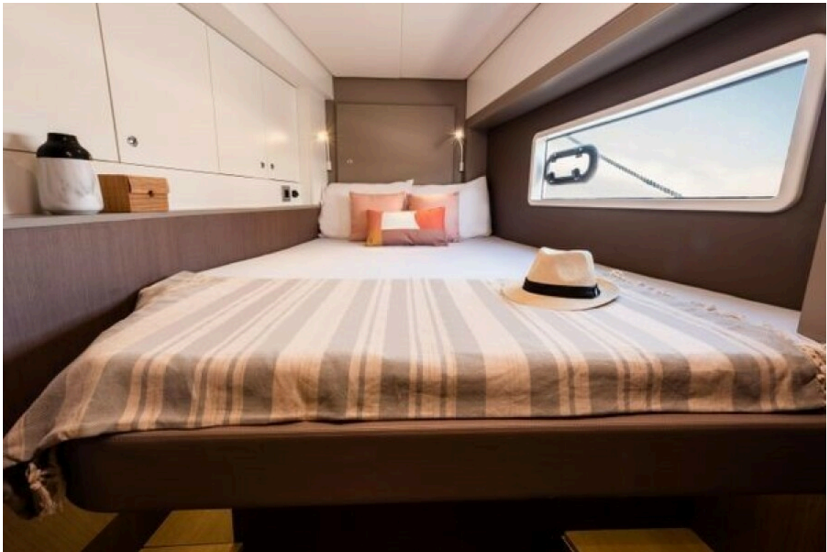
New Sail Catamaran for sale 2024 BALI CATAMARANS Bali 4.2 - BIMINI