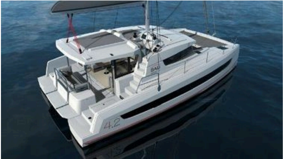
New Sail Catamaran for sale 2024 BALI CATAMARANS Bali 4.2 - BIMINI