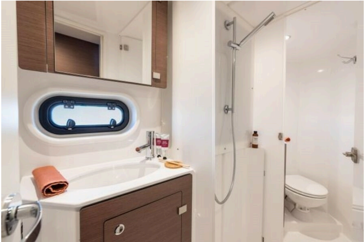
New Sail Catamaran for sale 2024 BALI CATAMARANS Bali 4.2 - BIMINI