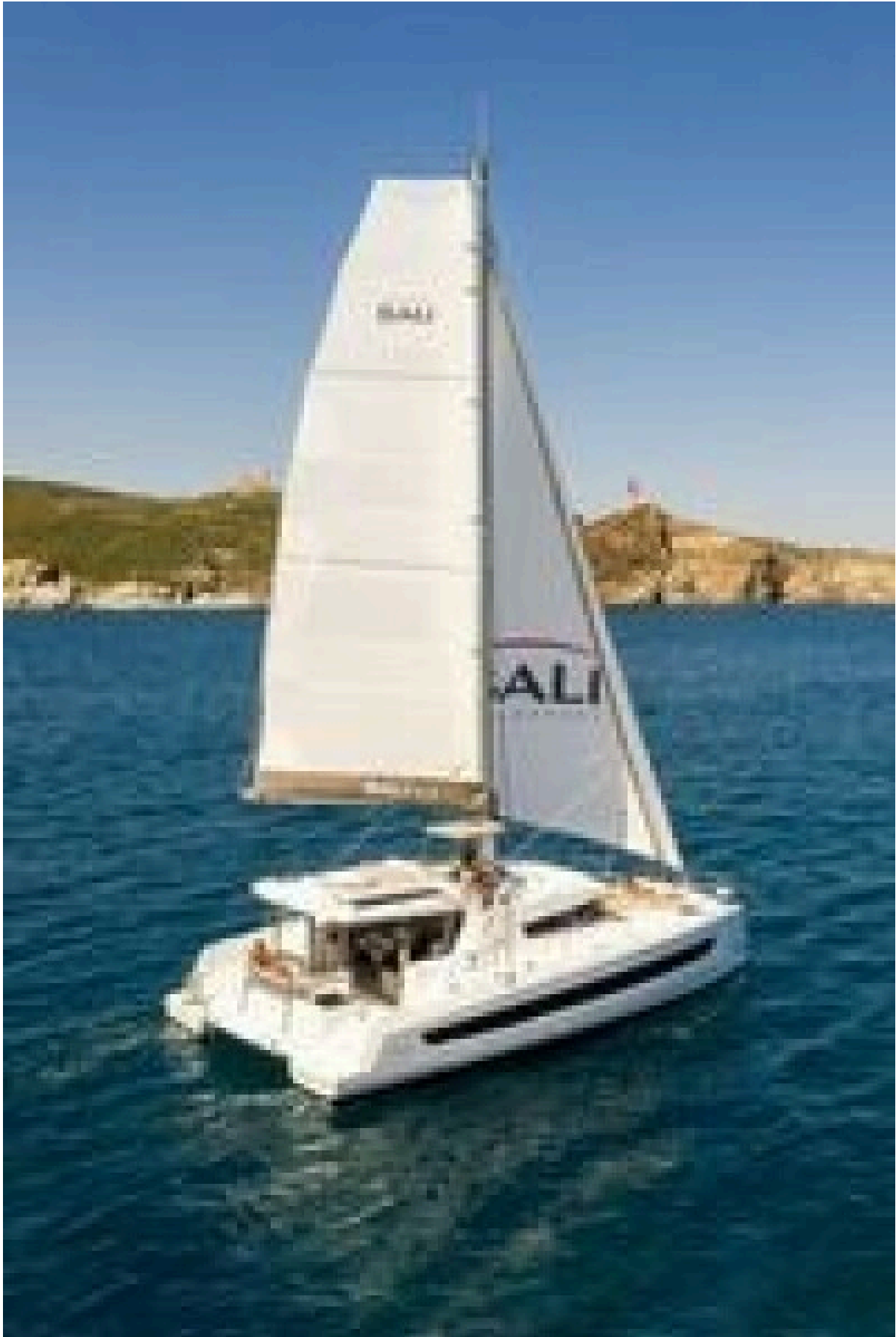
New Sail Catamaran for sale 2024 BALI CATAMARANS Bali 4.2 - BIMINI