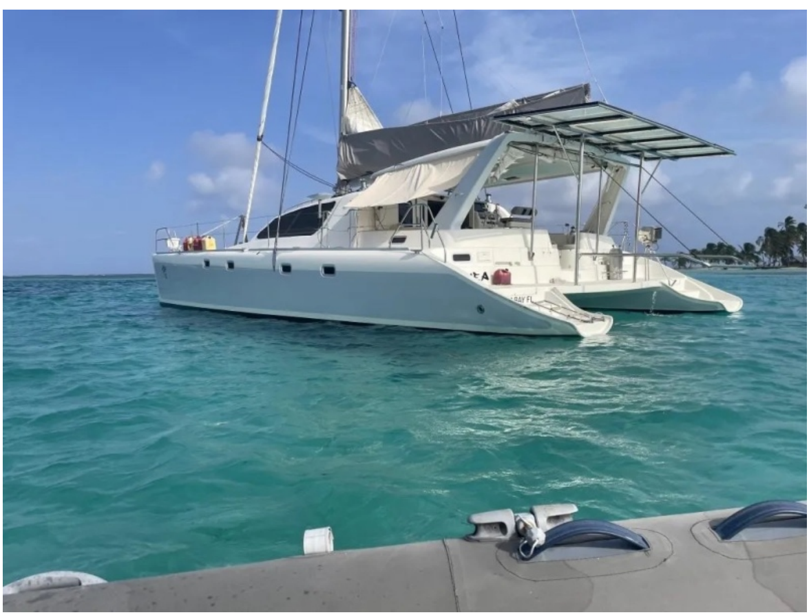
Used Sail Catamaran for sale 2000 ROBERTSON & CAINE Leopard 45 - ALTHEA