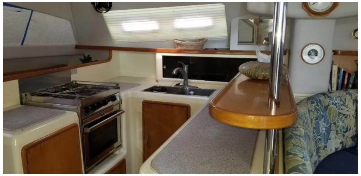
Used Sail Catamaran for sale 2000 ROBERTSON & CAINE Leopard 45 - ALTHEA