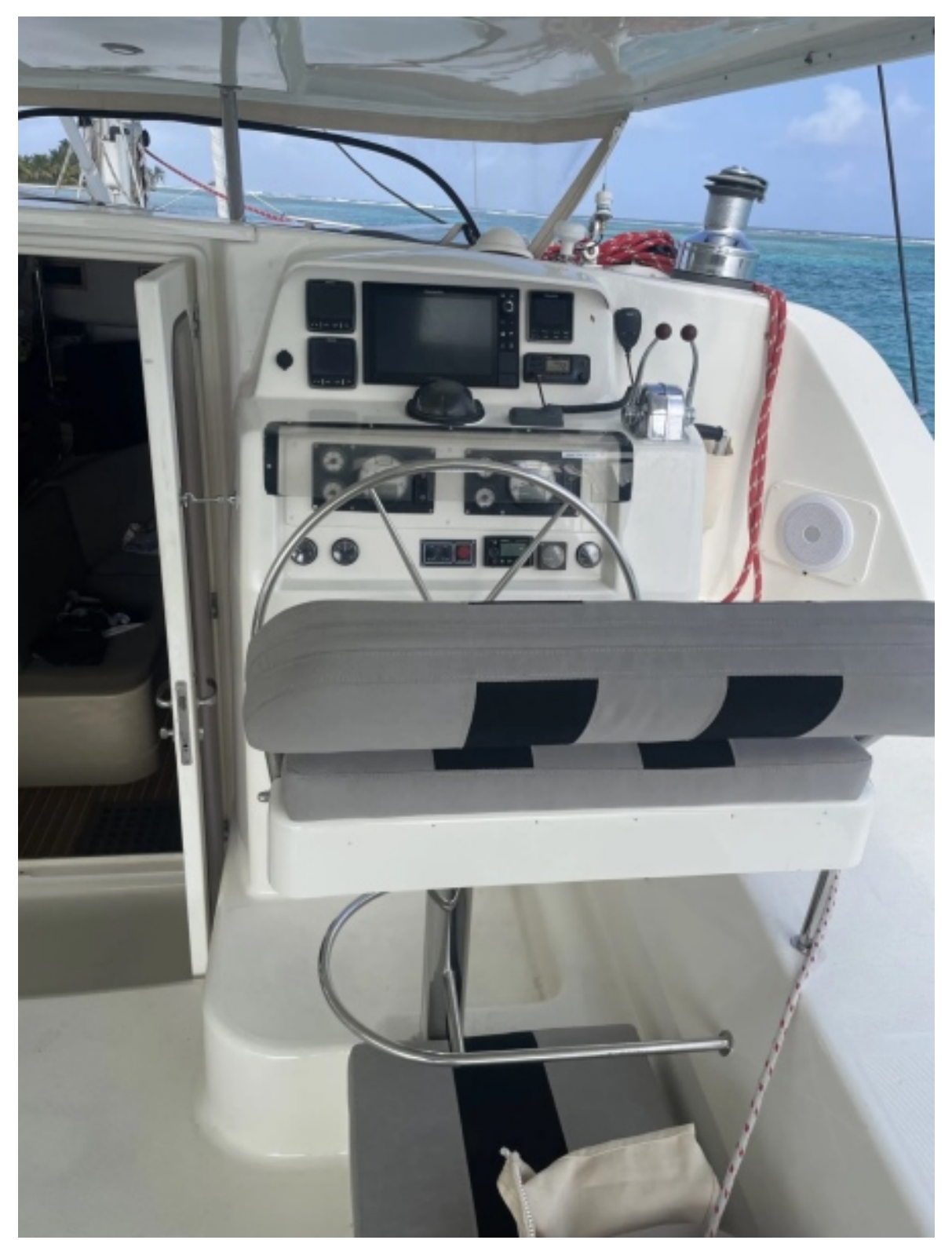
Used Sail Catamaran for sale 2000 ROBERTSON & CAINE Leopard 45 - ALTHEA