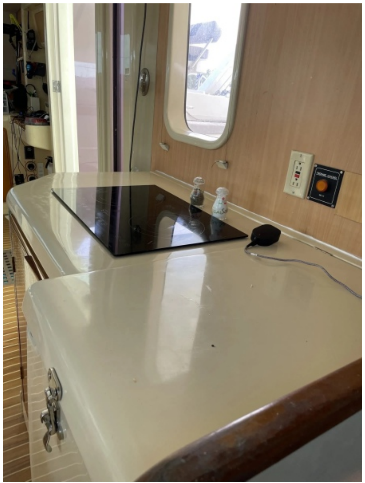
Used Sail Catamaran for sale 2000 ROBERTSON & CAINE Leopard 45 - ALTHEA