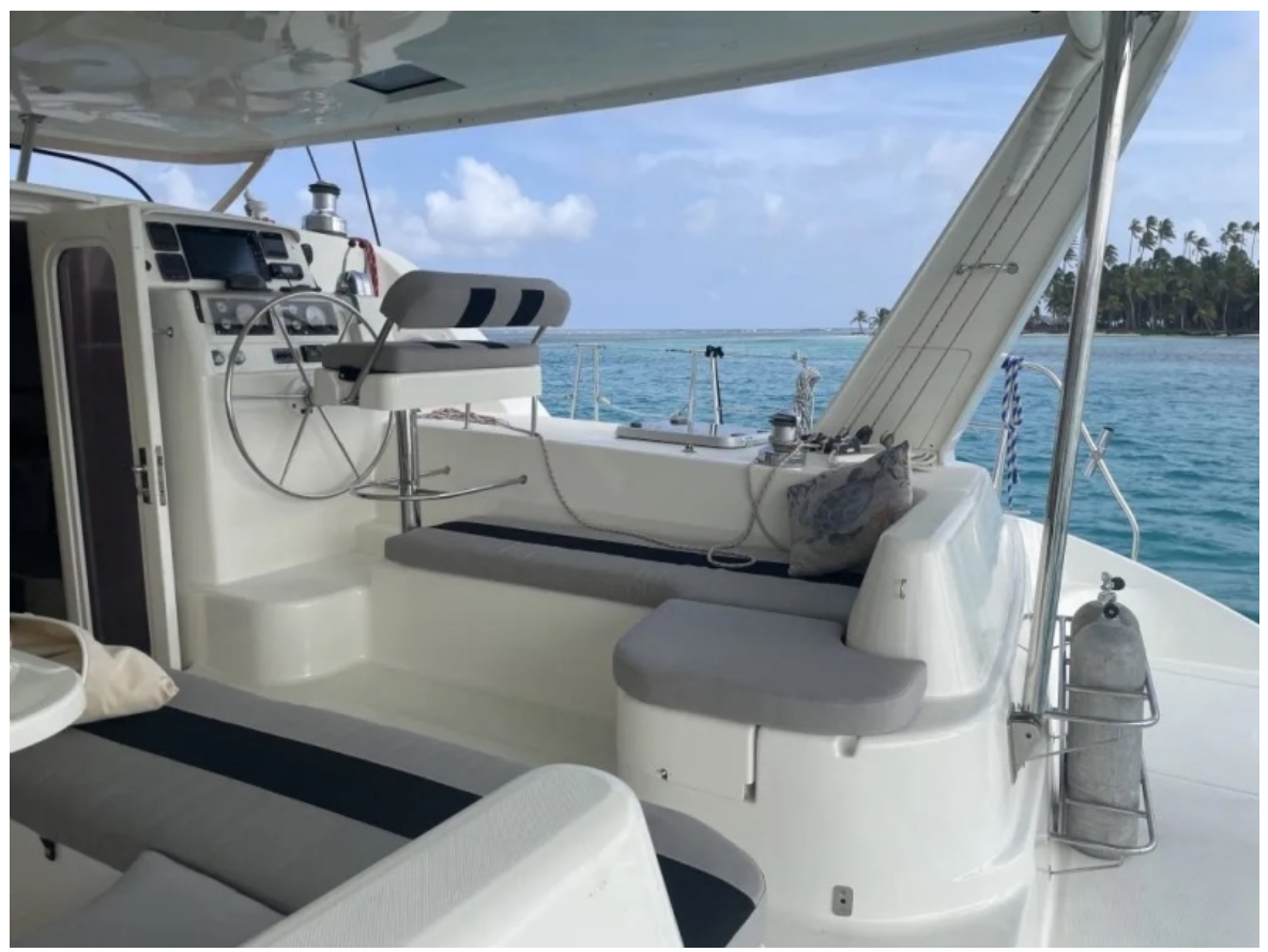
Used Sail Catamaran for sale 2000 ROBERTSON & CAINE Leopard 45 - ALTHEA