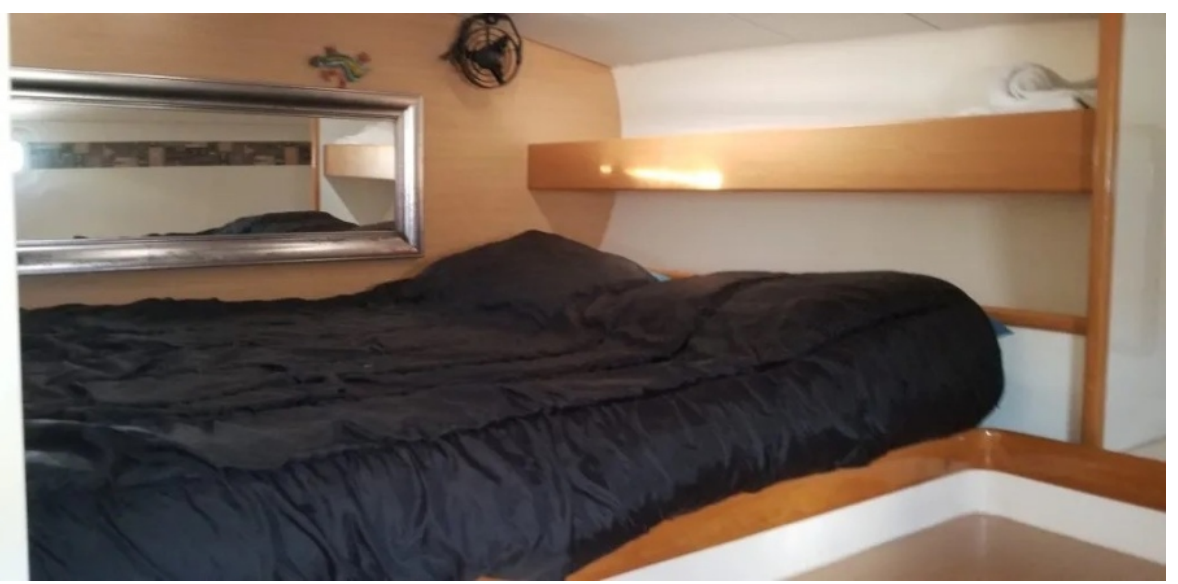
Used Sail Catamaran for sale 2000 ROBERTSON & CAINE Leopard 45 - ALTHEA