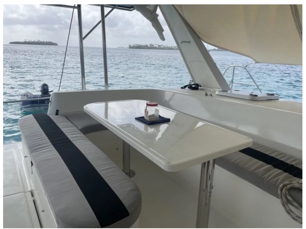
Used Sail Catamaran for sale 2000 ROBERTSON & CAINE Leopard 45 - ALTHEA