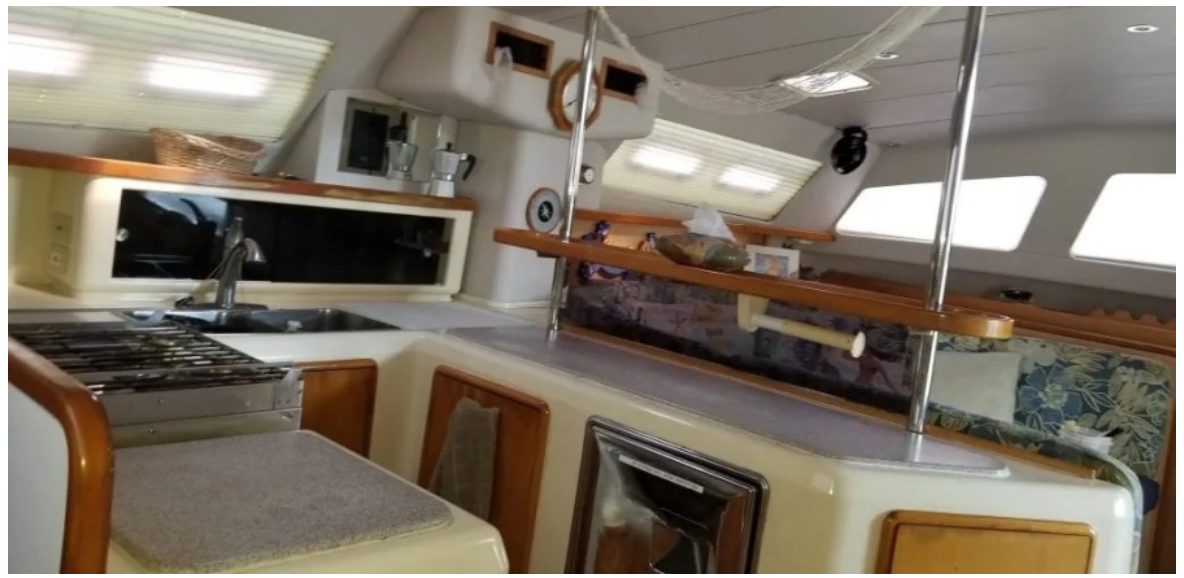
Used Sail Catamaran for sale 2000 ROBERTSON & CAINE Leopard 45 - ALTHEA