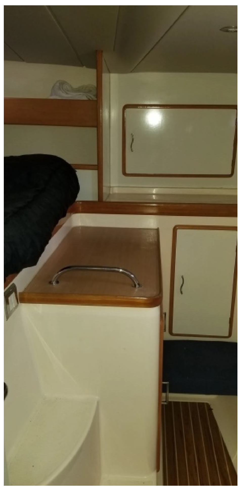
Used Sail Catamaran for sale 2000 ROBERTSON & CAINE Leopard 45 - ALTHEA