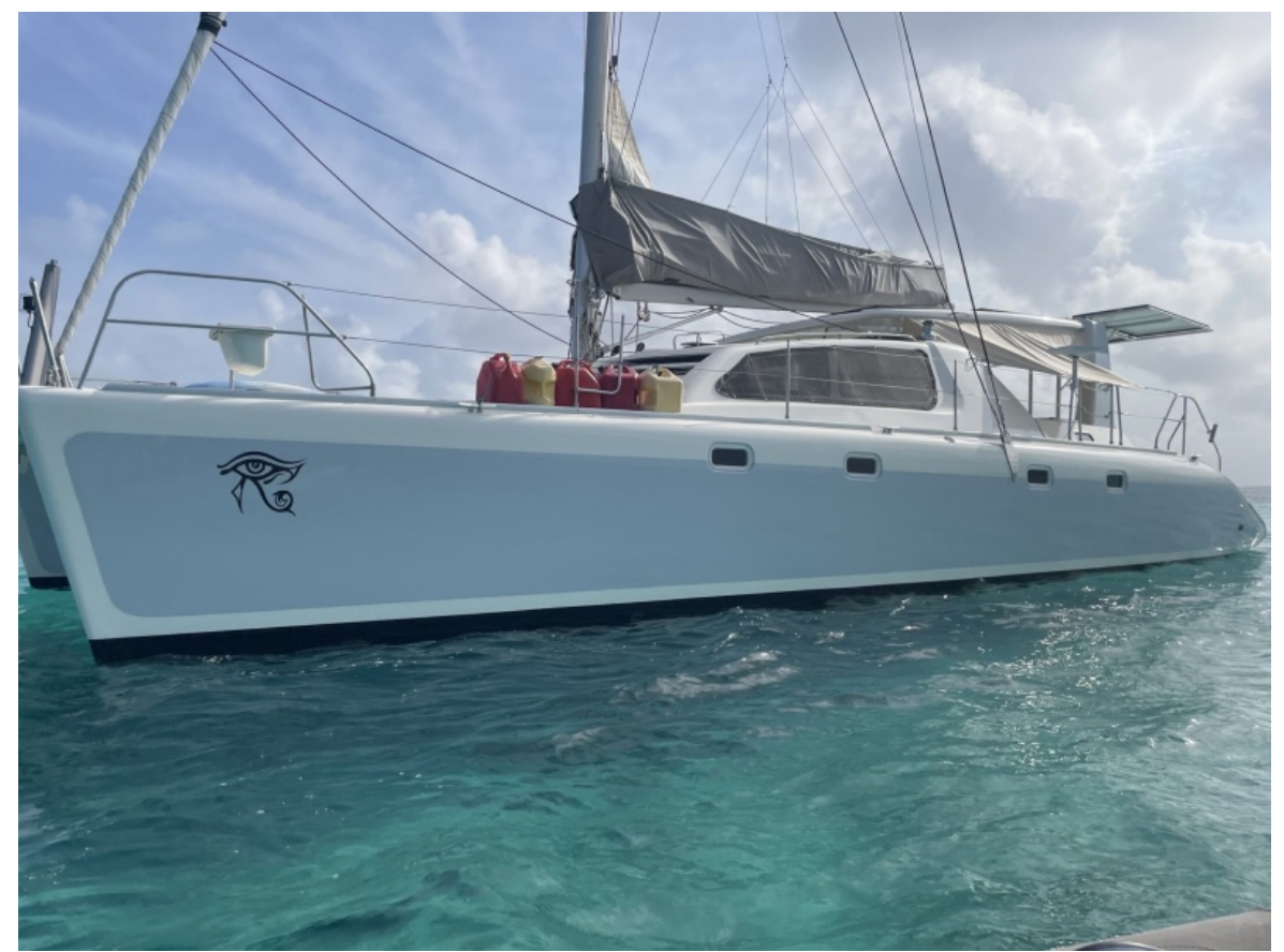
Used Sail Catamaran for sale 2000 ROBERTSON & CAINE Leopard 45 - ALTHEA