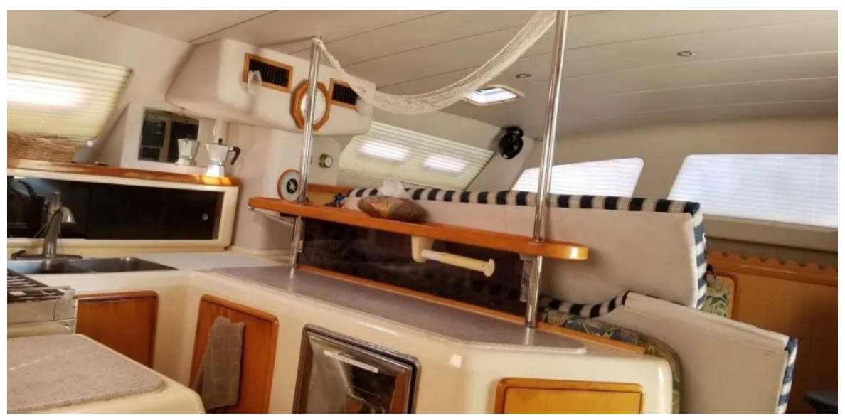
Used Sail Catamaran for sale 2000 ROBERTSON & CAINE Leopard 45 - ALTHEA