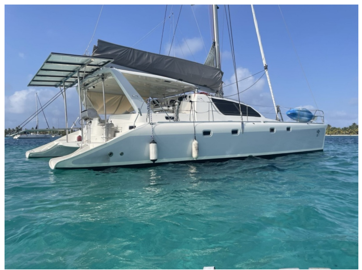
Used Sail Catamaran for sale 2000 ROBERTSON & CAINE Leopard 45 - ALTHEA