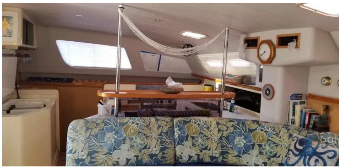
Used Sail Catamaran for sale 2000 ROBERTSON & CAINE Leopard 45 - ALTHEA