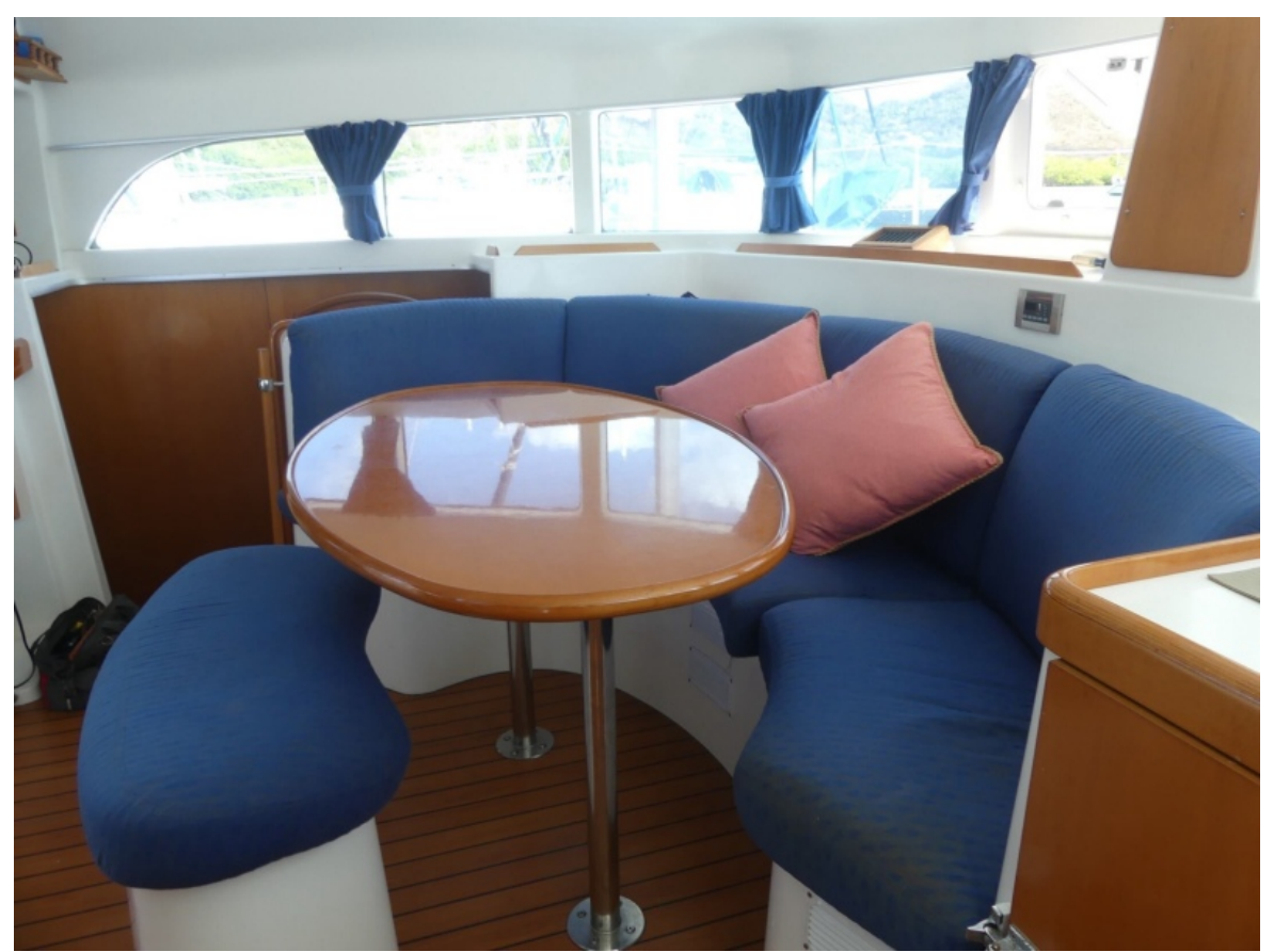
Used Sail Catamaran for sale 2004 Lagoon 380 - BLUE MOON OF AMBLE