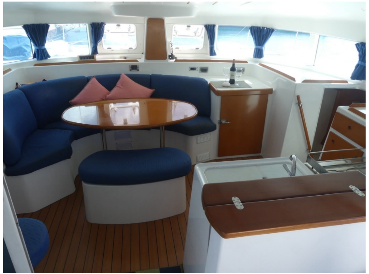
Used Sail Catamaran for sale 2004 Lagoon 380 - BLUE MOON OF AMBLE