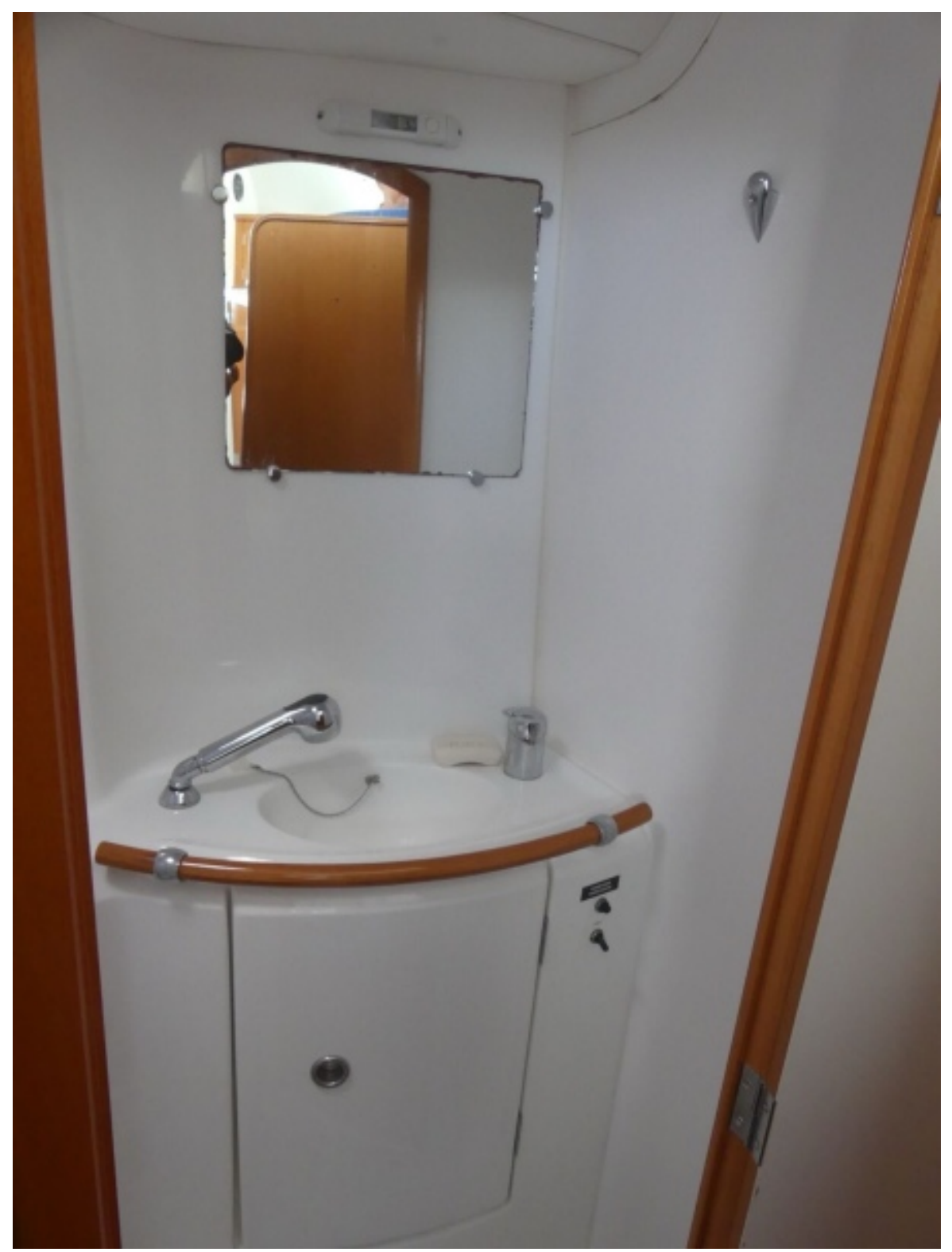
Used Sail Catamaran for sale 2004 Lagoon 380 - BLUE MOON OF AMBLE