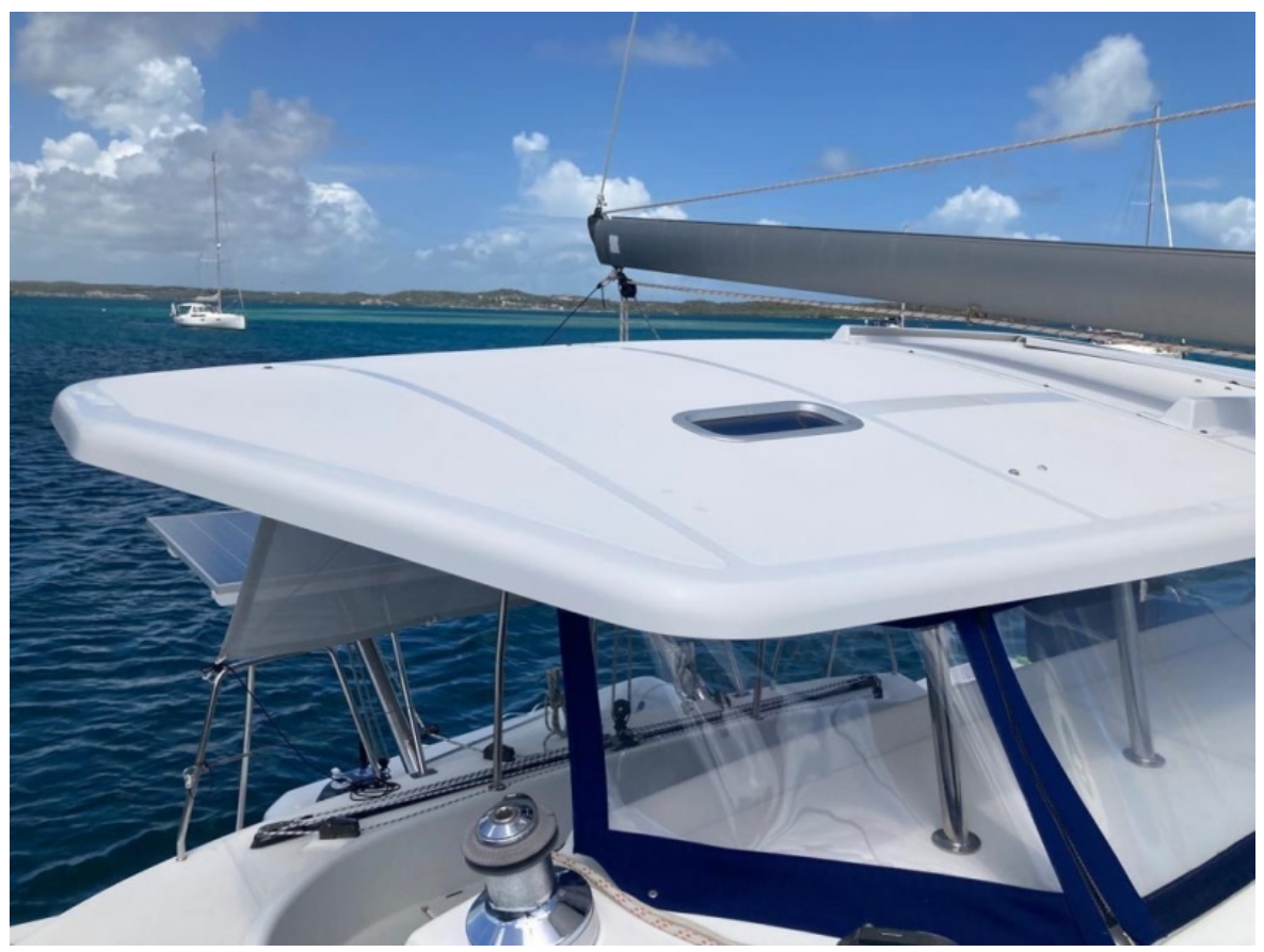
Used Sail Catamaran for sale 2004 Lagoon 380 - BLUE MOON OF AMBLE