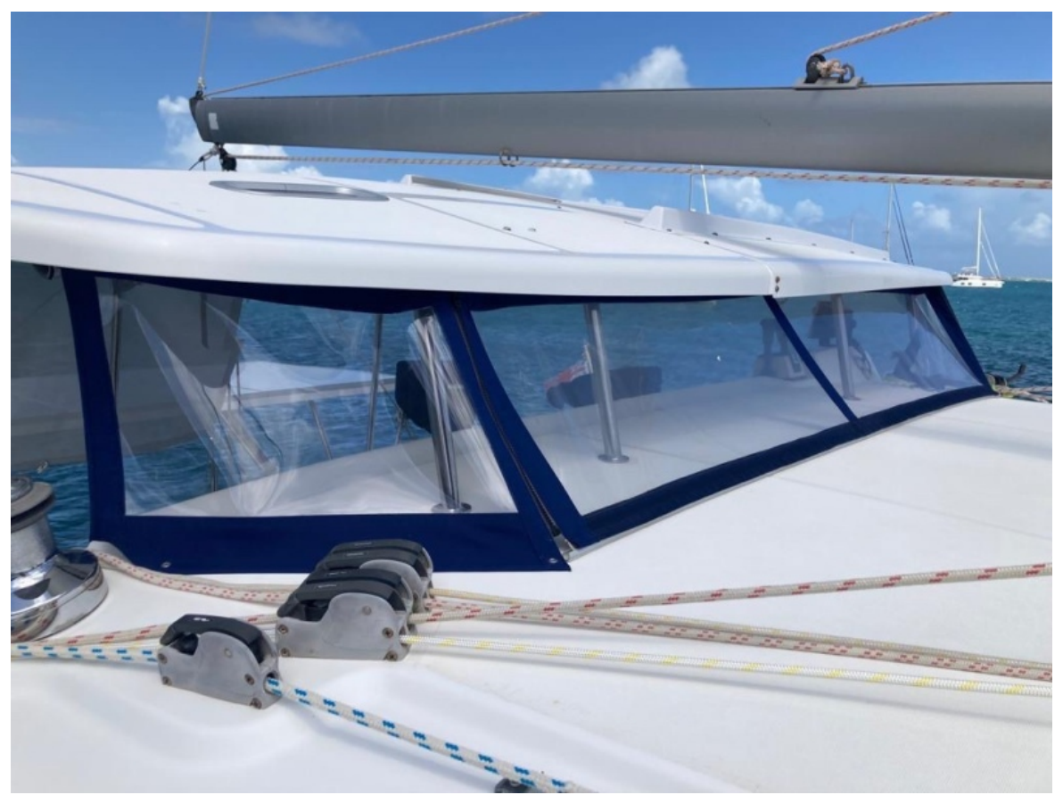
Used Sail Catamaran for sale 2004 Lagoon 380 - BLUE MOON OF AMBLE