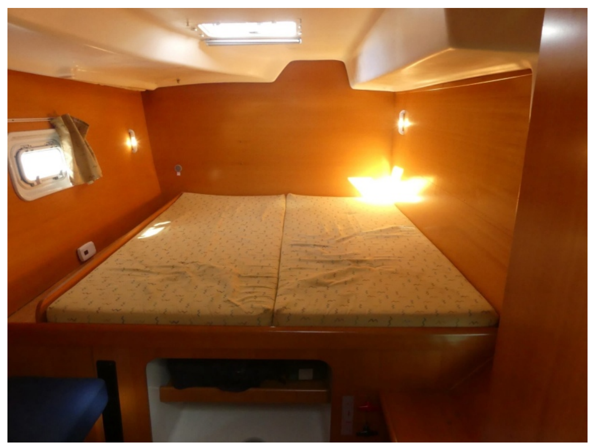
Used Sail Catamaran for sale 2004 Lagoon 380 - BLUE MOON OF AMBLE