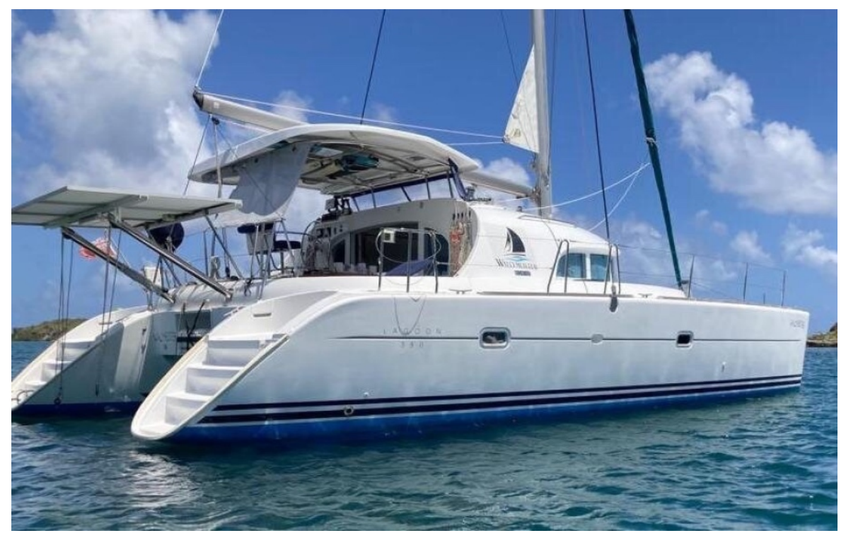
Used Sail Catamaran for sale 2004 Lagoon 380 - BLUE MOON OF AMBLE