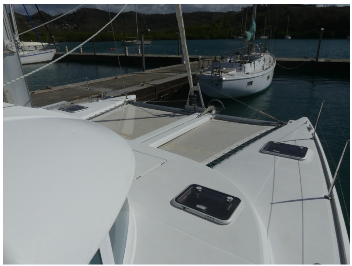
Used Sail Catamaran for sale 2004 Lagoon 380 - BLUE MOON OF AMBLE