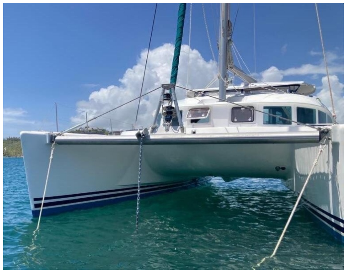
Used Sail Catamaran for sale 2004 Lagoon 380 - BLUE MOON OF AMBLE