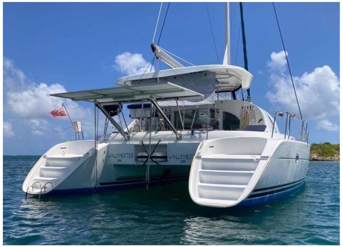
Used Sail Catamaran for sale 2004 Lagoon 380 - BLUE MOON OF AMBLE