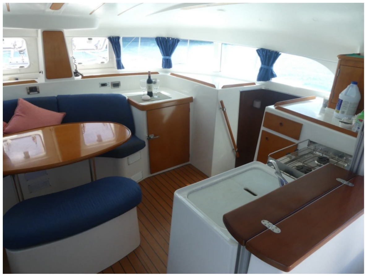
Used Sail Catamaran for sale 2004 Lagoon 380 - BLUE MOON OF AMBLE