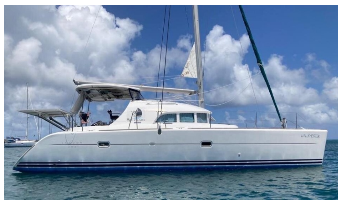
Used Sail Catamaran for sale 2004 Lagoon 380 - BLUE MOON OF AMBLE