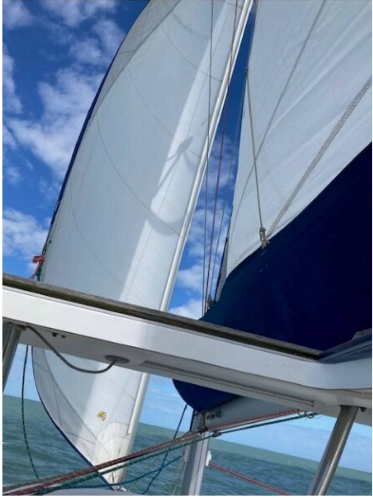
Used Sail Catamaran for sale 2009 Lagoon 380 - SAPPHIRE SEAS