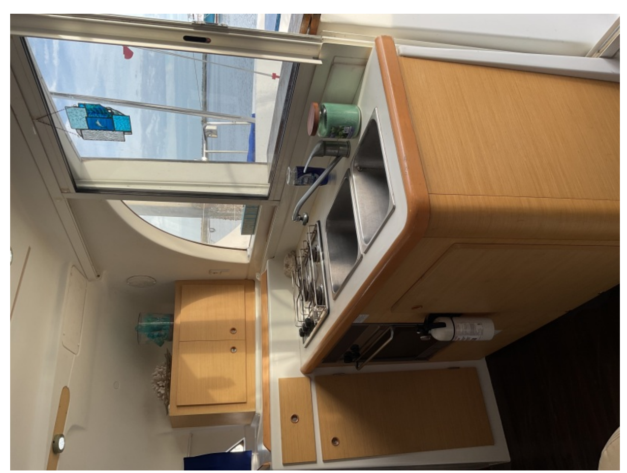
Used Sail Catamaran for sale 2009 Lagoon 380 - SAPPHIRE SEAS