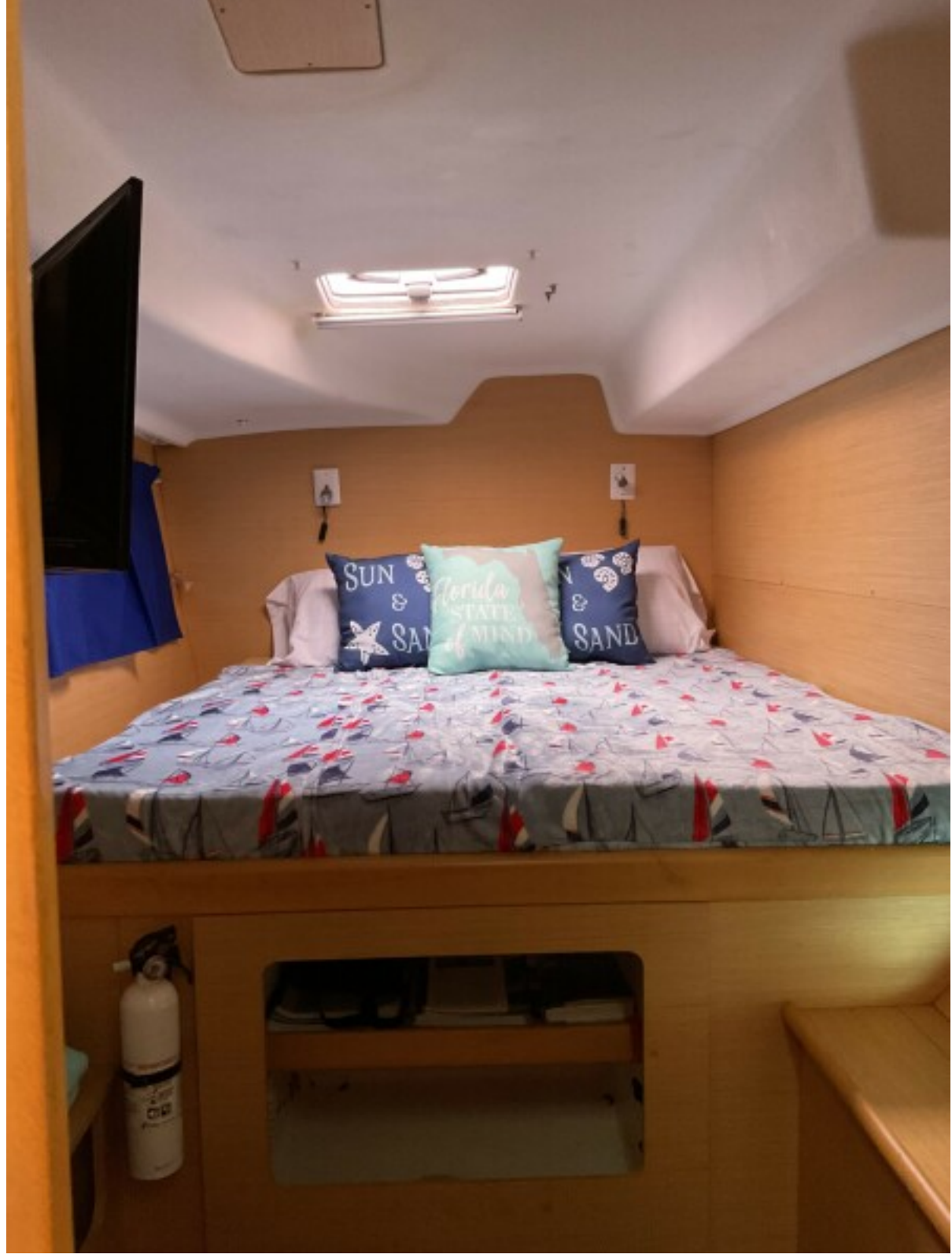
Used Sail Catamaran for sale 2009 Lagoon 380 - SAPPHIRE SEAS