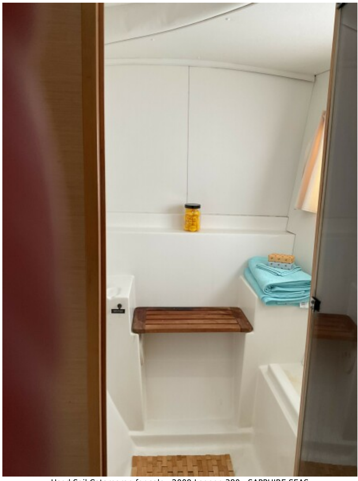
Used Sail Catamaran for sale 2009 Lagoon 380 - SAPPHIRE SEAS