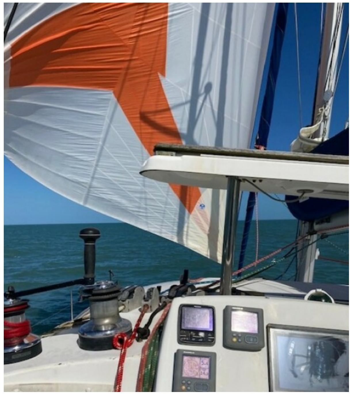
Used Sail Catamaran for sale 2009 Lagoon 380 - SAPPHIRE SEAS