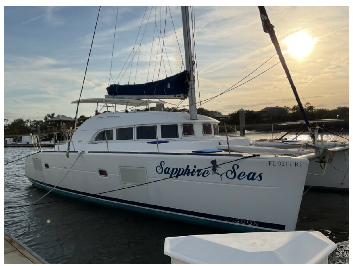
Used Sail Catamaran for sale 2009 Lagoon 380 - SAPPHIRE SEAS