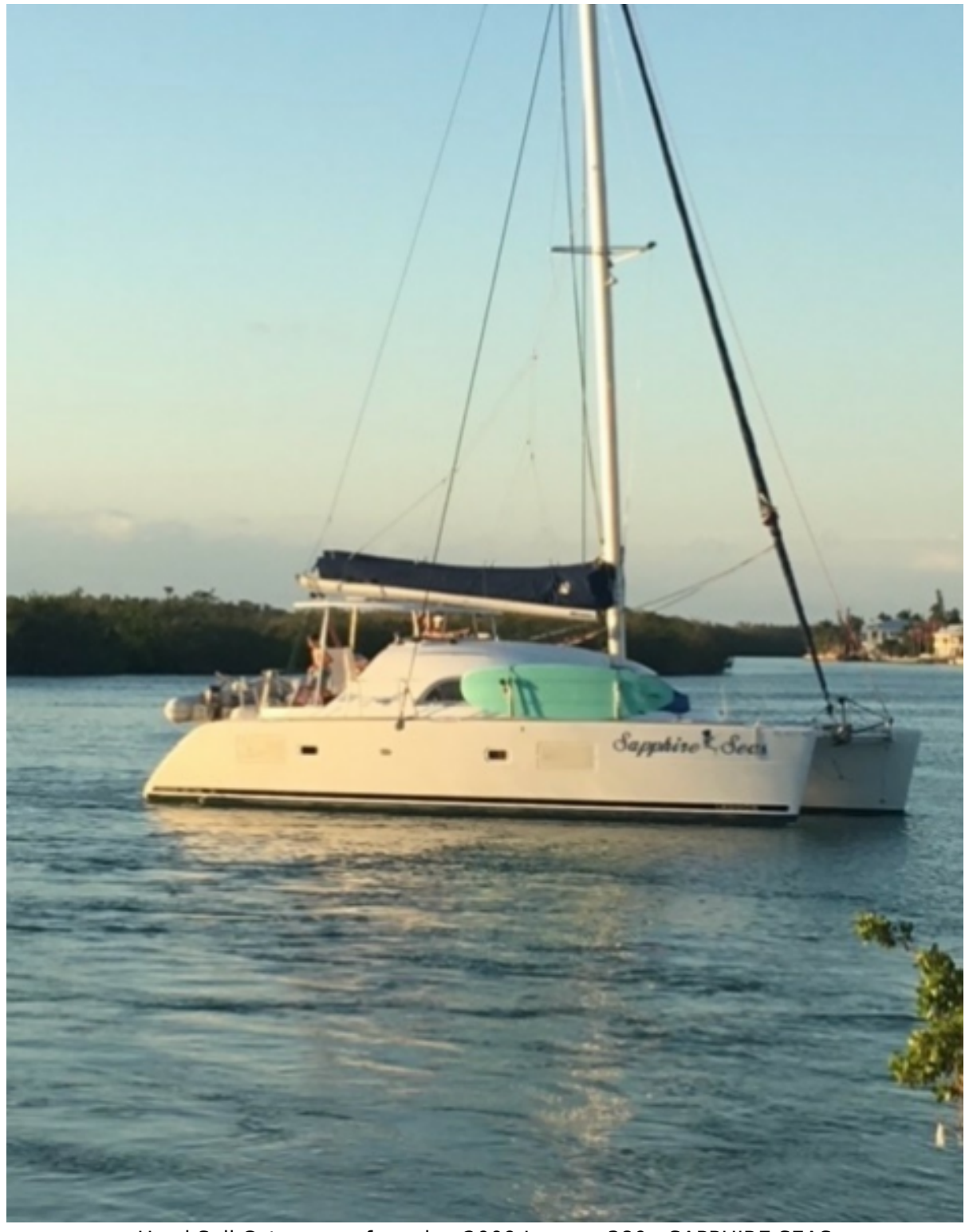
Used Sail Catamaran for sale 2009 Lagoon 380 - SAPPHIRE SEAS