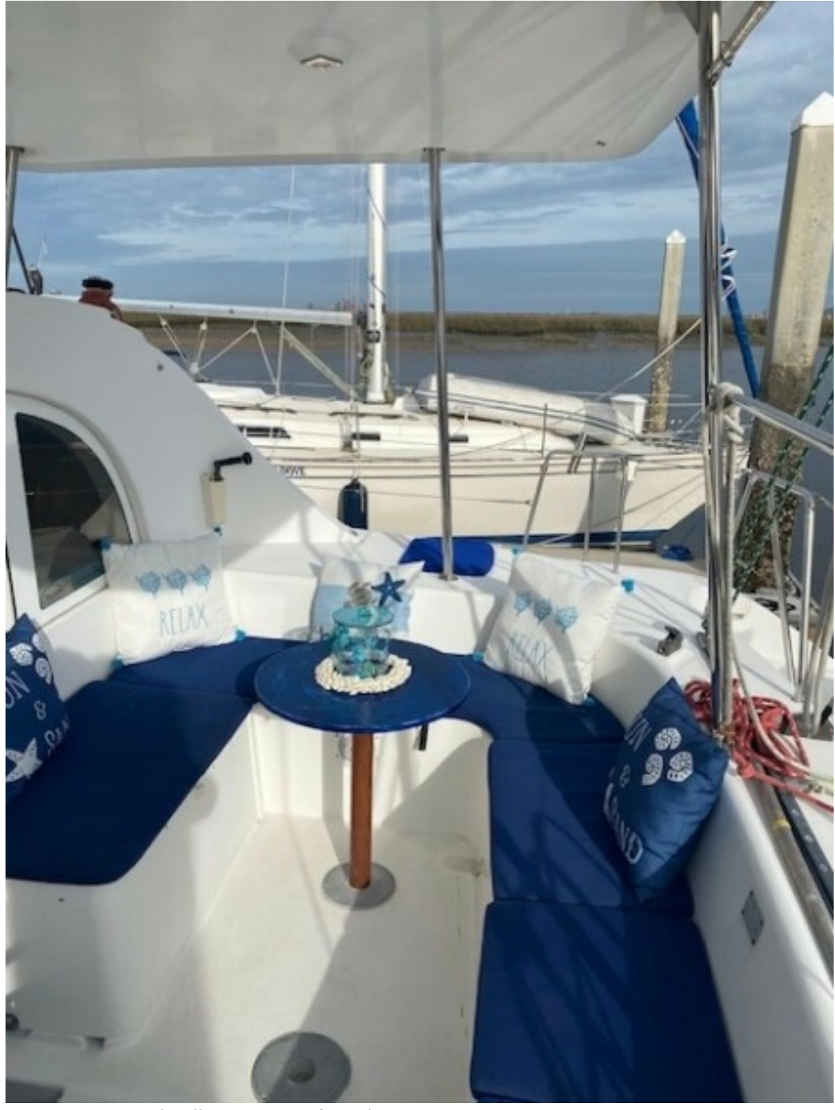
Used Sail Catamaran for sale 2009 Lagoon 380 - SAPPHIRE SEAS