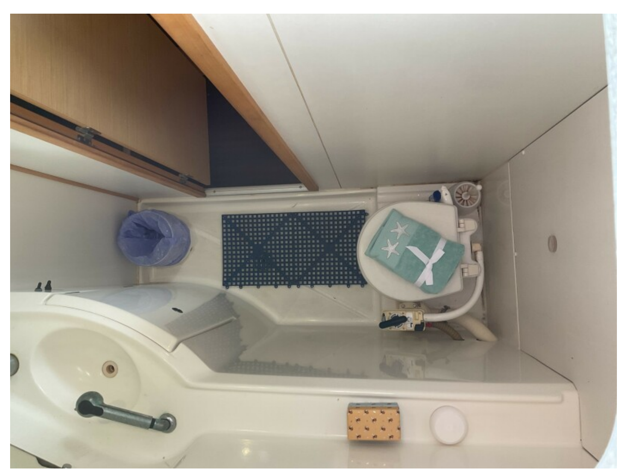
Used Sail Catamaran for sale 2009 Lagoon 380 - SAPPHIRE SEAS