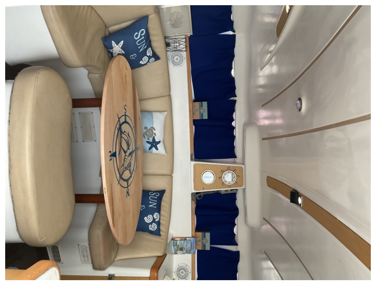
Used Sail Catamaran for sale 2009 Lagoon 380 - SAPPHIRE SEAS