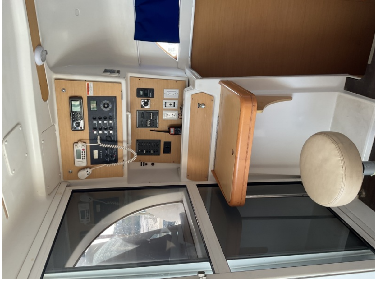
Used Sail Catamaran for sale 2009 Lagoon 380 - SAPPHIRE SEAS