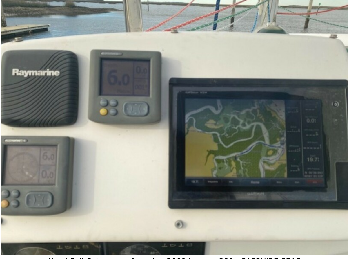
Used Sail Catamaran for sale 2009 Lagoon 380 - SAPPHIRE SEAS