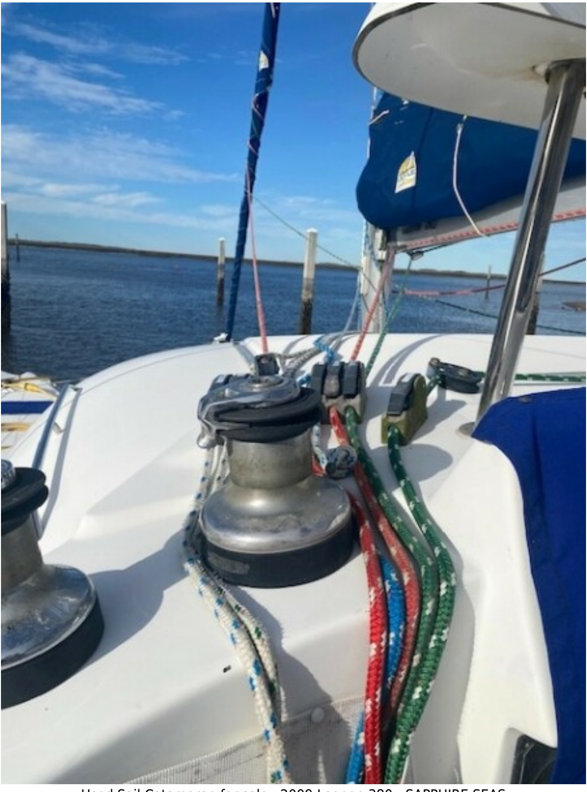
Used Sail Catamaran for sale 2009 Lagoon 380 - SAPPHIRE SEAS