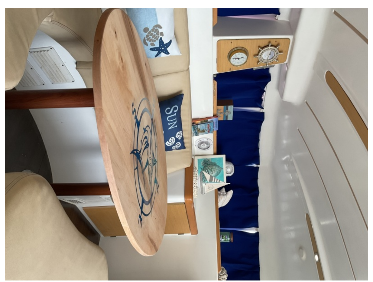
Used Sail Catamaran for sale 2009 Lagoon 380 - SAPPHIRE SEAS