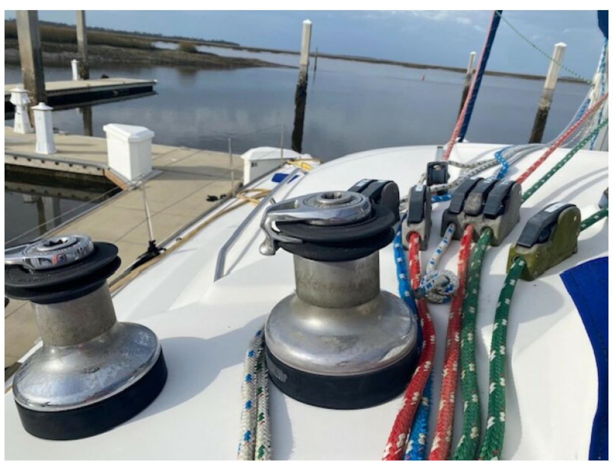
Used Sail Catamaran for sale 2009 Lagoon 380 - SAPPHIRE SEAS