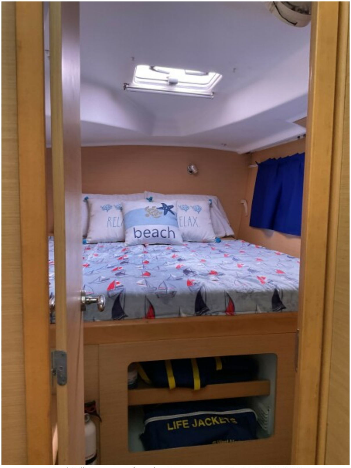
Used Sail Catamaran for sale 2009 Lagoon 380 - SAPPHIRE SEAS