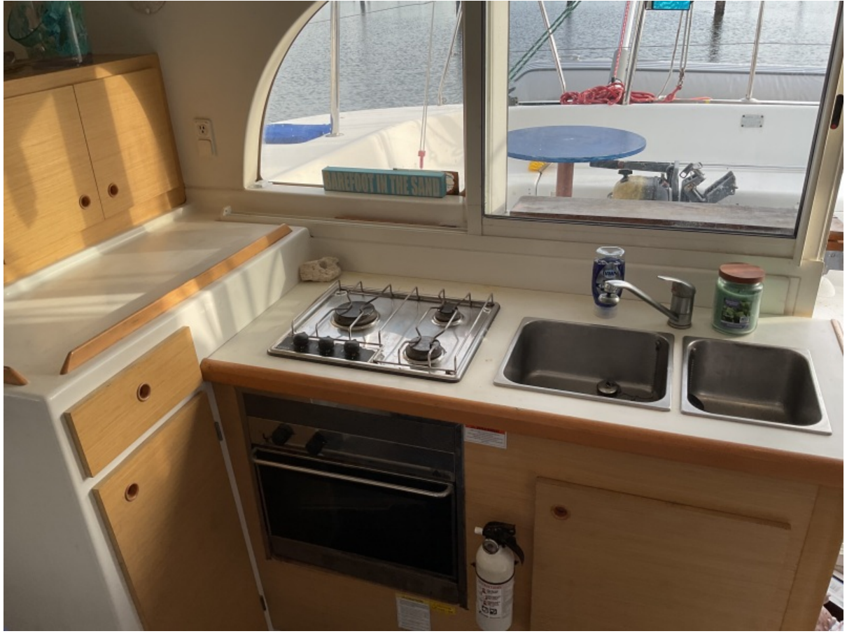
Used Sail Catamaran for sale 2009 Lagoon 380 - SAPPHIRE SEAS