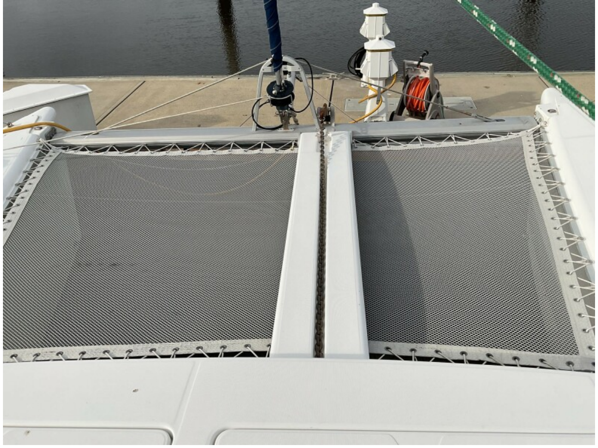
Used Sail Catamaran for sale 2009 Lagoon 380 - SAPPHIRE SEAS