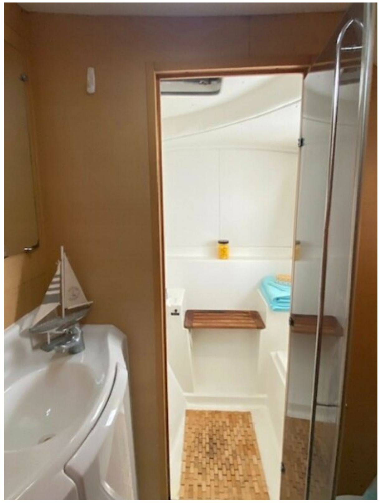
Used Sail Catamaran for sale 2009 Lagoon 380 - SAPPHIRE SEAS