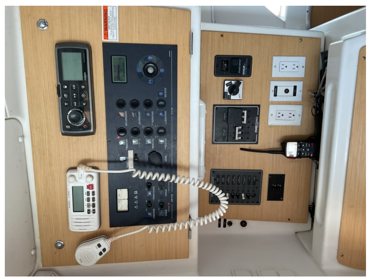
Used Sail Catamaran for sale 2009 Lagoon 380 - SAPPHIRE SEAS