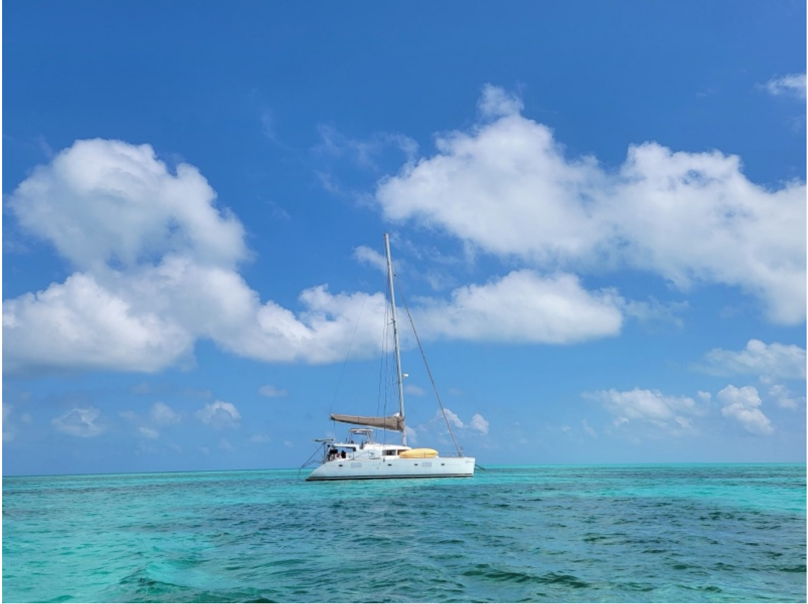
Used Sail Catamaran for sale 2009 Lagoon 500 - SANDSTAR