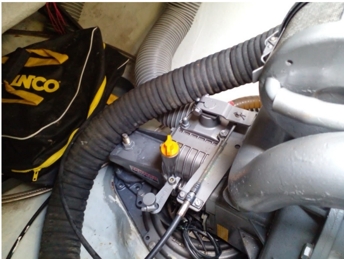
Used Sail Catamaran for sale 2009 Lagoon 500 - SANDSTAR