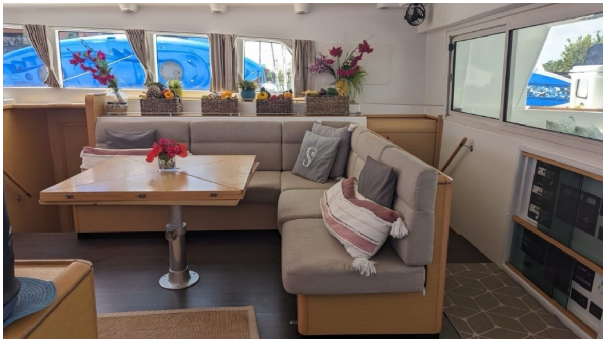
Used Sail Catamaran for sale 2009 Lagoon 500 - SANDSTAR