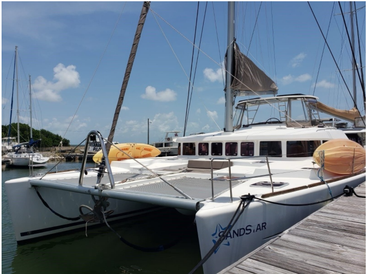
Used Sail Catamaran for sale 2009 Lagoon 500 - SANDSTAR