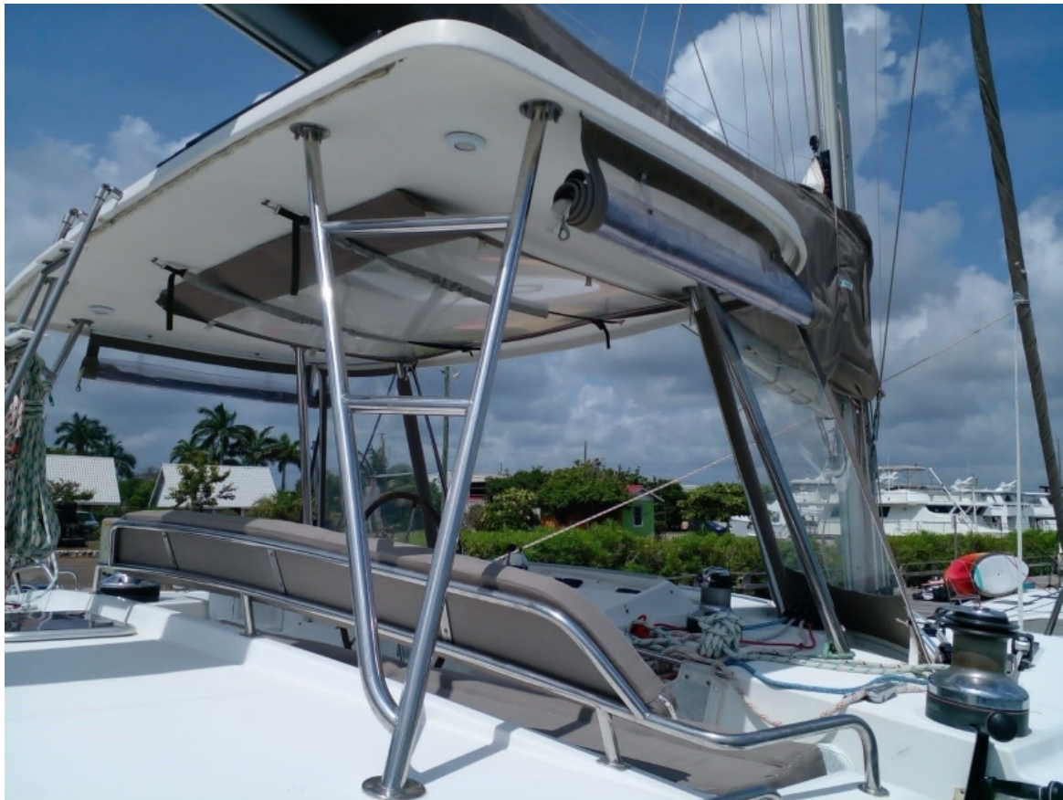
Used Sail Catamaran for sale 2009 Lagoon 500 - SANDSTAR