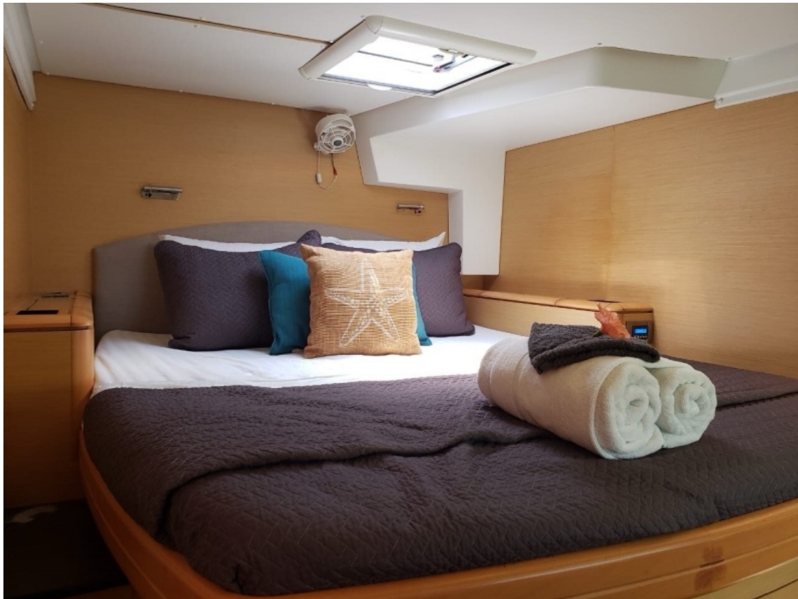
Used Sail Catamaran for sale 2009 Lagoon 500 - SANDSTAR