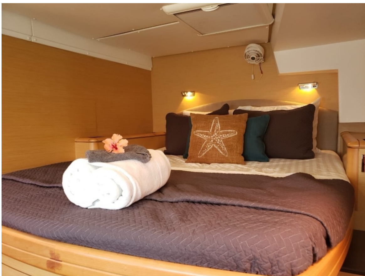
Used Sail Catamaran for sale 2009 Lagoon 500 - SANDSTAR