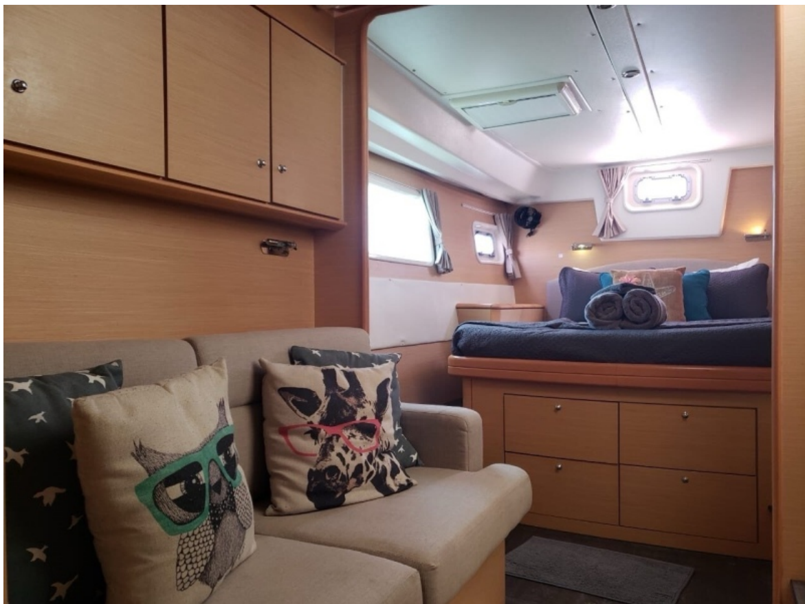
Used Sail Catamaran for sale 2009 Lagoon 500 - SANDSTAR