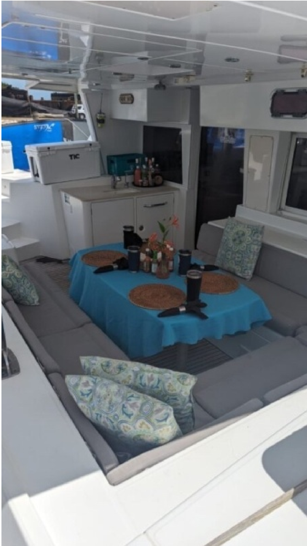
Used Sail Catamaran for sale 2009 Lagoon 500 - SANDSTAR