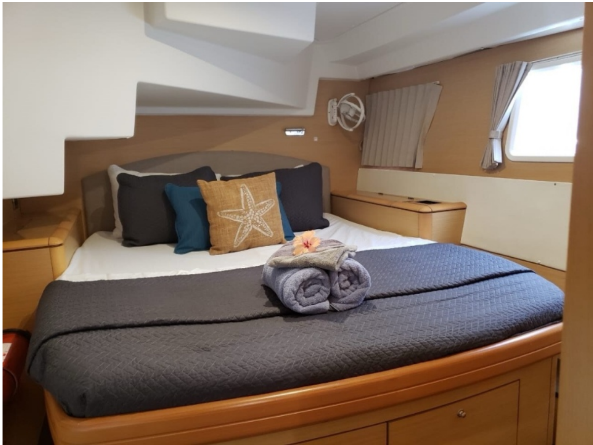
Used Sail Catamaran for sale 2009 Lagoon 500 - SANDSTAR