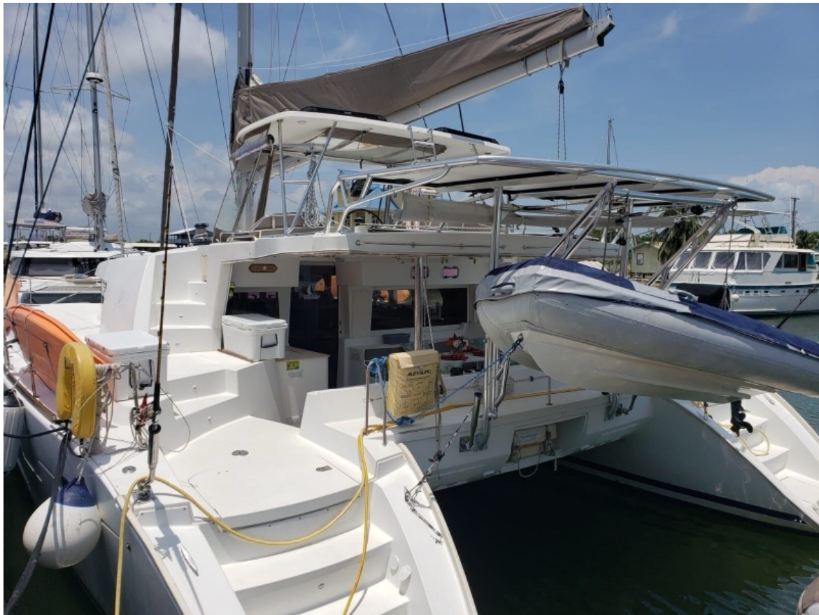
Used Sail Catamaran for sale 2009 Lagoon 500 - SANDSTAR