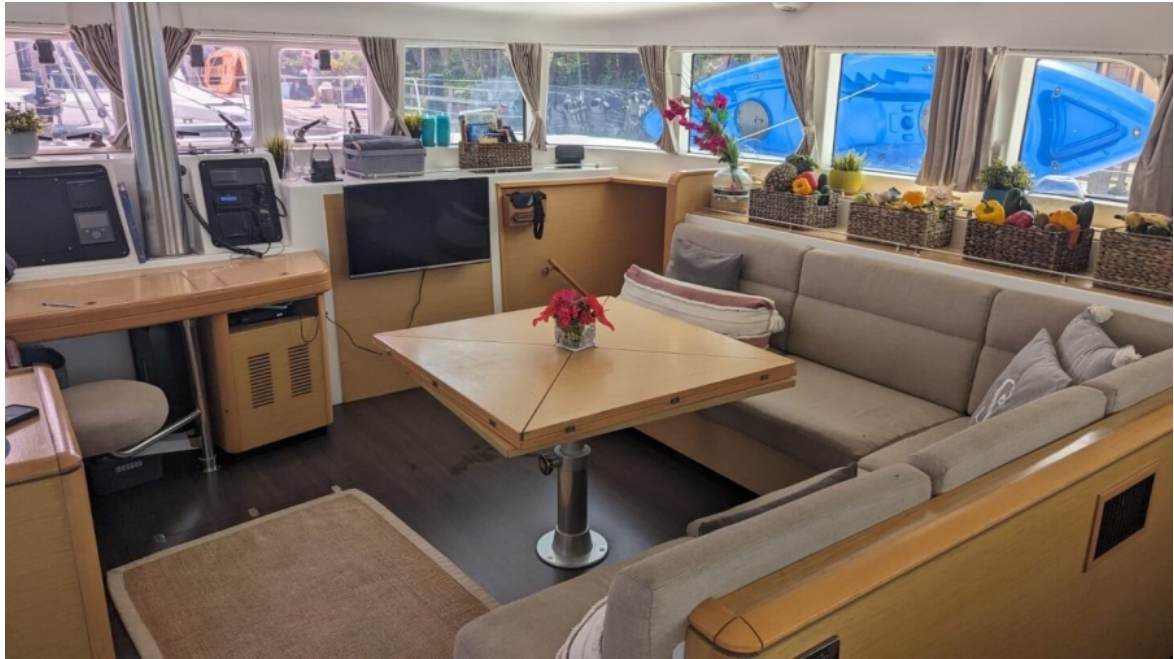
Used Sail Catamaran for sale 2009 Lagoon 500 - SANDSTAR