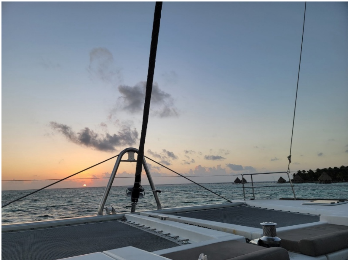
Used Sail Catamaran for sale 2009 Lagoon 500 - SANDSTAR