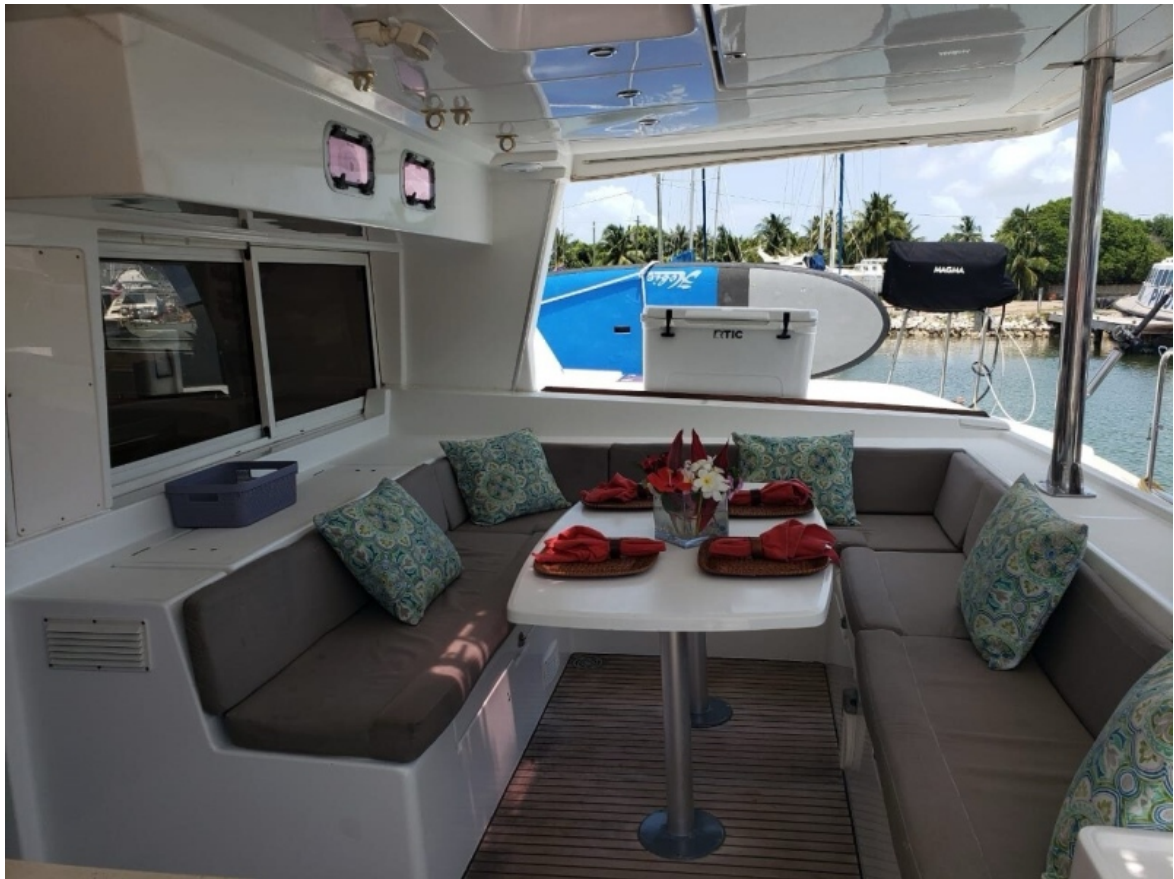
Used Sail Catamaran for sale 2009 Lagoon 500 - SANDSTAR