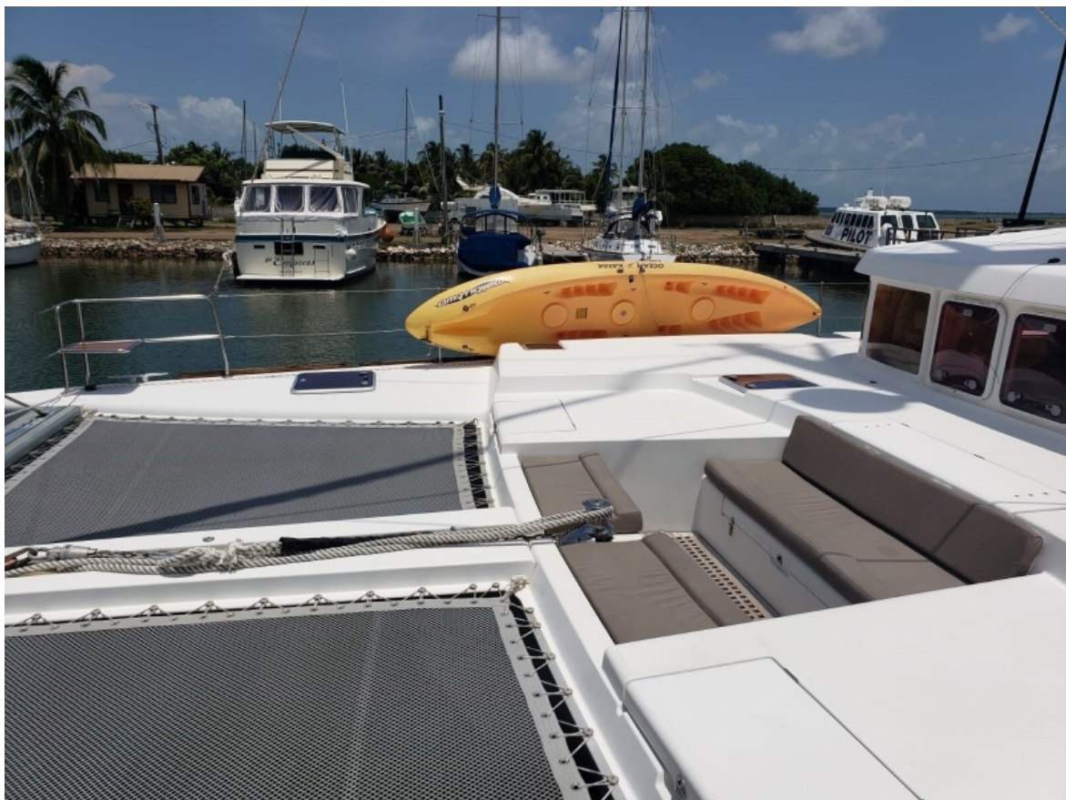
Used Sail Catamaran for sale 2009 Lagoon 500 - SANDSTAR