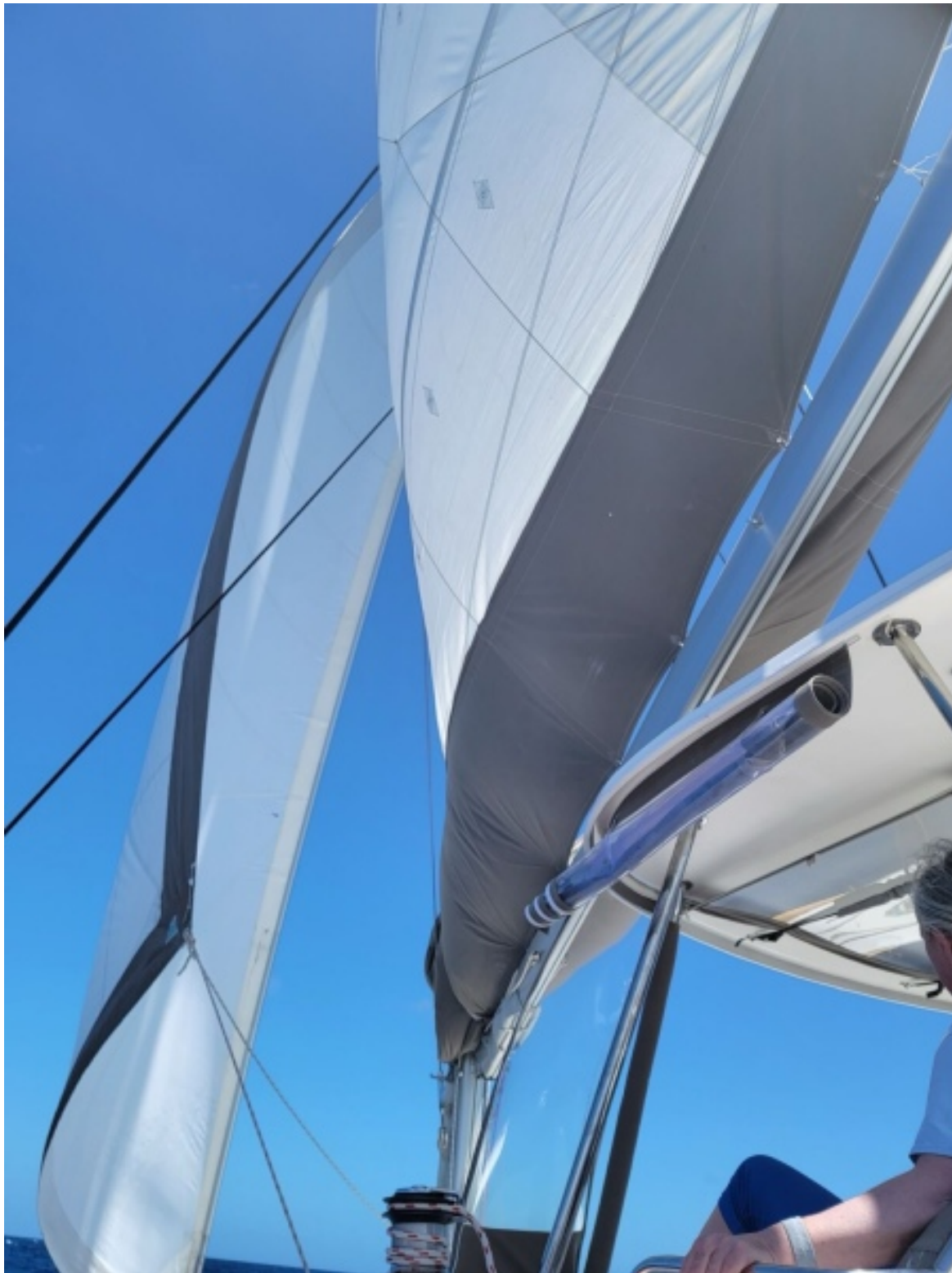
Used Sail Catamaran for sale 2009 Lagoon 500 - SANDSTAR