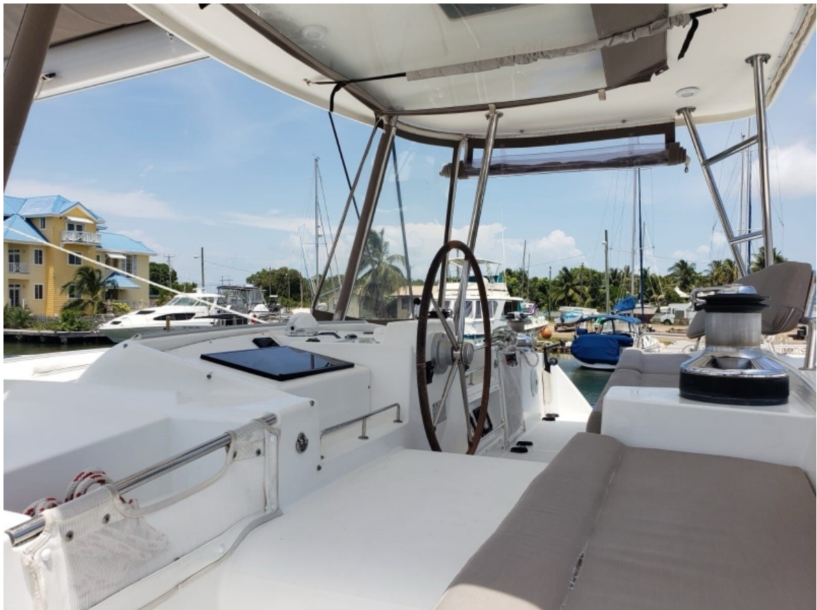
Used Sail Catamaran for sale 2009 Lagoon 500 - SANDSTAR