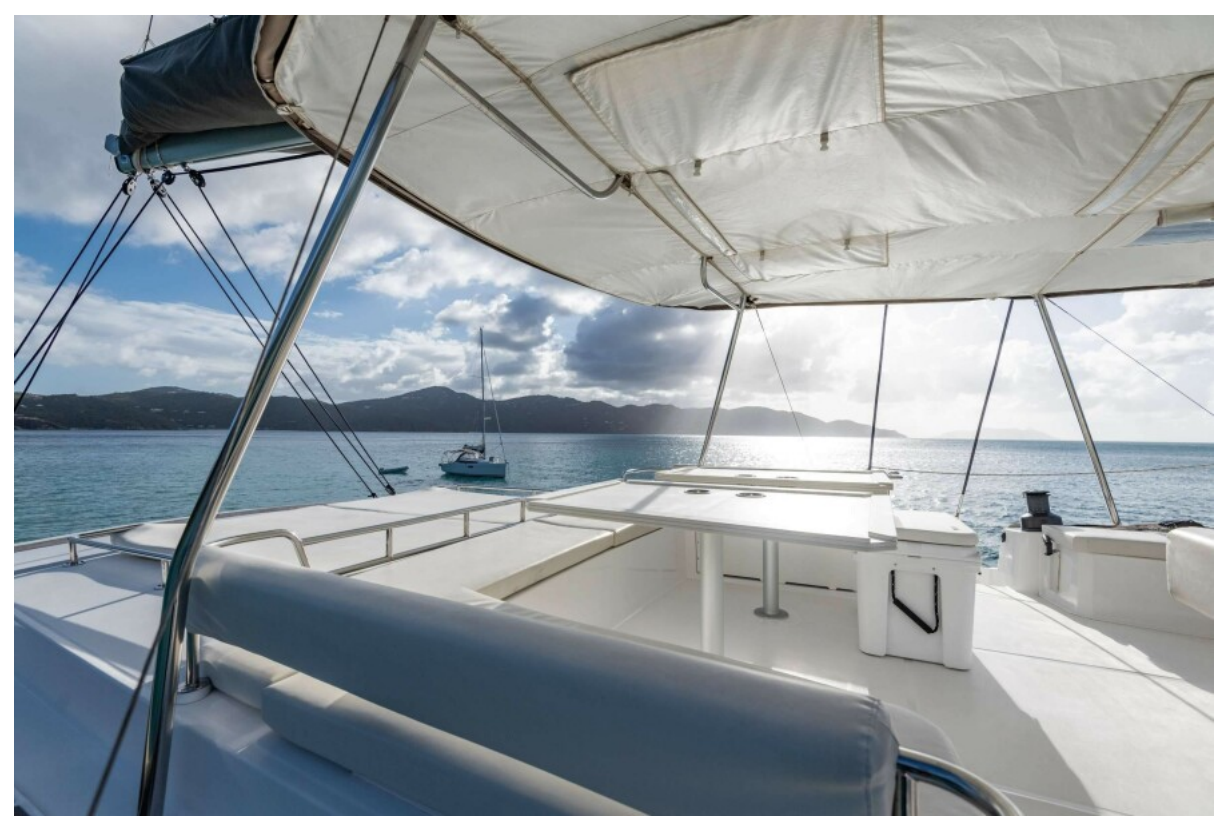
Used Sail Catamaran for sale 2020 BALI CATAMARANS Bali 5.4 - AD ASTRA