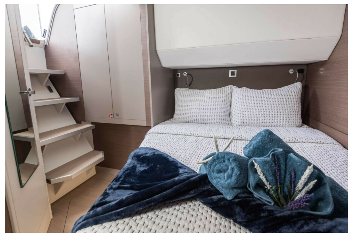
Used Sail Catamaran for sale 2020 BALI CATAMARANS Bali 5.4 - AD ASTRA