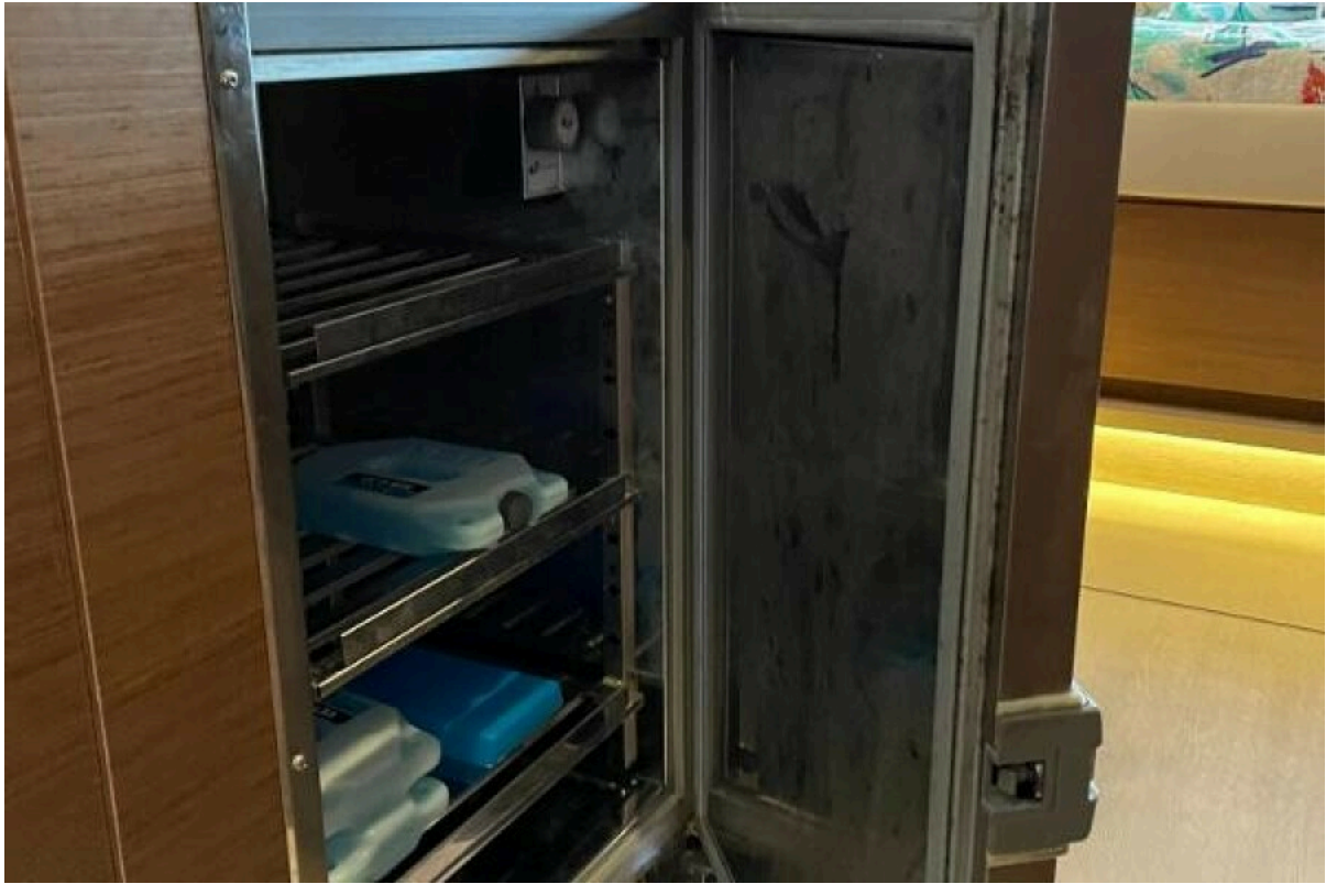
Used Sail Catamaran for sale 2019 Lagoon 50 - LIVE FREE