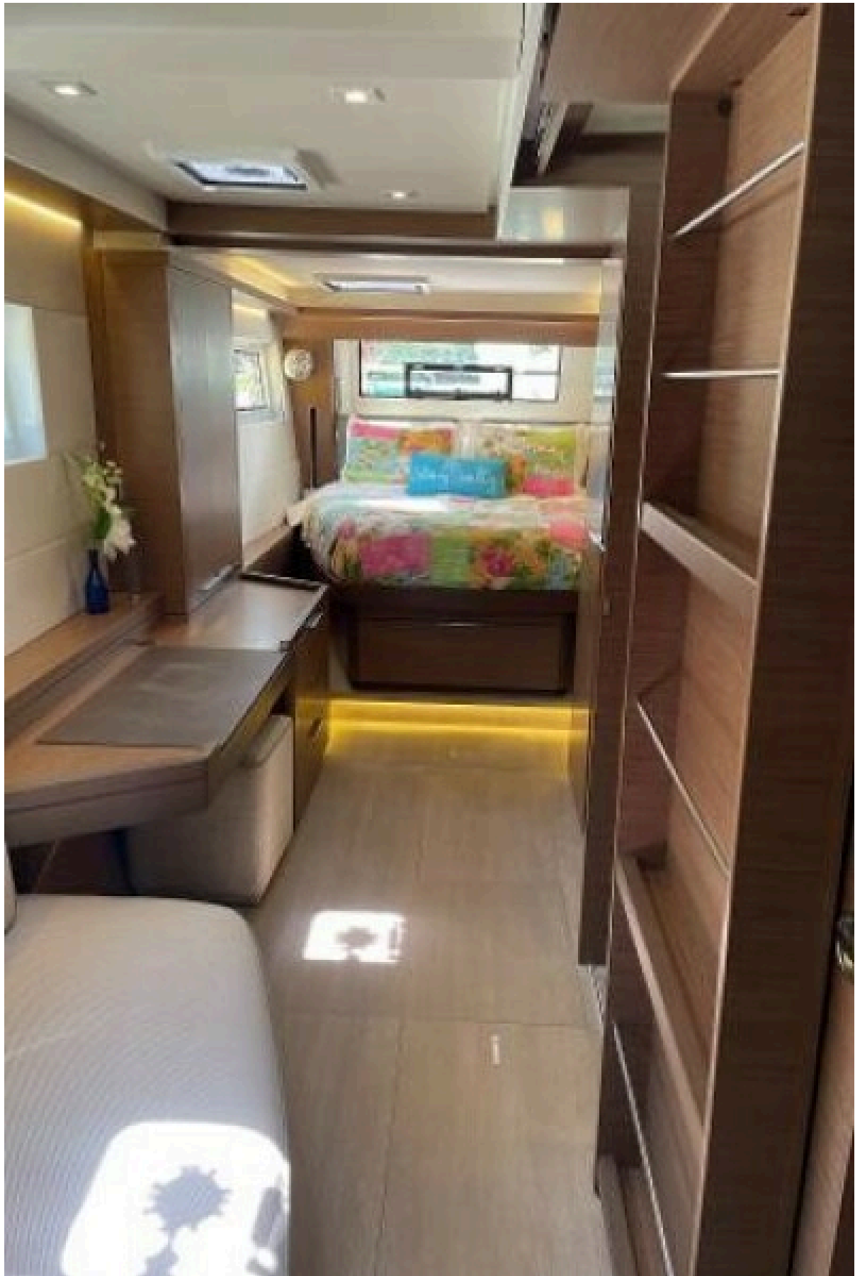
Used Sail Catamaran for sale 2019 Lagoon 50 - LIVE FREE