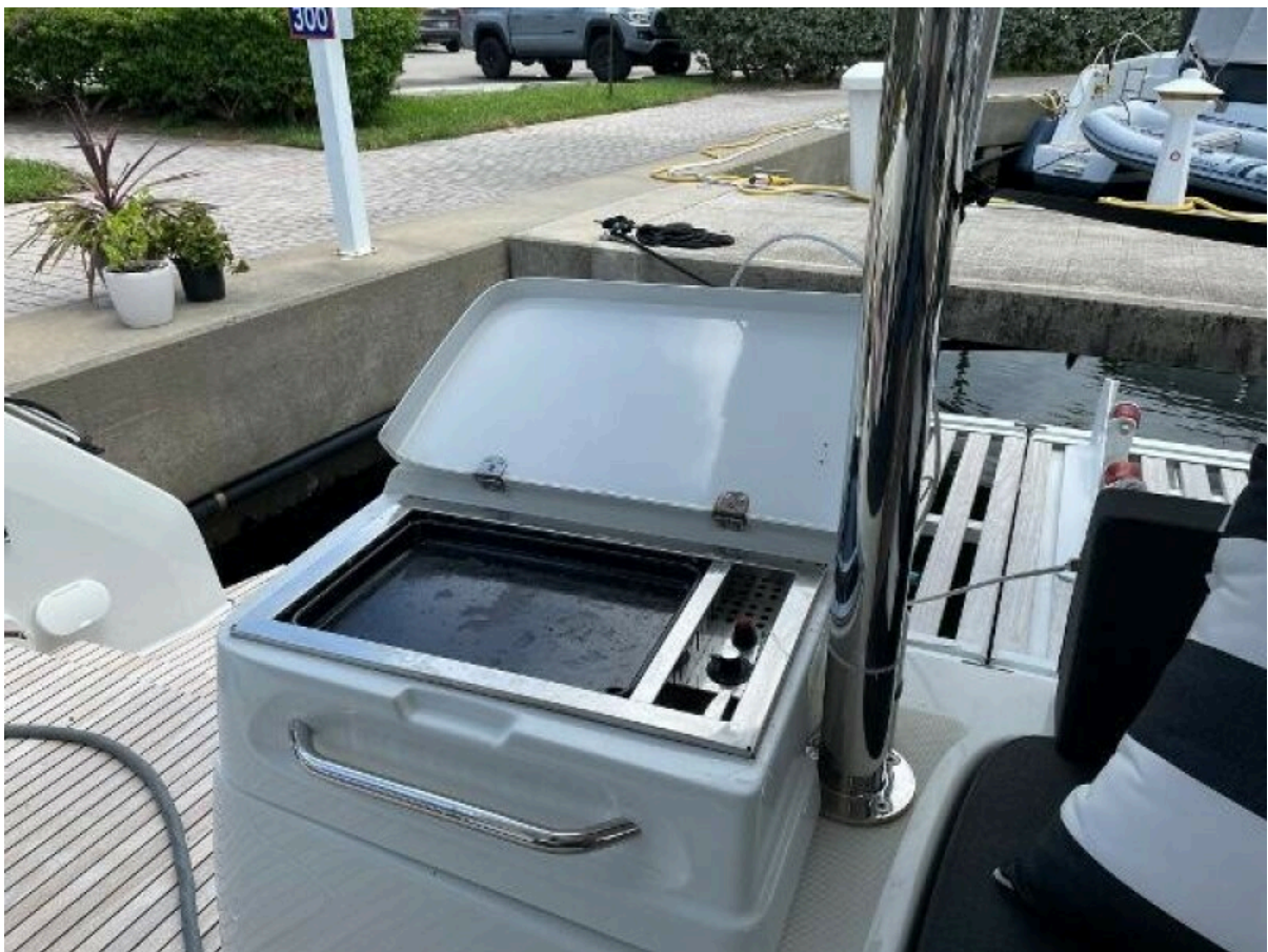
Used Sail Catamaran for sale 2019 Lagoon 50 - LIVE FREE