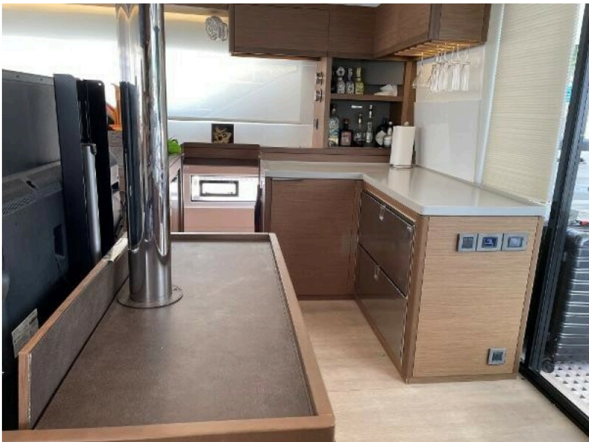
Used Sail Catamaran for sale 2019 Lagoon 50 - LIVE FREE