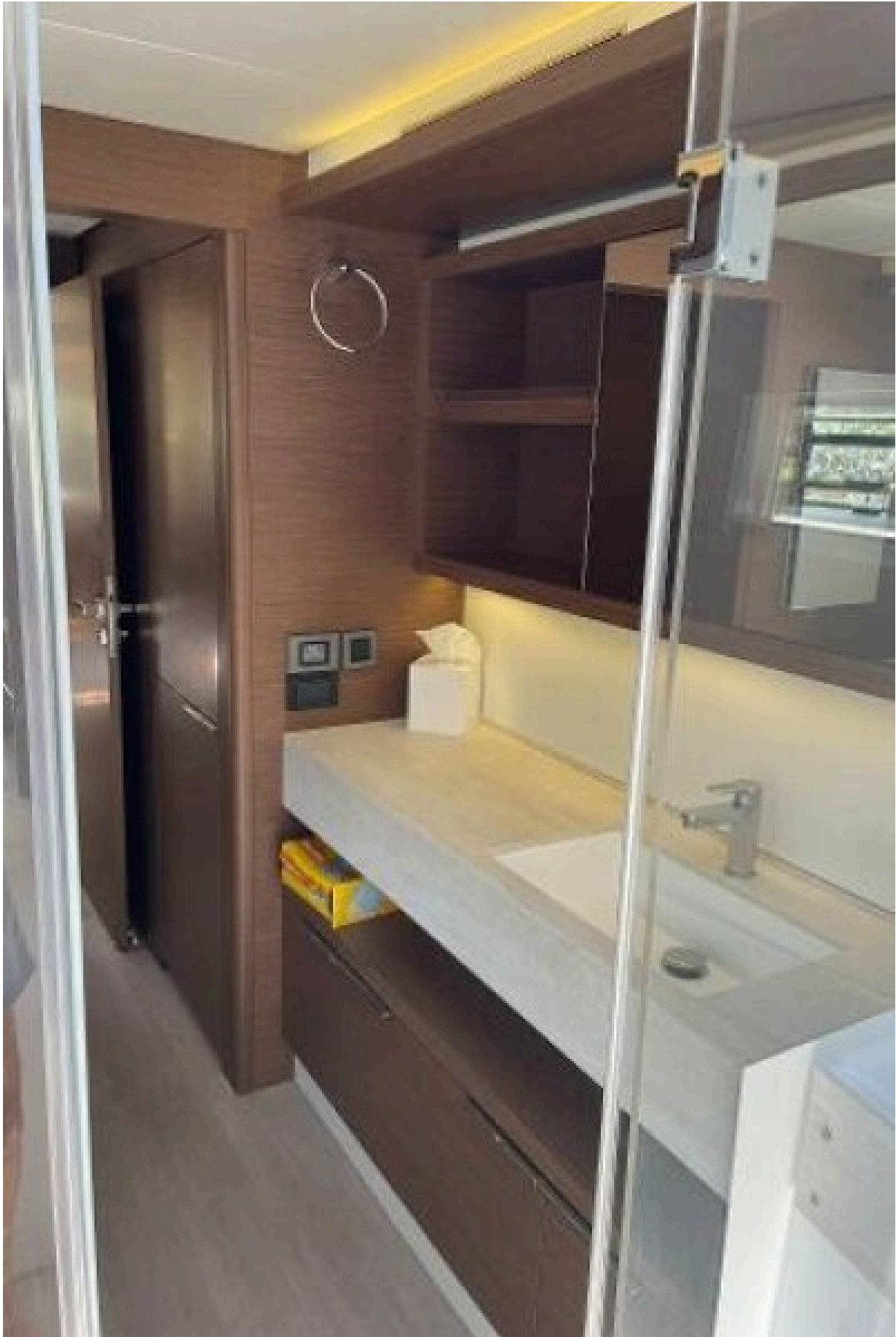
Used Sail Catamaran for sale 2019 Lagoon 50 - LIVE FREE