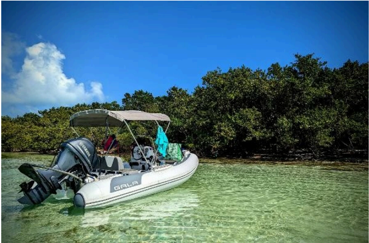
Used Sail Catamaran for sale 2019 Lagoon 50 - LIVE FREE