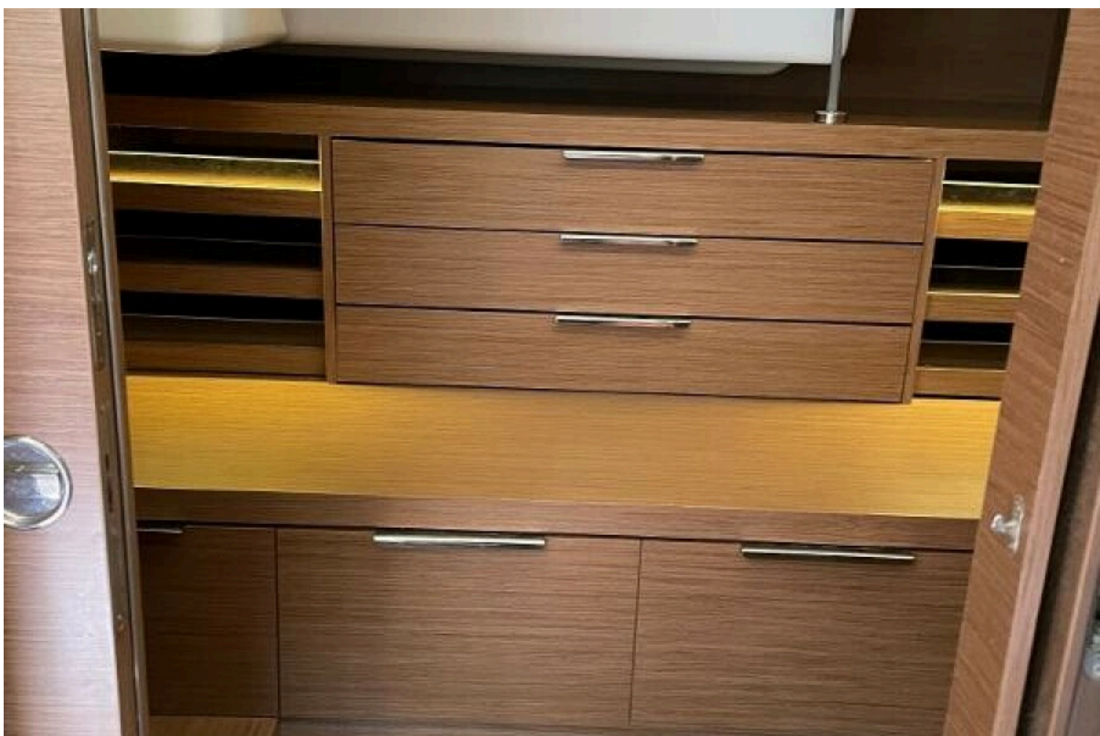
Used Sail Catamaran for sale 2019 Lagoon 50 - LIVE FREE