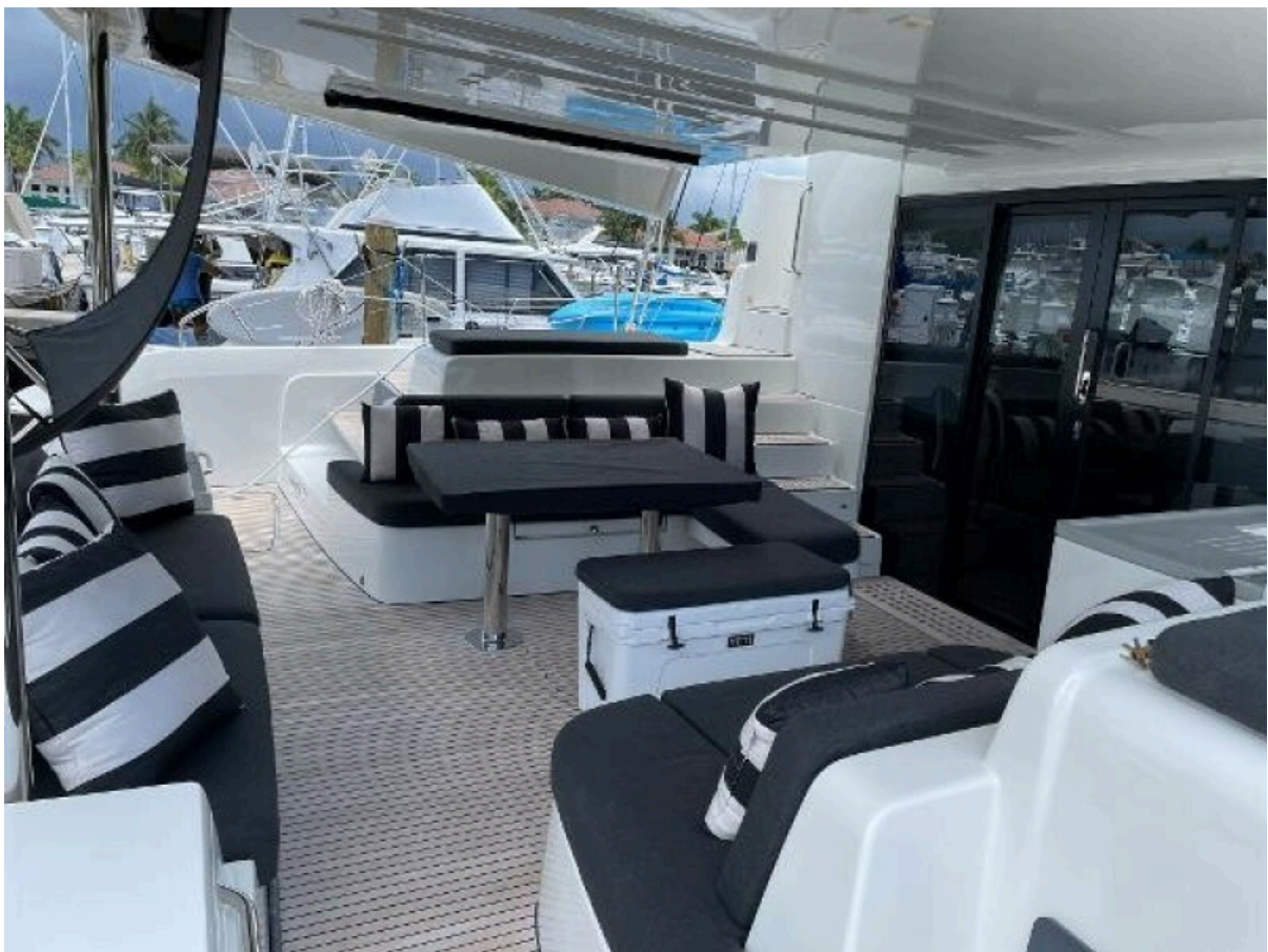
Used Sail Catamaran for sale 2019 Lagoon 50 - LIVE FREE