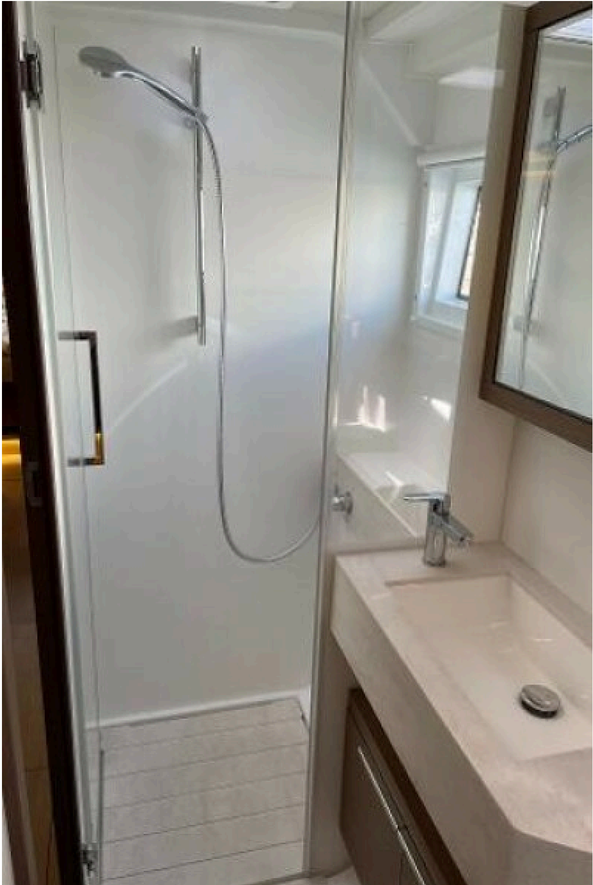
Used Sail Catamaran for sale 2019 Lagoon 50 - LIVE FREE