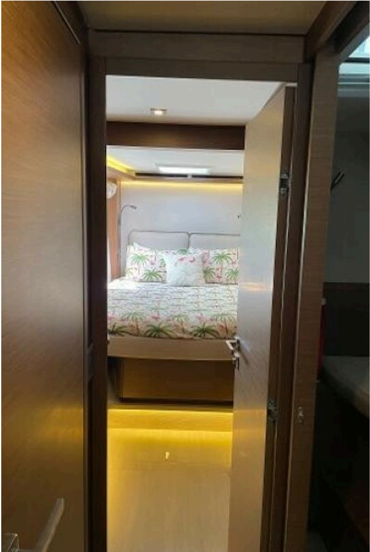
Used Sail Catamaran for sale 2019 Lagoon 50 - LIVE FREE