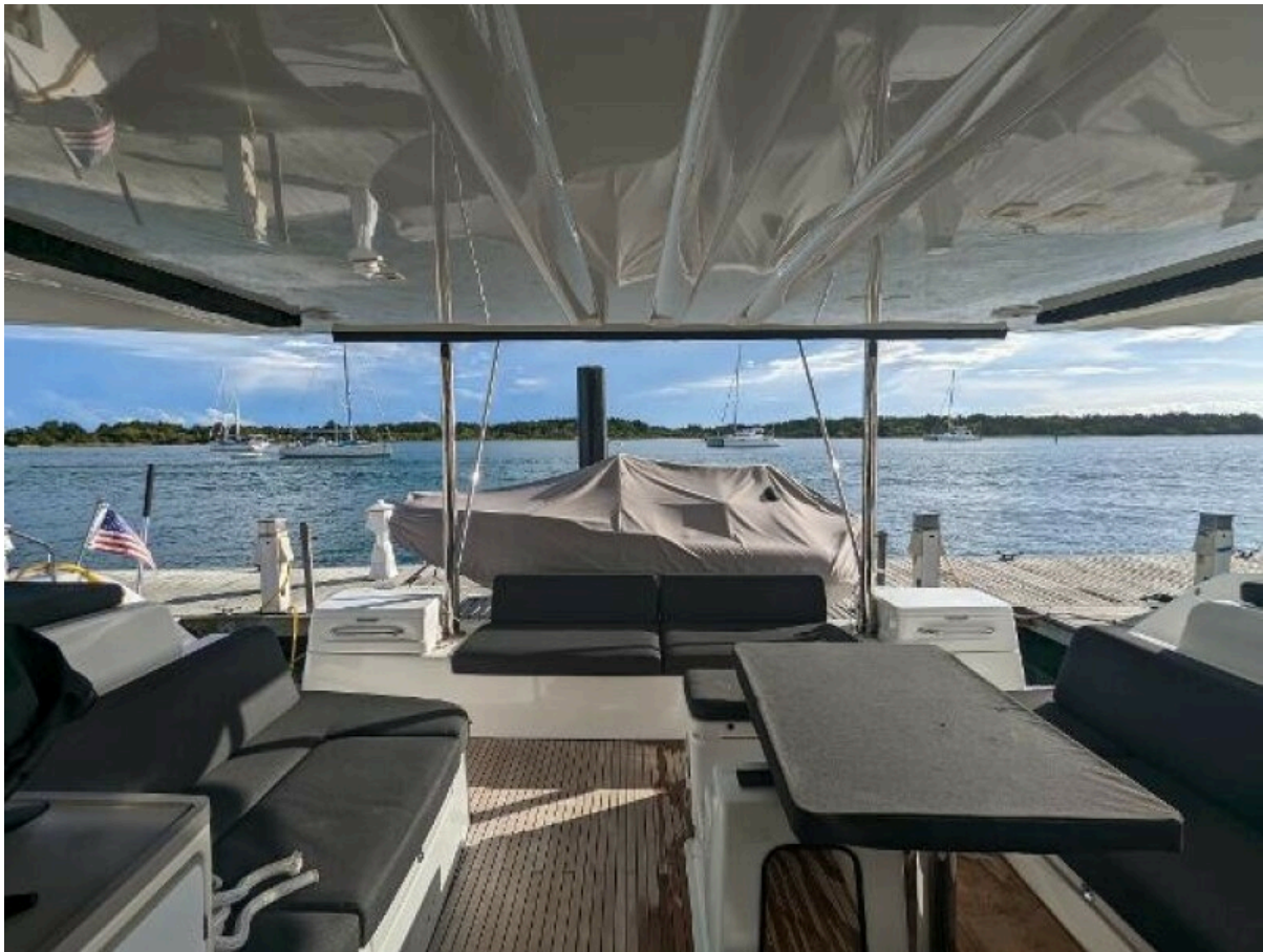
Used Sail Catamaran for sale 2019 Lagoon 50 - LIVE FREE