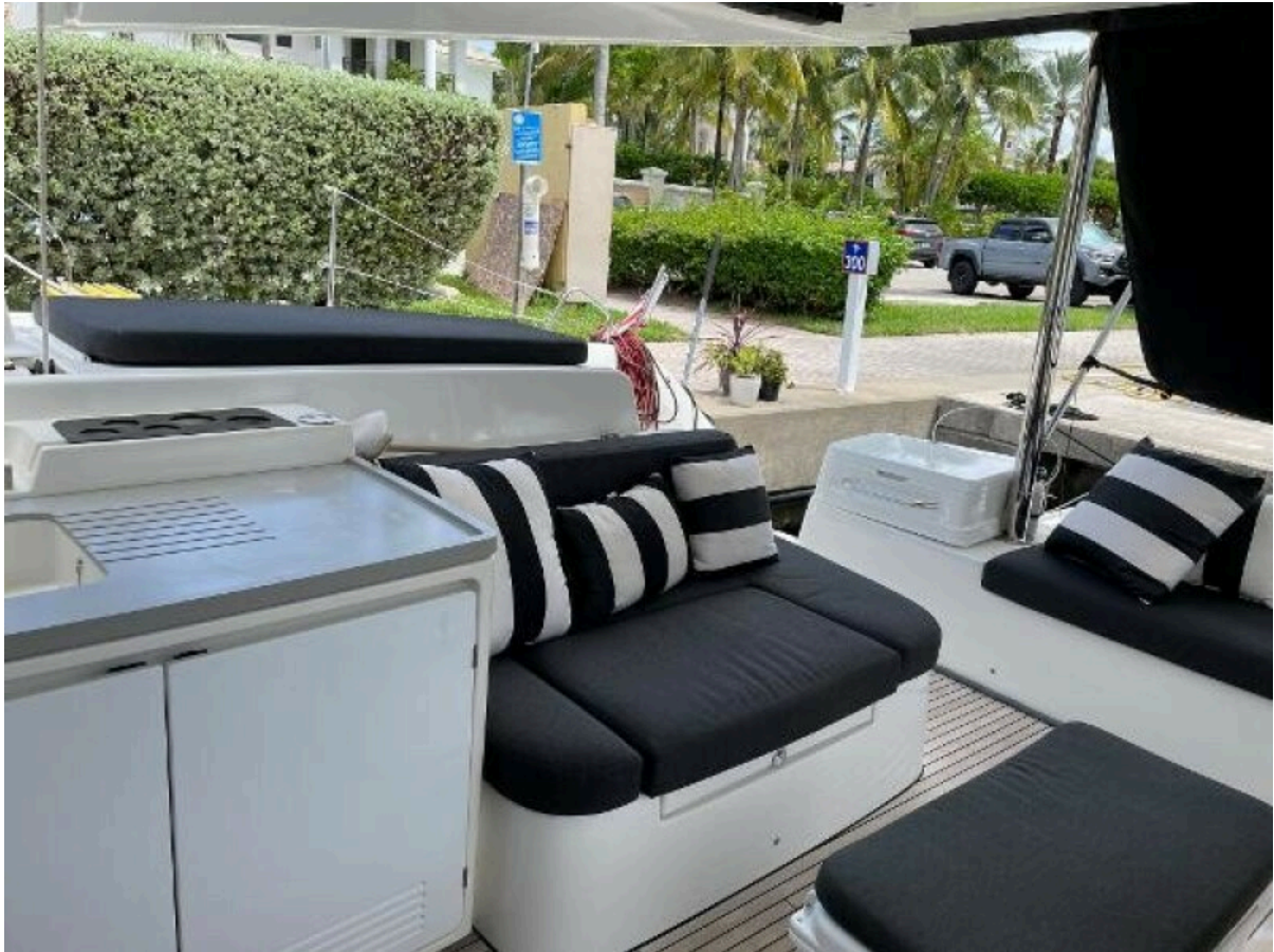
Used Sail Catamaran for sale 2019 Lagoon 50 - LIVE FREE