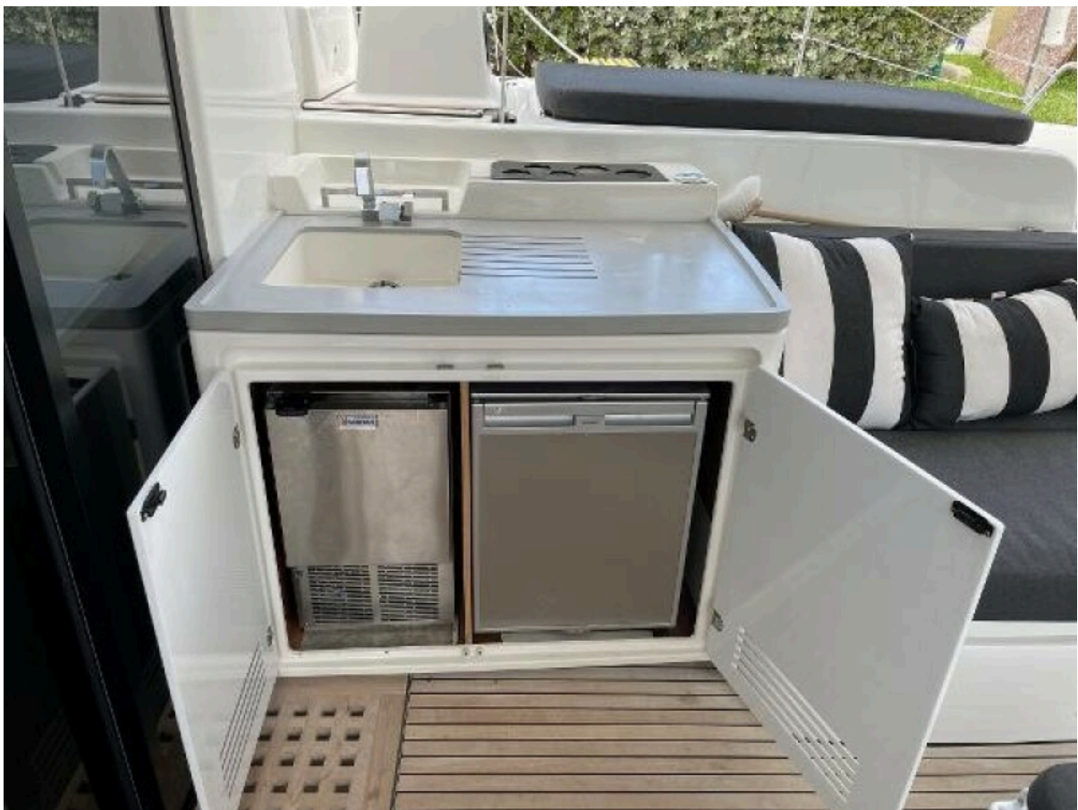
Used Sail Catamaran for sale 2019 Lagoon 50 - LIVE FREE