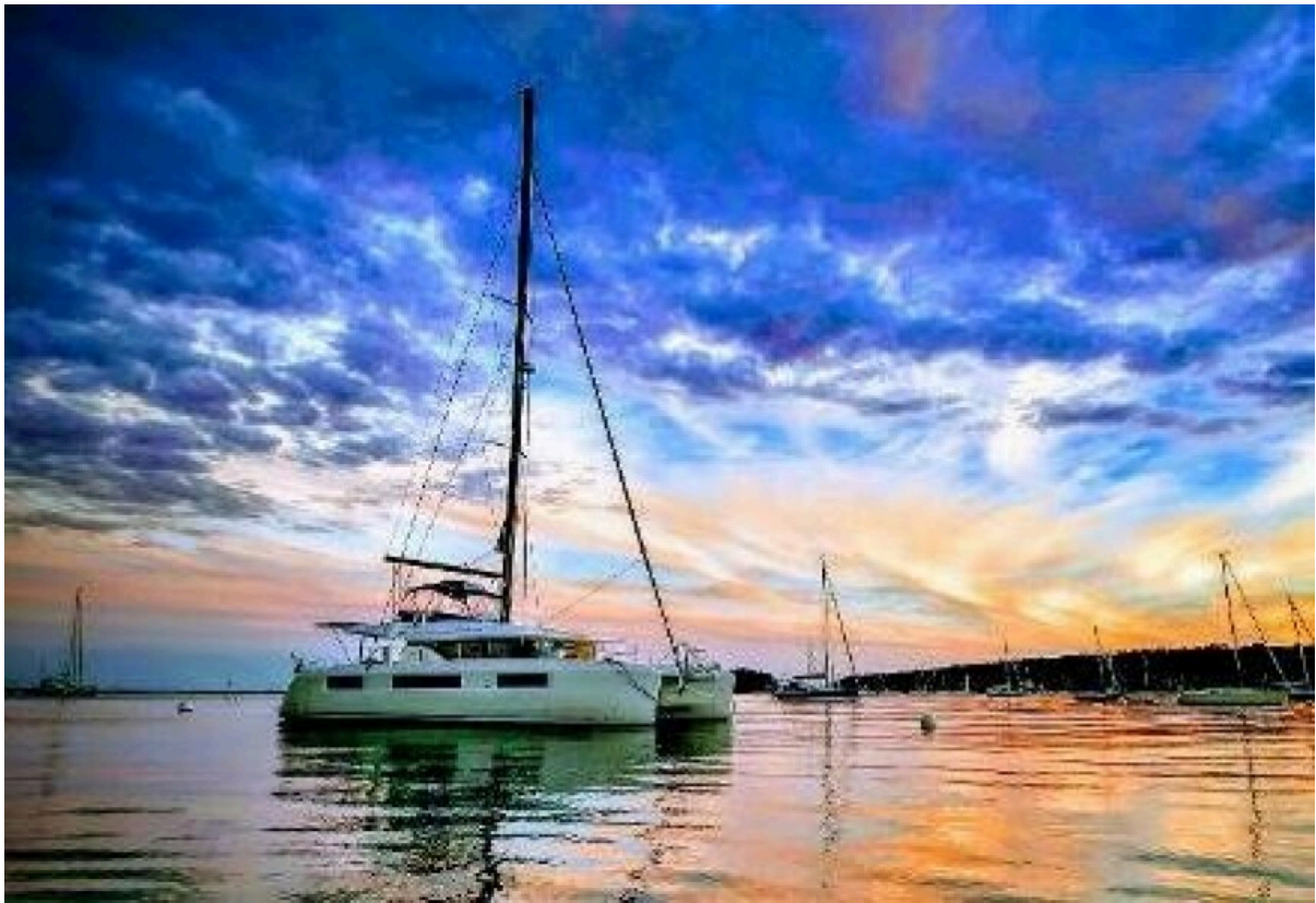
Used Sail Catamaran for sale 2019 Lagoon 50 - LIVE FREE