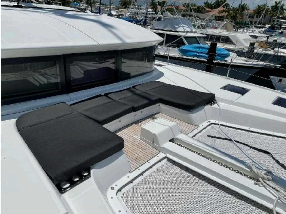
Used Sail Catamaran for sale 2019 Lagoon 50 - LIVE FREE