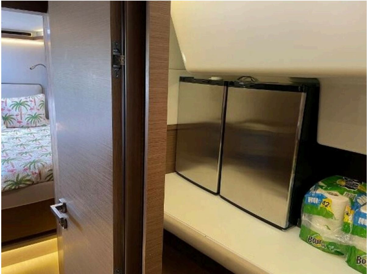
Used Sail Catamaran for sale 2019 Lagoon 50 - LIVE FREE