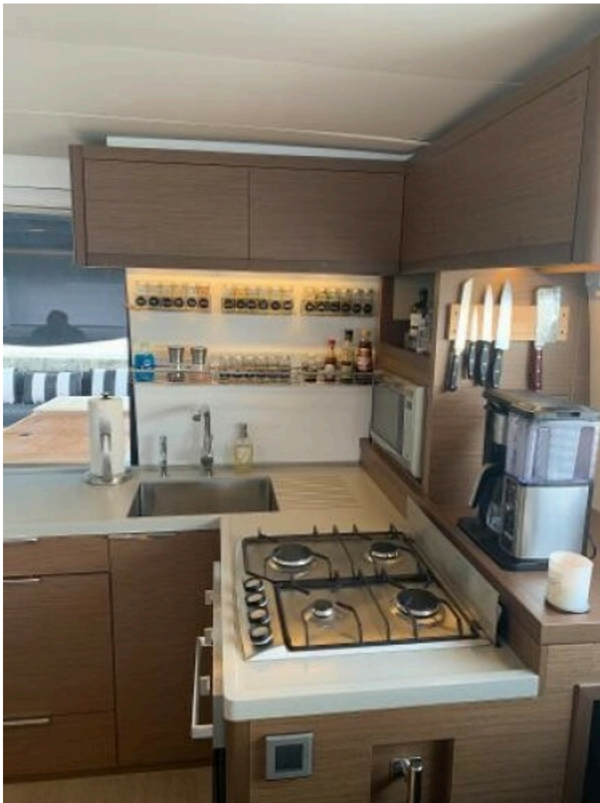
Used Sail Catamaran for sale 2019 Lagoon 50 - LIVE FREE