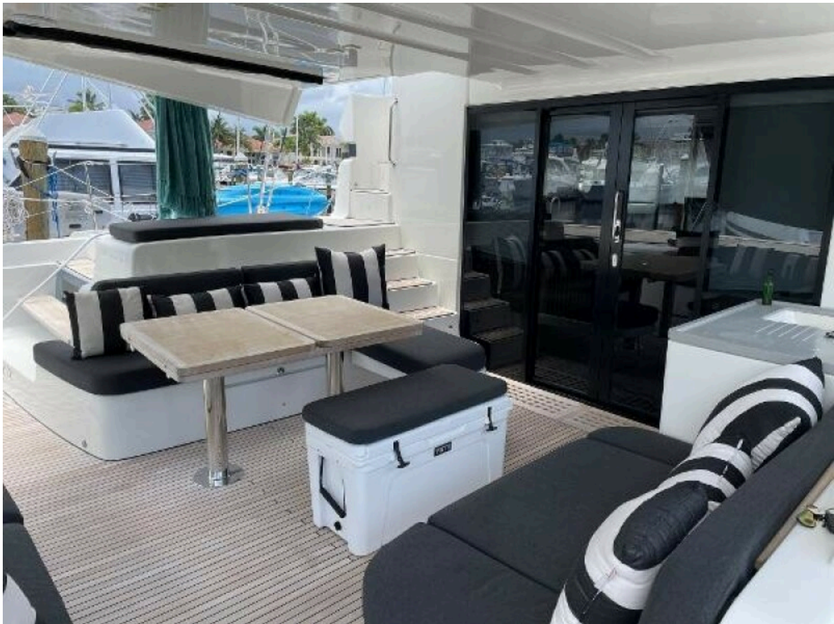
Used Sail Catamaran for sale 2019 Lagoon 50 - LIVE FREE