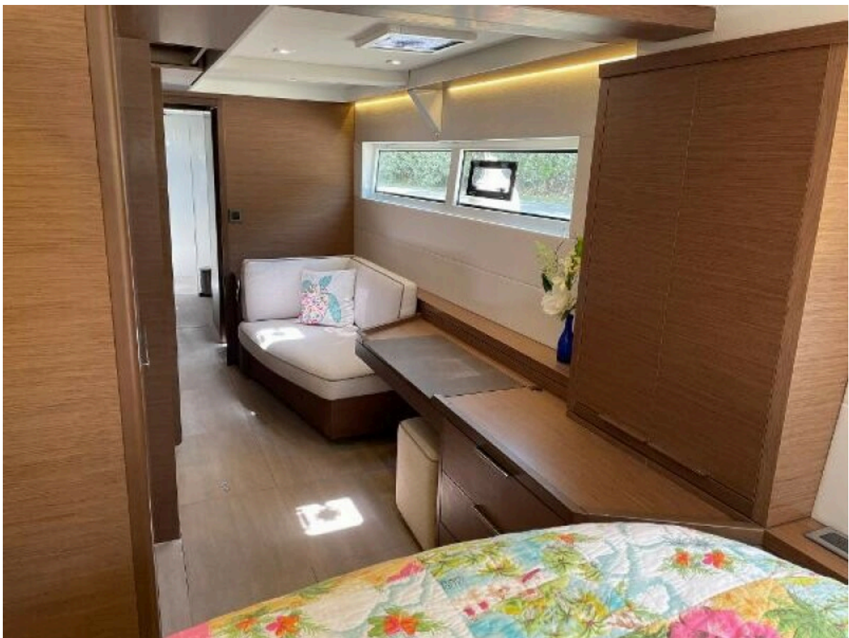
Used Sail Catamaran for sale 2019 Lagoon 50 - LIVE FREE