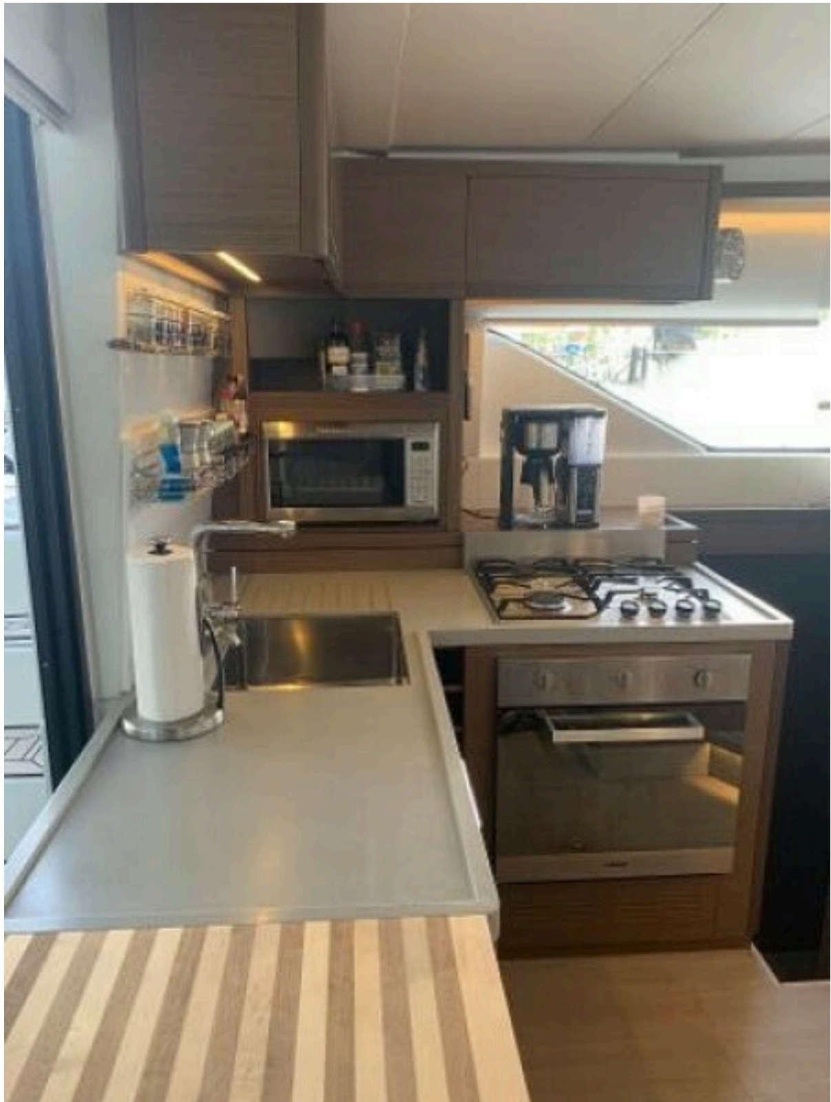
Used Sail Catamaran for sale 2019 Lagoon 50 - LIVE FREE