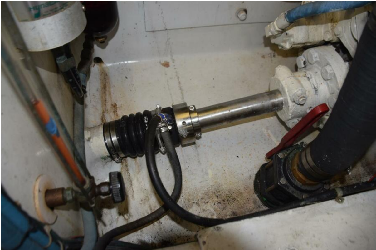
Dripless Shaft Logs