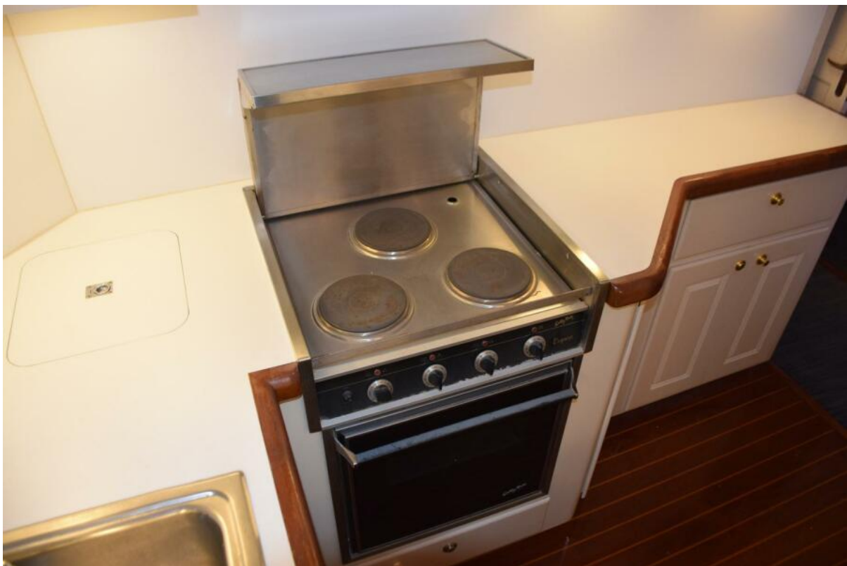
Stove And Oven