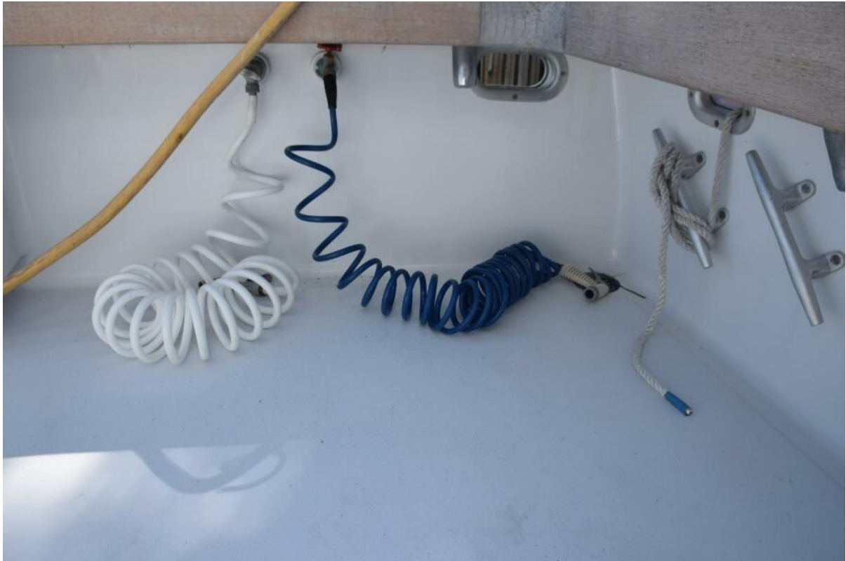
Cockpit Washdown Hoses