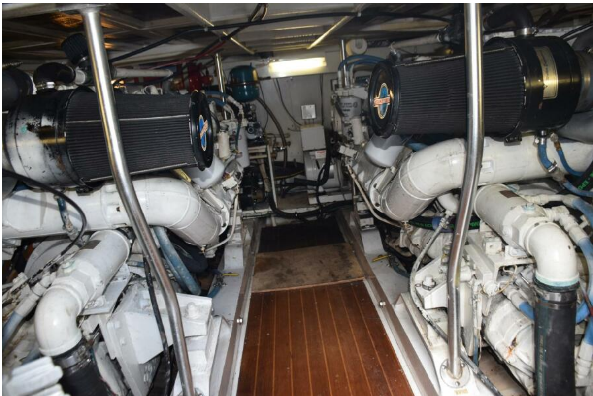
Engine Room, Detroit Diesel 8v92s