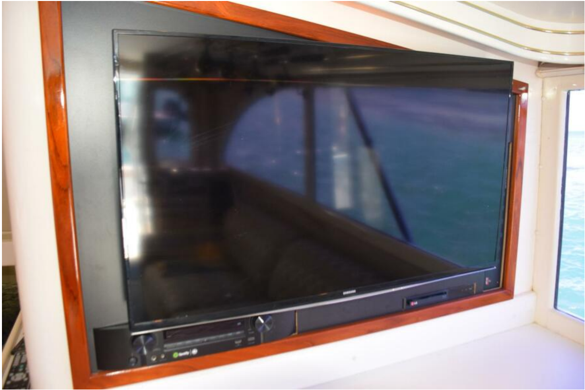
Flat Panel TV In Salon