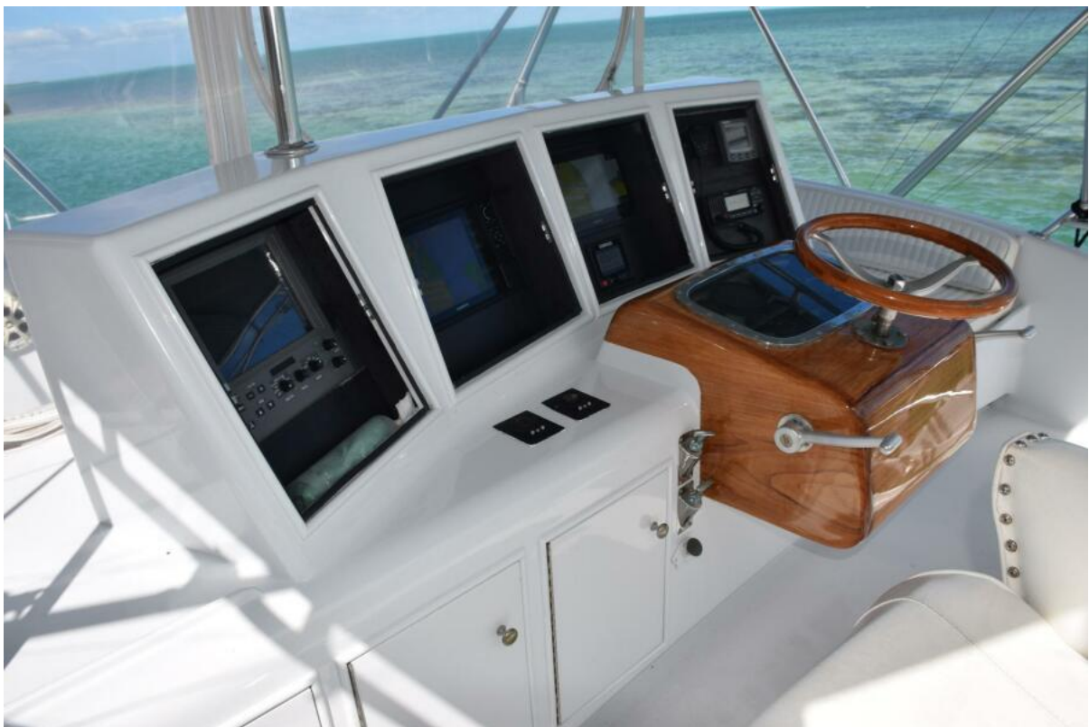
Teak Helm Pod With Teak Rim Wheel