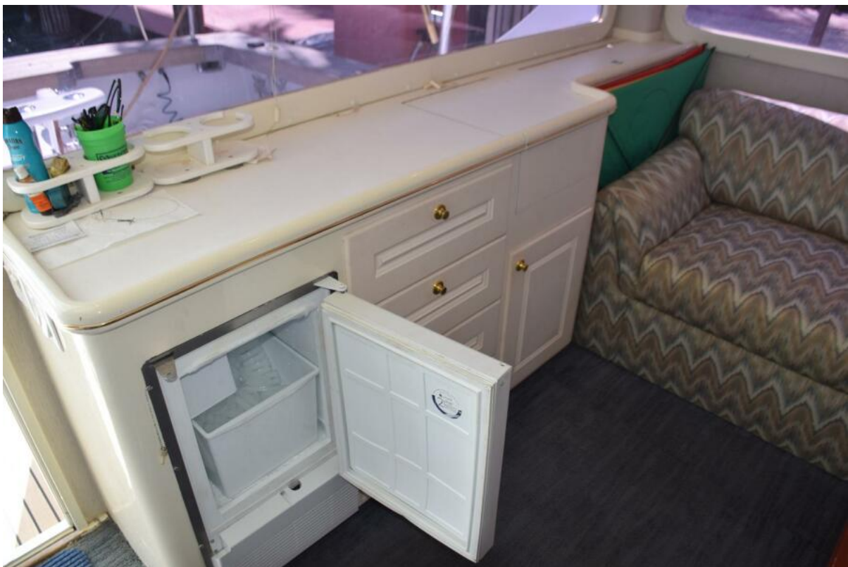
U-Line Icemaker In Aft Cabinet