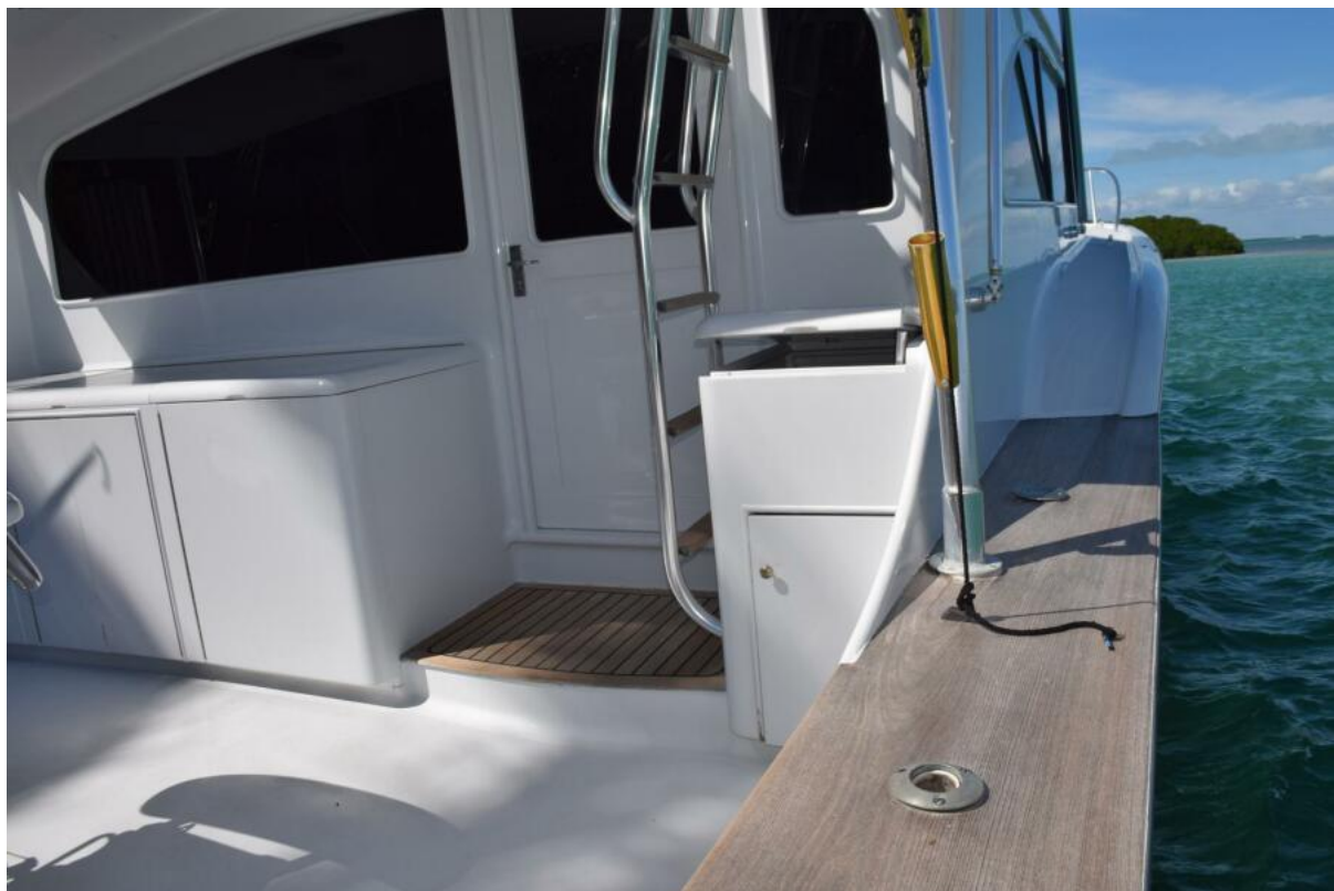
Cockpit And Side Deck