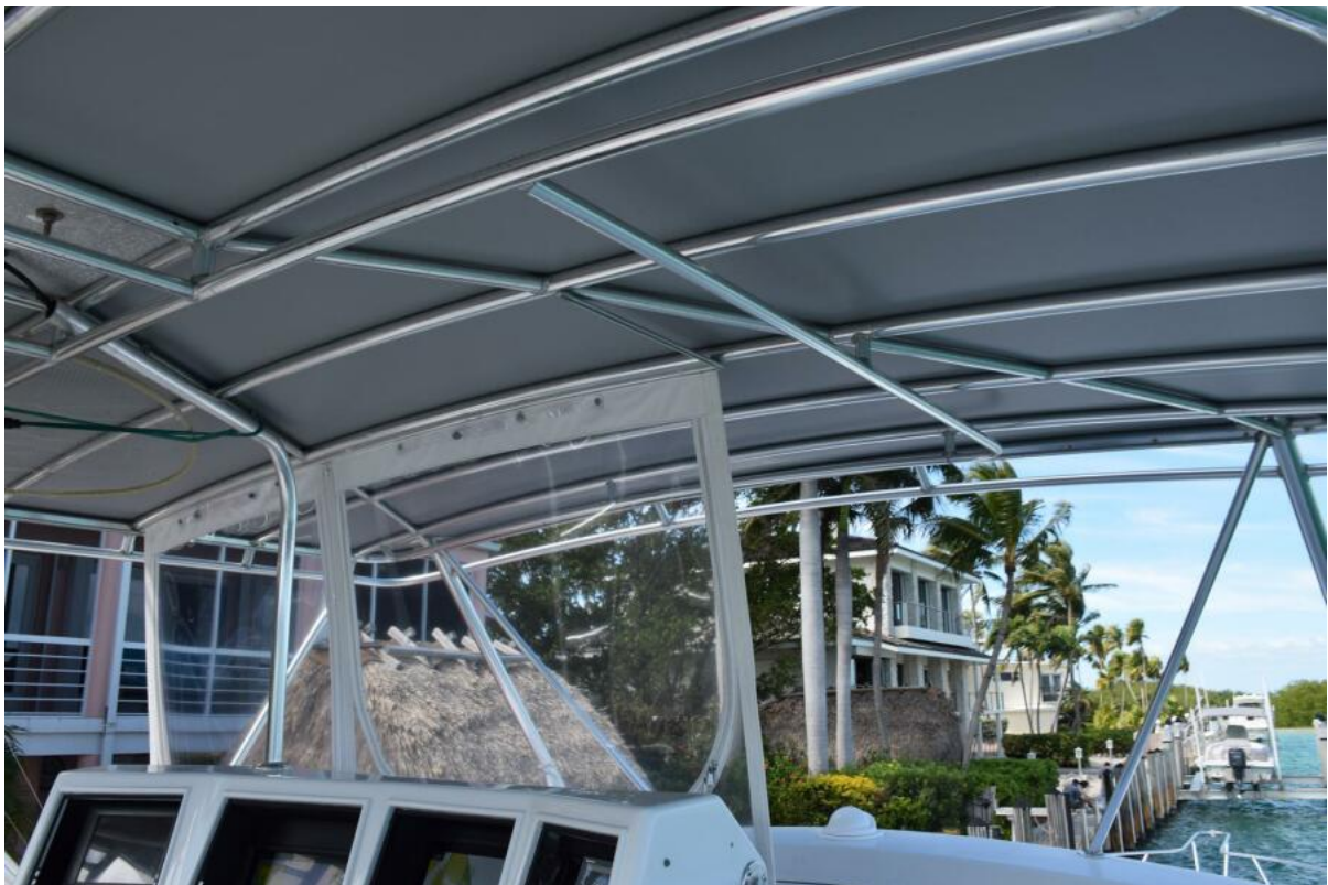
Canvas Tower Top Over Flybridge