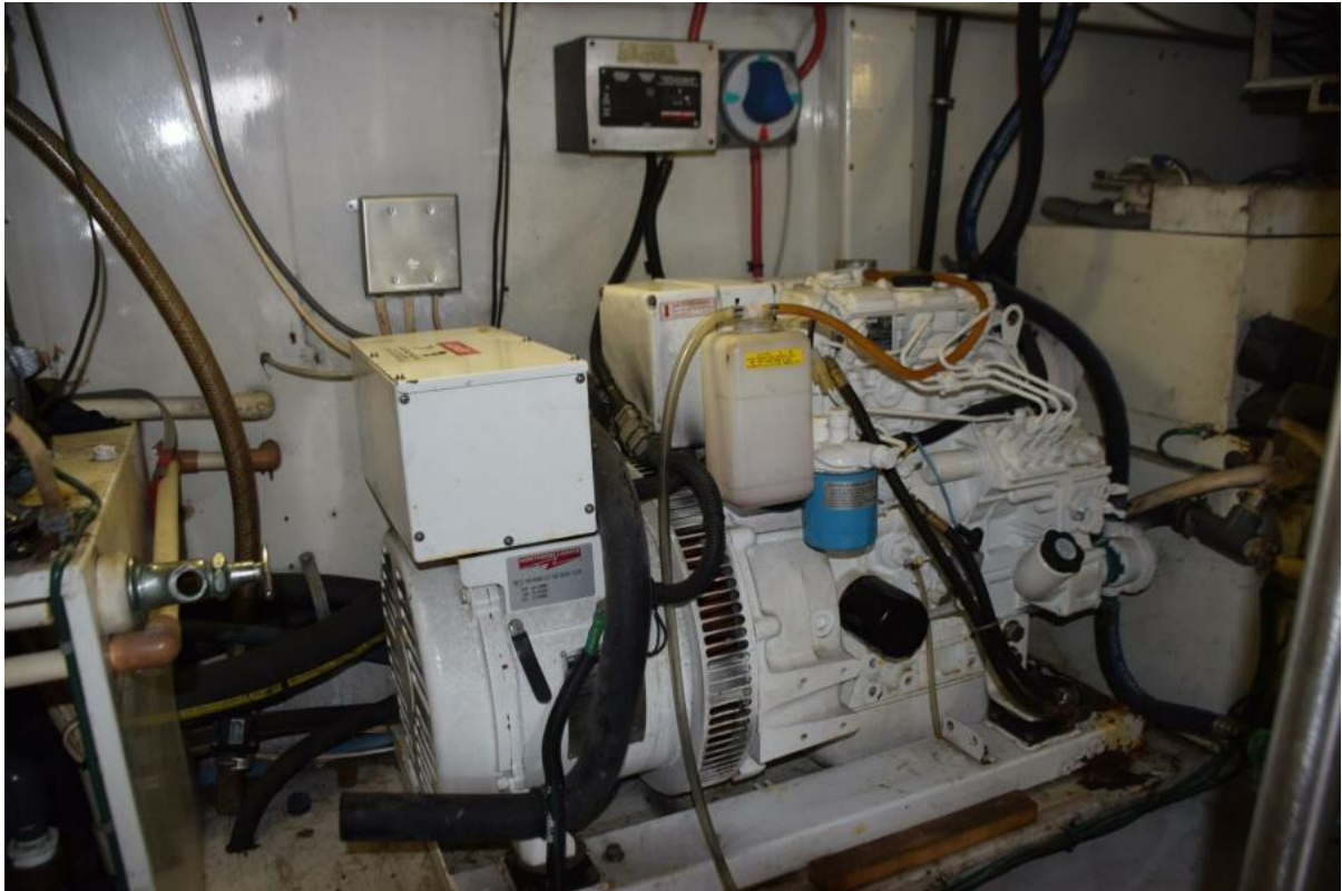
Newer Northern Lights Generator