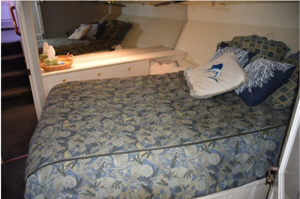
Athwartships Berth In Master Stateroom Forward