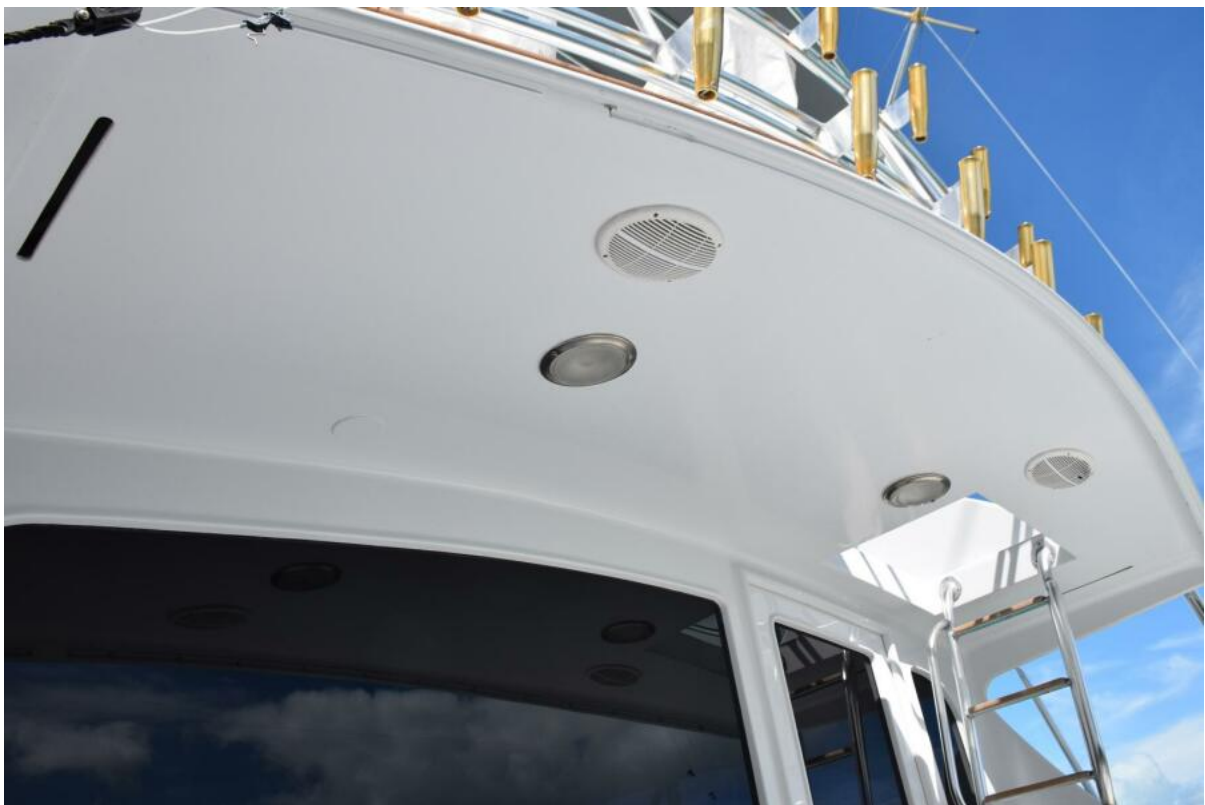
Large Overhang With Speakers And Lighting