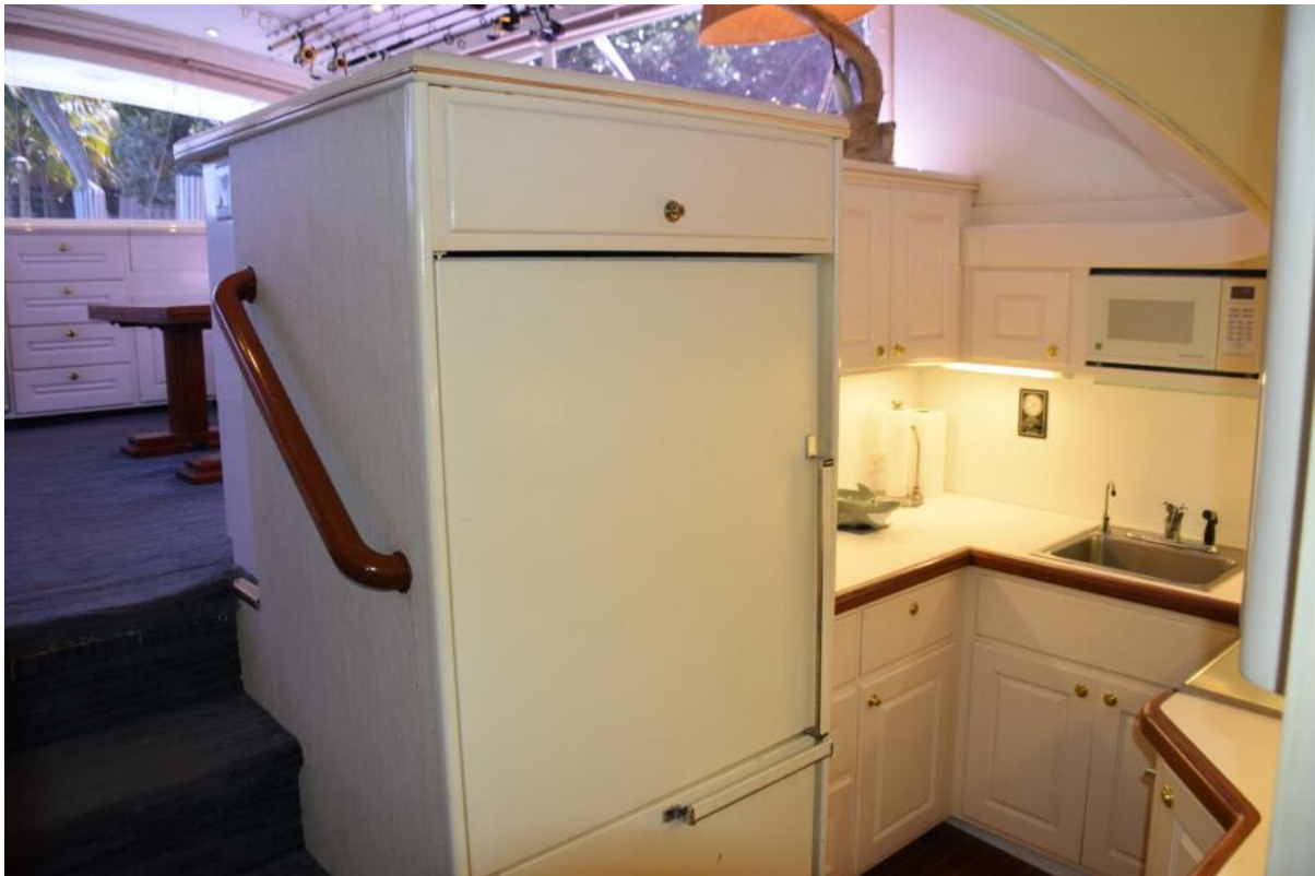
Steps Down To Galley