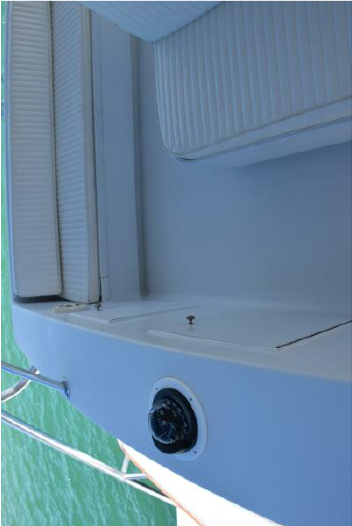
Flybridge Passenger Seating