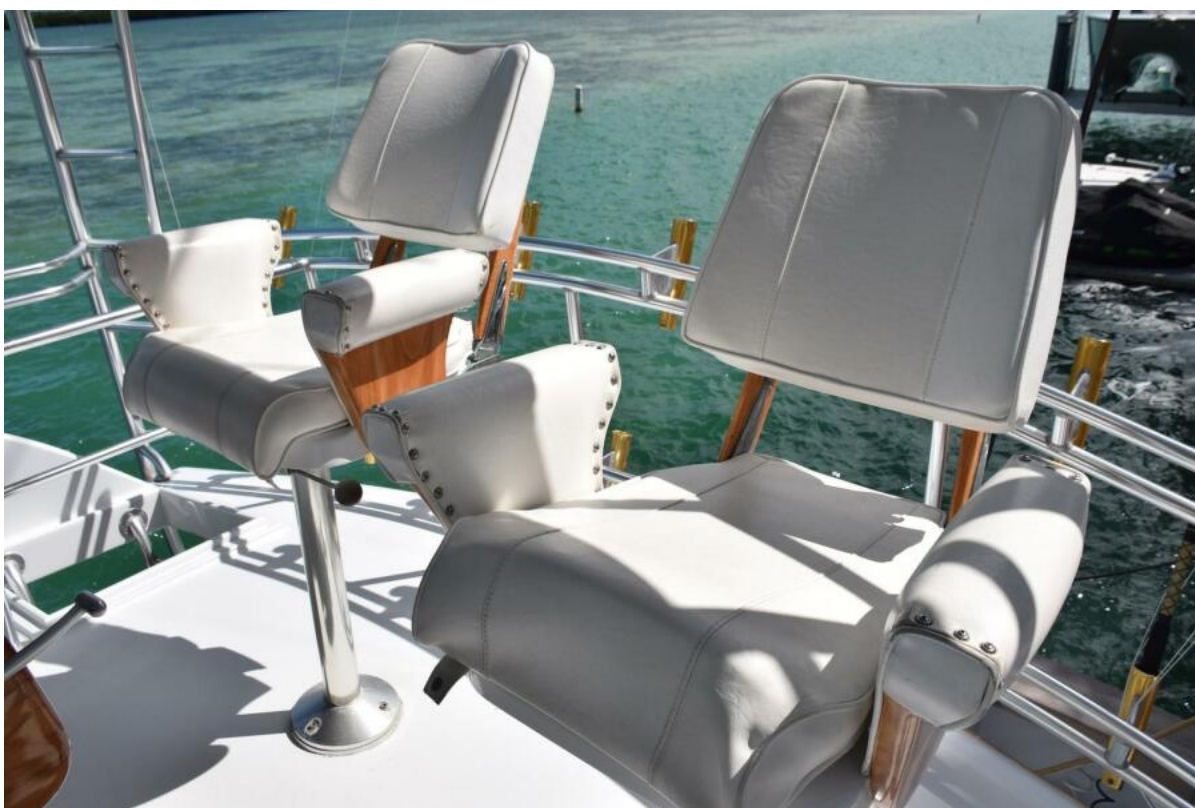
Helm And Companion Chairs