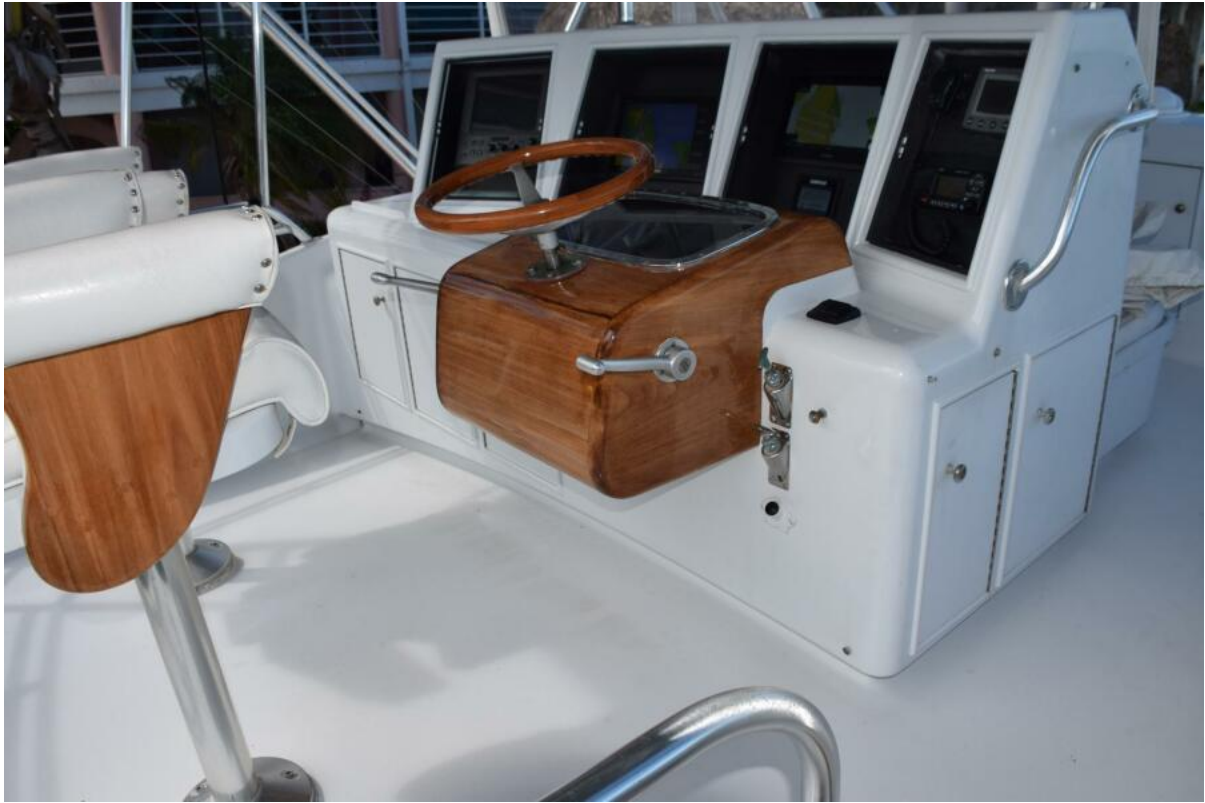
Helm Console With Safety Railings