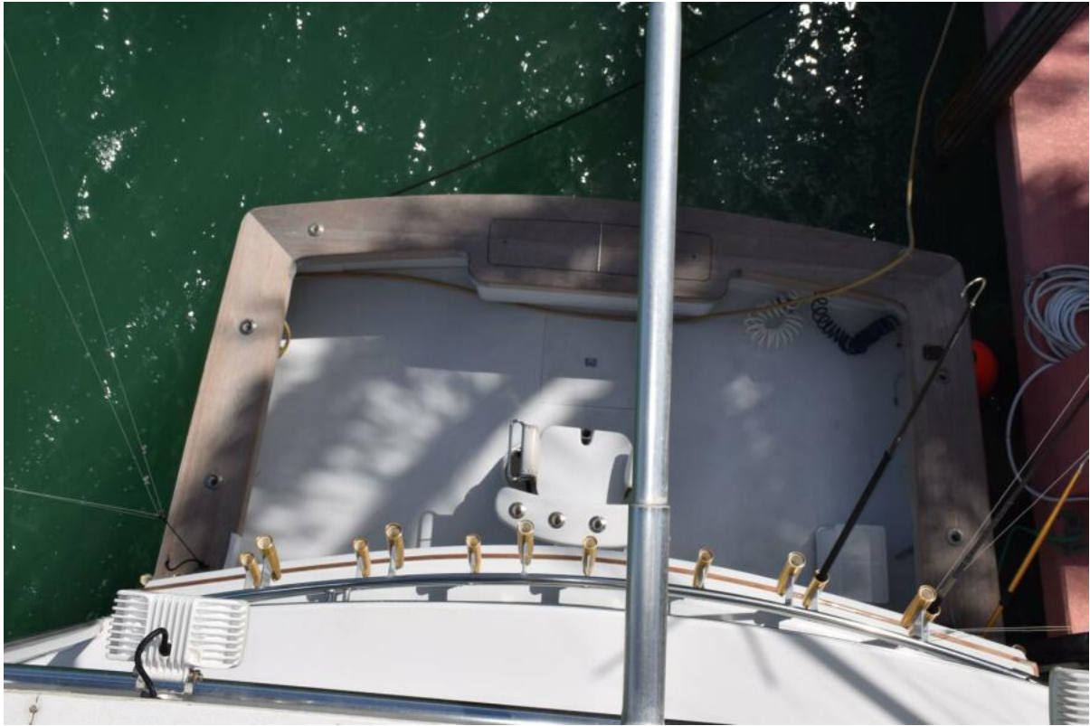
Cockpit View From Tower