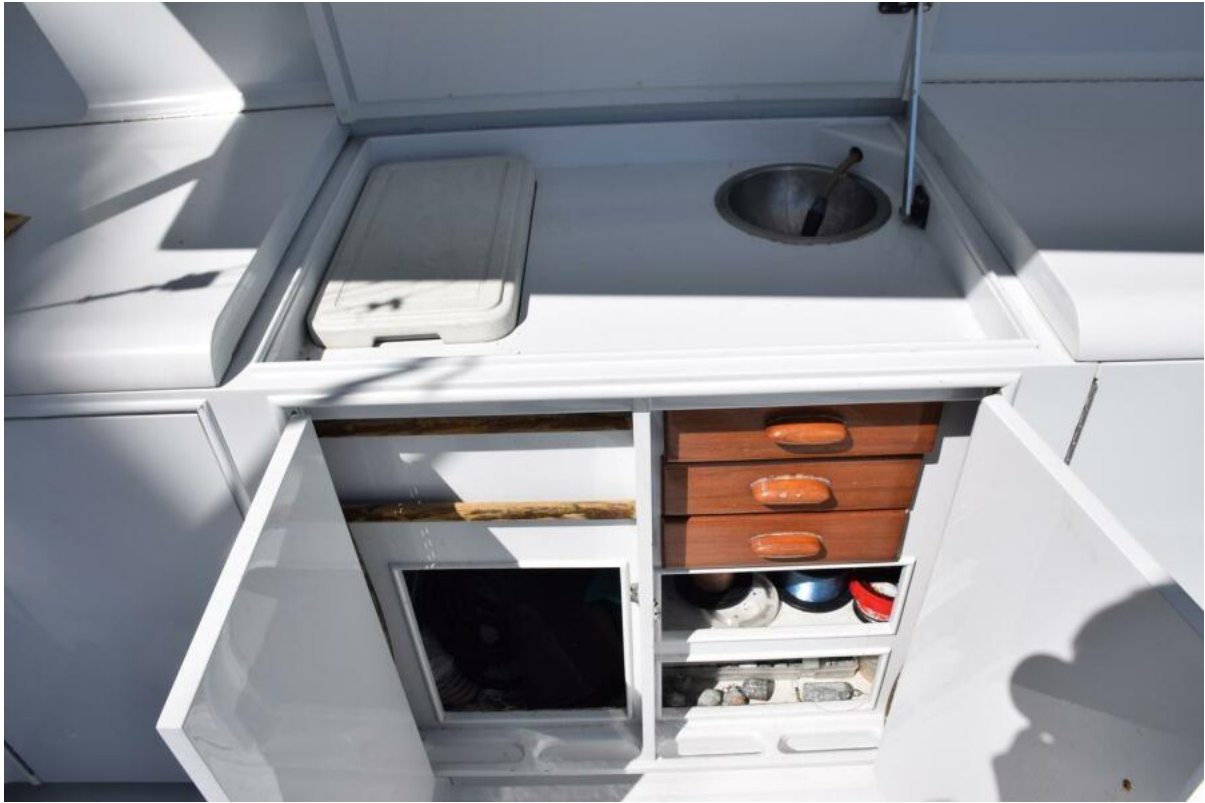
Cockpit Tackle Center With Sink And Cooler