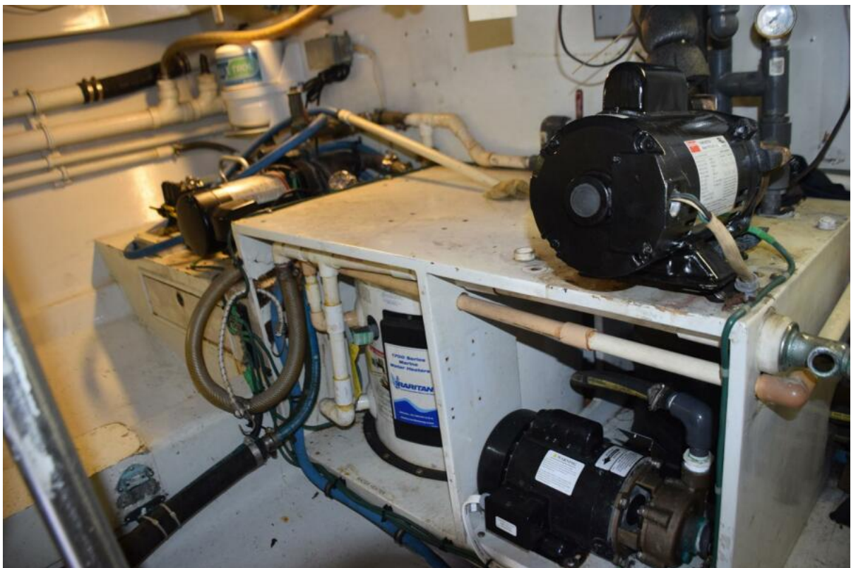
Forward Engine Room