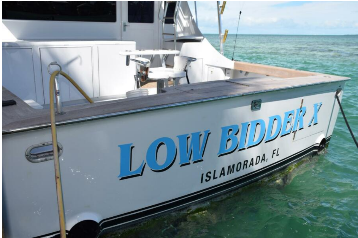
Transom, Wide Beam