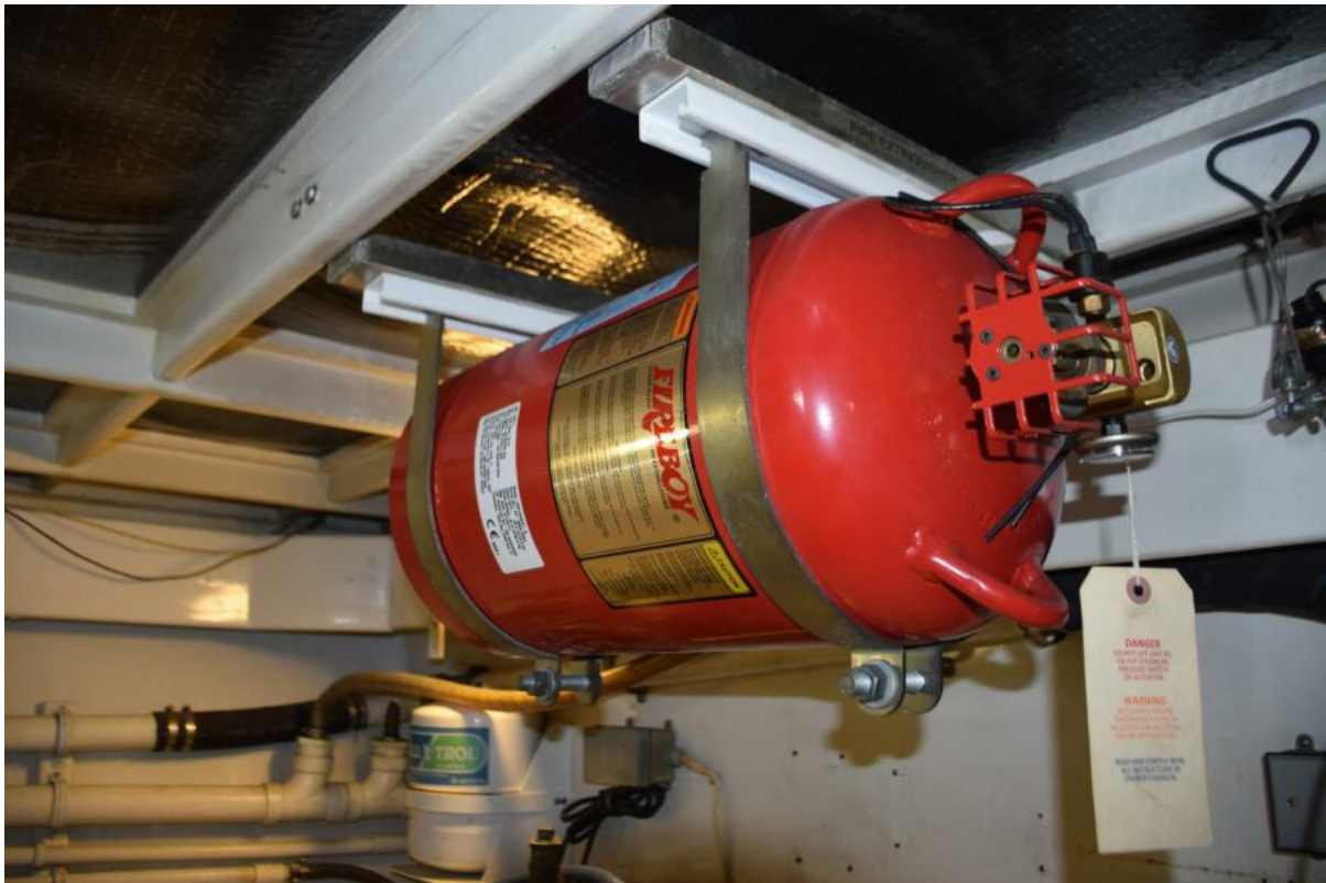
Engine Room Fire Suppression System