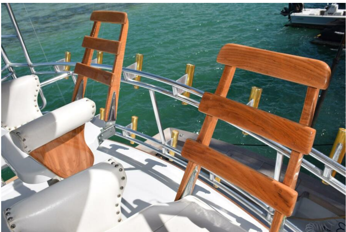
Teak Ladderback Helm Chairs