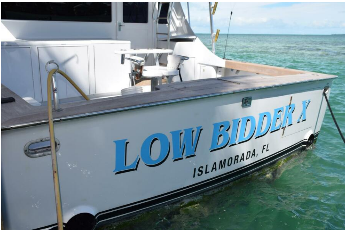
Transom, Wide Beam