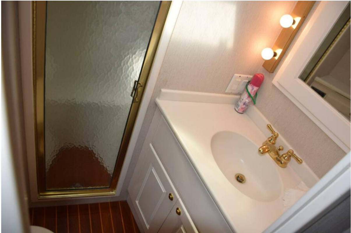
Master Stateroom Vanity With Shower In Peak