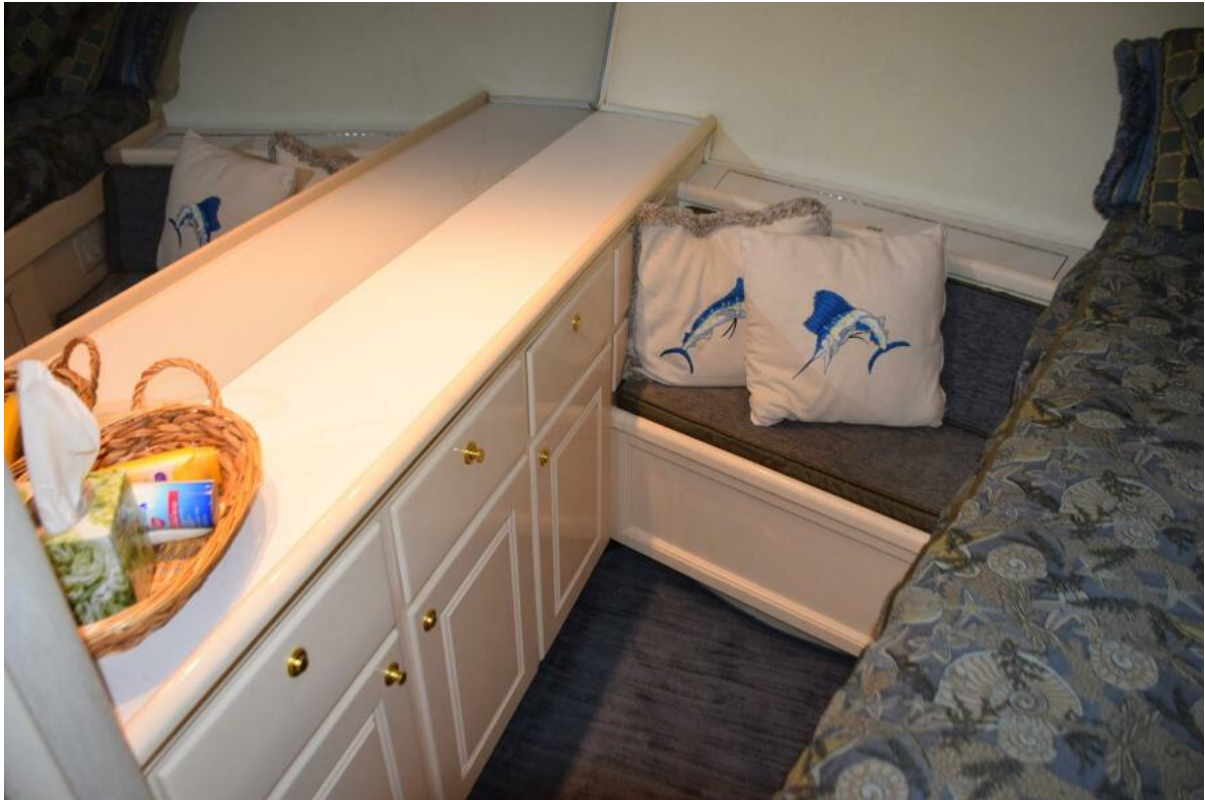
Aft Dresser Cabinet With Mirror Above