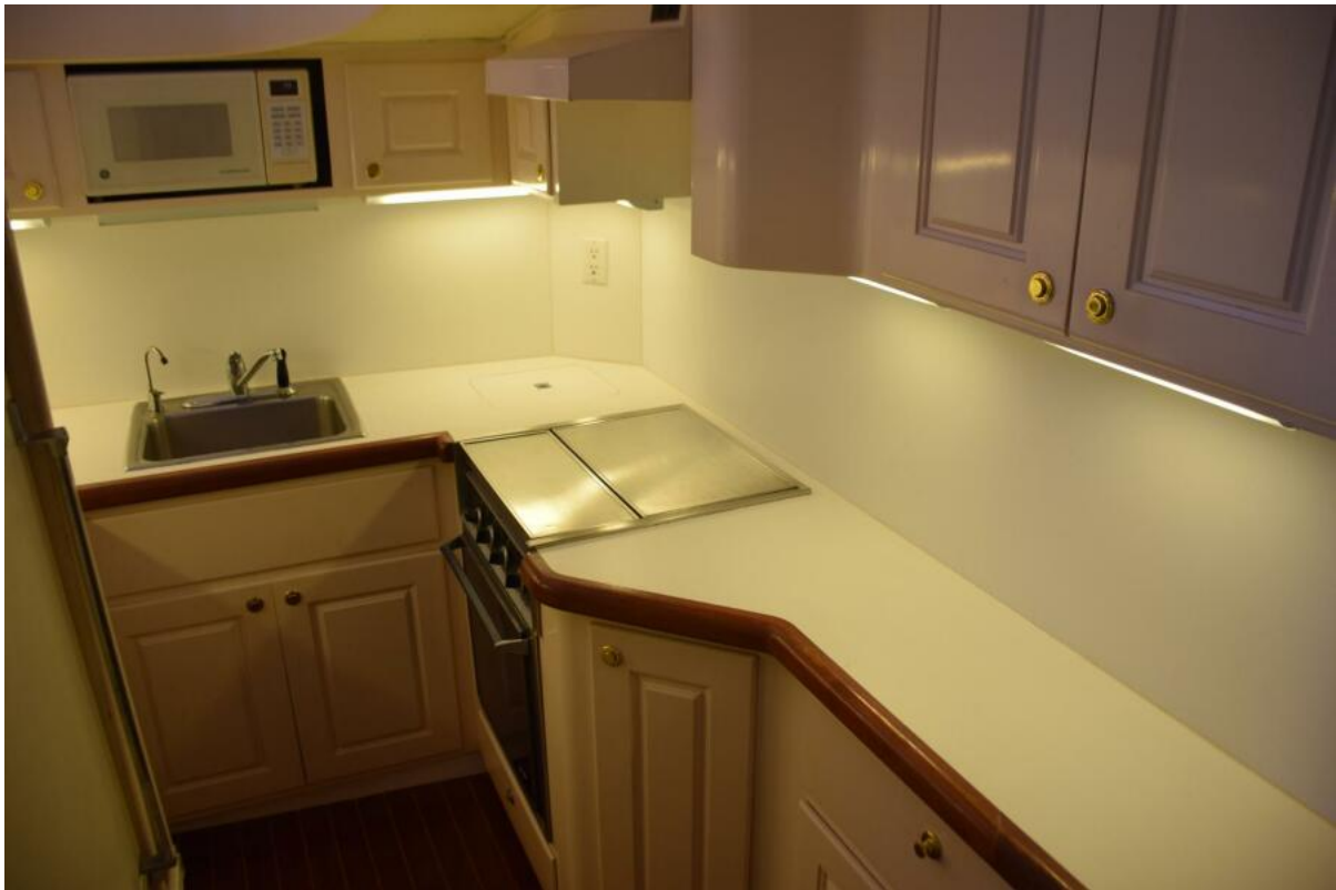
Lots Of Counterspace