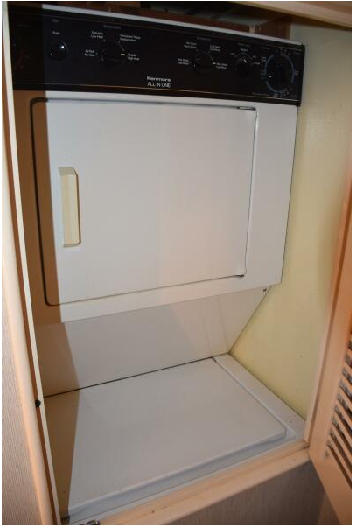
Washer And Dryer