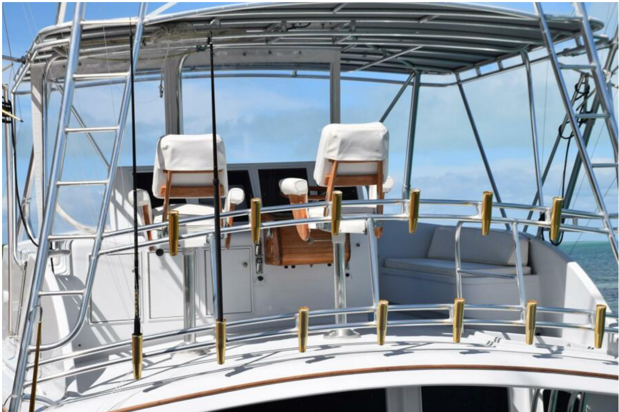
Flybridge With Rod Storage On Aft Railings