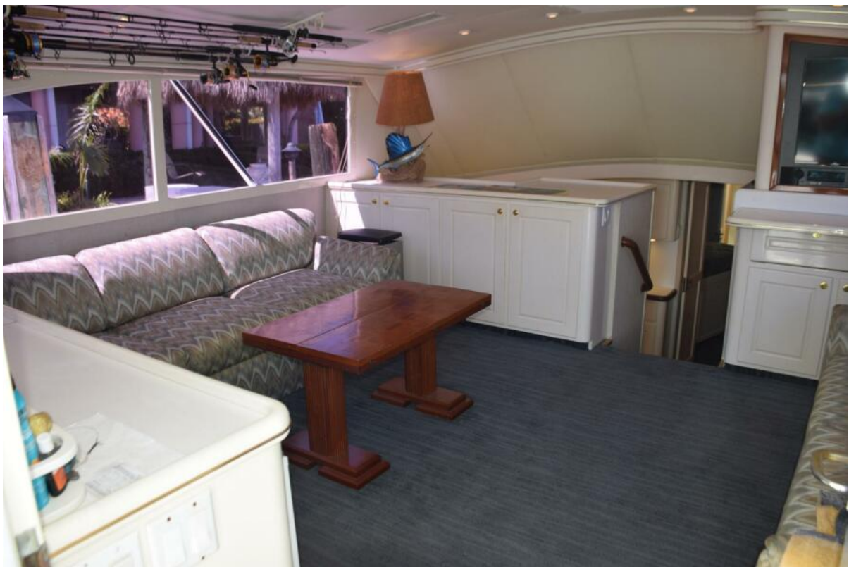
White Painted Wood Cabinetry