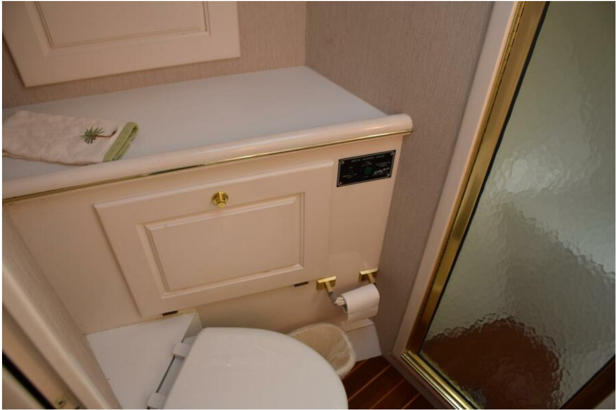
Guest Head And Shower Stall