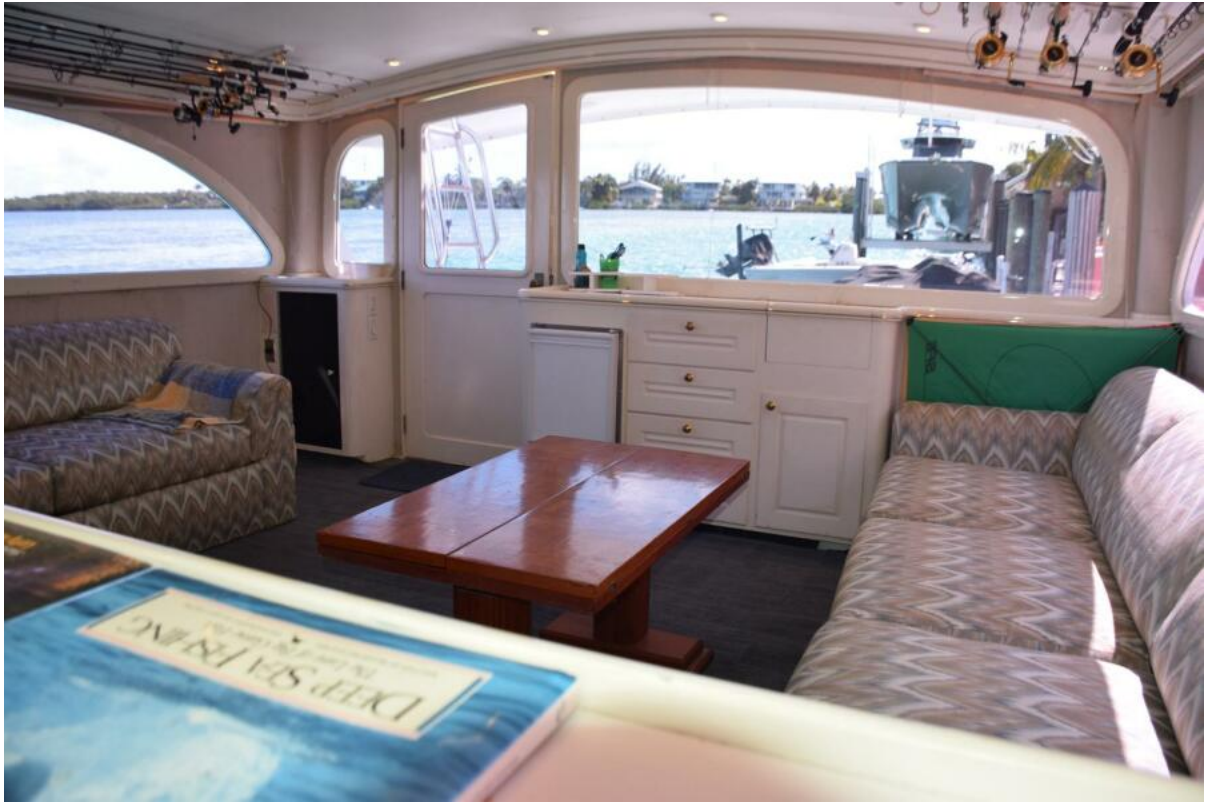
Newer Comfortable Sofas