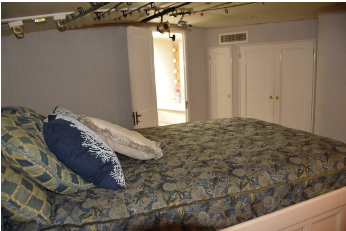
Master Head Forward With Closets On Starboard Side