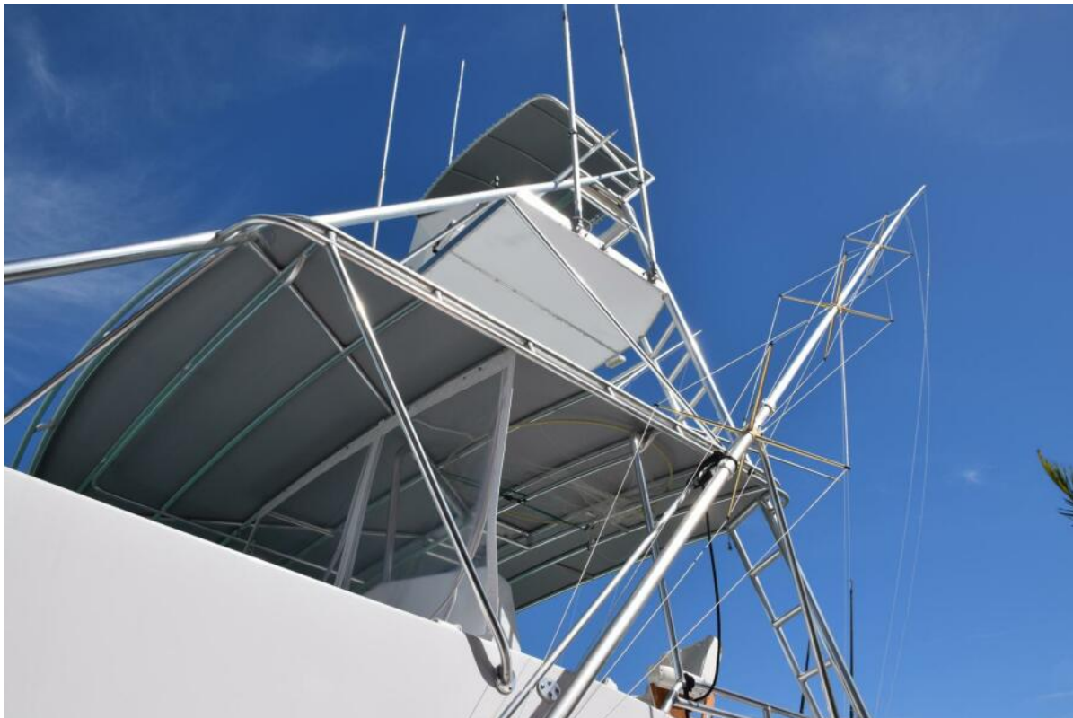
Tower With Triple Spreader Outriggers