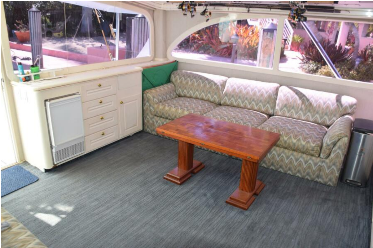
Salon Table Has Opening Leaves For Dining