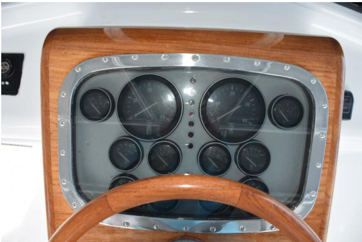
Helm Pod With Chrome Bezel And Gauges