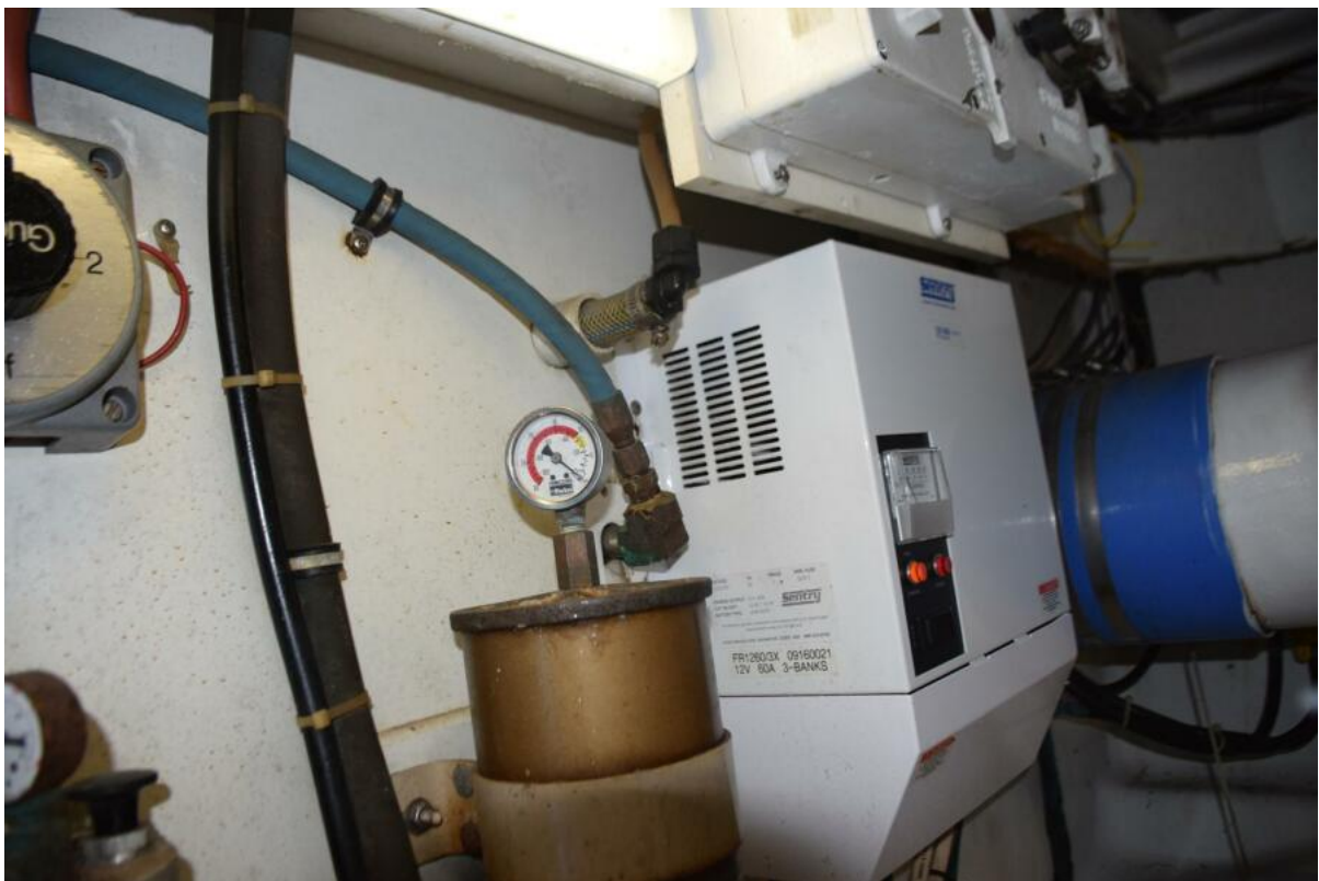
Aft Engine Room