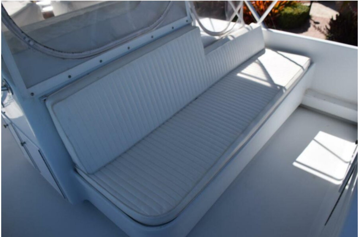
Flybridge Forward Lounge