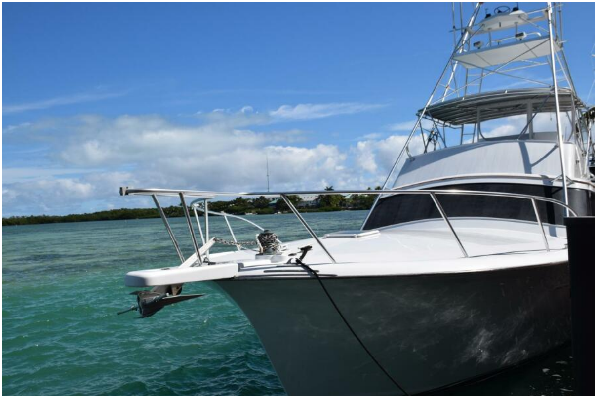
Bow Rail With Pulpit And Windlass