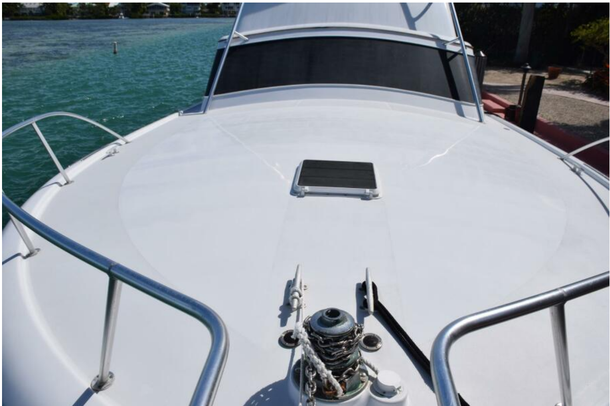
Carolina Crowned Foredeck