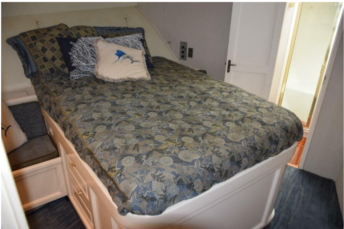
Walkaround Queen Berth With Changing Seats On Either Side Of Berth