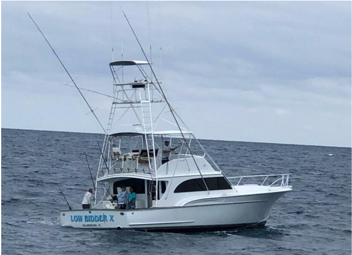
LOW BIDDER X