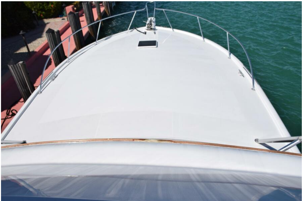
Foredeck View From Flybridge