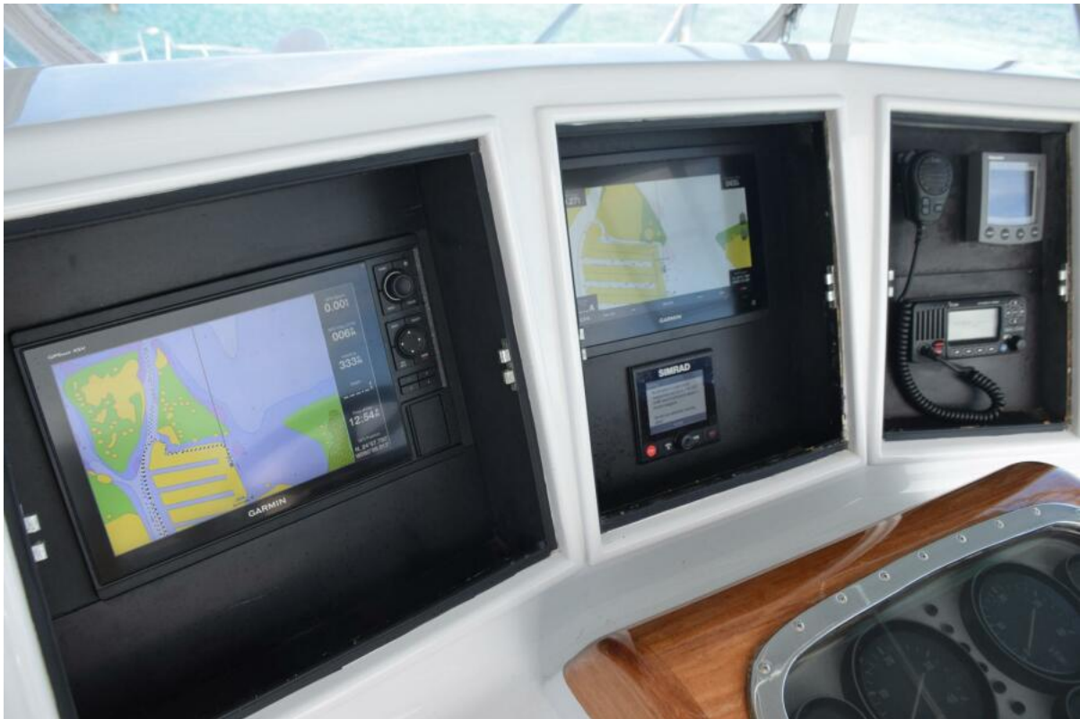
Garmin MFDs And Simrad AP