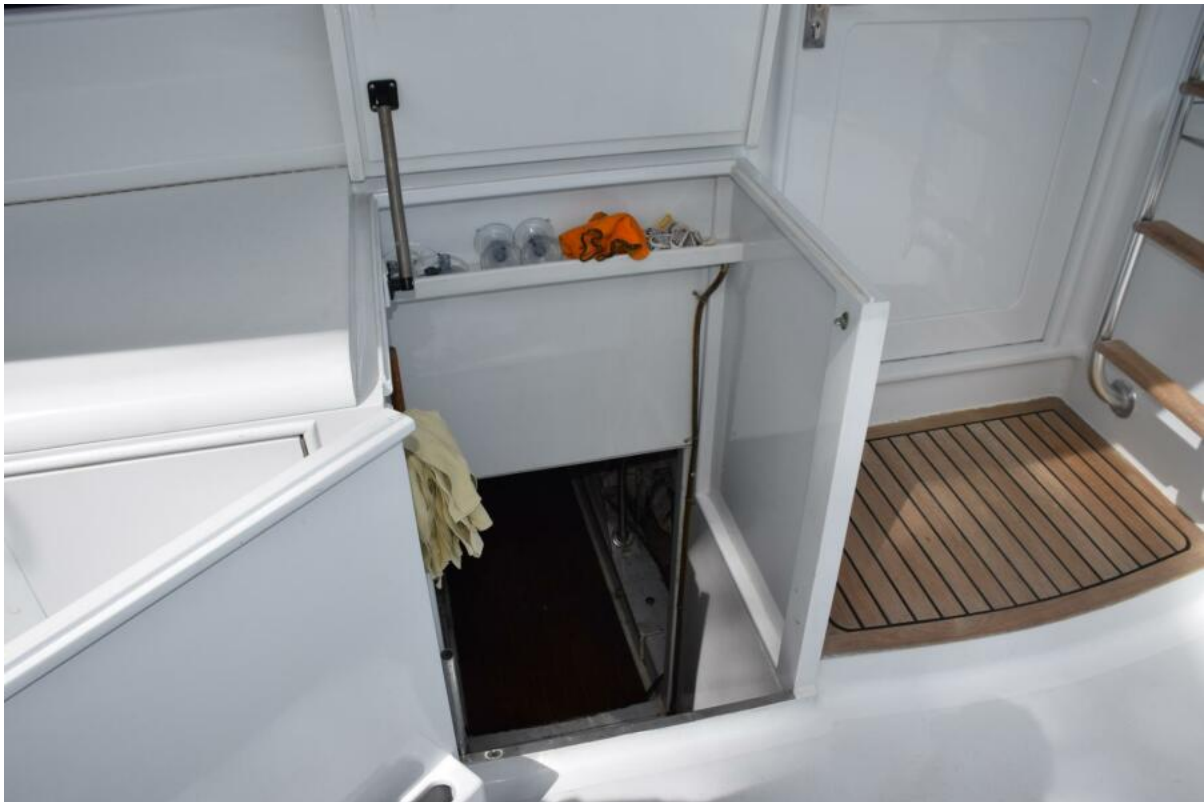
Engine Room Entrance