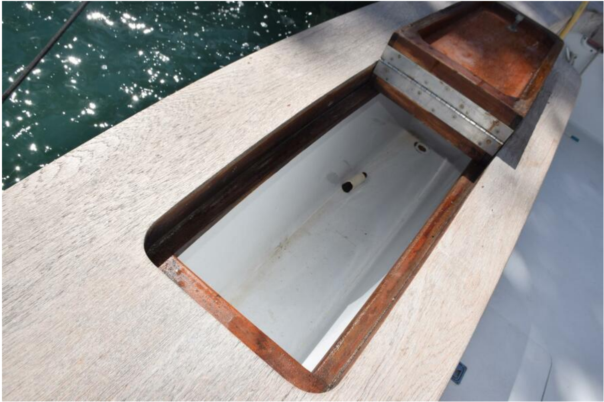
Transom Livewell Or Fishbox