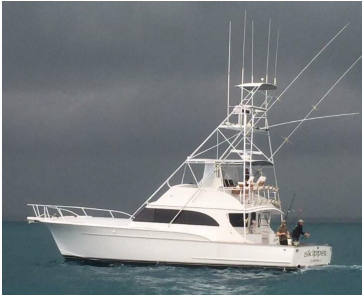
LOW BIDDER X