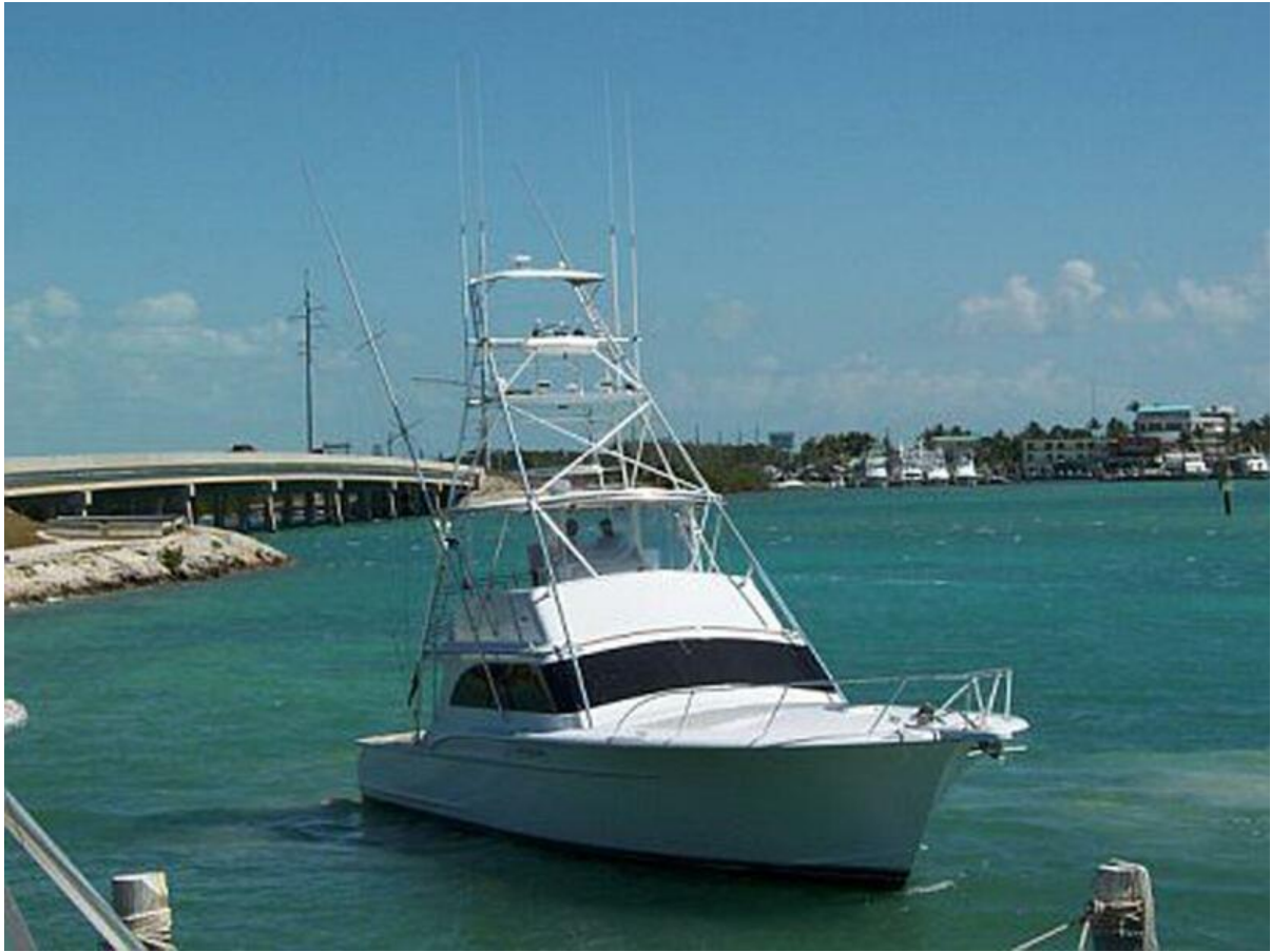
Off The Dock