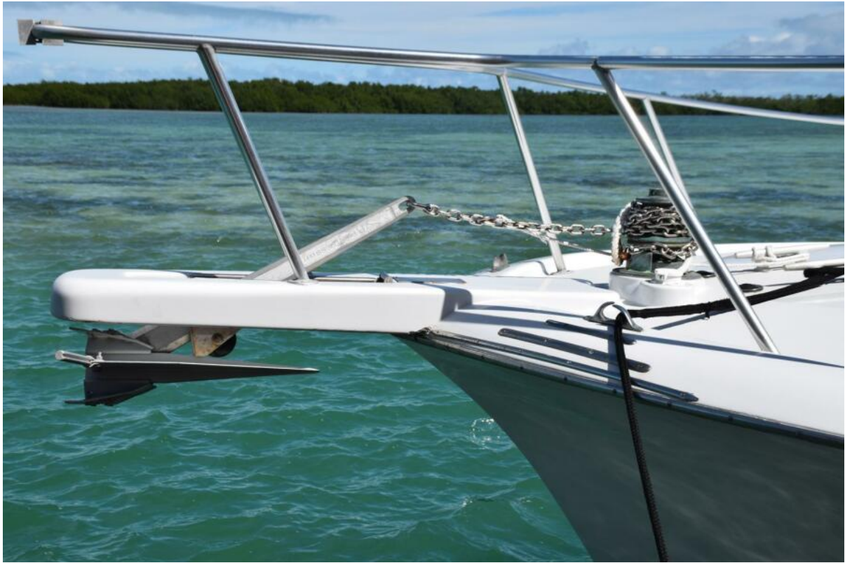
Pulpit, Windlass, And Ground Tackle