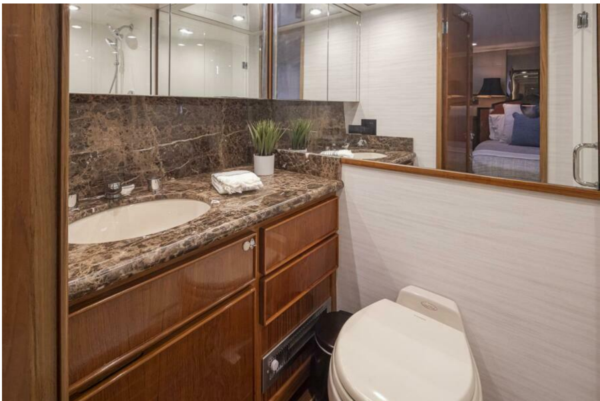
VIP Stateroom Head