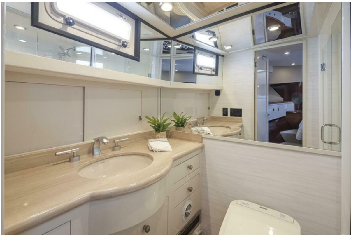
Owner's Stateroom Head