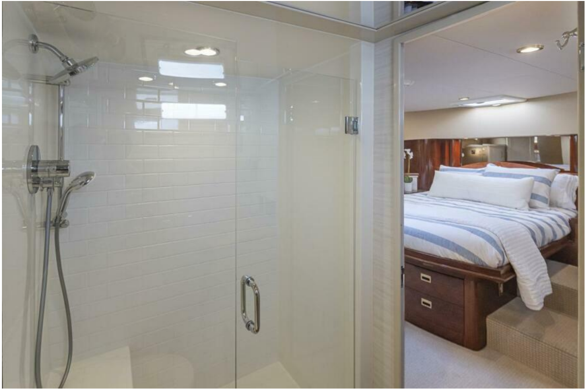
Owner's Stateroom Head