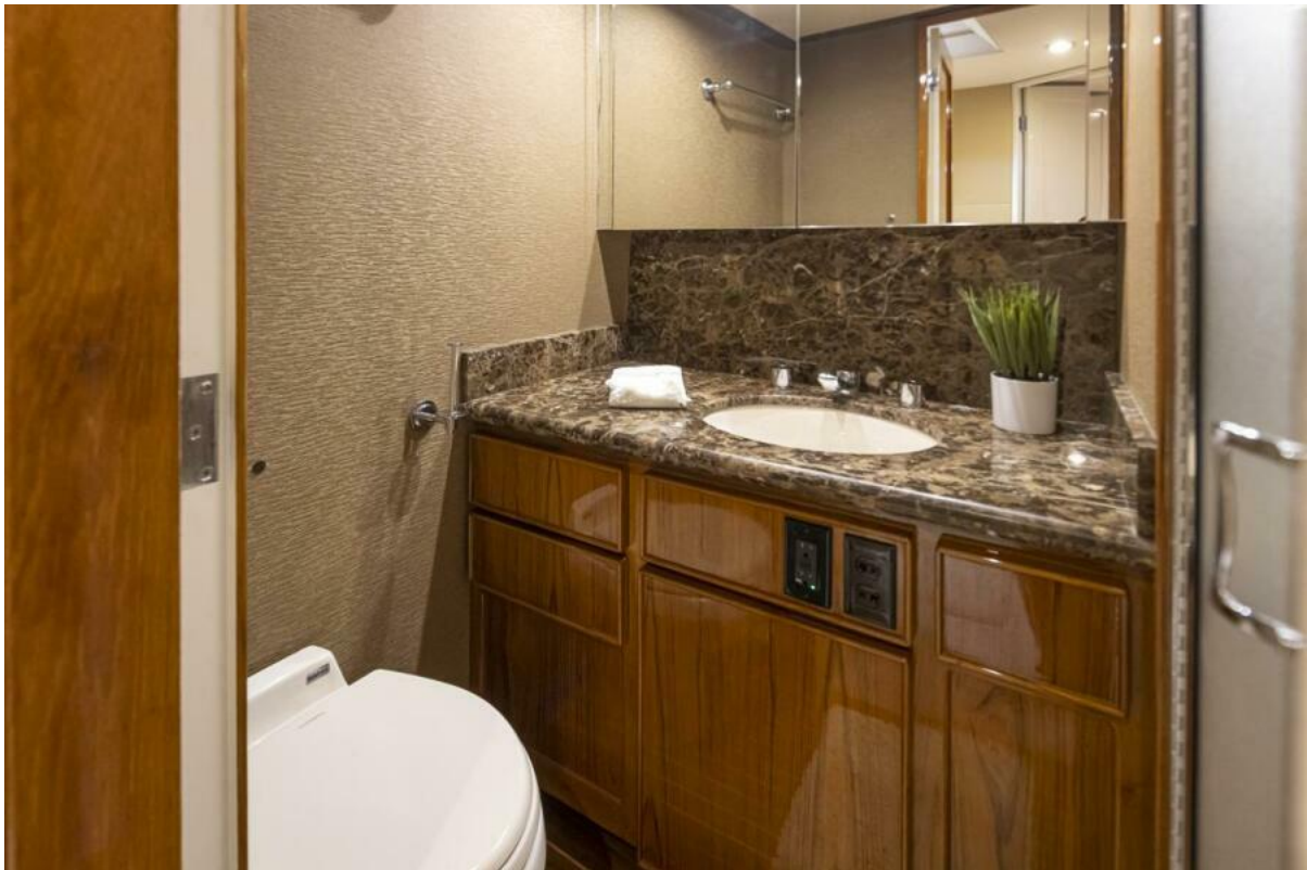
VIP Stateroom Head