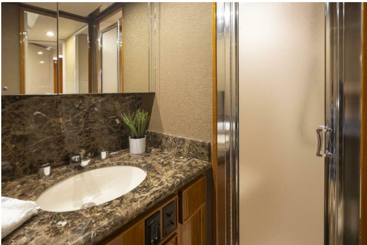
VIP Stateroom Head