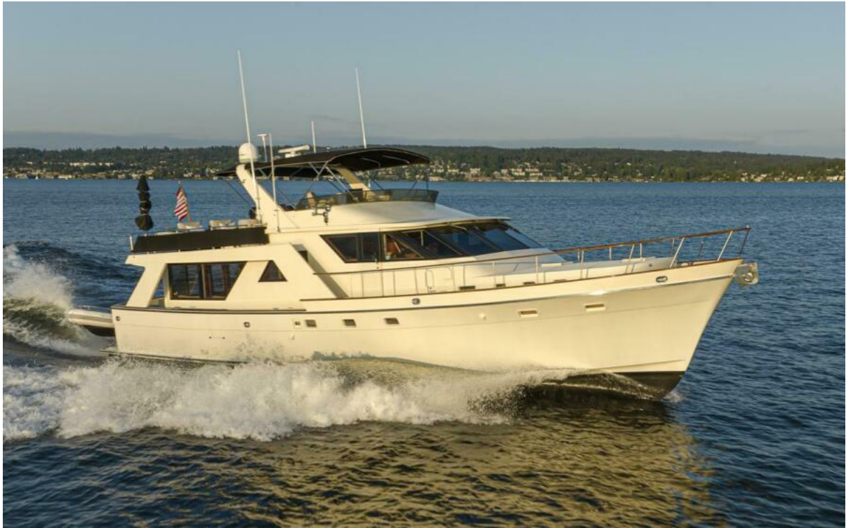
MARGENE, 63' (19.20m) Nordlund 1984/2022