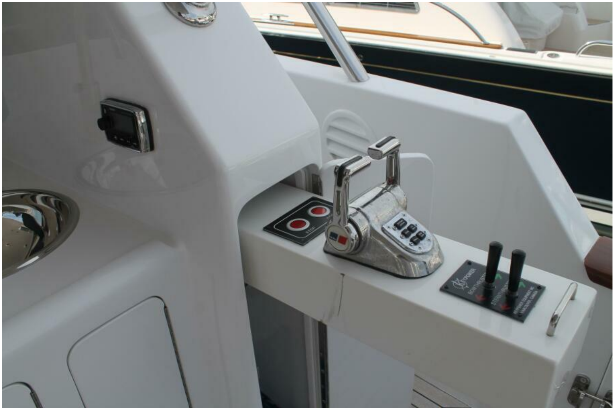
Aft deck station