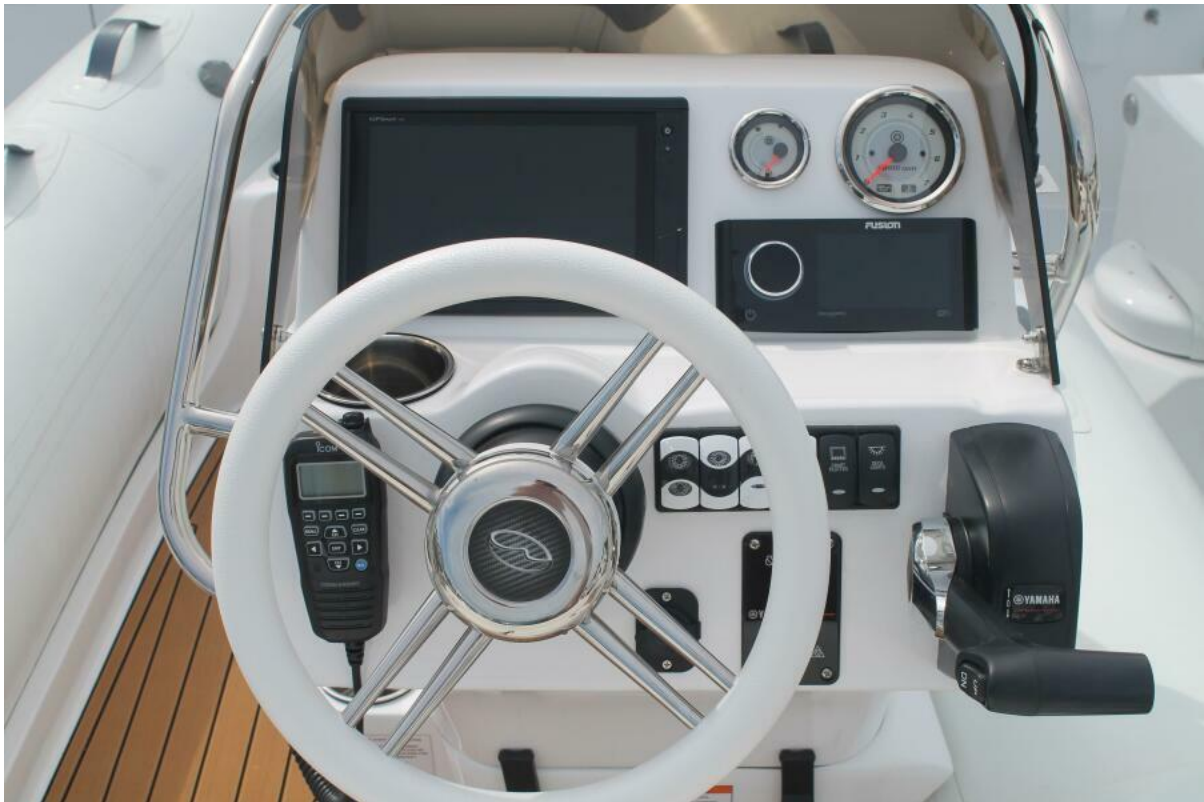
2023 Walker Bay helm