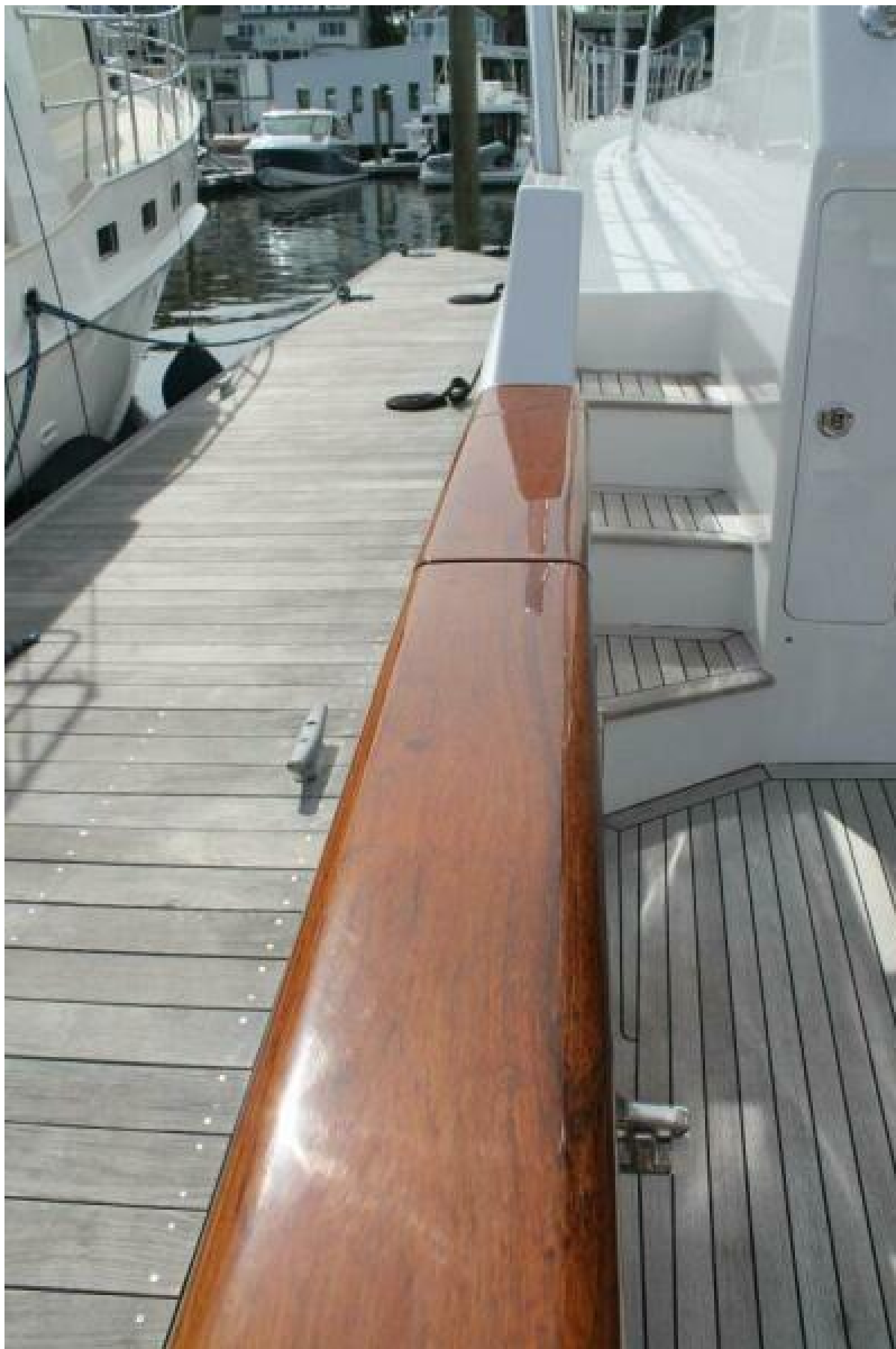
Aft deck cap rail