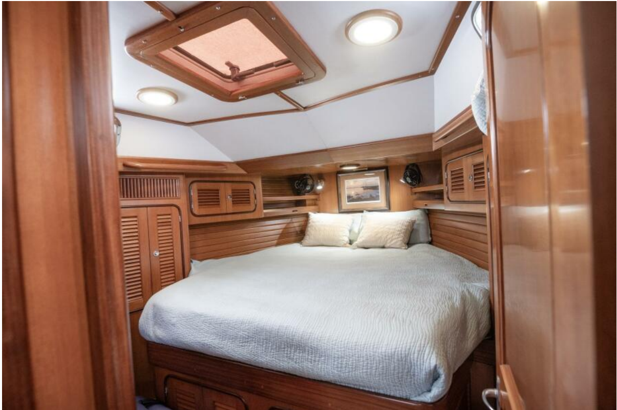
Passport Vista 515 For Sale010