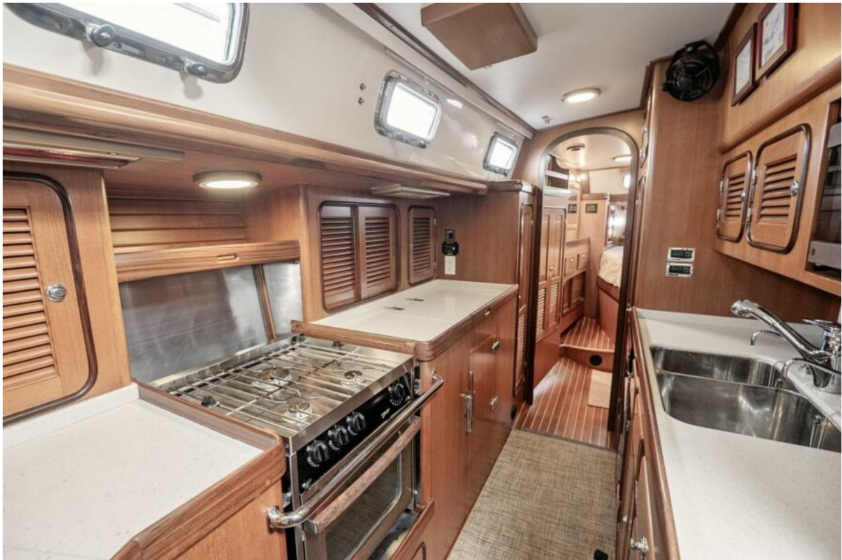
Passport Vista 515 For Sale002