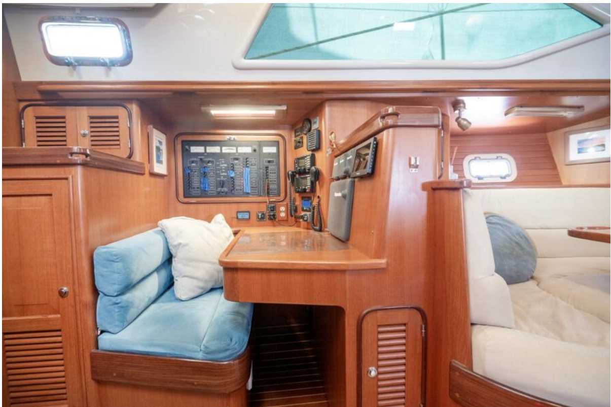
Passport Vista 515 For Sale009