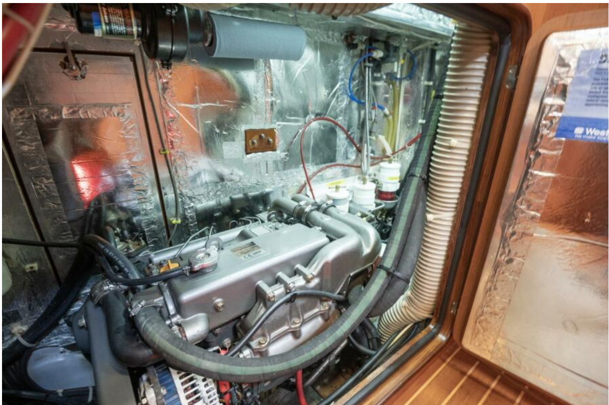
Passport Vista 515 For Sale013