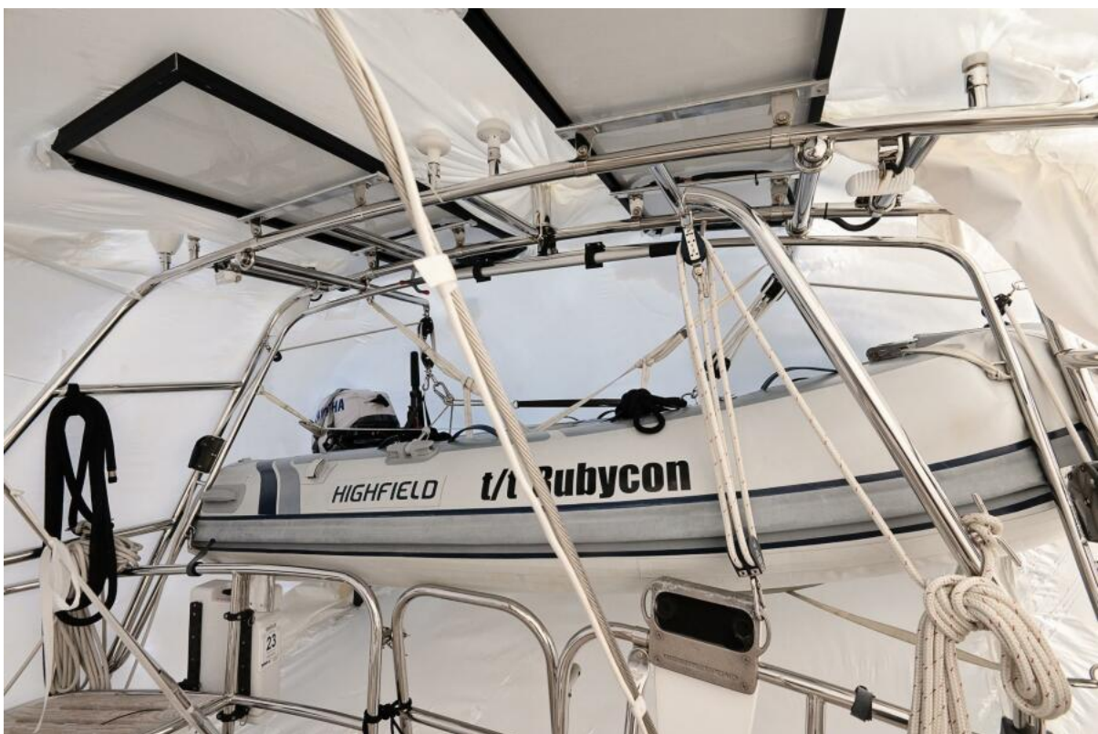
Passport Vista 515 For Sale018