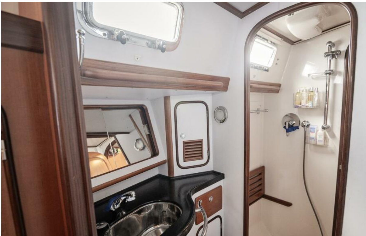
Passport Vista 515 For Sale007