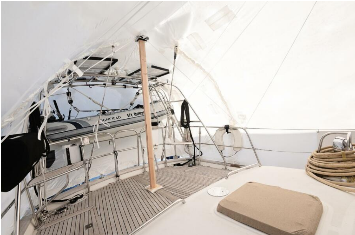
Passport Vista 515 For Sale017