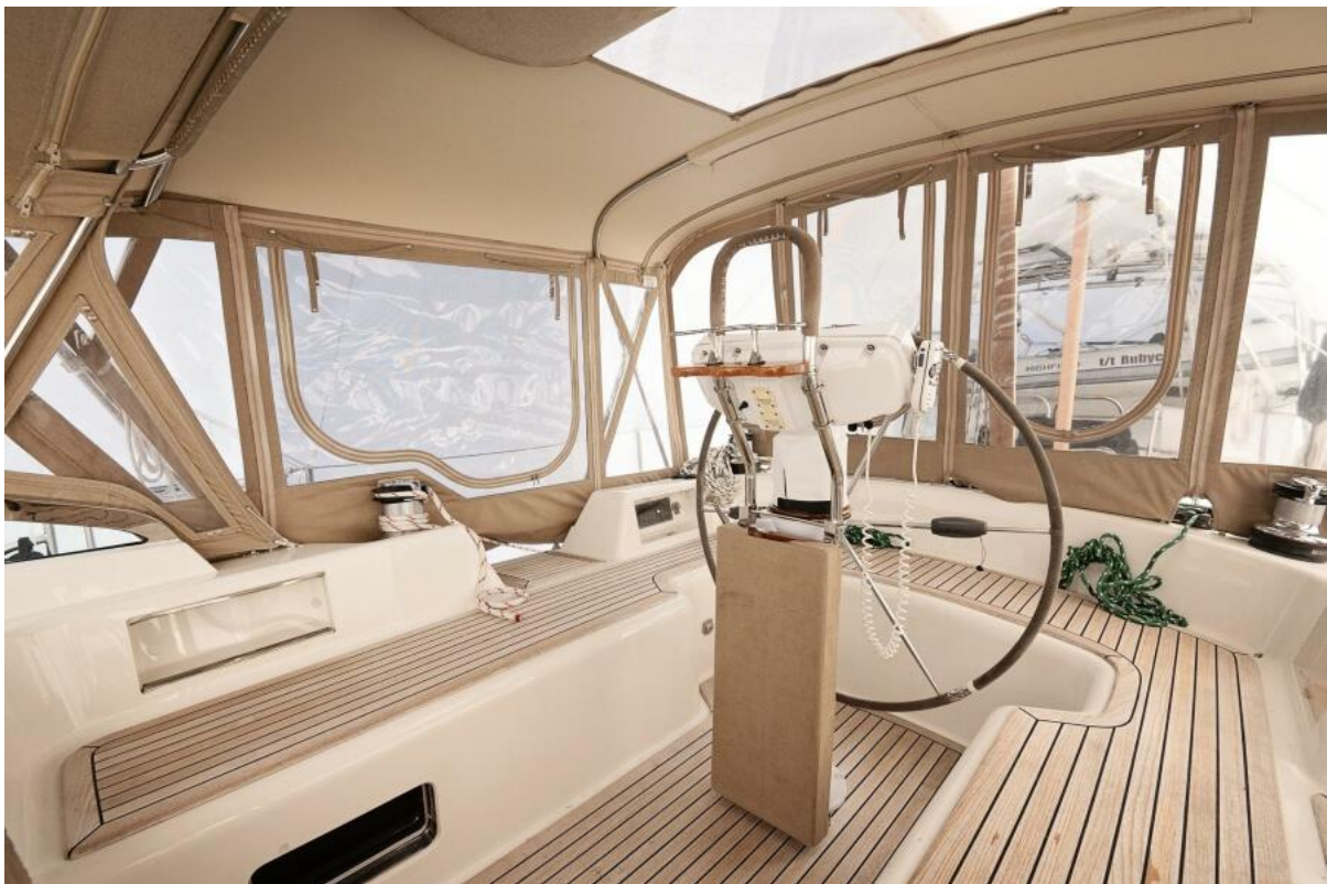
Passport Vista 515 For Sale020