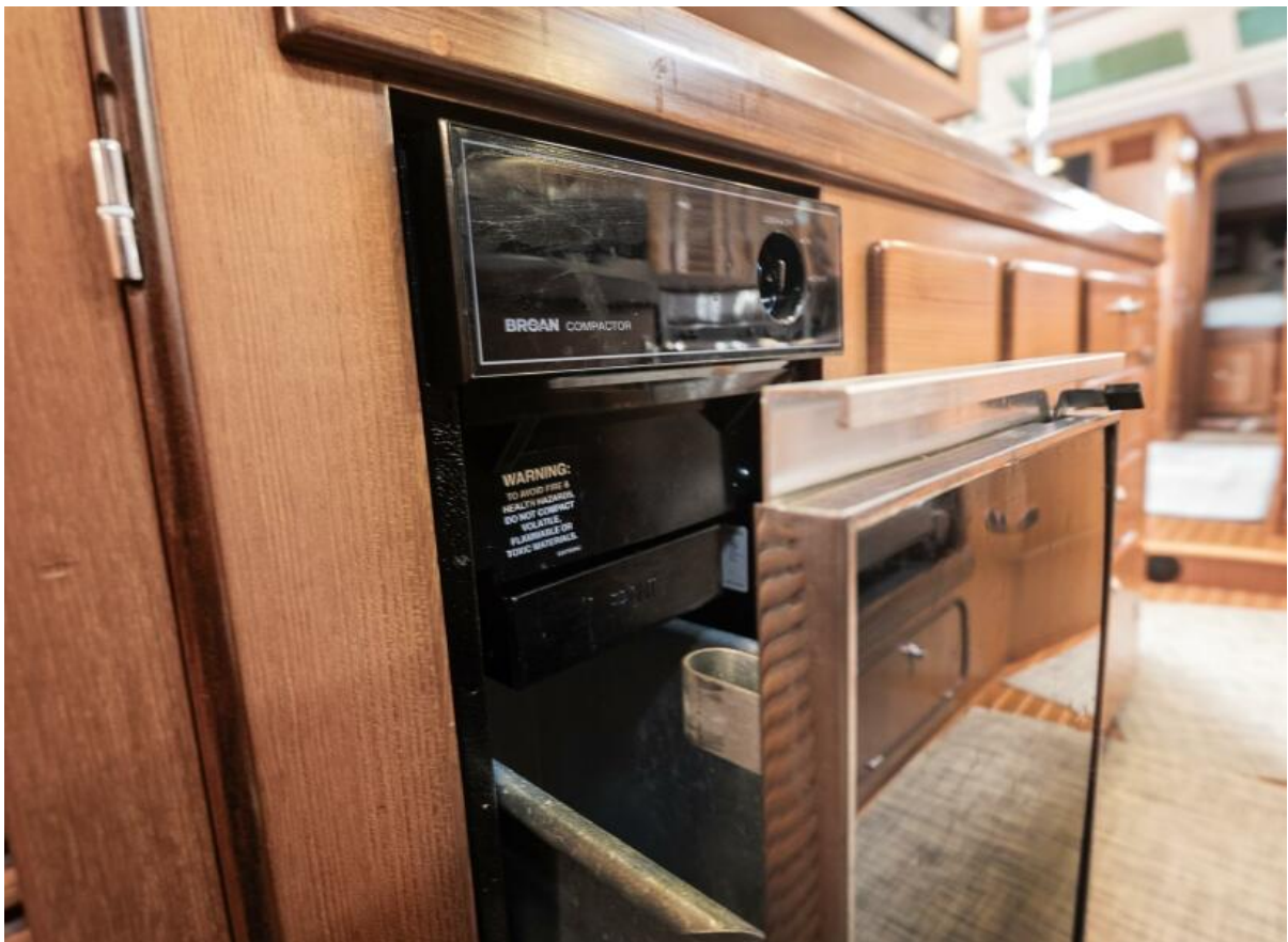
Passport Vista 515 For Sale004