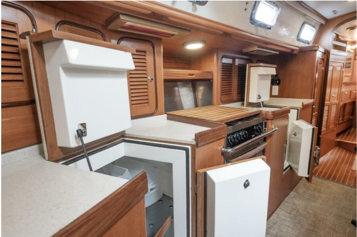
Passport Vista 515 For Sale003