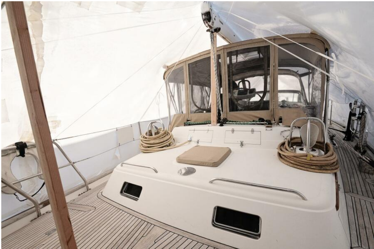
Passport Vista 515 For Sale019