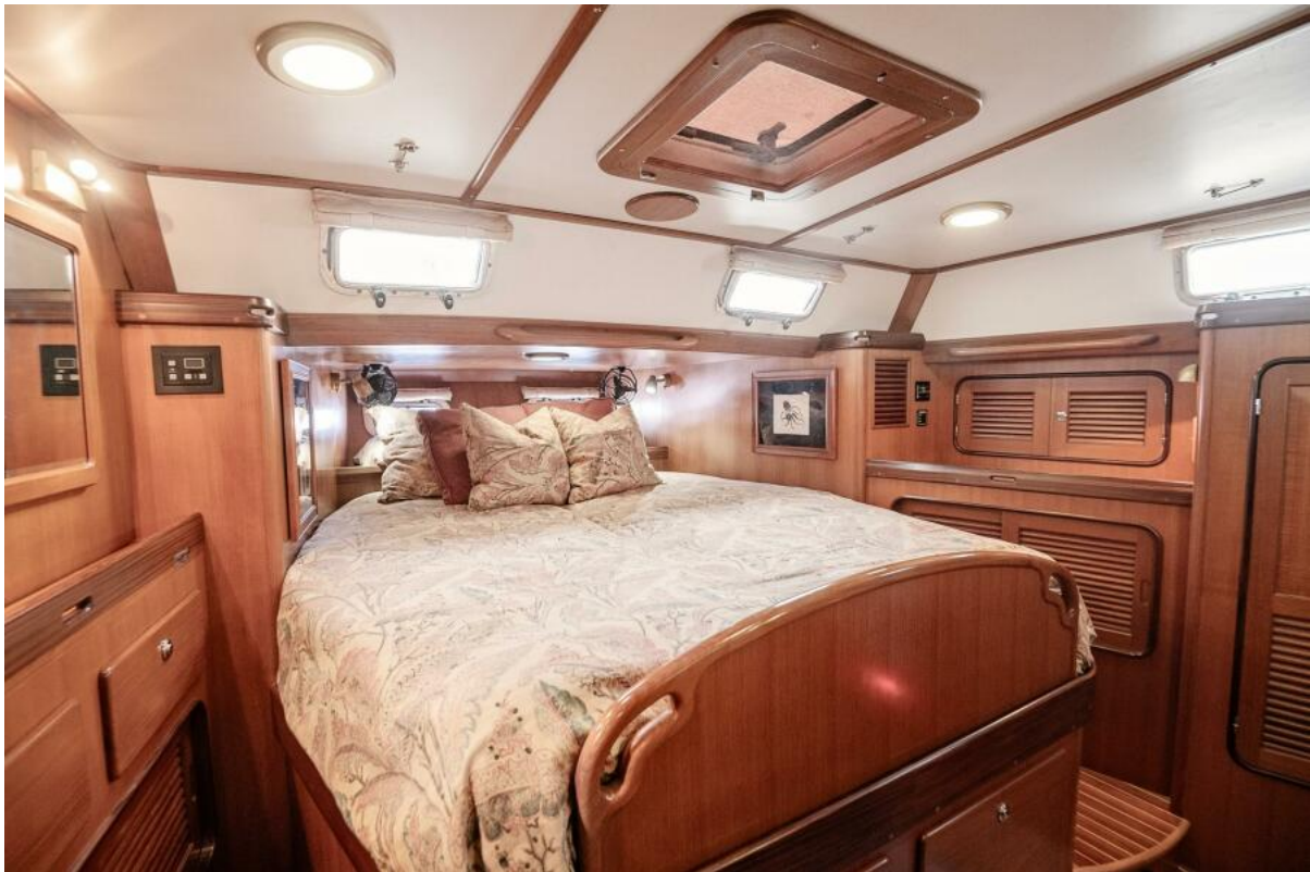
Passport Vista 515 For Sale005