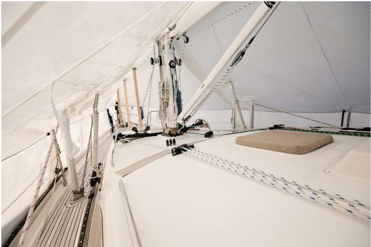
Passport Vista 515 For Sale015