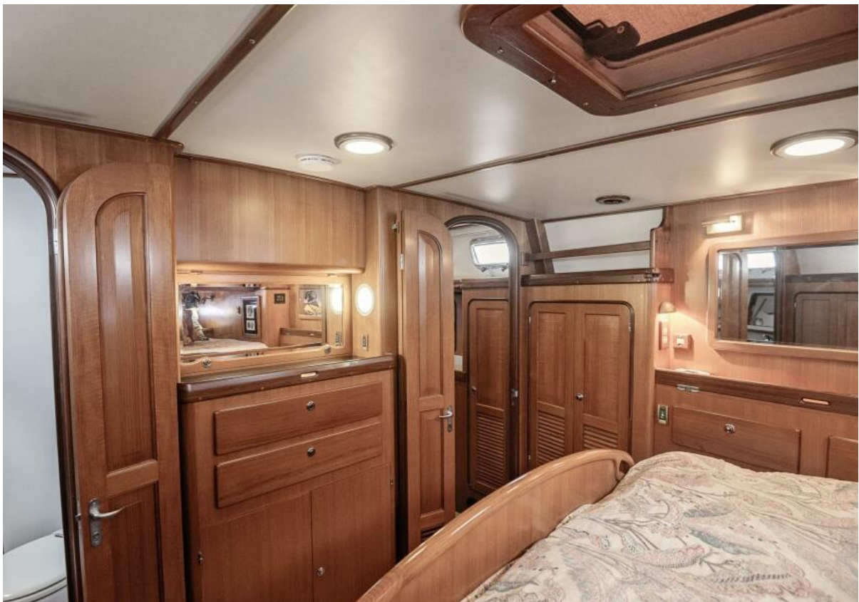
Passport Vista 515 For Sale006