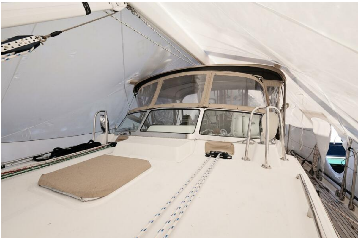
Passport Vista 515 For Sale016