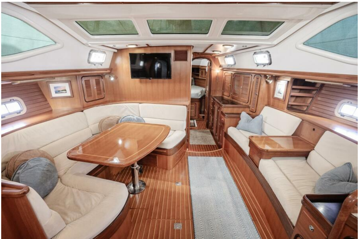
Passport Vista 515 For Sale001