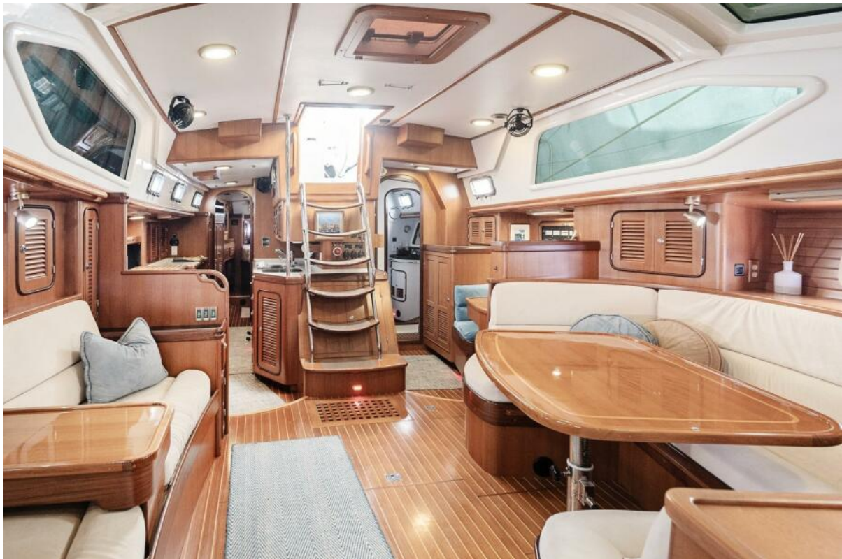
Passport Vista 515 For Sale014