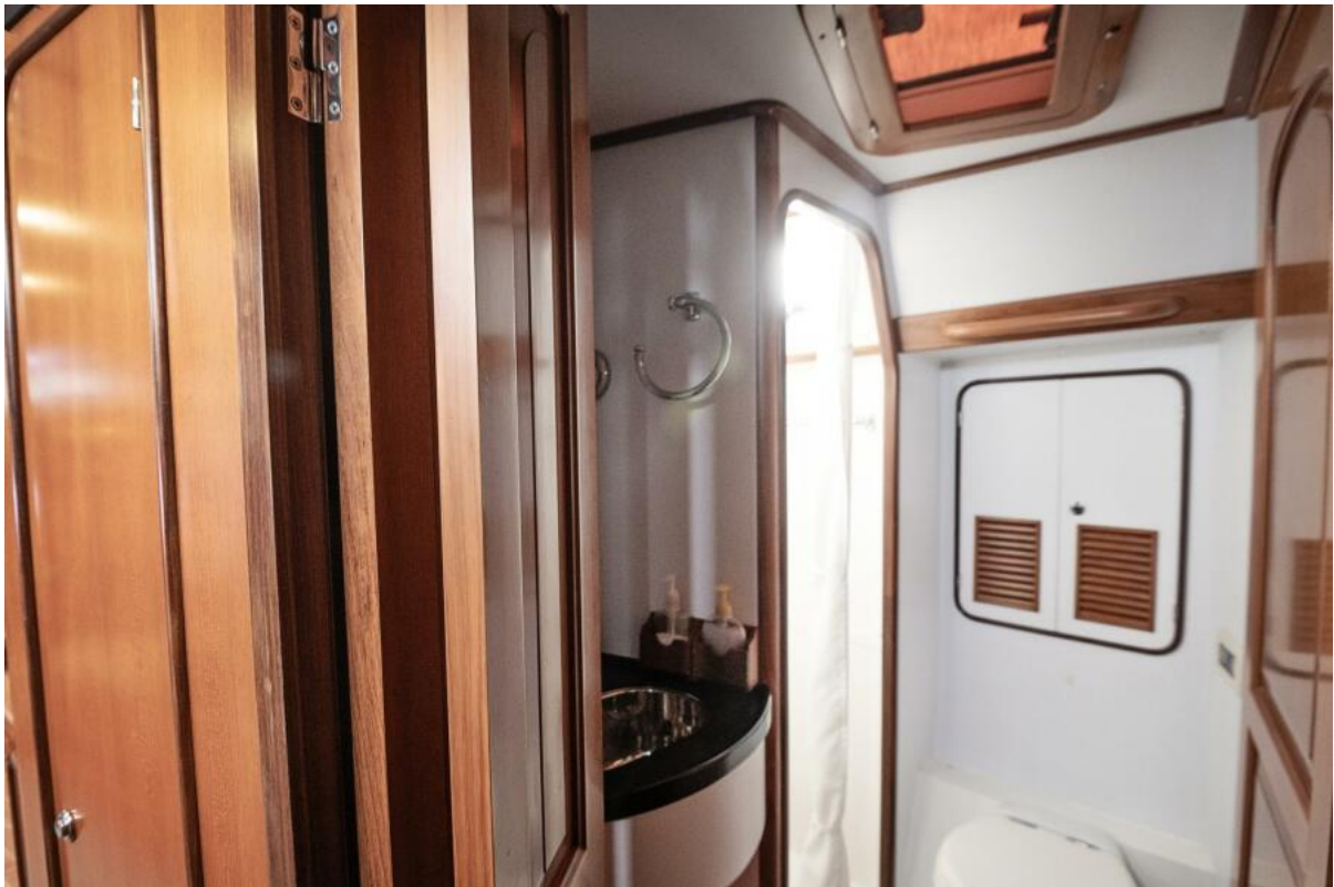
Passport Vista 515 For Sale012