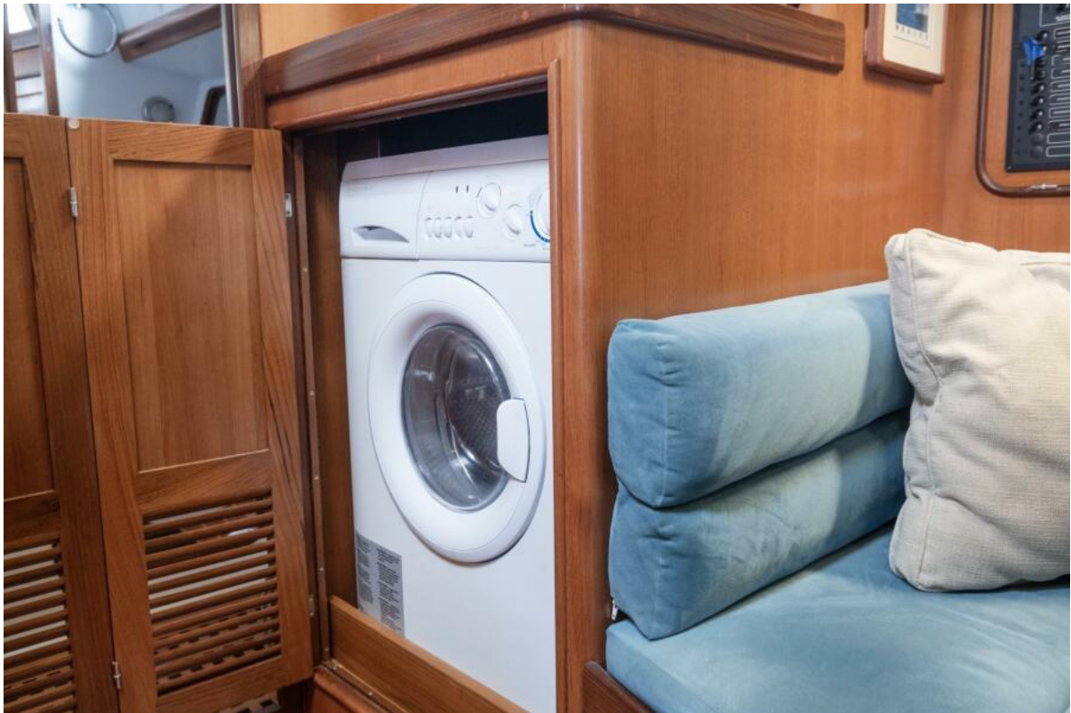
Passport Vista 515 For Sale008