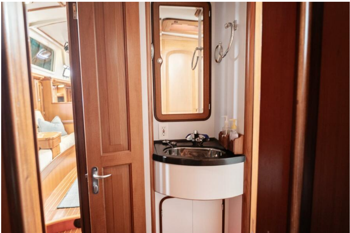
Passport Vista 515 For Sale011