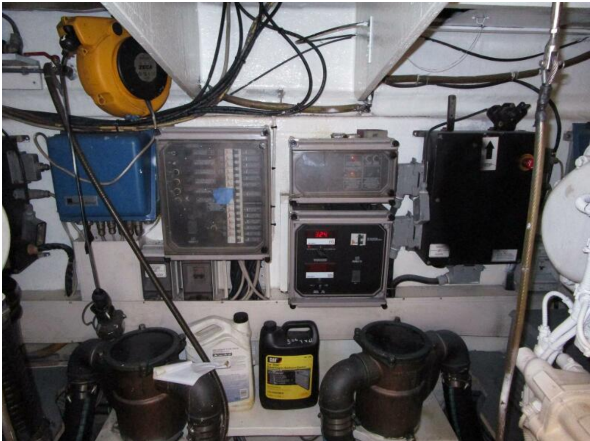
Engine Room Aft