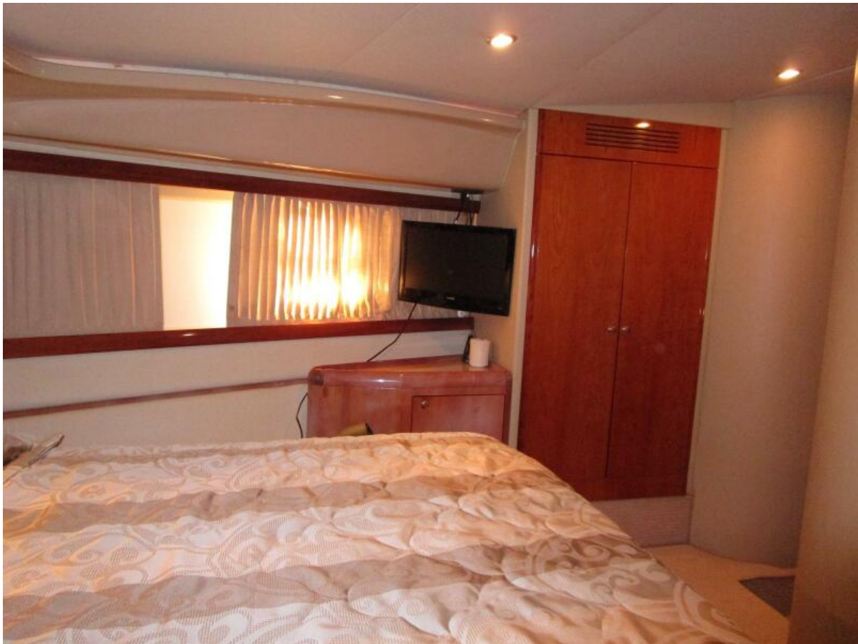
VIP Looking to Stbd.