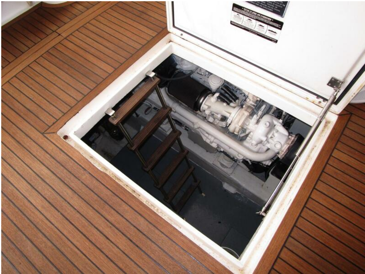
Engine Room Access