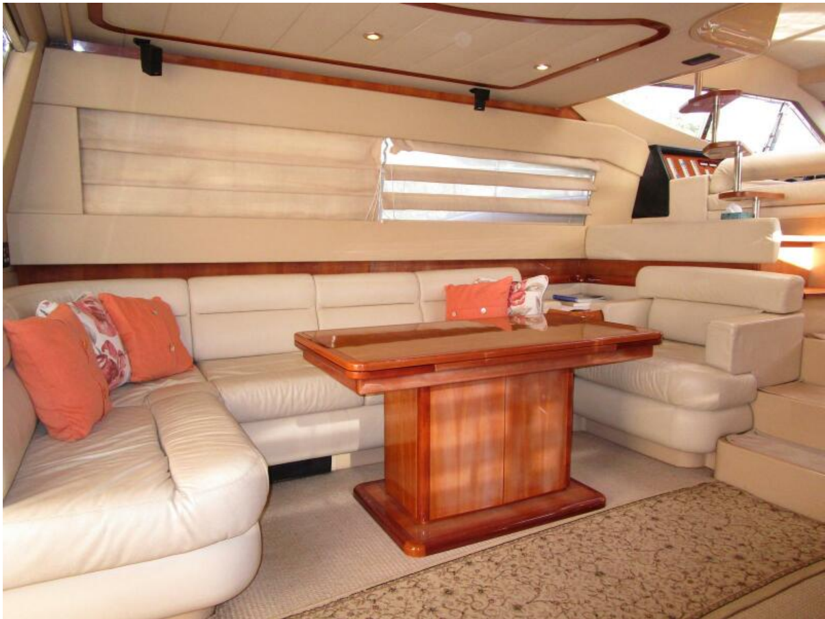
Salon Looking to Port