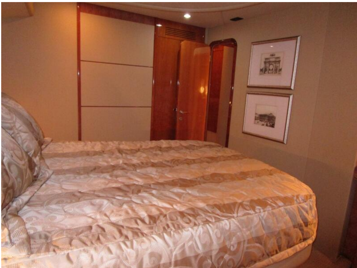
Master Looking Forward