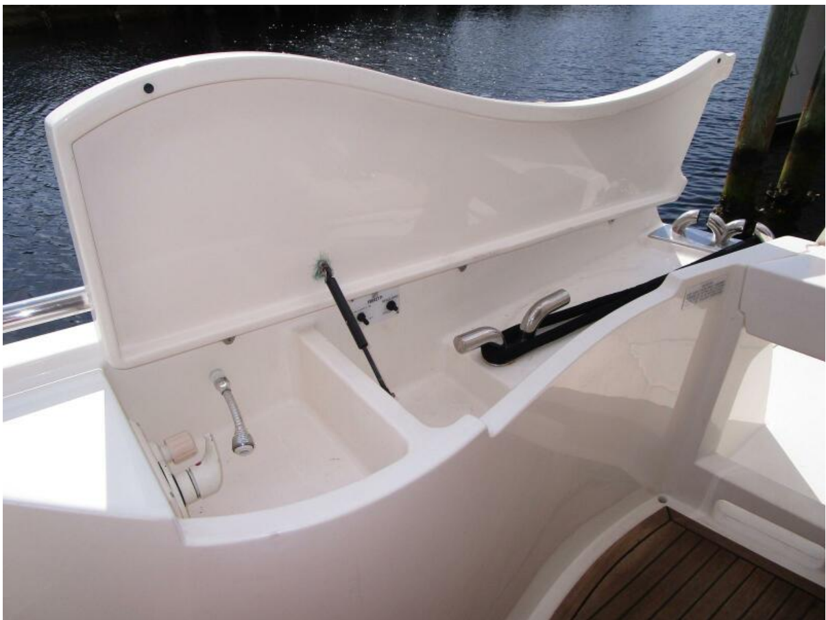
Sink and Cleats