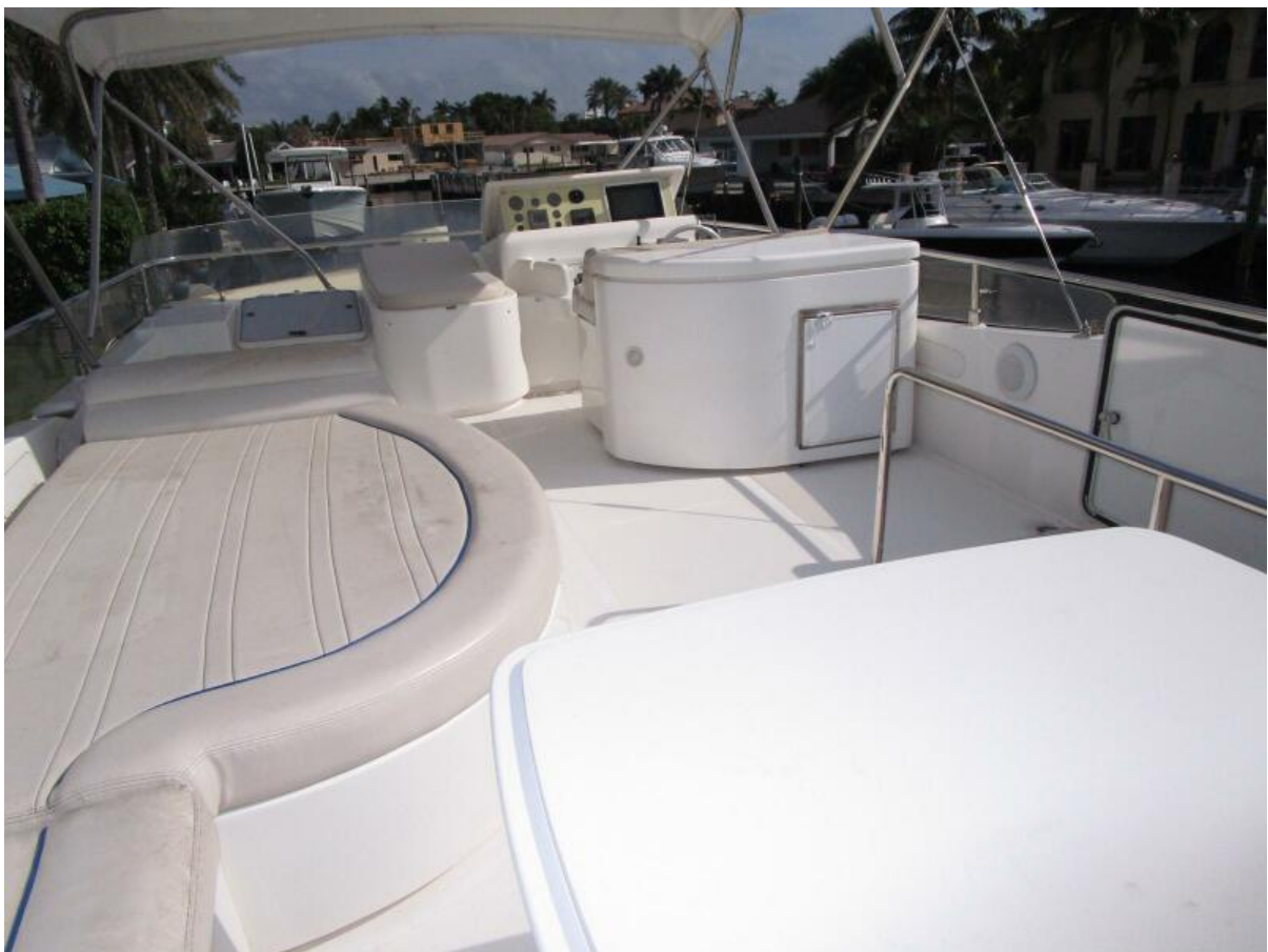
Flybridge Looking Fwd.