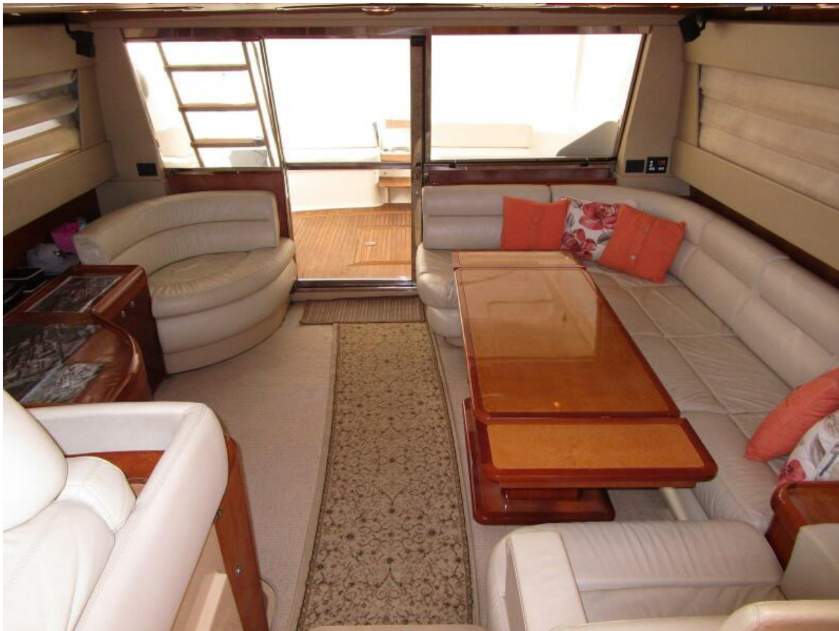
Salon Looking Out