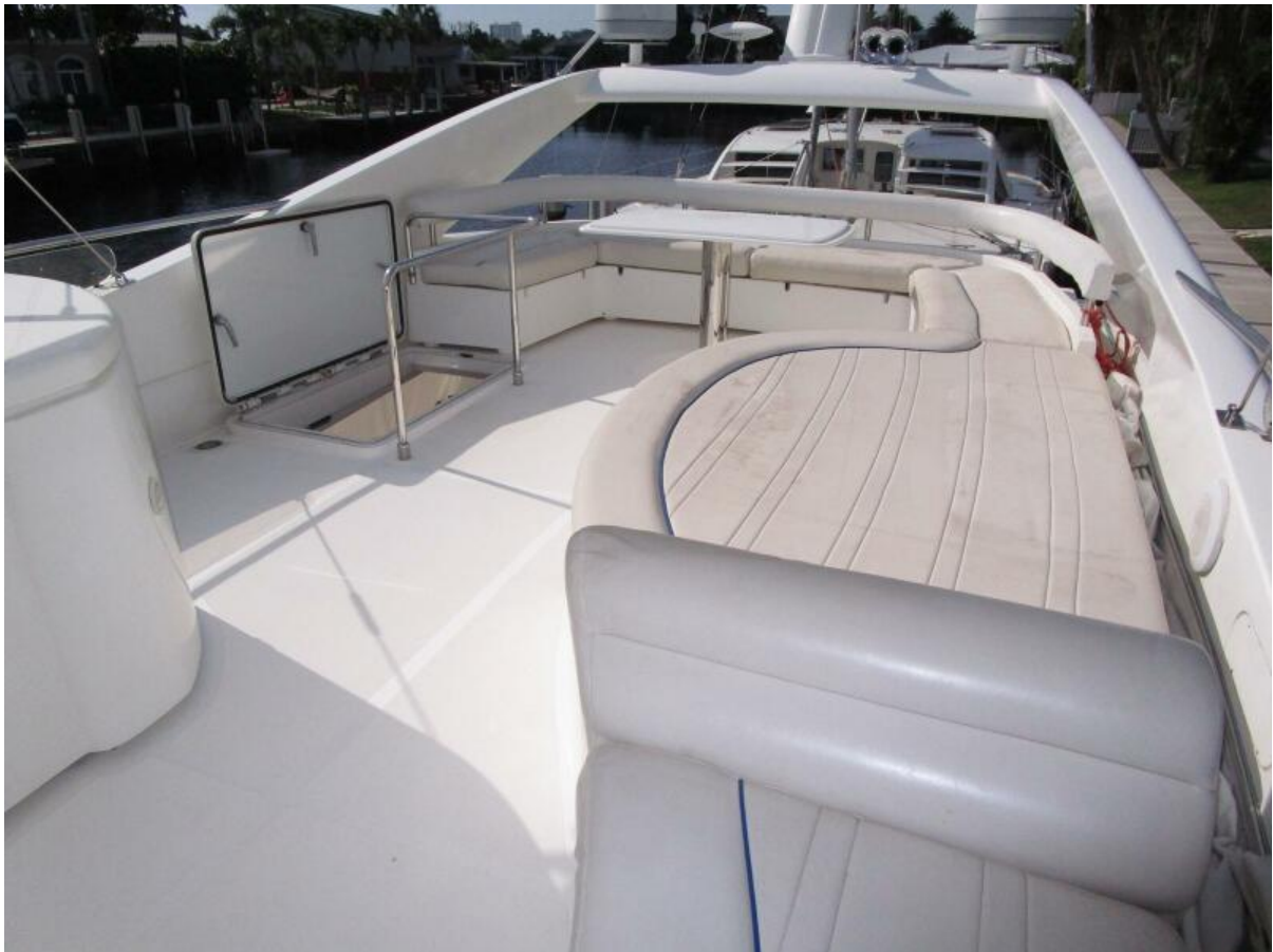
Flybridge Looking Aft