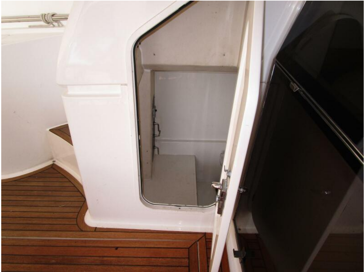
Crew Cabin Entry