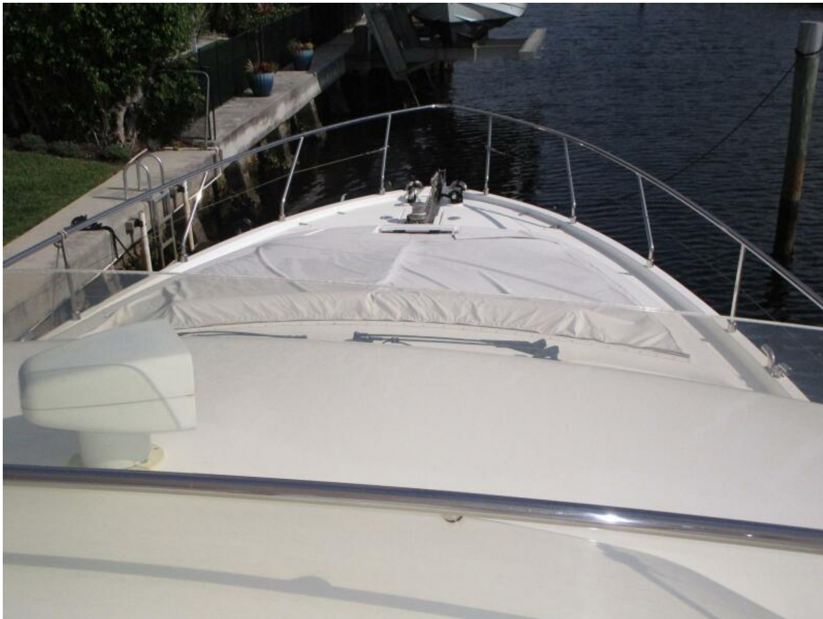
View from Helm