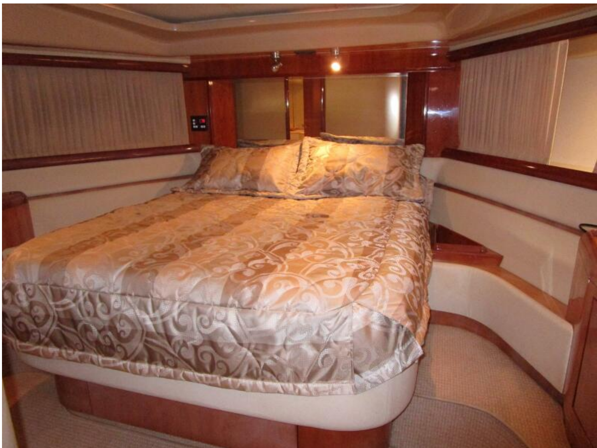
VIP Looking Fwd.