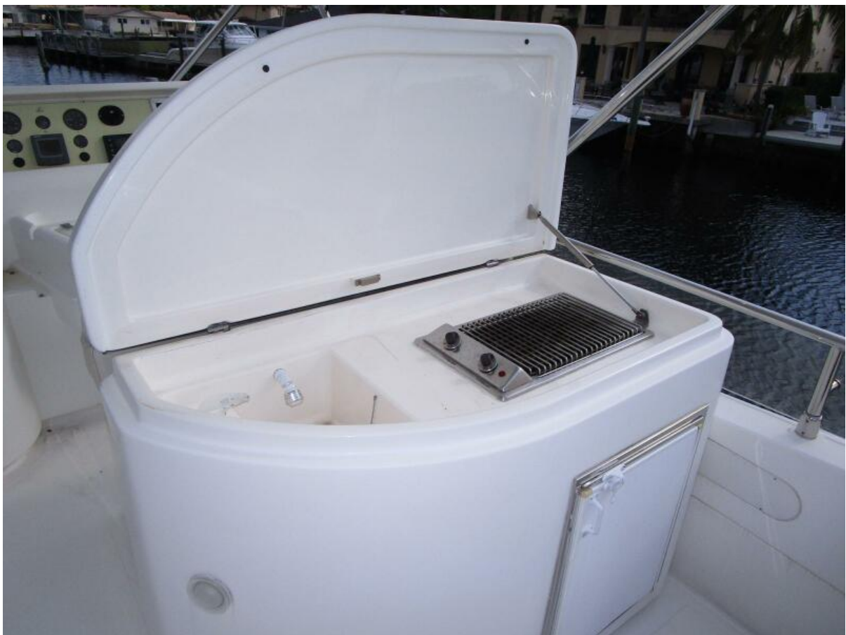
Flybridge Wet Bar