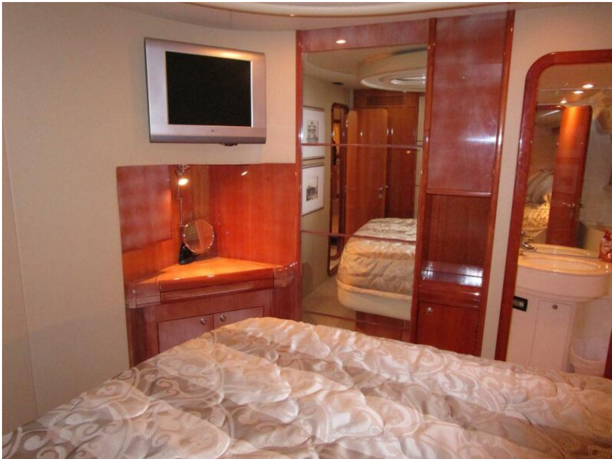
Master Looking Inboard