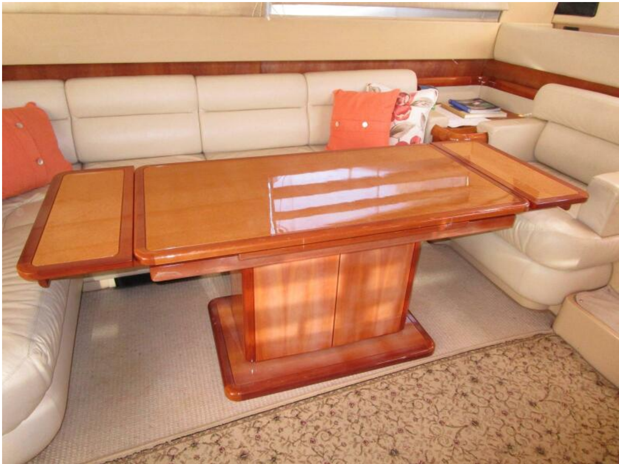
Salon Table Extended