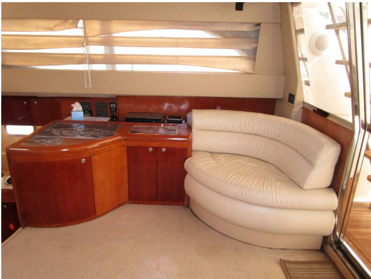
Salon Looking to Stbd.