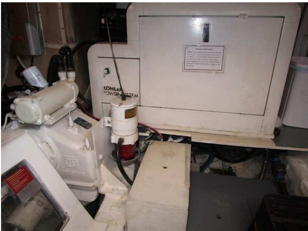
Engine Room Forward