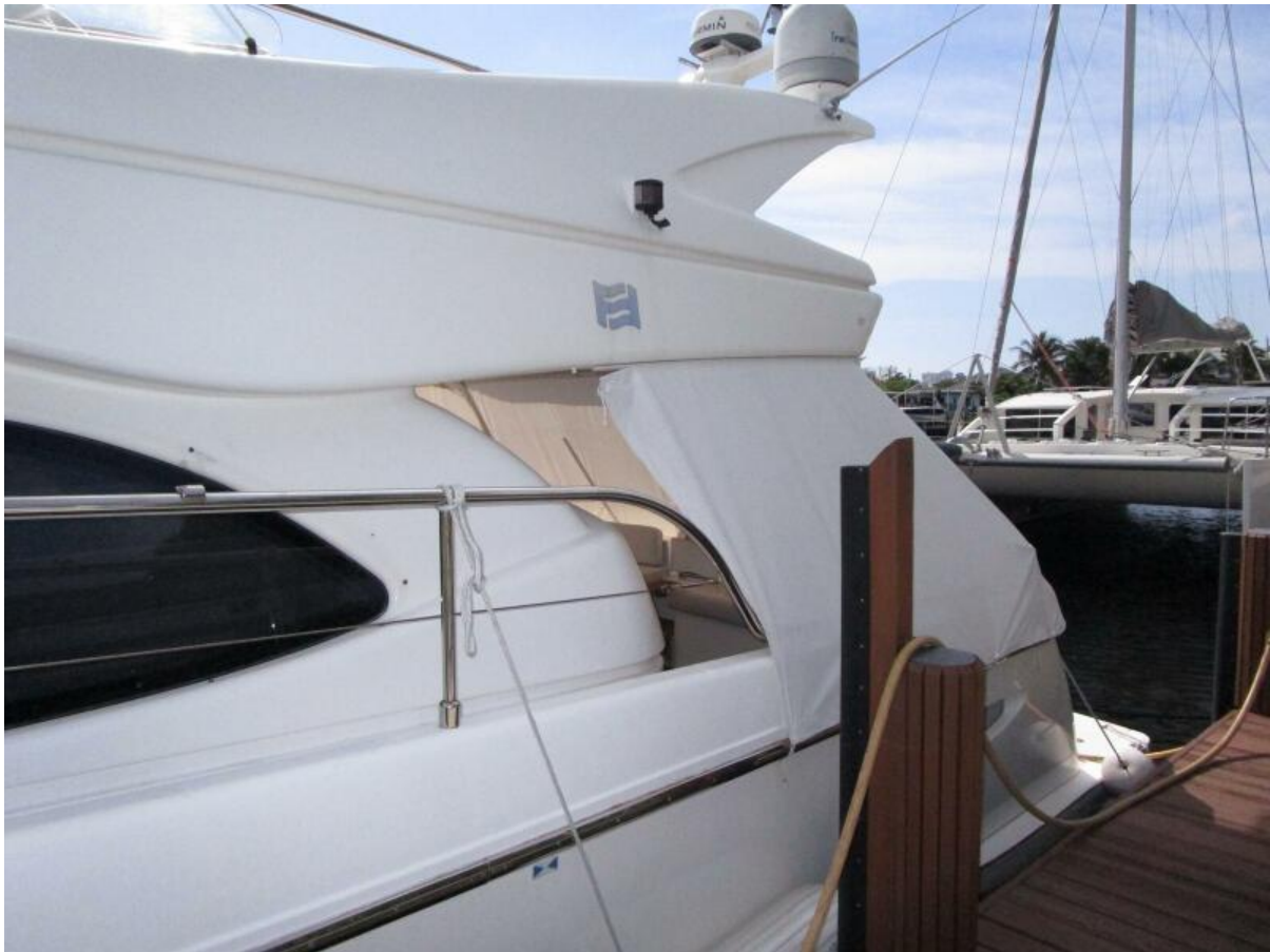
Aft Deck Curtains