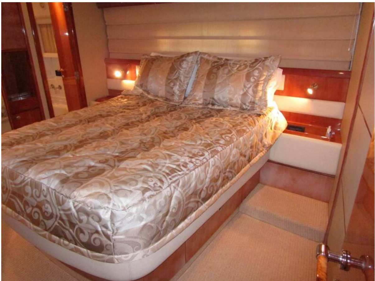
Master Looking Outboard