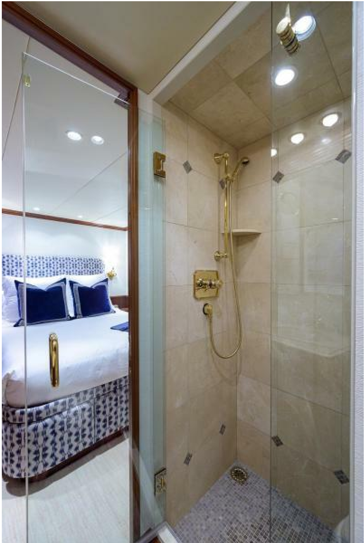
Starboard Guest Shower