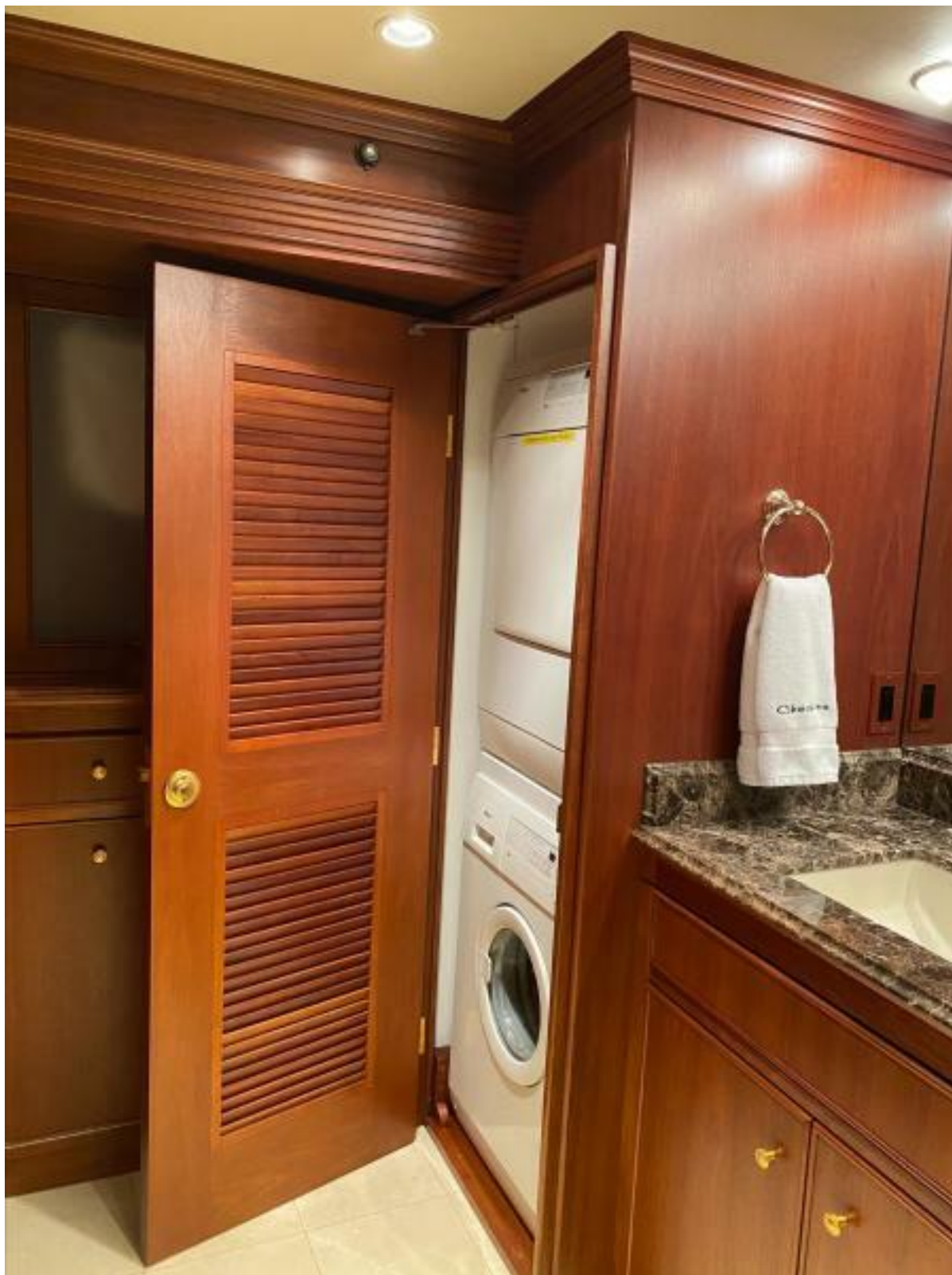
Laundry in Owner Ensuite