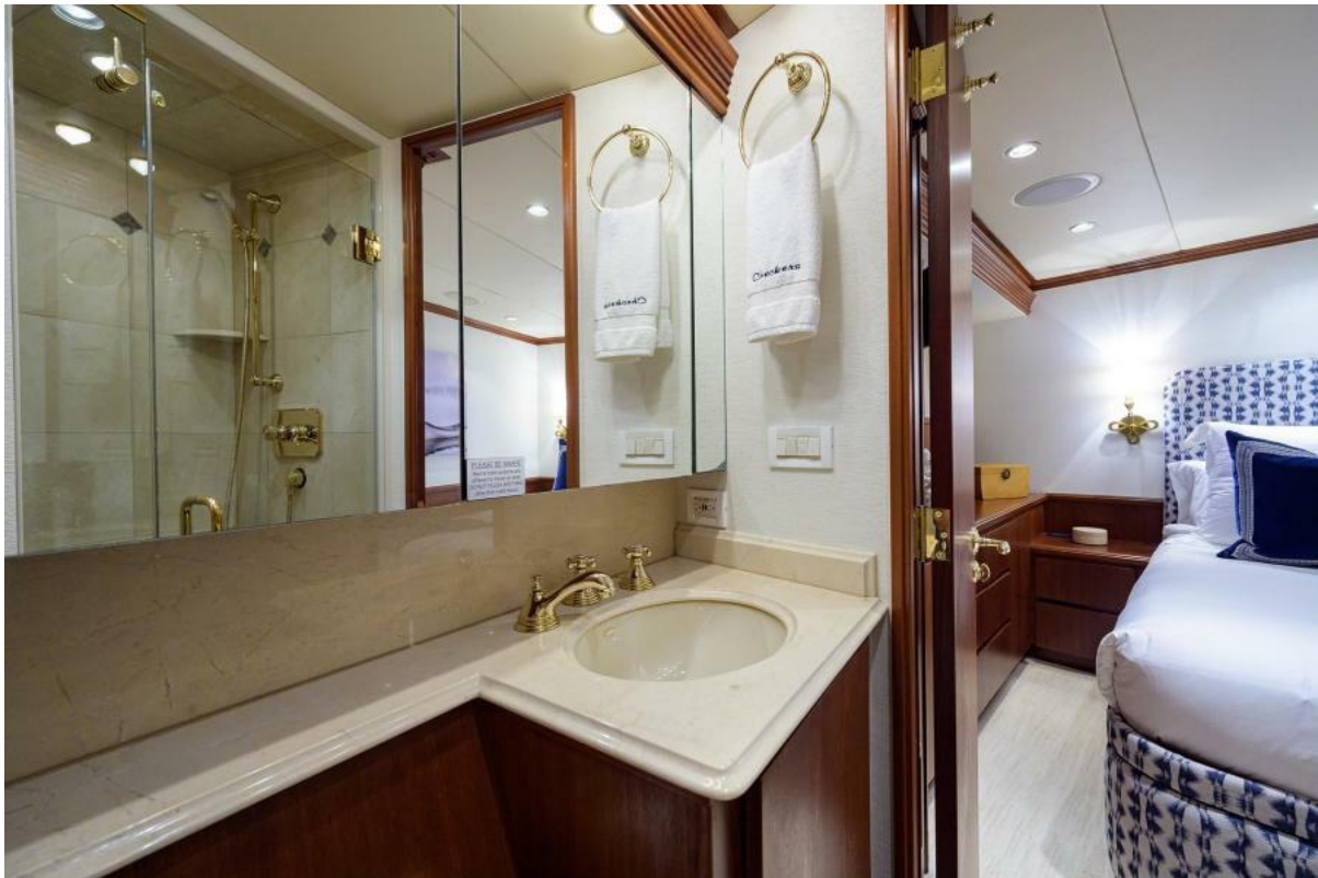
Starboard Guest Ensuite