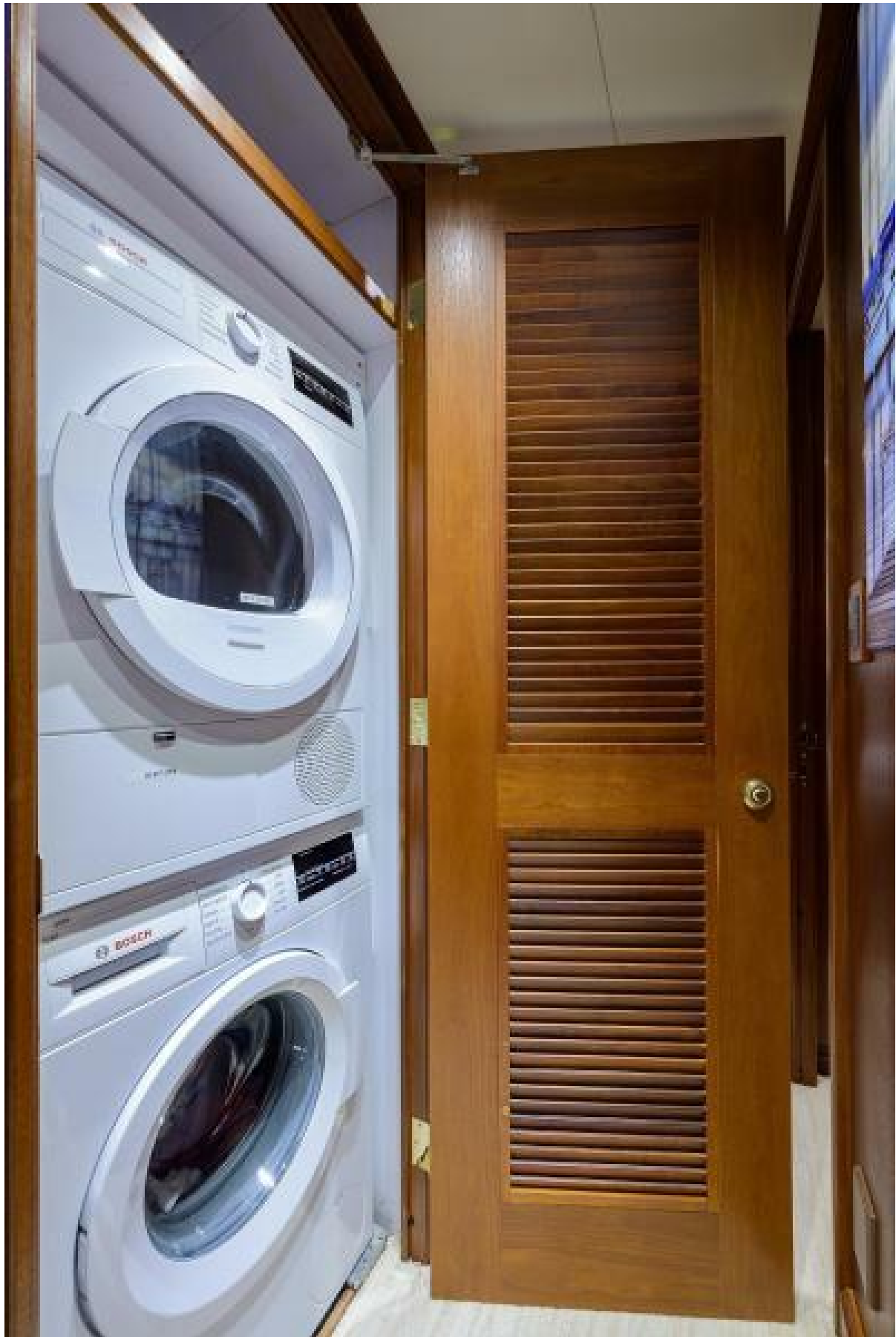
Laundry Area Lower Foyer