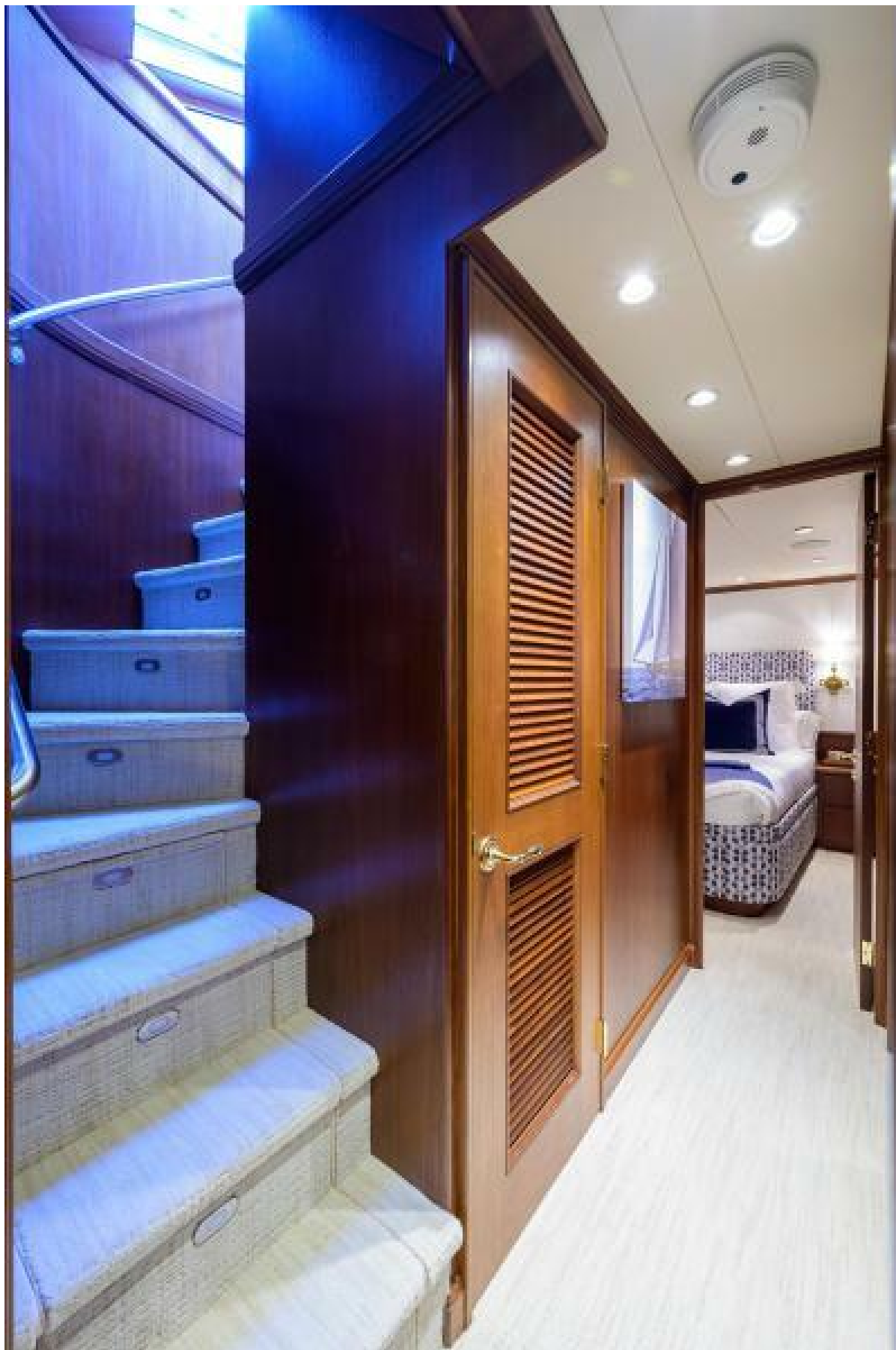
Lower Deck Foyer