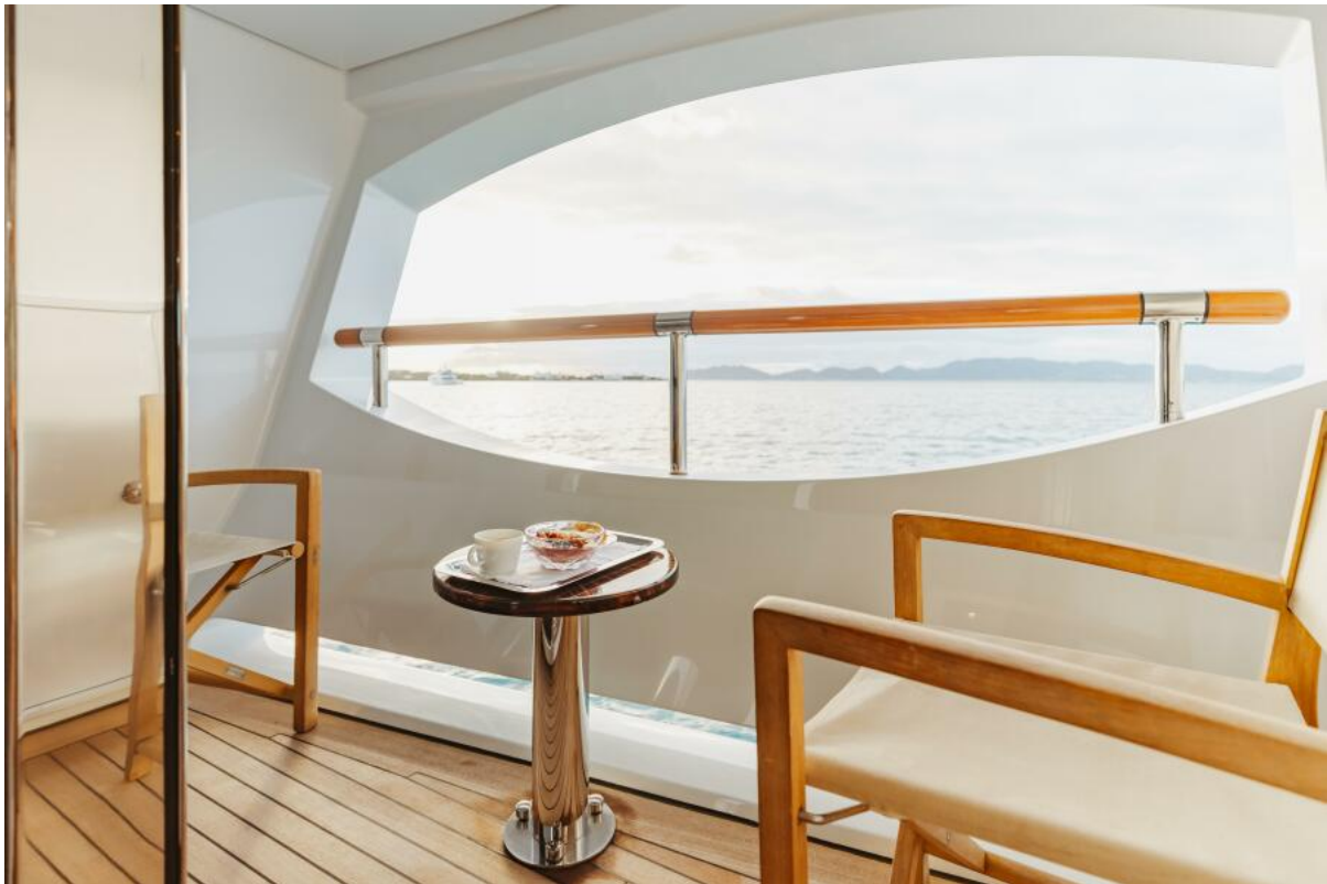
Master Stateroom Balcony