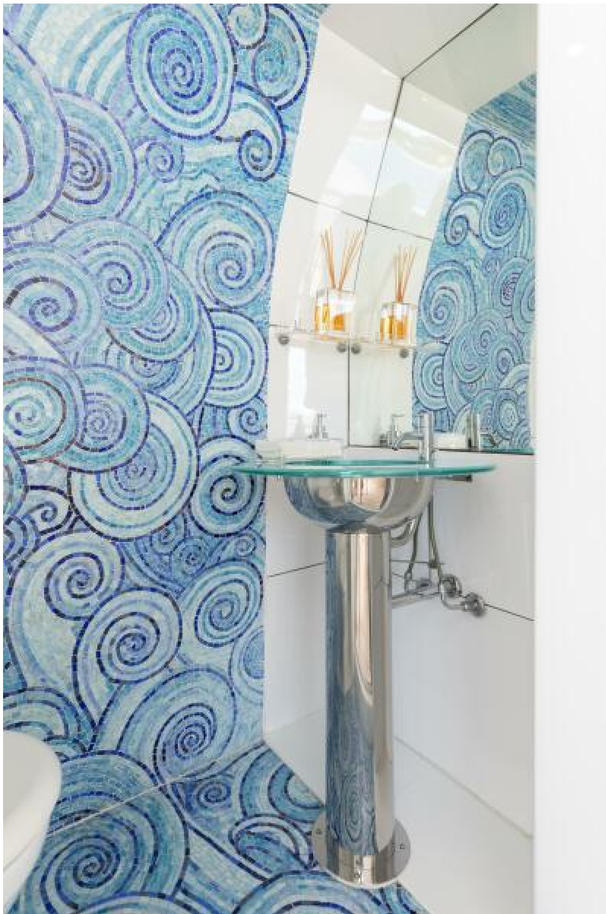
Day Heads Sun Deck