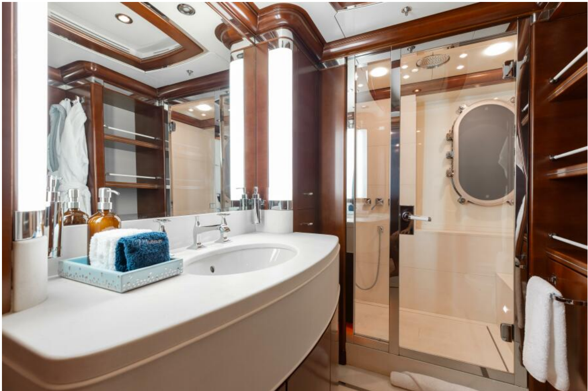
Guest Head 1 Stbd