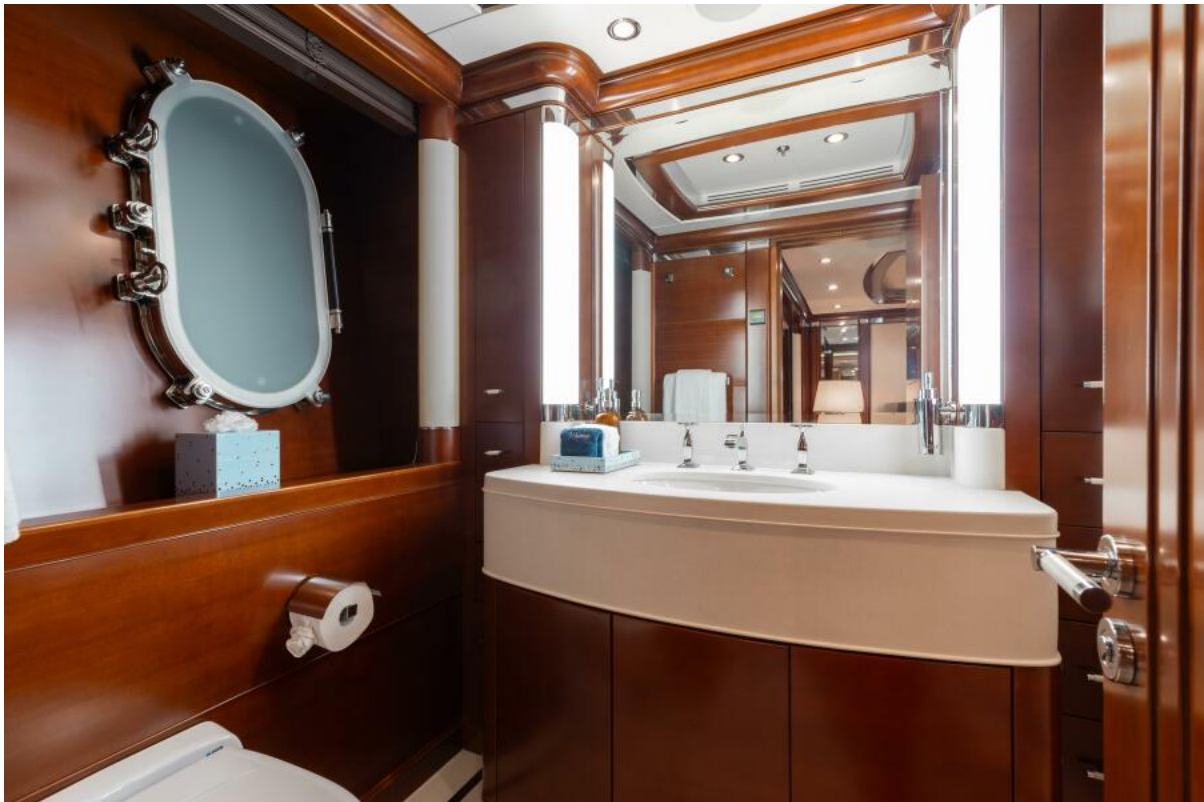
Guest Head 2 Stbd