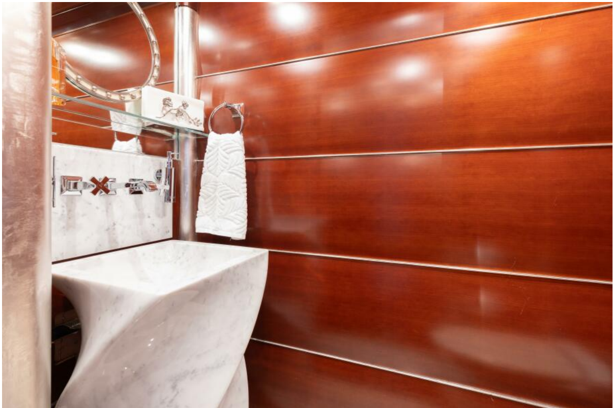
Day Heads Main Deck