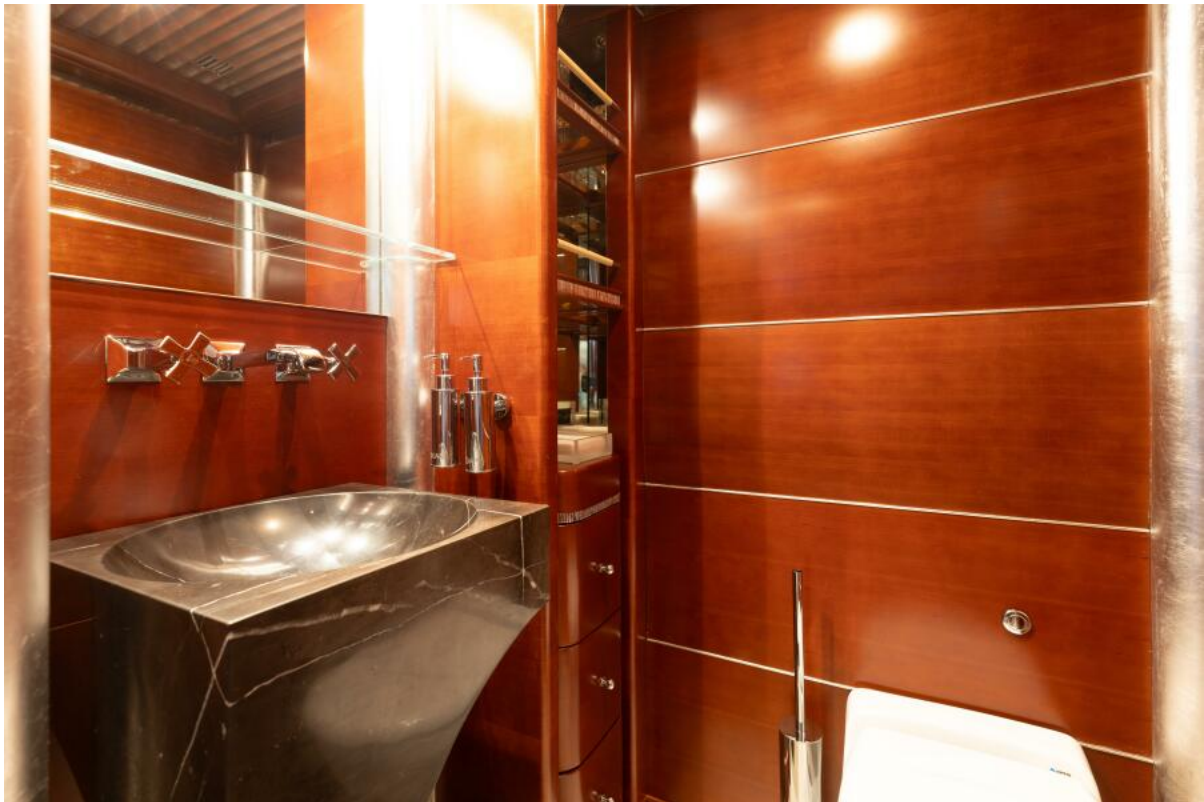
Day Heads Bridge Deck