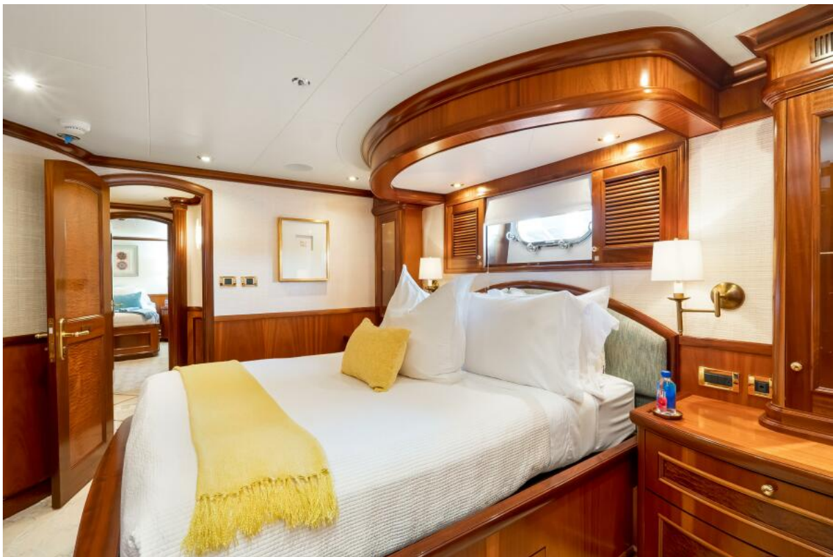
Guest Stateroom Stbd. Side