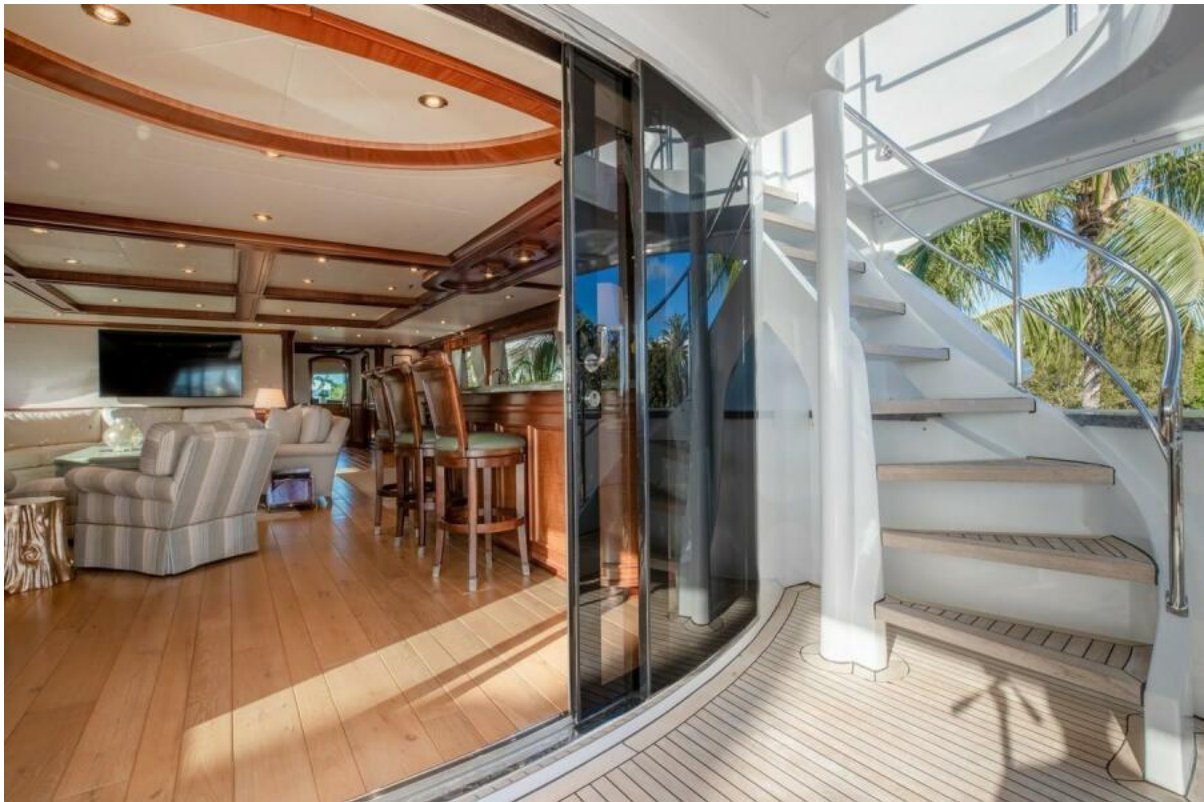
Bridge Aft Deck and Fly Bridge Stairs