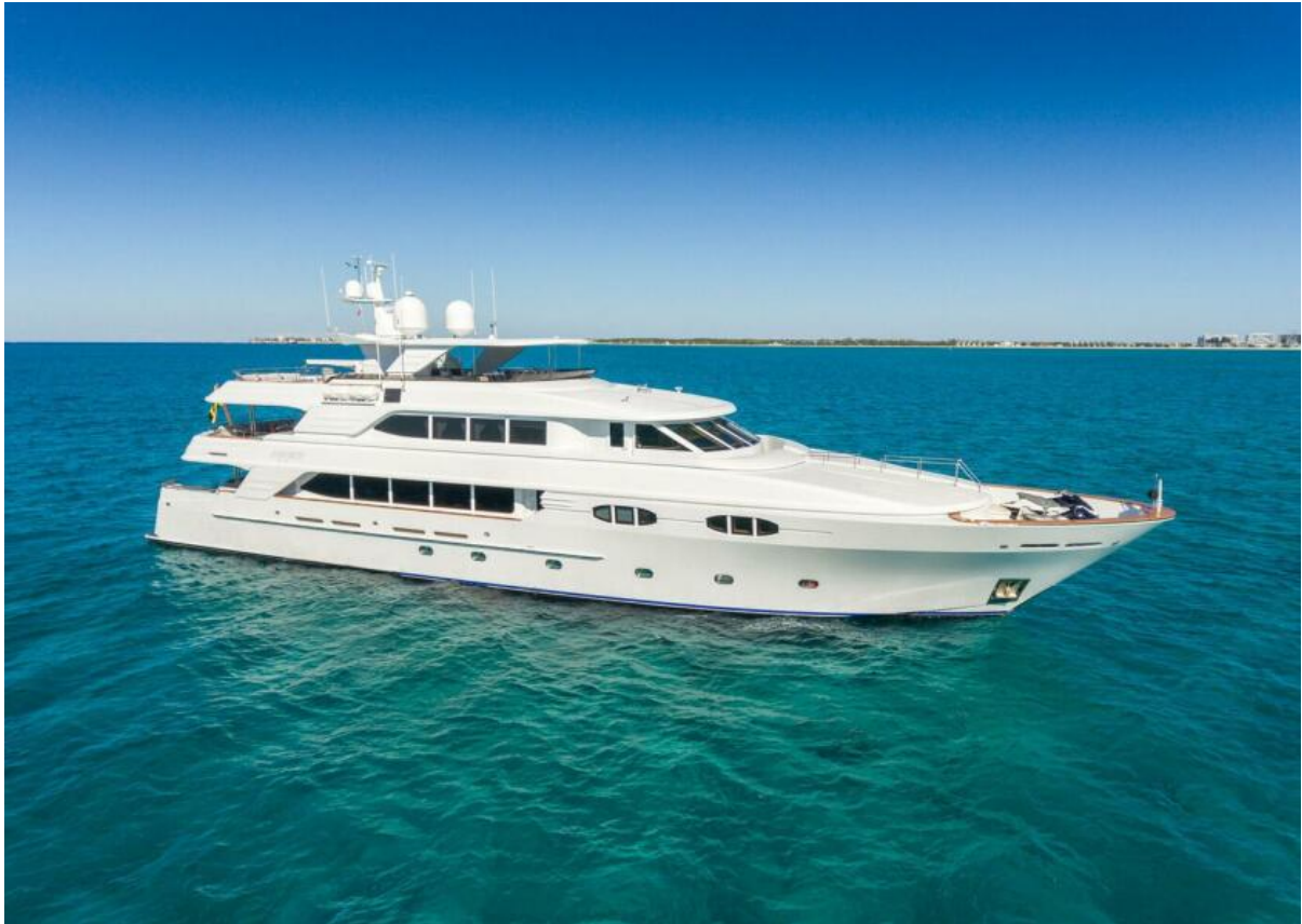
MISS STEPHANIE 138' (42m) Richmond Motoryacht, 2004/2023