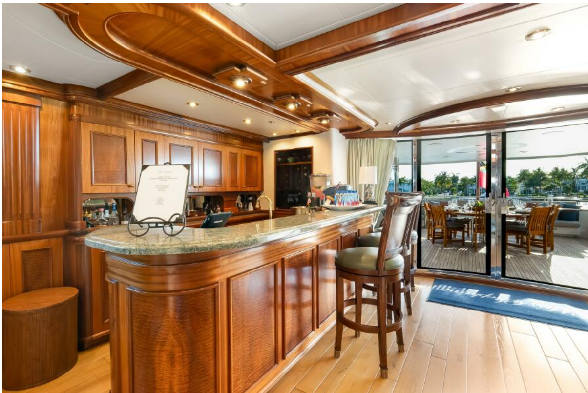
Sky Lounge Bar