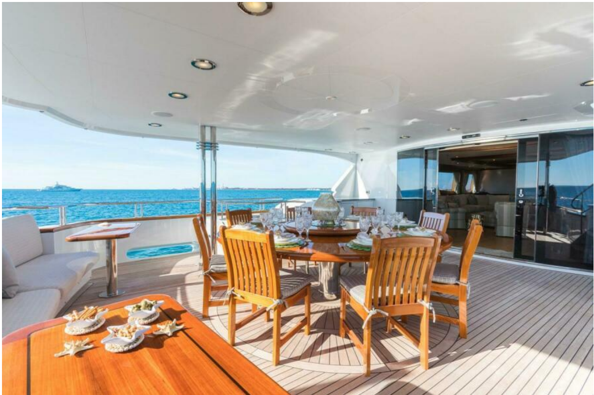
Bridge Aft Deck