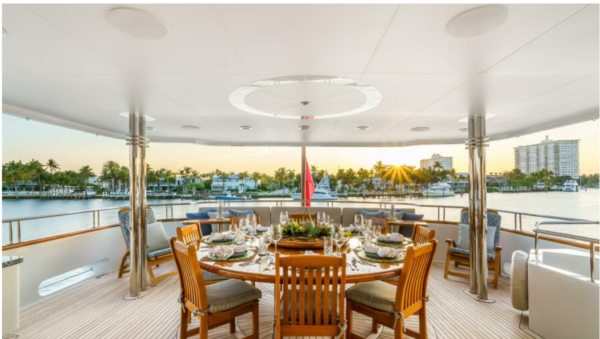
Bridge Aft Deck