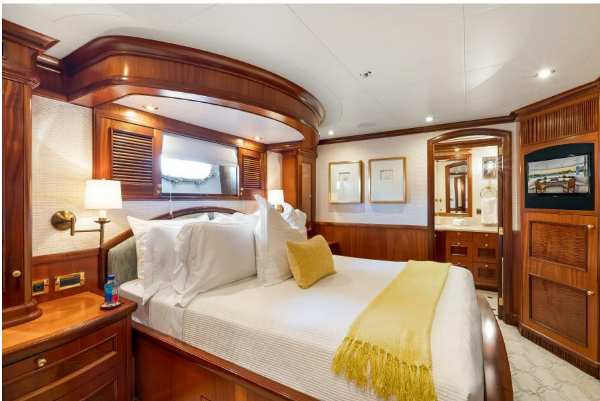
Guest Stateroom Port side