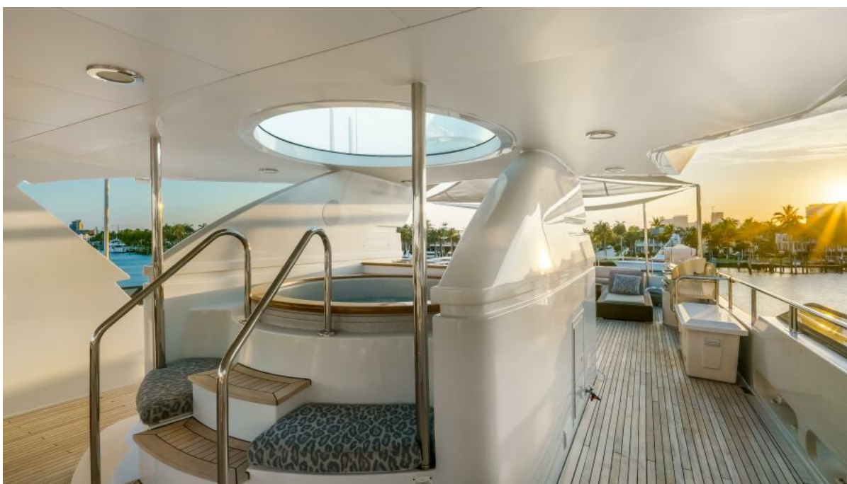
Jacuzzi - Sun Deck