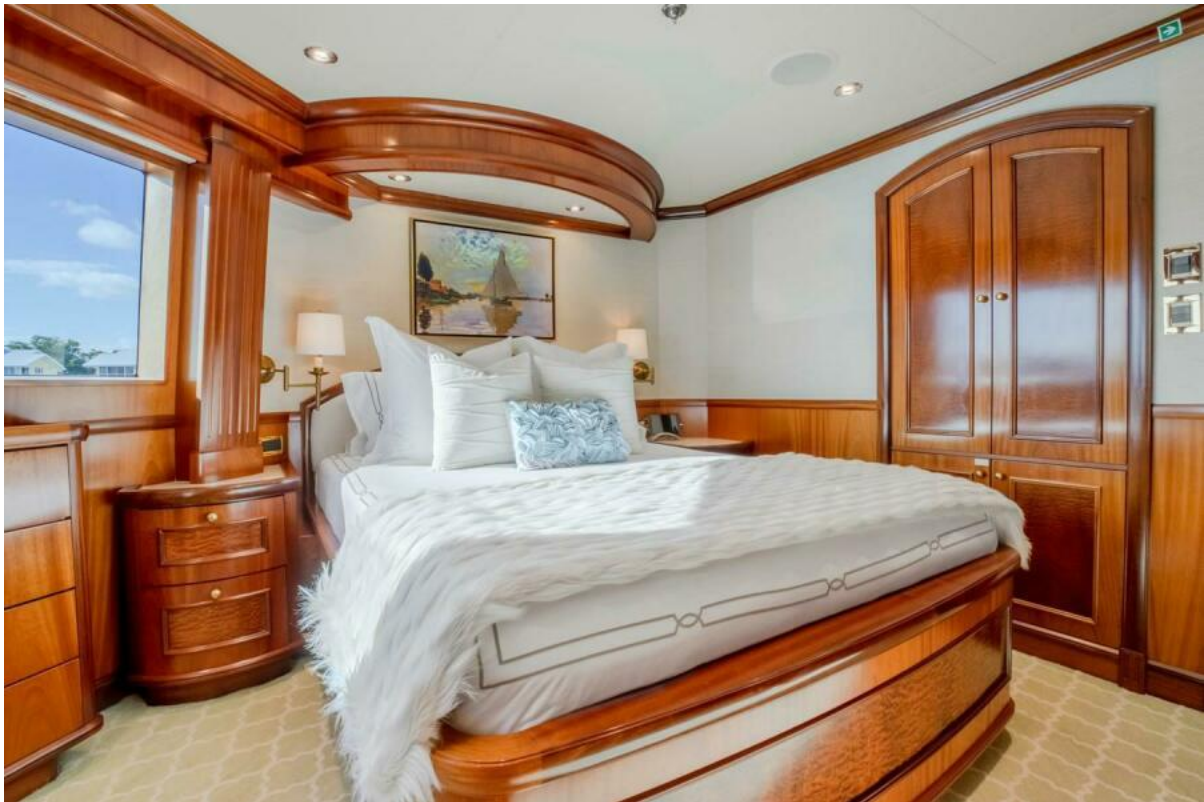
VIP Stateroom on Bridge Deck