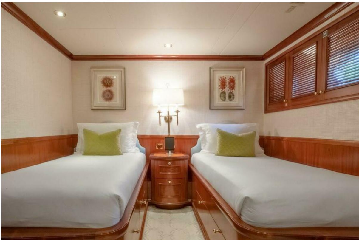
Twin Stateroom Stbd. Fwd.