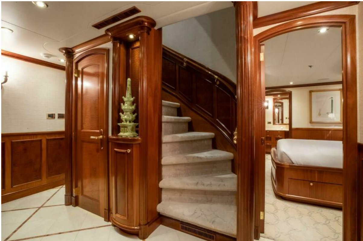
Stairs to Lower Deck