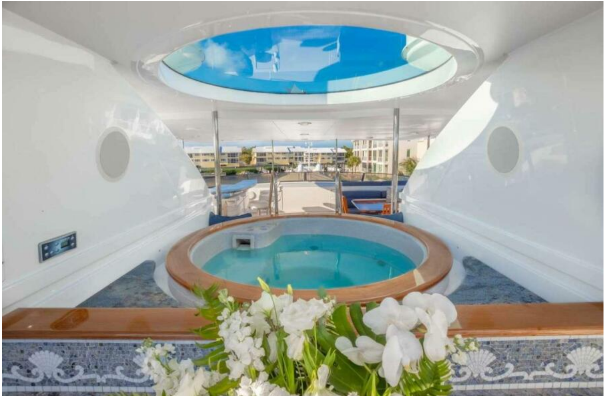
Jacuzzi - Sun Deck