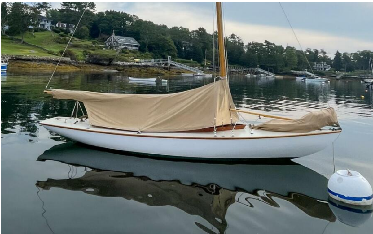
Sparkman And Stephens Manhasset One Design1449