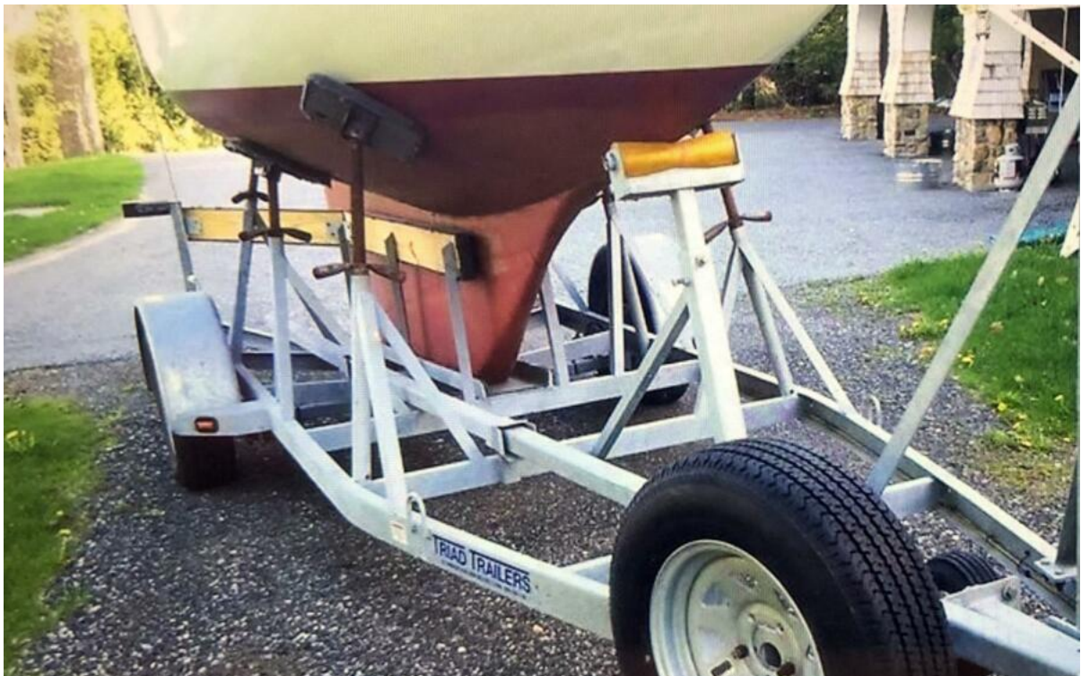
Sparkman And Stephens Manhasset One Design2921