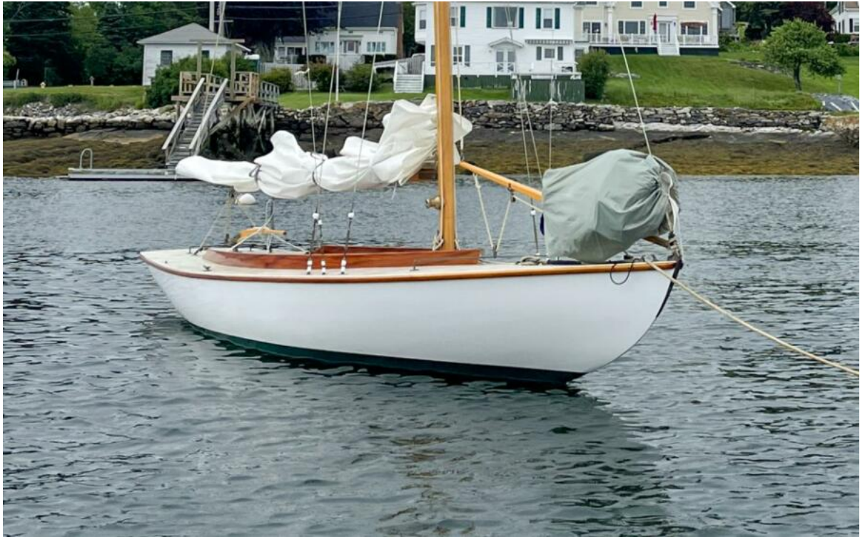
Sparkman And Stephens Manhasset One Design1371