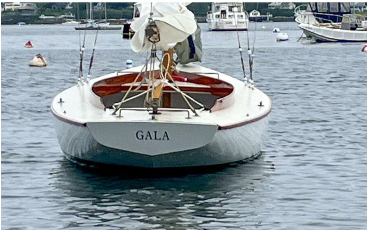
Sparkman And Stephens Manhasset One Design1373