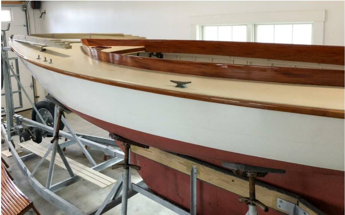
Sparkman And Stephens Manhasset One Design3171