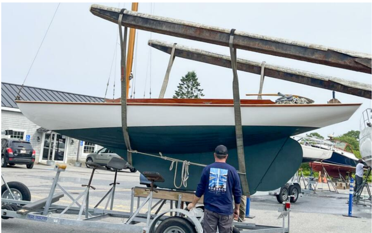
Sparkman And Stephens Manhasset One Design1331