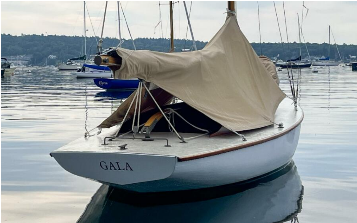
Sparkman And Stephens Manhasset One Design1448