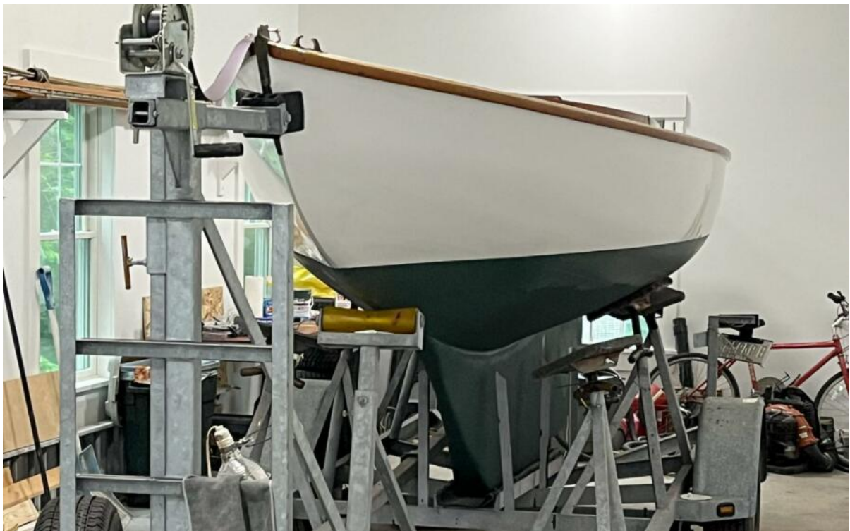
Sparkman And Stephens Manhasset One Design1328