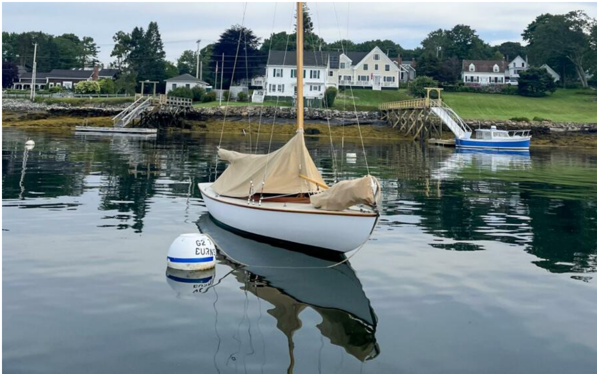
Sparkman And Stephens Manhasset One Design1450