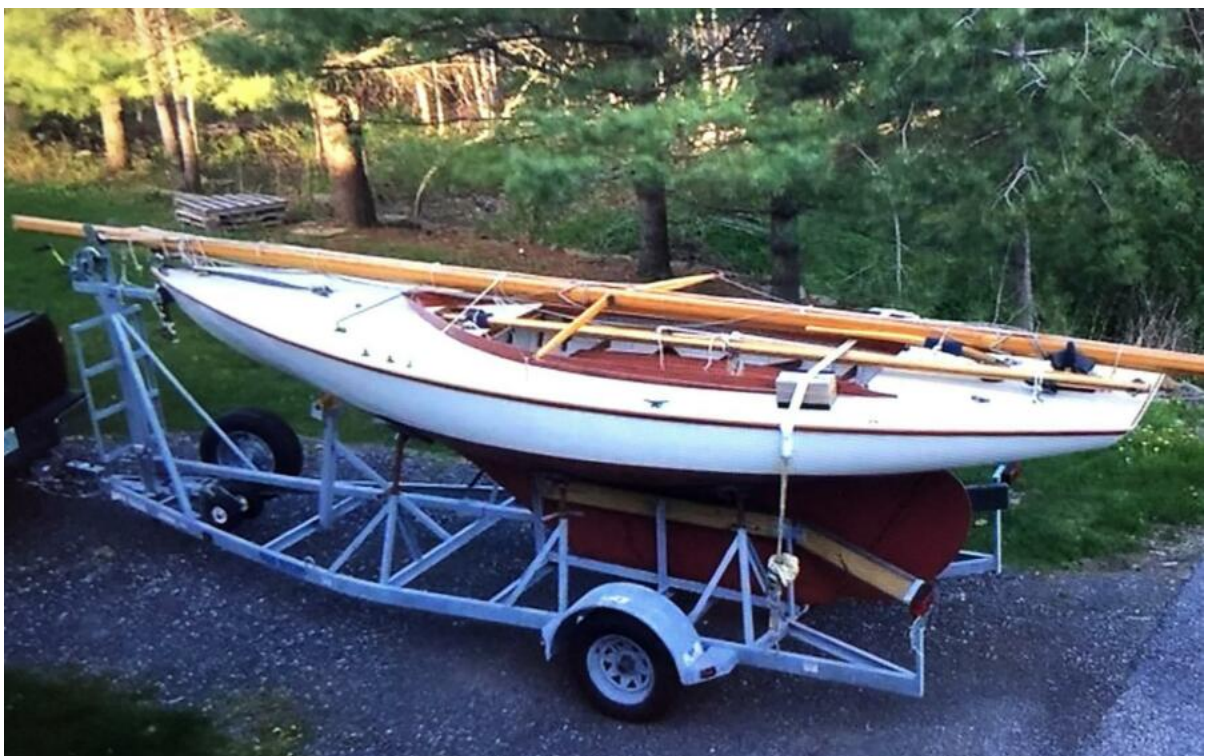
Sparkman And Stephens Manhasset One Design2920