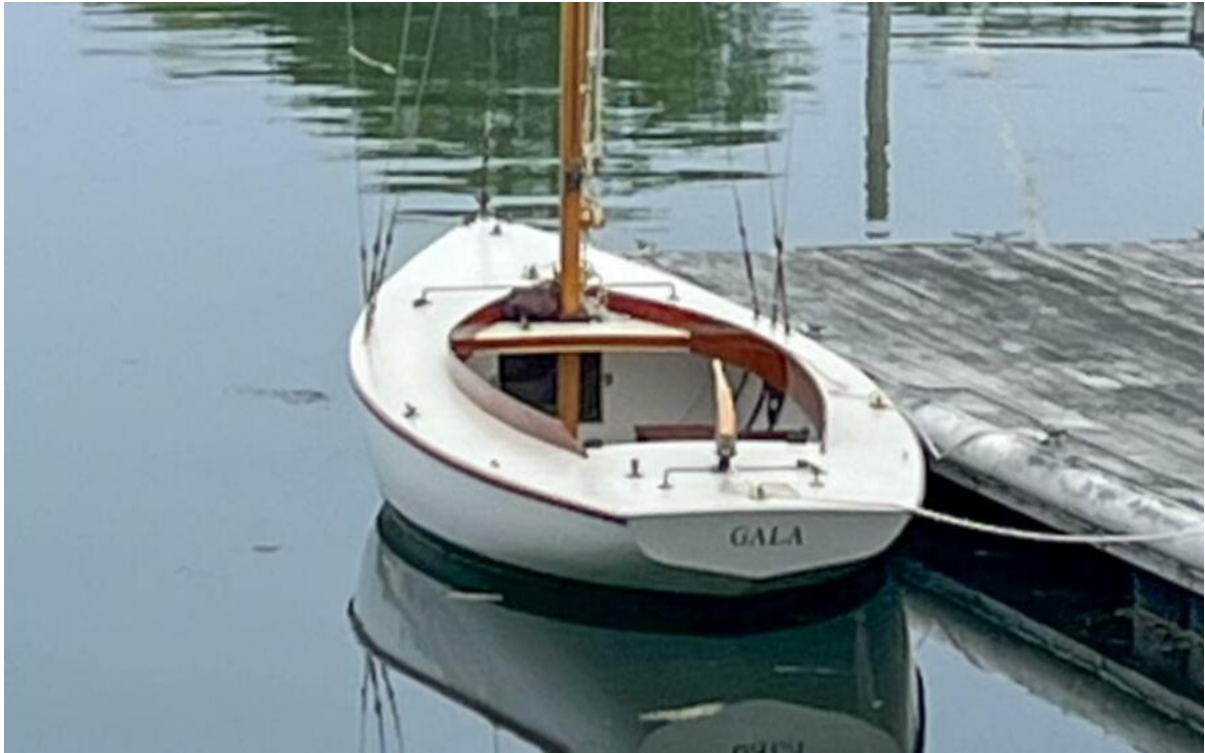
Sparkman And Stephens Manhasset One Design1332