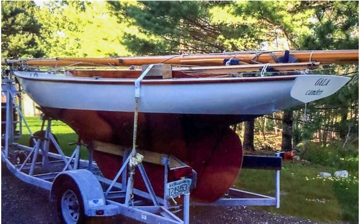
Sparkman And Stephens Manhasset One Design2922