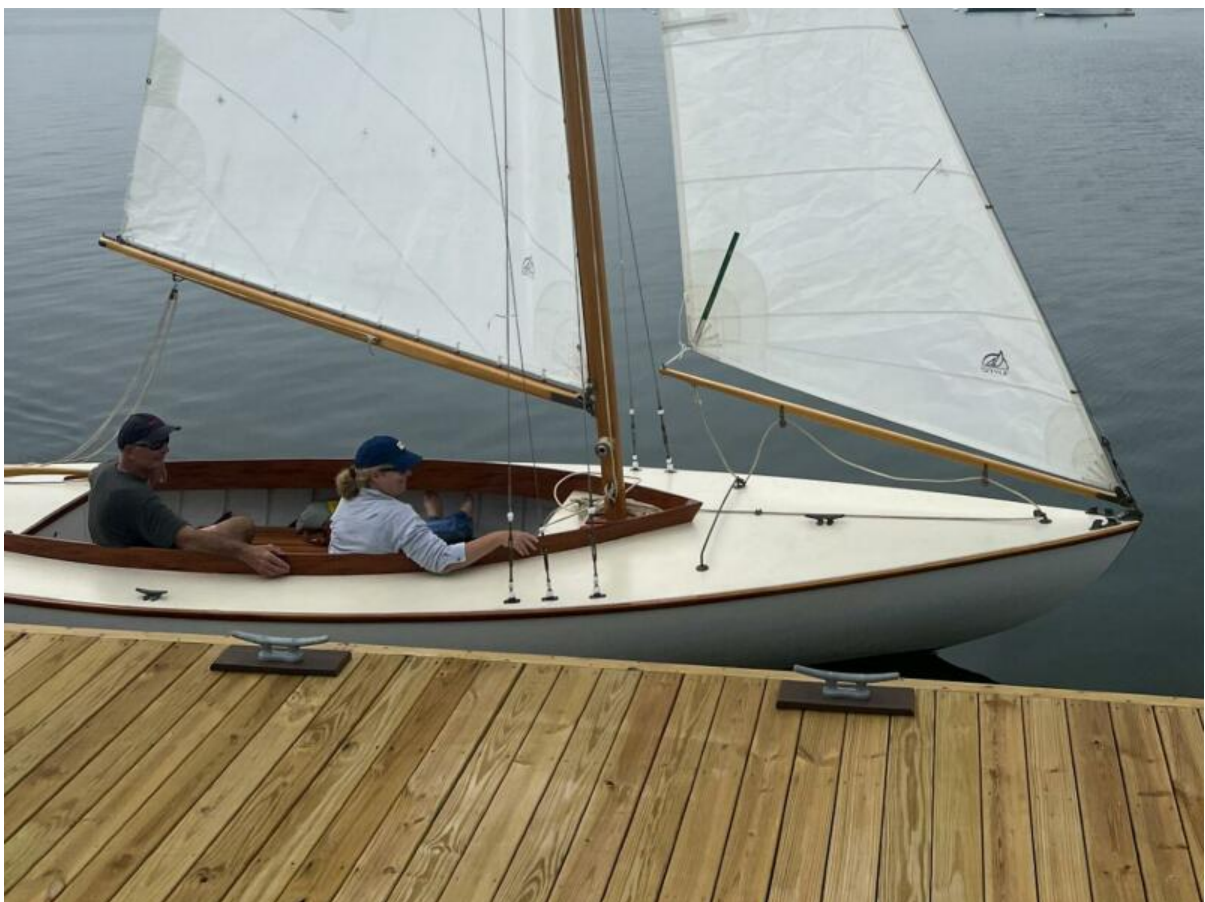
Sparkman And Stephens Manhasset One Design1804