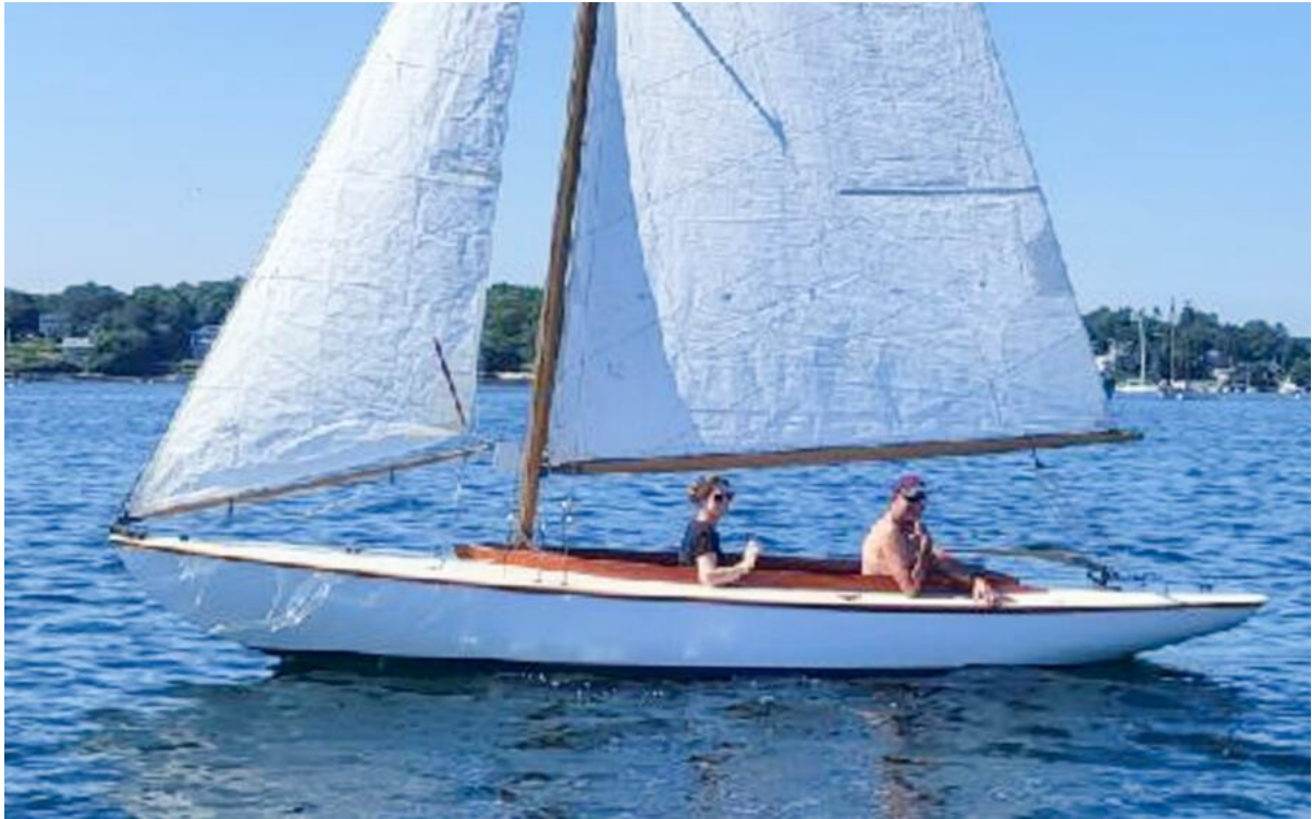
Sparkman And Stephens Manhasset One DesignResized95202306309515250195355721232691747