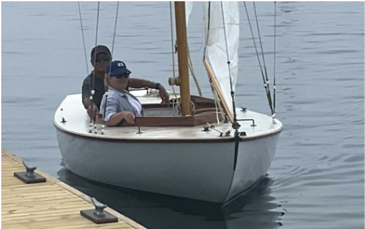
Sparkman And Stephens Manhasset One Design1802