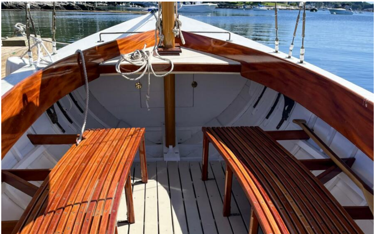
Sparkman And Stephens Manhasset One Design1473