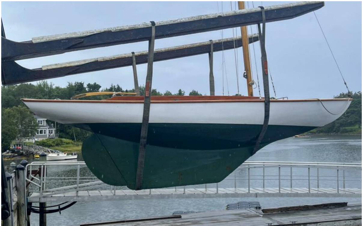
Sparkman And Stephens Manhasset One Design1487