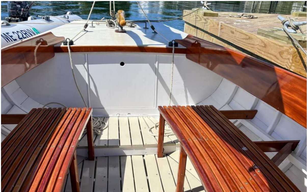
Sparkman And Stephens Manhasset One Design1474