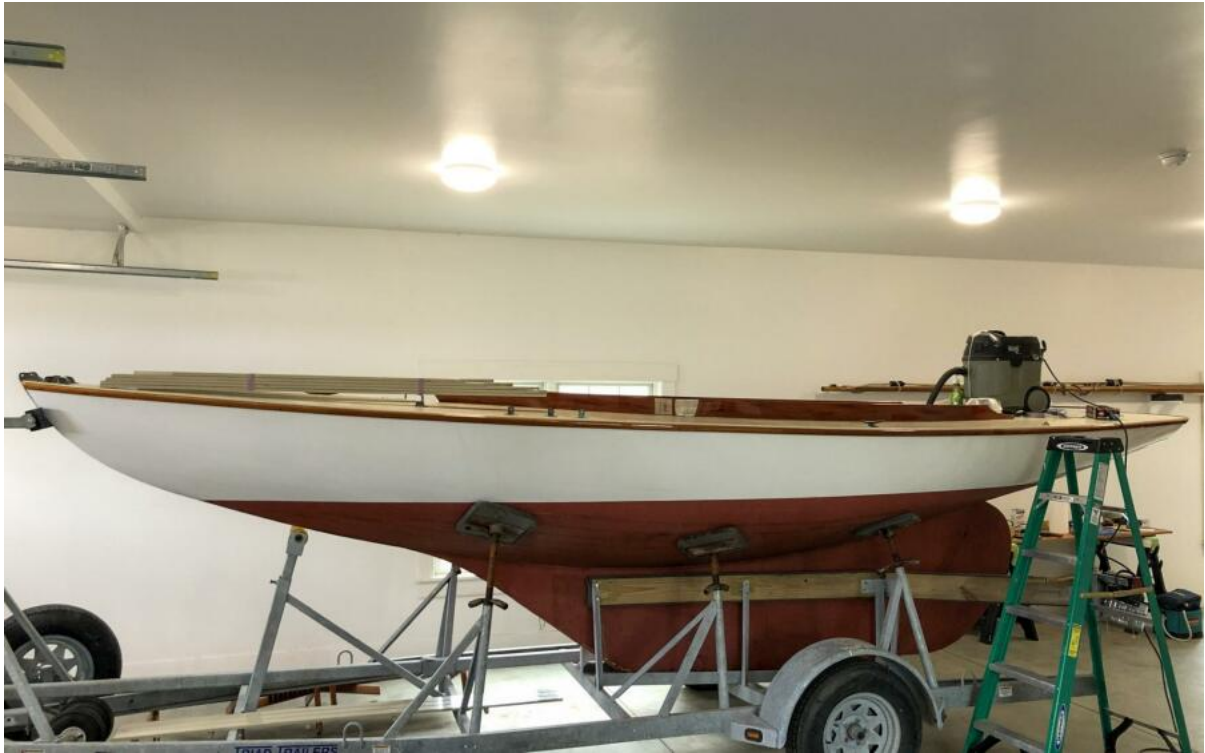
Sparkman And Stephens Manhasset One Design3170