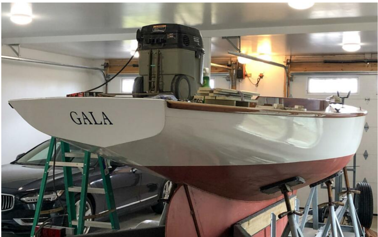
Sparkman And Stephens Manhasset One Design3172