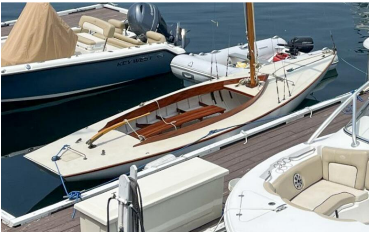
Sparkman And Stephens Manhasset One Design1335