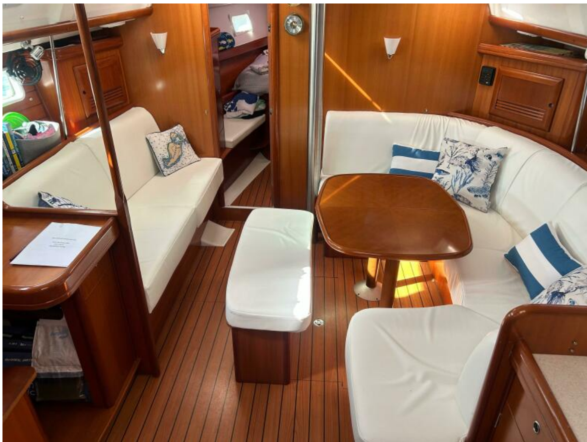
Main Salon Looking Forward