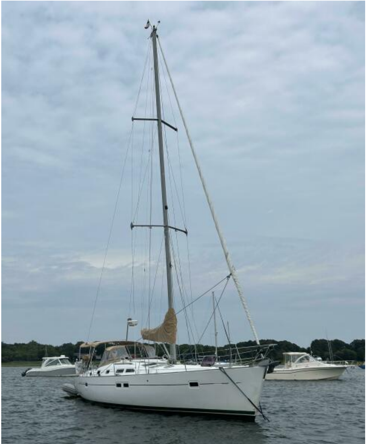
On The Mooring