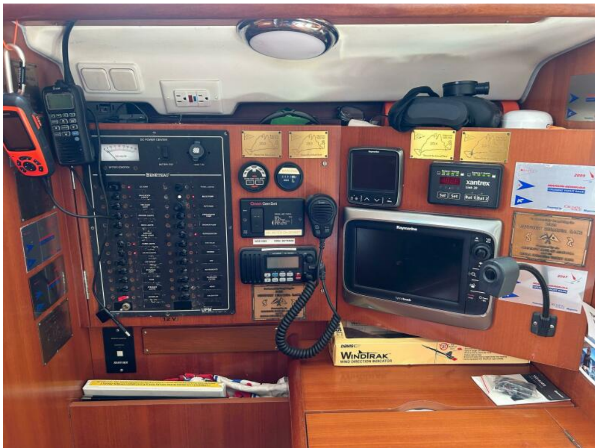
Instruments at Nav Station