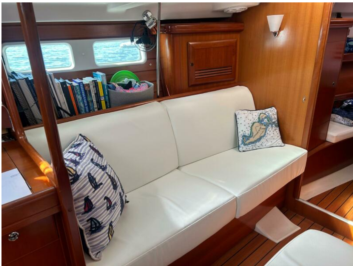
Port Side Settee