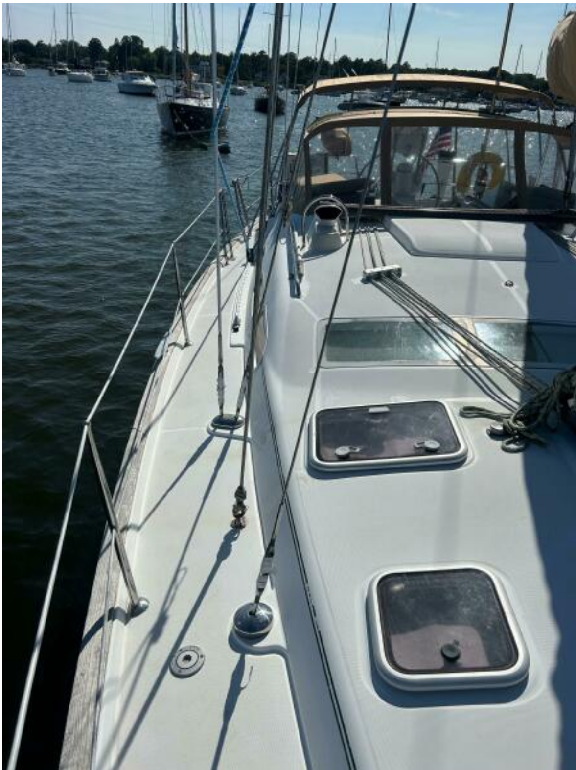
Starboard Run Deck