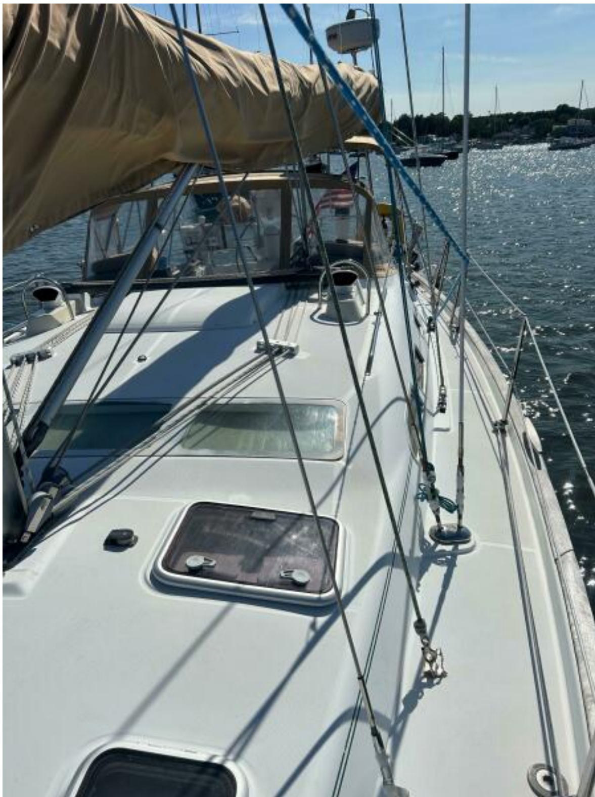
Port Side Run Deck