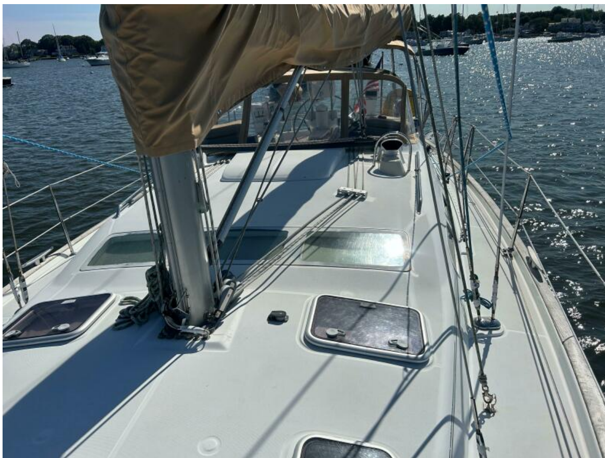
Hatches and Skylights