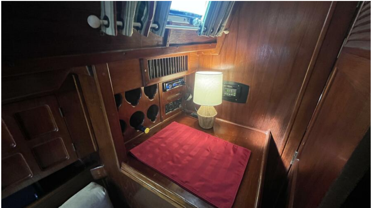
Salon, Port Forward