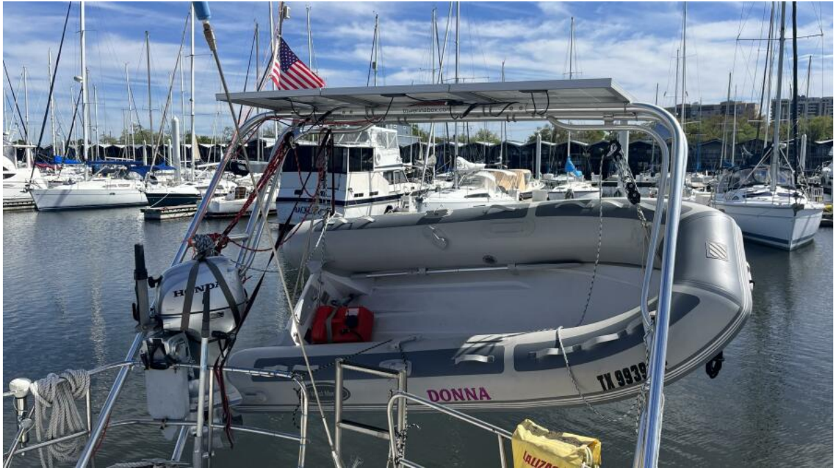
Dinghy, Solar Arch