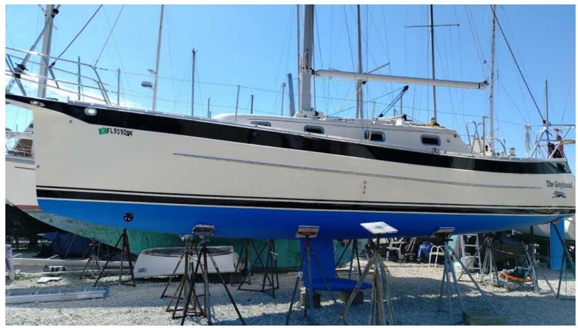
2017 Hake / Seaward 32RK