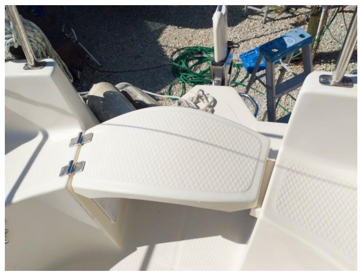
Helm seat opens for walk thru