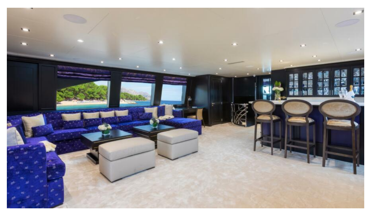
TANZANITE 145' Westship 2004/2023 Skylounge