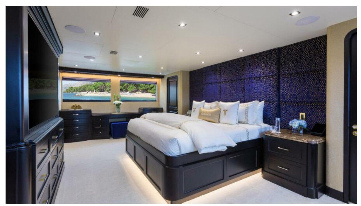
TANZANITE 145' Westship 2004/2023 Master Stateroom