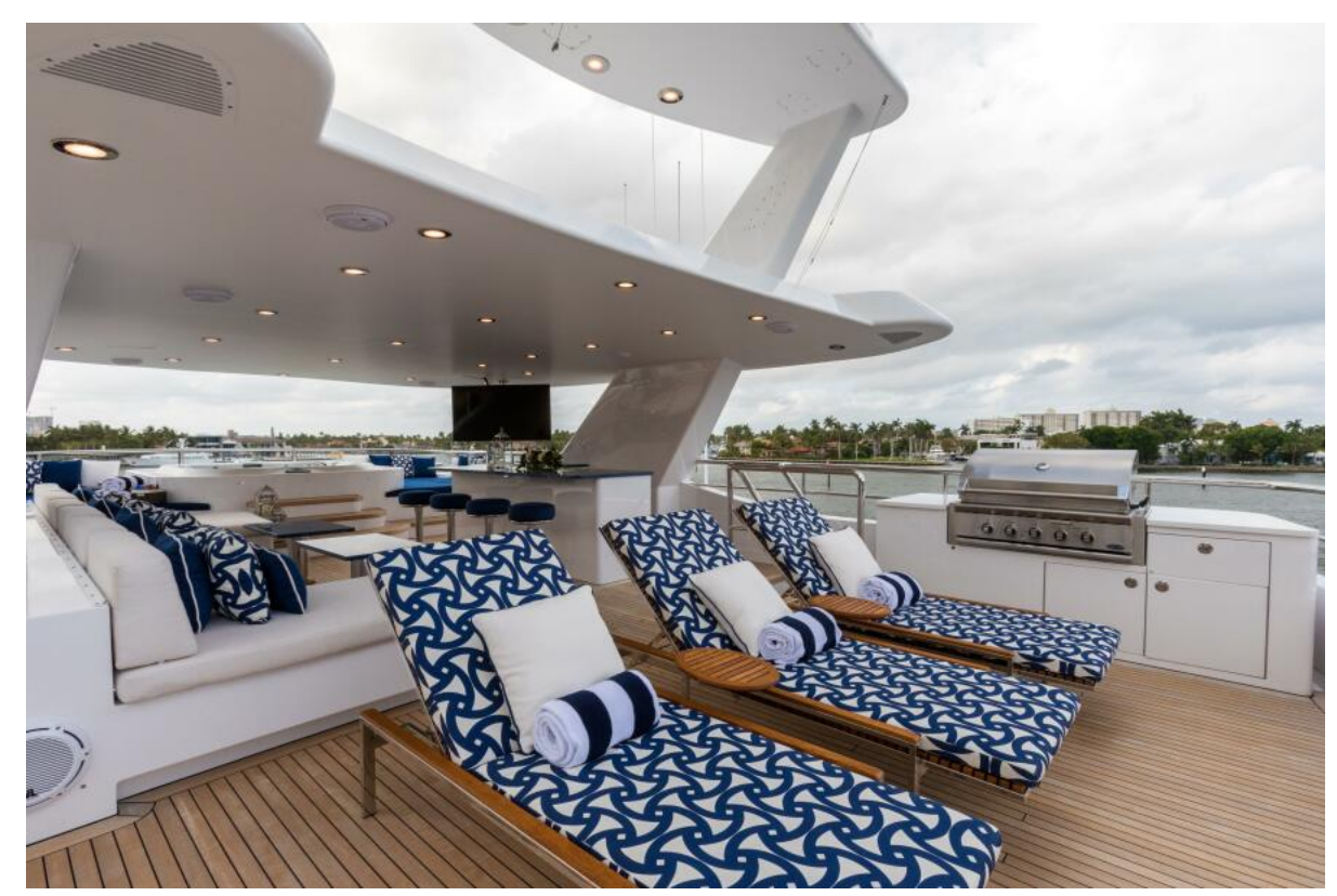
TANZANITE 145' Westship 2004/2023 Sundeck Lounge Area