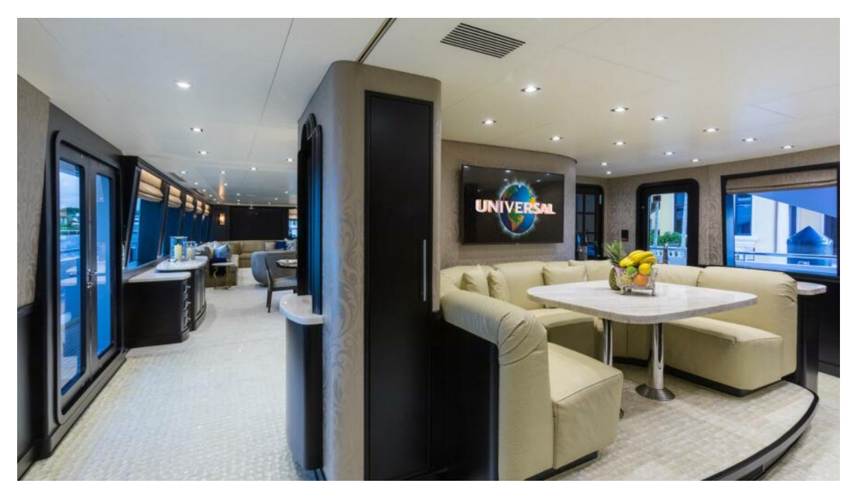
TANZANITE 145' Westship 2004/2023 Galley