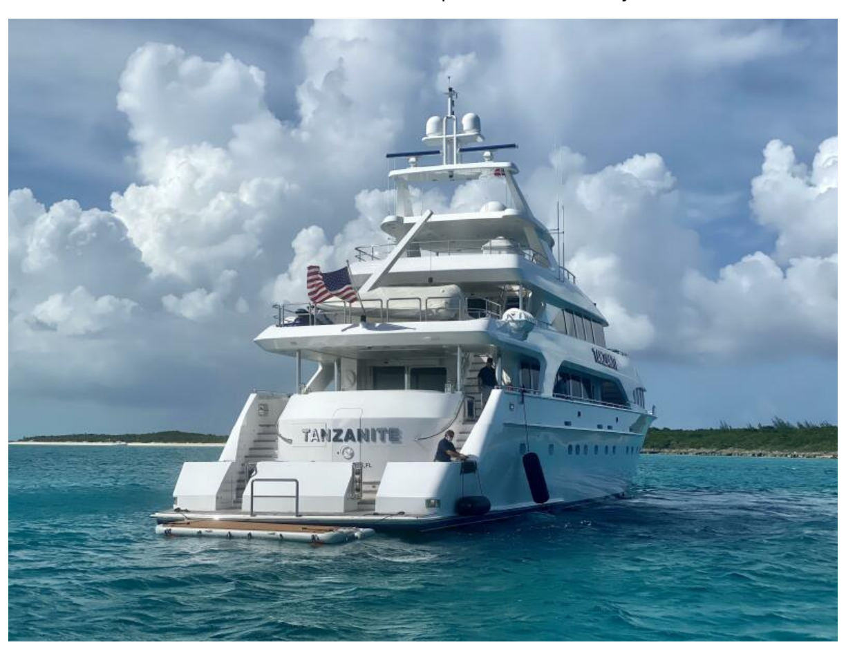
TANZANITE 145' Westship 2004/2023