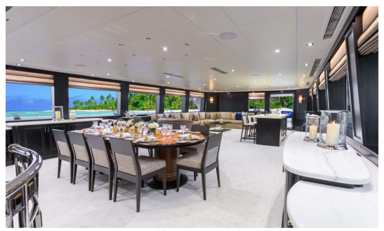
TANZANITE 145' Westship 2004/2023 Main Salon Dining Area