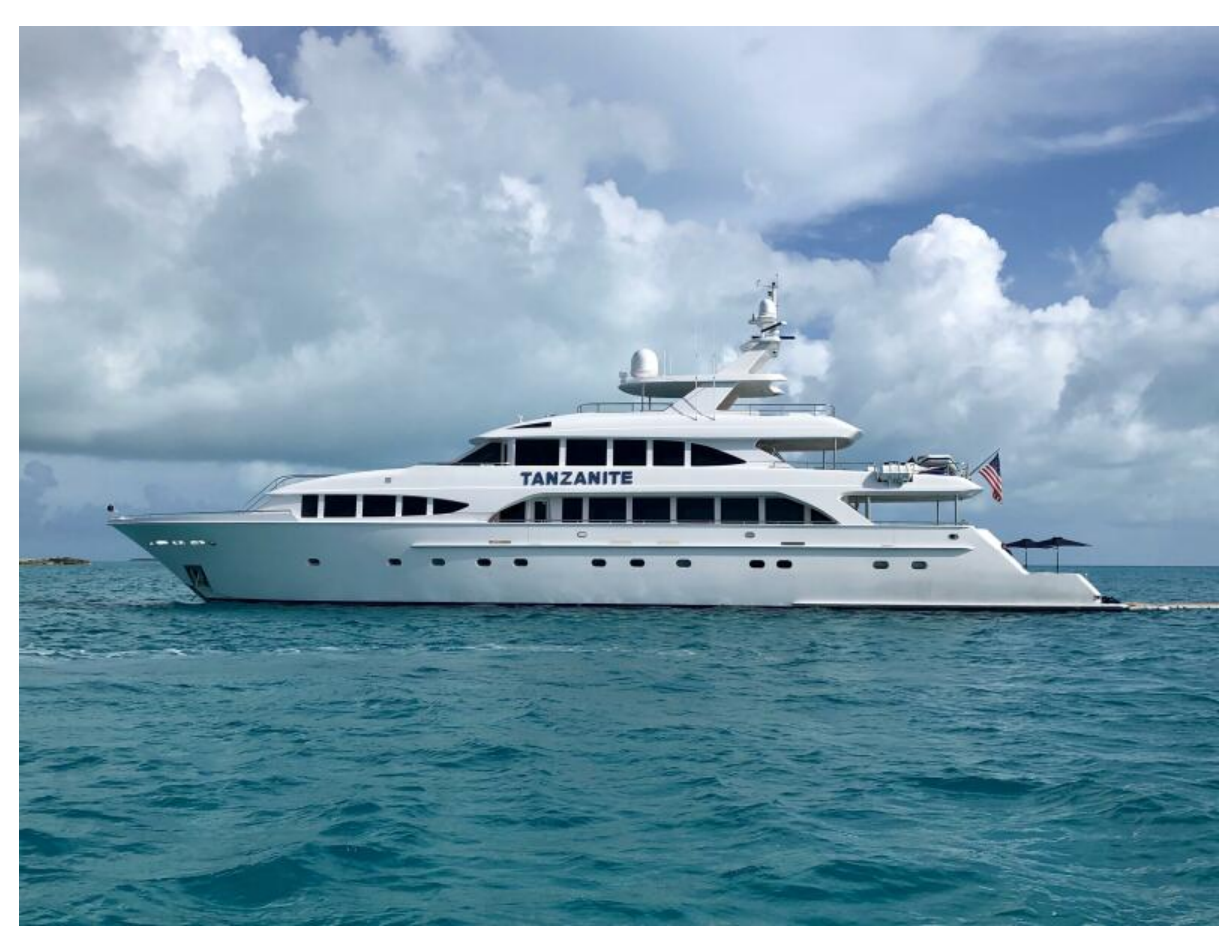
TANZANITE 145' Westship 2004/2023