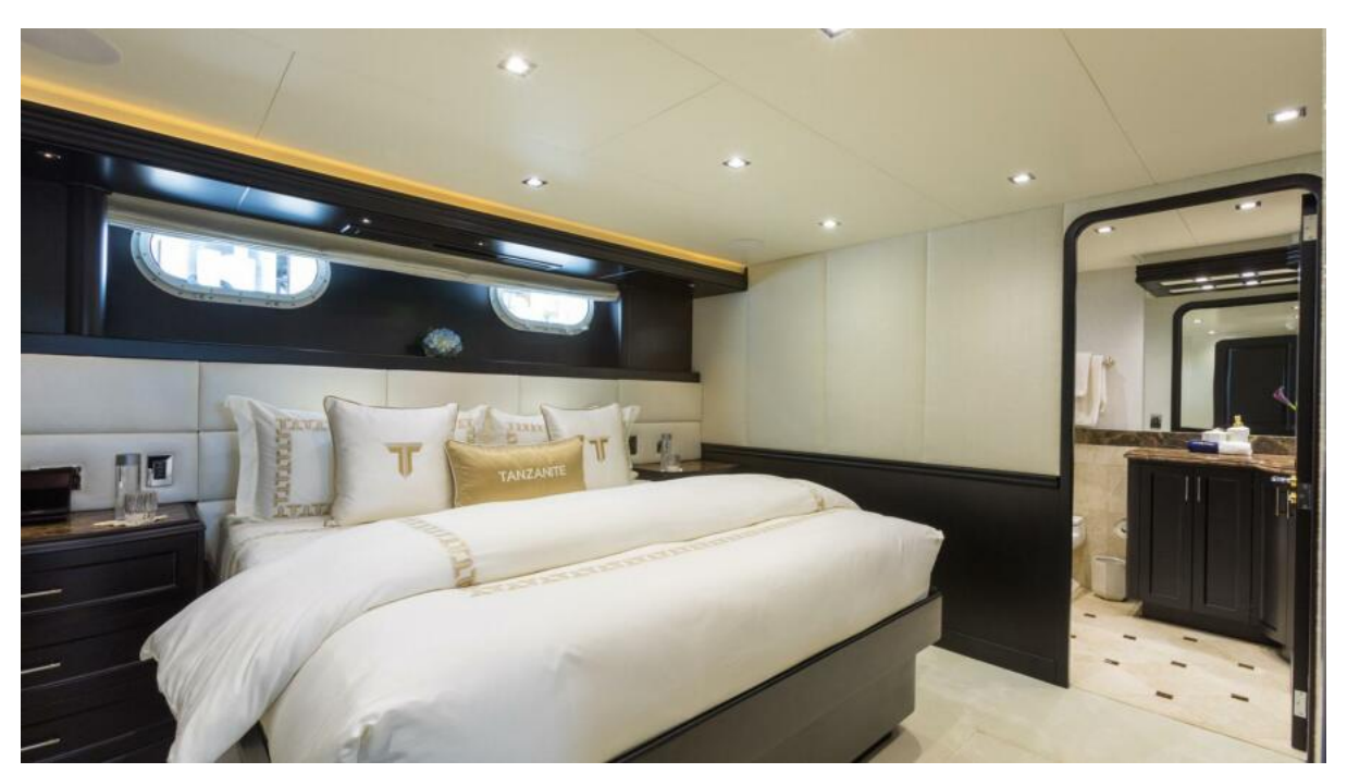
TANZANITE 145' Westship 2004/2023 Guest Stateroom (convertible)