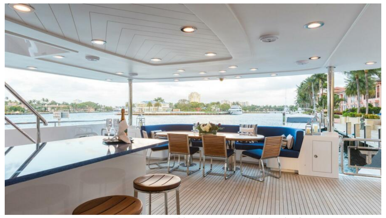
TANZANITE 145' Westship 2004/2023 Main Deck Aft