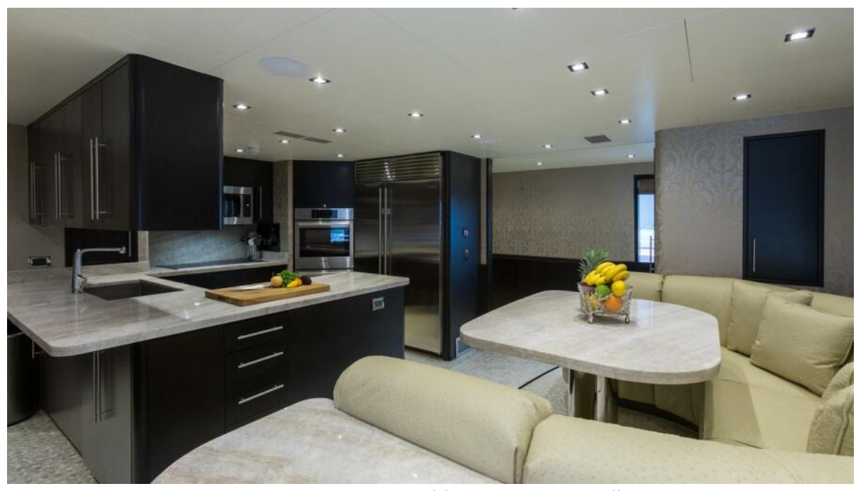
TANZANITE 145' Westship 2004/2023 Galley