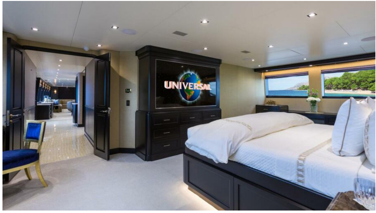
TANZANITE 145' Westship 2004/2023 Master Stateroom