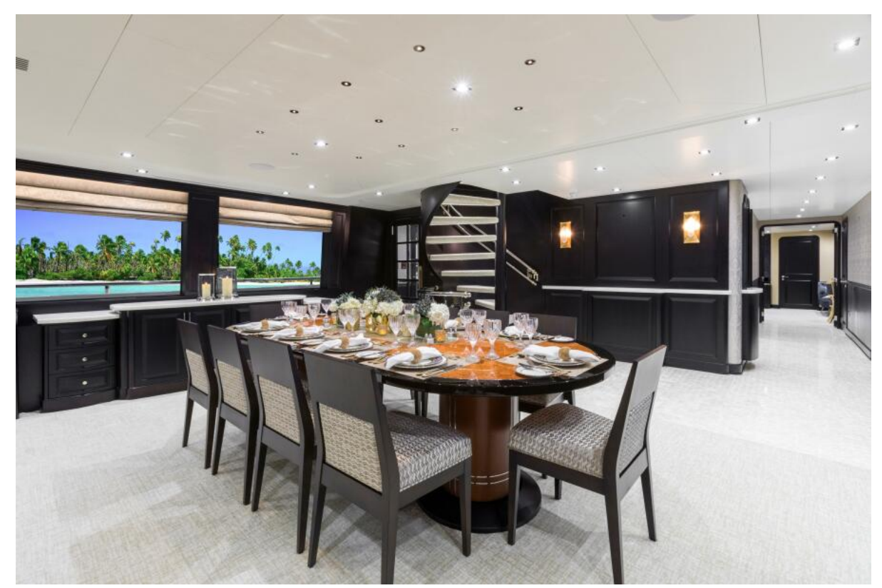
TANZANITE 145' Westship 2004/2023 Main Salon Dining Area