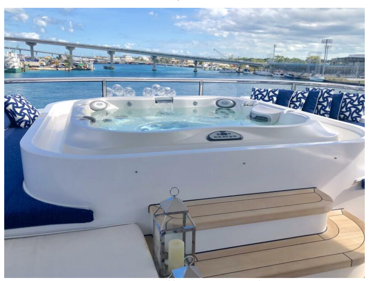
TANZANITE 145' Westship 2004/2023 Jacuzzi/Lounge