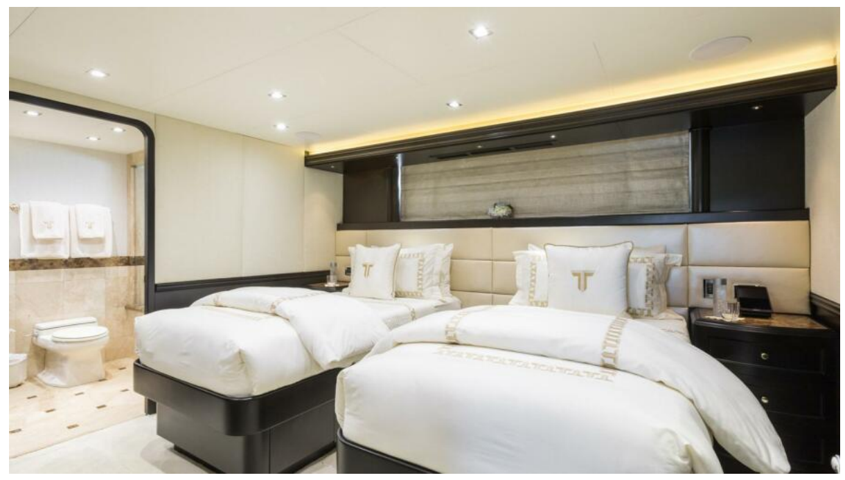
TANZANITE 145' Westship 2004/2023 Guest Stateroom (convertible)