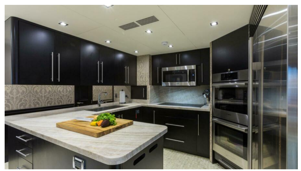
TANZANITE 145' Westship 2004/2023 Galley