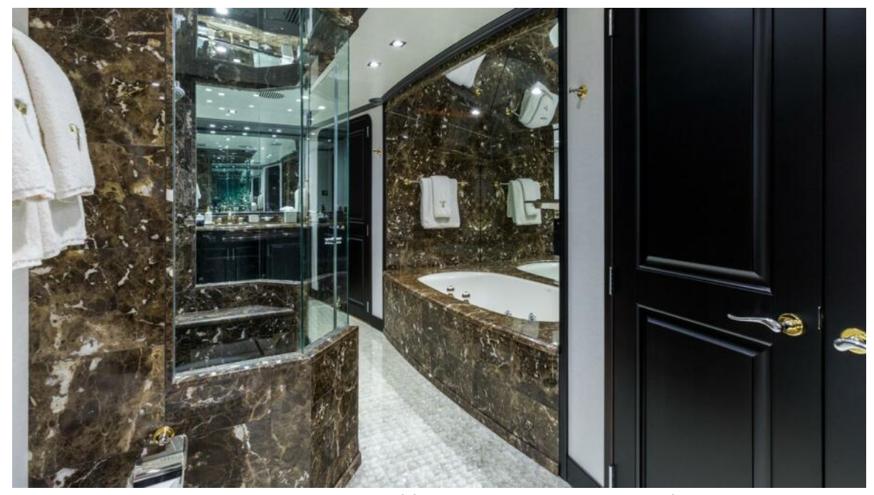
TANZANITE 145' Westship 2004/2023 Master Ensuite