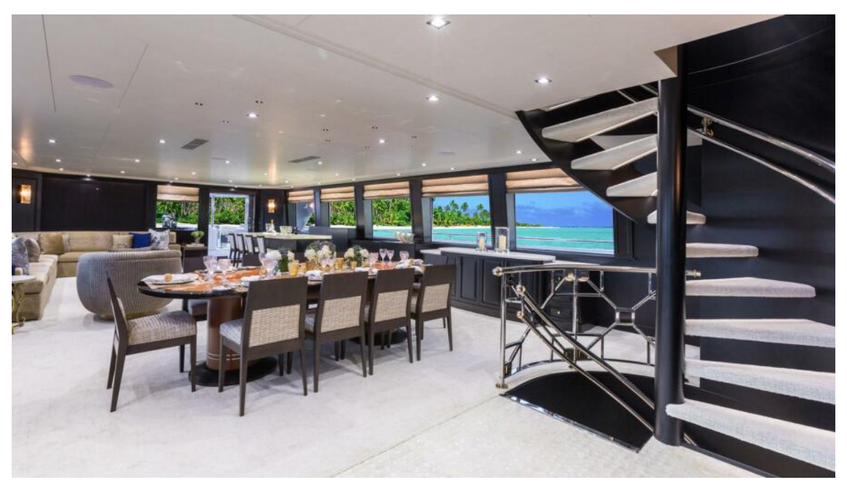
TANZANITE 145' Westship 2004/2023 Main Salon