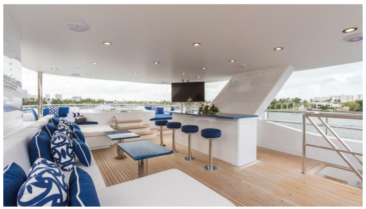
TANZANITE 145' Westship 2004/2023 Sundeck