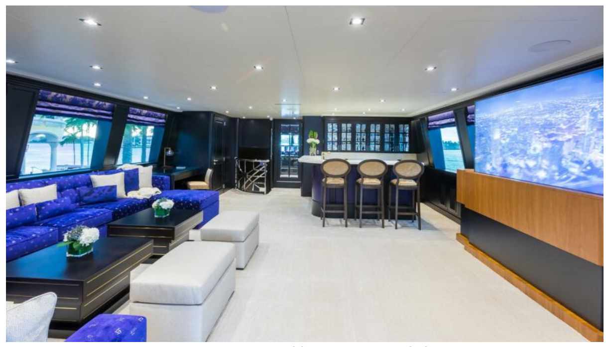
TANZANITE 145' Westship 2004/2023 Skylounge