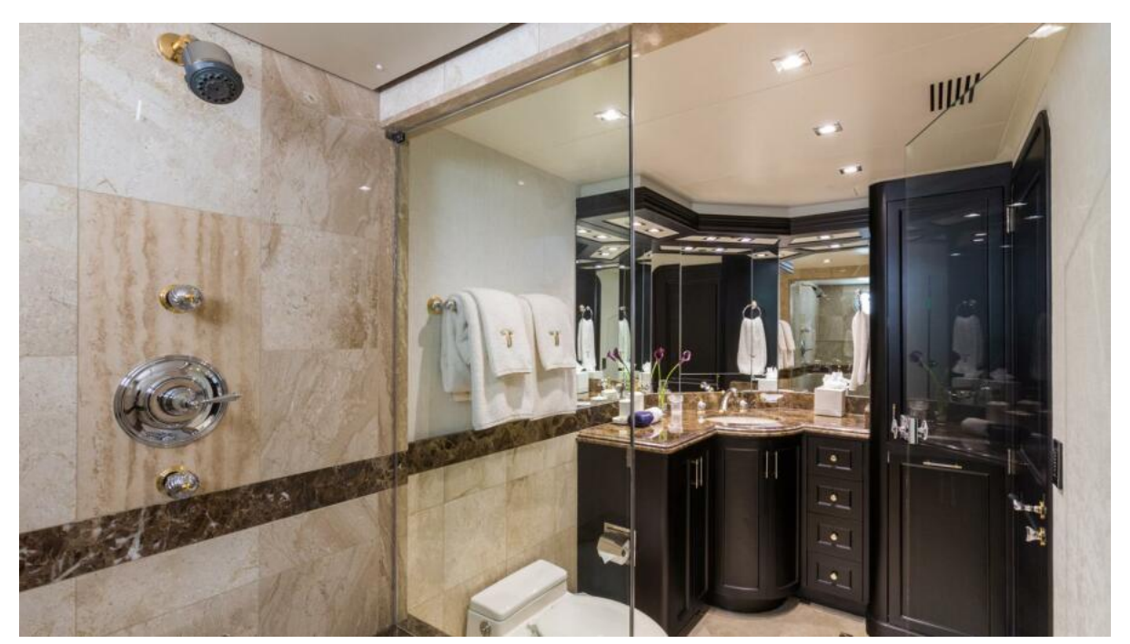
TANZANITE 145' Westship 2004/2023 Guest Ensuite