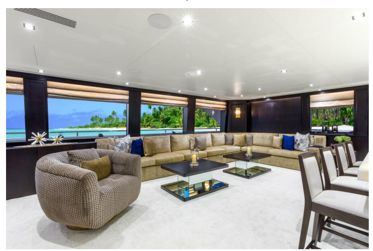
TANZANITE 145' Westship 2004/2023 Main Salon