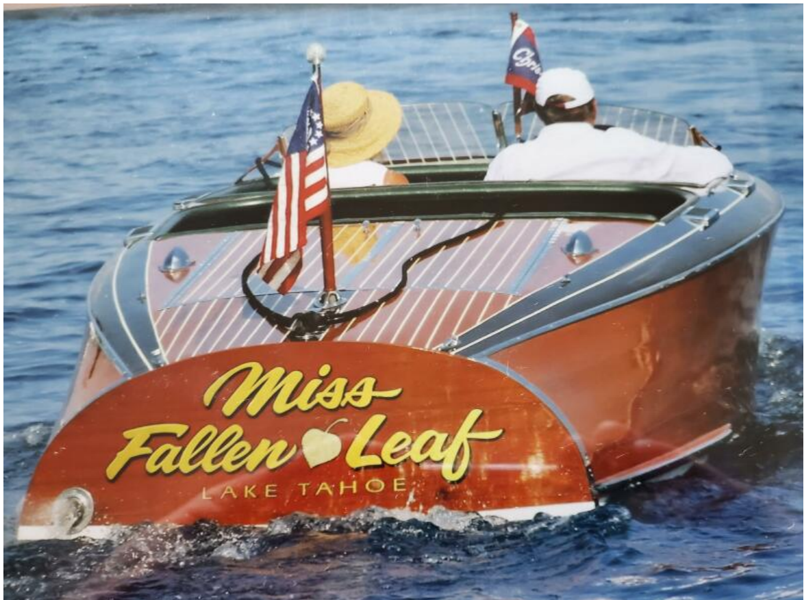
Name and Hailing Port