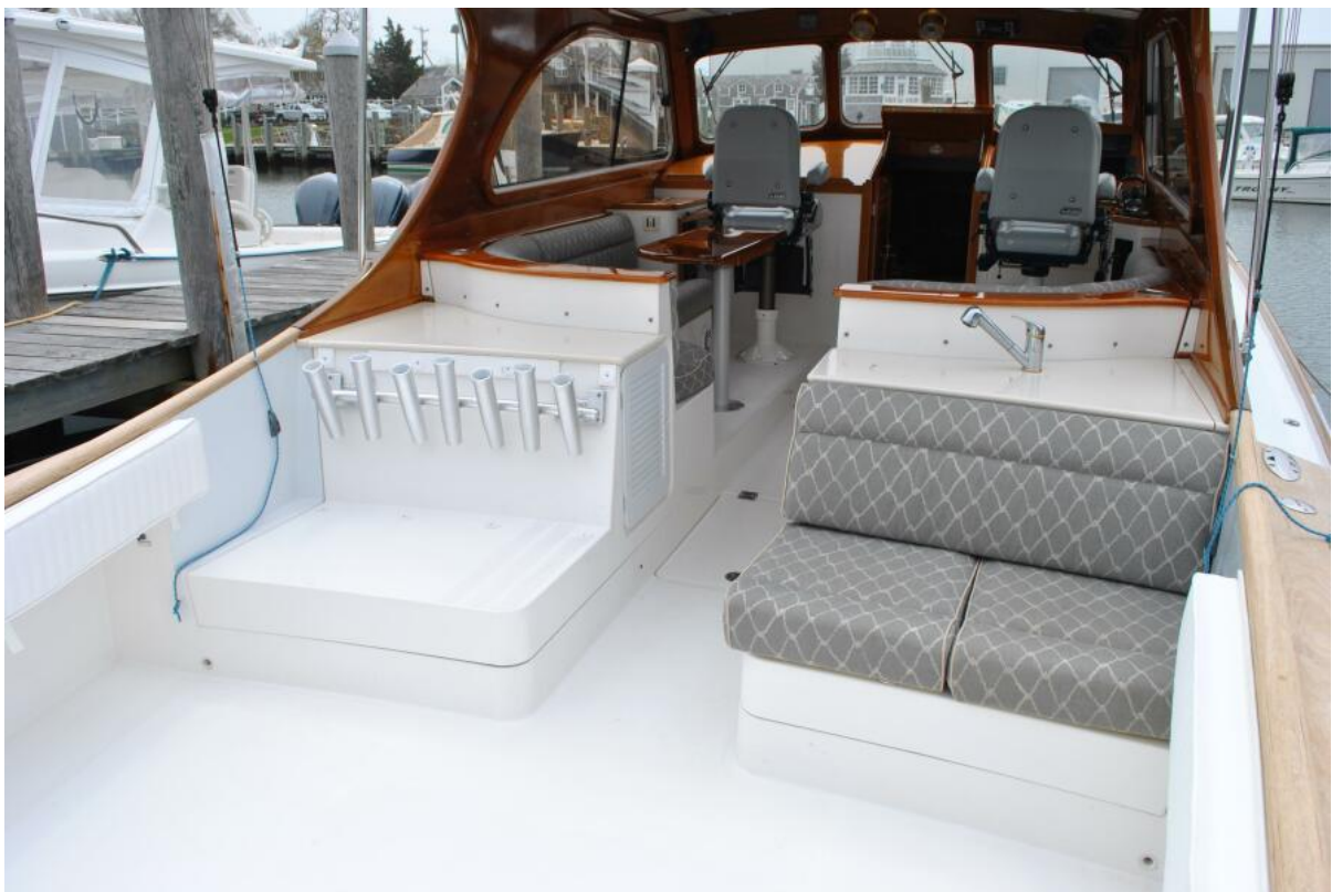
Cockpit Fishing Set Up