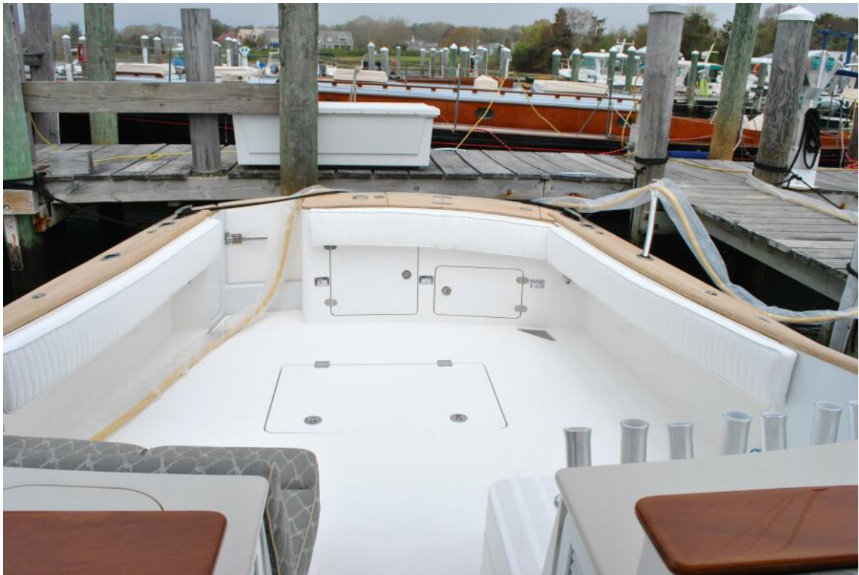
Cockpit Fishing Set Up