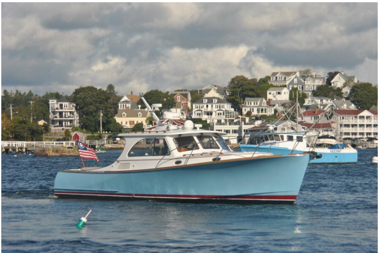
Starboard Bow Profile