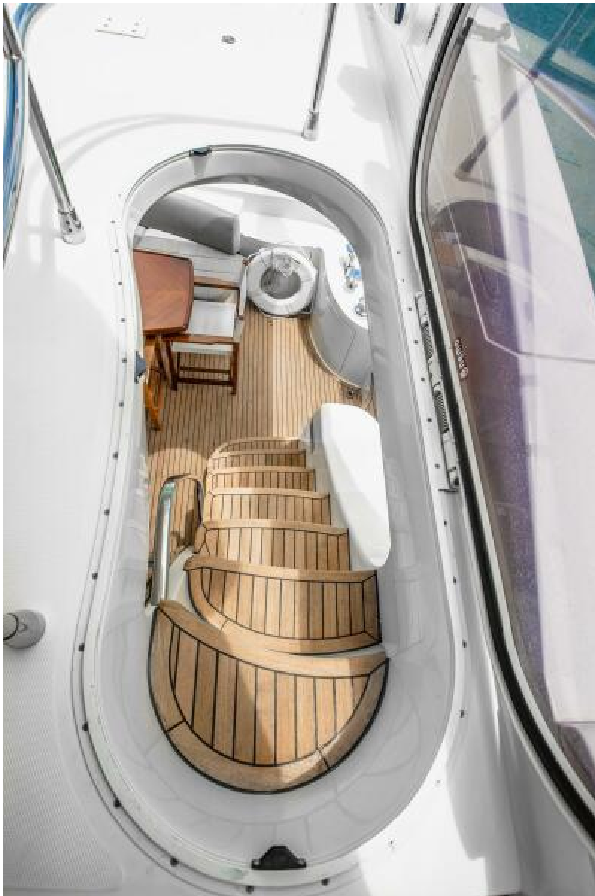
Stairway to Flybridge