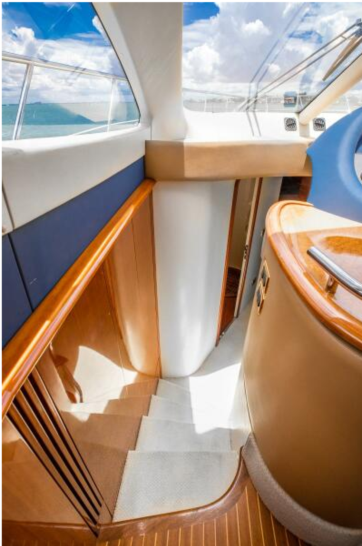
Stairway to Lower Deck