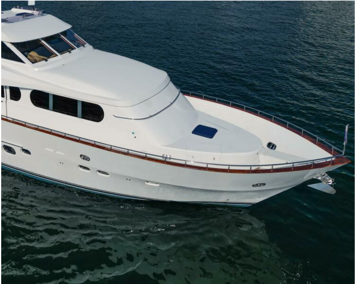
Profile Profile of Bow