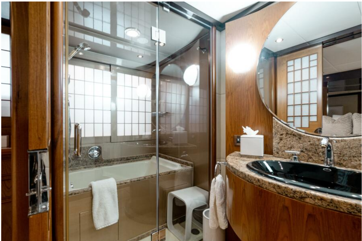
Master Cabin Ensuite Master Cabin Ensuite with Tub