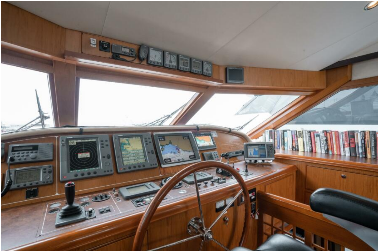
Bridge Deck Bridge Deck