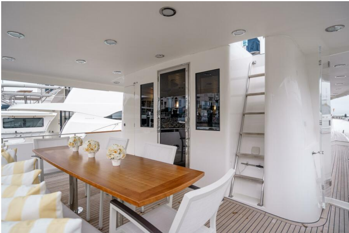
Main Deck Aft Main Deck Aft