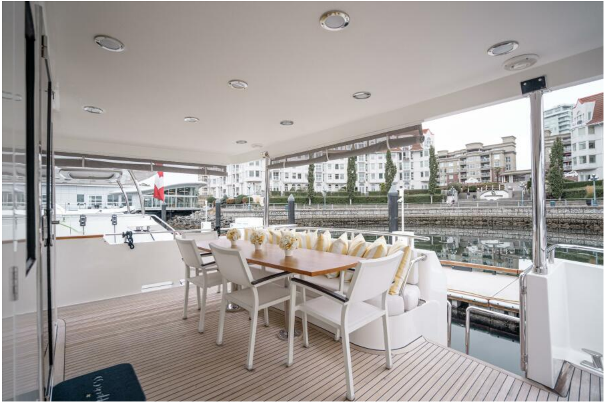
Main Deck Aft Main Deck Aft