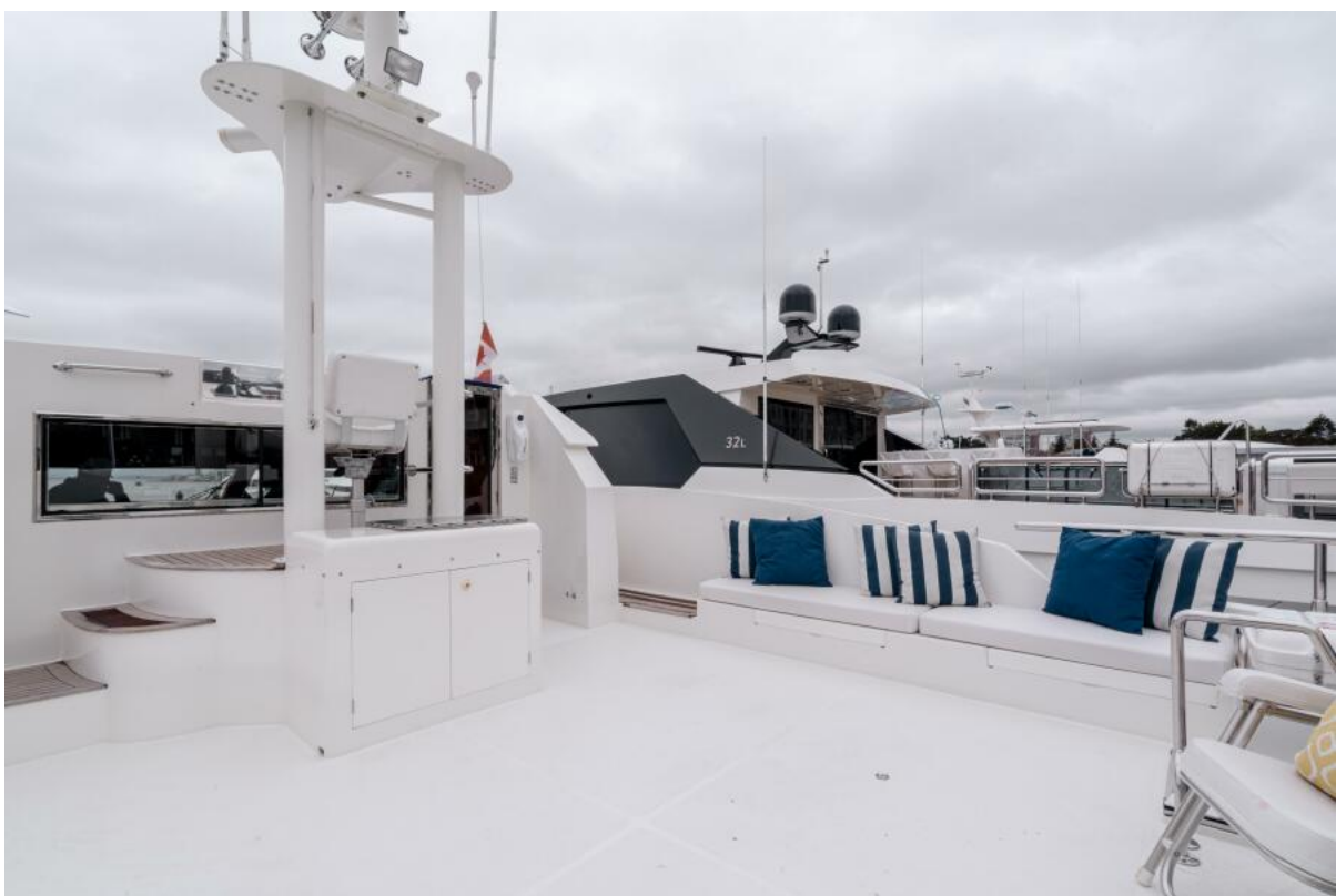
Sun Deck Sun Deck