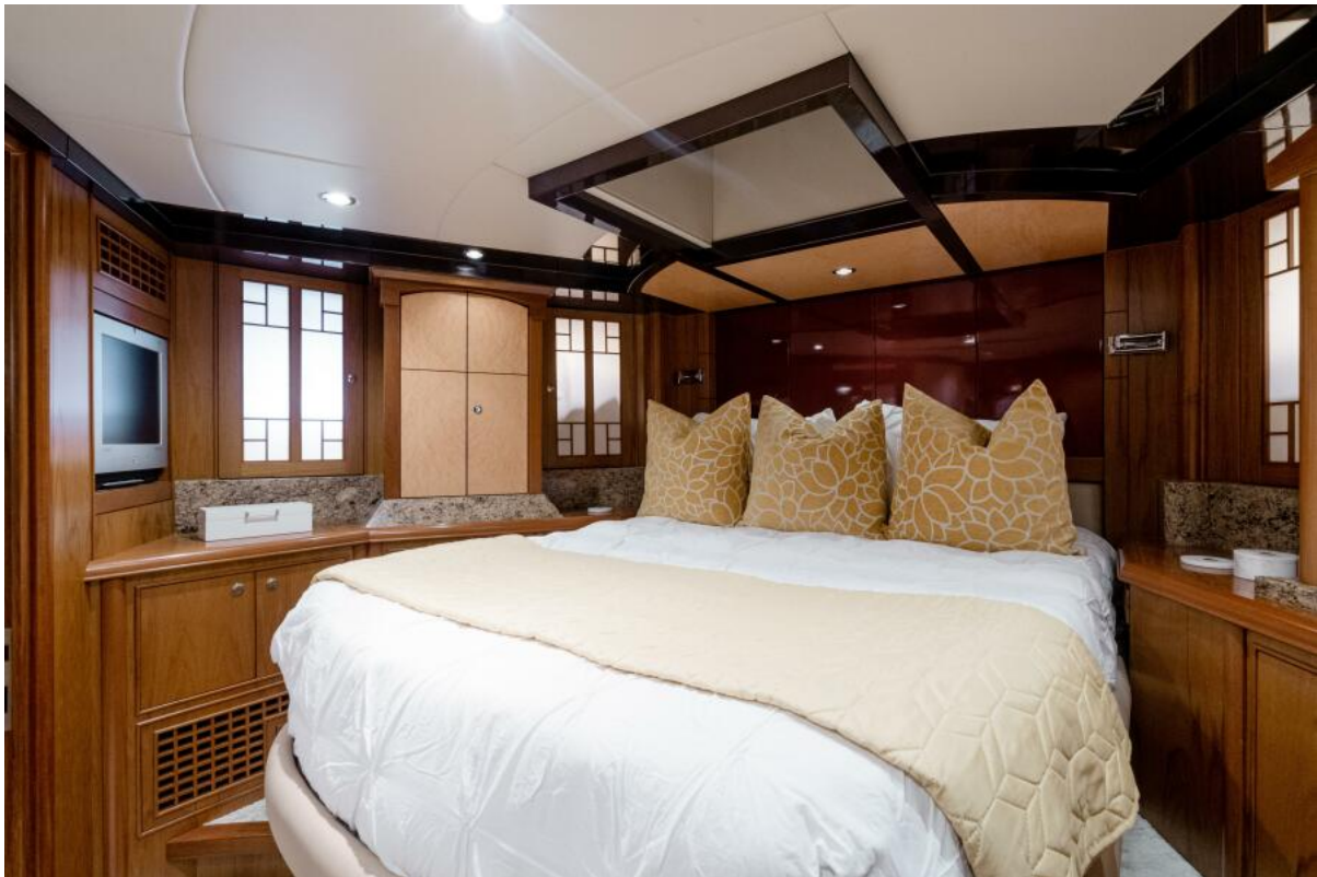
VIP Cabin VIP Cabin