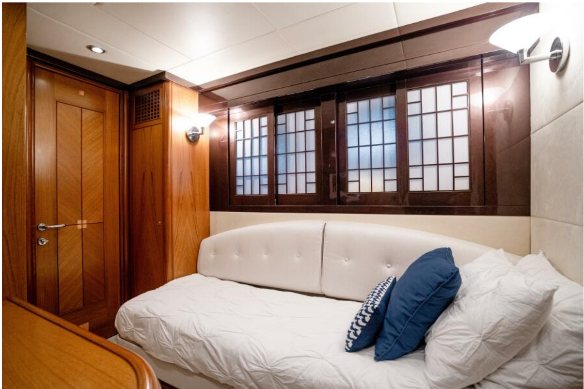
Study / Port Side Guest Cabin Study / Port Side Guest Cabin