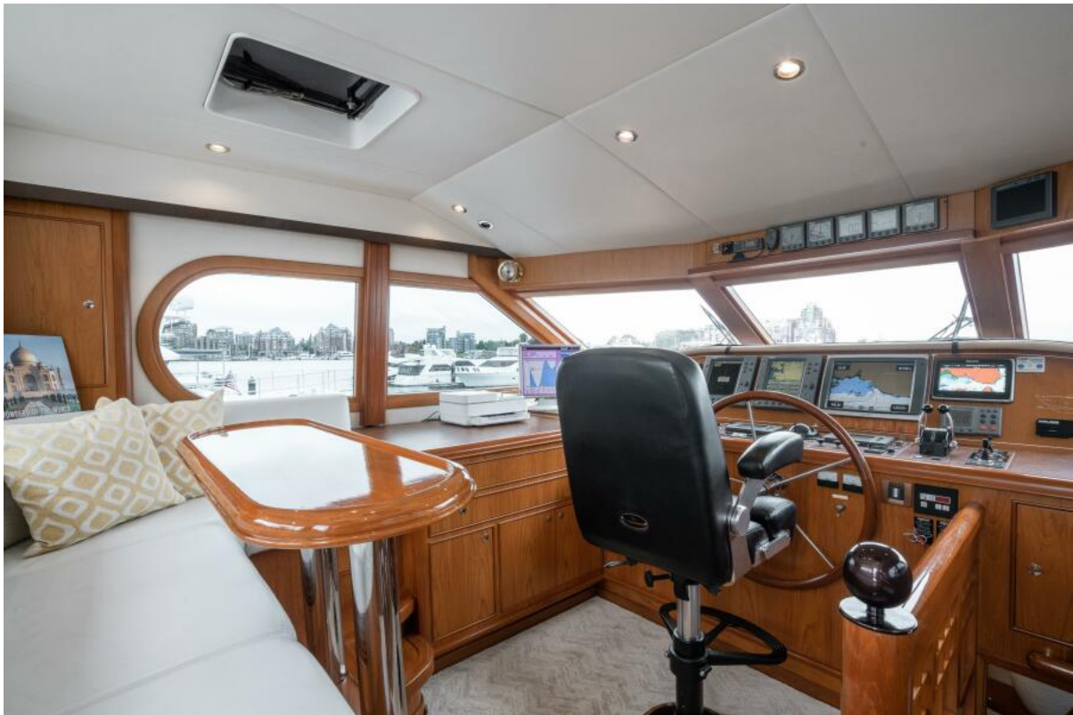
Bridge Deck Bridge Deck