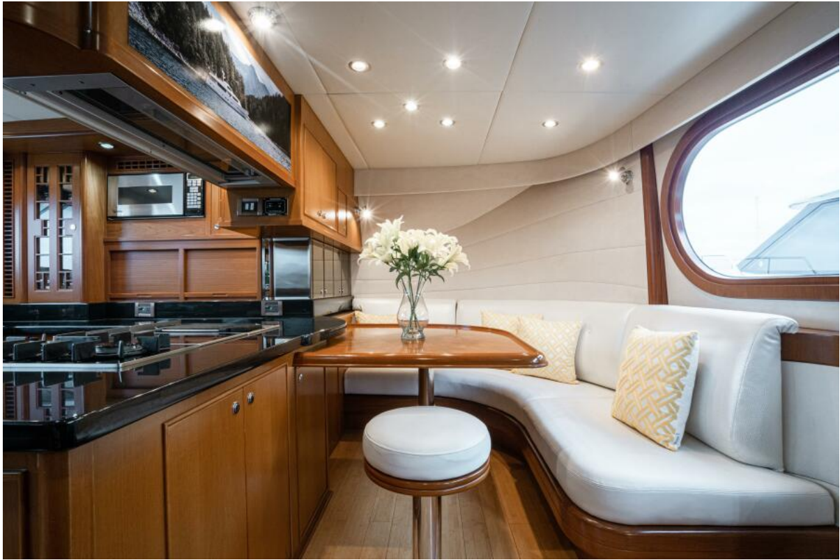
Informal Dining Area Informal Dining Area