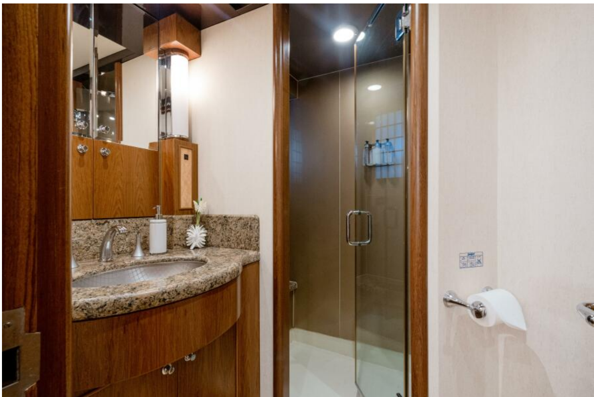
Starboard Guest Cabin Ensuite Starboard Guest Cabin Ensuite