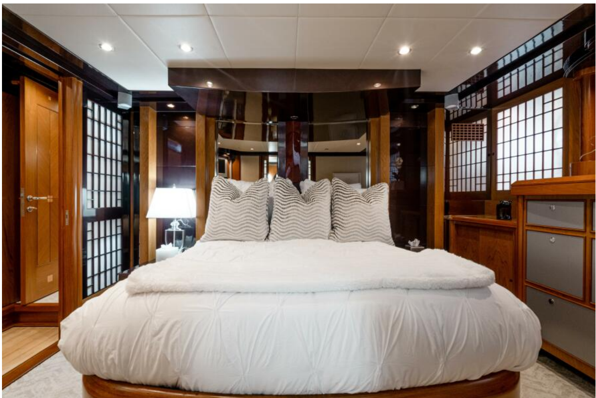
Master Cabin Master Cabin