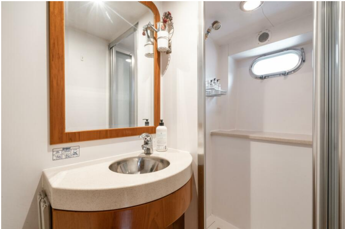
Crew Cabin Ensuite Crew Cabin Ensuite