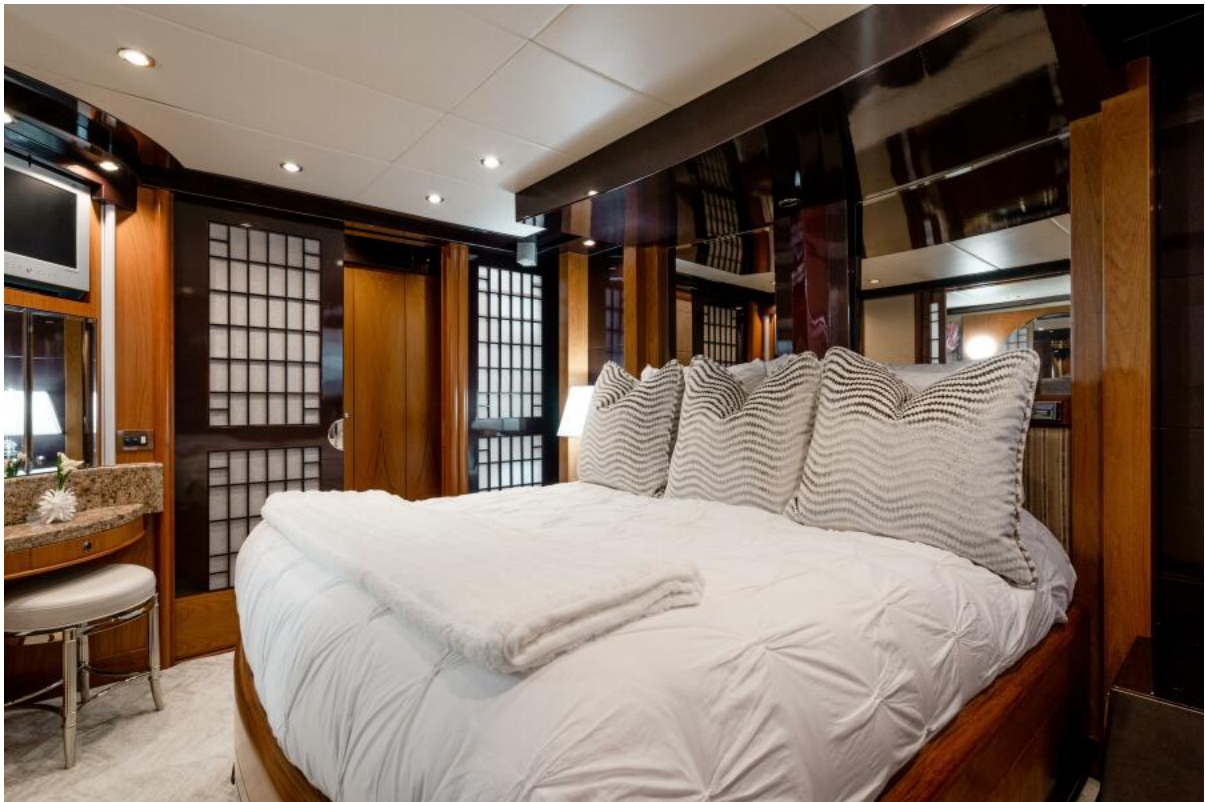
Master Cabin Master Cabin