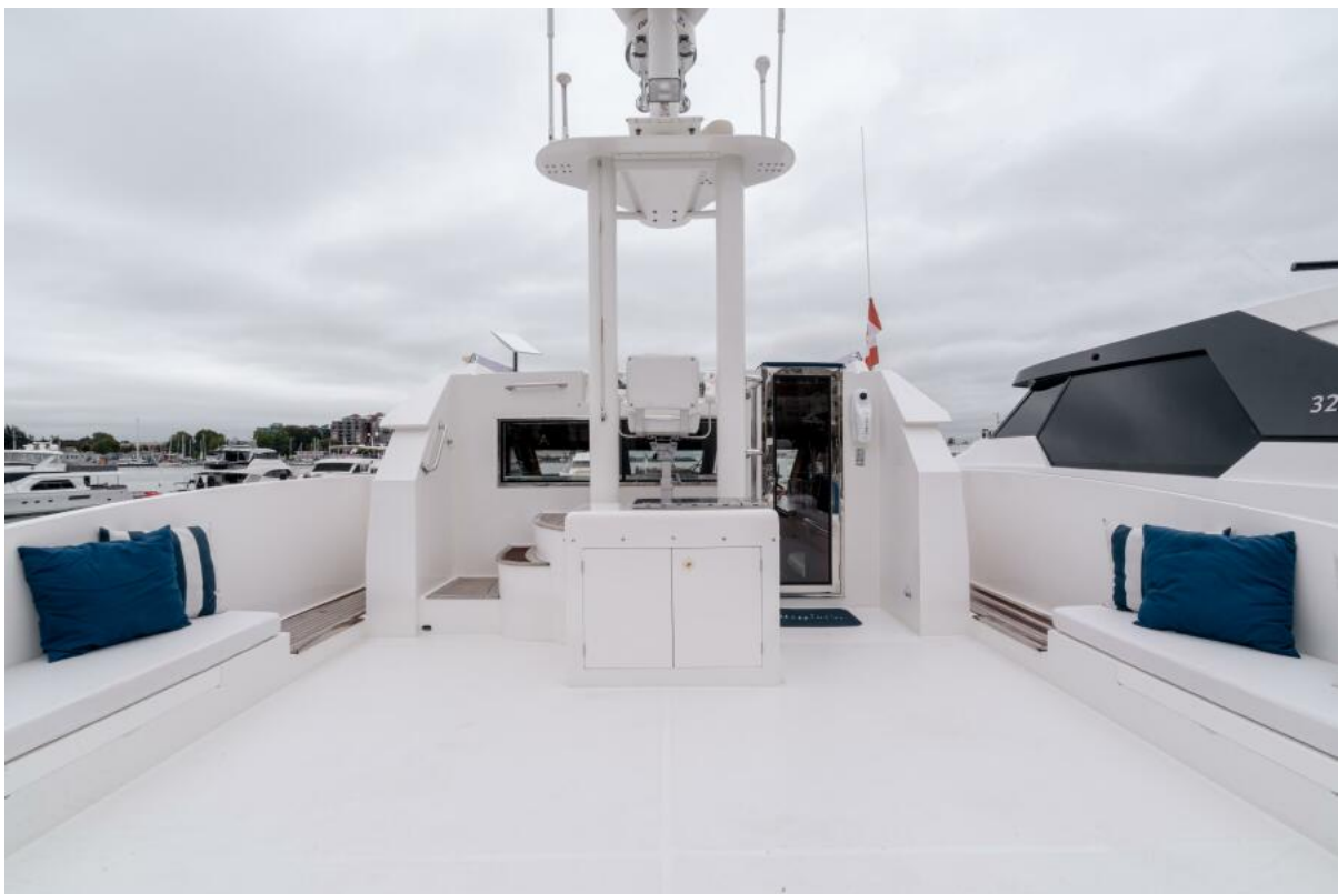
Sun Deck Sun Deck