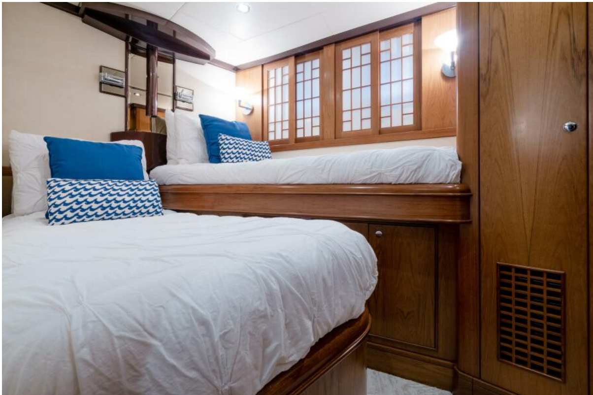
Starboard Guest Cabin Starboard Guest Cabin