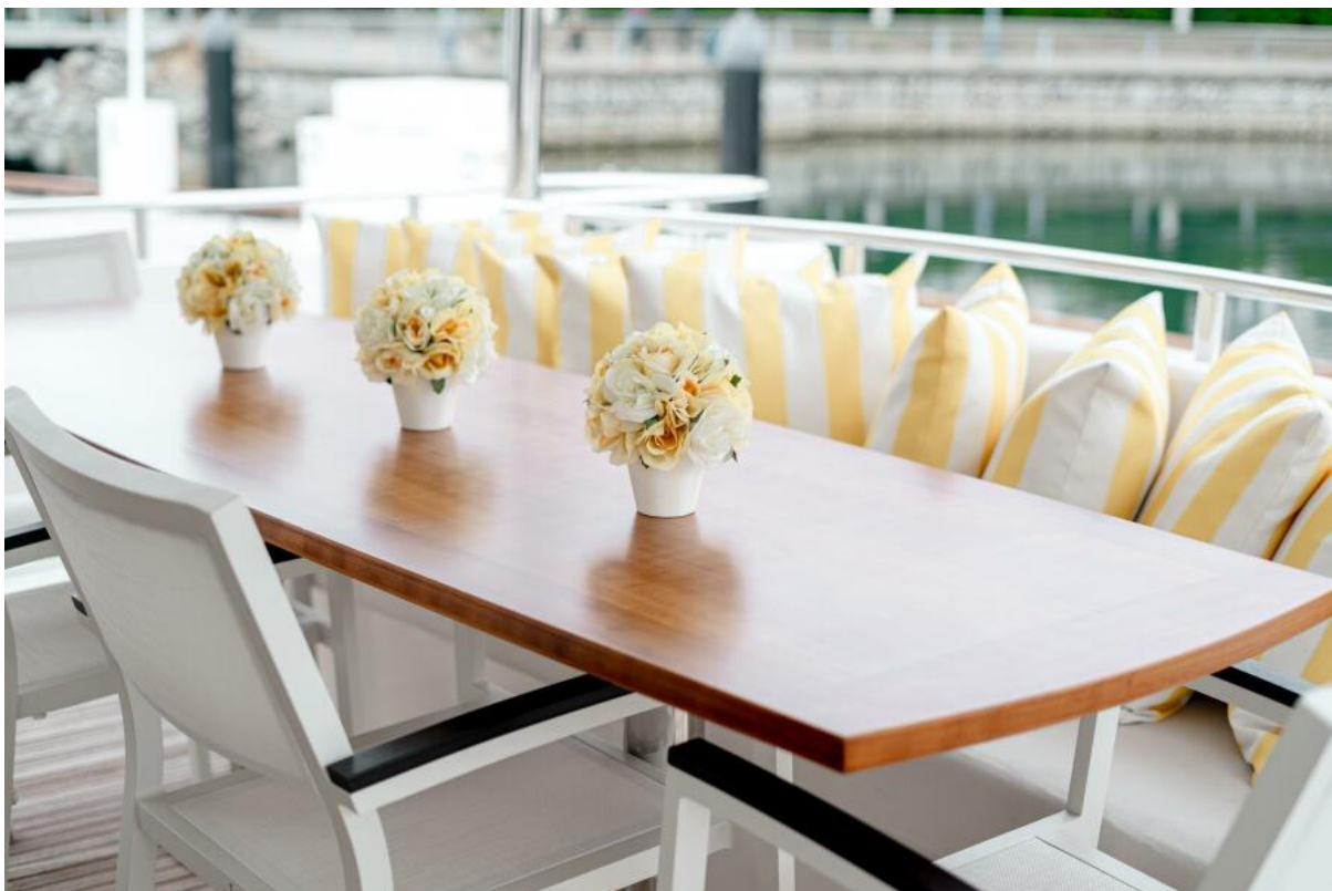
Main Deck Aft Main Deck Aft