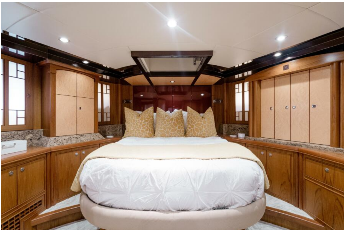
VIP Cabin VIP Cabin