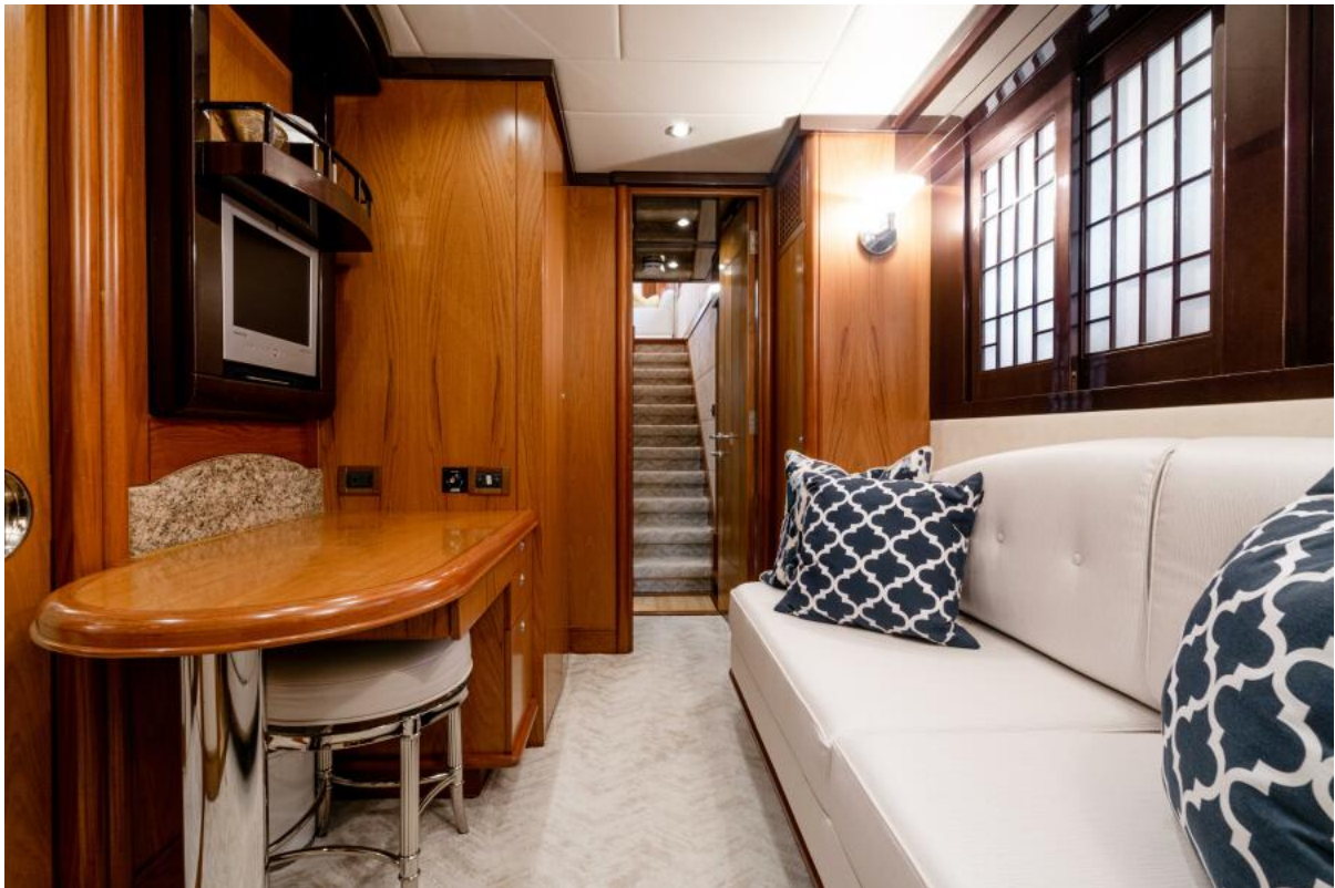
Study / Port Side Guest Cabin Study / Port Side Guest Cabin with spare washer and dryer unit in closet