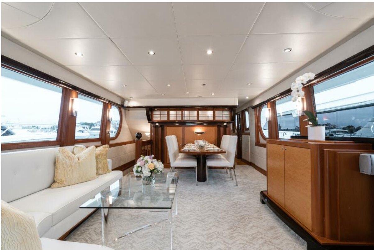
Main Salon Main Salon