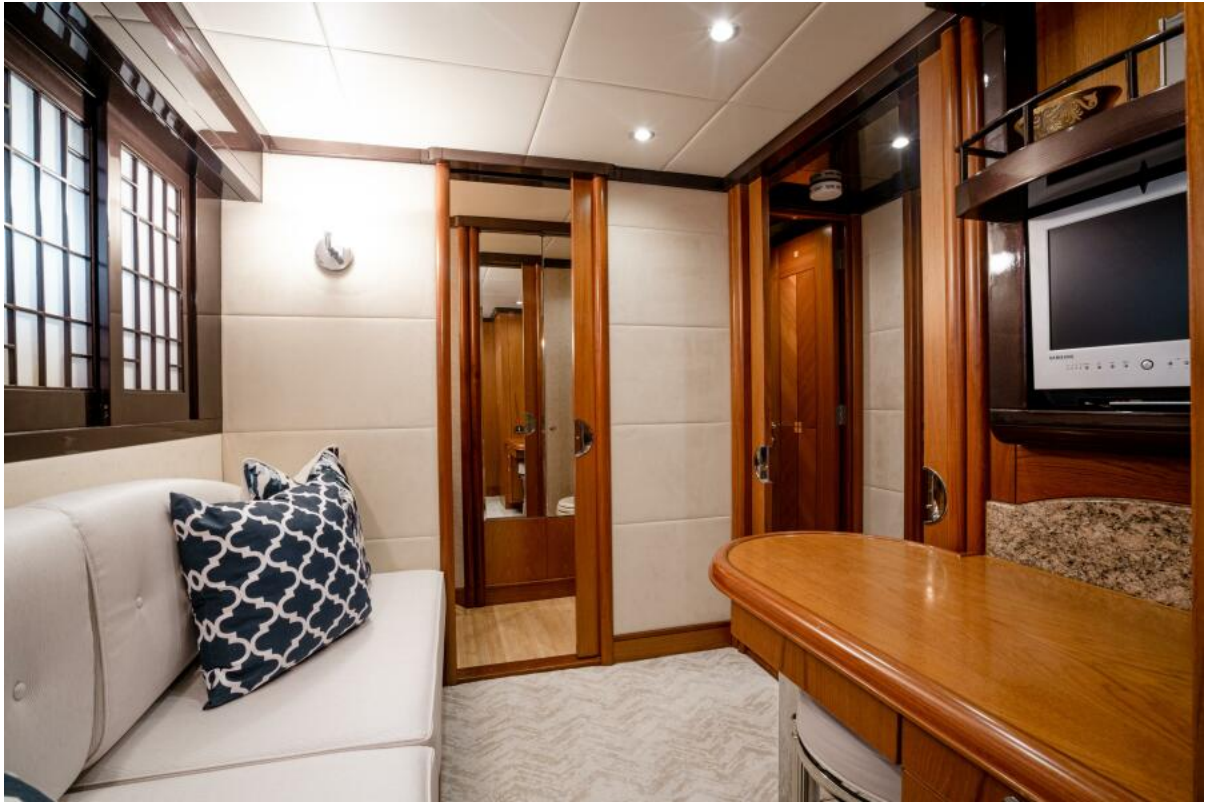
Study / Port Side Guest Cabin Study / Port Side Guest Cabin with Ensuite head