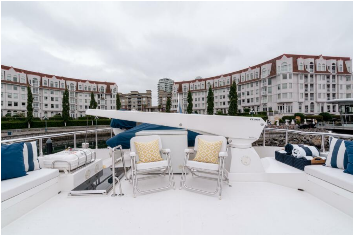
Sun Deck Sun Deck