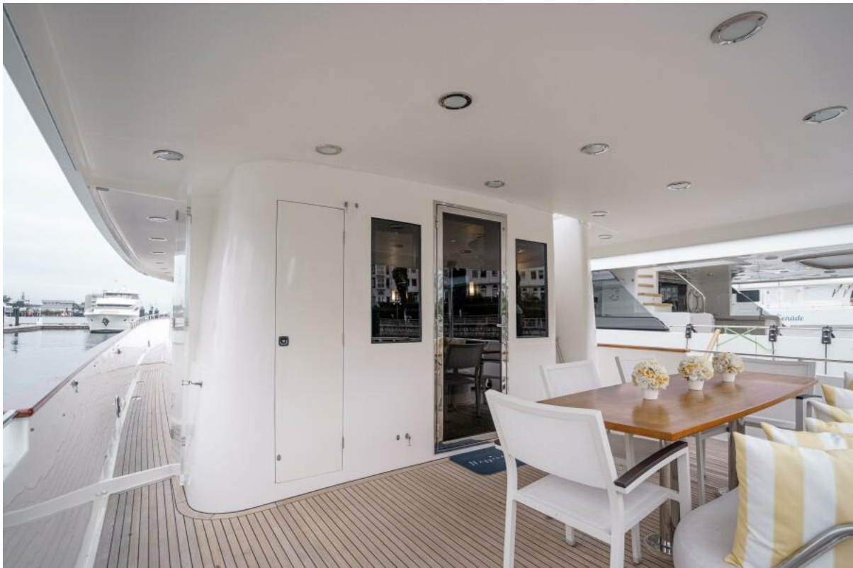
Main Deck Aft Main Deck Aft