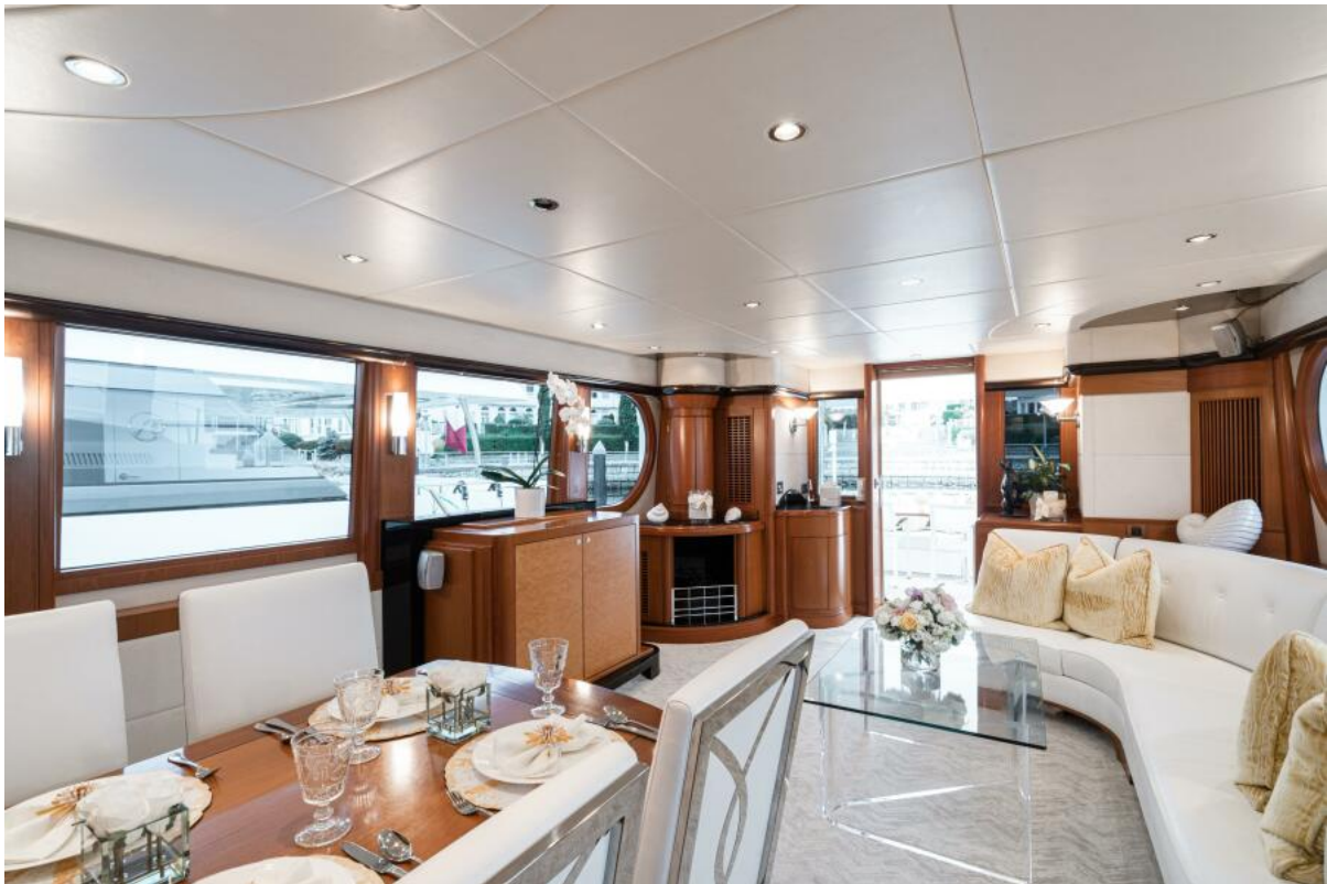
Main Salon Main Salon