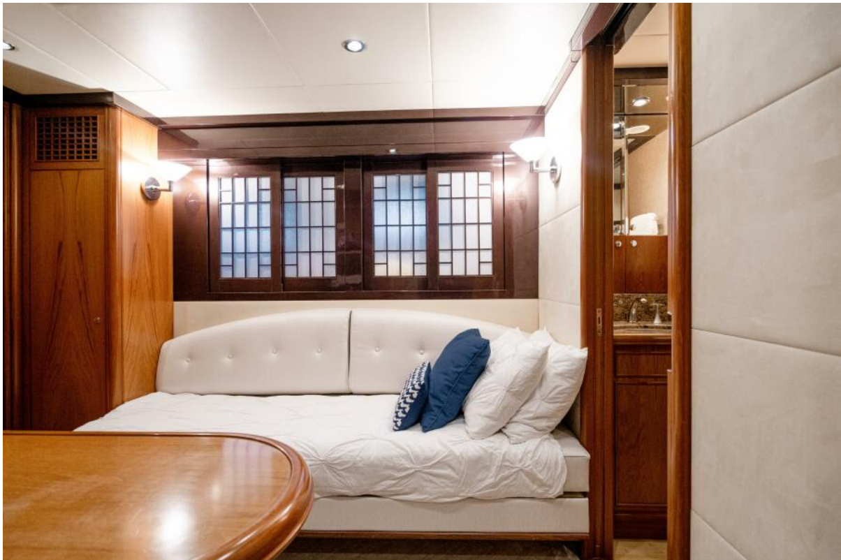
Study / Port Side Guest Cabin Study / Port Side Guest Cabin with Convertible berth