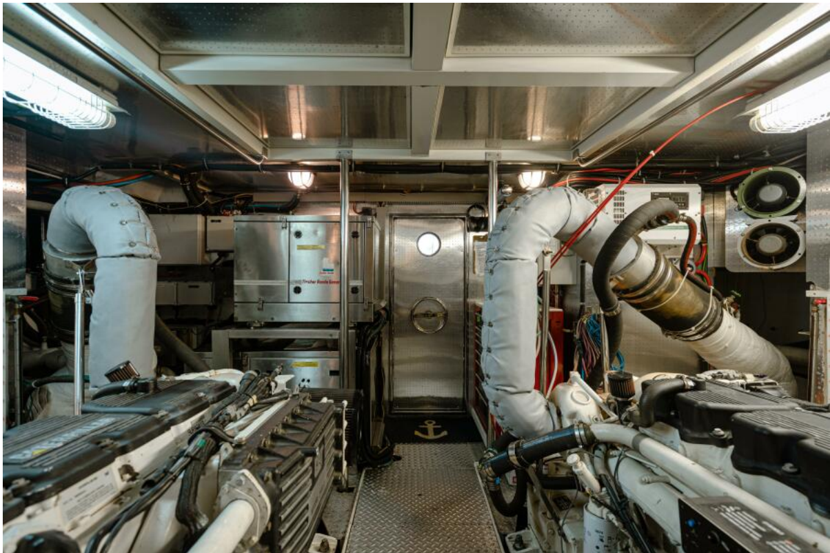
Engine Room Engine Room