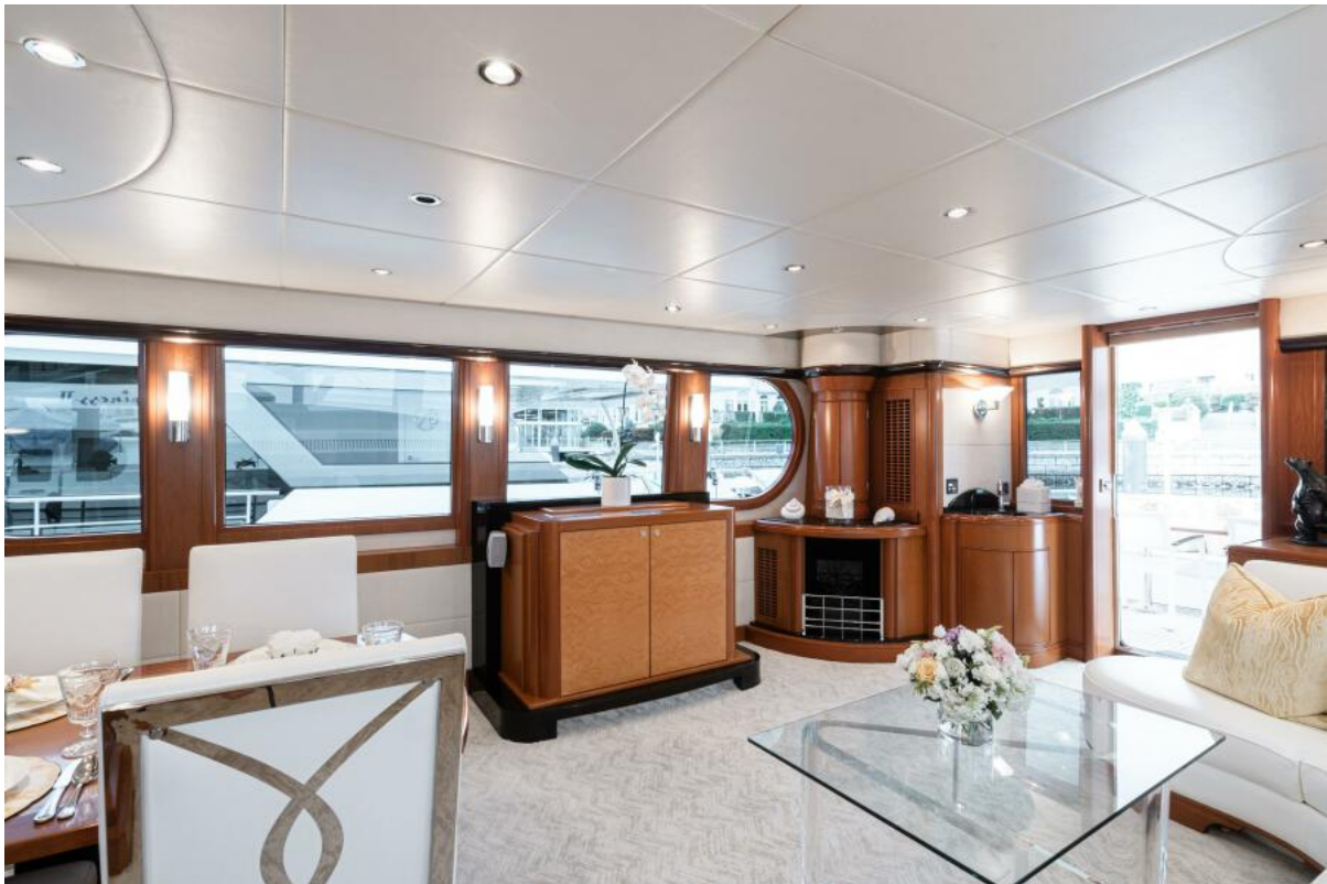
Main Salon Main Salon