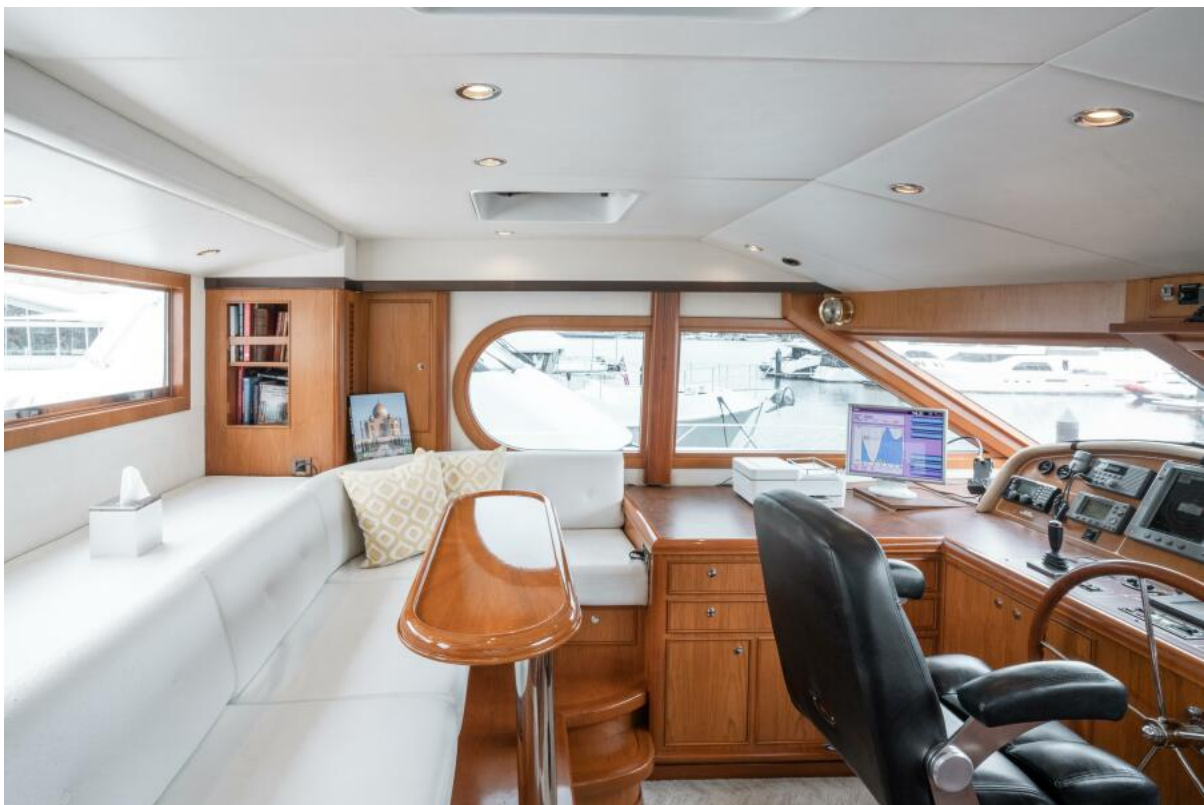
Bridge Deck Bridge Deck