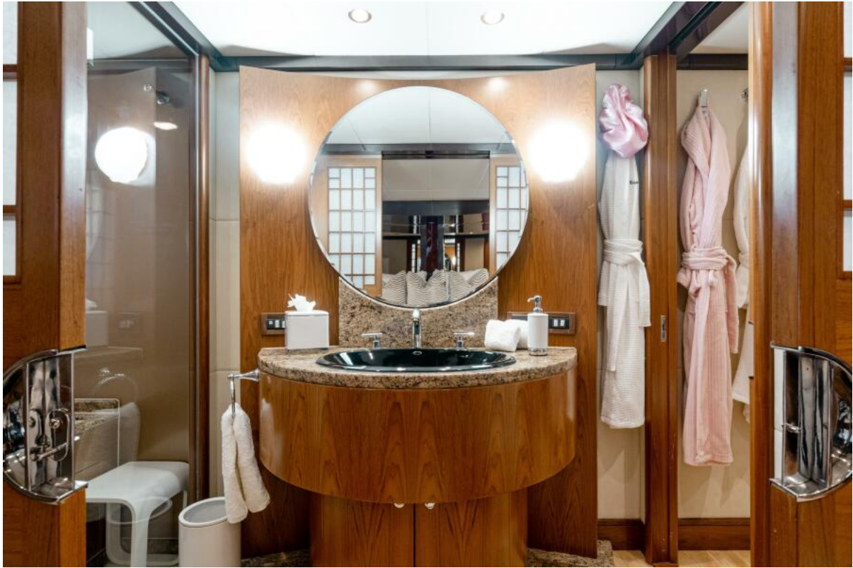
Master Cabin Ensuite Master Cabin Ensuite