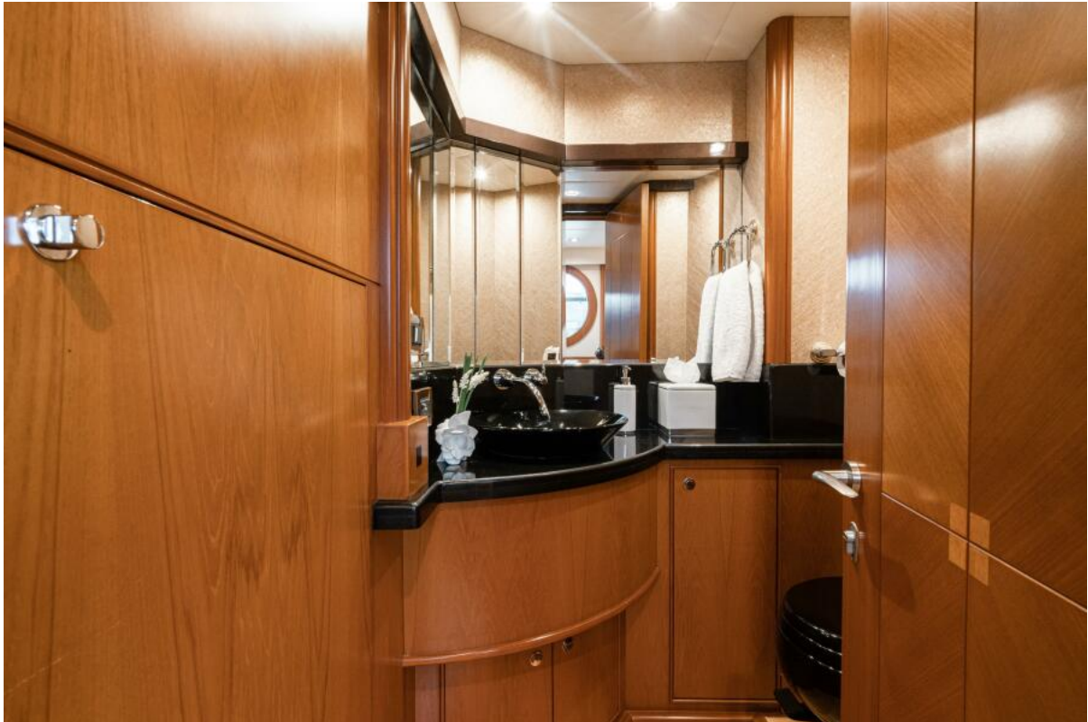
Main Deck Day Head Day Head