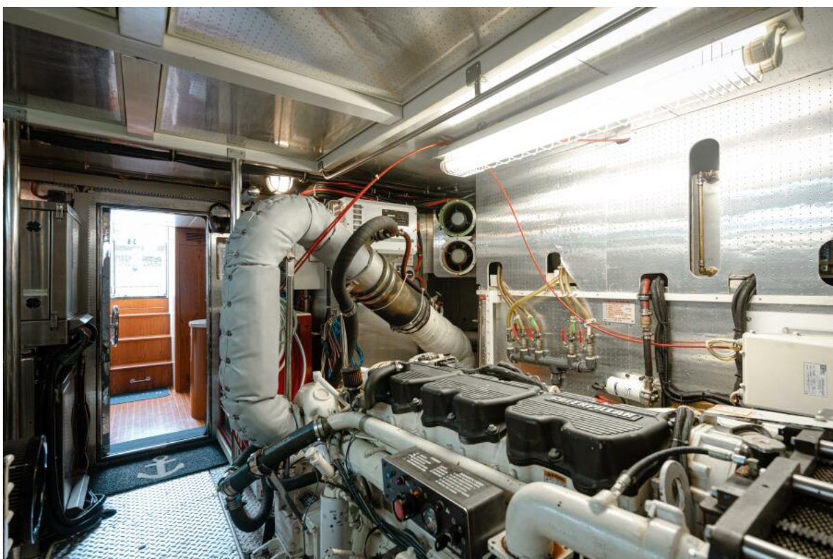
Engine Room Engine Room