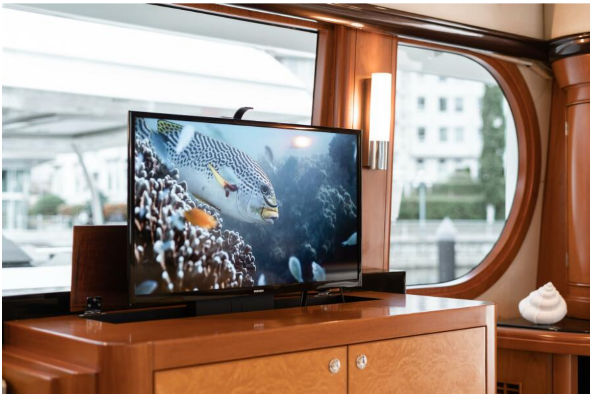
Main Salon Main Salon with TV on hide-away lift