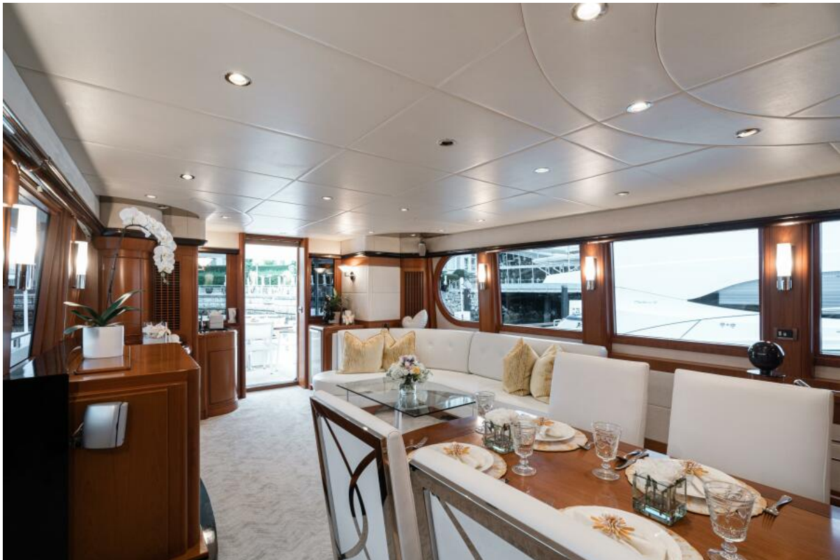
Main Salon Main Salon