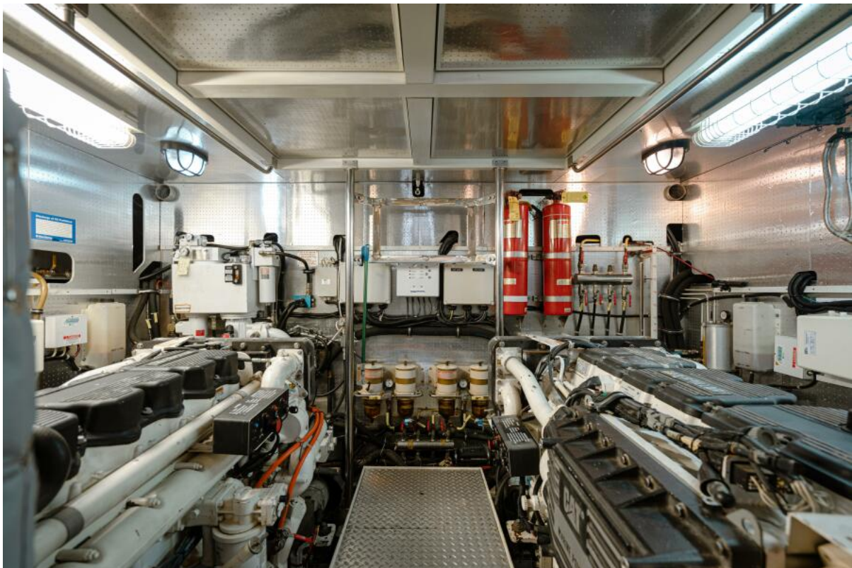
Engine Room Engine Room