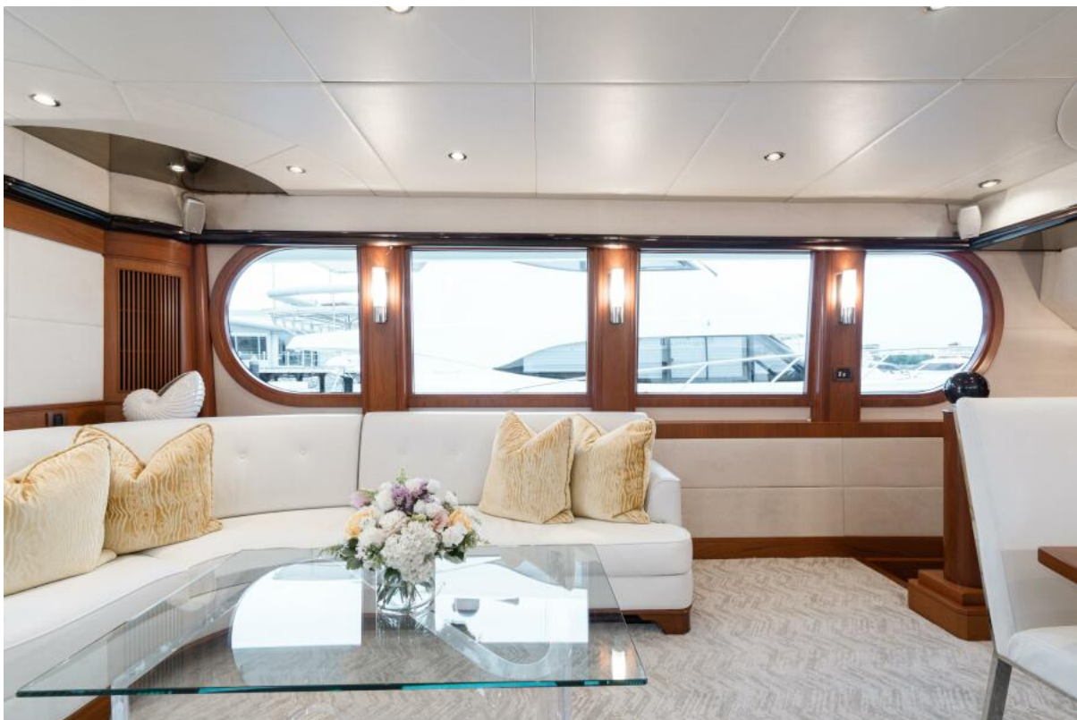
Main Salon Main Salon