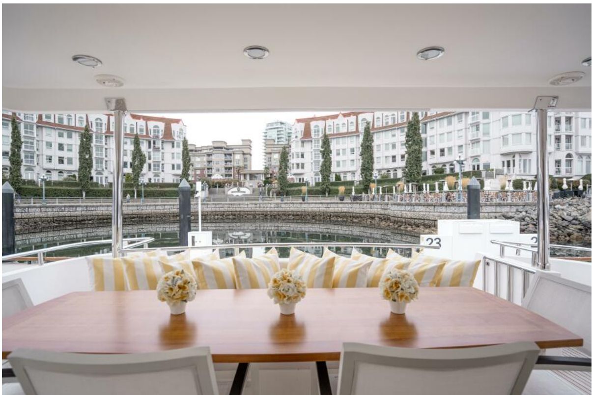
Main Deck Aft Main Deck Aft