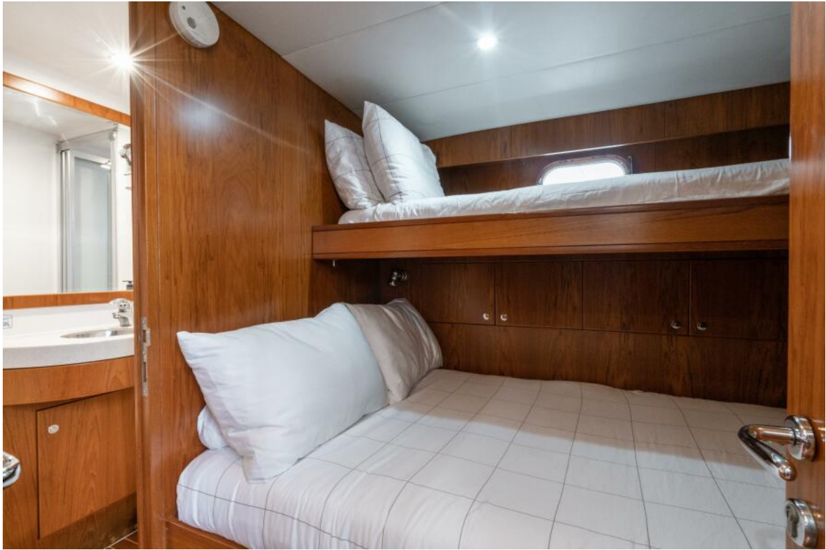
Crew Cabin Crew Cabin with single berth up top and double berth below