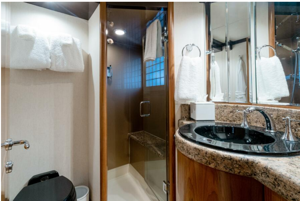
VIP Cabin Ensuite VIP Cabin Ensuite