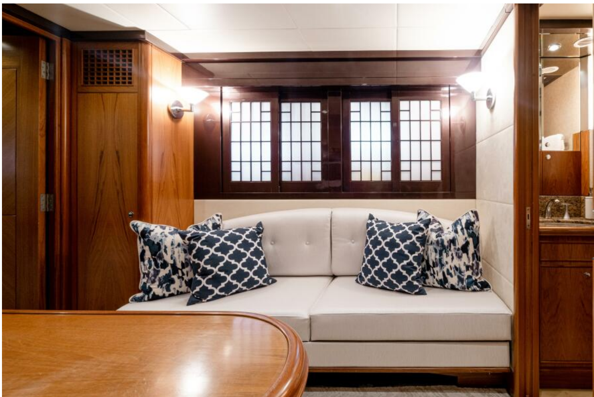
Study / Port Side Guest Cabin Study / Port Side Guest Cabin with Convertible berth