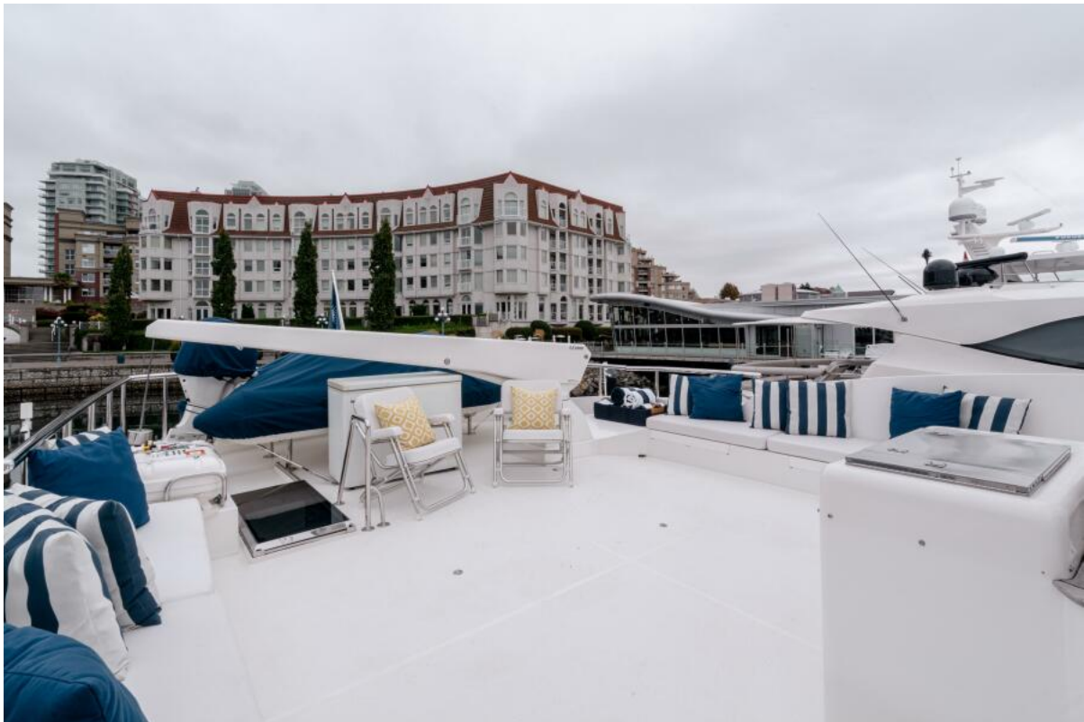
Sun Deck Sun Deck