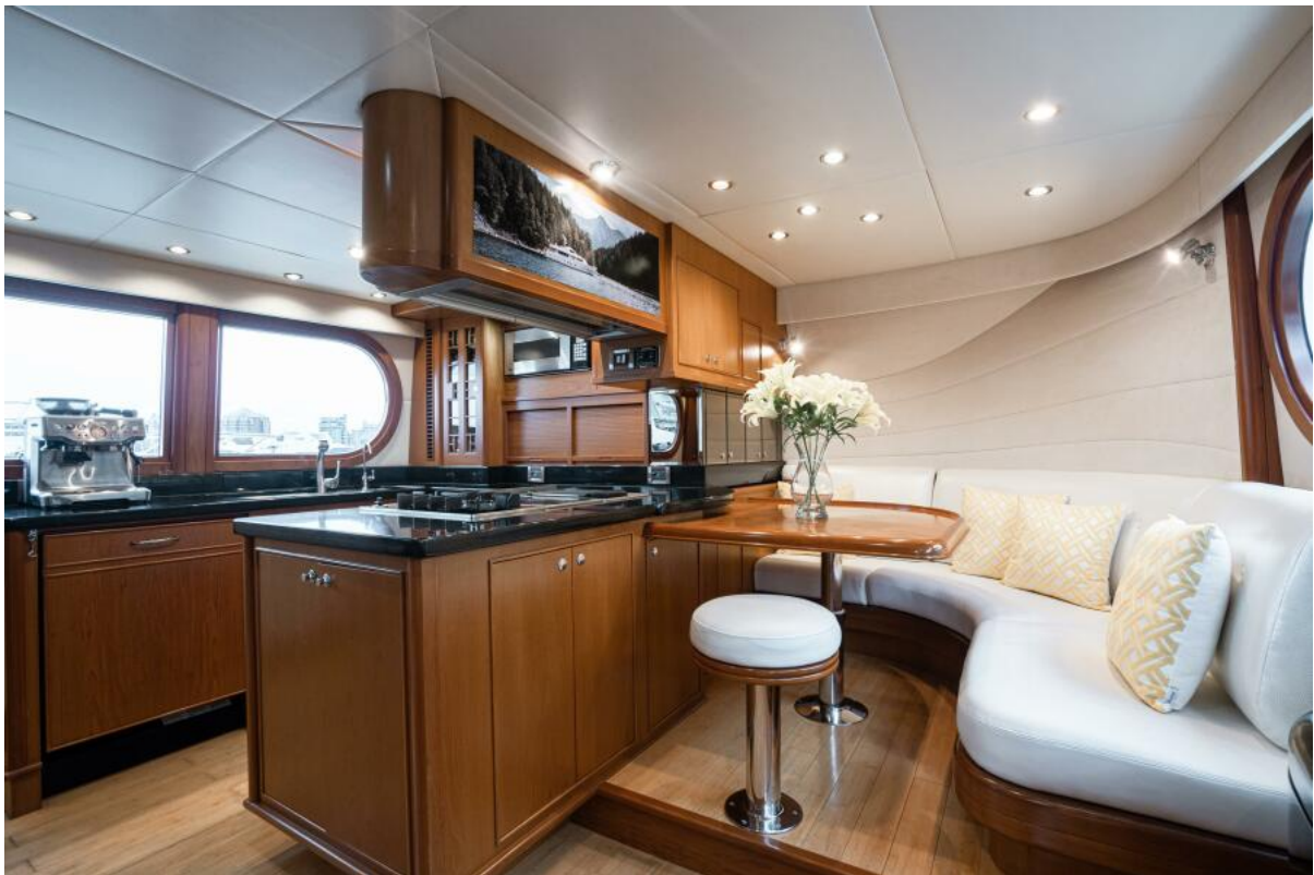
Informal Dining Area & Galley Informal Dining Area & Galley