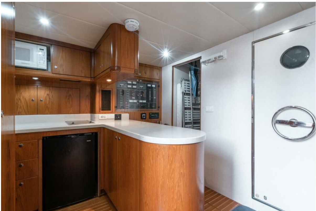
Crew Galley Euro Style Crew Galley with washer and dryer in cabinet