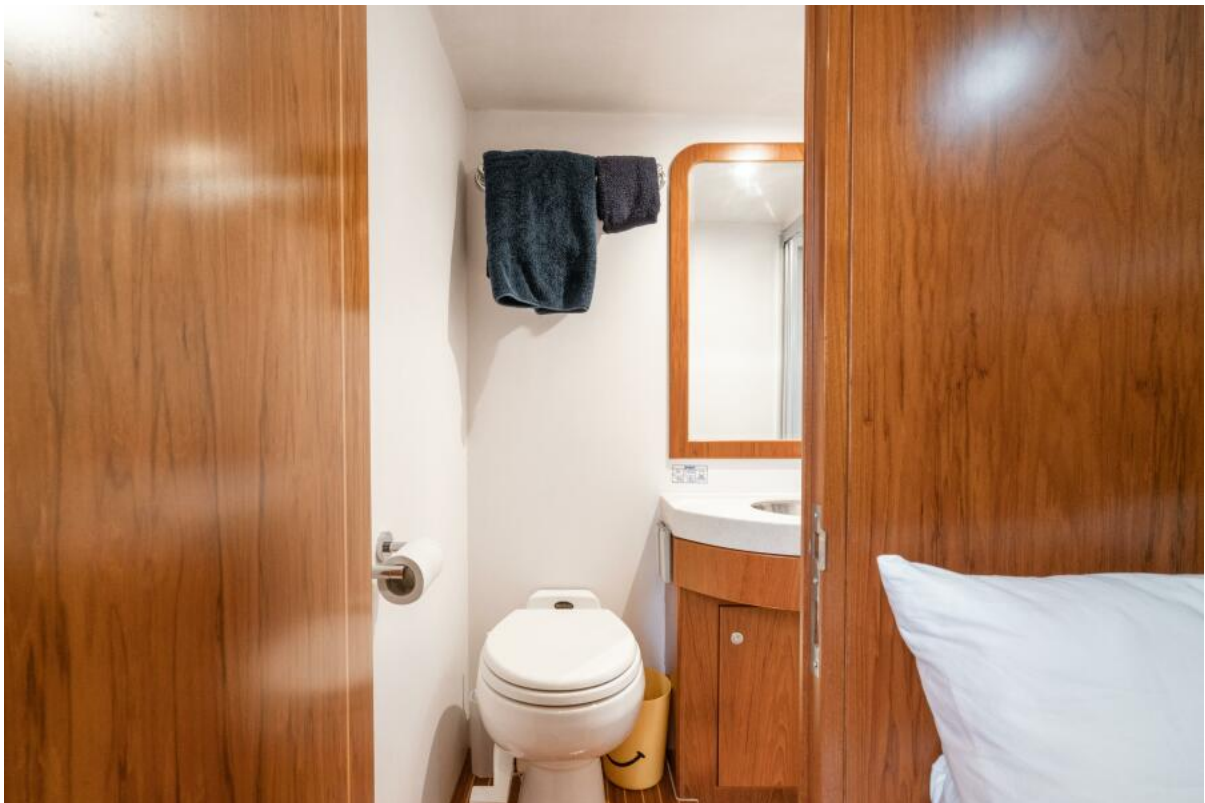
Crew Cabin Ensuite Crew Cabin Ensuite