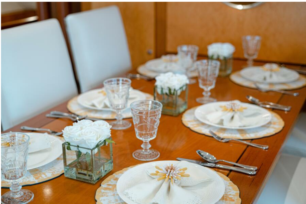
Main Salon Formal Dining Table which retracts into bulkhead