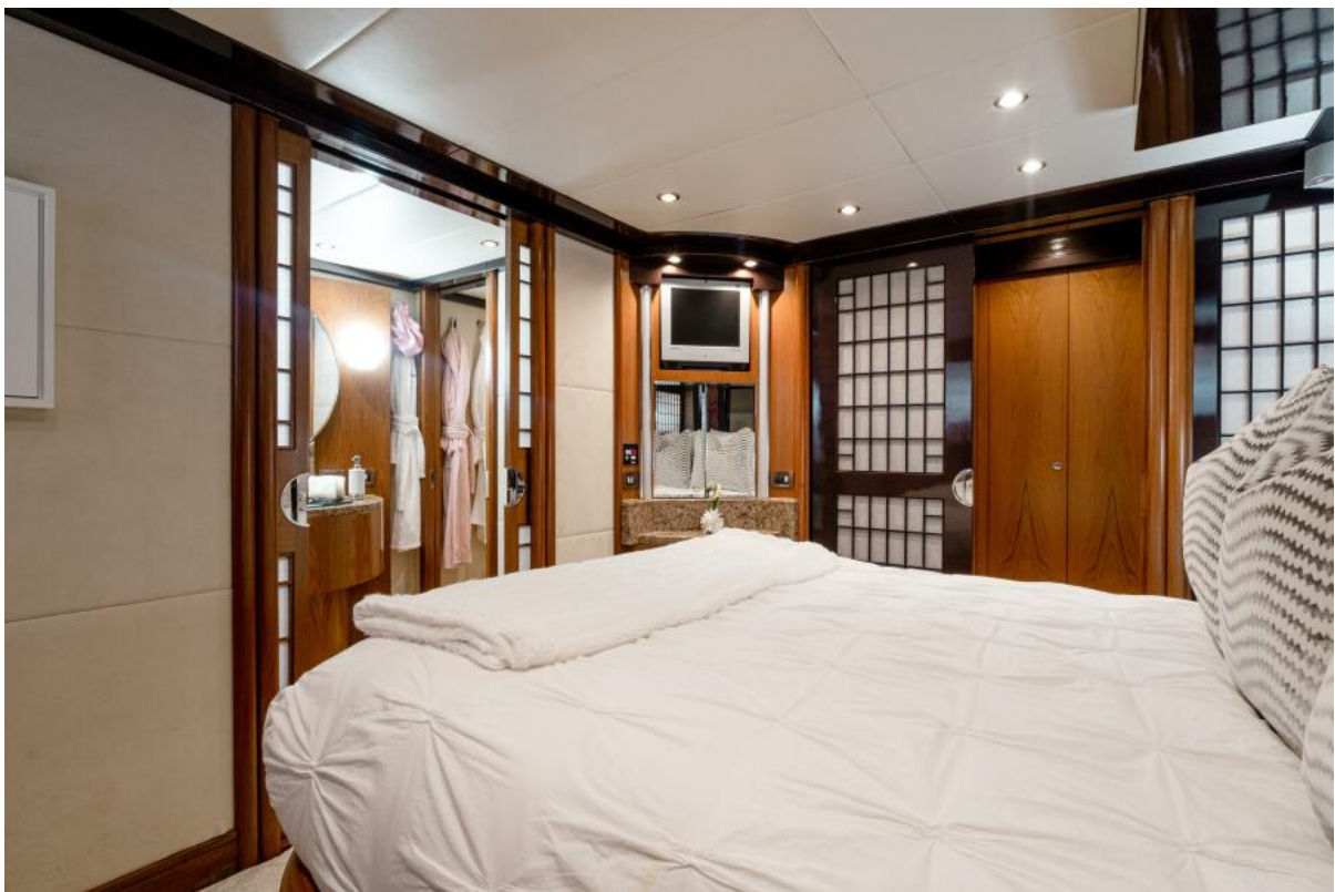
Master Cabin Master Cabin