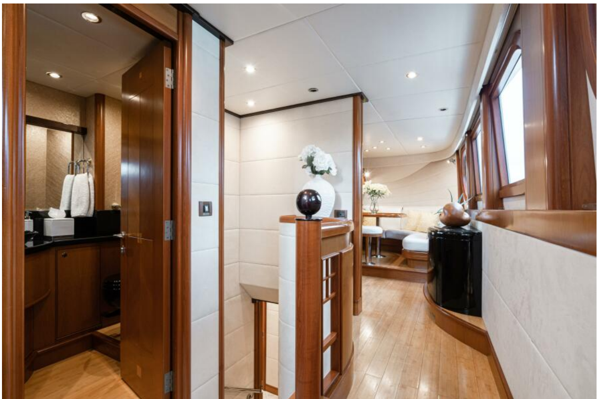
Main Deck Lobby Main Deck Lobby