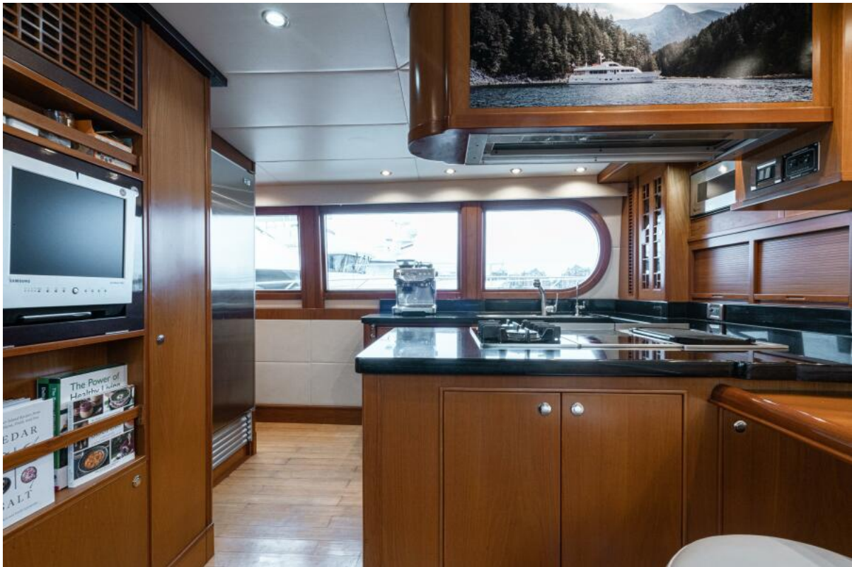
Informal Dining Area & Galley Informal Dining Area & Galley