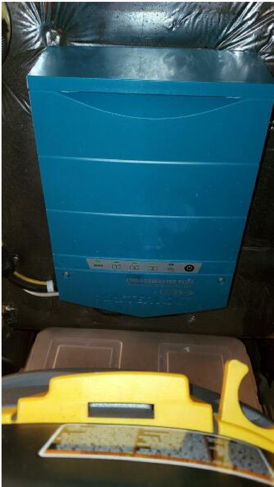
Battery Charger Inverter