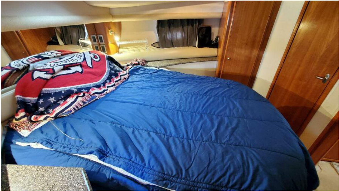
VIP Stateroom Starboard