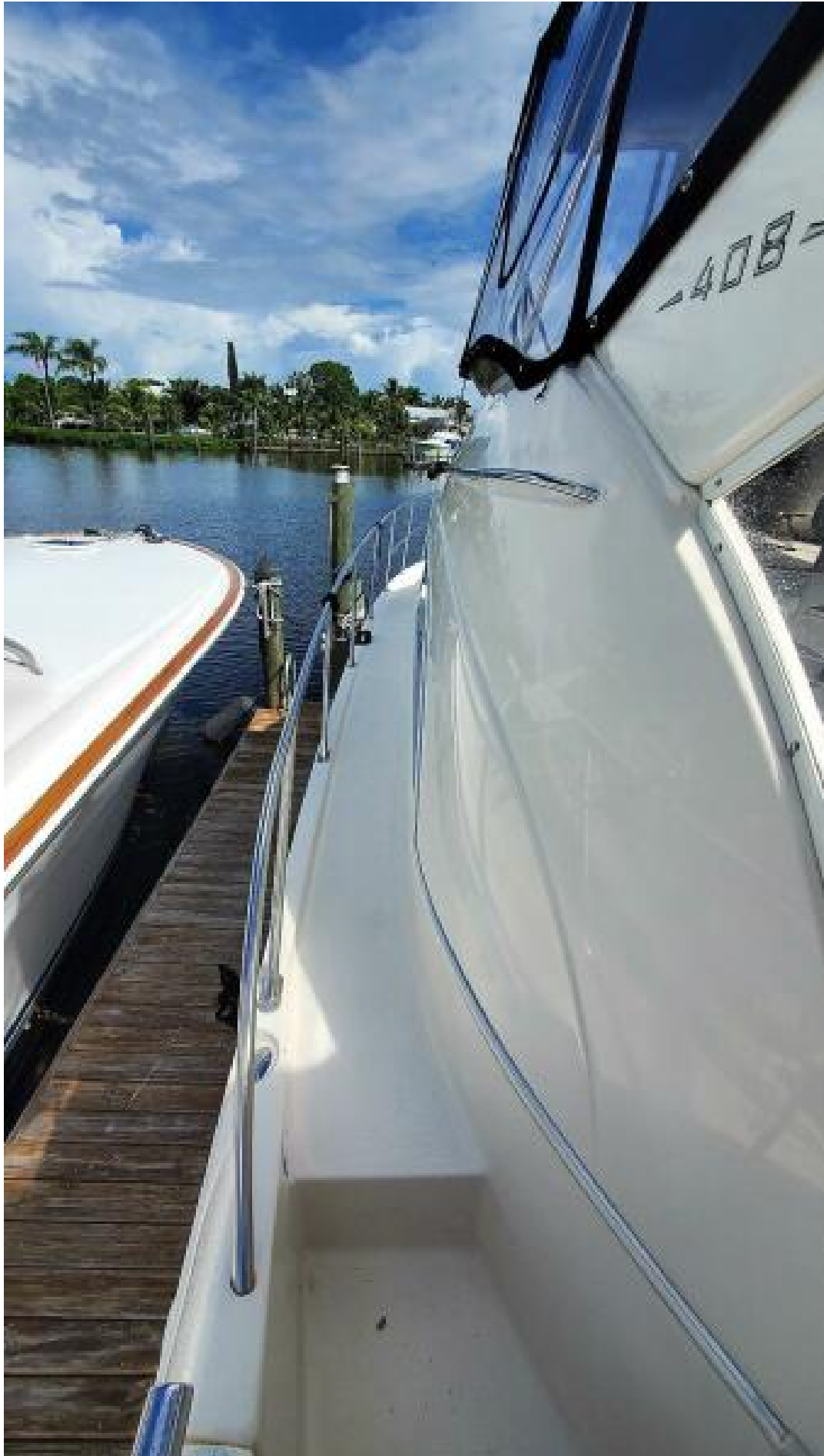
Port Side Walkway