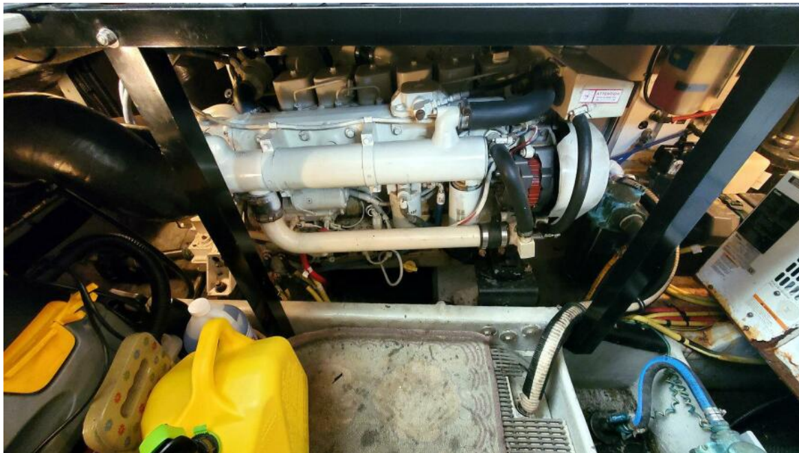
Port Main Engine