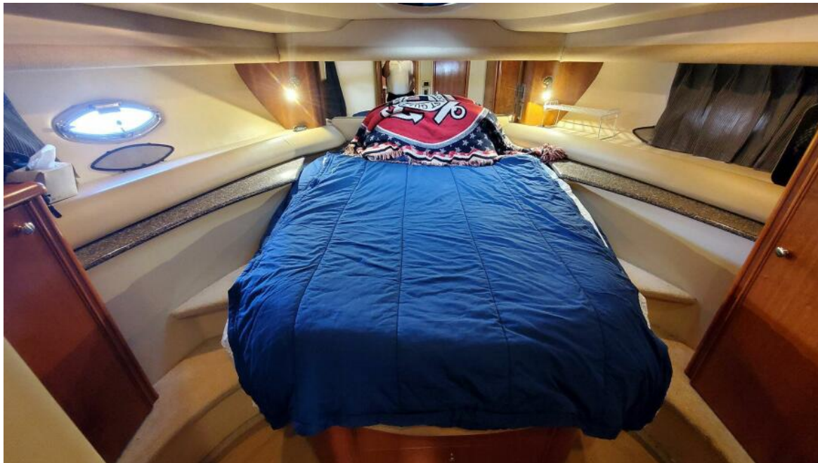
VIP Stateroom Forward