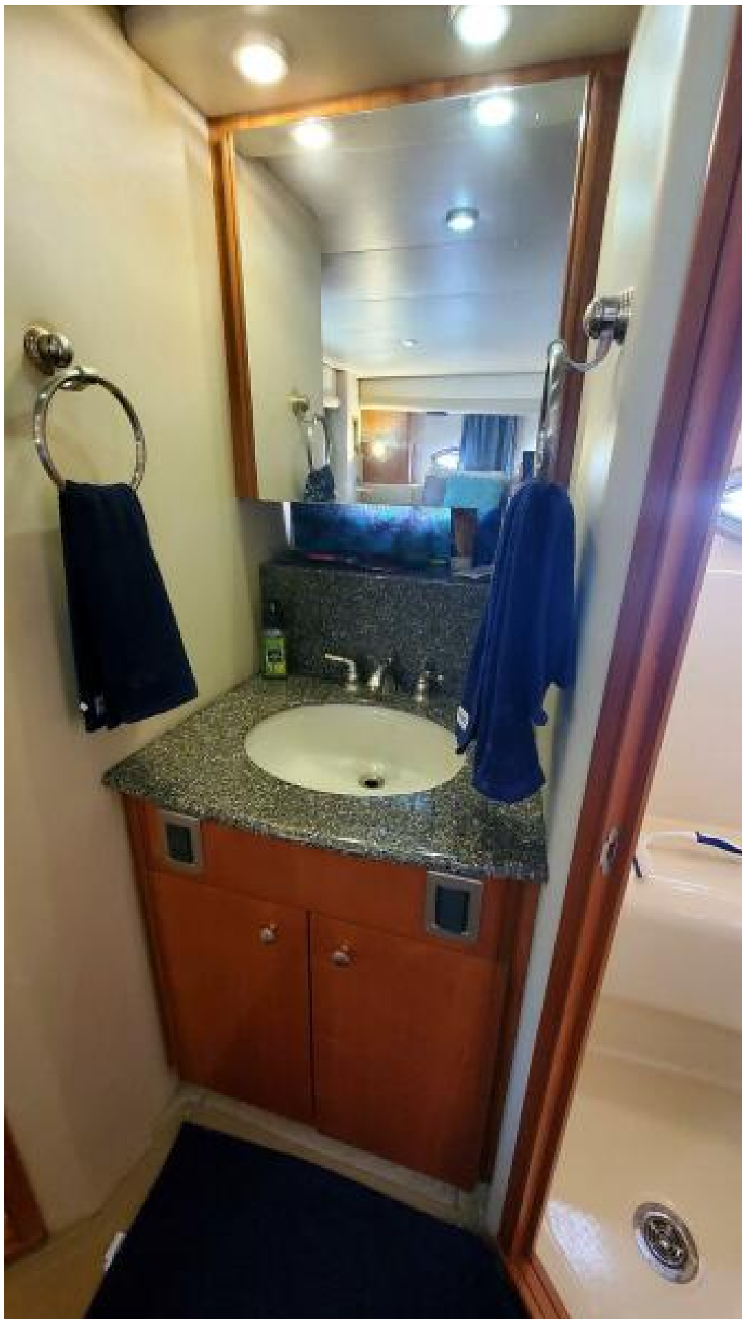
Master Head Vanity