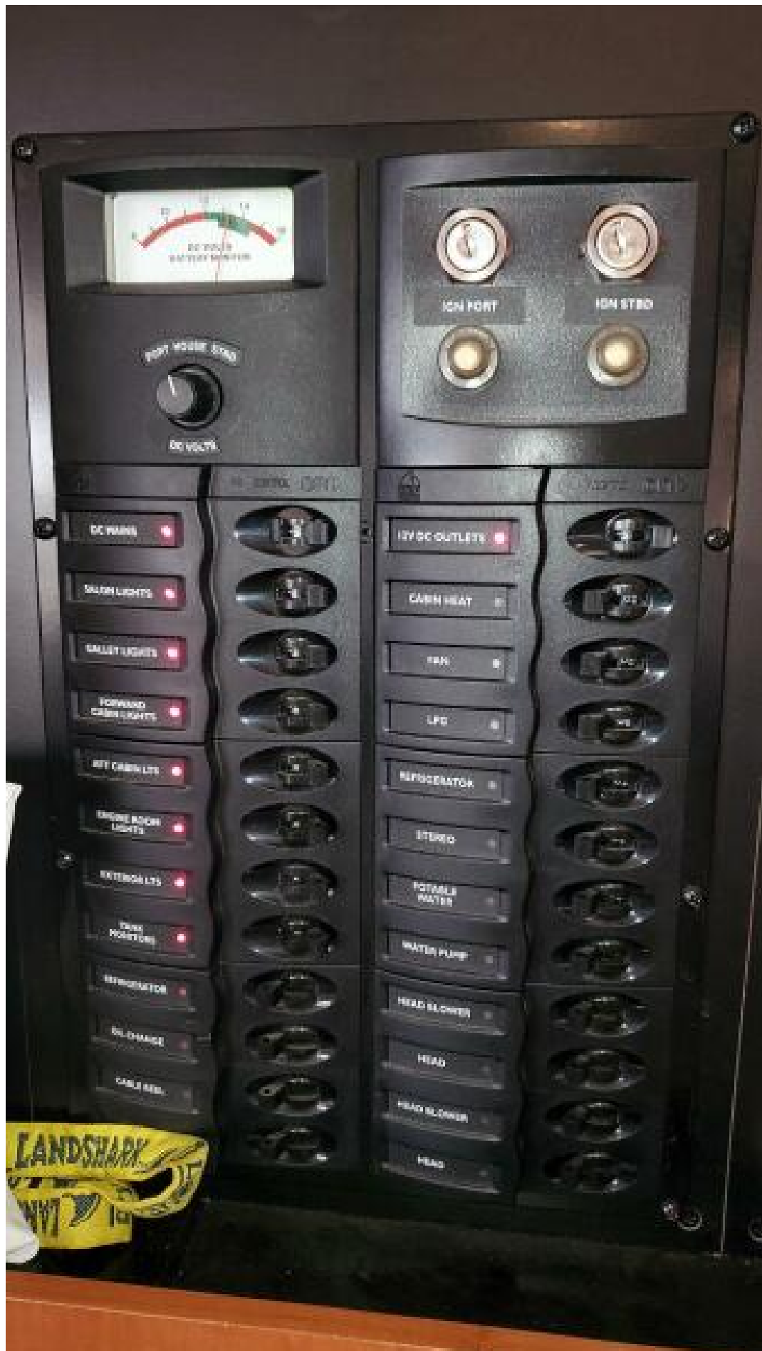
DC Electrical Panel