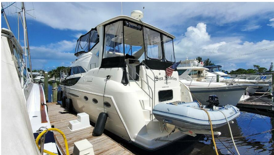
Port Stern Profile