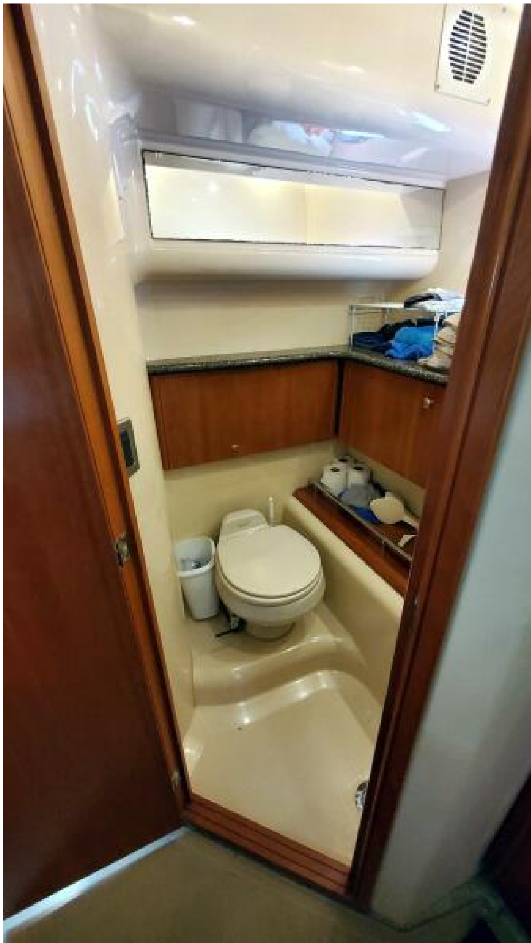
Master Head Toilet