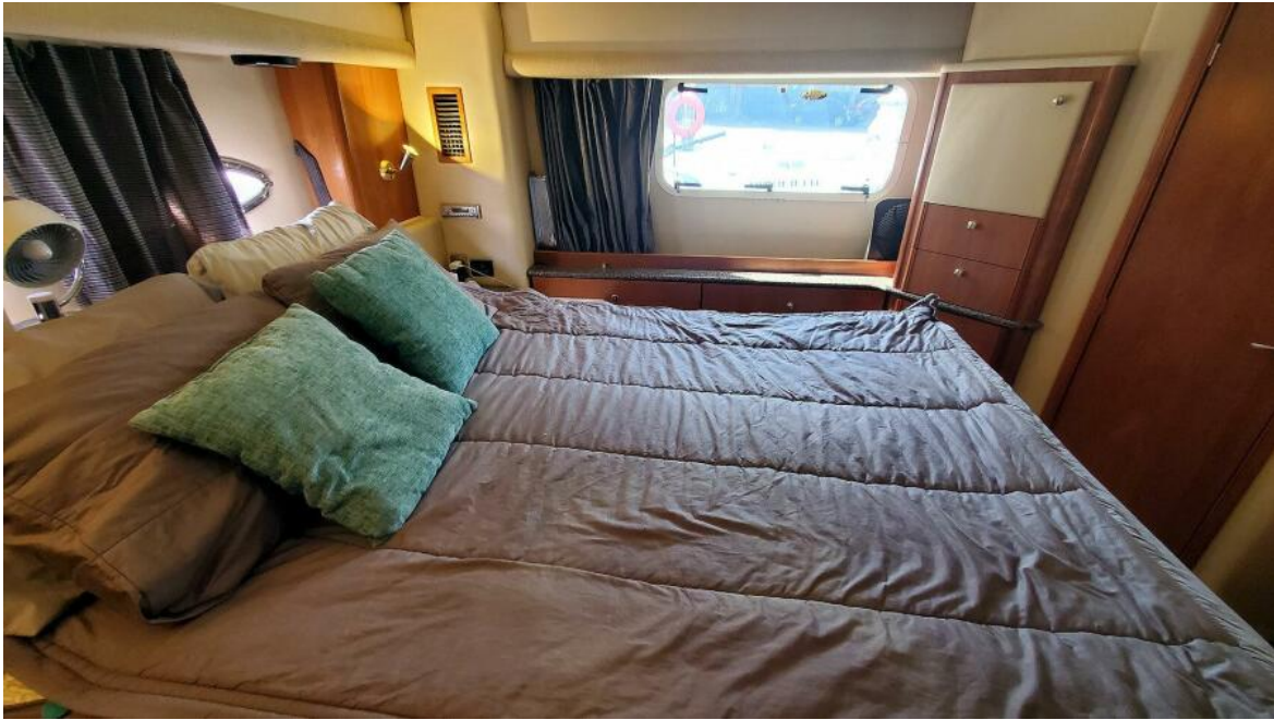
Master Stateroom Aft