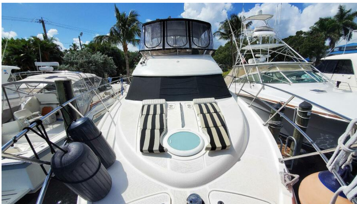
Fore Deck Aft