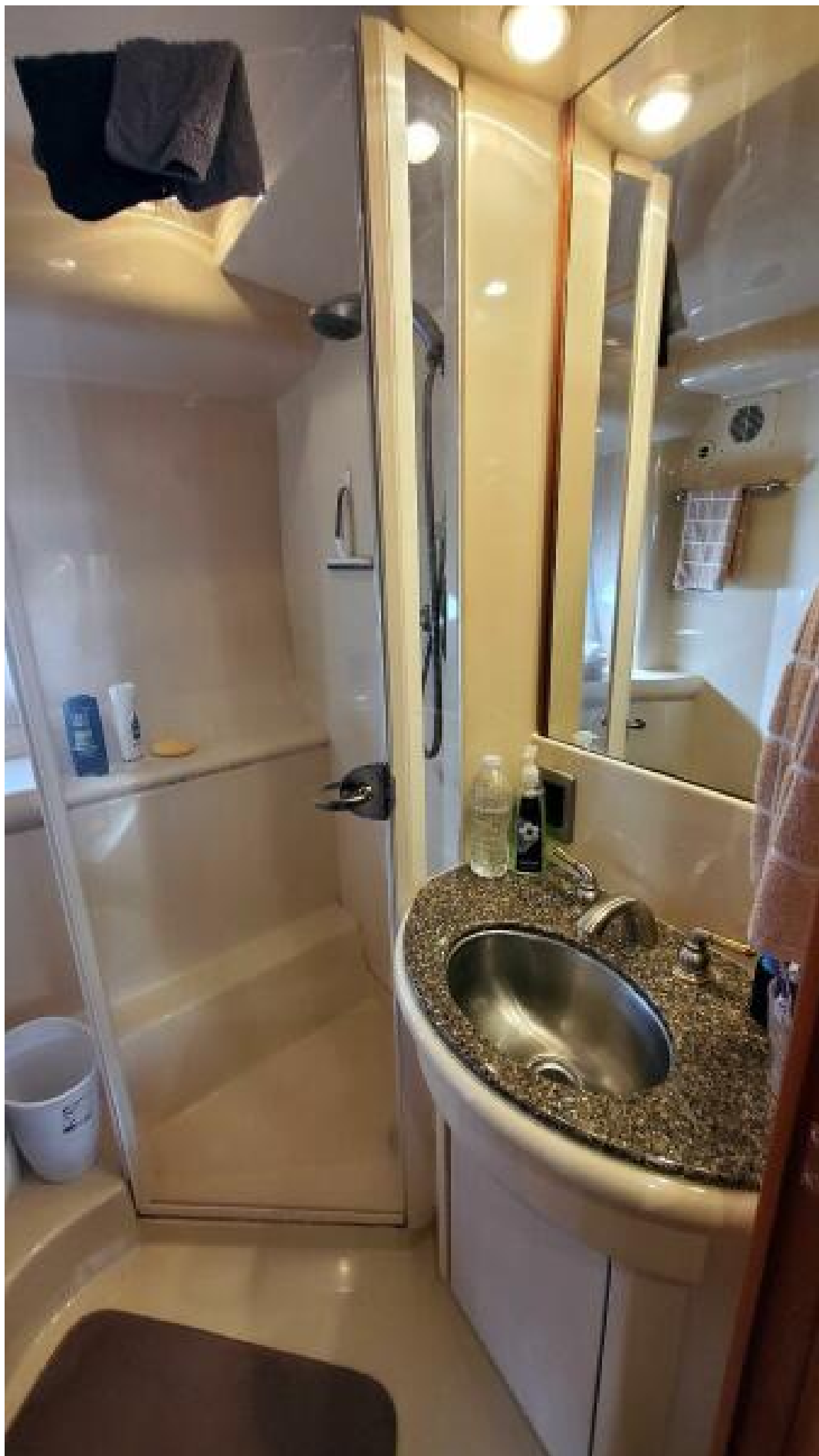
Guest Head Vanity and Shower