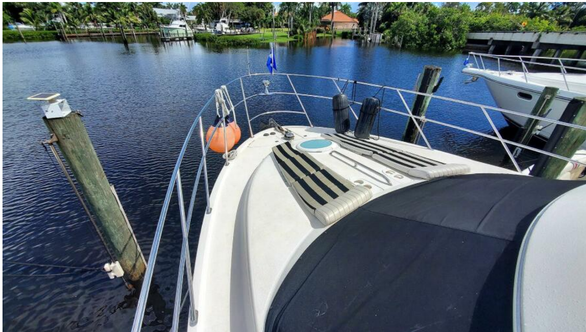
Fore Deck Forward