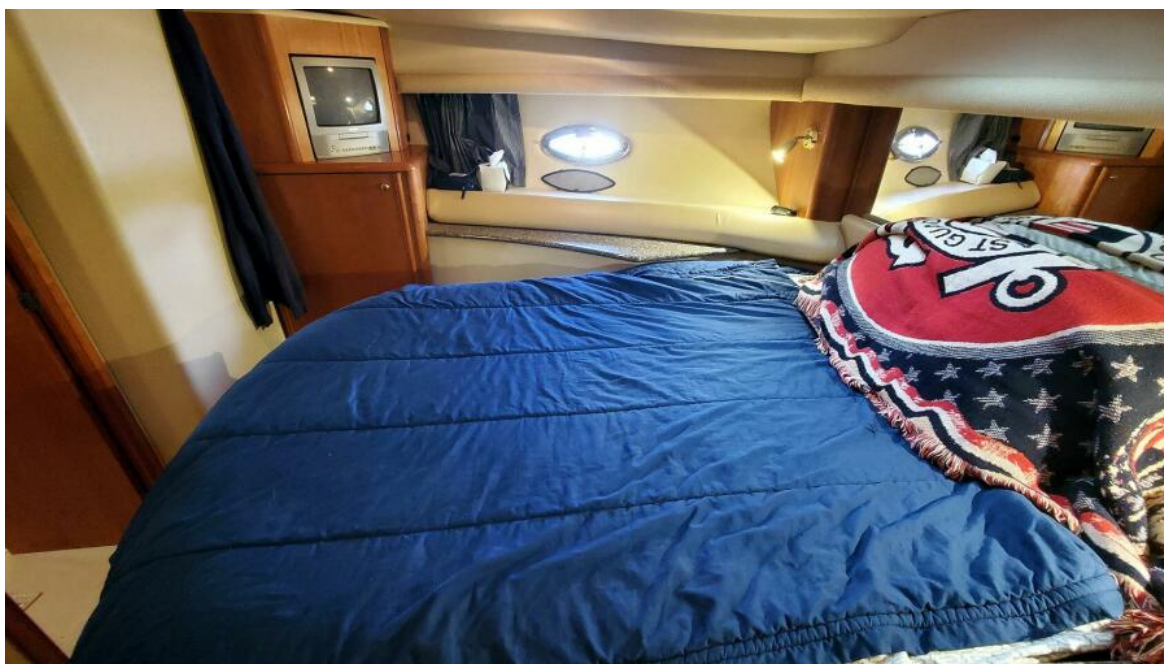
VIP Stateroom Port