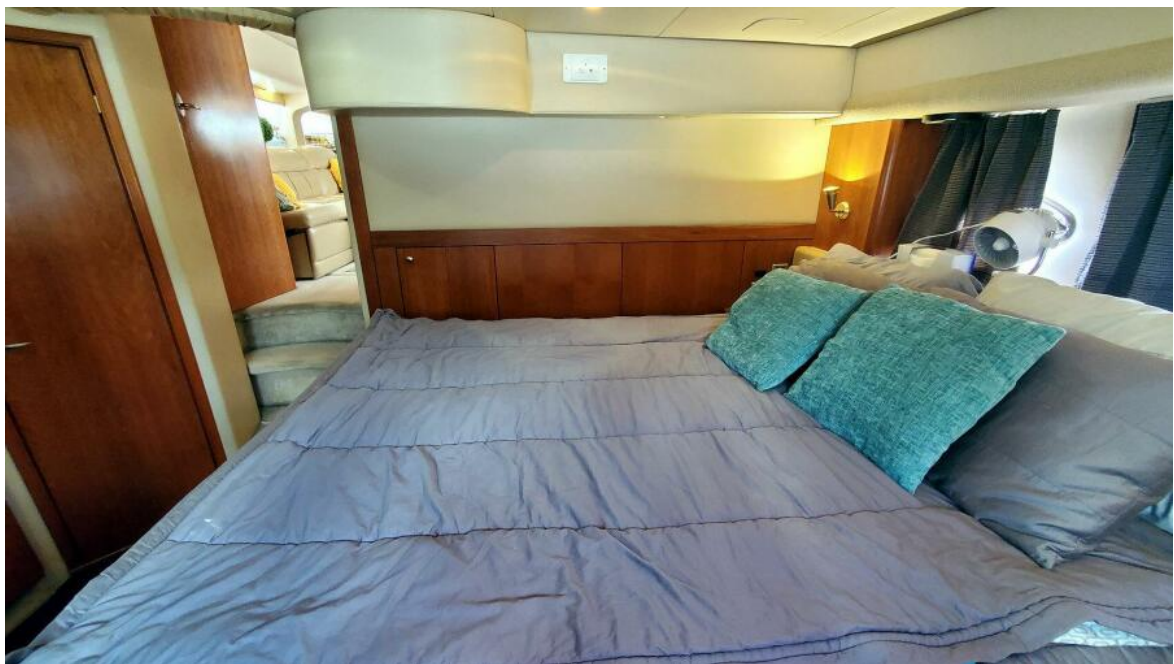
Master Stateroom Forward