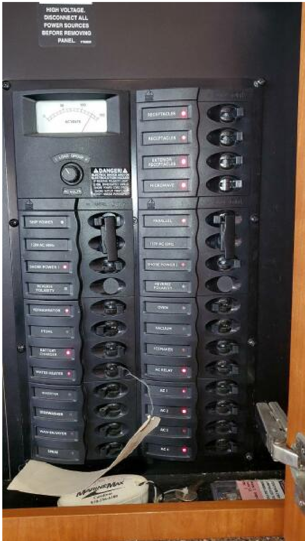
AC Electrical Panel