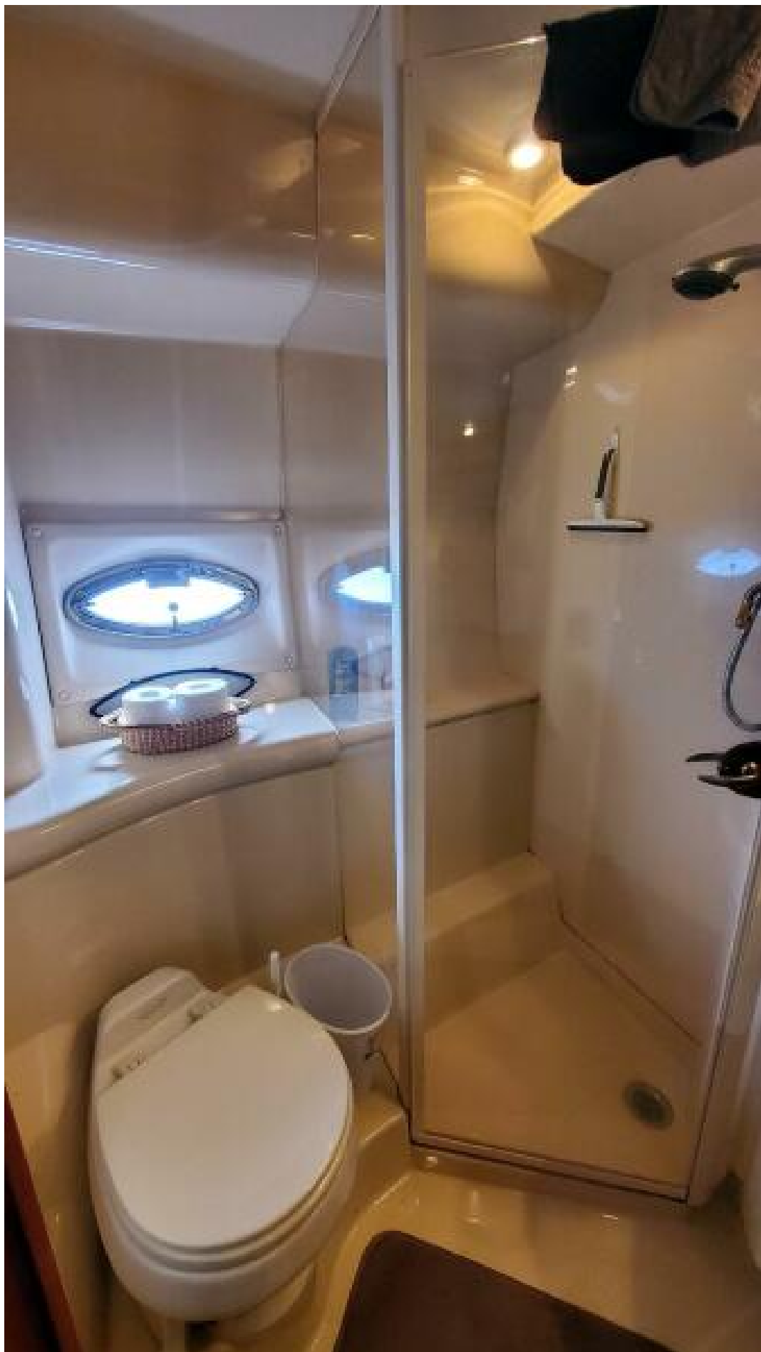
Guest Head Shower and Toilet