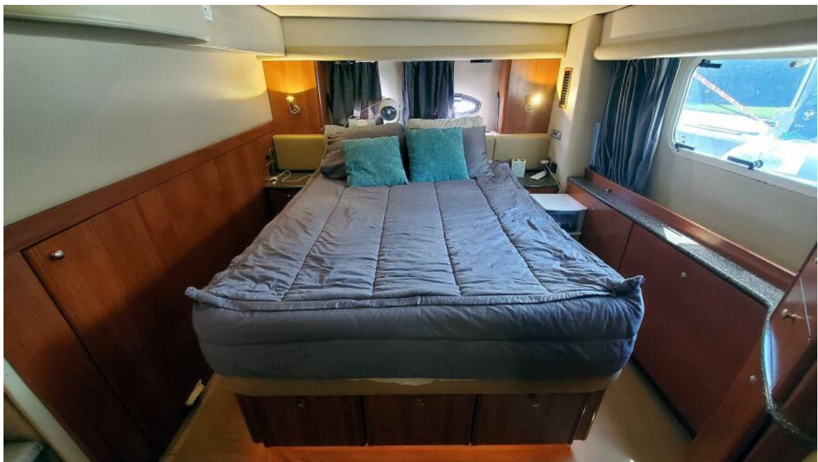
Master Stateroom Starboard