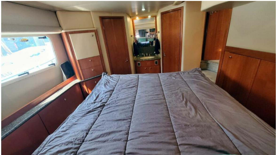
Master Stateroom Port