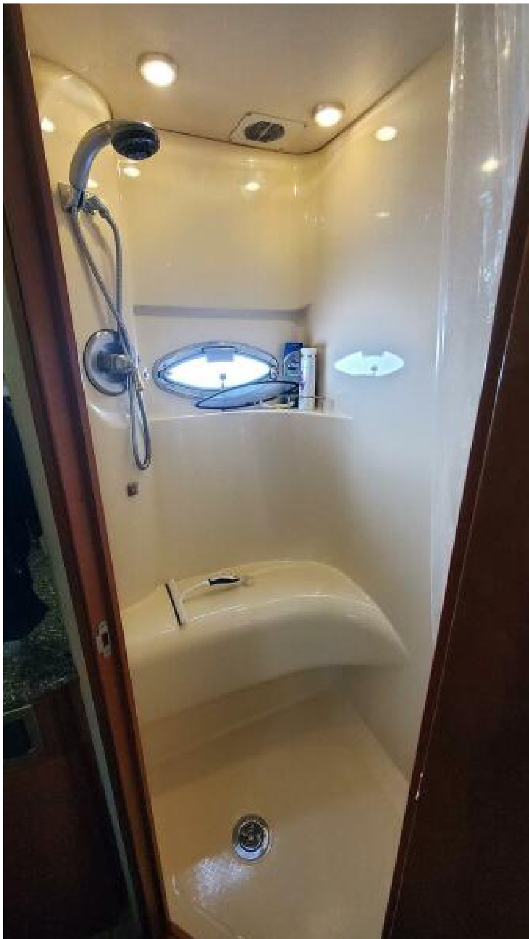
Master Head Shower