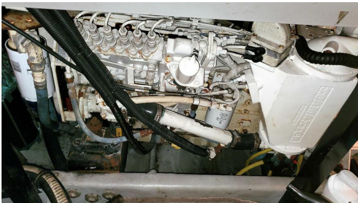
Starboard Main Engine