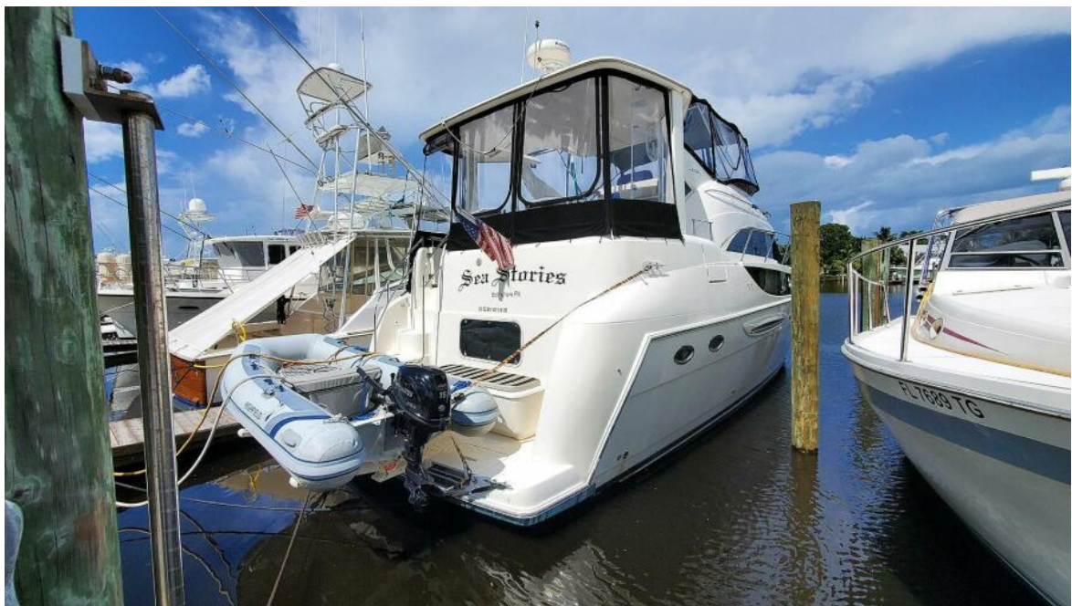
Starboard Stern Profile