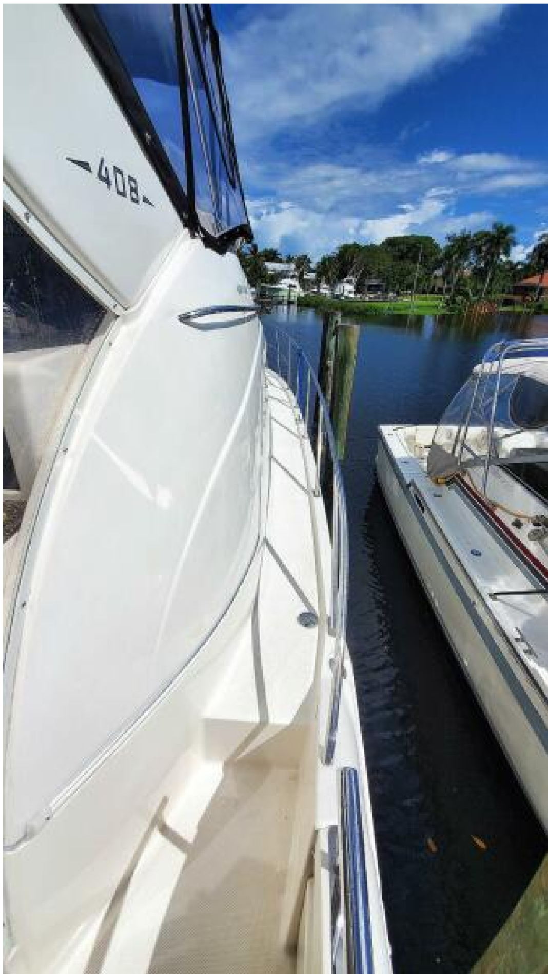
Starboard Side Walkway