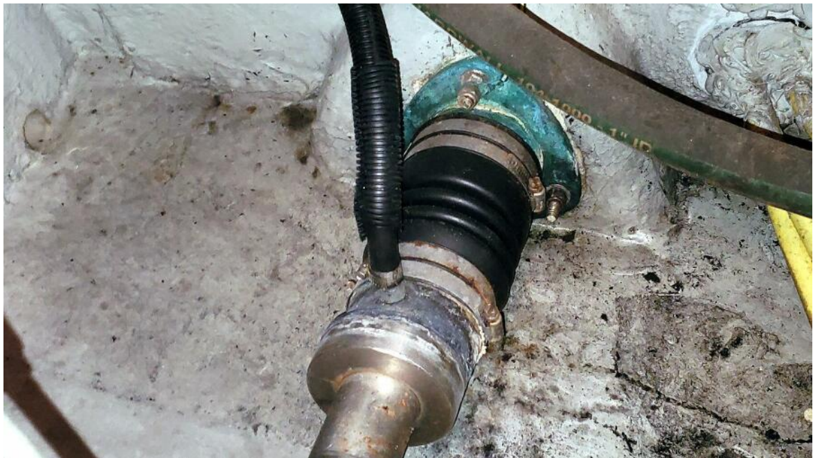
Dripless Shaft Seals