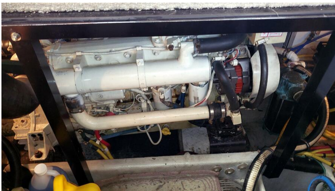
Port Main Engine