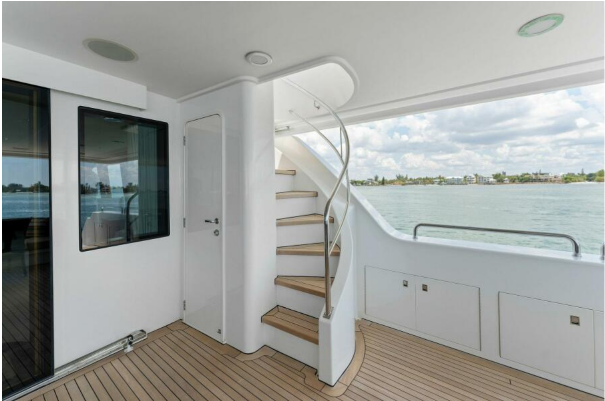
2002 112 Westport Motor Yacht Eclipse Deck