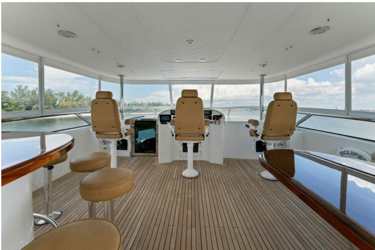
2002 112 Westport Motor Yacht Eclipse Flybridge