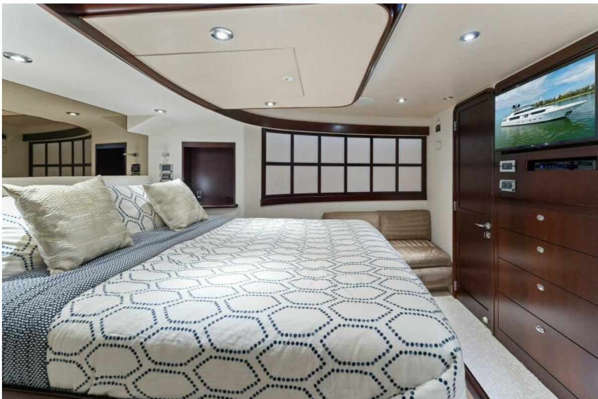
2002 112 Westport Motor Yacht Eclipse VIP Stateroom