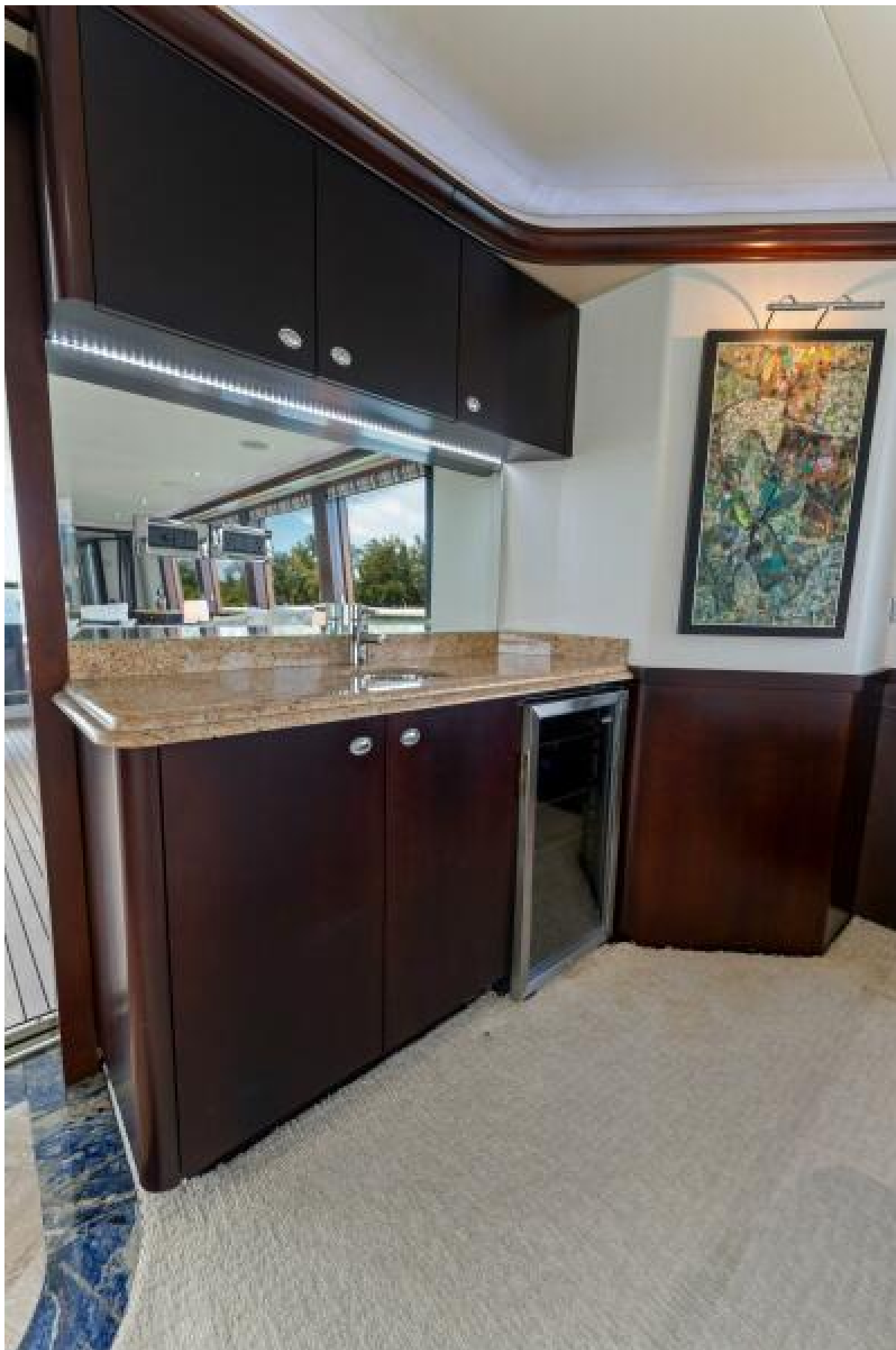
2002 112 Westport Motor Yacht Eclipse Foyer