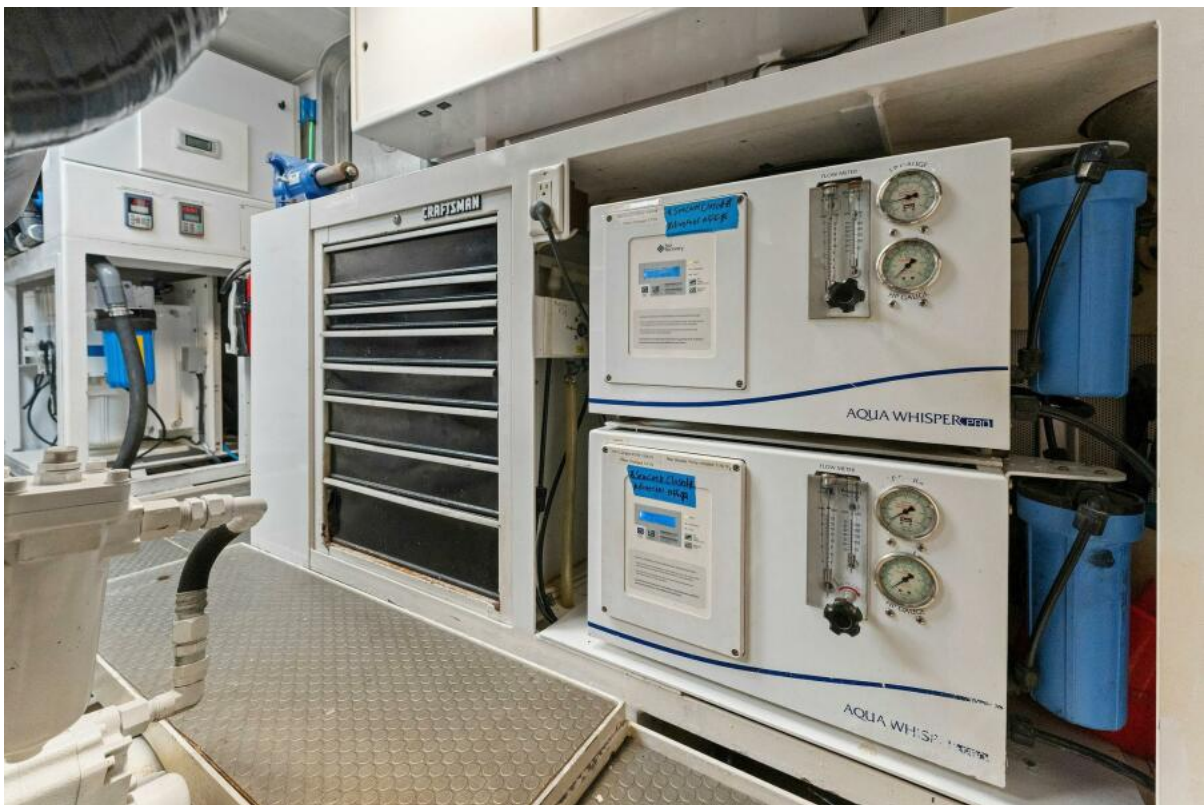
2002 112 Westport Motor Yacht Eclipse Engine Room