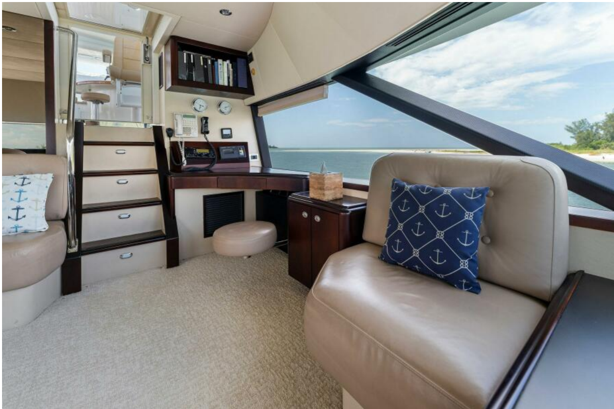
2002 112 Westport Motor Yacht Eclipse Cockpit