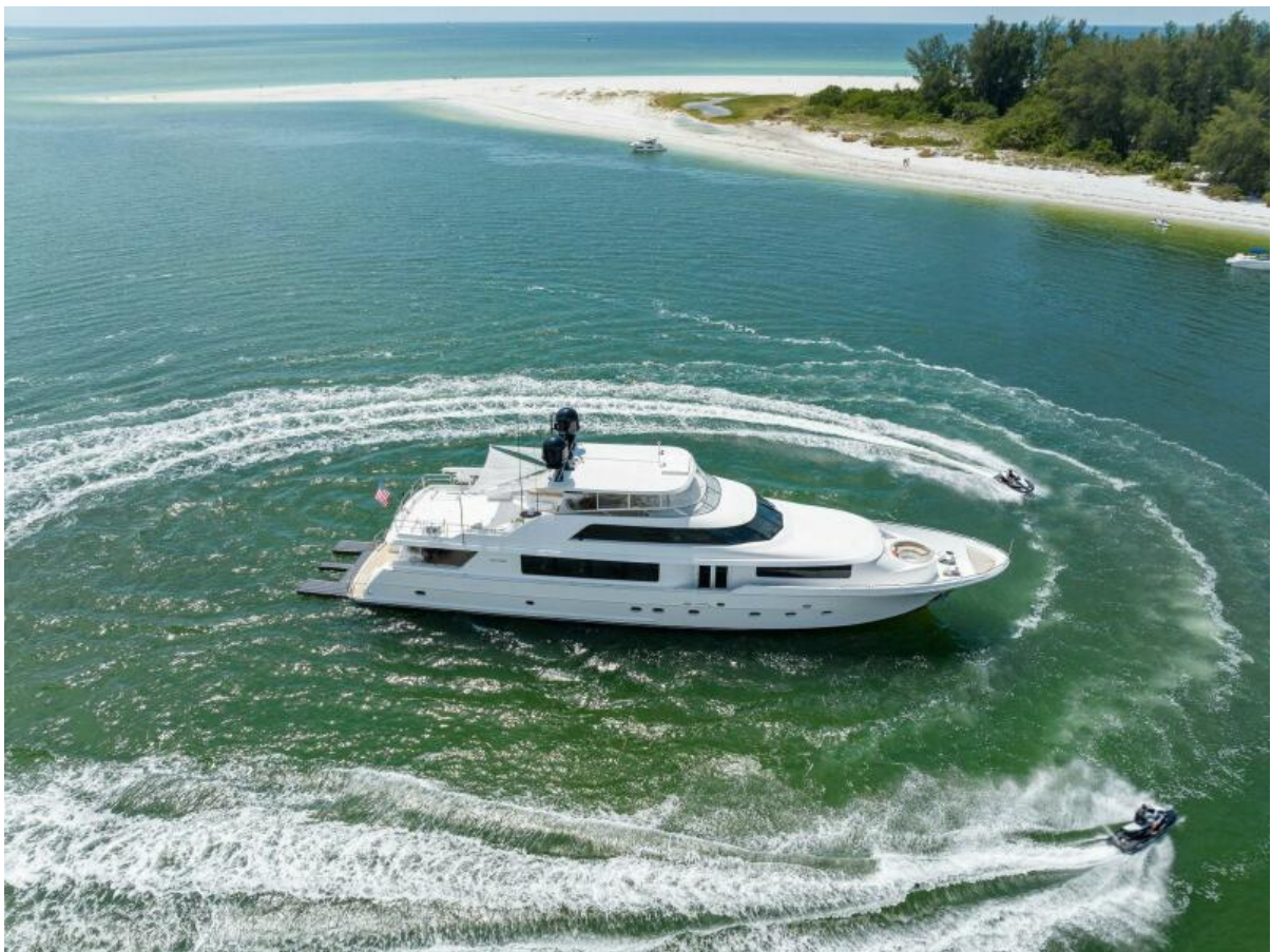
2002 112 Westport Motor Yacht Eclipse Aerial View