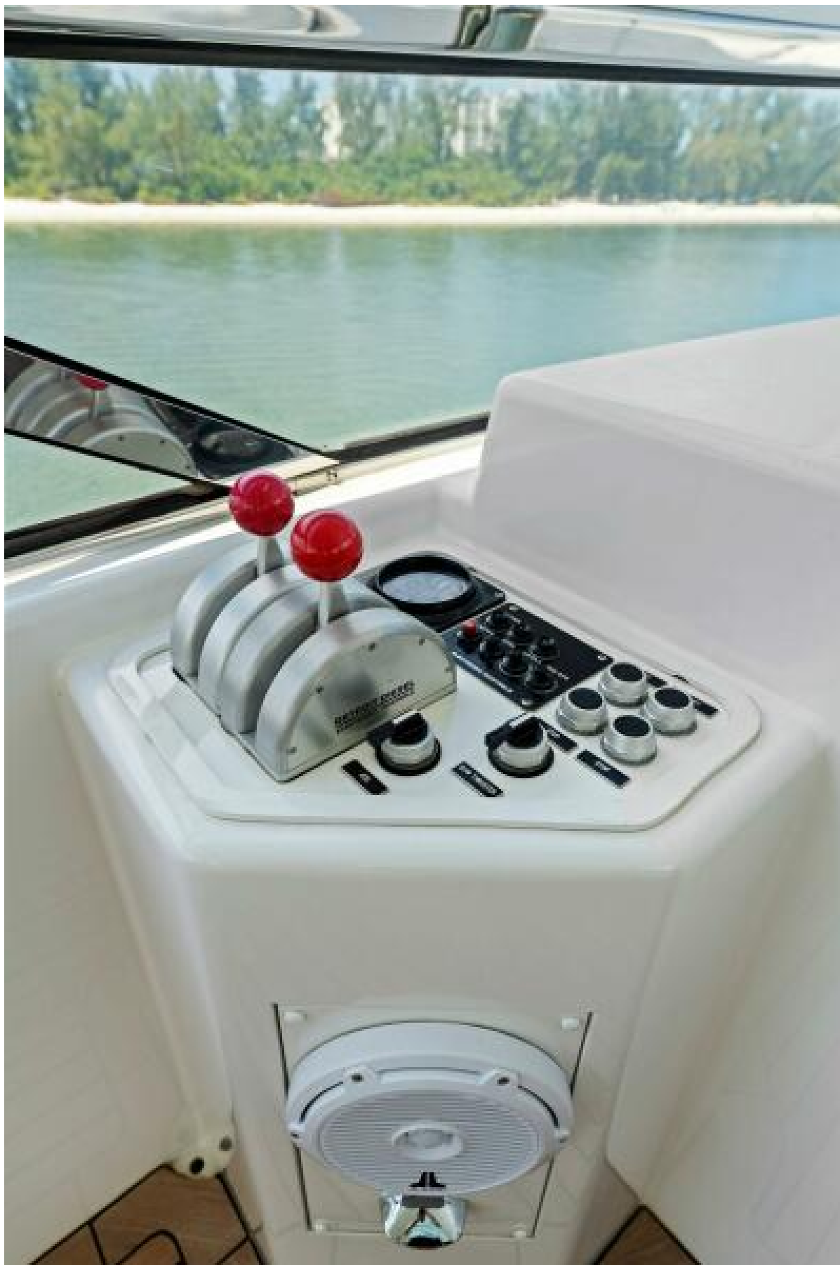
2002 112 Westport Motor Yacht Eclipse Flybridge