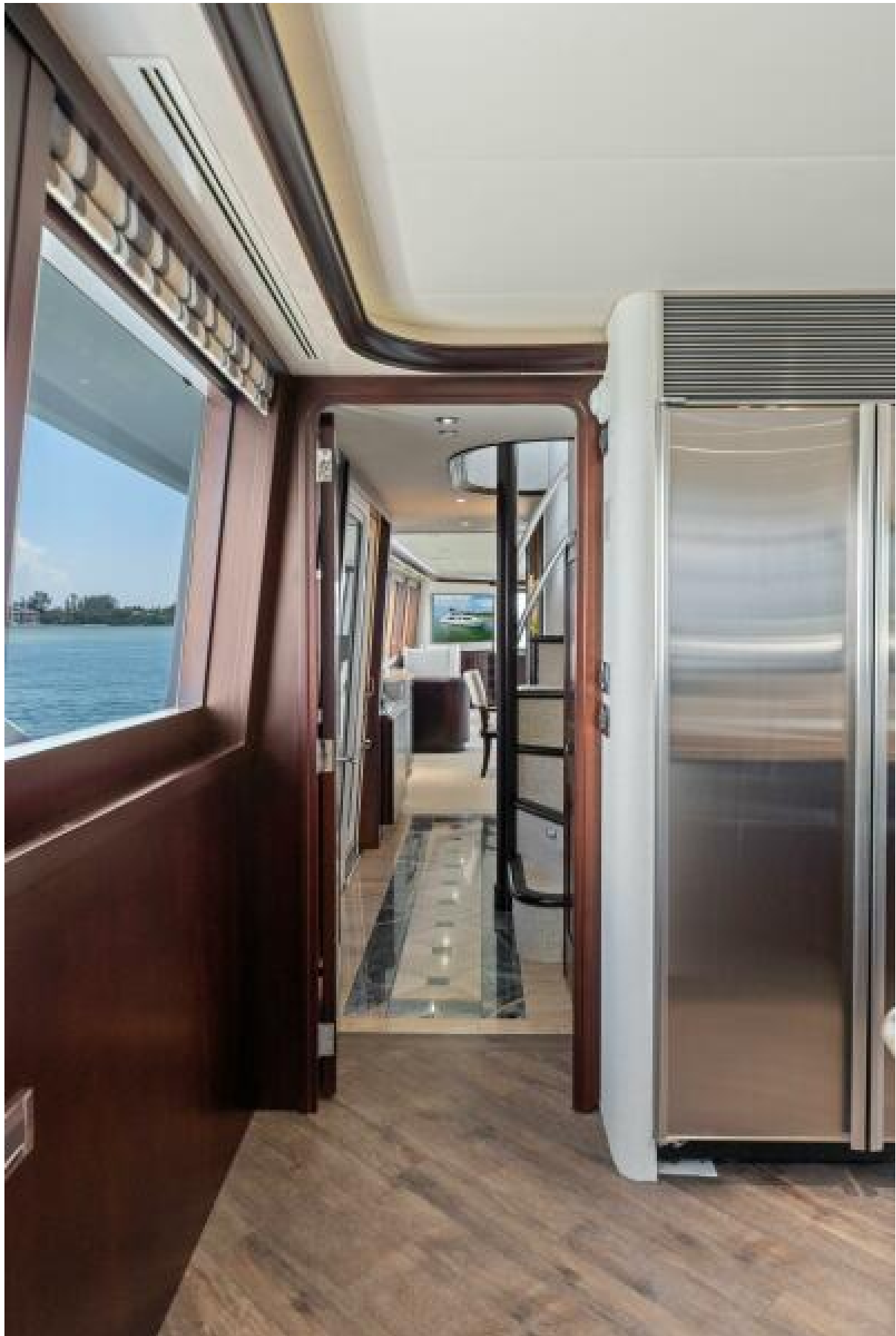
2002 112 Westport Motor Yacht Eclipse Galley