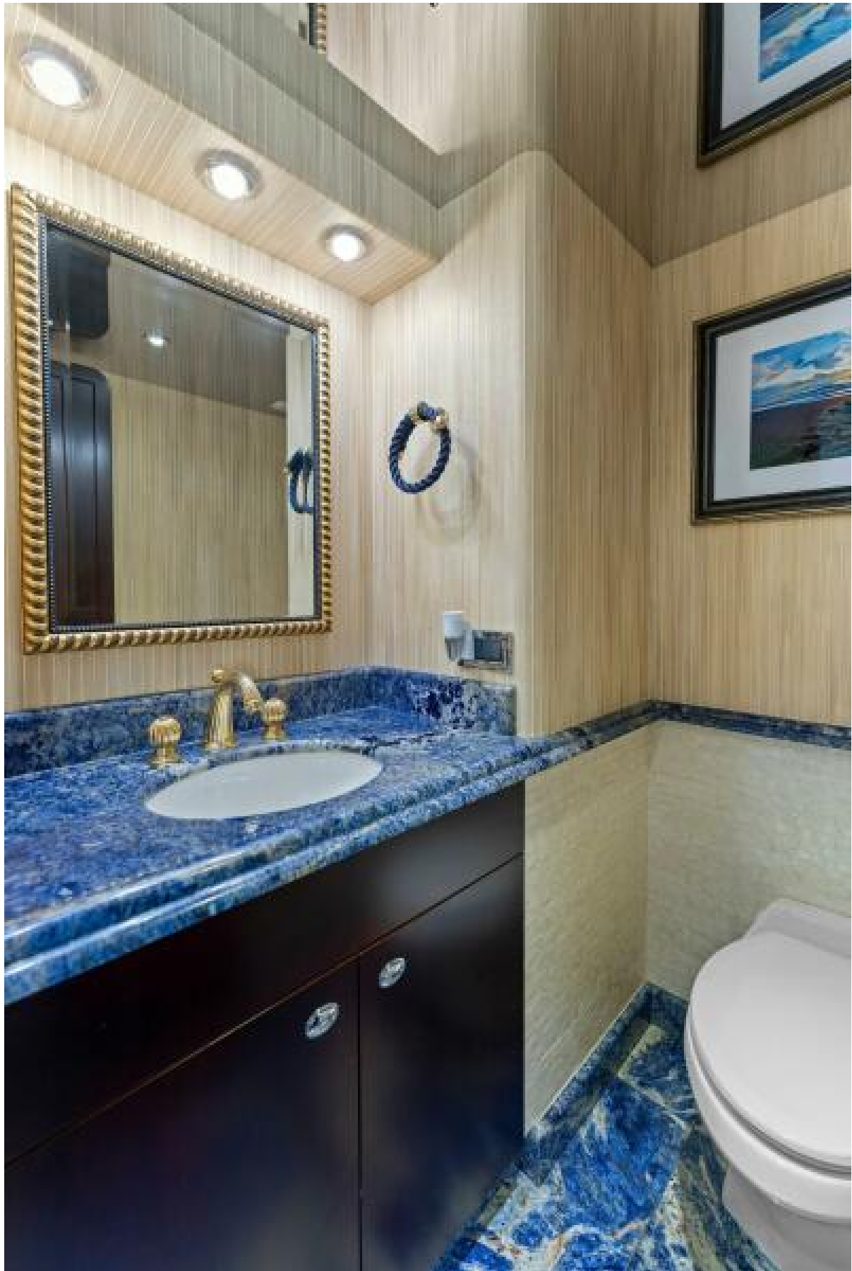
2002 112 Westport Motor Yacht Eclipse Day Head