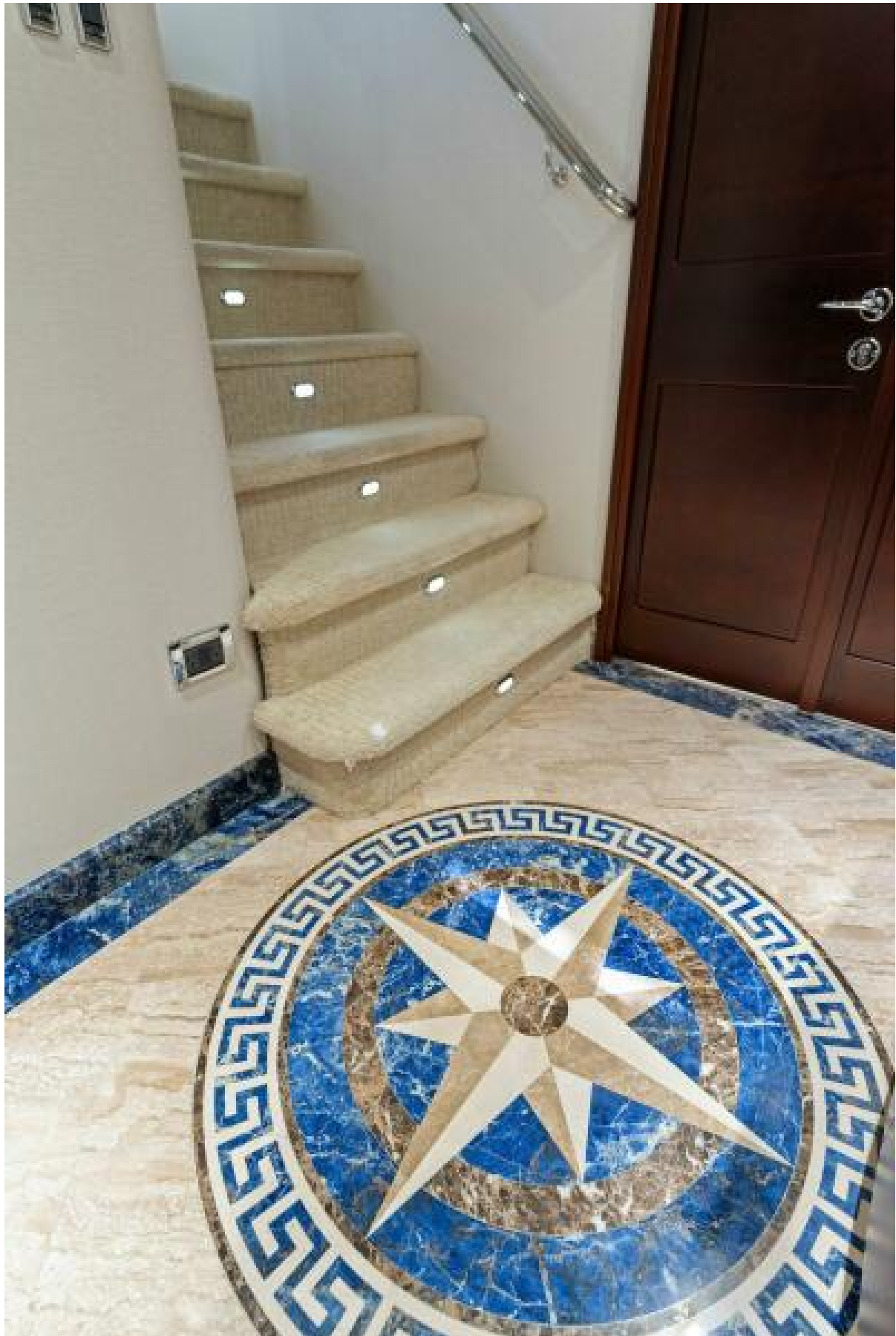
2002 112 Westport Motor Yacht Eclipse Stairway to Master Stateroom