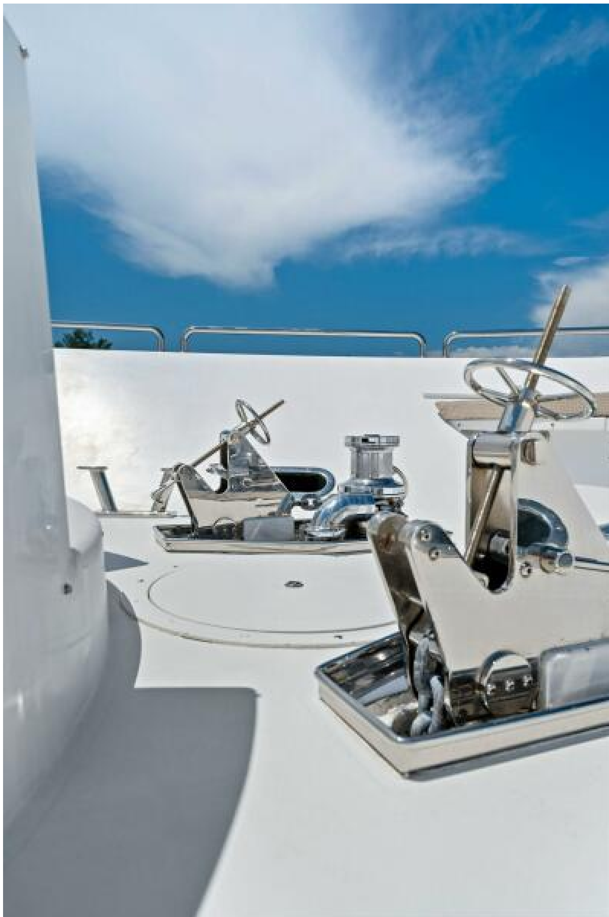
2002 112 Westport Motor Yacht Eclipse