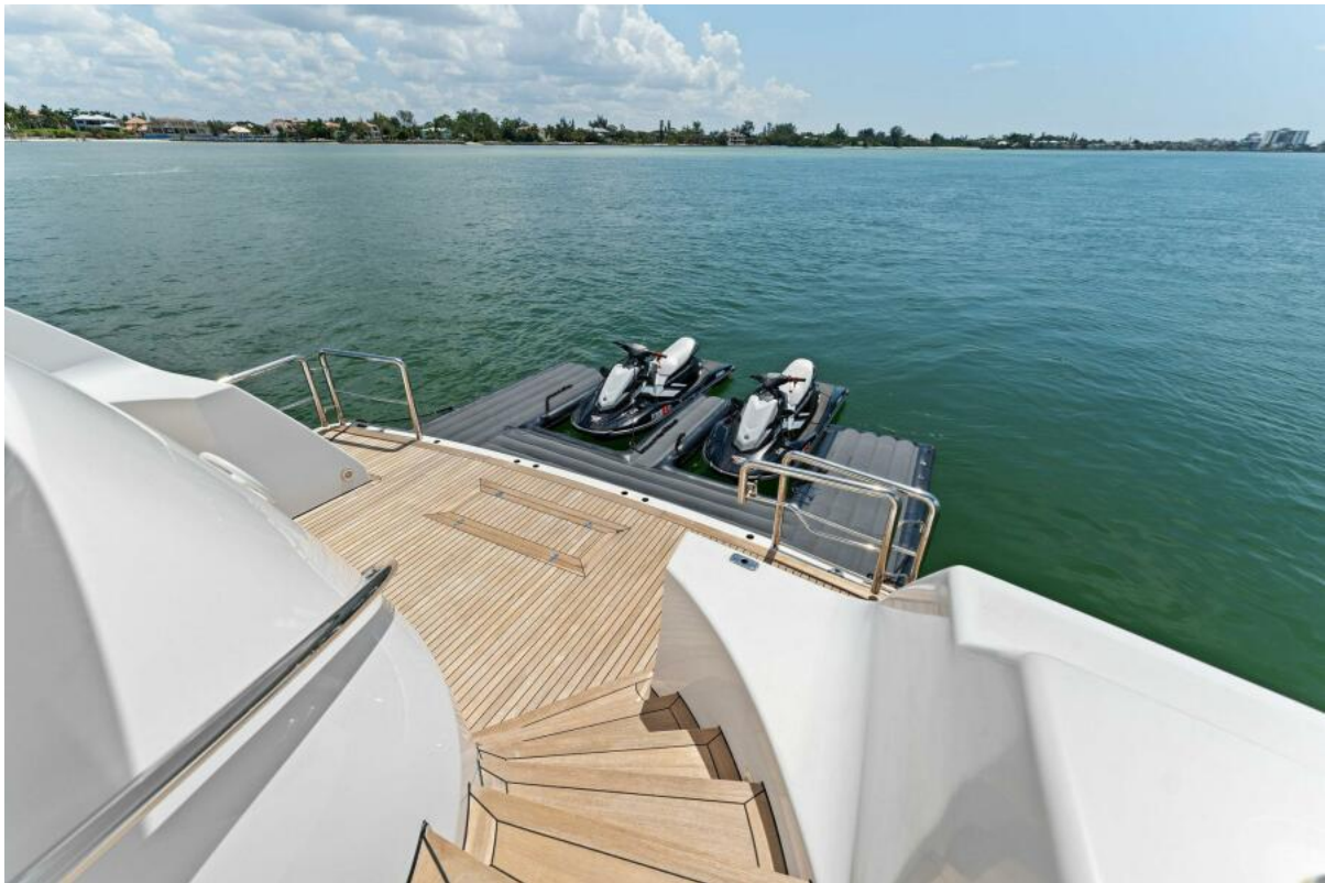
2002 112 Westport Motor Yacht Eclipse Deck