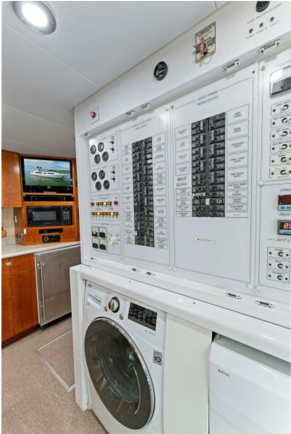
2002 112 Westport Motor Yacht Eclipse Mechanical