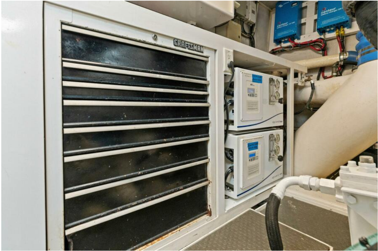
2002 112 Westport Motor Yacht Eclipse Engine Room