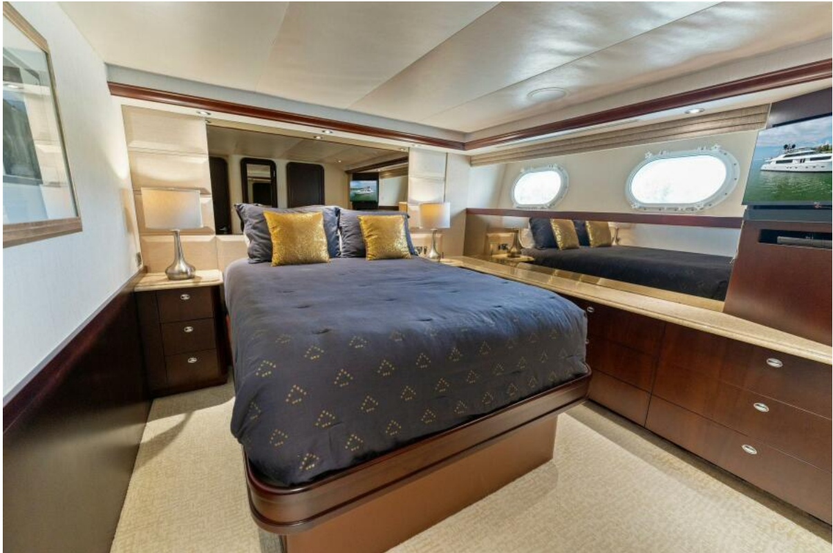
2002 112 Westport Motor Yacht Eclipse Starboard Guest Stateroom