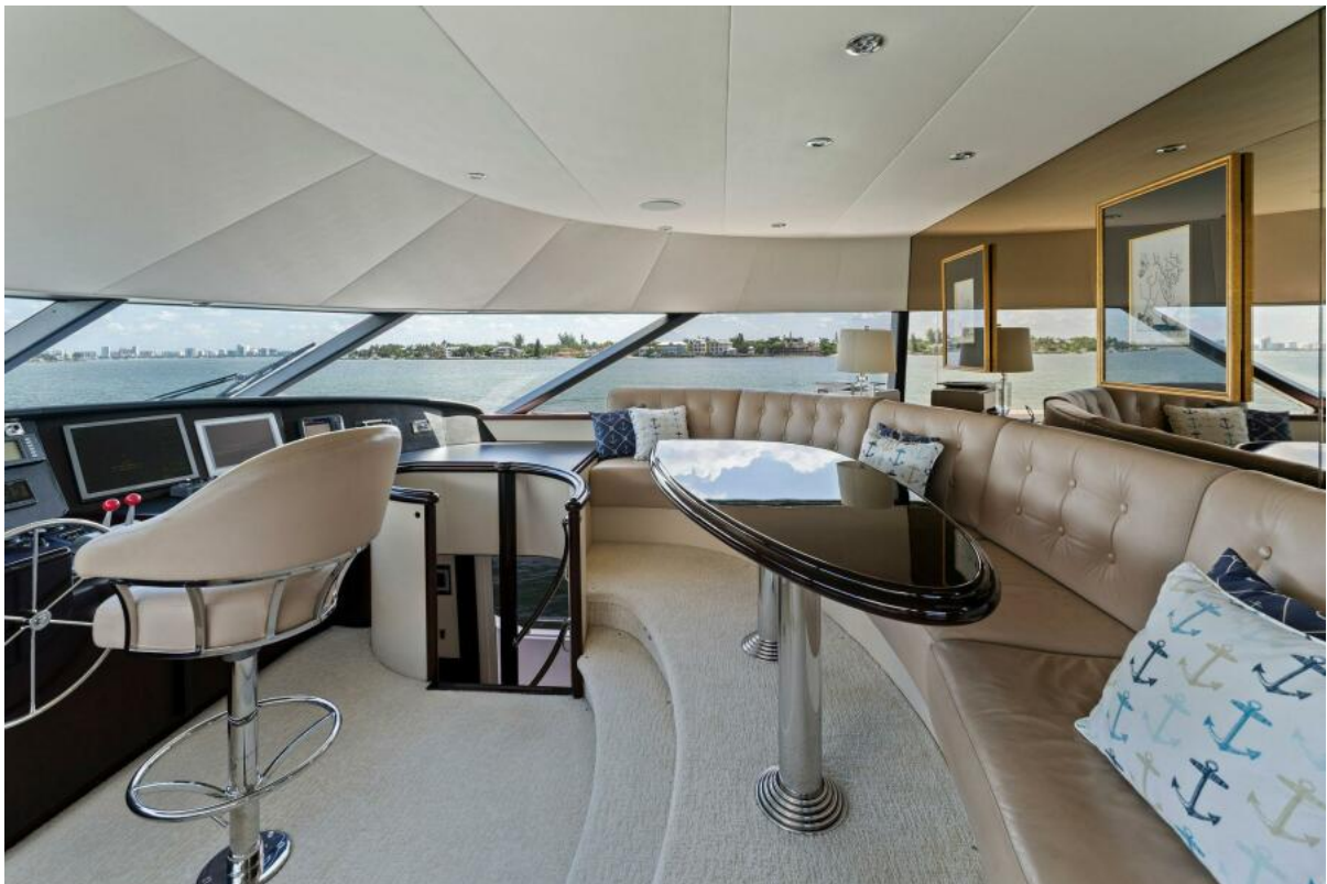
2002 112 Westport Motor Yacht Eclipse Cockpit