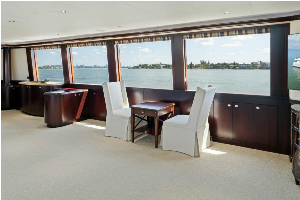
2002 112 Westport Motor Yacht Eclipse Salon