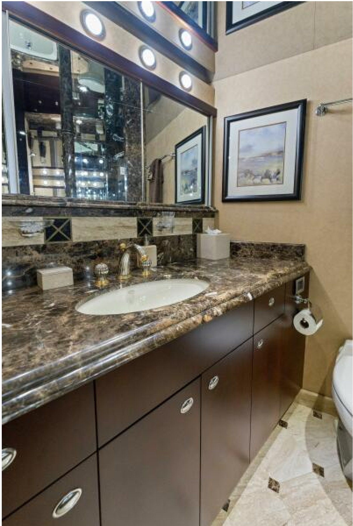
2002 112 Westport Motor Yacht Eclipse Master Head