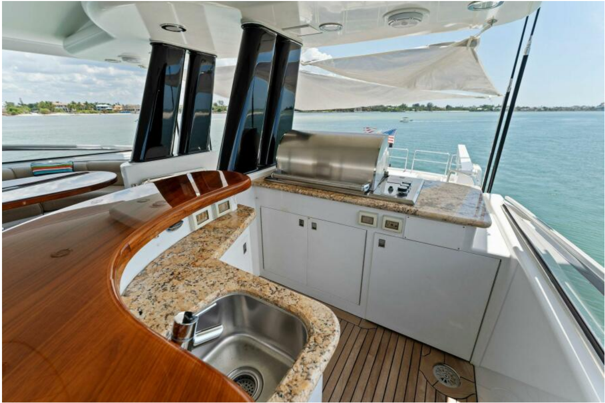
2002 112 Westport Motor Yacht Eclipse Flybridge