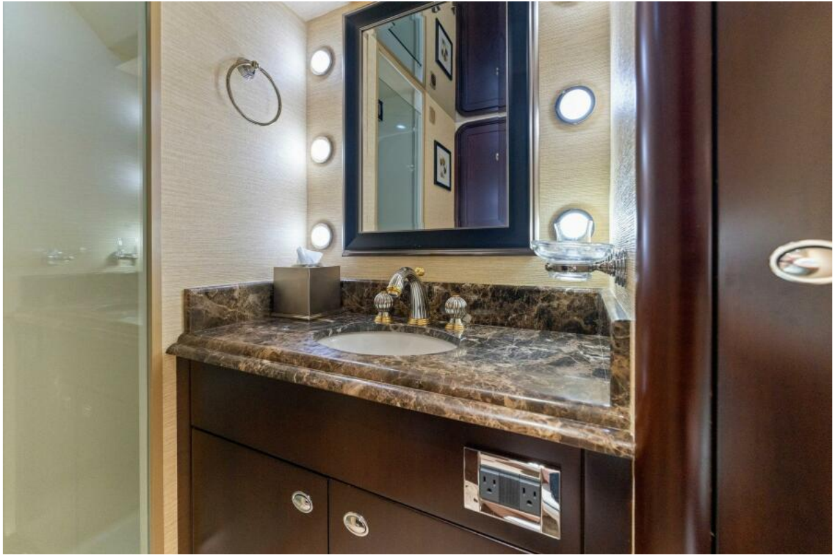
2002 112 Westport Motor Yacht Eclipse VIP Head