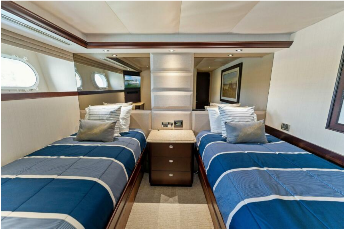
2002 112 Westport Motor Yacht Eclipse Port Guest Room