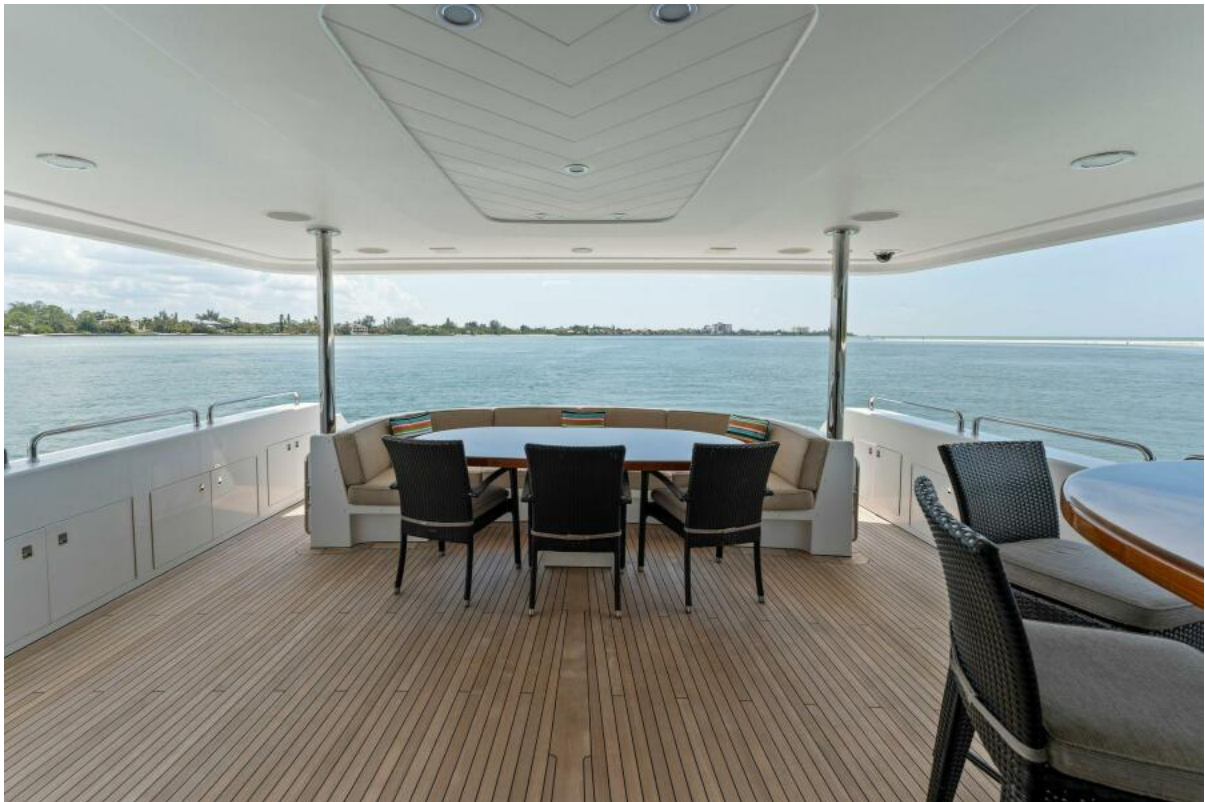
2002 112 Westport Motor Yacht Eclipse Cockpit