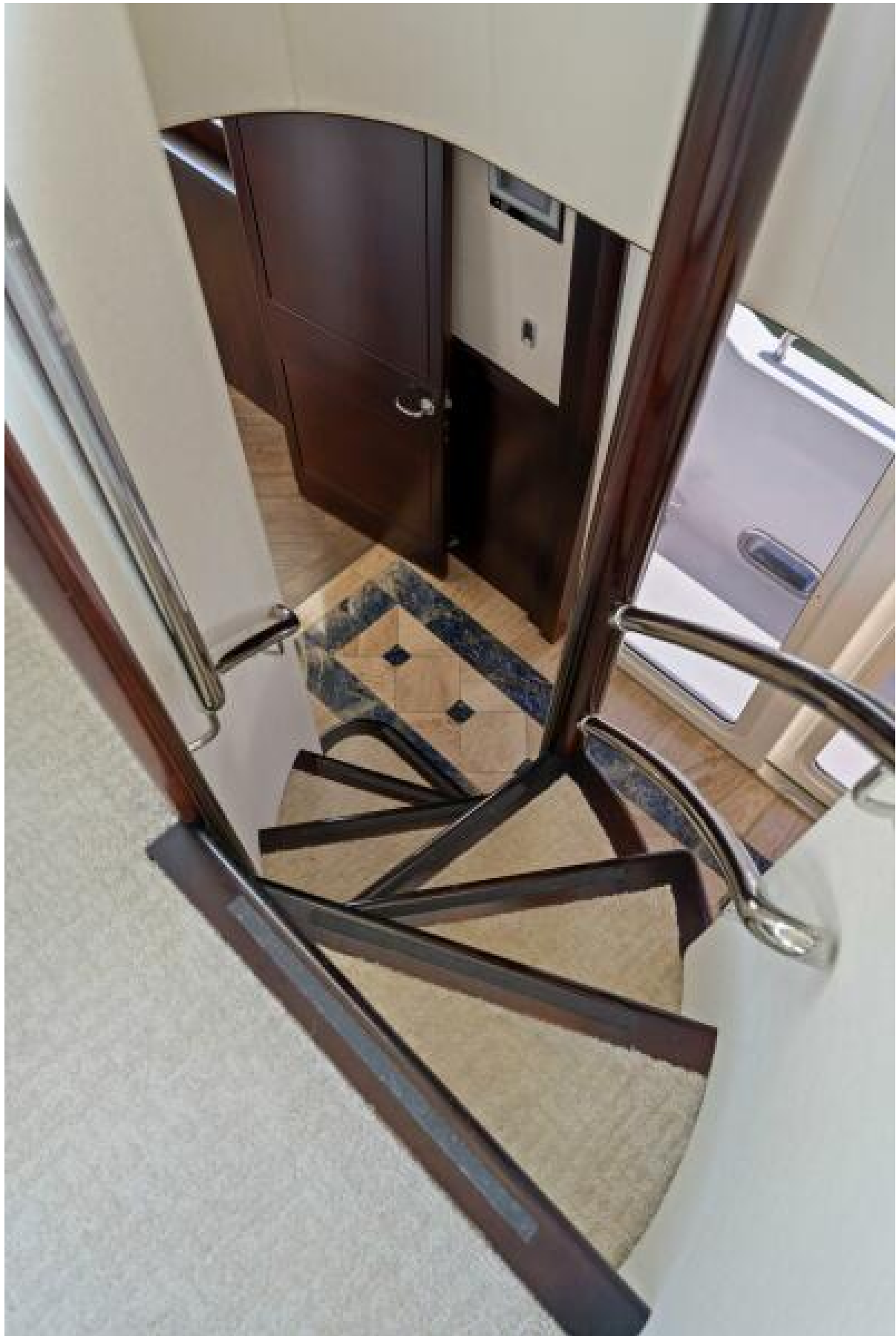
2002 112 Westport Motor Yacht Eclipse Stairway to Cockpit