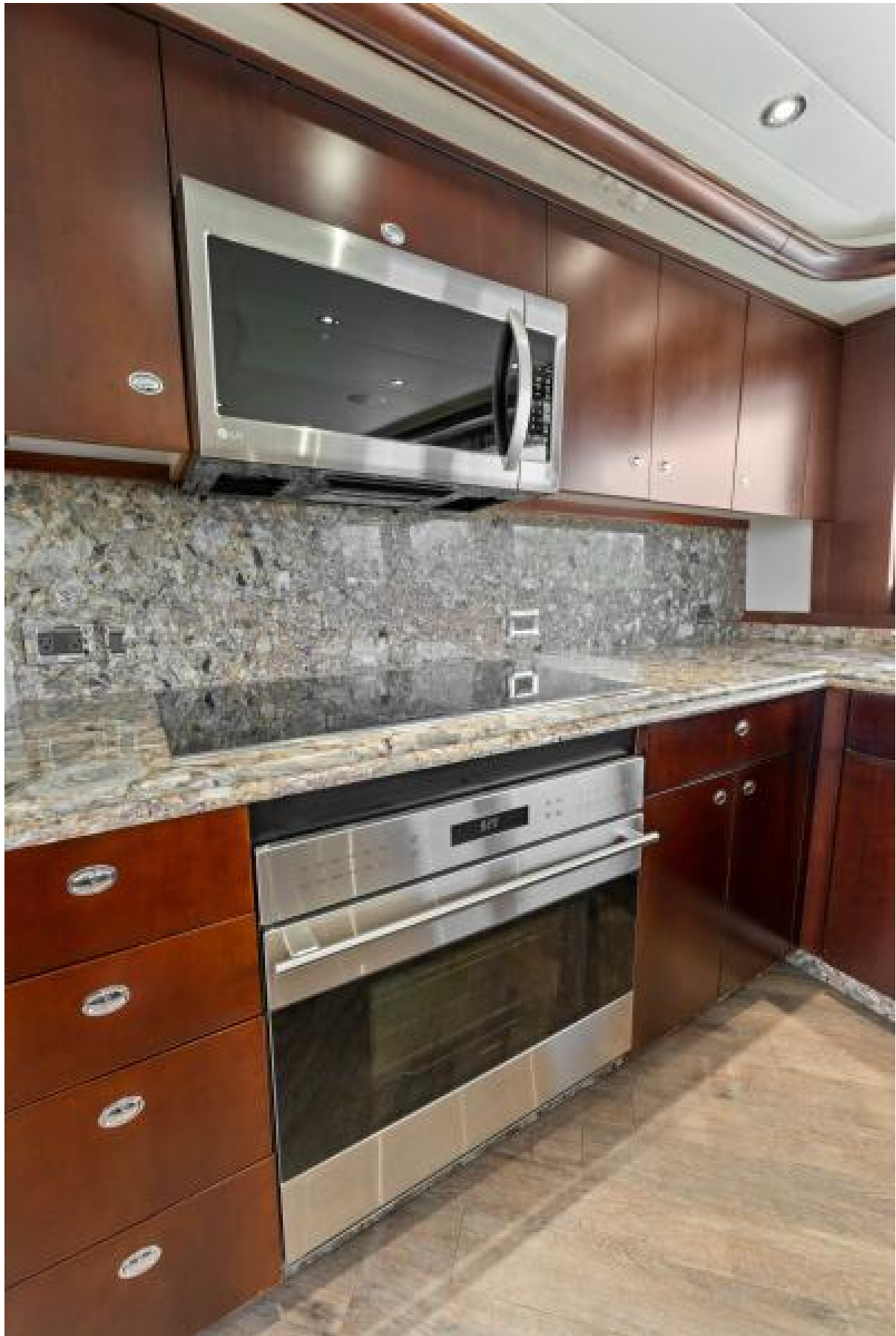
2002 112 Westport Motor Yacht Eclipse Galley