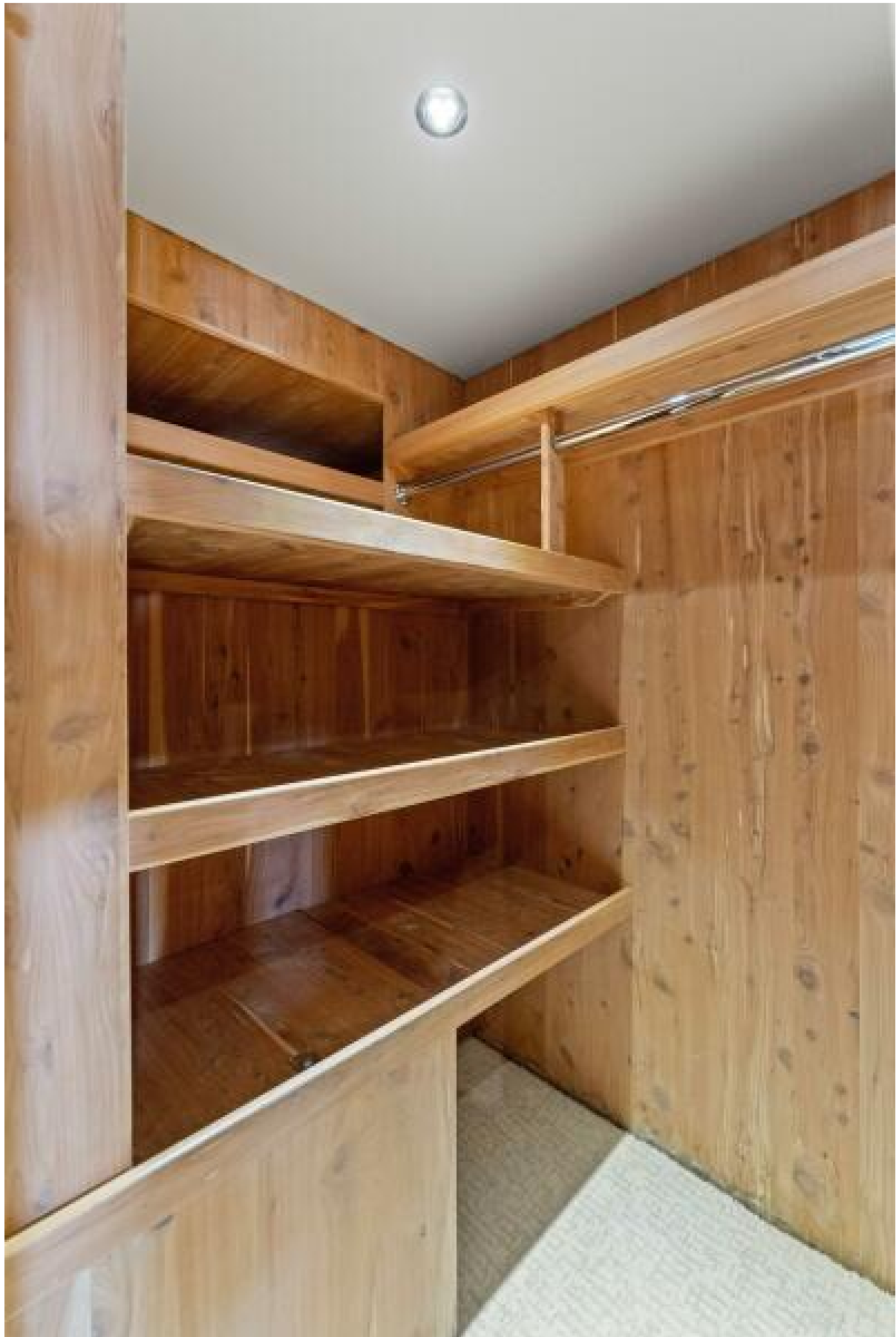
2002 112 Westport Motor Yacht Eclipse Master Stateroom Cedar Closet