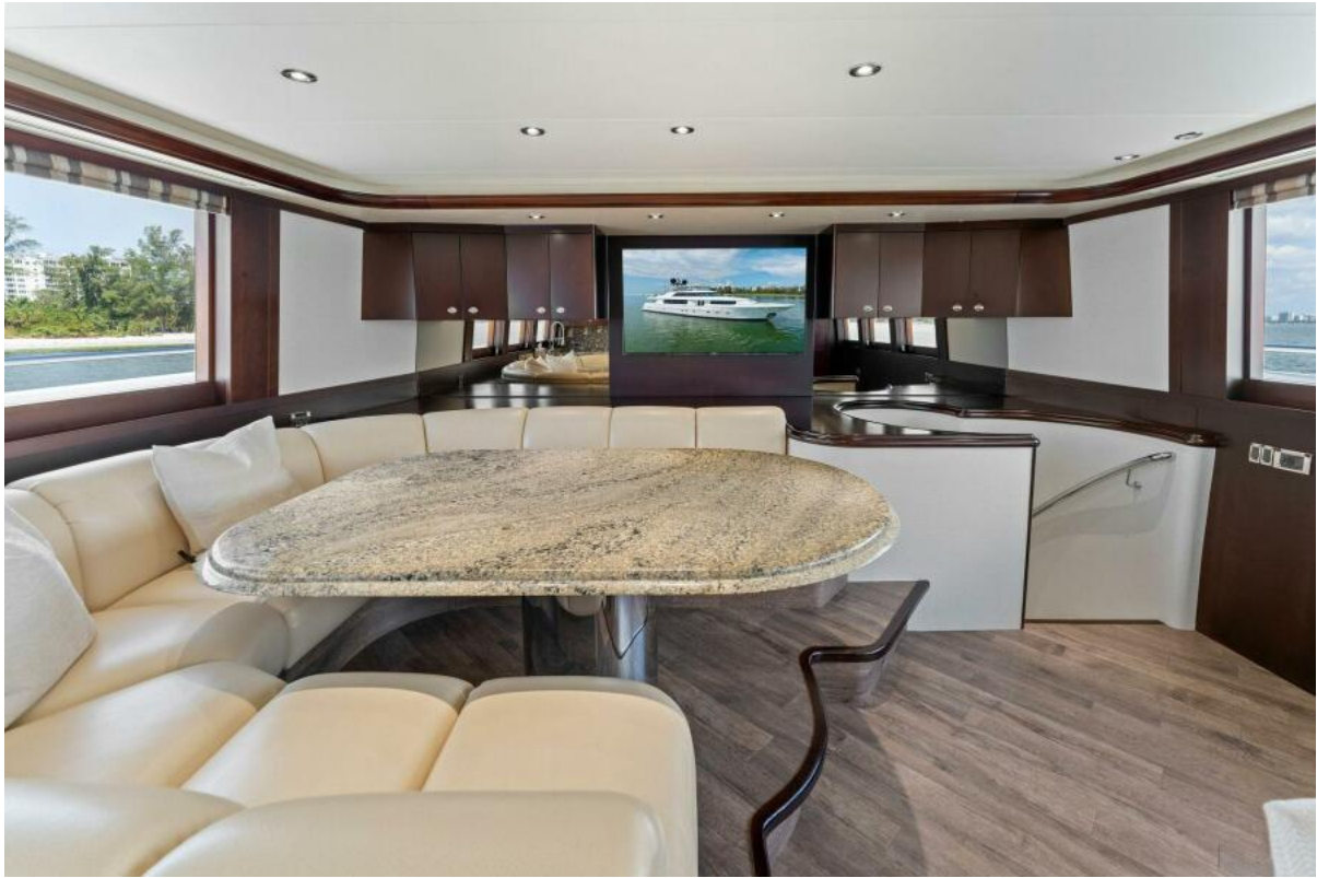
2002 112 Westport Motor Yacht Eclipse Galley