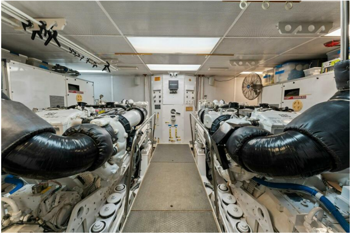
2002 112 Westport Motor Yacht Eclipse Engine Room