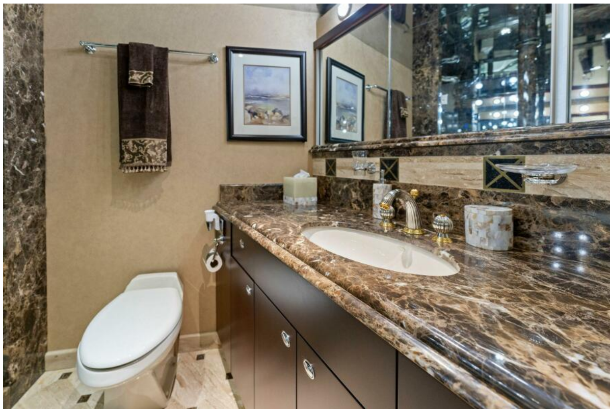
2002 112 Westport Motor Yacht Eclipse Master Head