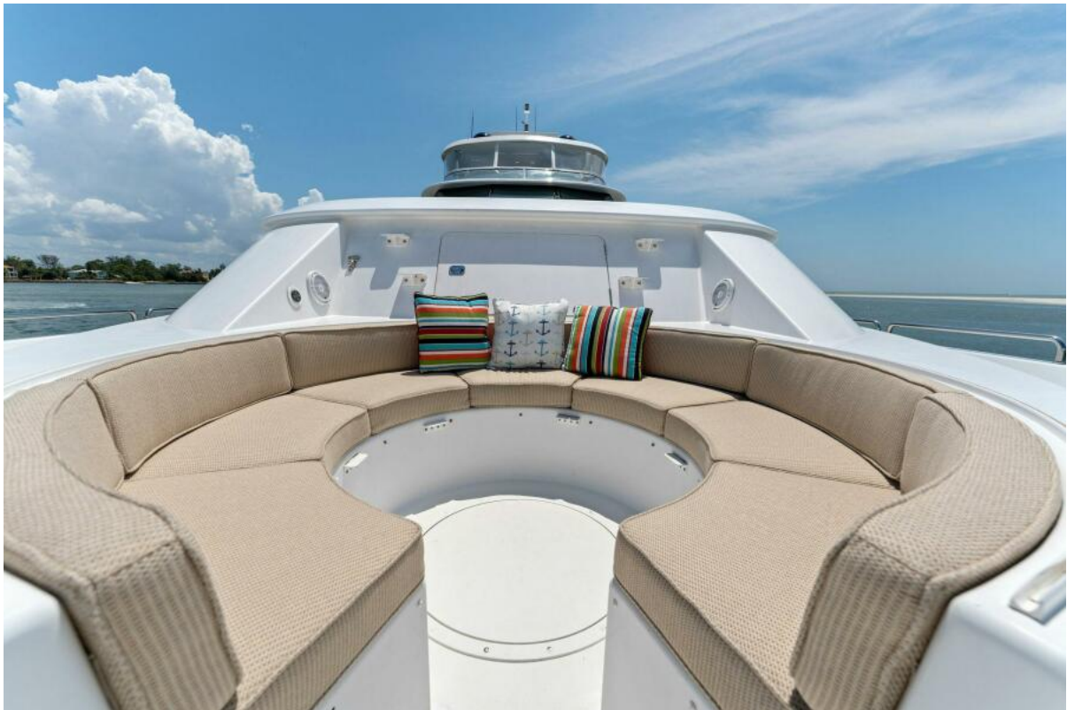
2002 112 Westport Motor Yacht Eclipse Fore Deck