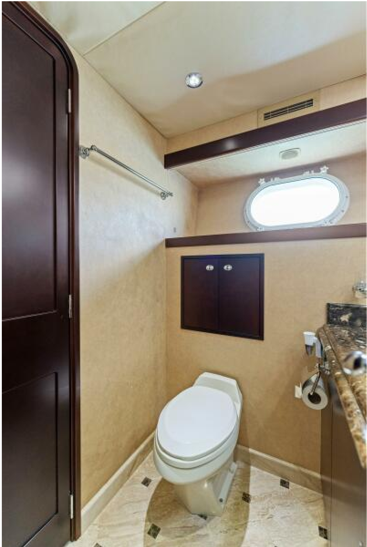
2002 112 Westport Motor Yacht Eclipse Port Guest Head