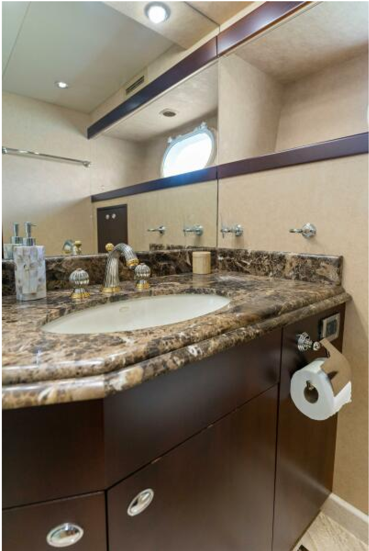
2002 112 Westport Motor Yacht Eclipse Port Guest Head