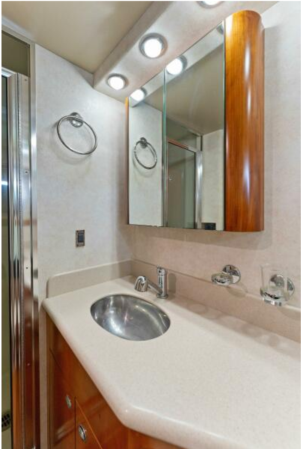
2002 112 Westport Motor Yacht Eclipse Crew Head