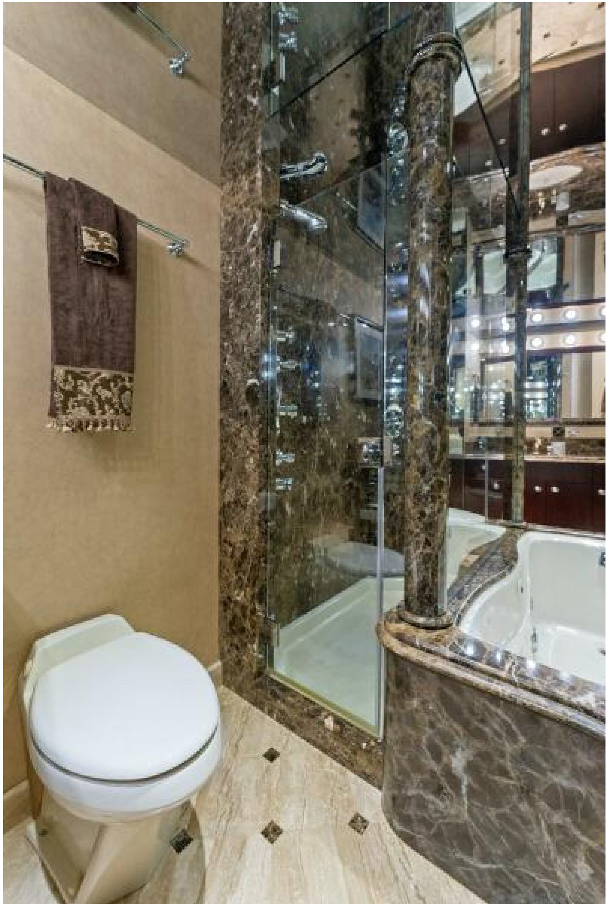
2002 112 Westport Motor Yacht Eclipse Master Head