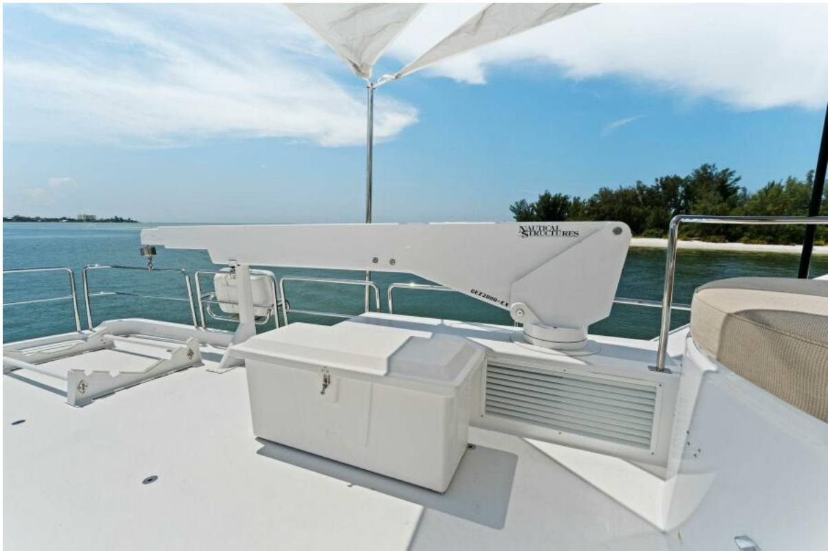
2002 112 Westport Motor Yacht Eclipse Flybridge