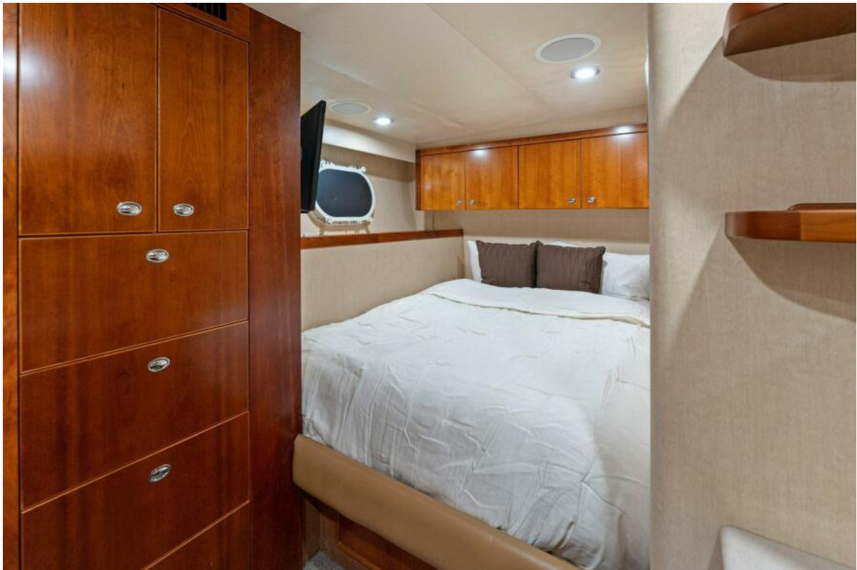
2002 112 Westport Motor Yacht Eclipse Crew Quarters