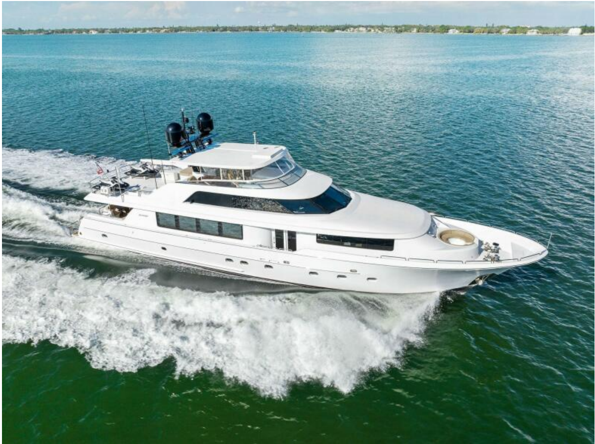
2002 112 Westport Motor Yacht Eclipse Aerial View