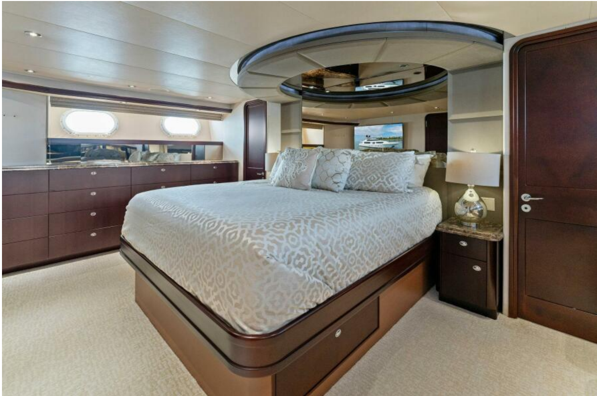
2002 112 Westport Motor Yacht Eclipse Master Stateroom