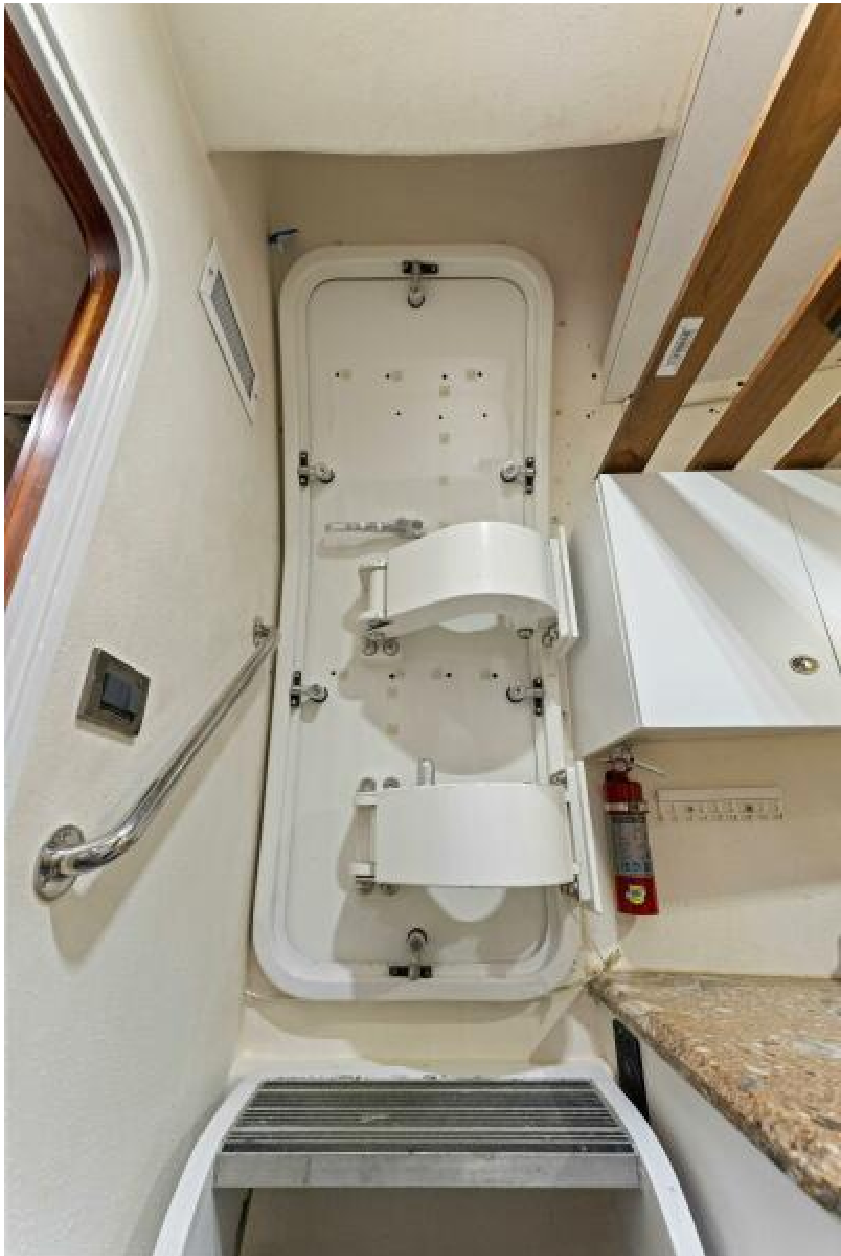
2002 112 Westport Motor Yacht Eclipse Engine Room