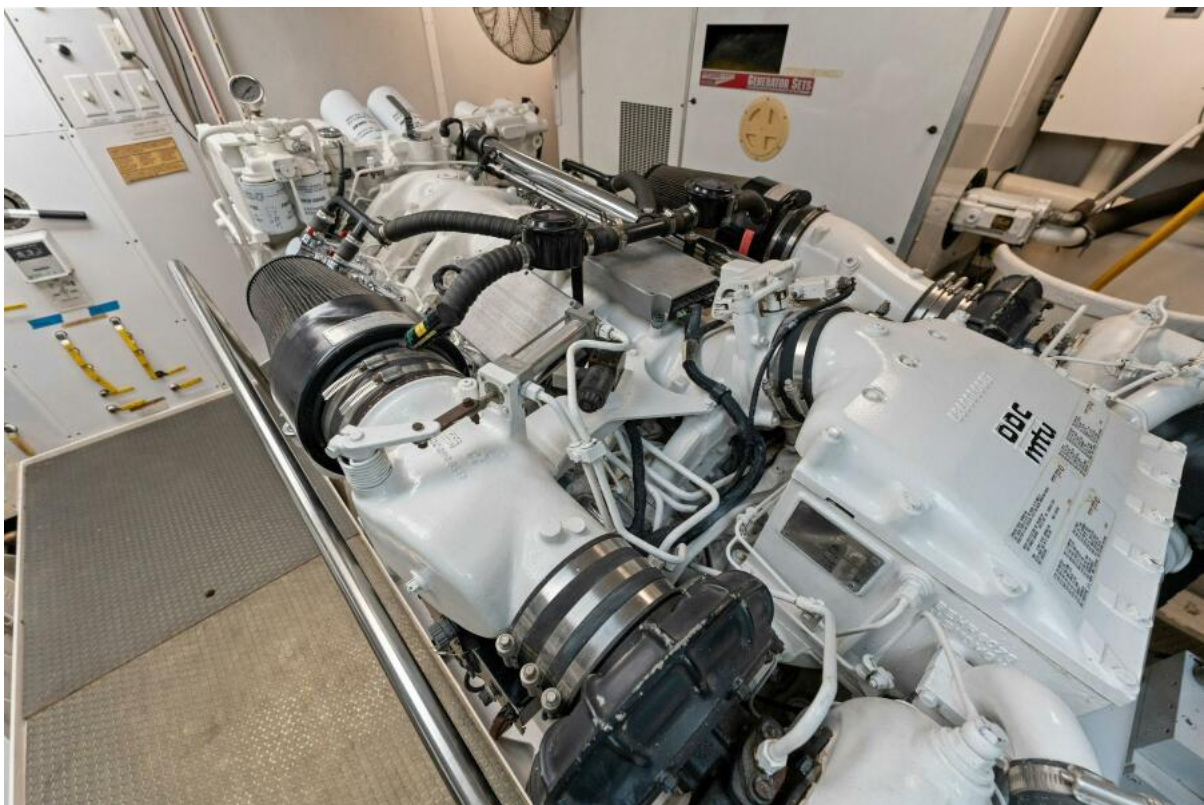
2002 112 Westport Motor Yacht Eclipse Engine Room