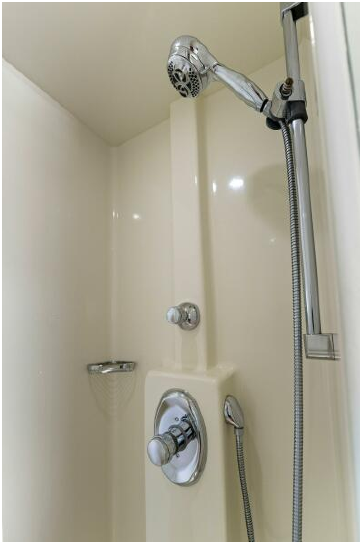
2002 112 Westport Motor Yacht Eclipse Port Guest Head