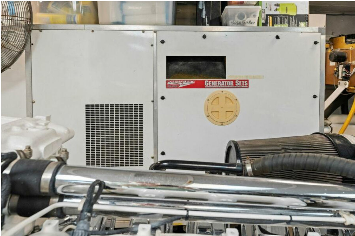
2002 112 Westport Motor Yacht Eclipse Engine Room