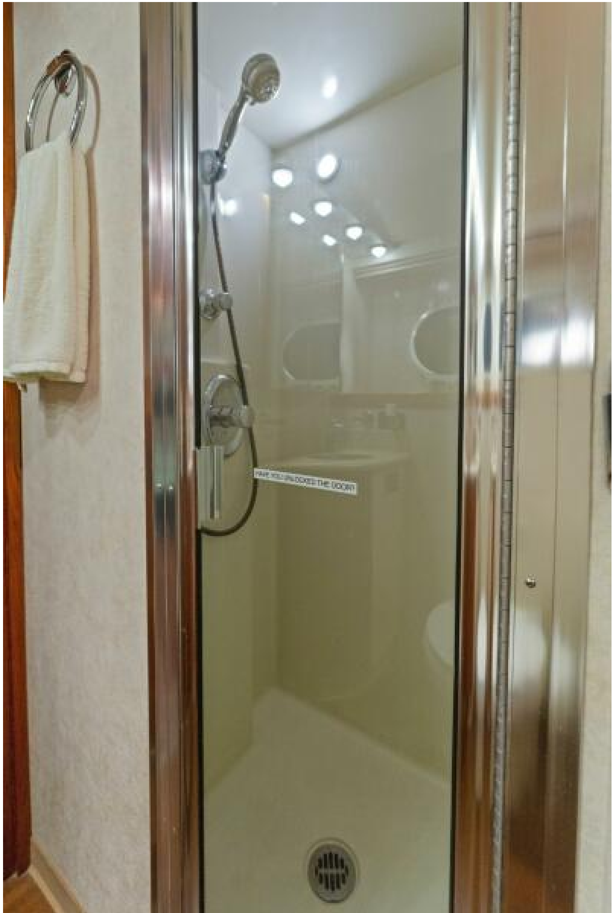
2002 112 Westport Motor Yacht Eclipse Crew Head