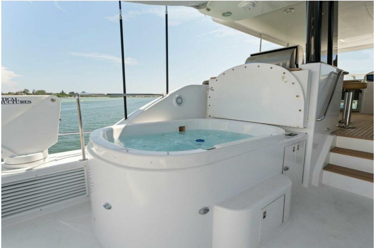
2002 112 Westport Motor Yacht Eclipse Fore Deck