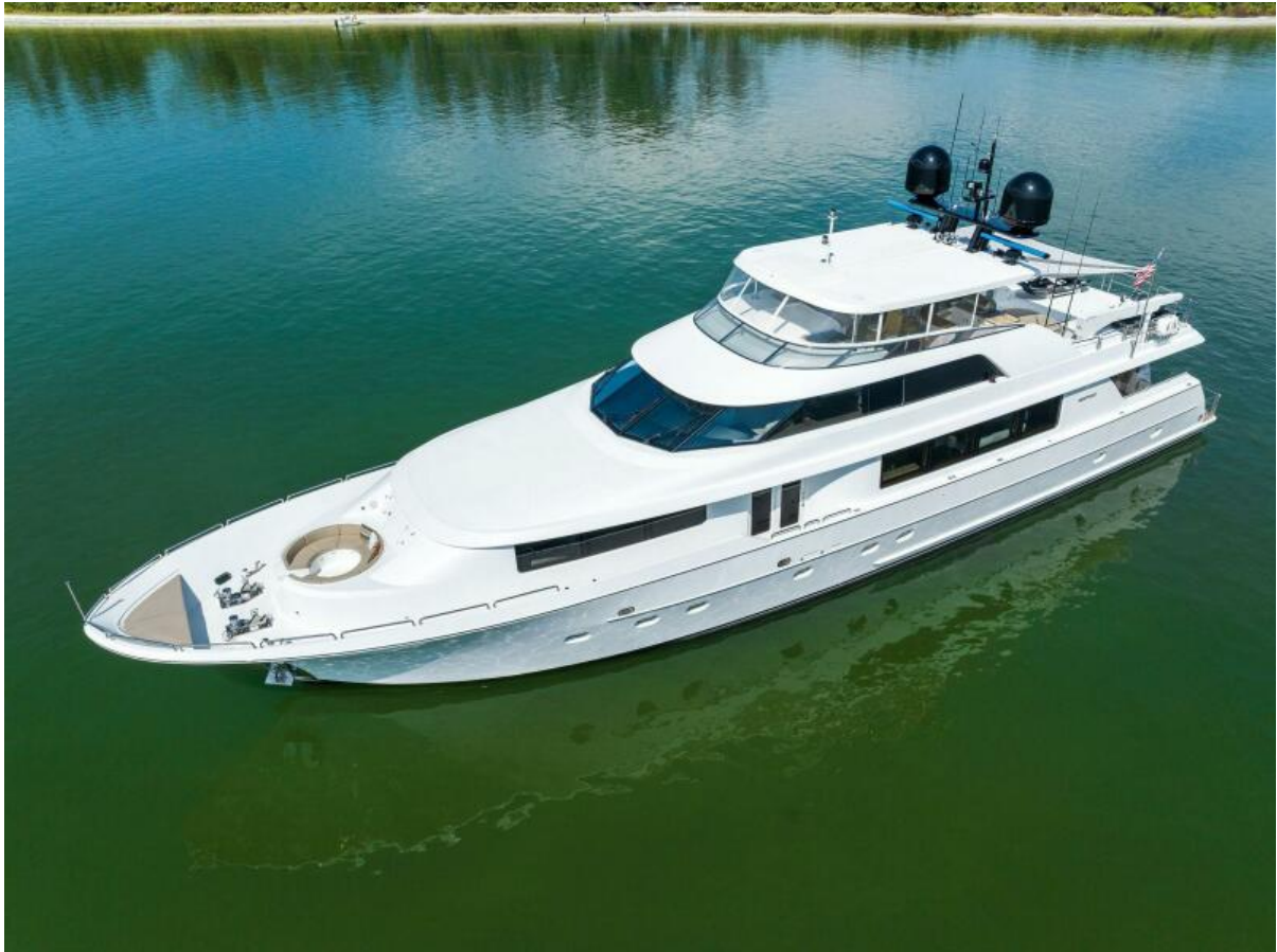
2002 112 Westport Motor Yacht Eclipse Aerial View