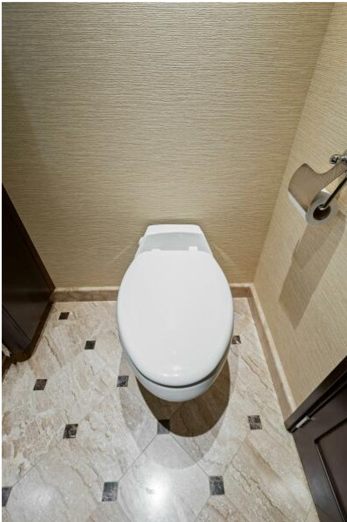
2002 112 Westport Motor Yacht Eclipse VIP Head