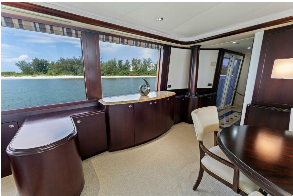
2002 112 Westport Motor Yacht Eclipse Salon