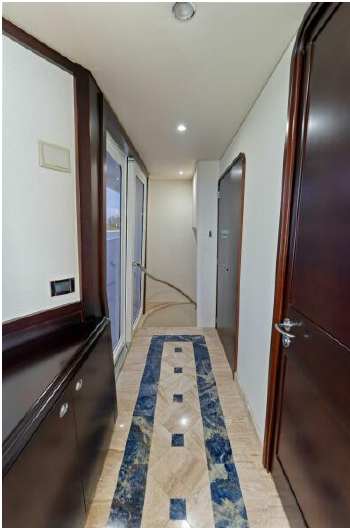
2002 112 Westport Motor Yacht Eclipse Companionway