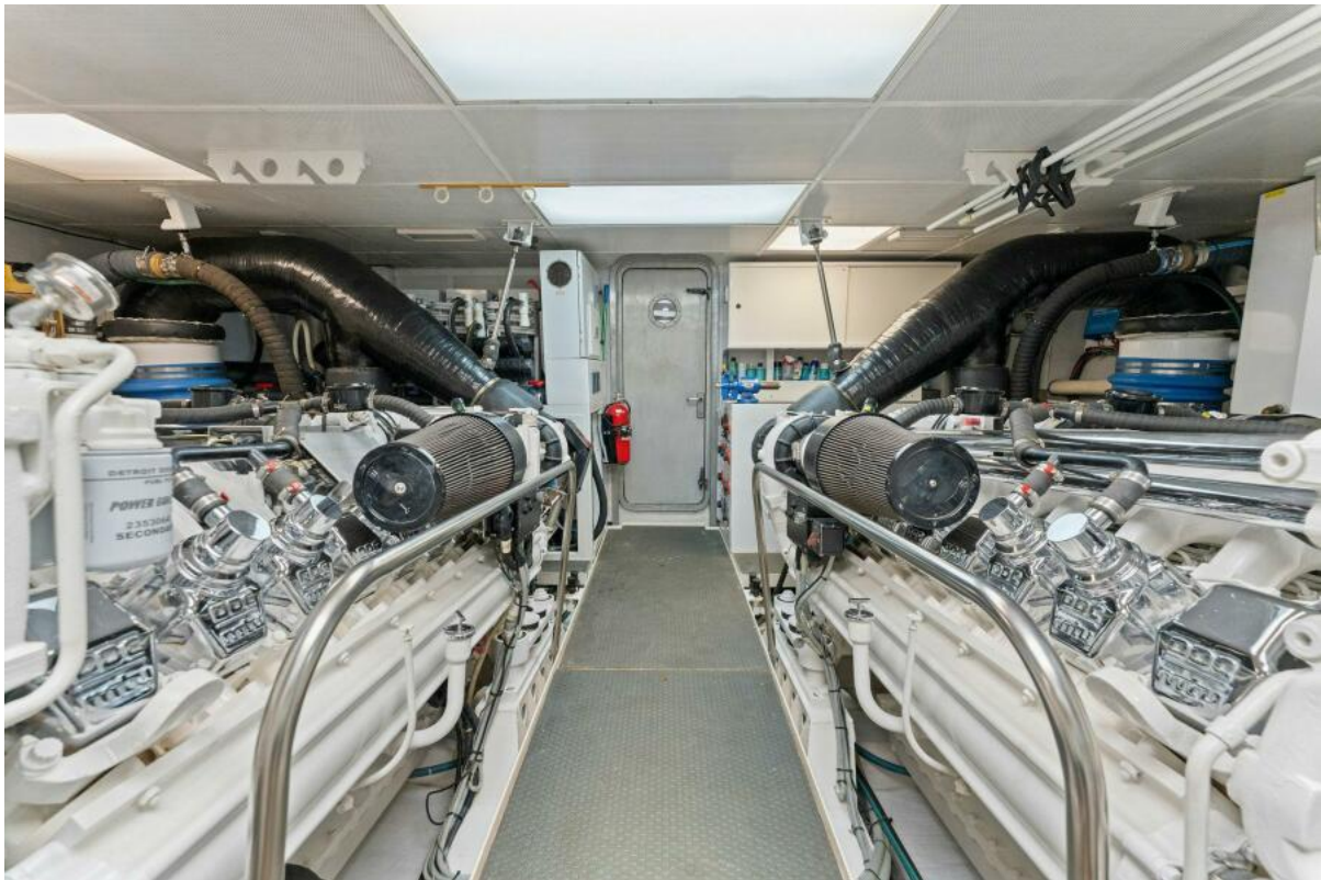
2002 112 Westport Motor Yacht Eclipse Engine Room