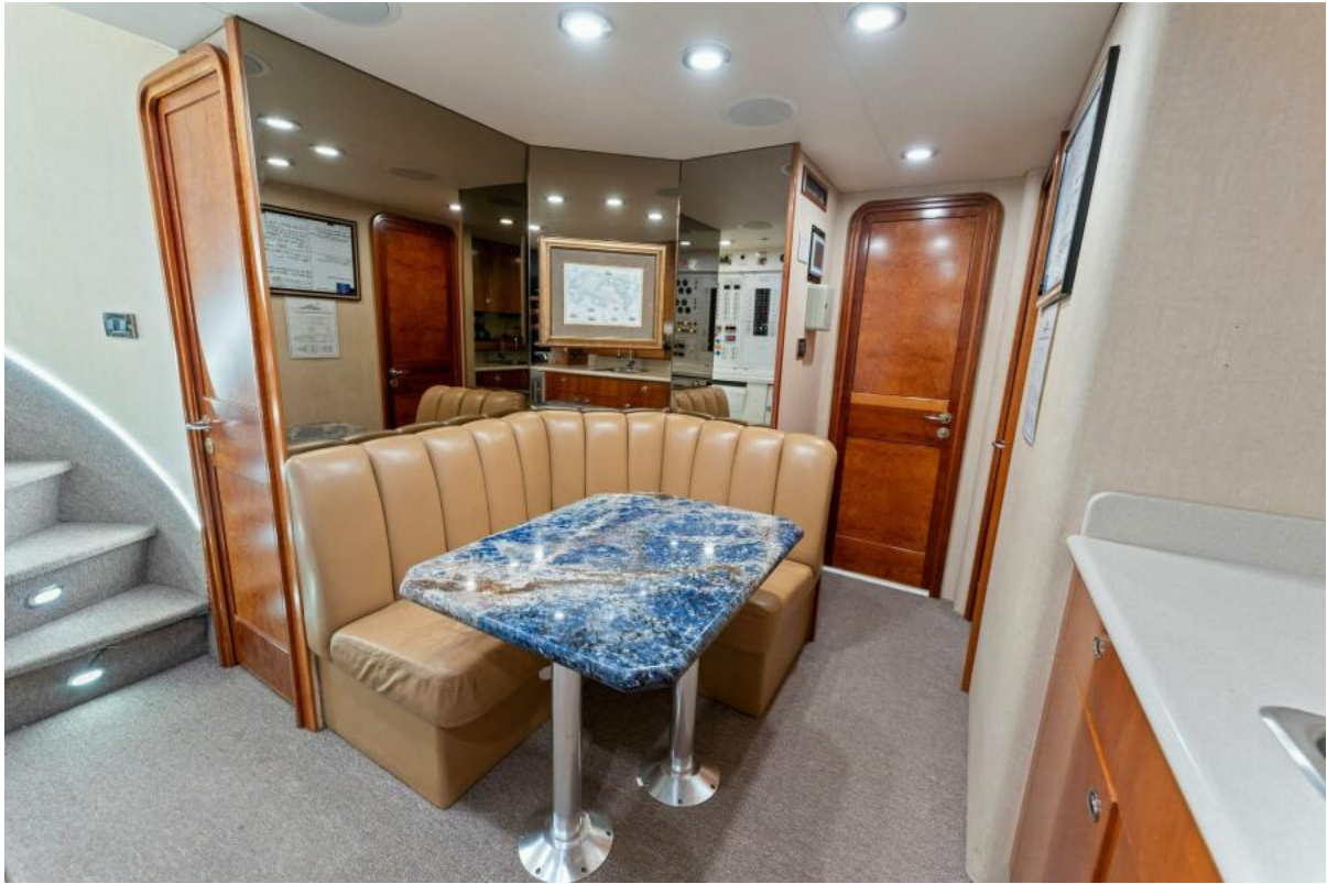
2002 112 Westport Motor Yacht Eclipse Crew Quarters