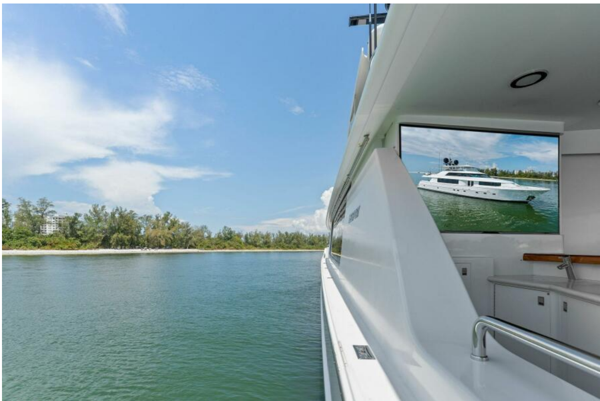
2002 112 Westport Motor Yacht Eclipse