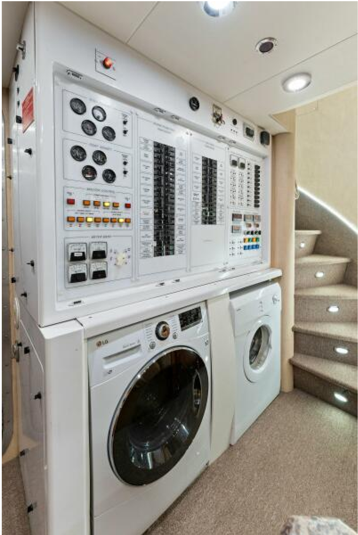
2002 112 Westport Motor Yacht Eclipse Mechanical