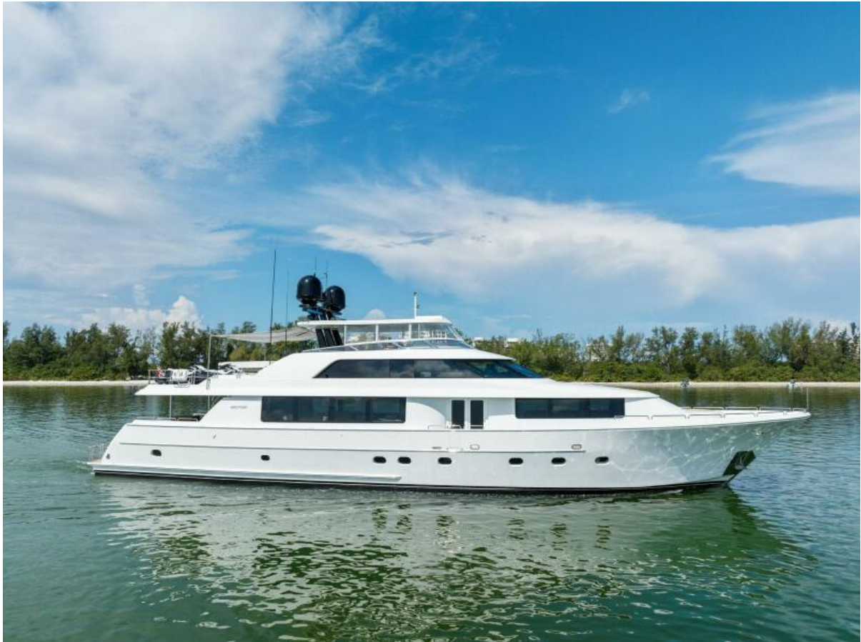
2002 112 Westport Motor Yacht Eclipse Profile