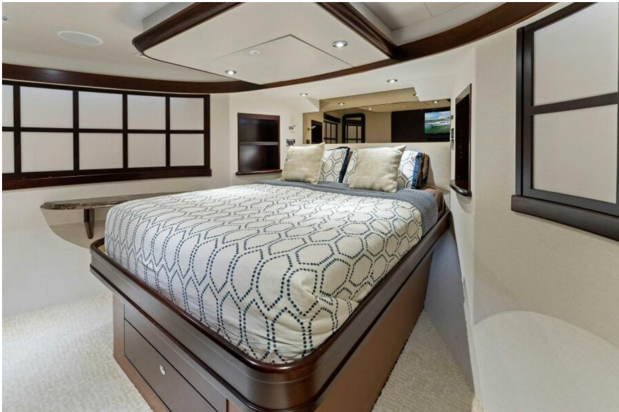
2002 112 Westport Motor Yacht Eclipse VIP Stateroom