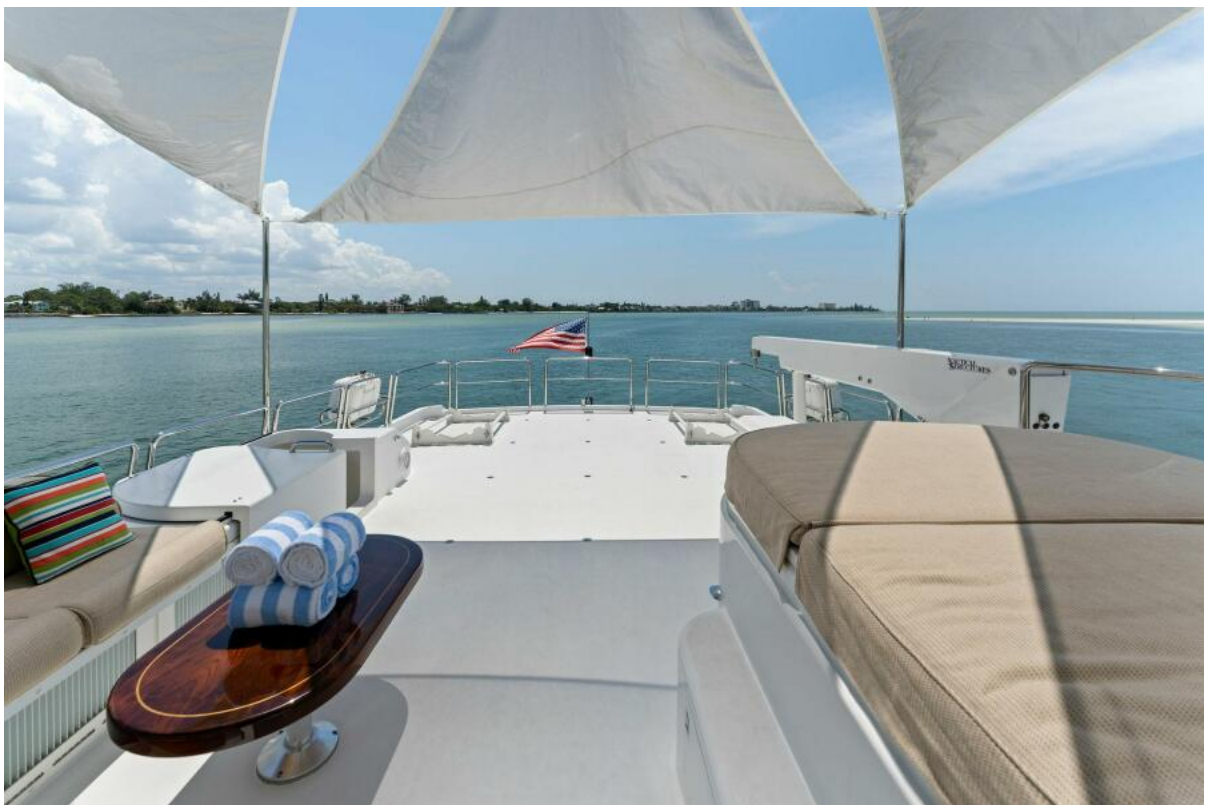
2002 112 Westport Motor Yacht Eclipse Deck