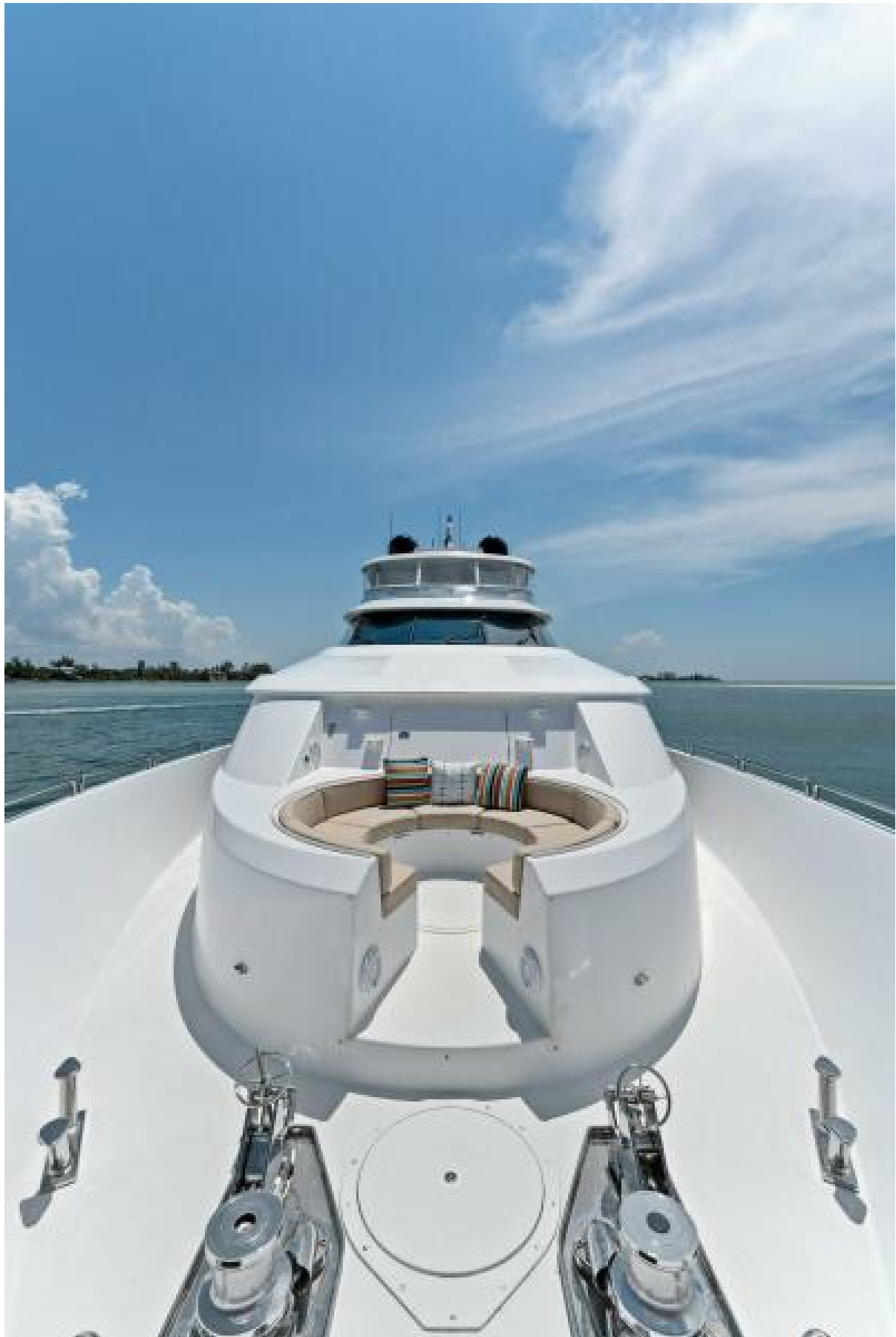
2002 112 Westport Motor Yacht Eclipse Fore Deck