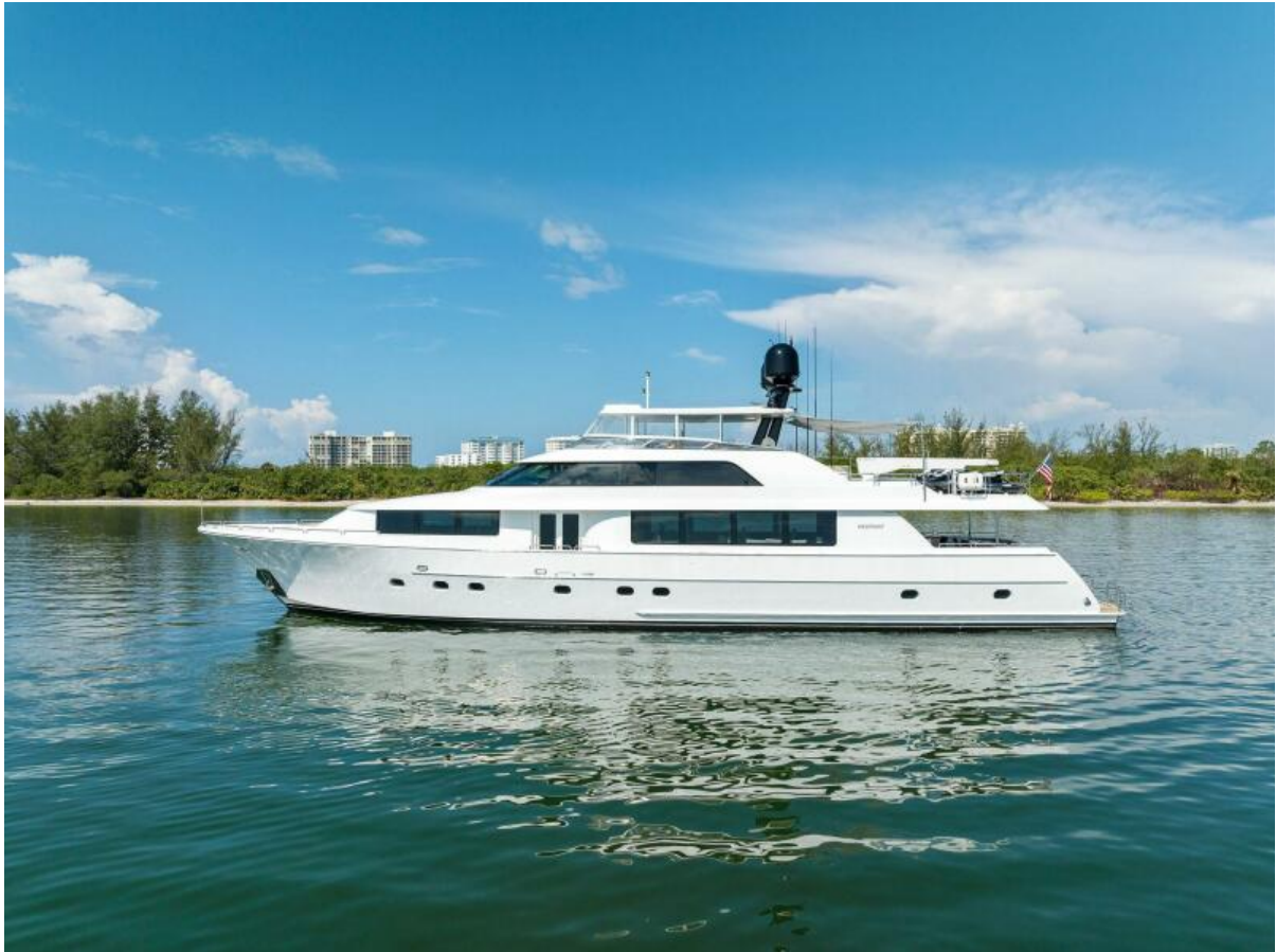
2002 112 Westport Motor Yacht Eclipse Profile