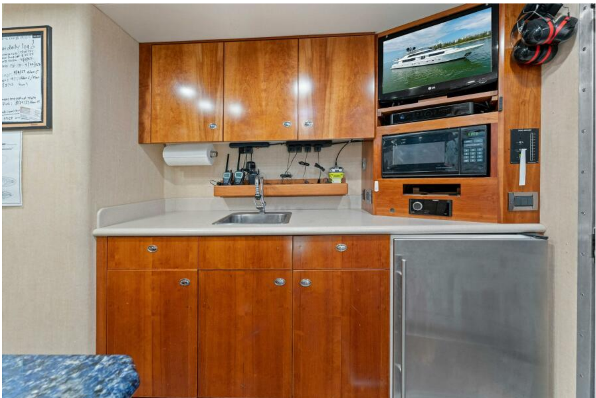
2002 112 Westport Motor Yacht Eclipse Crew Quarters