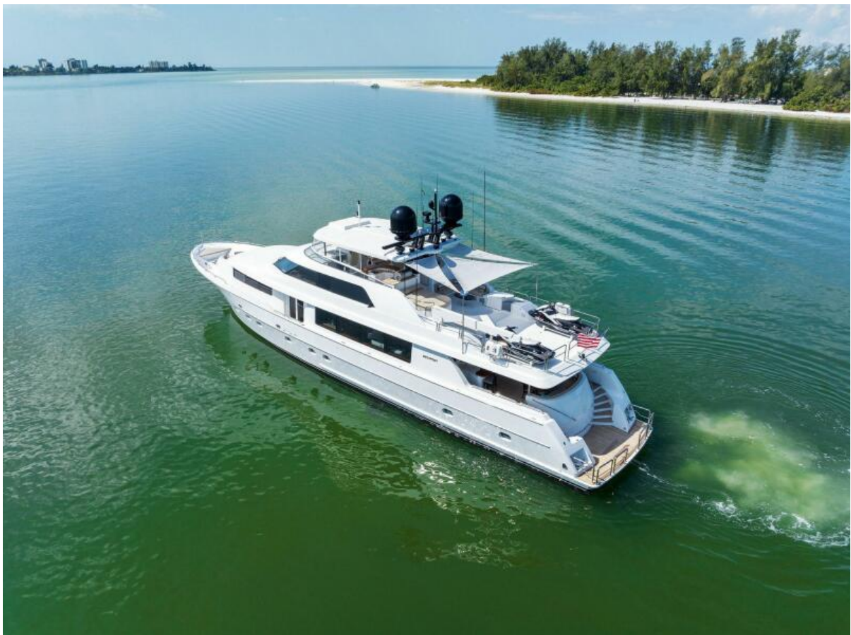
2002 112 Westport Motor Yacht Eclipse Aerial View