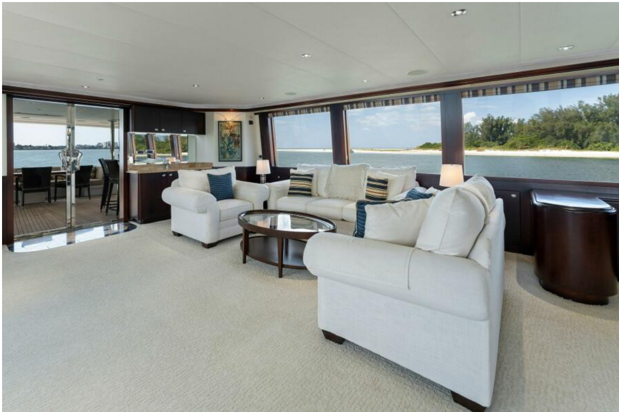
2002 112 Westport Motor Yacht Eclipse Salon