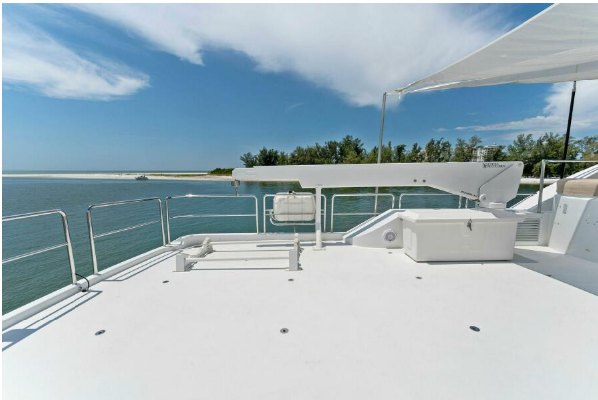
2002 112 Westport Motor Yacht Eclipse Flybridge