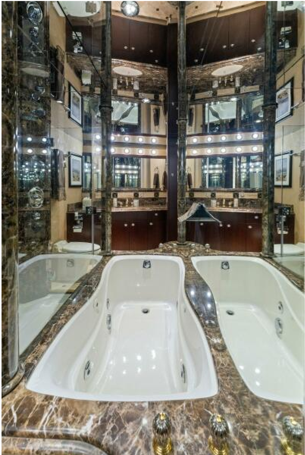
2002 112 Westport Motor Yacht Eclipse Master Head