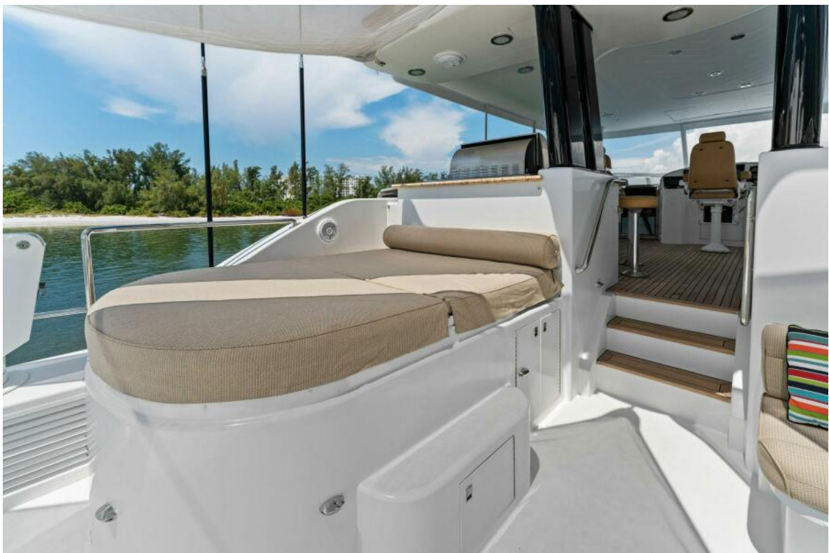
2002 112 Westport Motor Yacht Eclipse Deck