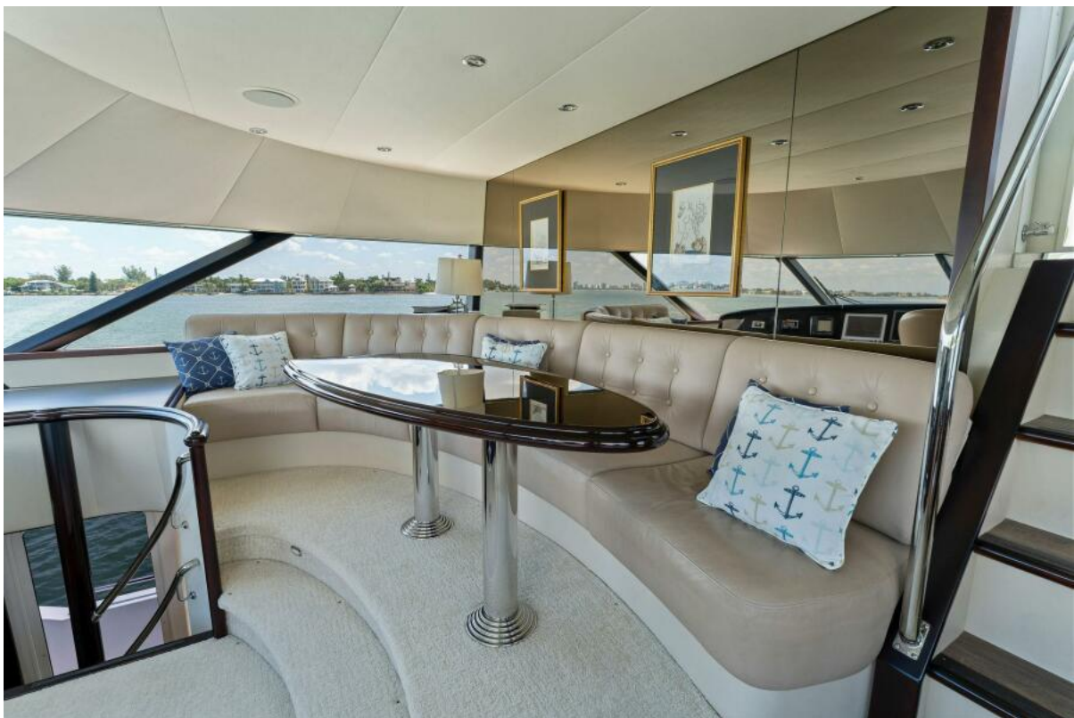
2002 112 Westport Motor Yacht Eclipse Cockpit