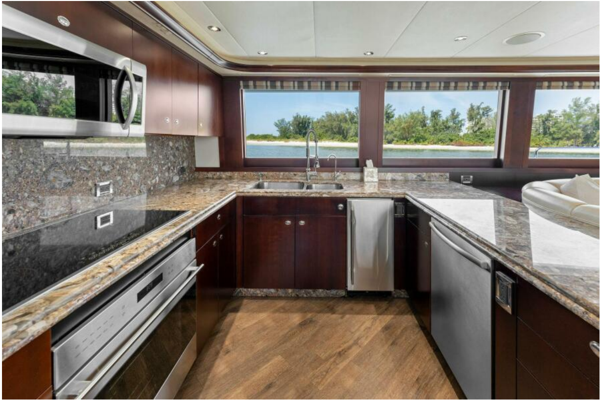
2002 112 Westport Motor Yacht Eclipse Galley