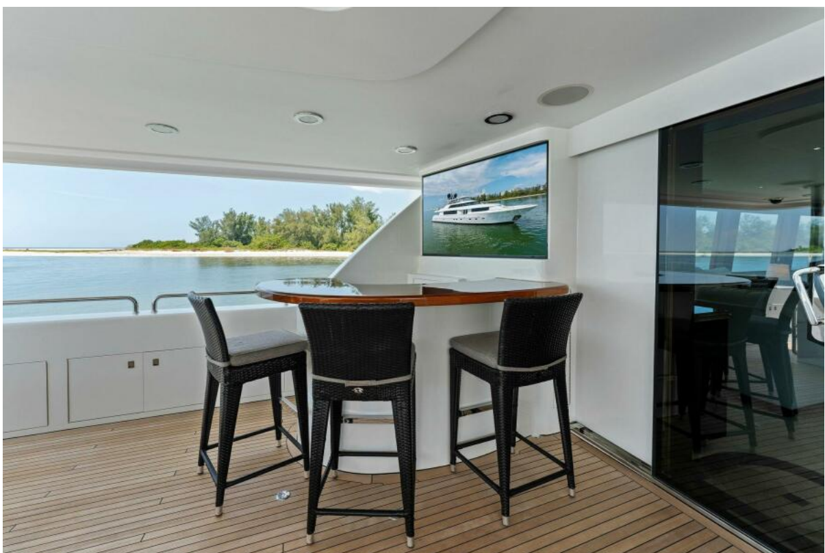
2002 112 Westport Motor Yacht Eclipse Cockpit