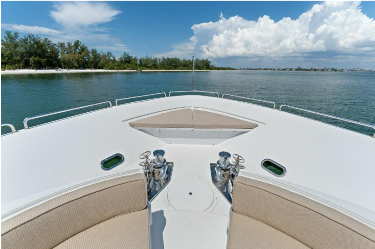
2002 112 Westport Motor Yacht Eclipse Fore Deck