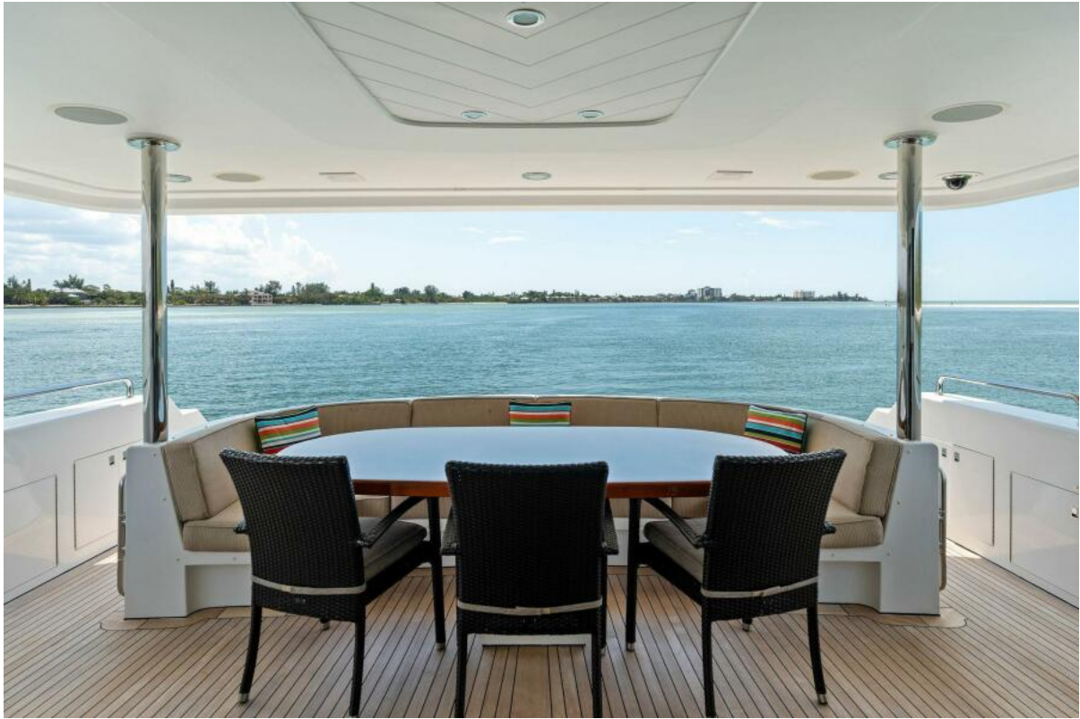
2002 112 Westport Motor Yacht Eclipse Deck