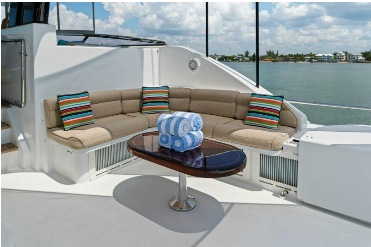
2002 112 Westport Motor Yacht Eclipse Deck