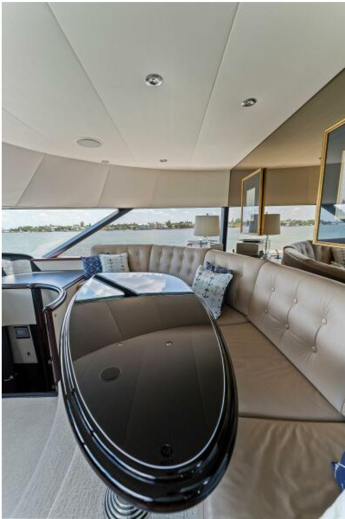
2002 112 Westport Motor Yacht Eclipse Cockpit