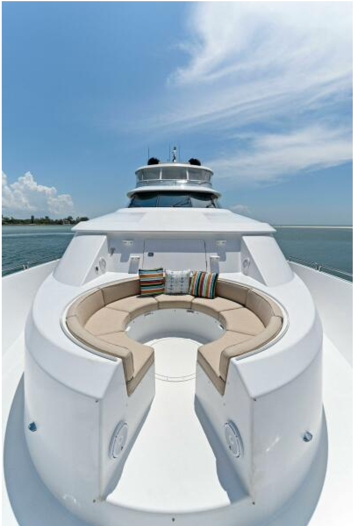
2002 112 Westport Motor Yacht Eclipse Fore Deck