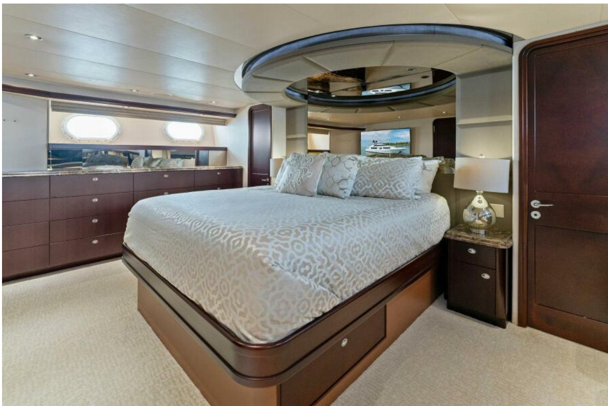
0002002 112 Westport Motor Yacht Eclipse Master Stateroom