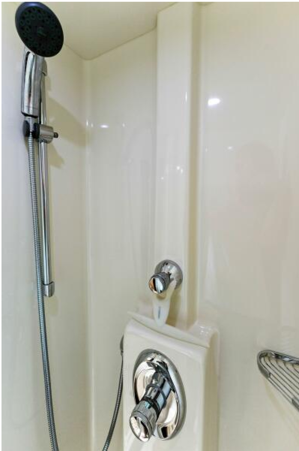
2002 112 Westport Motor Yacht Eclipse Starboard Guest Head