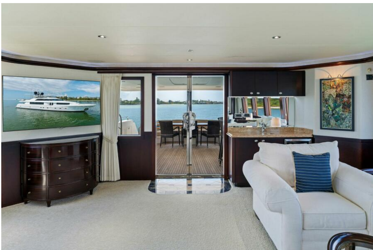
2002 112 Westport Motor Yacht Eclipse Salon