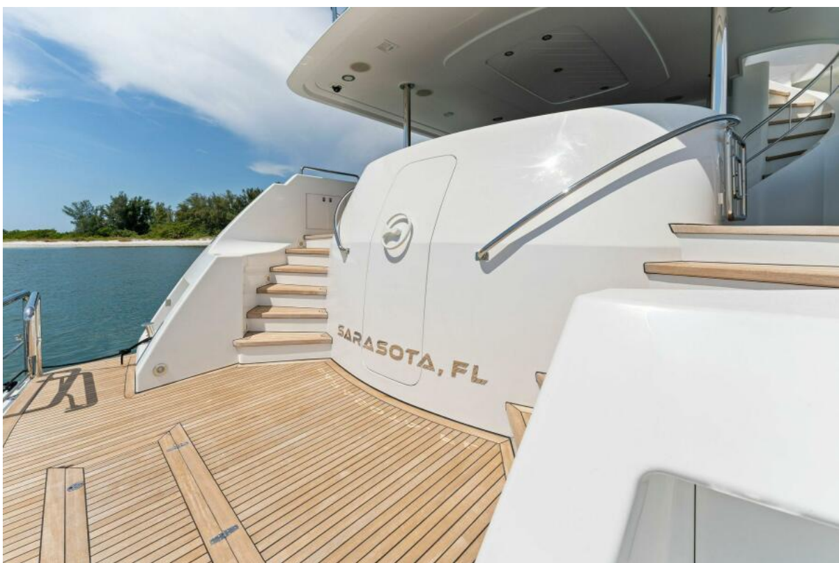
2002 112 Westport Motor Yacht Eclipse Deck