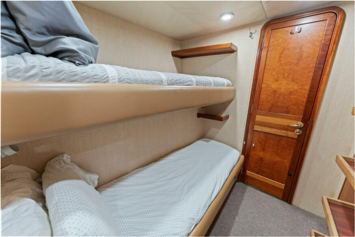
2002 112 Westport Motor Yacht Eclipse Crew Quarters