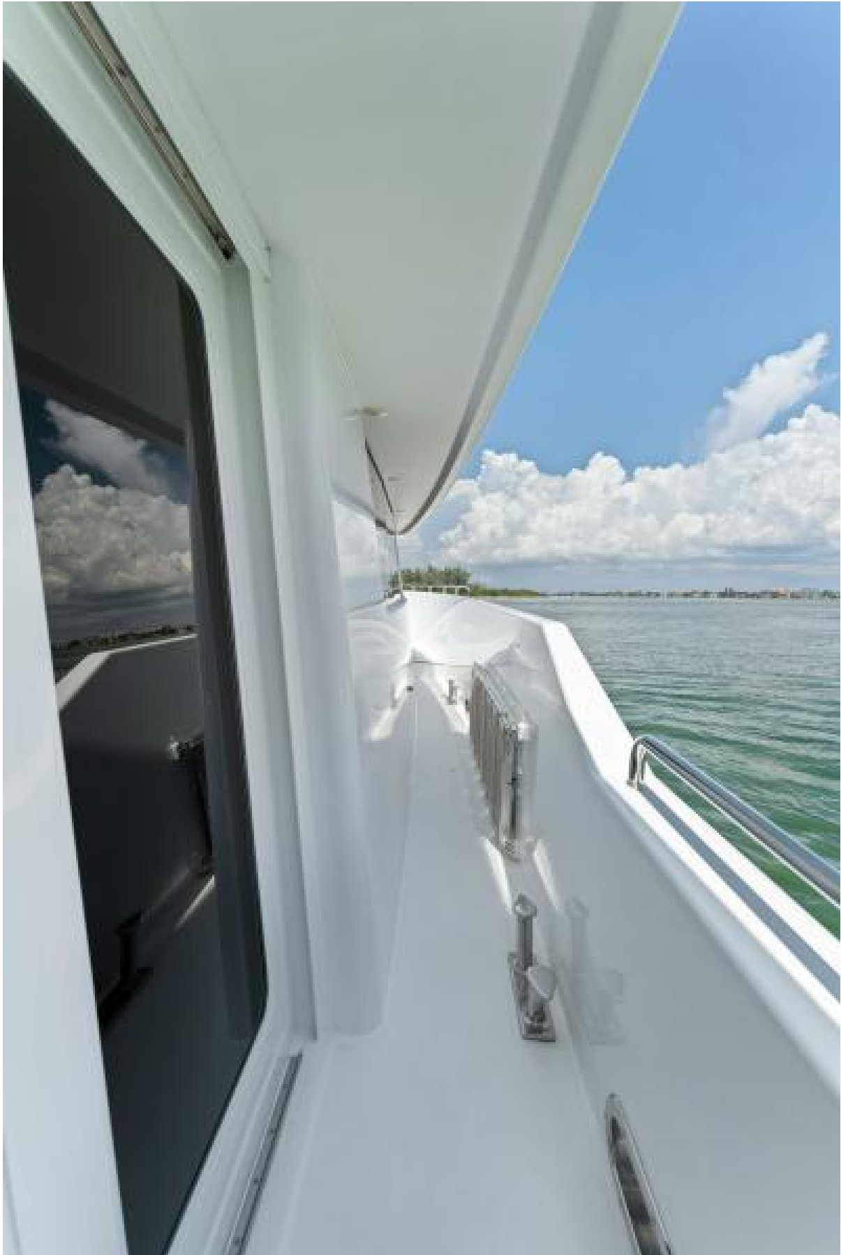
2002 112 Westport Motor Yacht Eclipse Flybridge