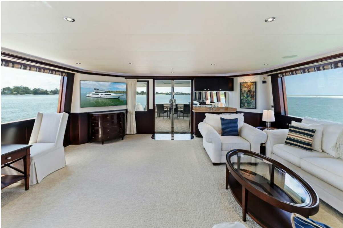
2002 112 Westport Motor Yacht Eclipse Salon