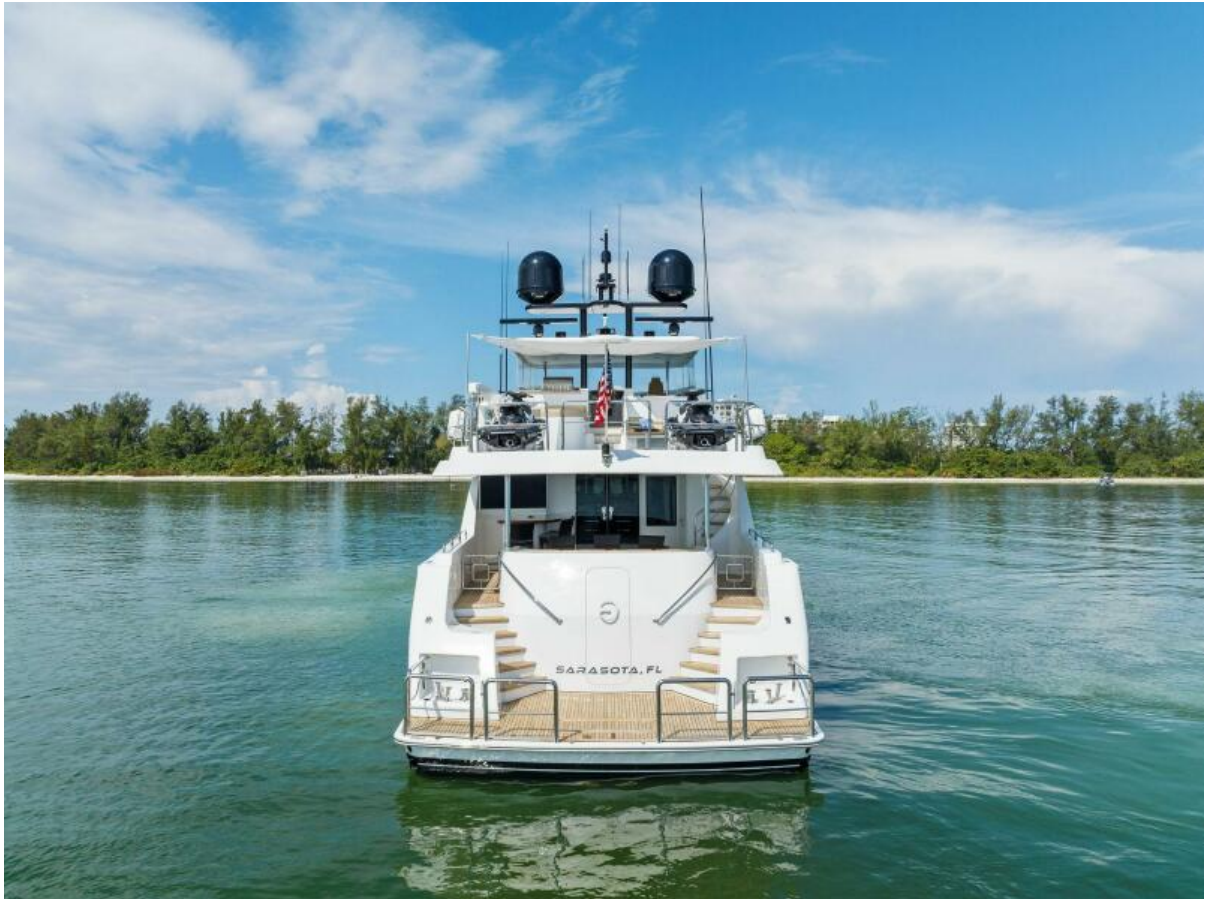
2002 112 Westport Motor Yacht Eclipse