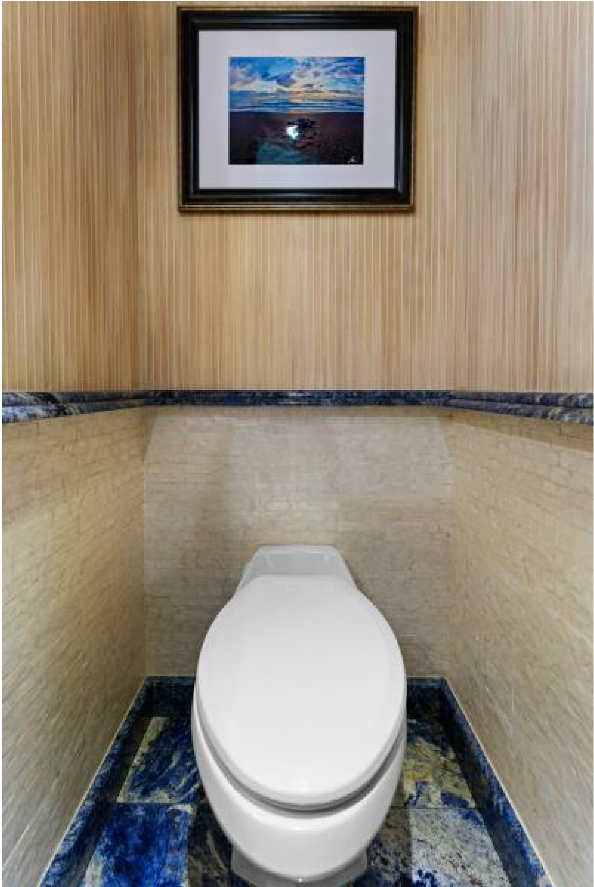
2002 112 Westport Motor Yacht Eclipse Day Head