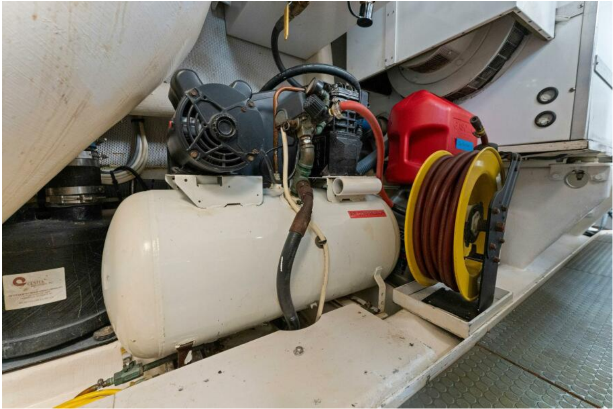
2002 112 Westport Motor Yacht Eclipse Engine Room