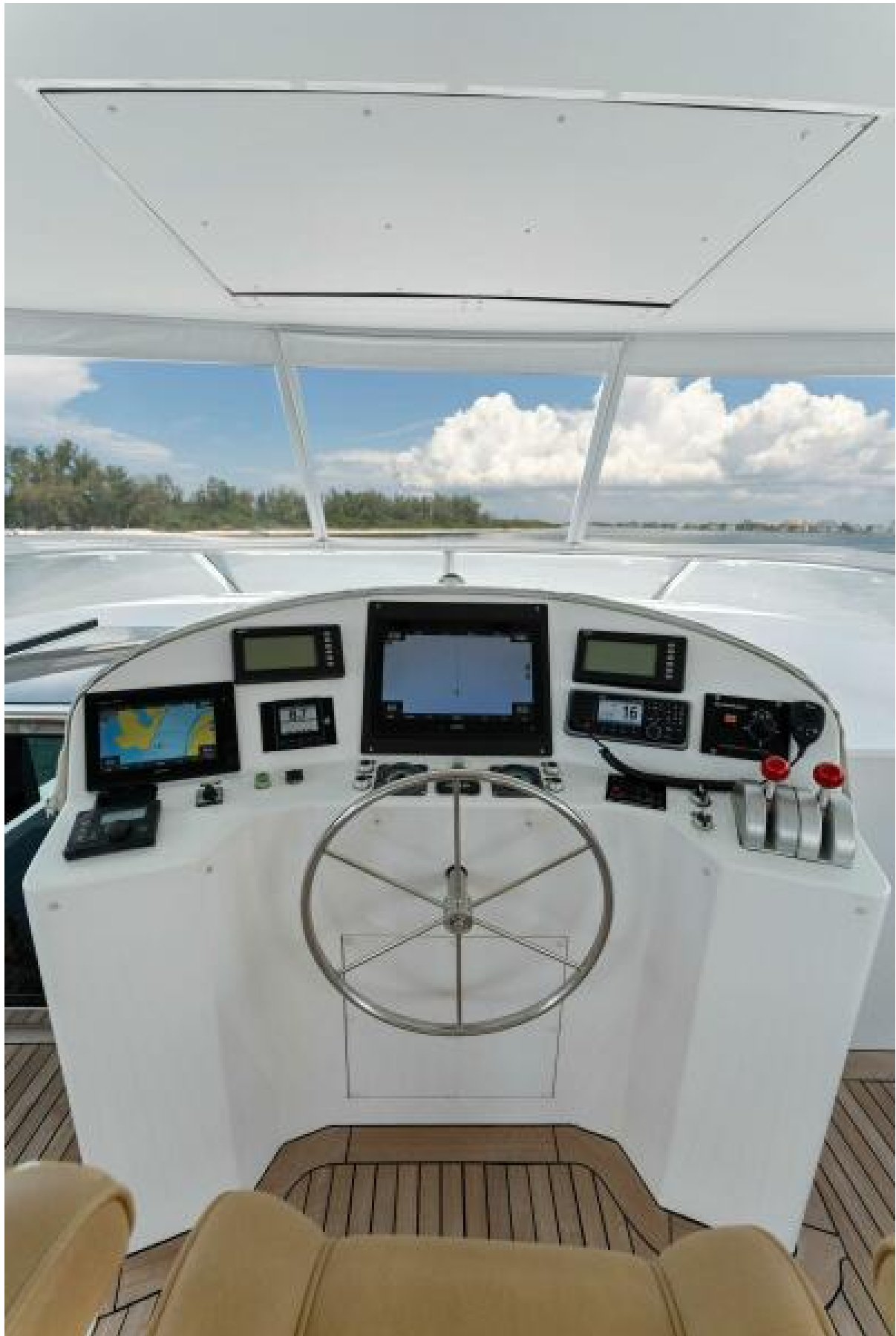
2002 112 Westport Motor Yacht Eclipse Flybridge