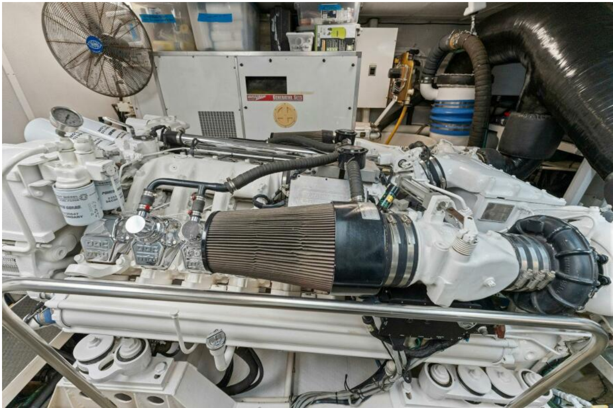
2002 112 Westport Motor Yacht Eclipse Engine Room