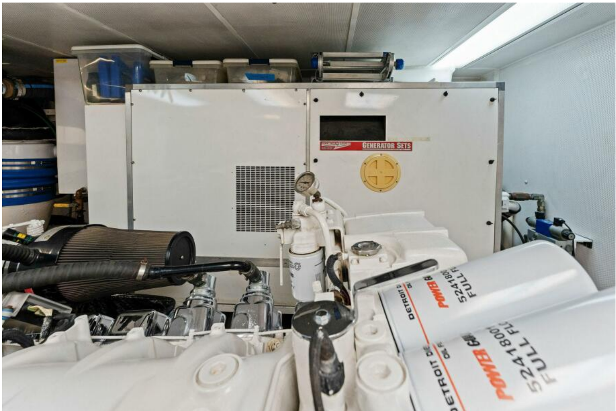
2002 112 Westport Motor Yacht Eclipse Engine Room