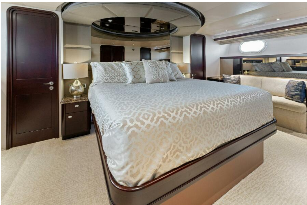
2002 112 Westport Motor Yacht Eclipse Master Stateroom