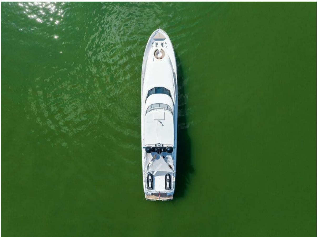
2002 112 Westport Motor Yacht Eclipse Aerial View