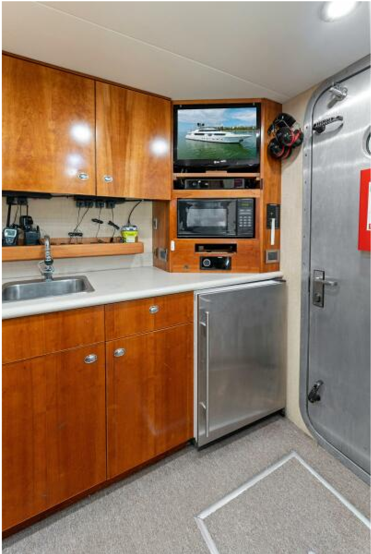
2002 112 Westport Motor Yacht Eclipse Crew Quarters