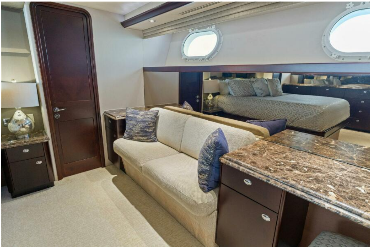
2002 112 Westport Motor Yacht Eclipse Master Stateroom