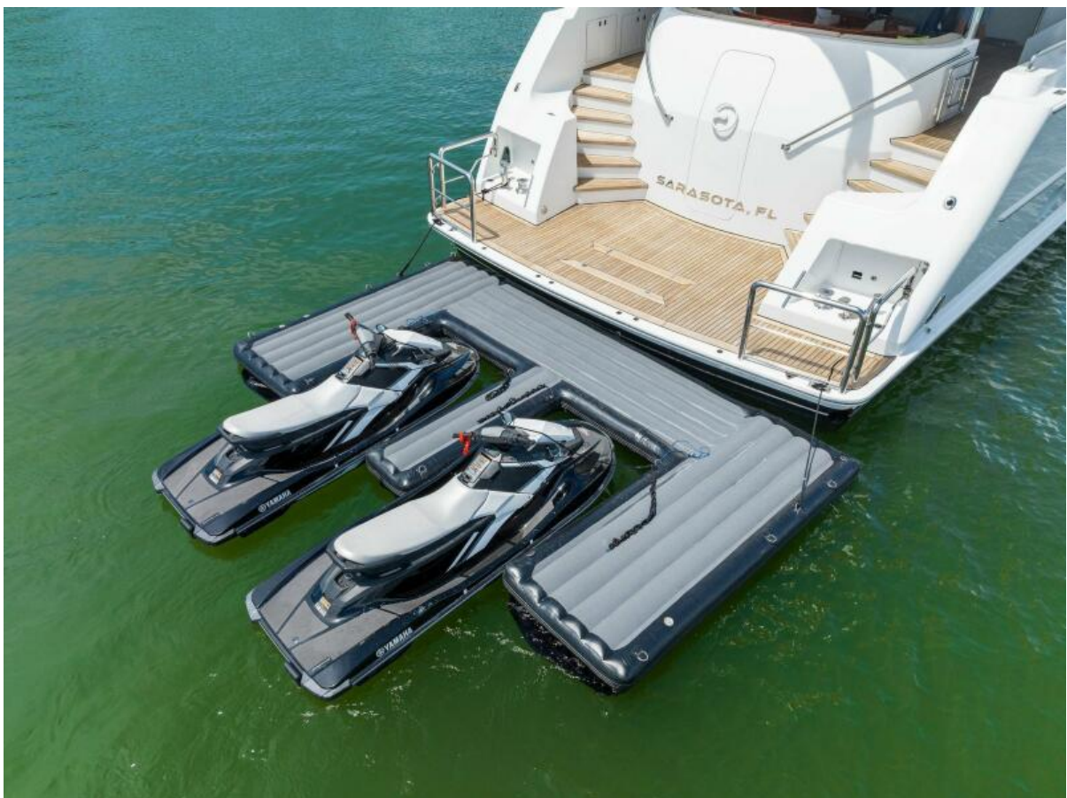
2002 112 Westport Motor Yacht Eclipse Swim Platform