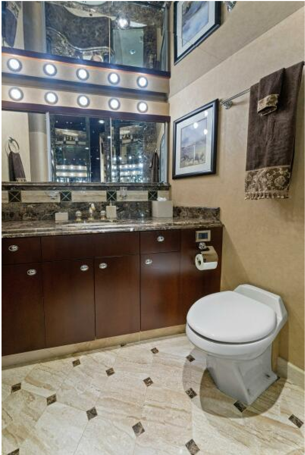
2002 112 Westport Motor Yacht Eclipse Master Head