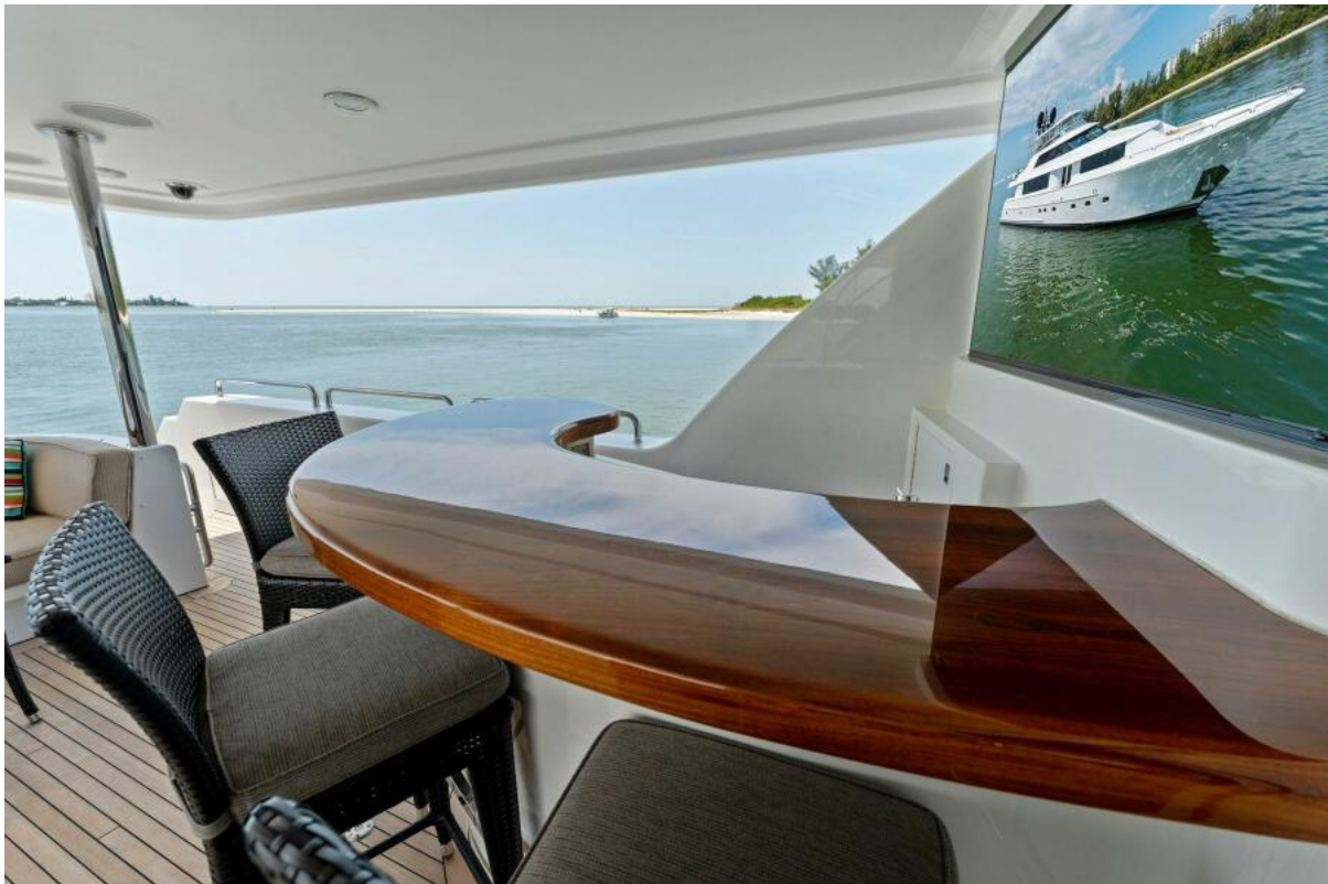
2002 112 Westport Motor Yacht Eclipse Cockpit