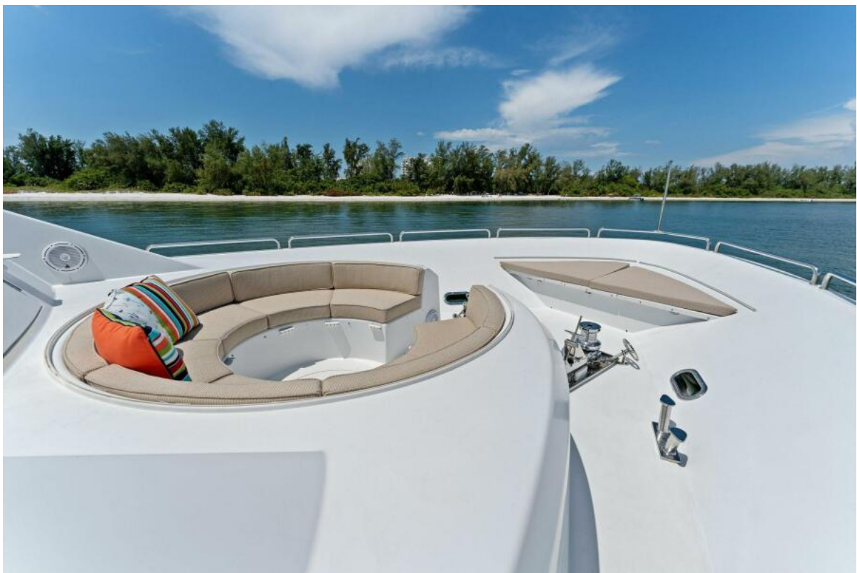
2002 112 Westport Motor Yacht Eclipse Fore Deck