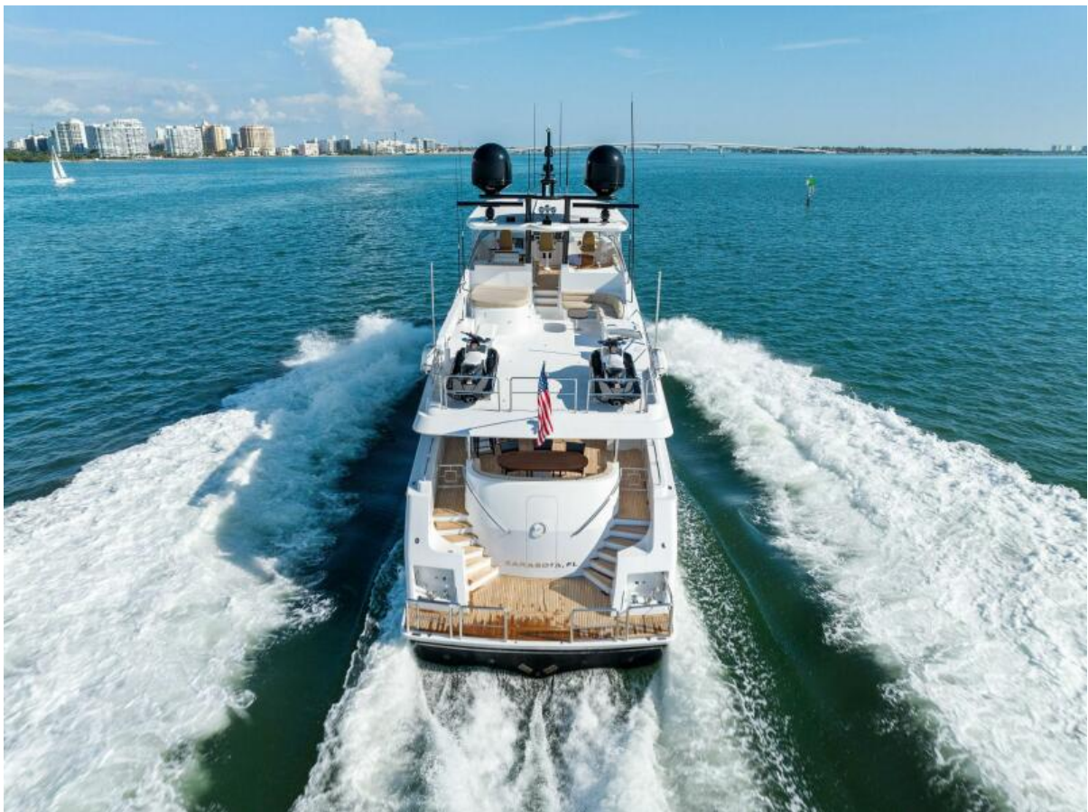
2002 112 Westport Motor Yacht Eclipse