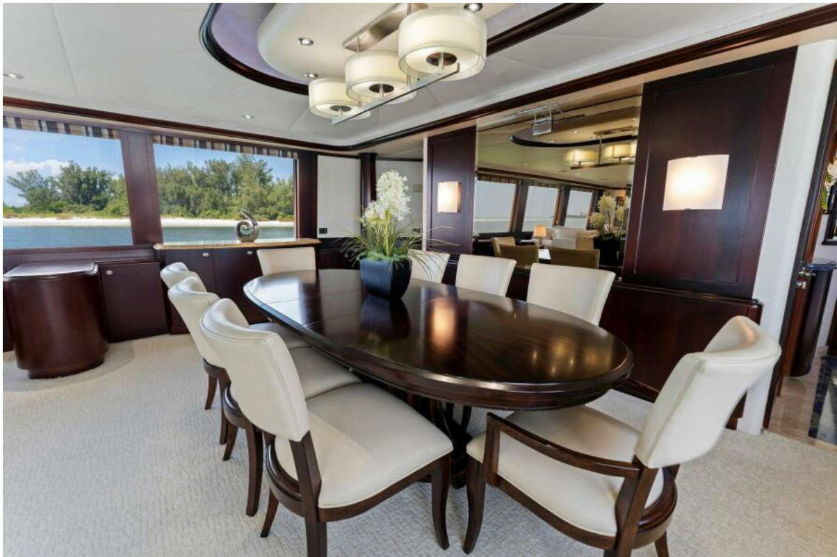
2002 112 Westport Motor Yacht Eclipse Salon