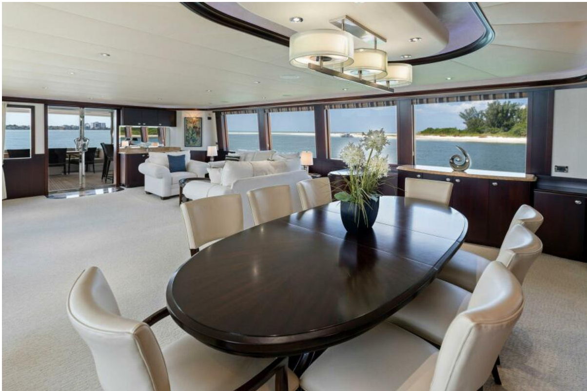
2002 112 Westport Motor Yacht Eclipse Salon