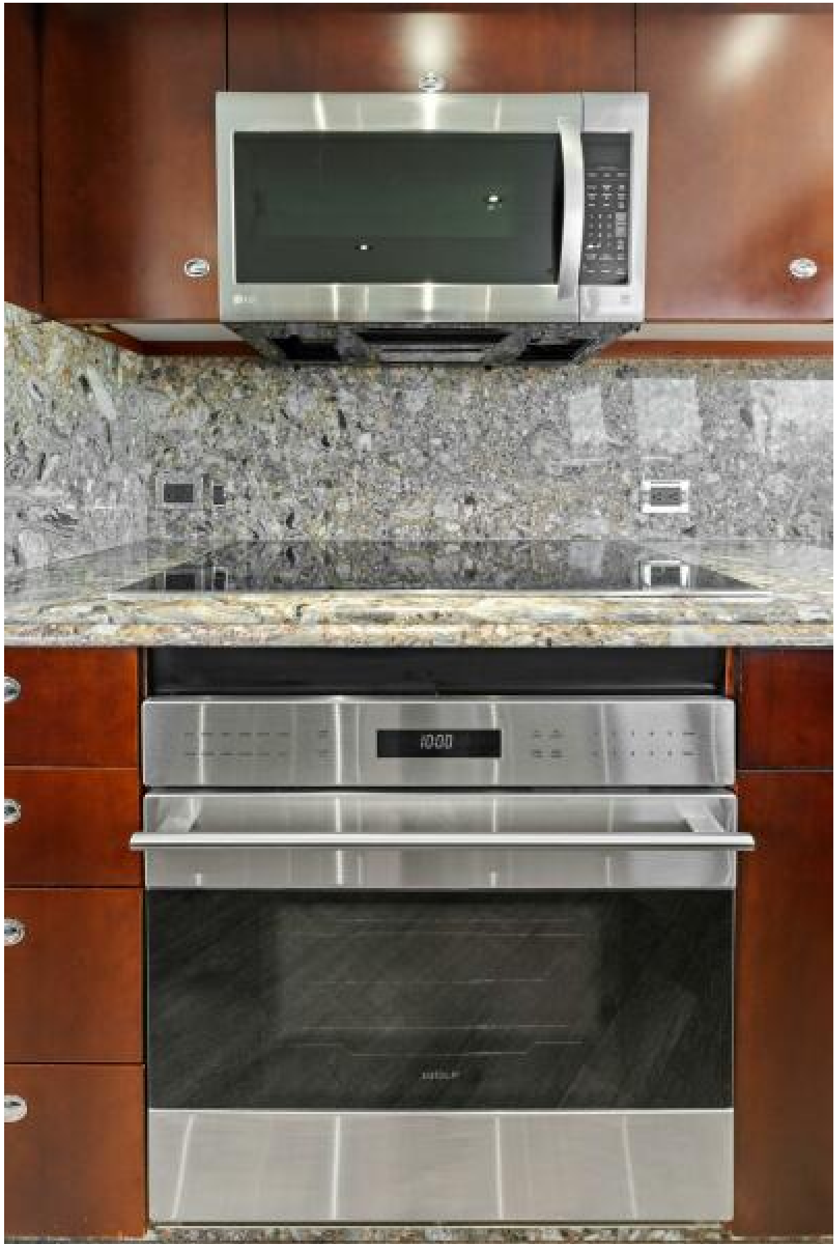
2002 112 Westport Motor Yacht Eclipse Galley