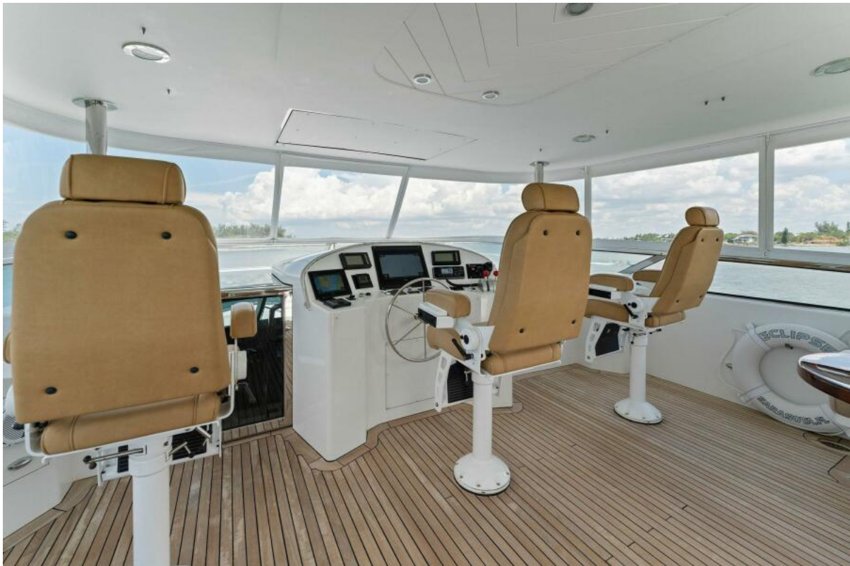
2002 112 Westport Motor Yacht Eclipse Flybridge