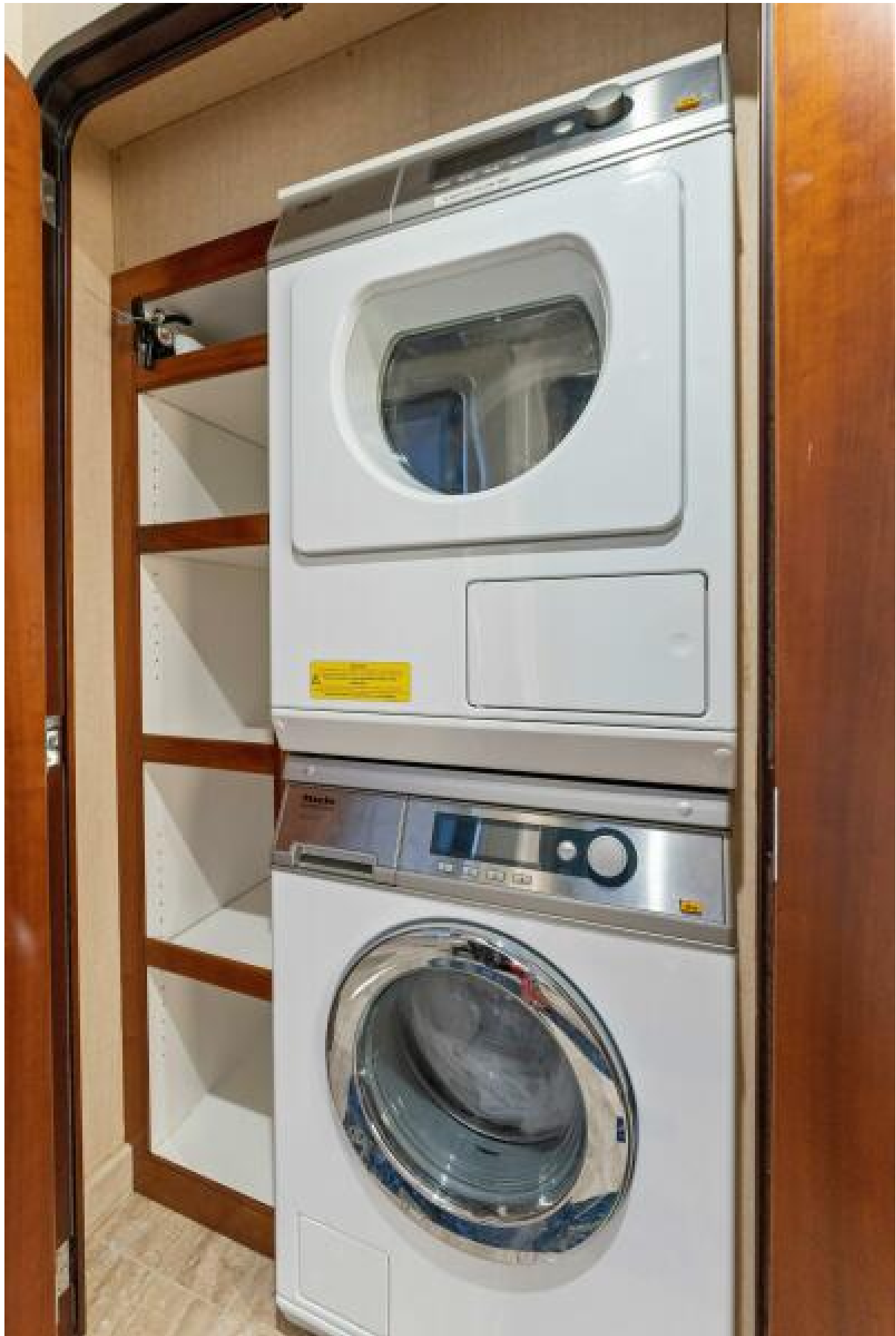
2002 112 Westport Motor Yacht Eclipse Laundry