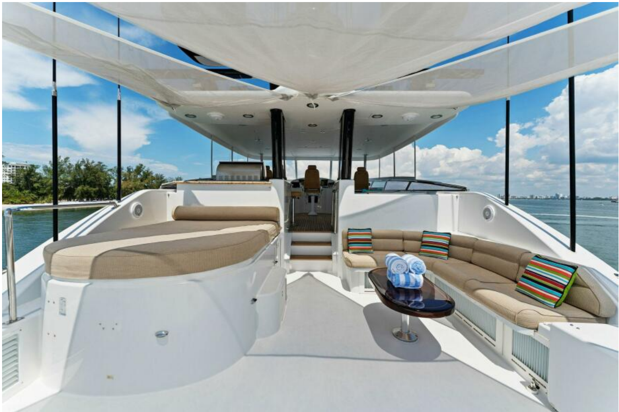
2002 112 Westport Motor Yacht Eclipse Deck