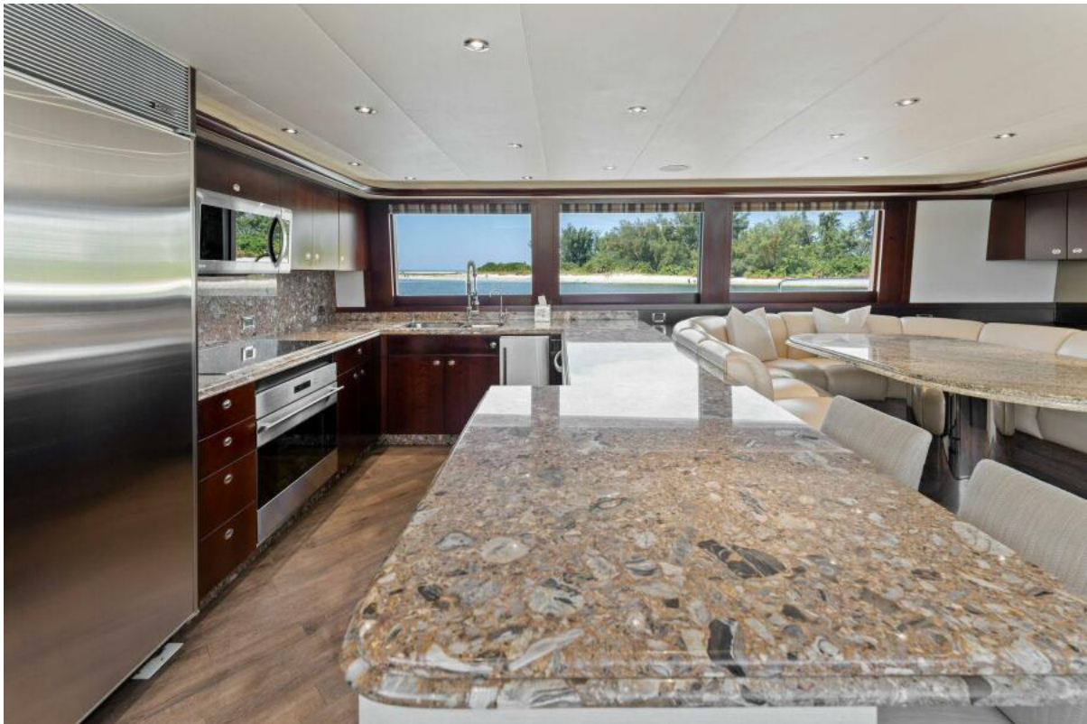
2002 112 Westport Motor Yacht Eclipse Galley