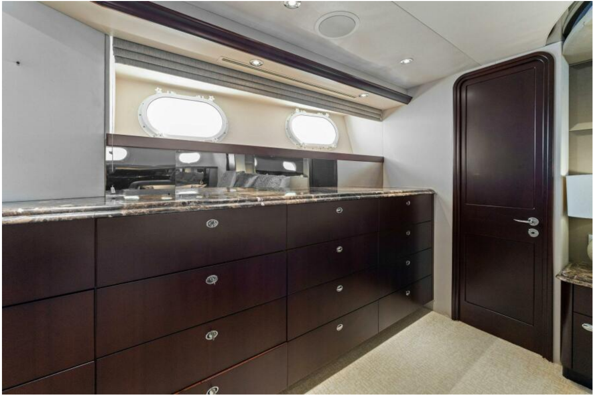
2002 112 Westport Motor Yacht Eclipse Master Stateroom