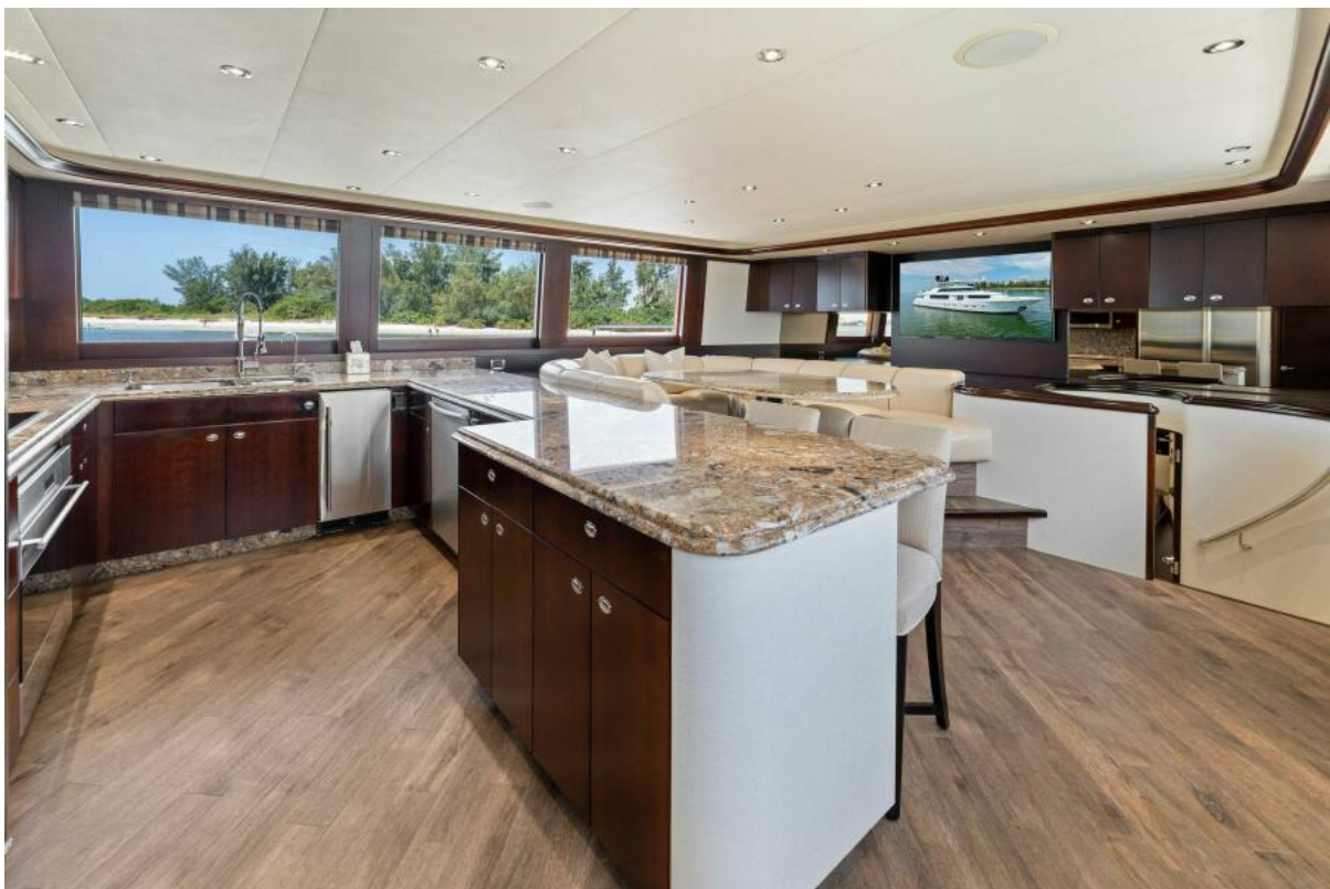
2002 112 Westport Motor Yacht Eclipse Galley