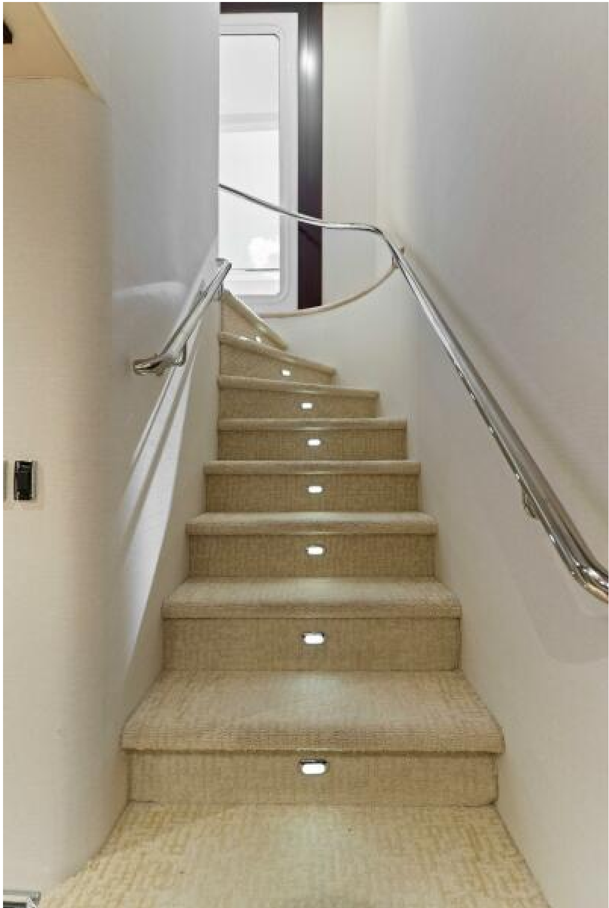
2002 112 Westport Stairway to Master Stateroom Motor Yacht Eclipse Stairway