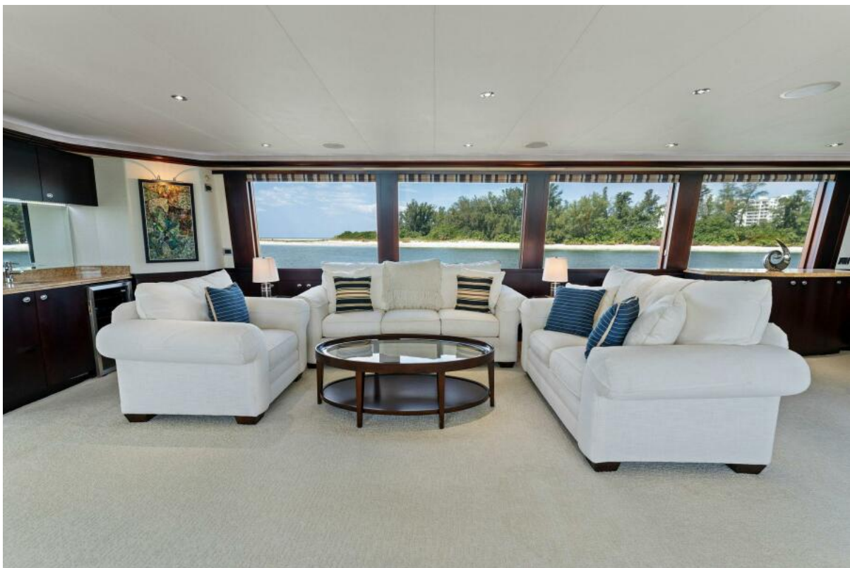
2002 112 Westport Motor Yacht Eclipse Salon