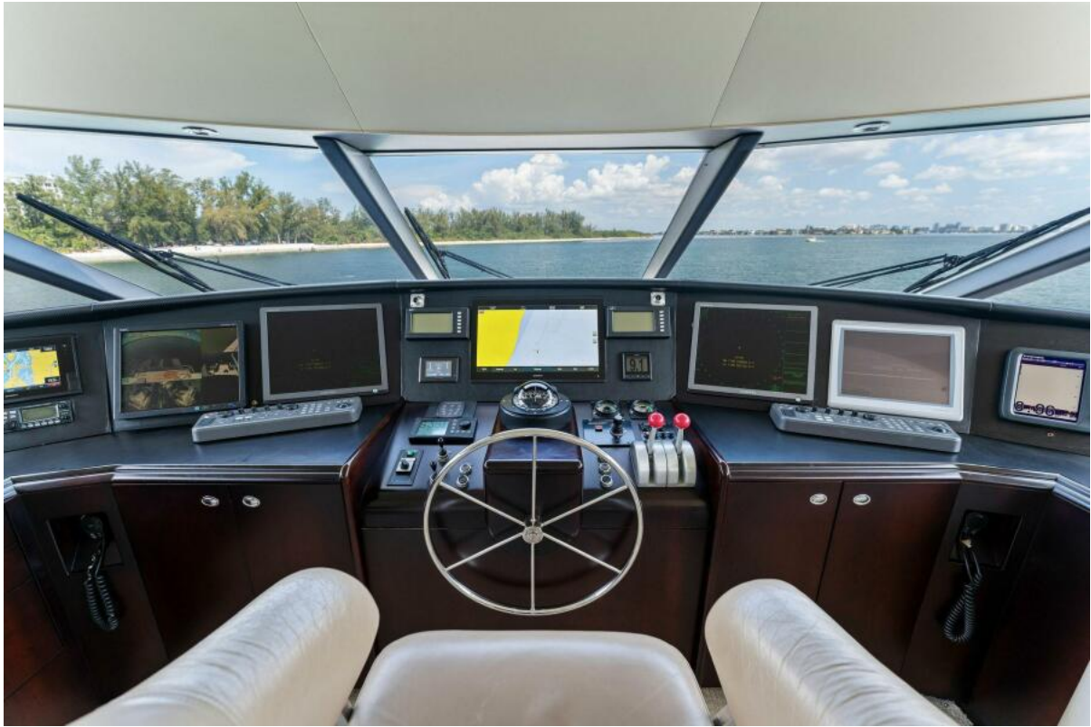
2002 112 Westport Motor Yacht Eclipse Helm