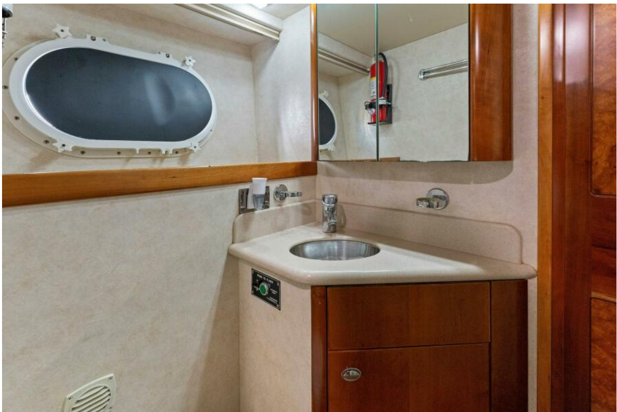
2002 112 Westport Motor Yacht Eclipse Crew Head