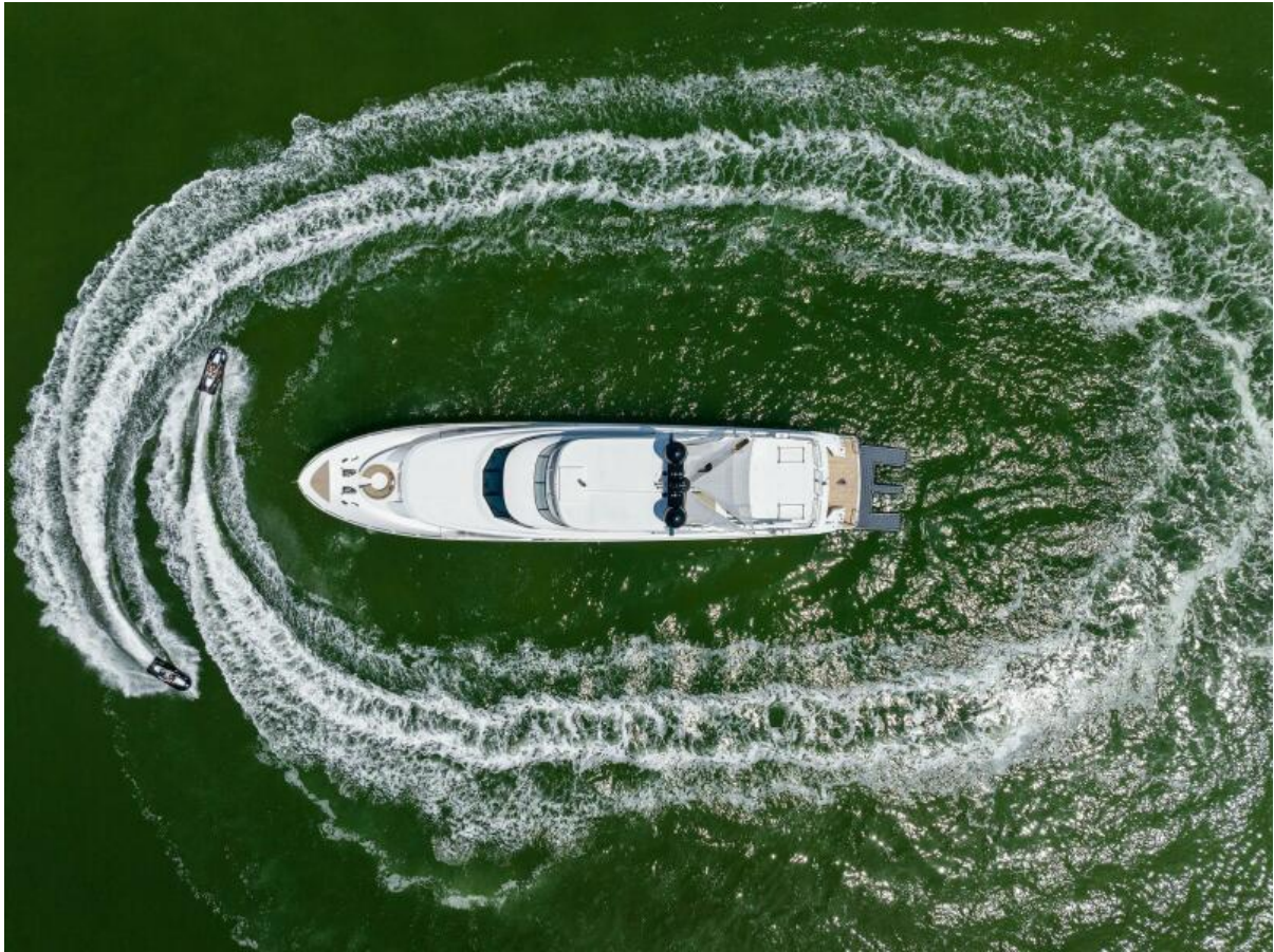
2002 112 Westport Motor Yacht Eclipse Aerial View