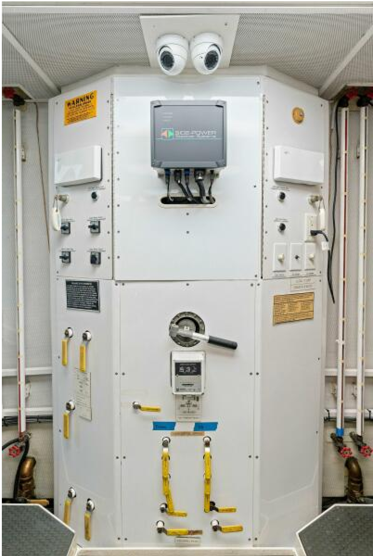
2002 112 Westport Motor Yacht Eclipse Engine Room