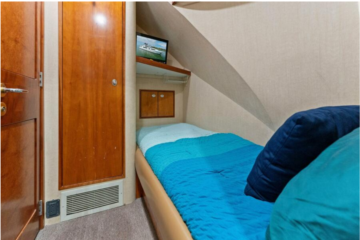
2002 112 Westport Motor Yacht Eclipse Crew Quarters