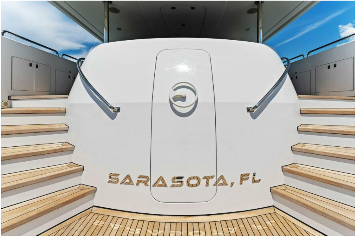
2002 112 Westport Motor Yacht Eclipse Deck