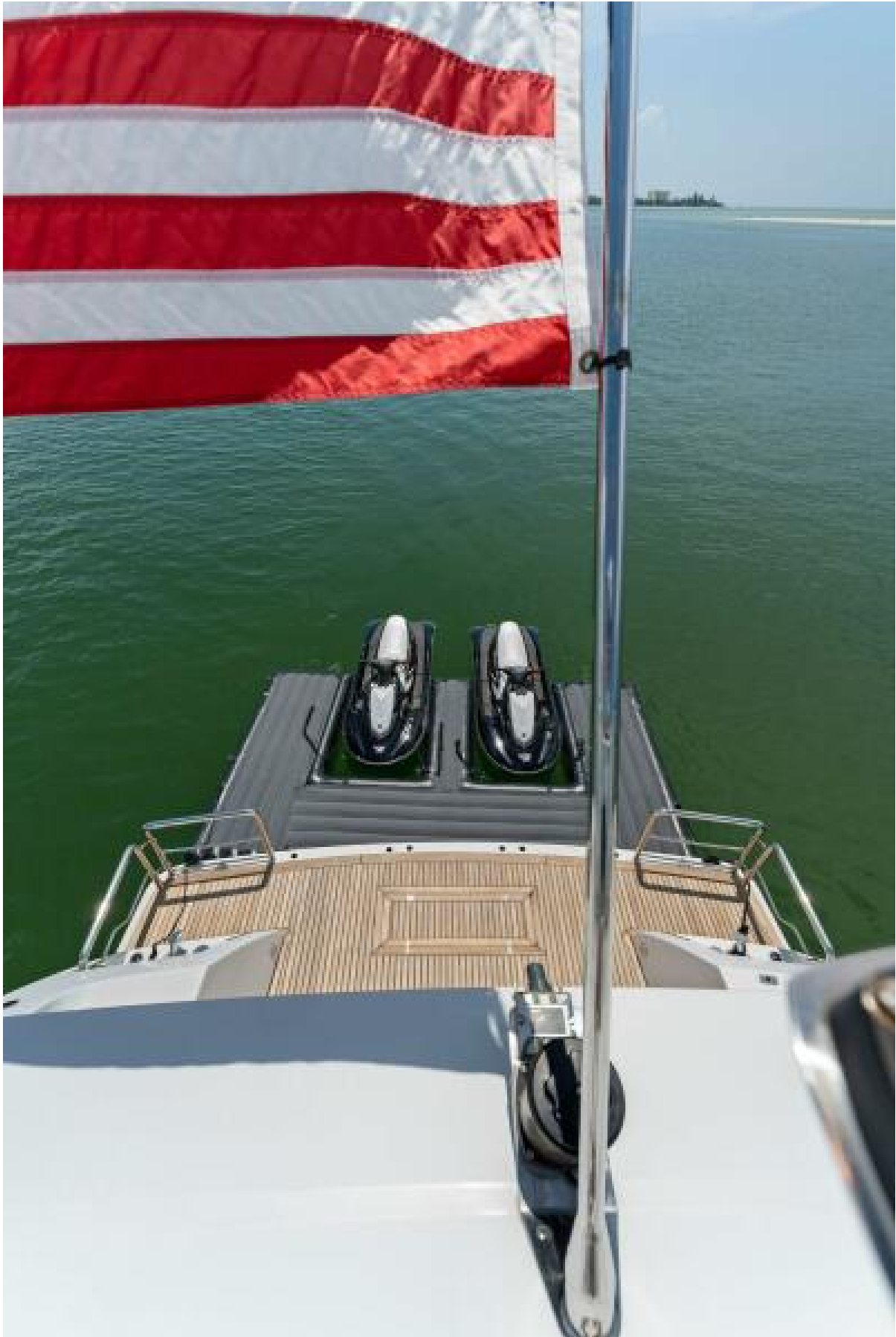
2002 112 Westport Motor Yacht Eclipse Deck