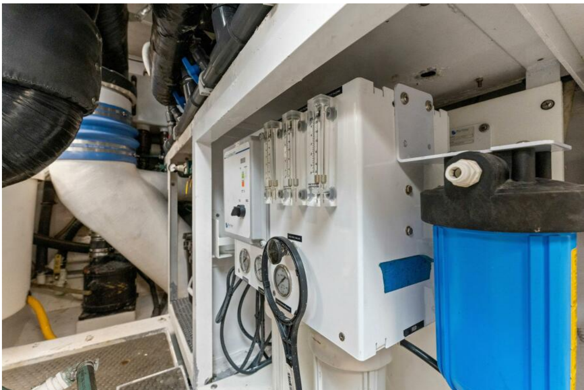
2002 112 Westport Motor Yacht Eclipse Engine Room