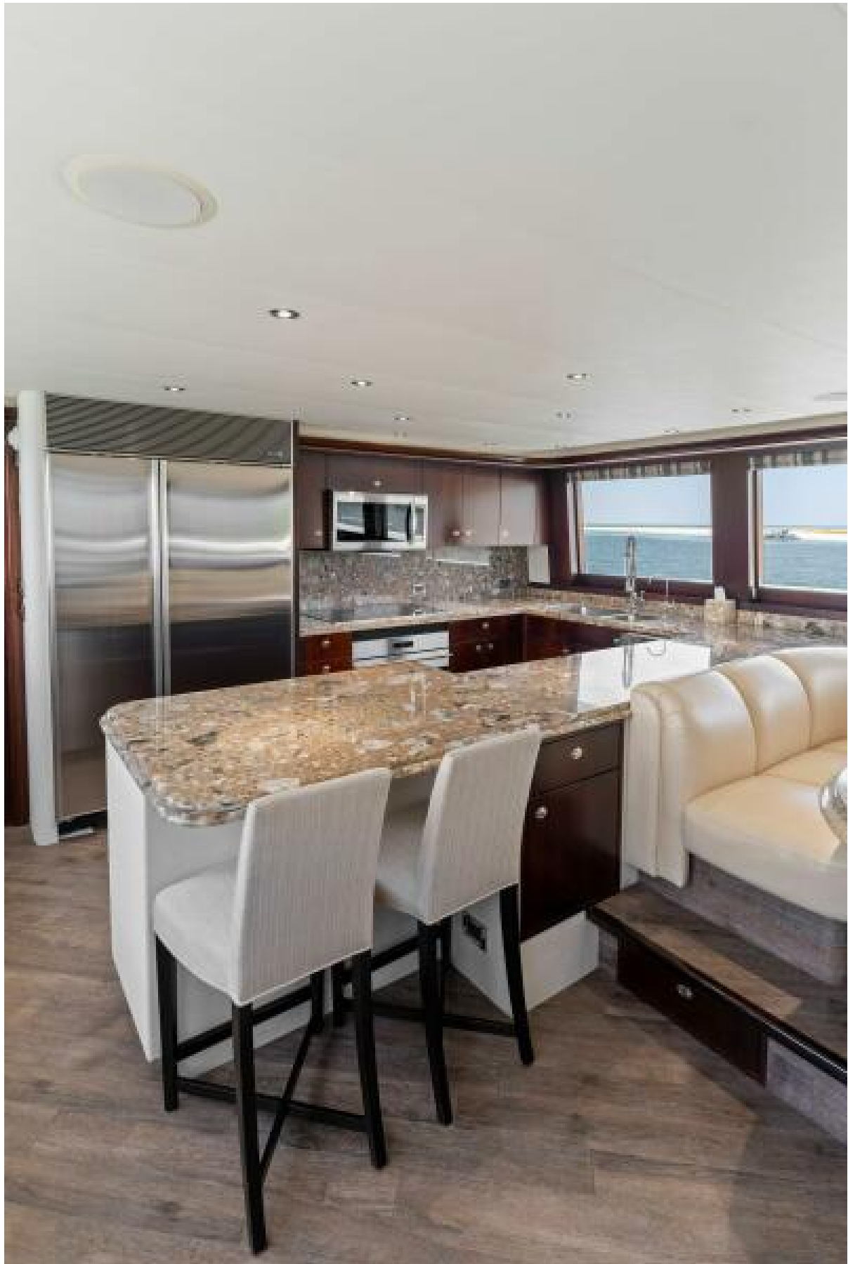
2002 112 Westport Motor Yacht Eclipse Galley