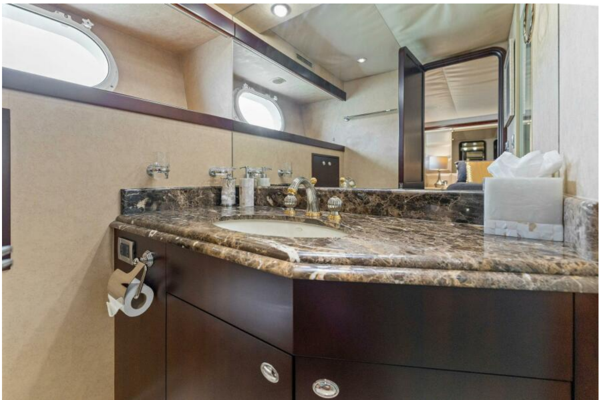
2002 112 Westport Motor Yacht Eclipse Starboard Guest Head