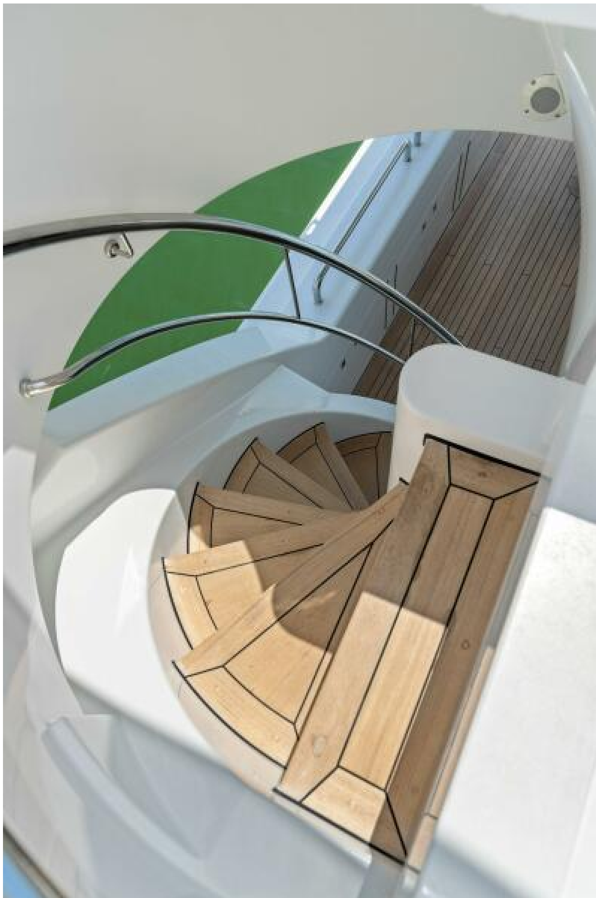
2002 112 Westport Motor Yacht Eclipse Stairway to Flybridge