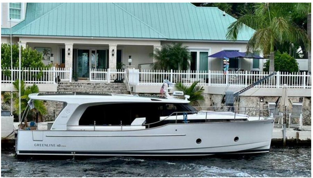
2023 Greenline 40 Hybrid