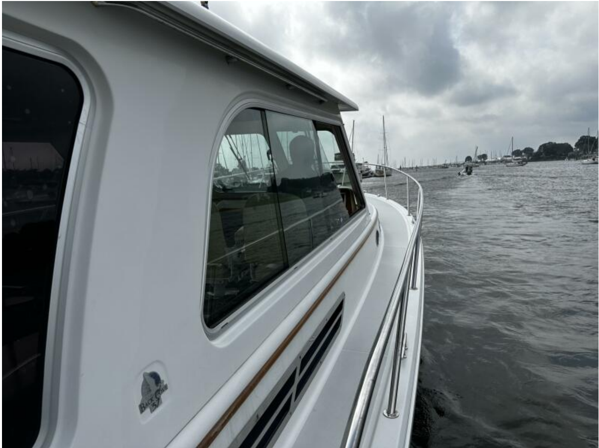
Side Deck 2010 Back Cove 37 Side Deck. For Sale Central Agent Northstar Yacht Sales