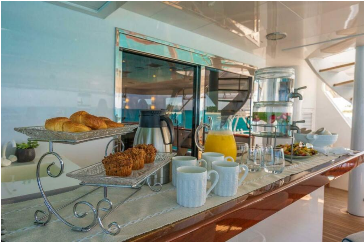
Aft Deck Bar