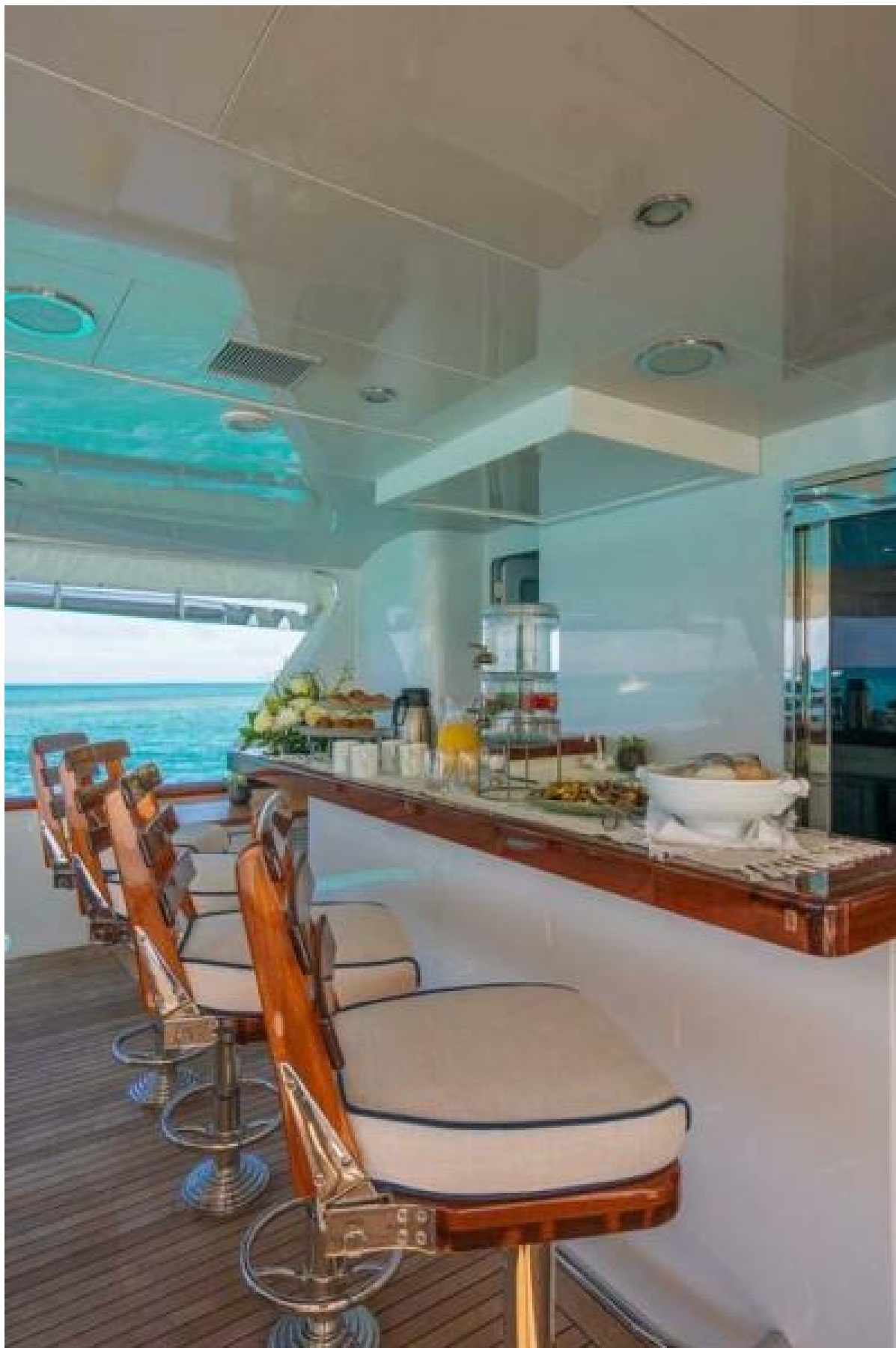
Aft Deck Bar