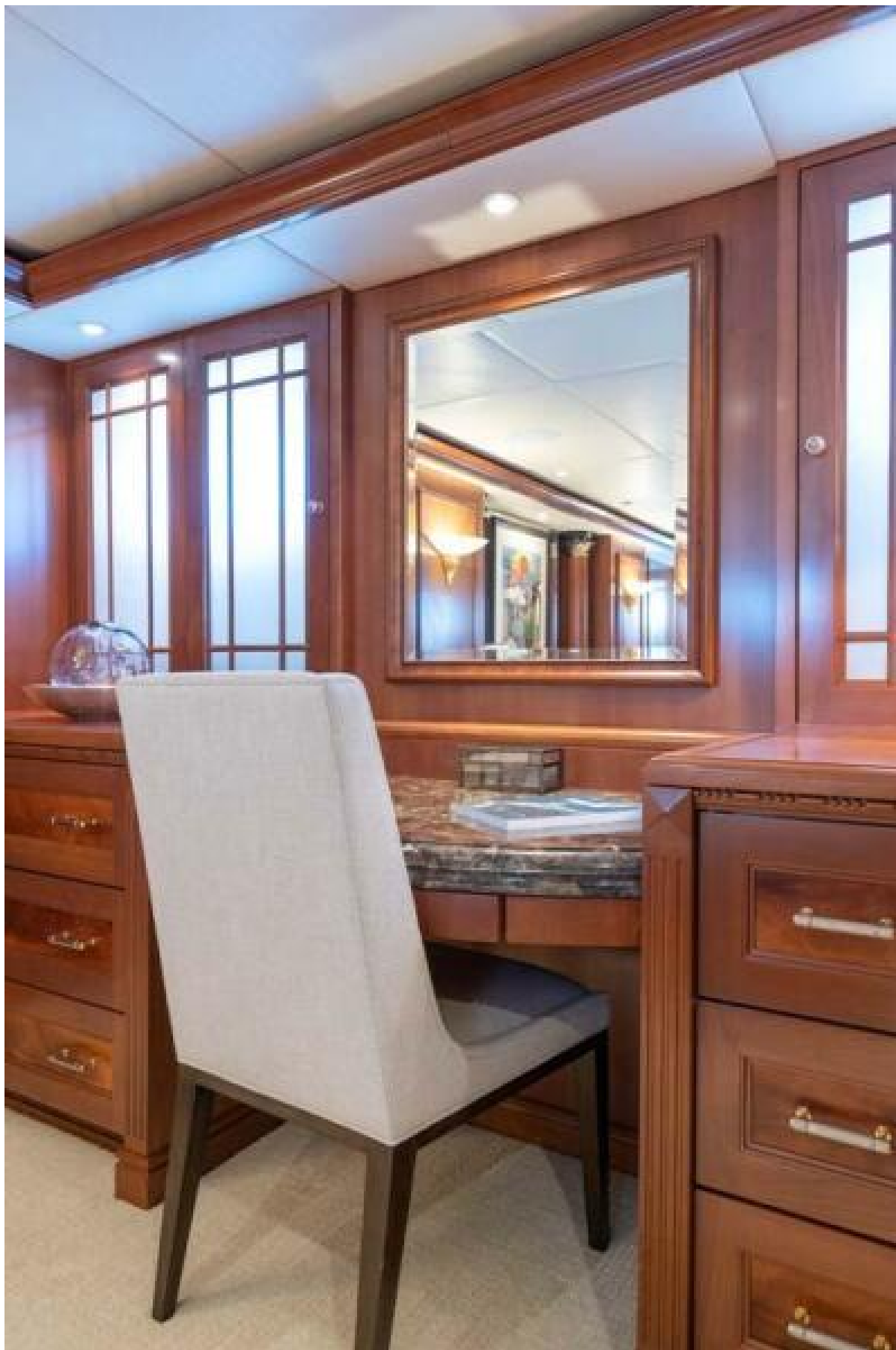
Desk in Owner Stateroom