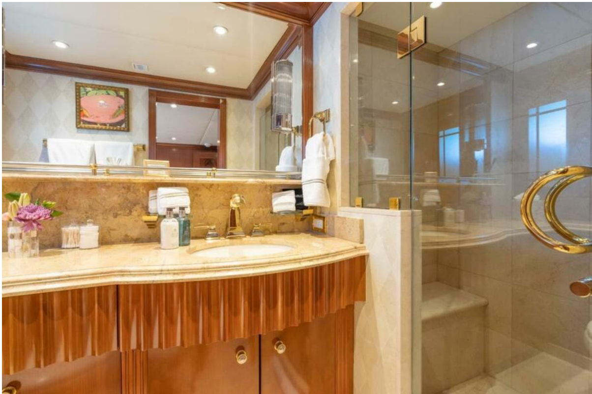
Port Guest Ensuite