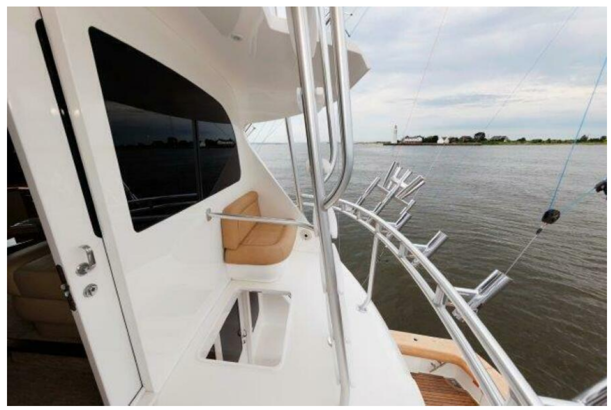
Enclosed Flybridge Aft Deck