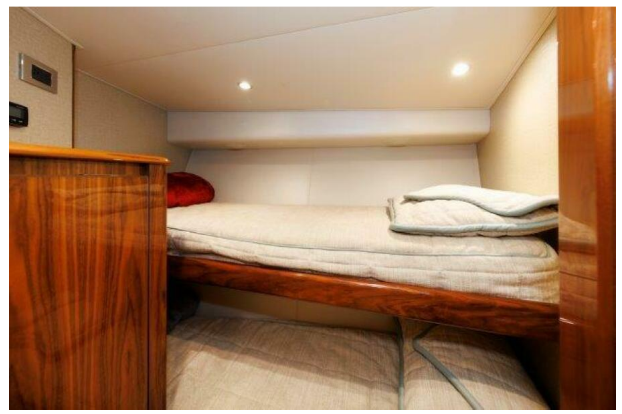
Guest Stateroom Bunks