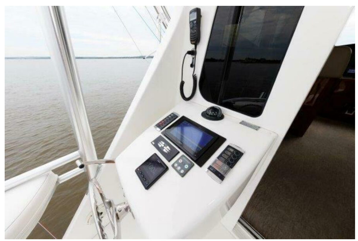
Enclosed Flybridge Aft Deck