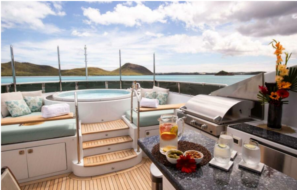
Sundeck Forward View