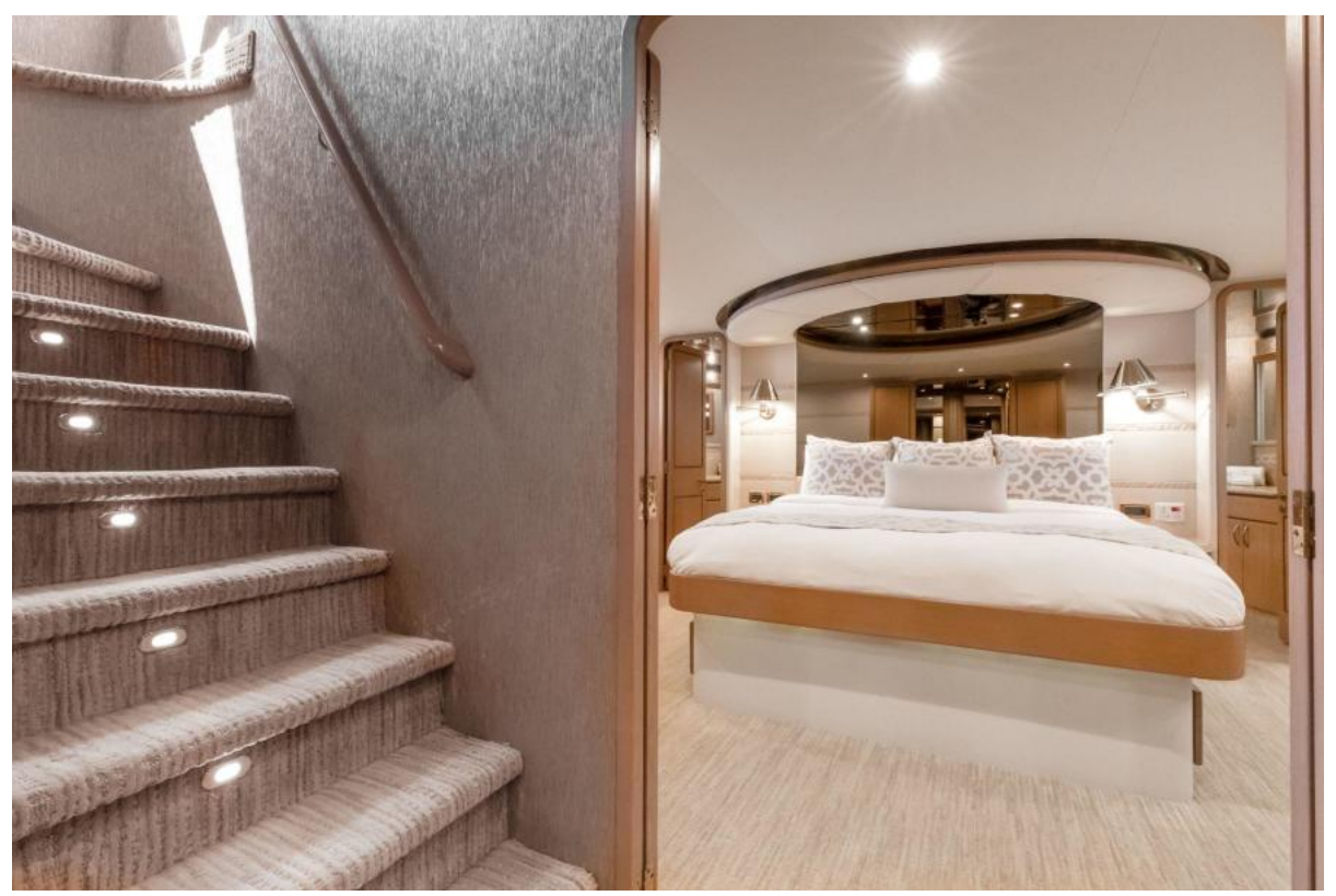
Master Suite Entrance