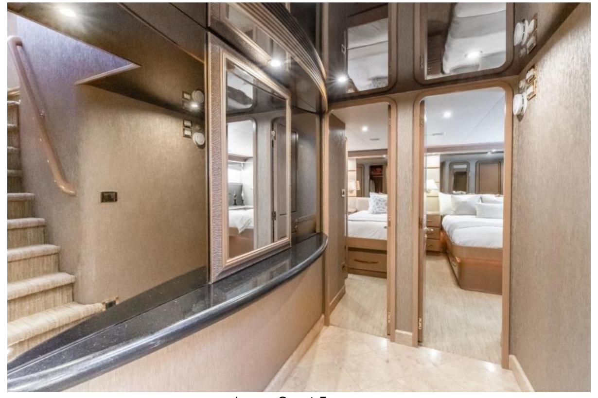
Lower Guest Foyer