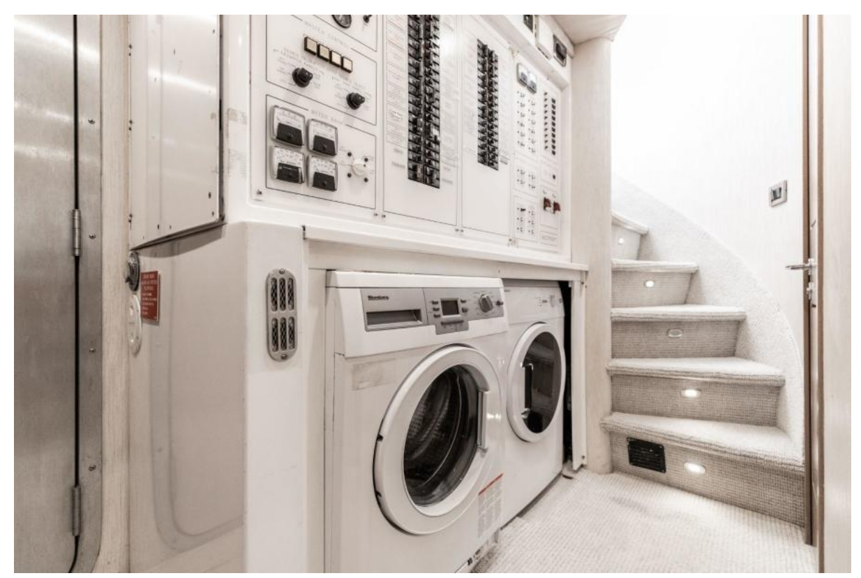
Crew Mess, Laundry, Electrical Panel