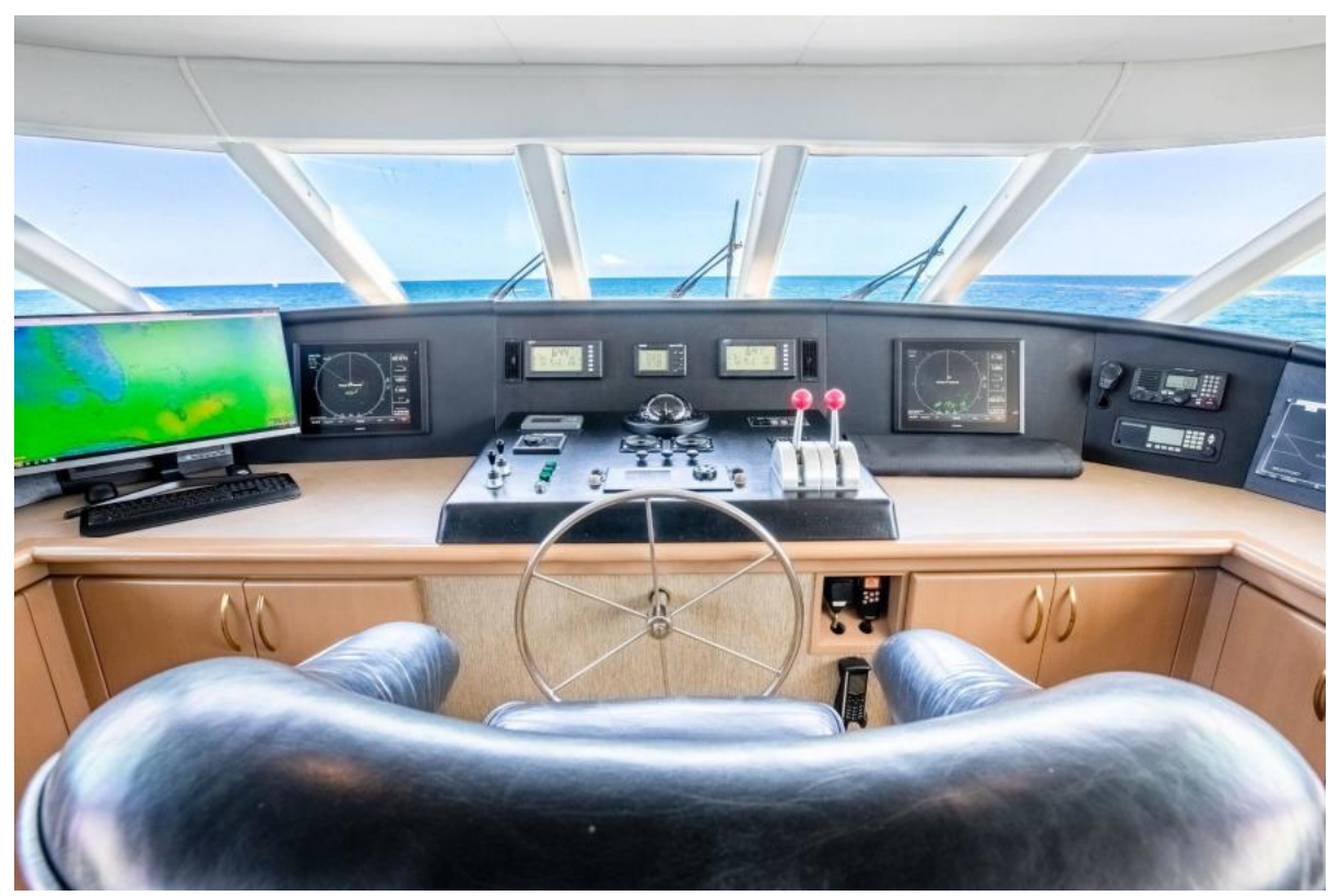
Raised Pilot House