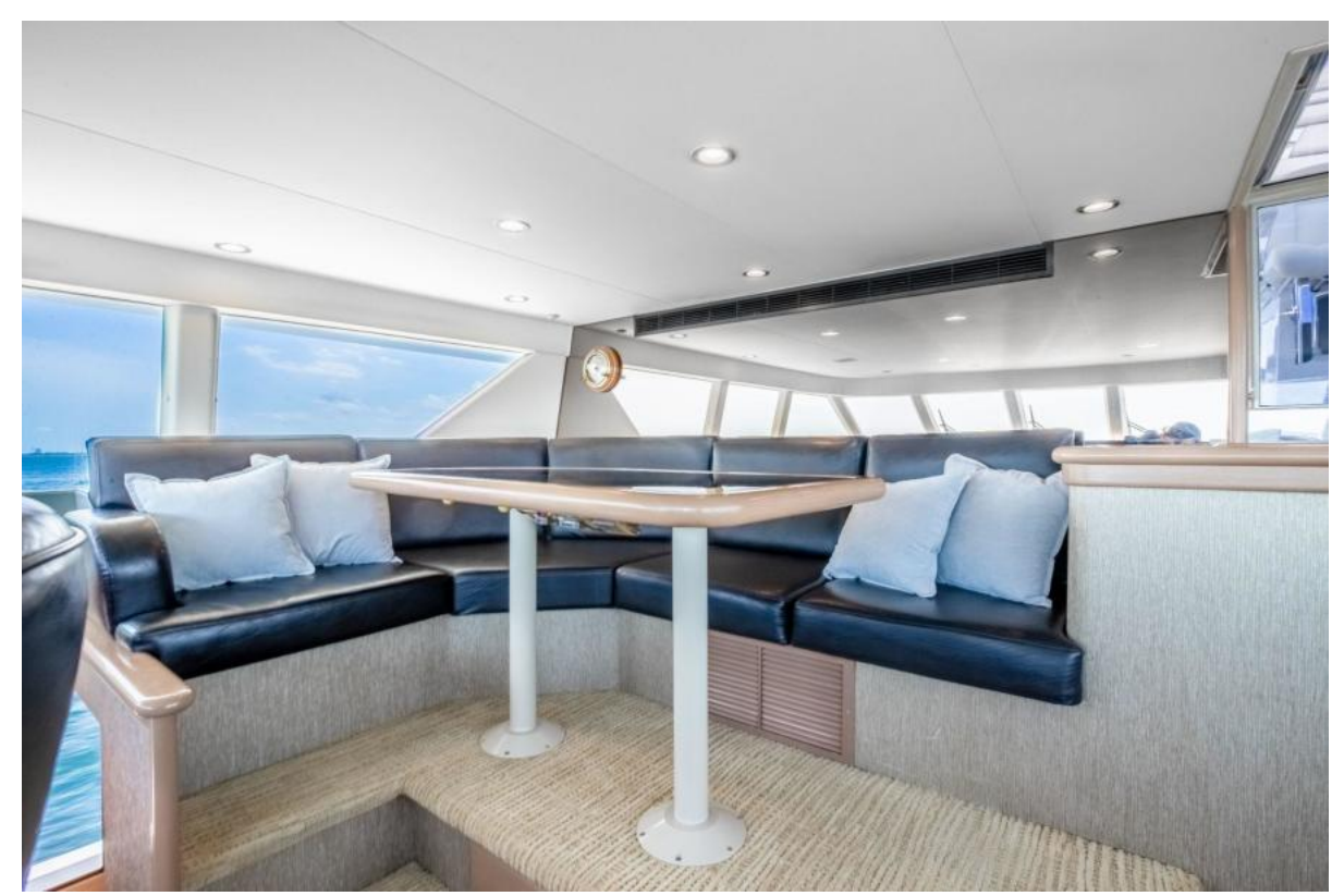
Raised Pilot House