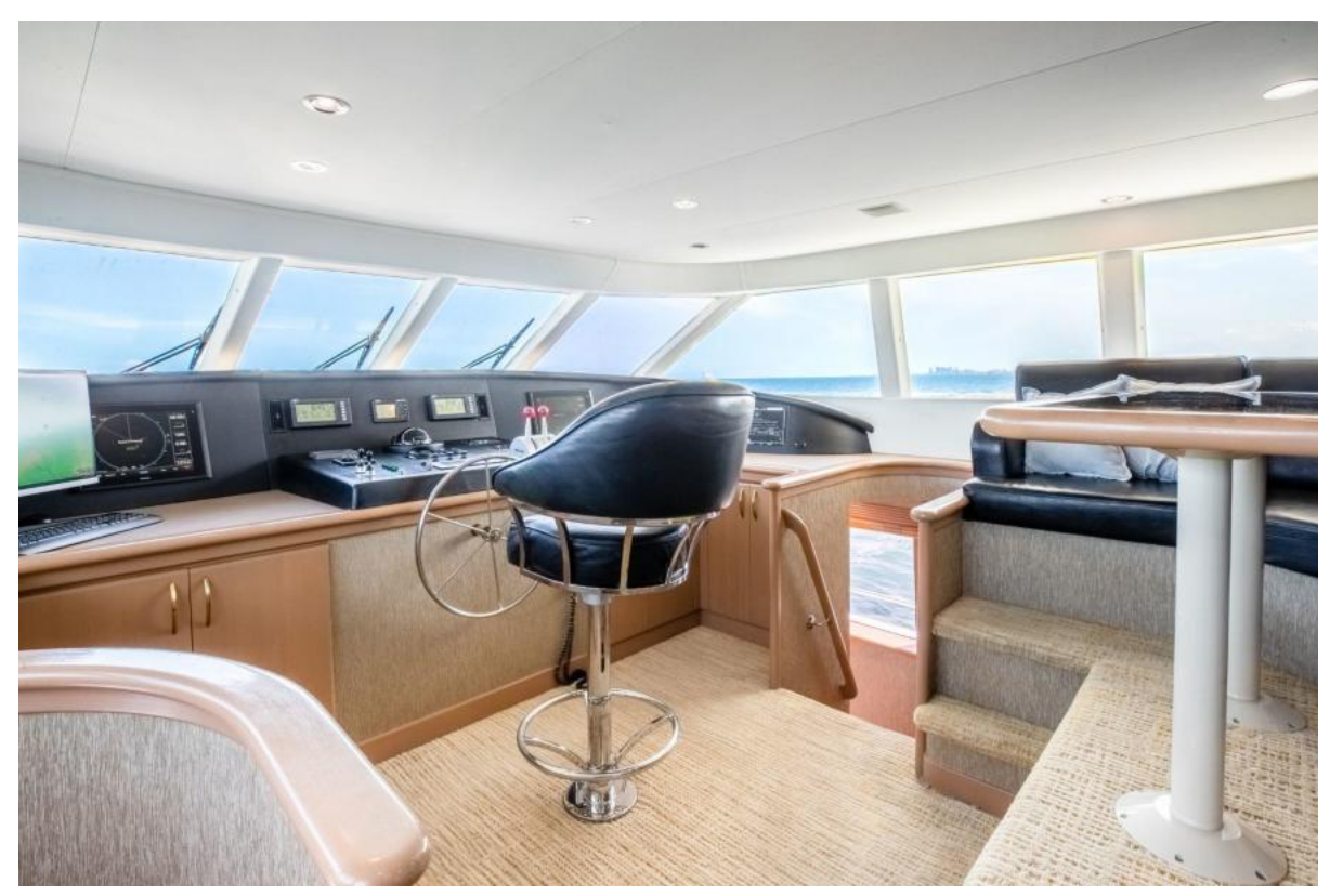
Raised Pilot House