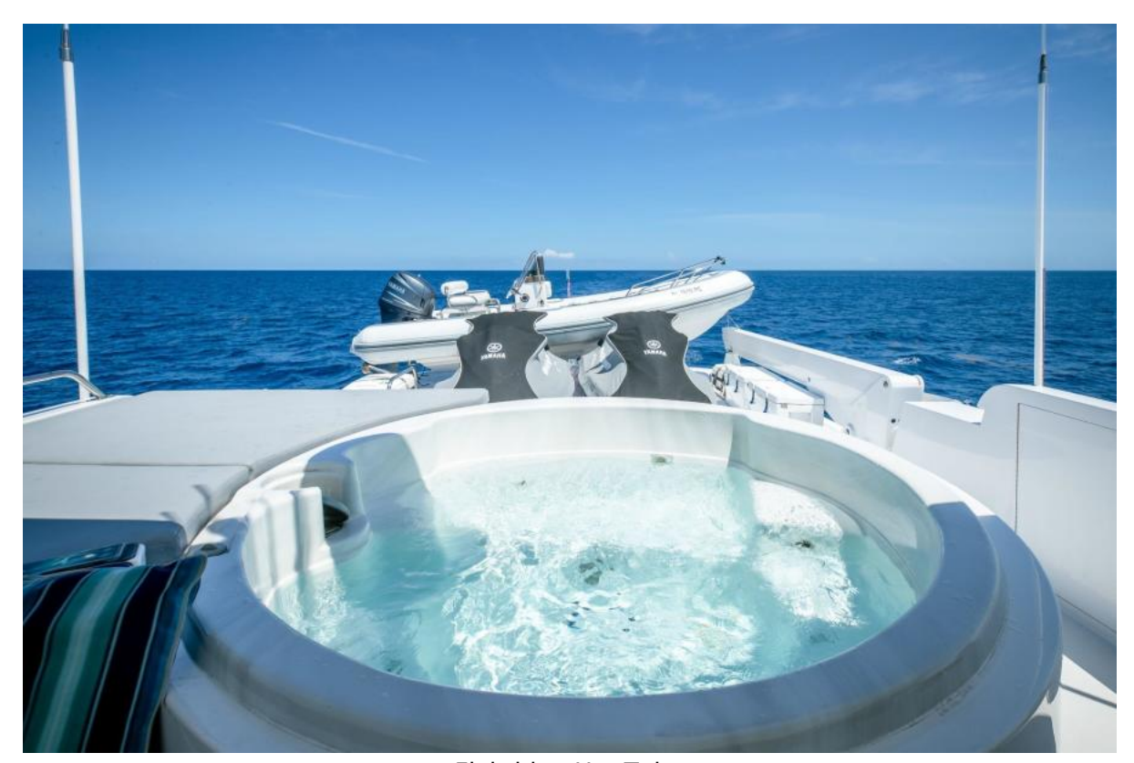
Flybridge Hot Tub