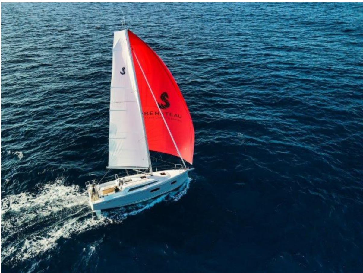
Beneteau OCEANIS 34.1