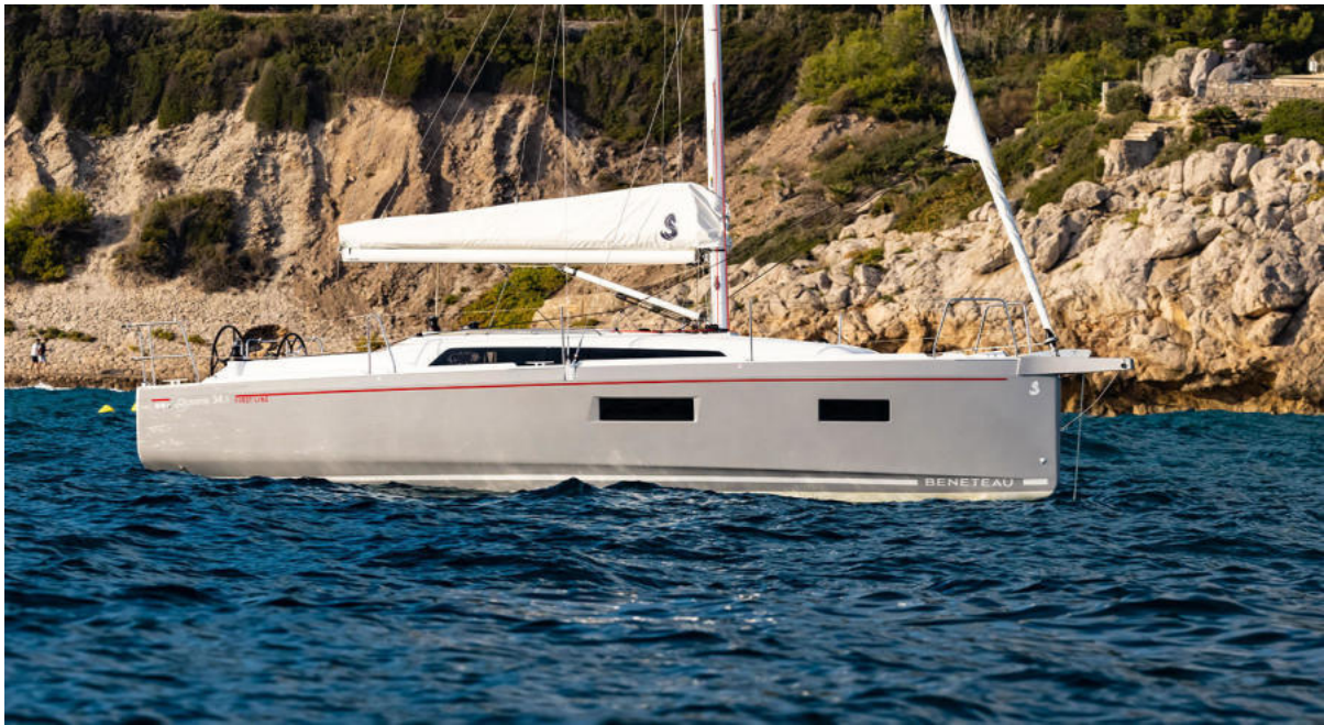
Beneteau OCEANIS 34.1