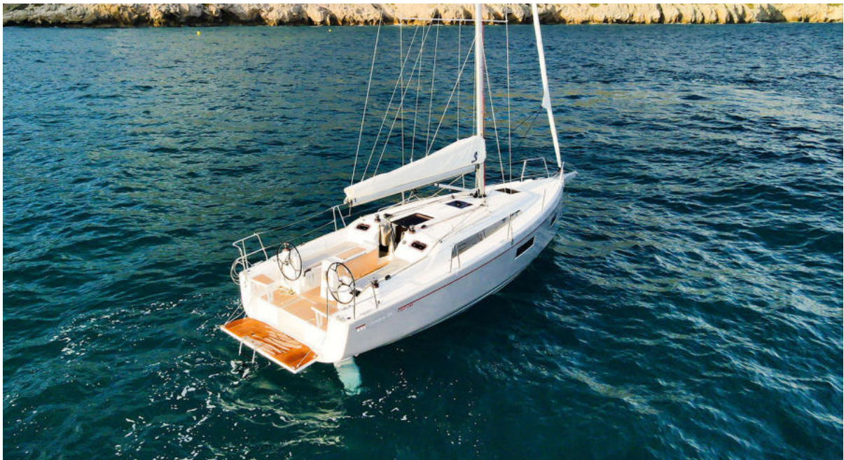
Beneteau OCEANIS 34.1