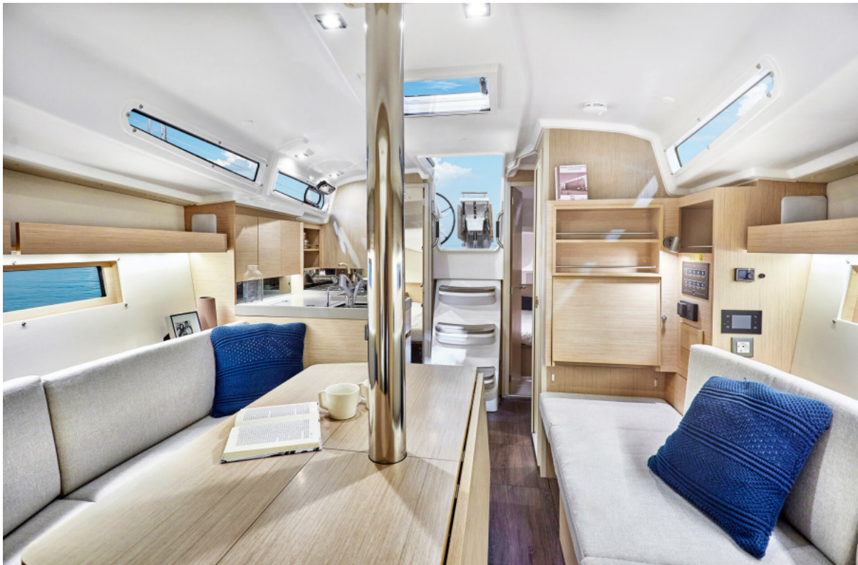
Beneteau OCEANIS 34.1 Salon looking aft