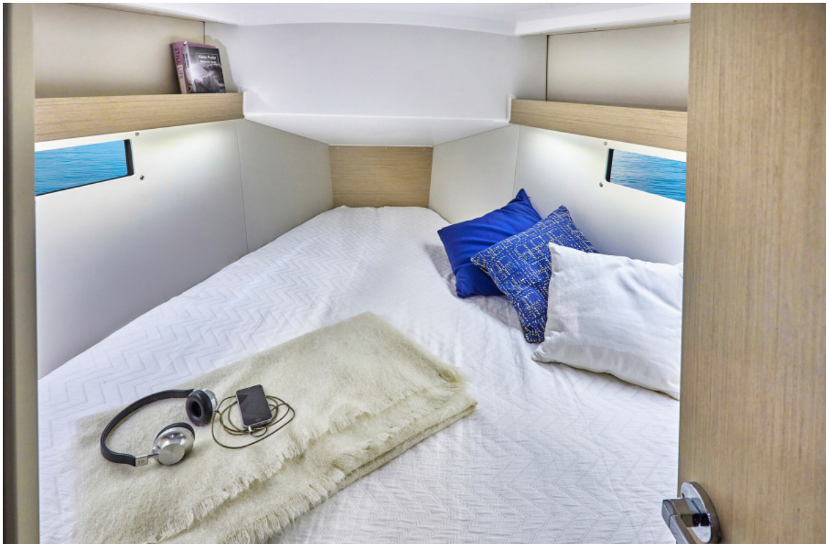
Beneteau OCEANIS 34.1 Master Berth