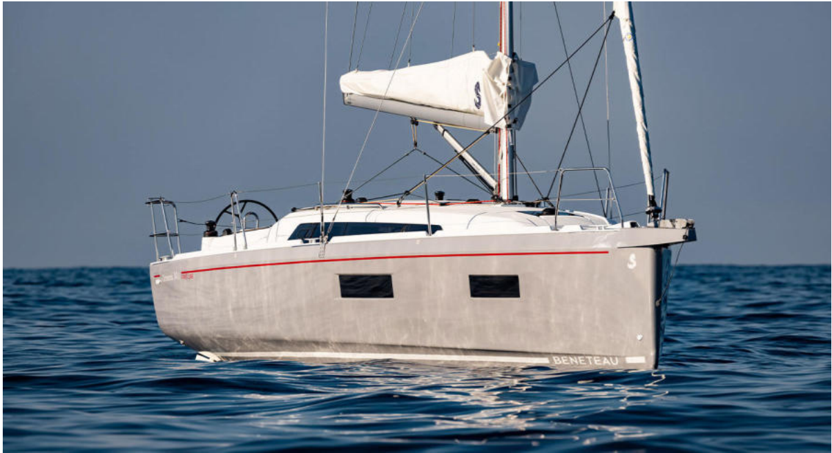
Beneteau OCEANIS 34.1