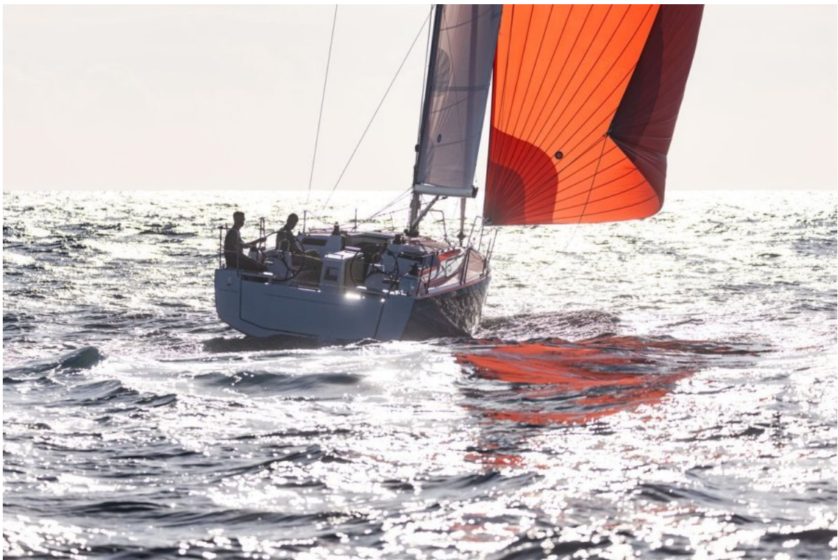
Beneteau OCEANIS 34.1