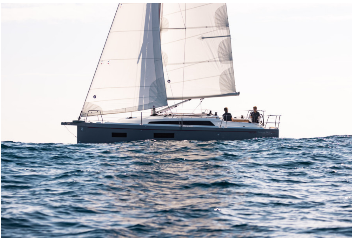
Beneteau OCEANIS 34.1