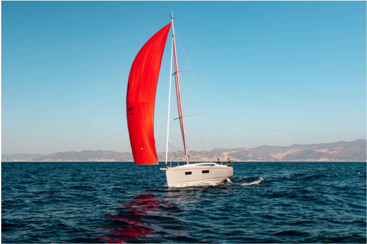
Beneteau OCEANIS 34.1