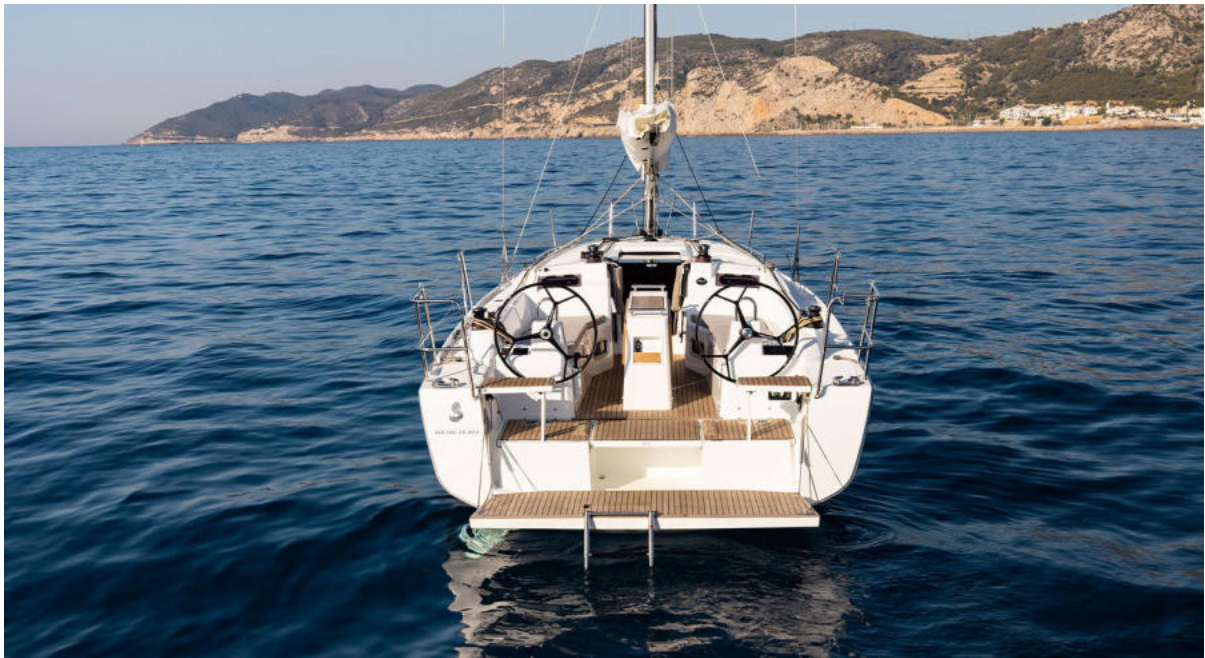
Beneteau OCEANIS 34.1