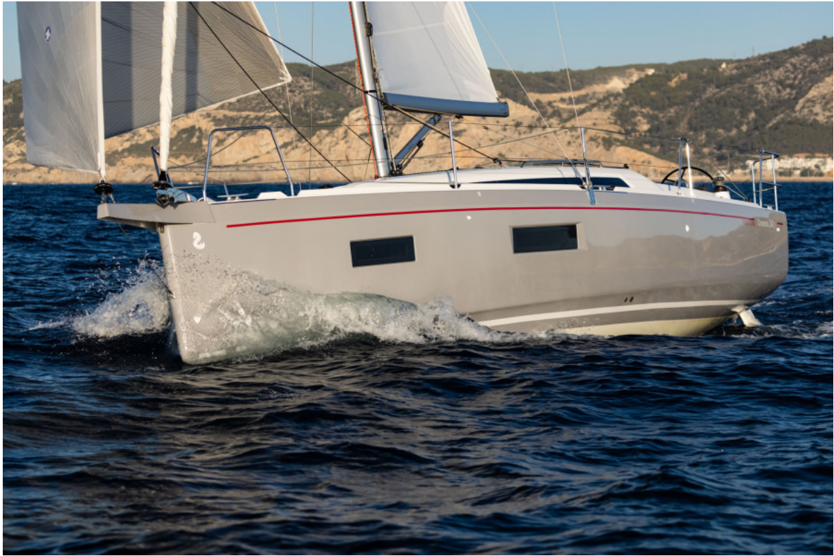
Beneteau OCEANIS 34.1