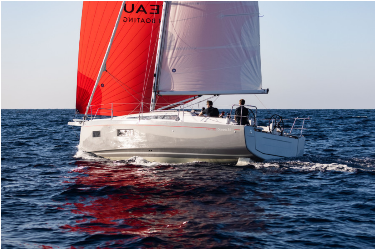
Beneteau OCEANIS 34.1