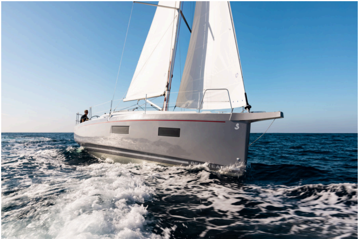
Beneteau OCEANIS 34.1