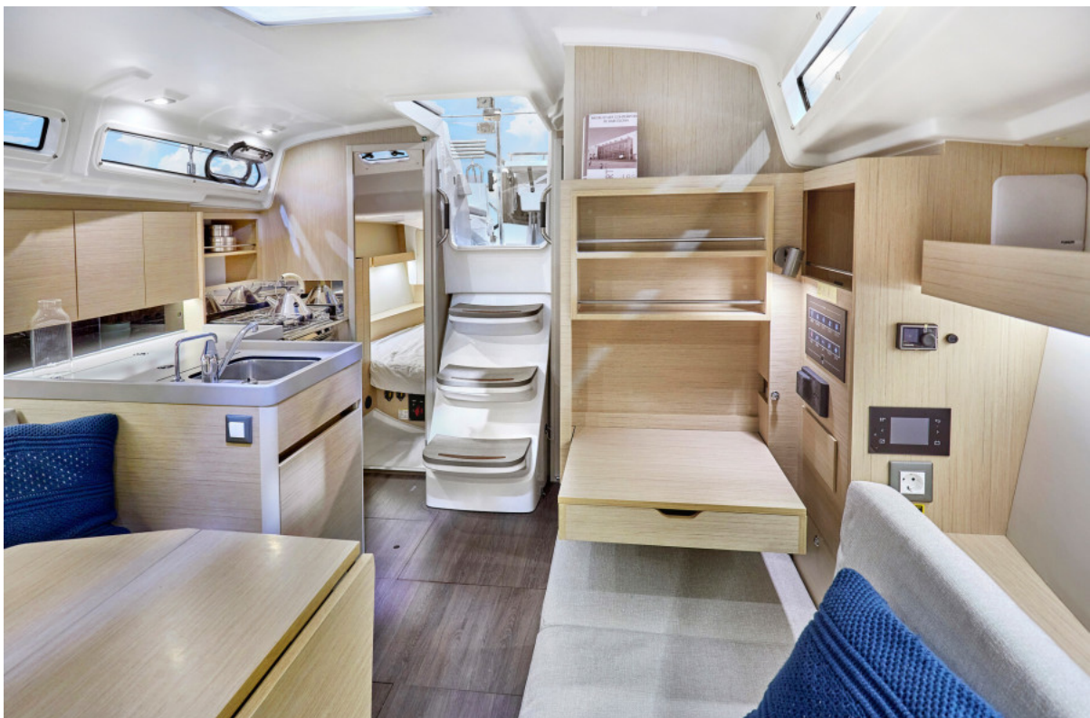
Beneteau OCEANIS 34.1 Salon & Nav Station