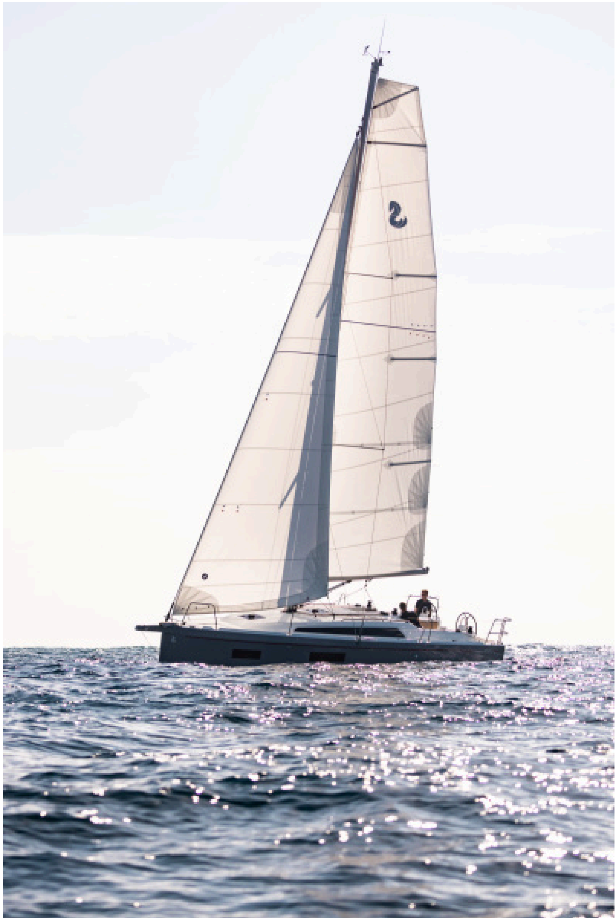
Beneteau OCEANIS 34.1