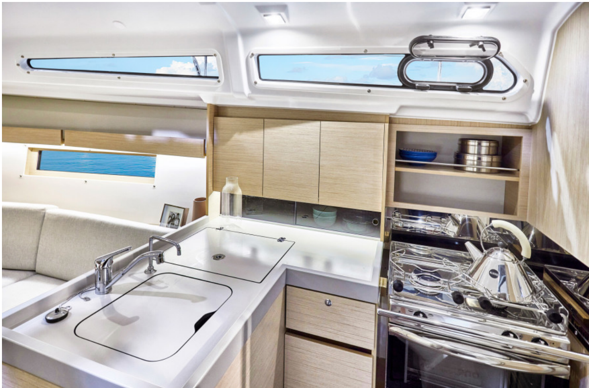
Beneteau OCEANIS 34.1 Galley