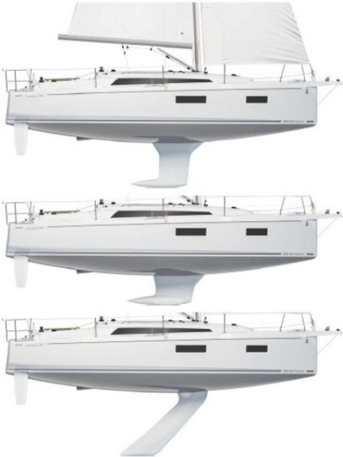
Beneteau OCEANIS 34.1