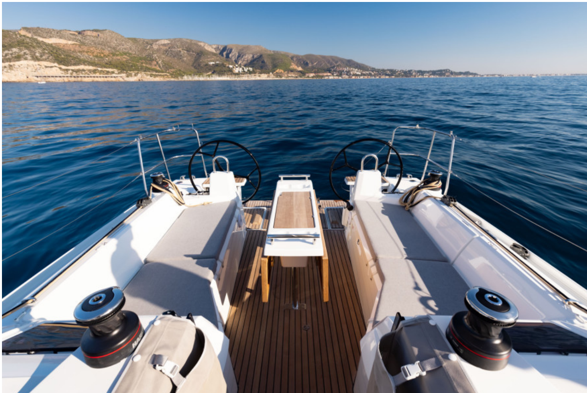
Beneteau OCEANIS 34.1