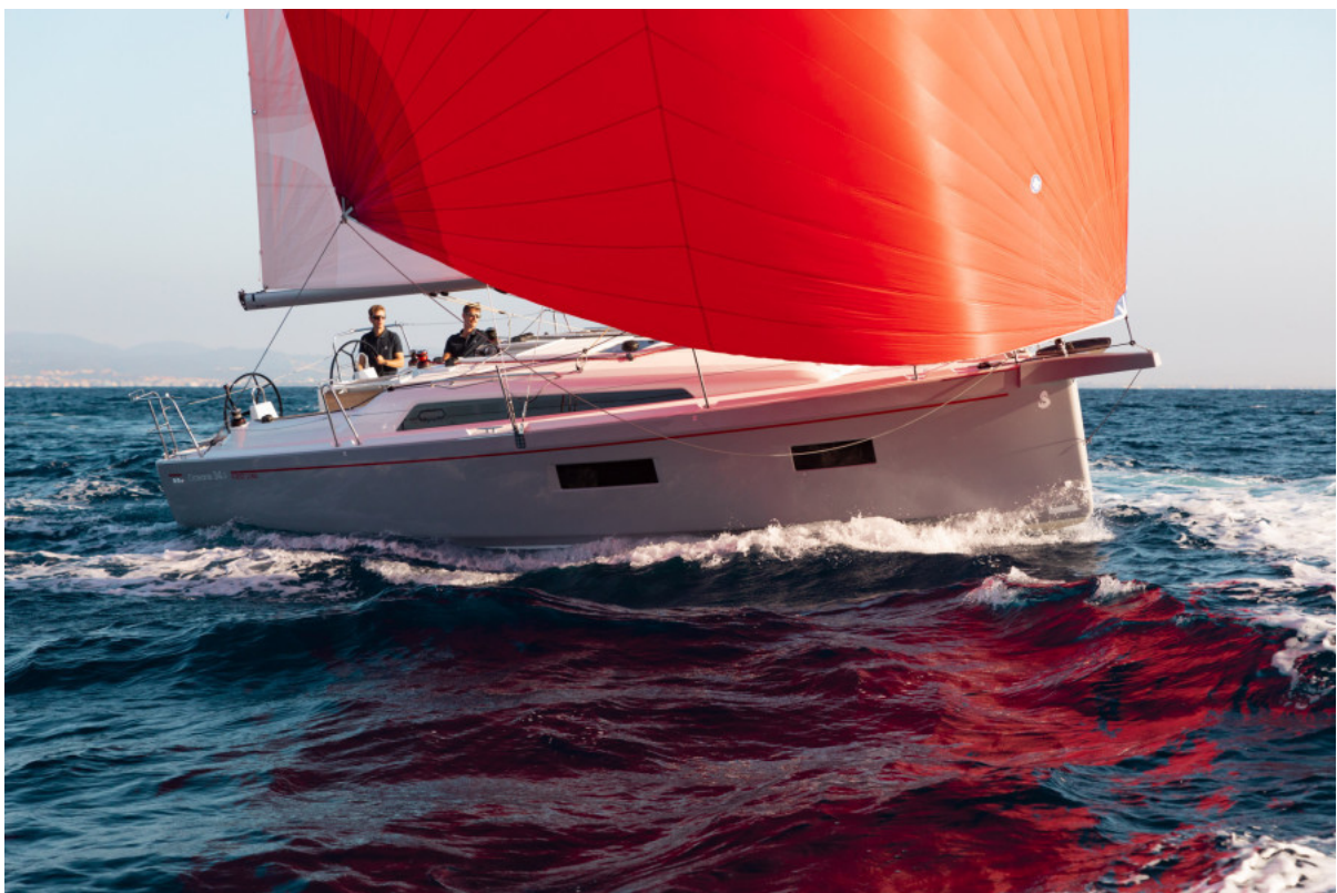
Beneteau OCEANIS 34.1