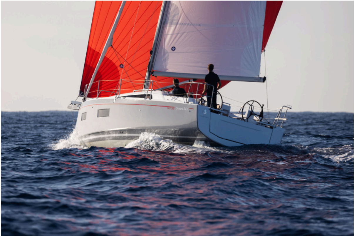
Beneteau OCEANIS 34.1