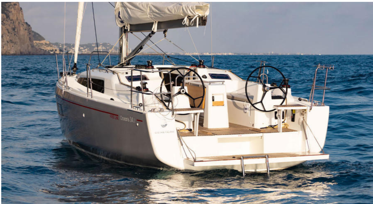
Beneteau OCEANIS 34.1