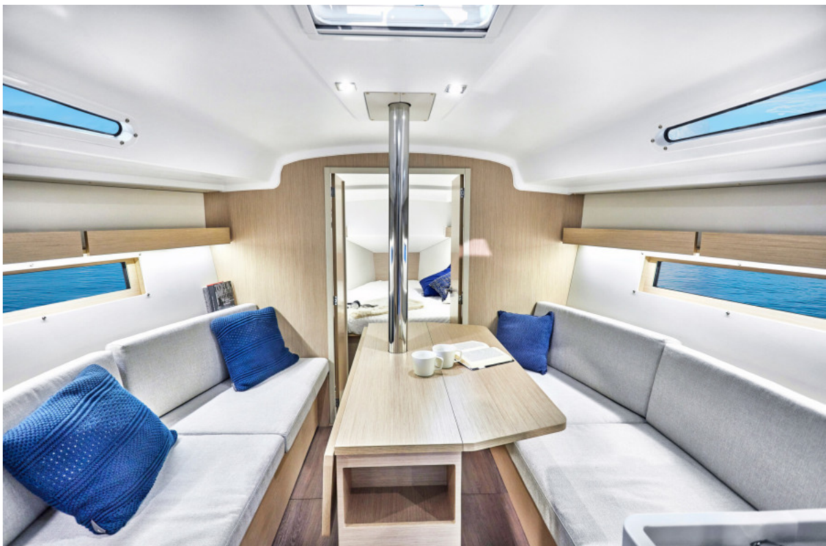
Beneteau OCEANIS 34.1 Salon