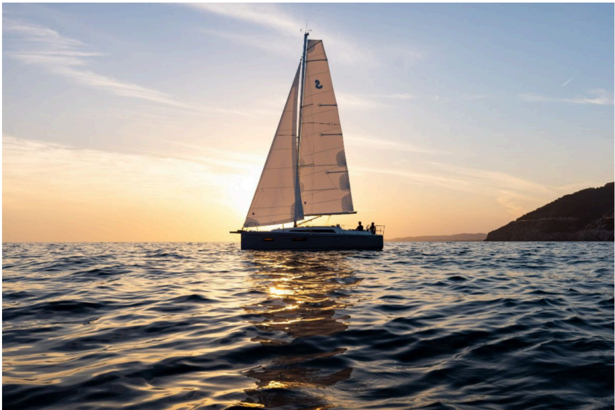
Beneteau OCEANIS 34.1