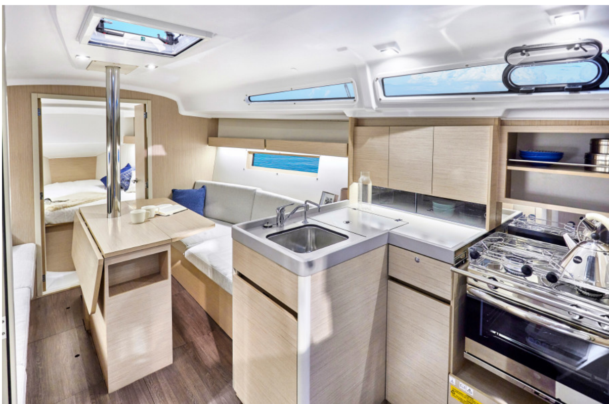
Beneteau OCEANIS 34.1 Galley & Salon