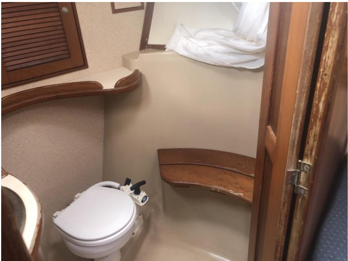
Forward head shower