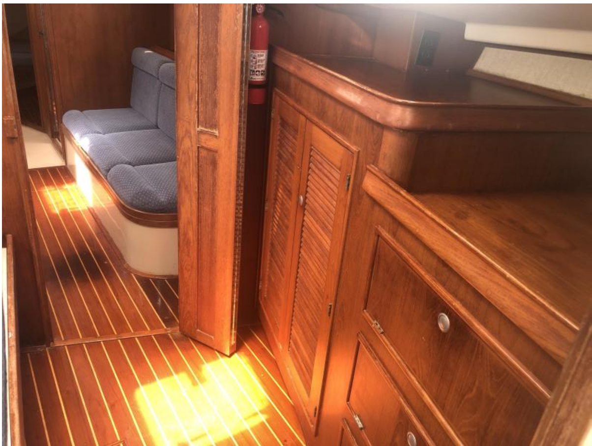
Looking aft from forward head