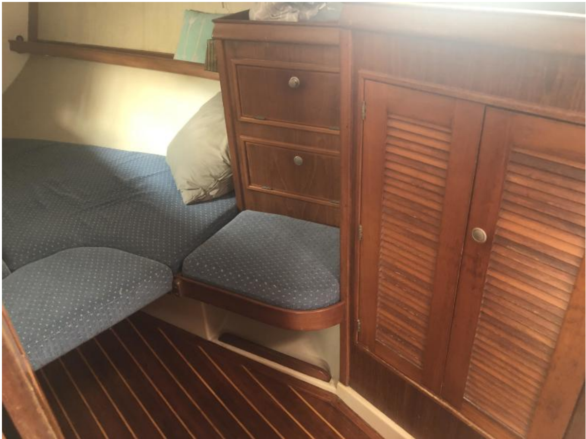
Aft Cabin storage