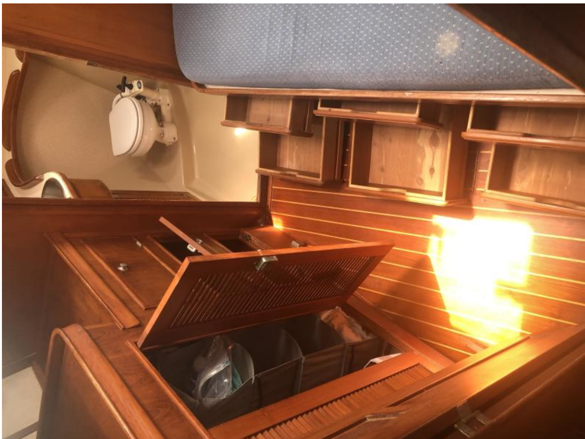
Forward cabin storage