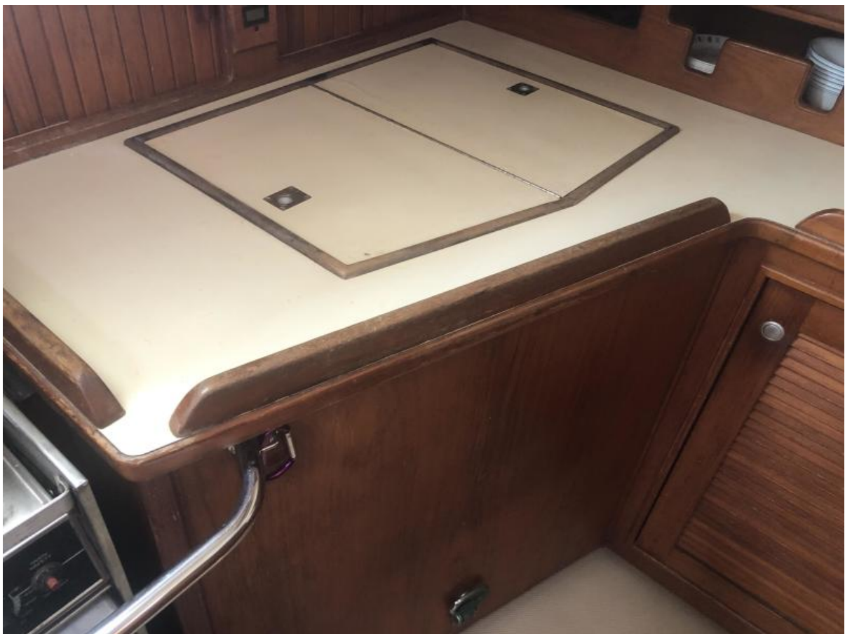
Top of Fridge/freezer