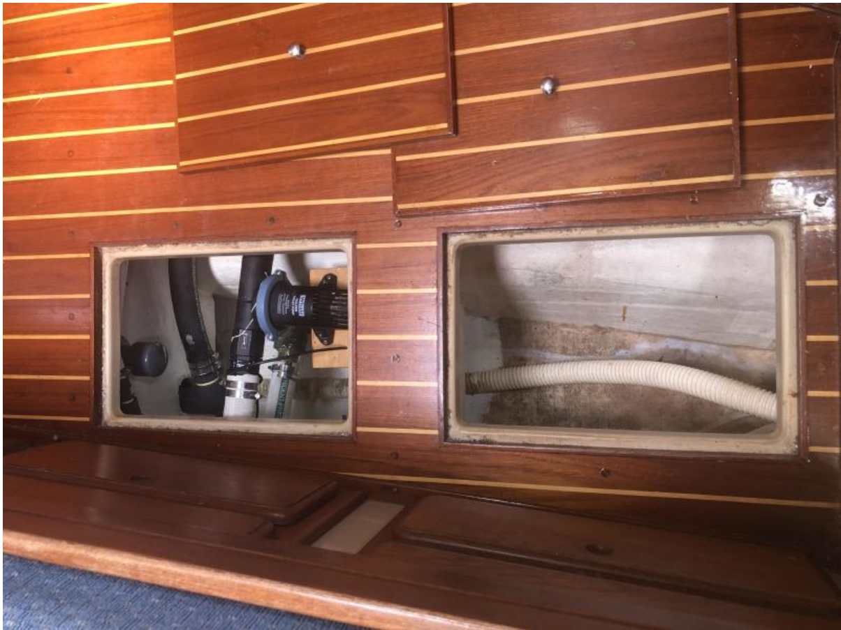
Forward cabin bilge access