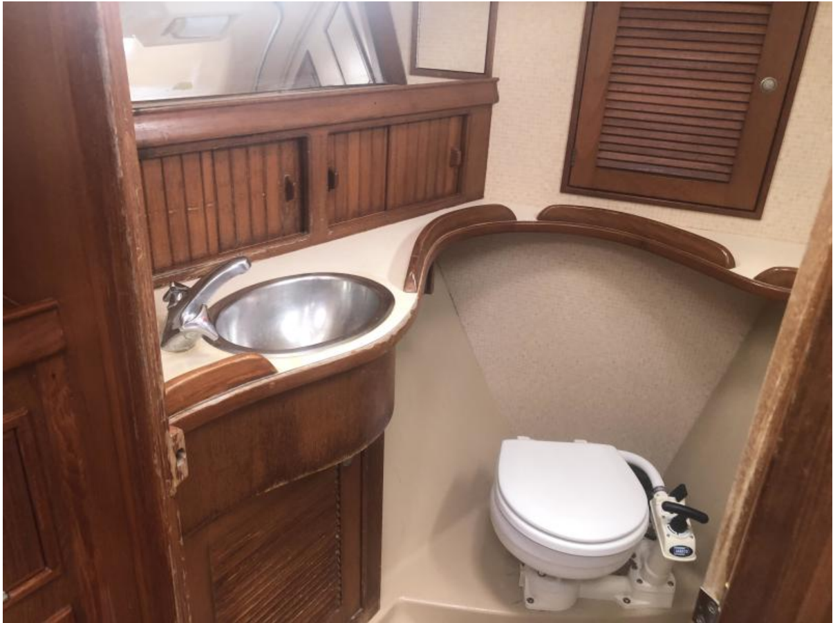
Forward head sink