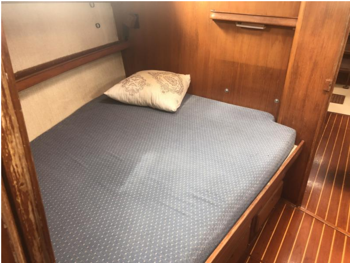
Forward cabin pullman berth