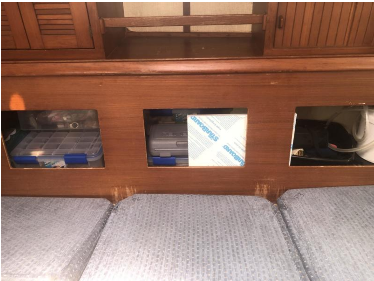
Behind port settee storage