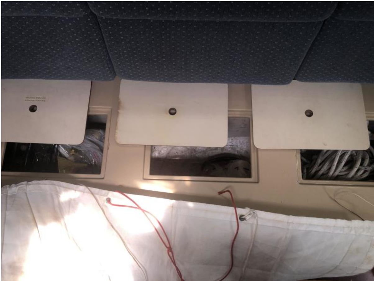
Below port settee storage