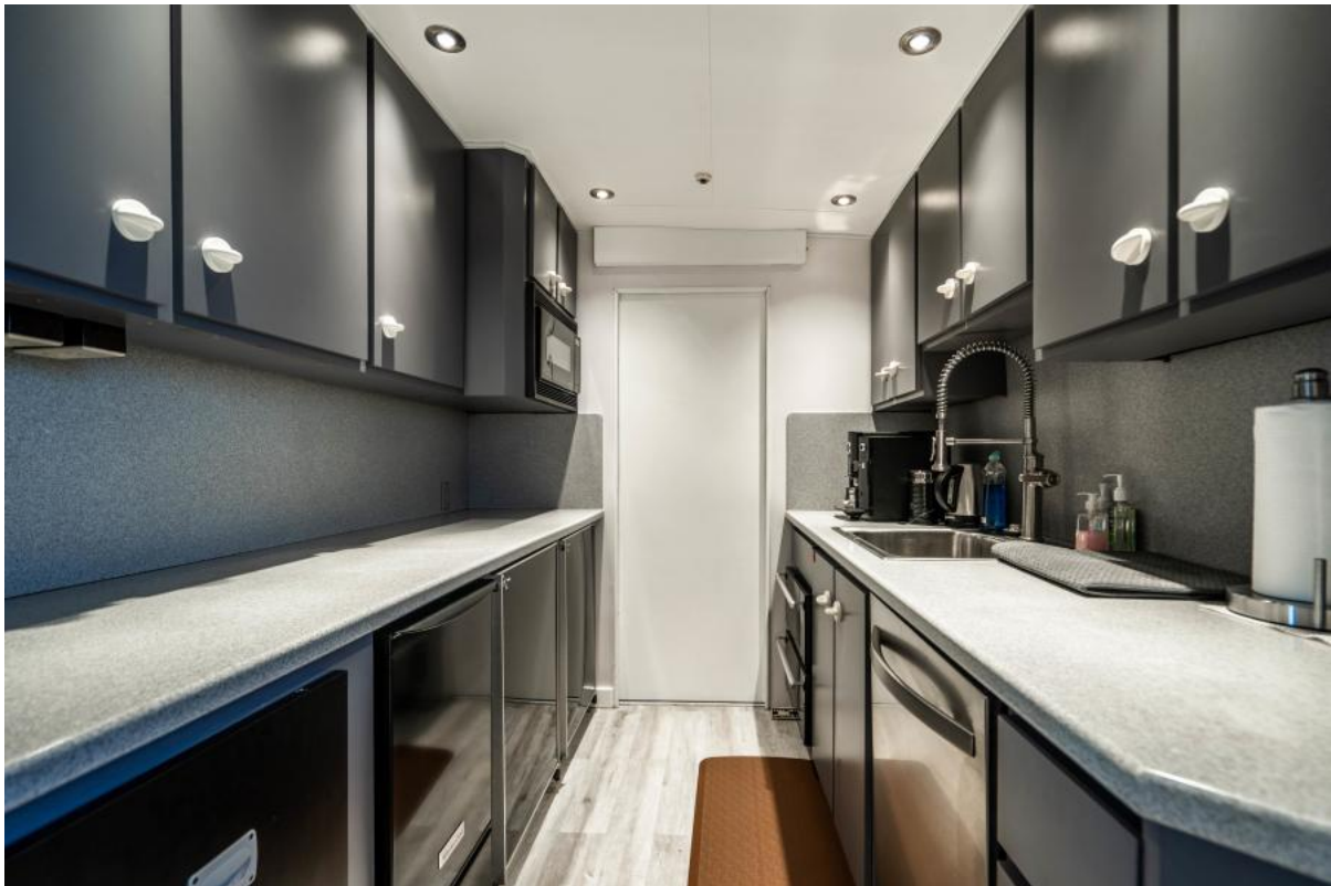
MAIN DECK STEW PANTRY