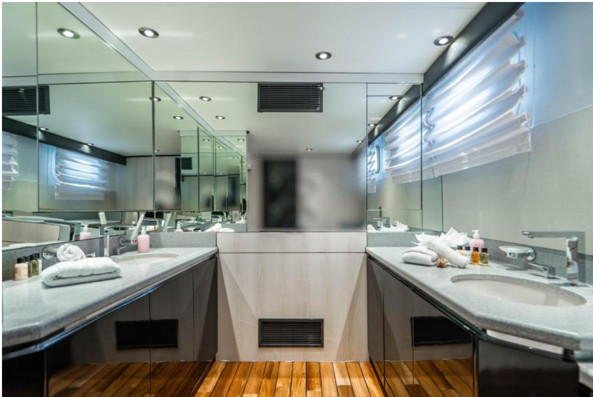
GUEST STATEROOM HEAD