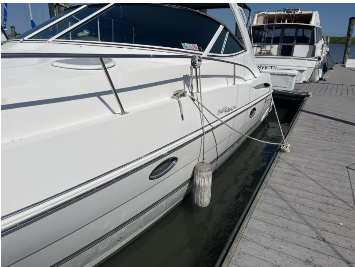
2005 Cruisers 340 Express Side