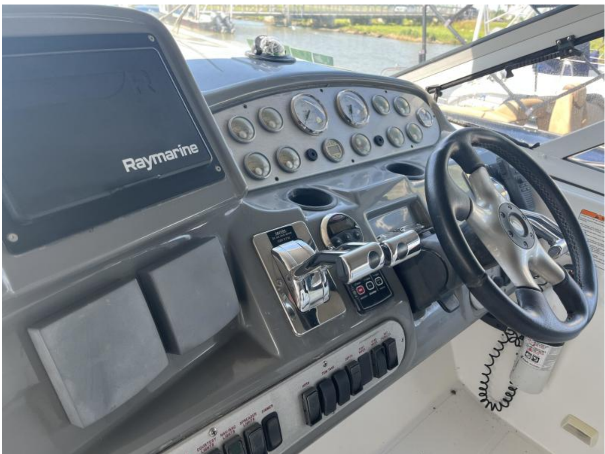
2005 Cruisers 340 Express Helm & Electronics