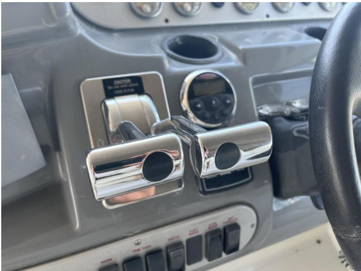
2005 Cruisers 340 Express Throttles