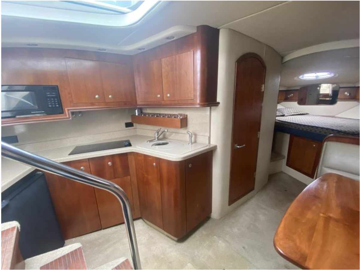
2005 Cruisers Yacht 340 Express