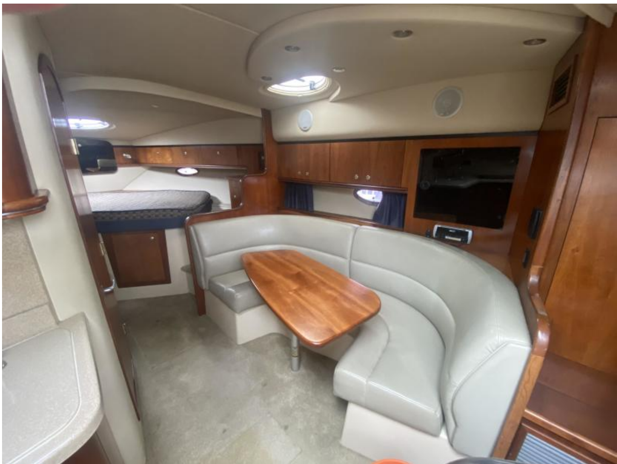
2005 Cruisers Yacht 340 Express