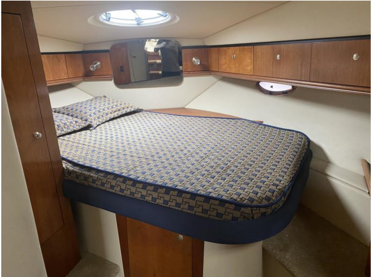
2005 Cruisers Yacht 340 Express