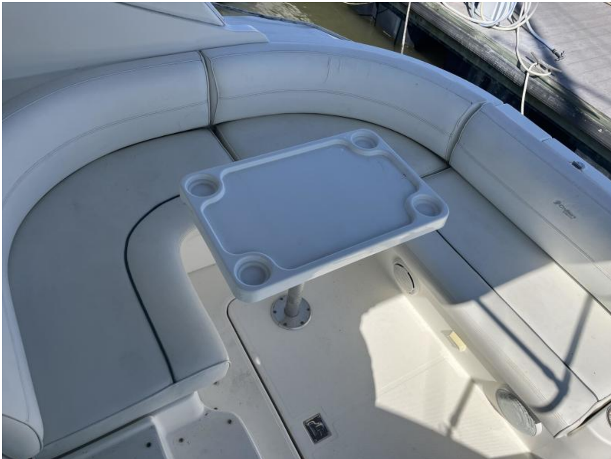
2005 Cruisers 340 Express Cockpit