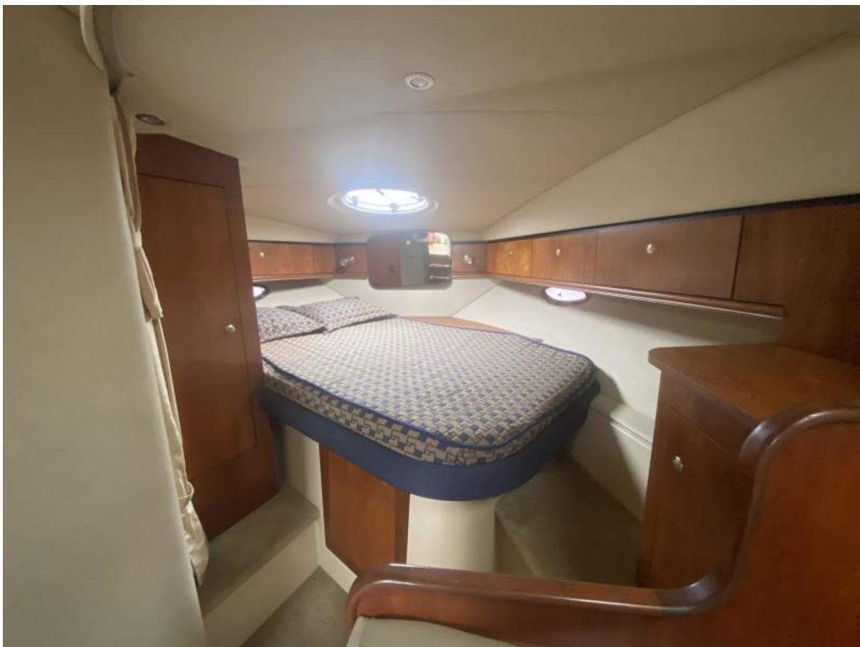
2005 Cruisers Yacht 340 Express