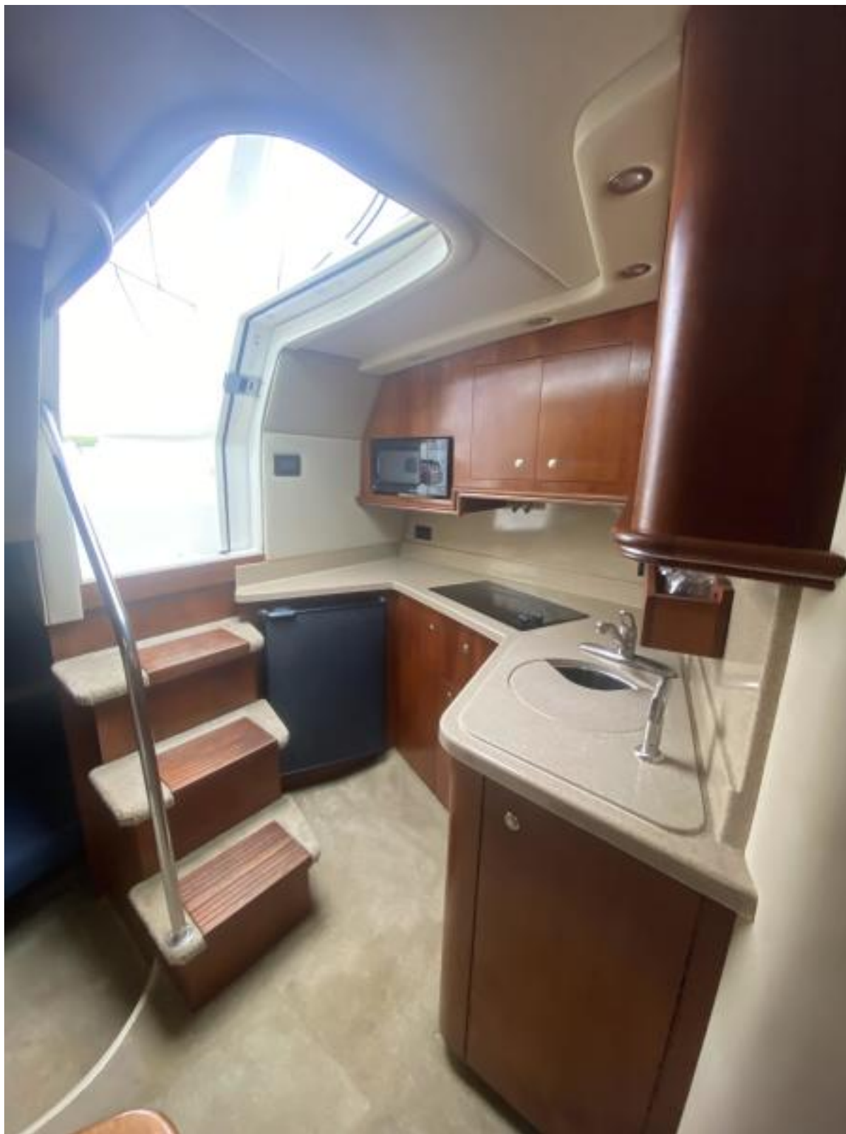
2005 Cruisers Yacht 340 Express