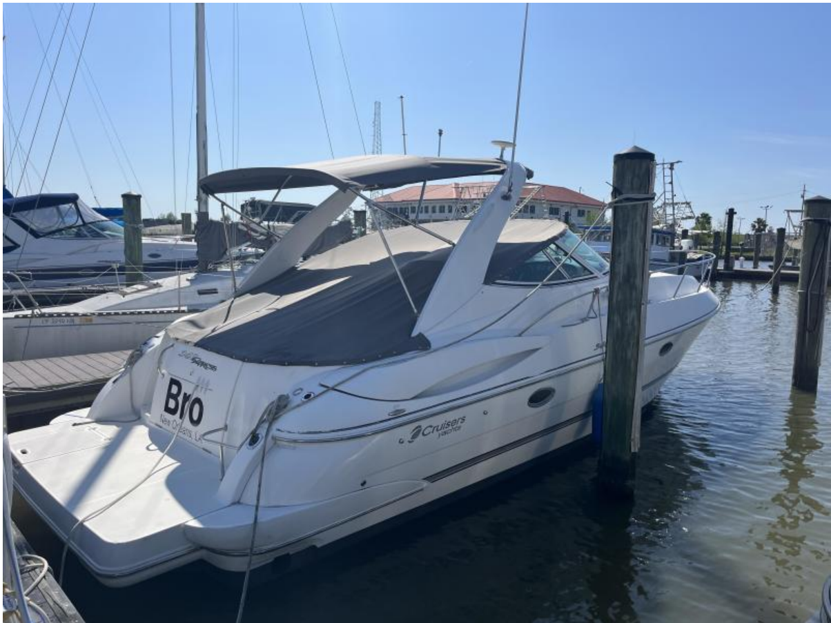
2005 Cruisers 340 Express Starboard Profile