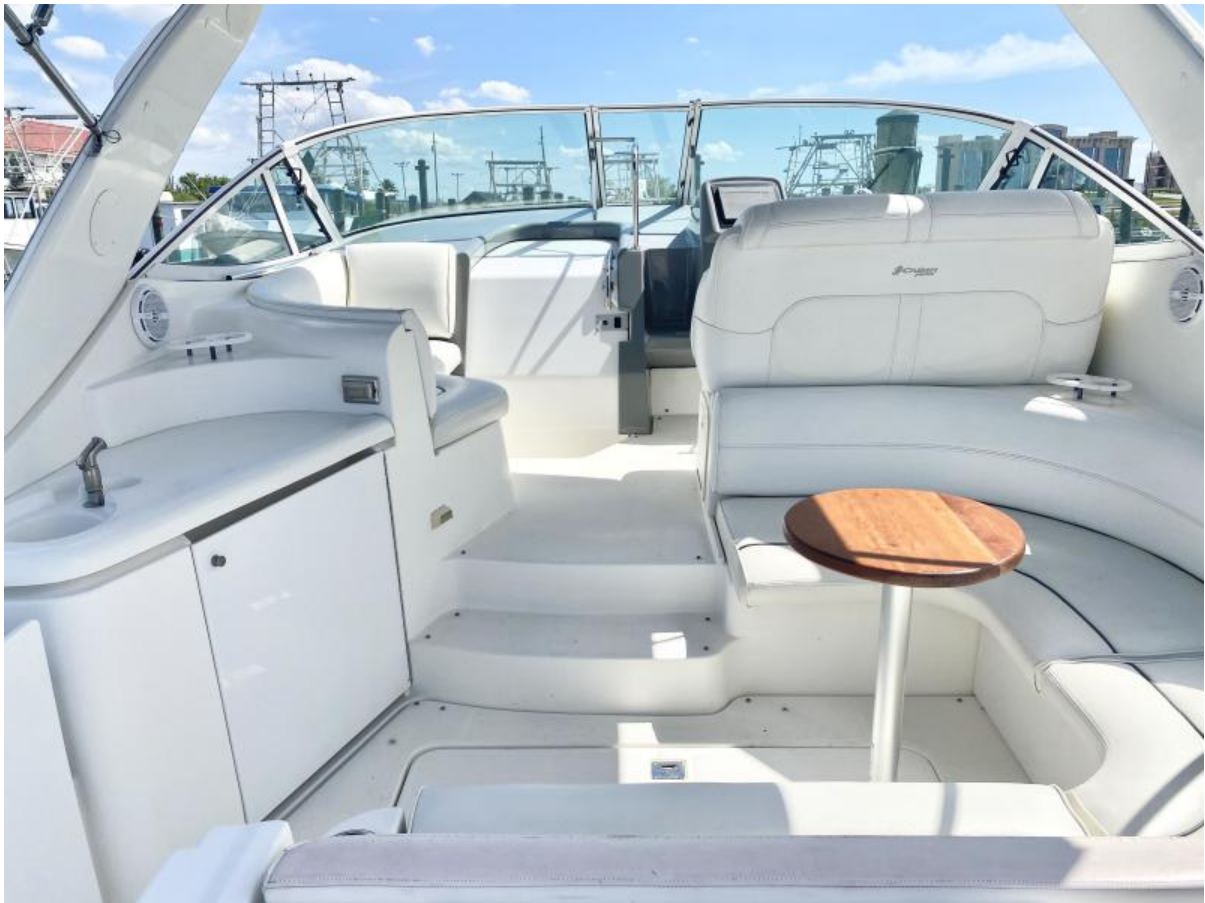
2005 Cruisers Yacht 340 Express