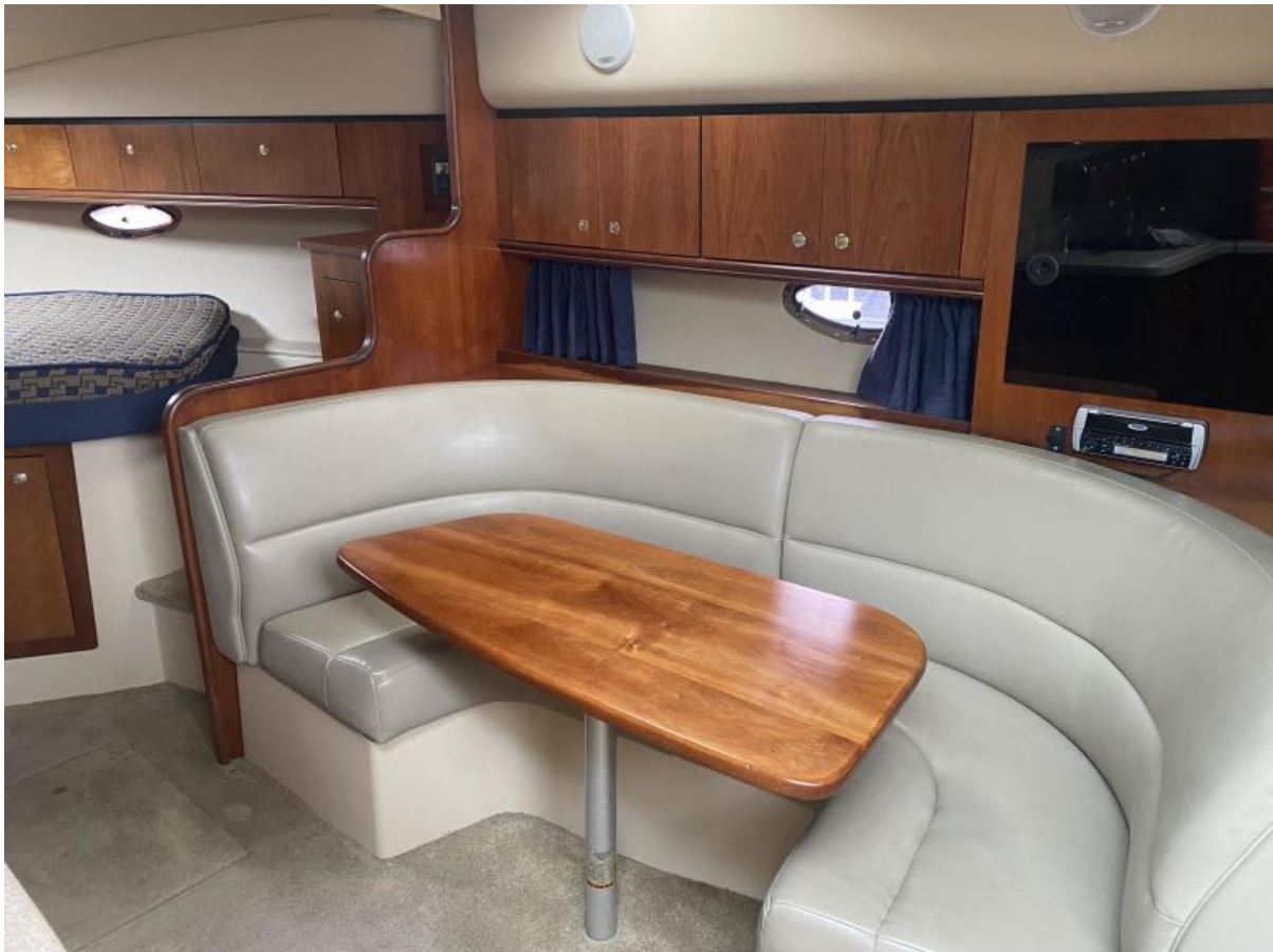
2005 Cruisers Yacht 340 Express