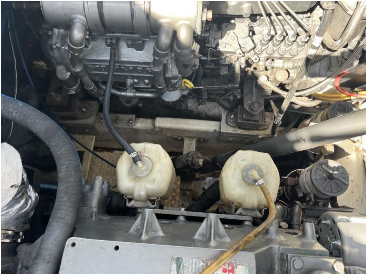
2005 Cruisers 340 Express Engine Room