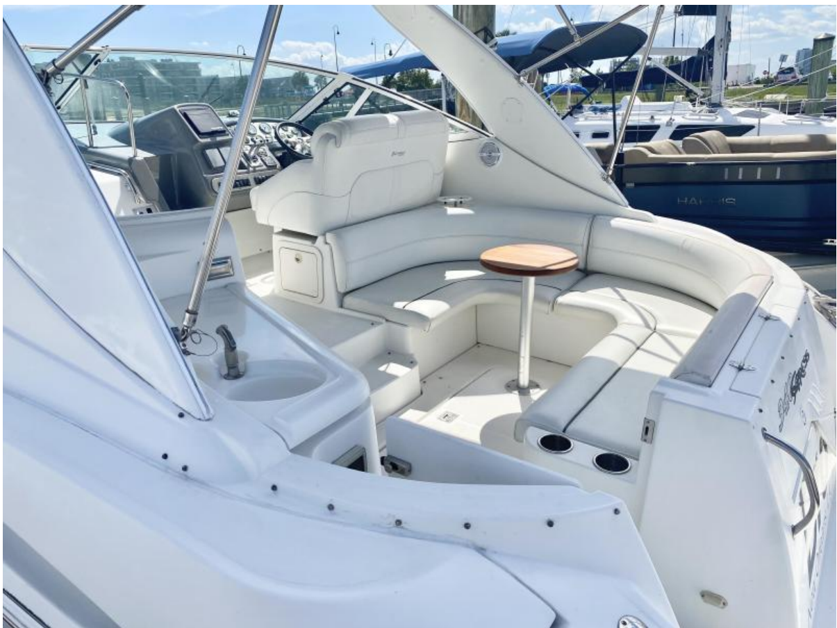
2005 Cruisers Yacht 340 Express