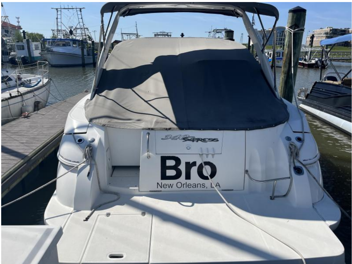
2005 Cruisers 340 Express Transom & Swim Platform