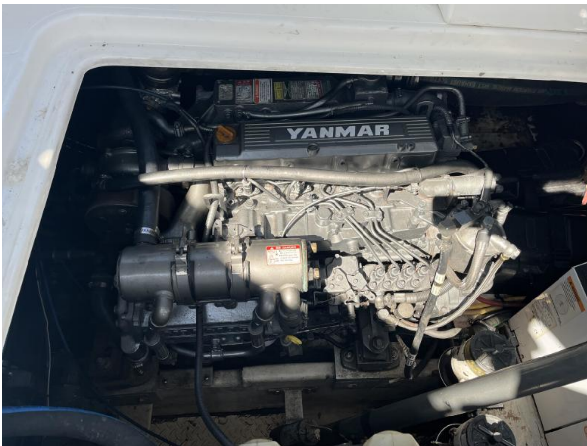
2005 Cruisers 340 Express Engine