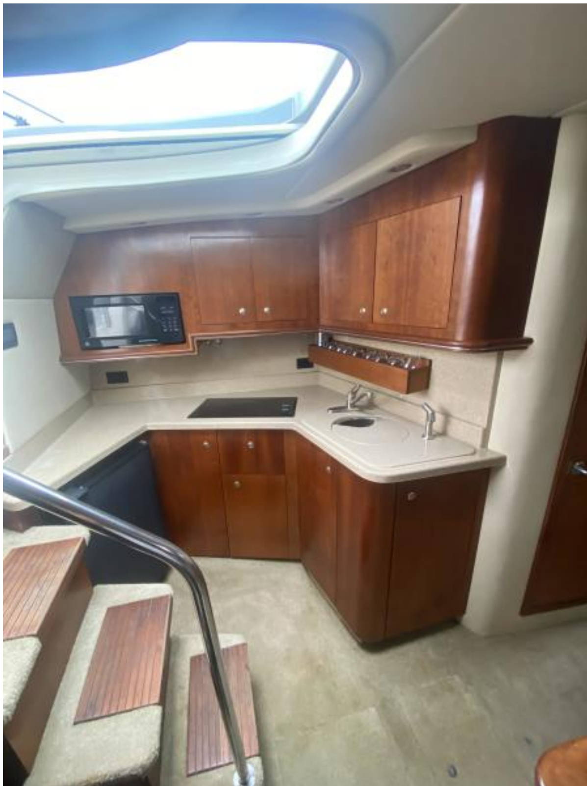
2005 Cruisers Yacht 340 Express