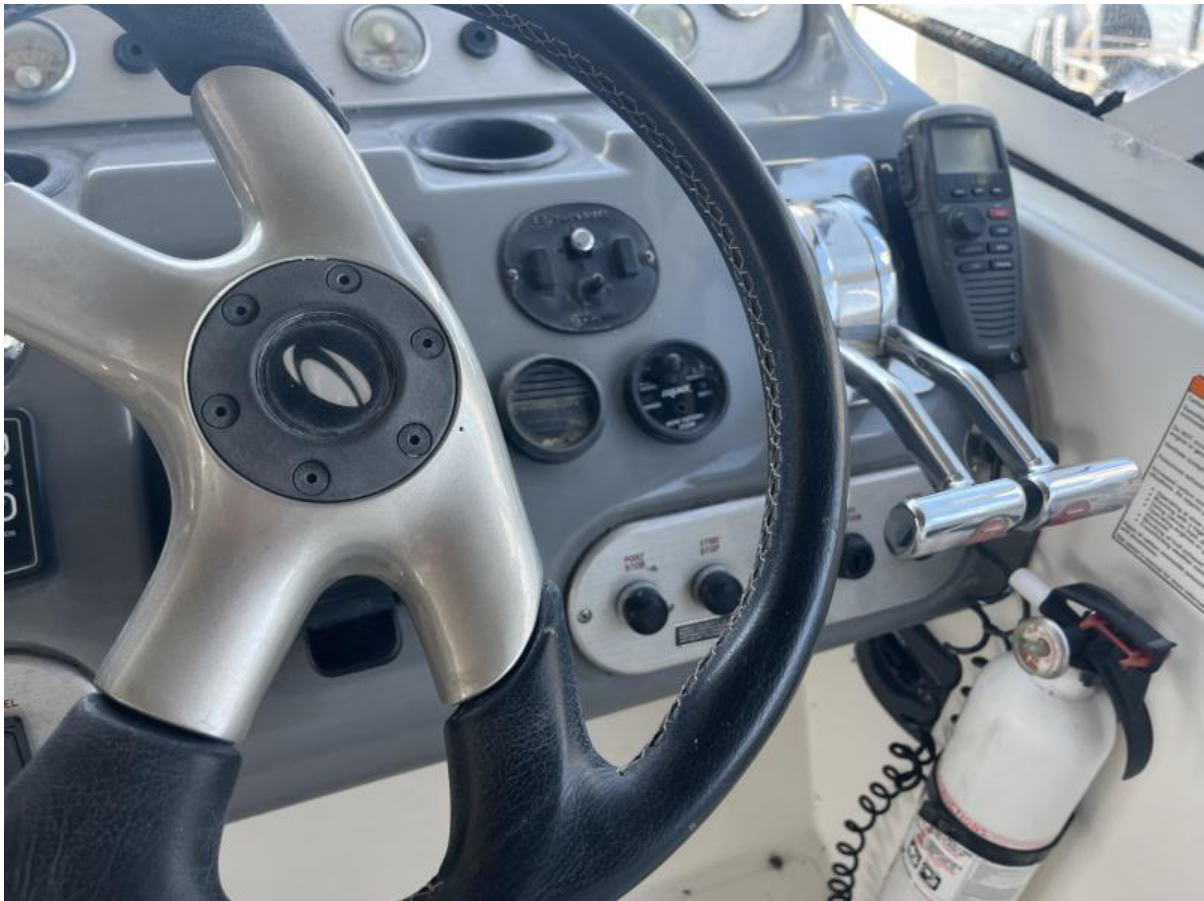
2005 Cruisers 340 Express Wheel