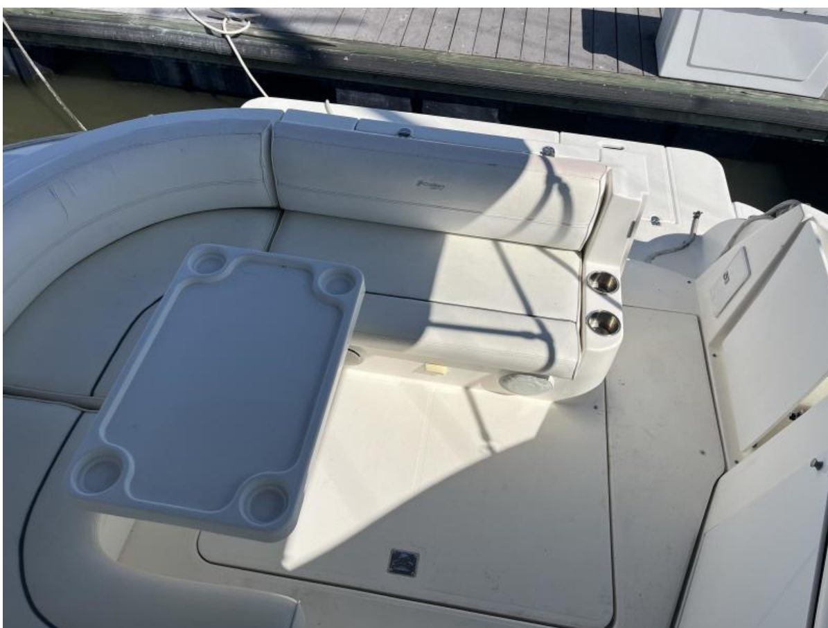
2005 Cruisers 340 Express Cockpit