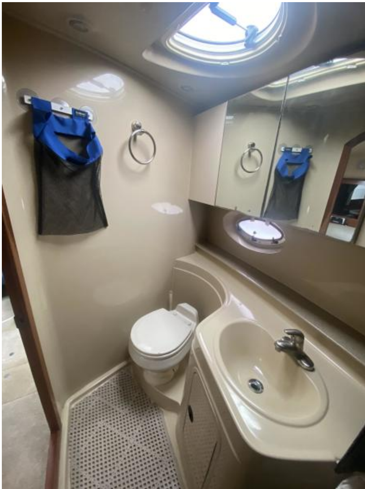
2005 Cruisers Yacht 340 Express