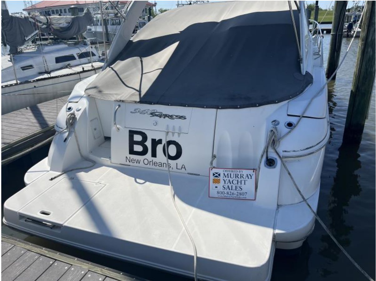
2005 Cruisers 340 Express Transom and Cockpit Cover