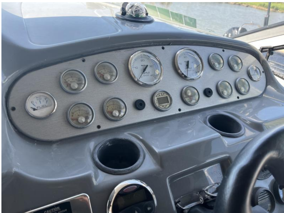
2005 Cruisers 340 Express Helm Gauges