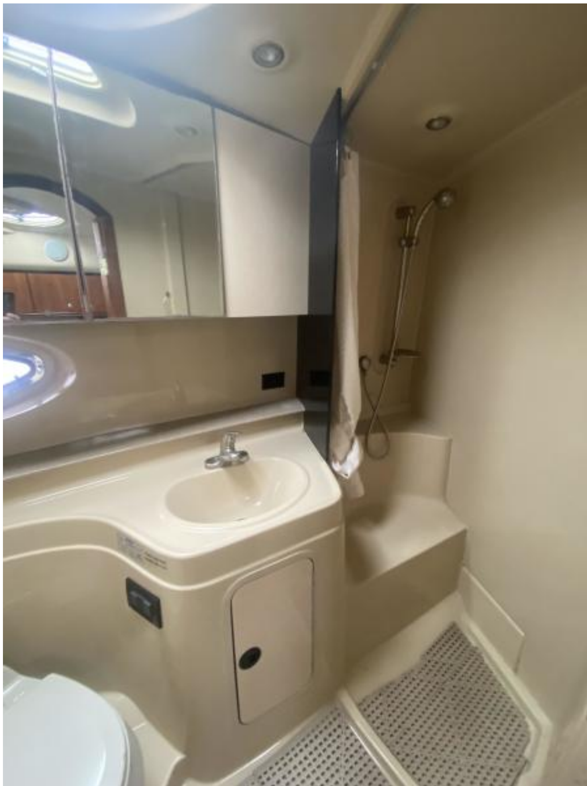
2005 Cruisers Yacht 340 Express