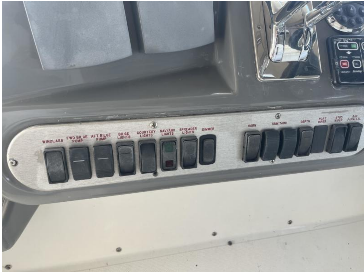
2005 Cruisers 340 Express Helm controls