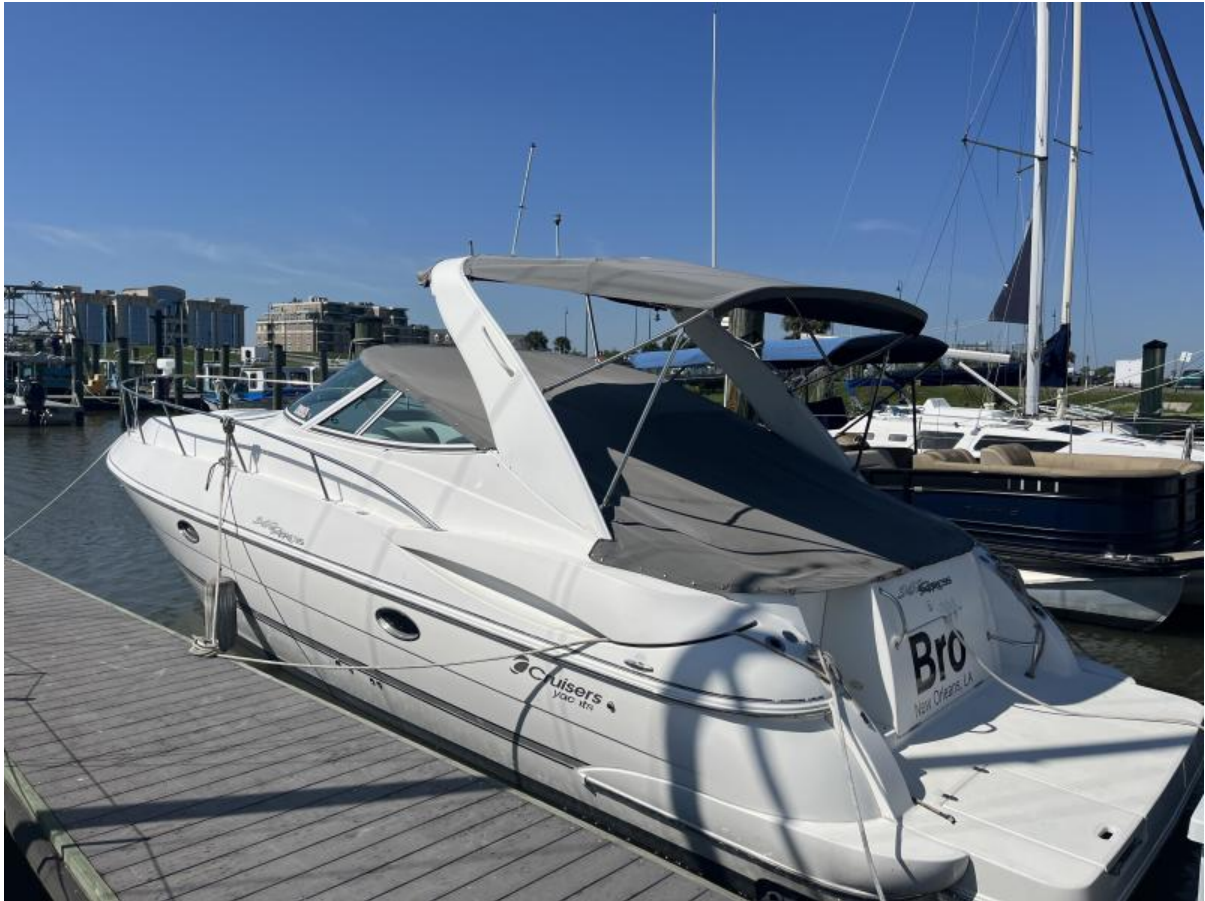
2005 Cruisers 340 Express Port Profile