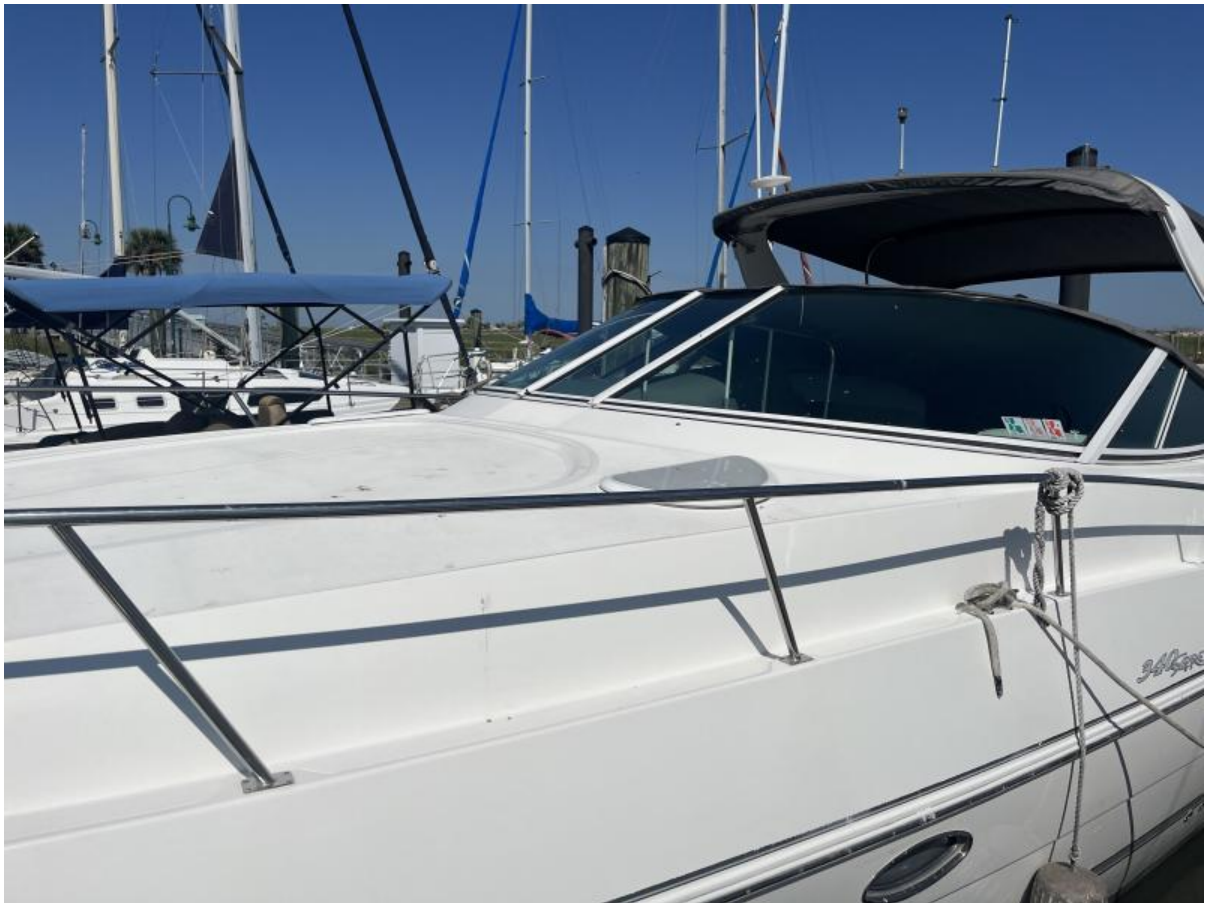
2005 Cruisers 340 Express Deck