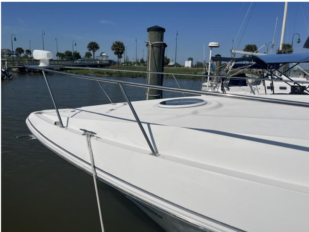
2005 Cruisers 340 Express Bow