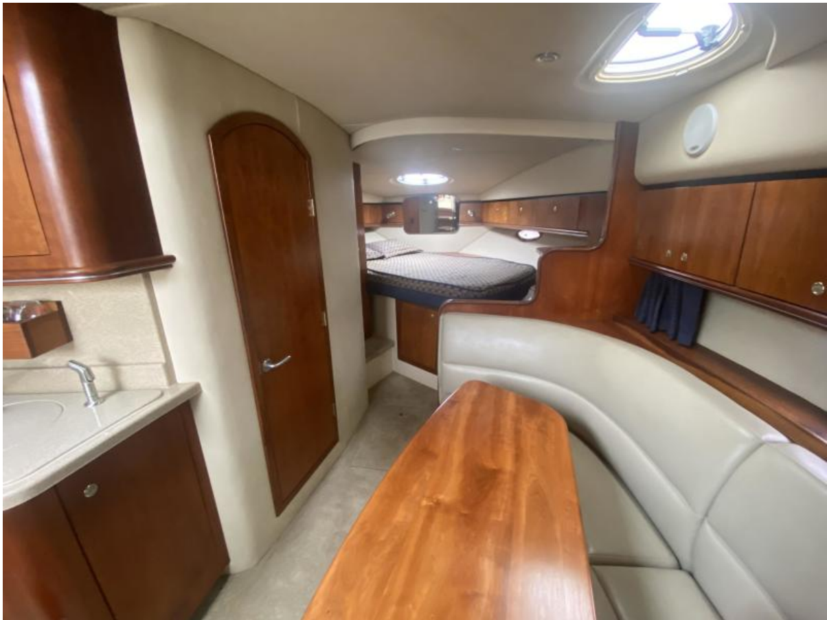
2005 Cruisers Yacht 340 Express