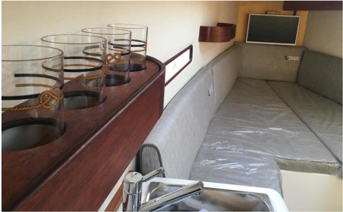
L30 Mfr Picture