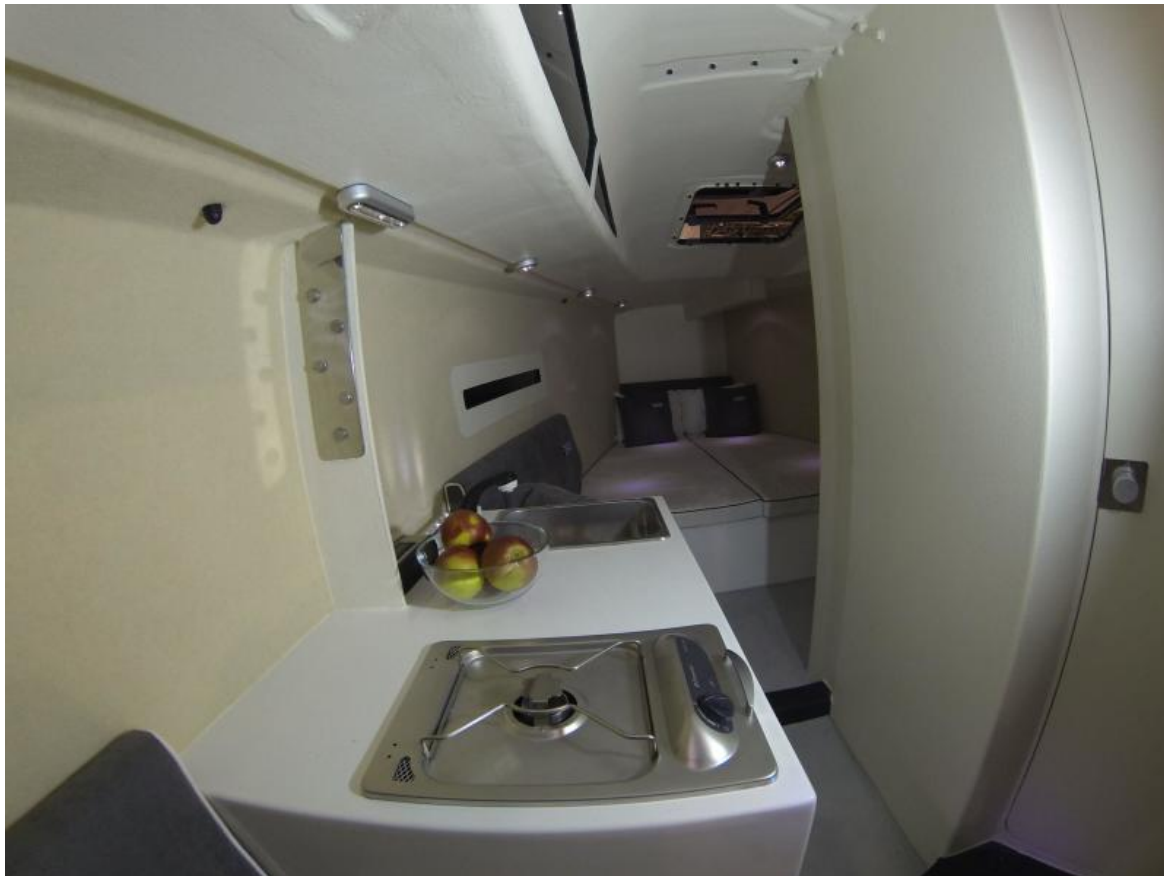
L30 Mfr Picture