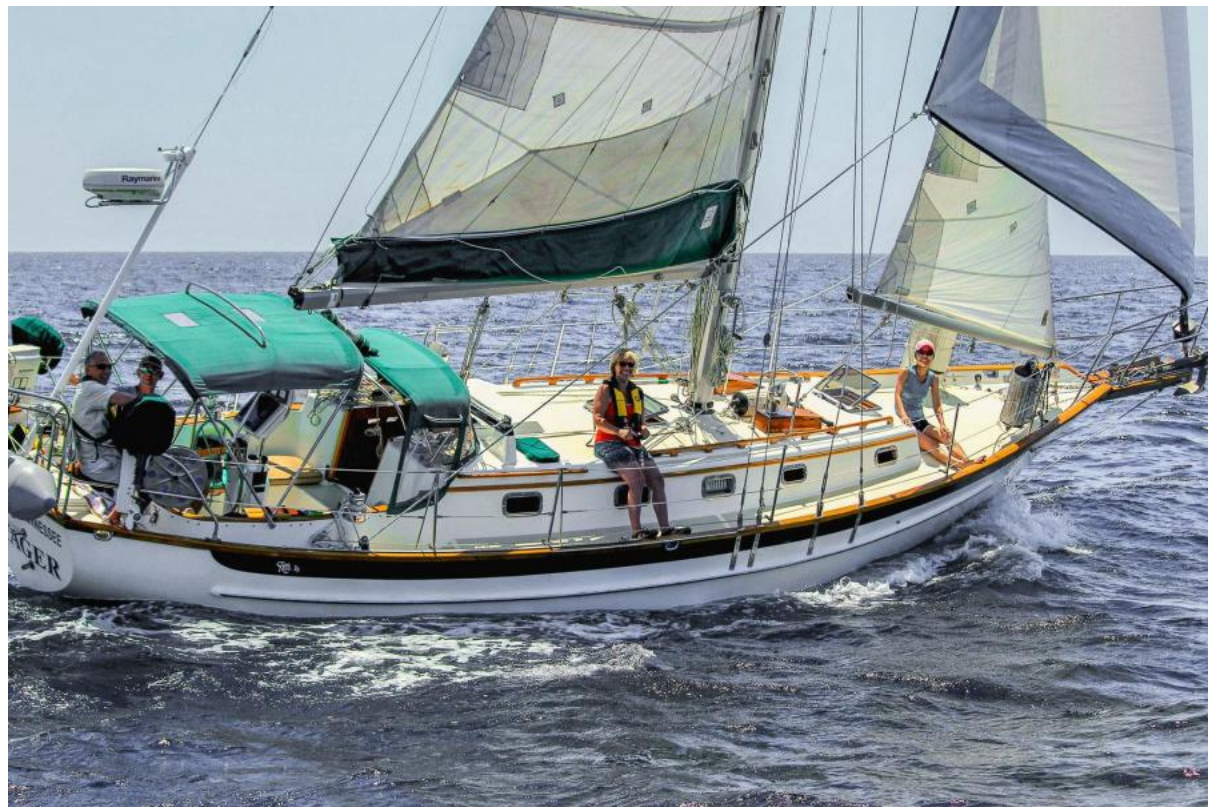
Cabo 38 Voyager Under Sail