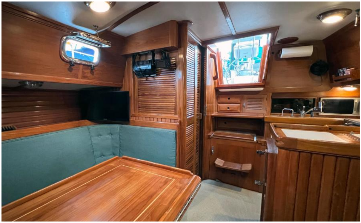
Voyager Looking Back Into Quarter Berth