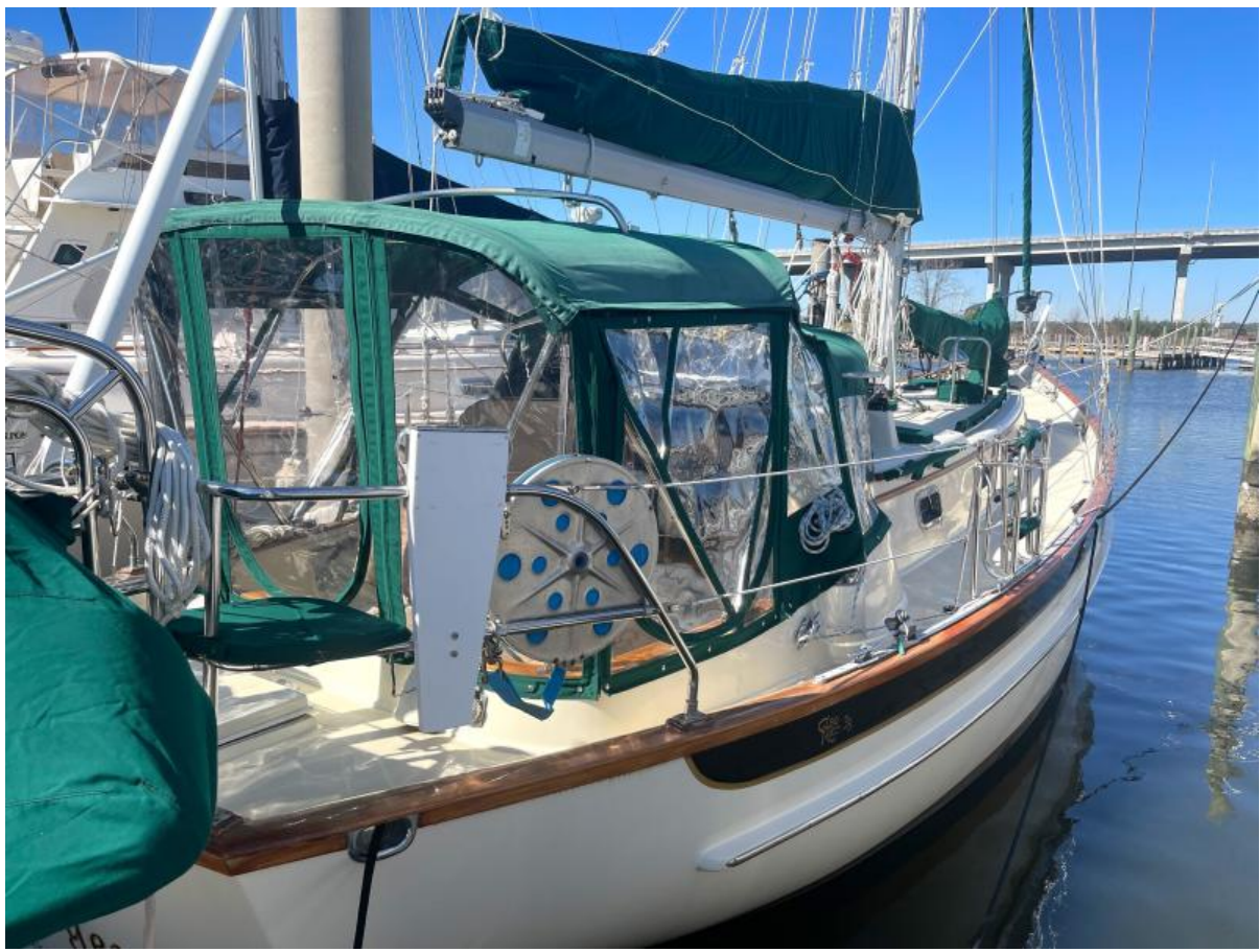
Voyager At The Dock Starboard Aft