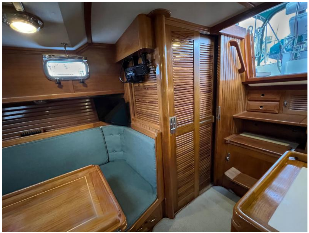
Voyager Quarter Berth Enclosure