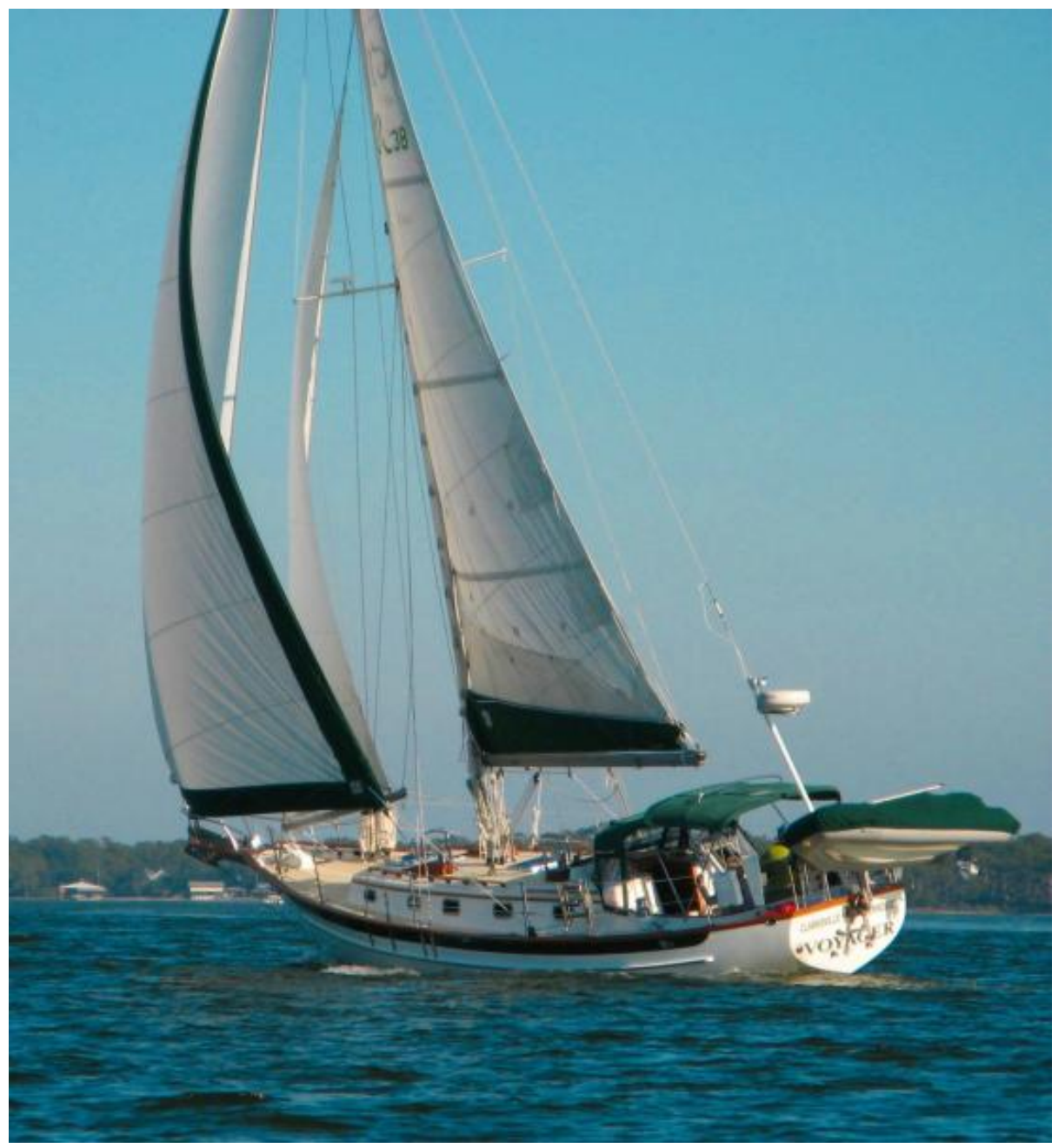
Cabo 38 Voyager Under Sail