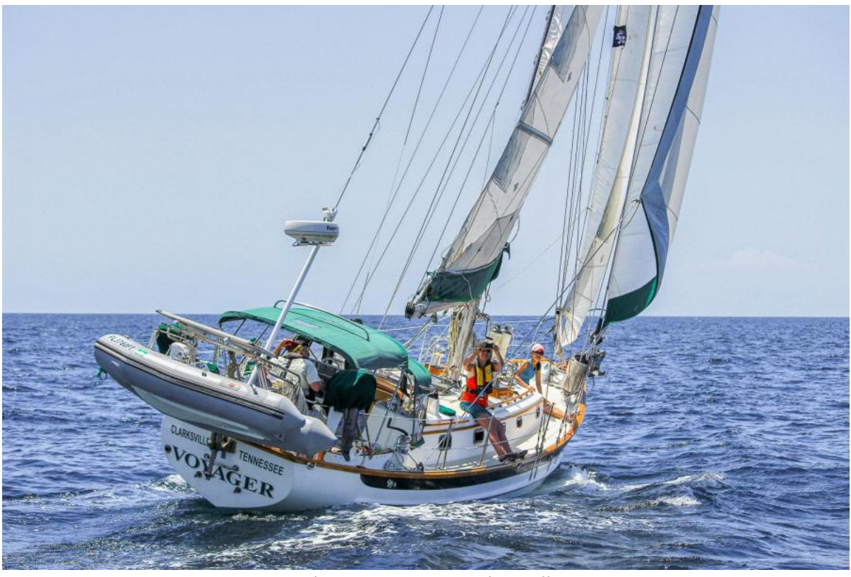
Cabo 38 Voyager Under Sail