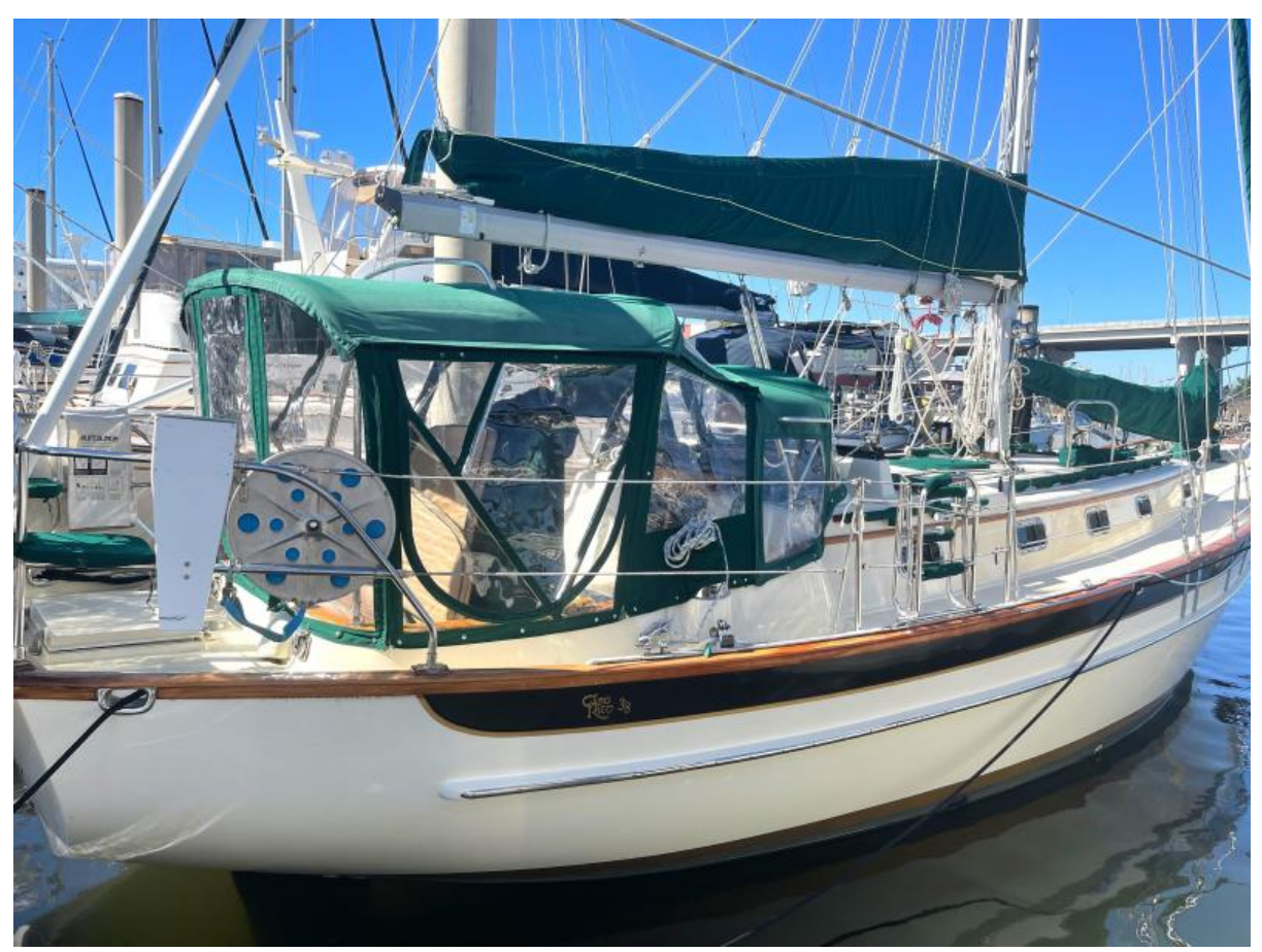
Voyager At The Dock Portside