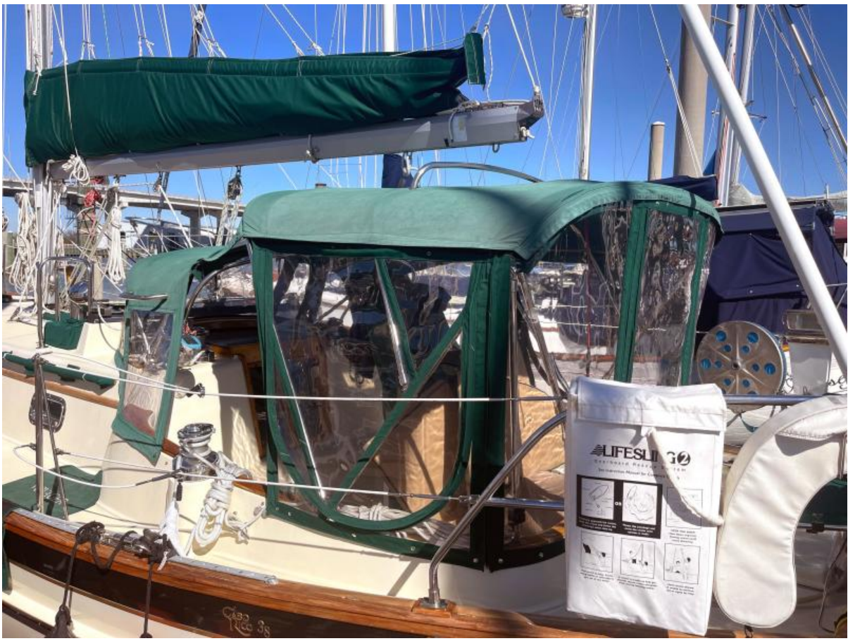
Voyager Stackpack Canvas & Cockpit