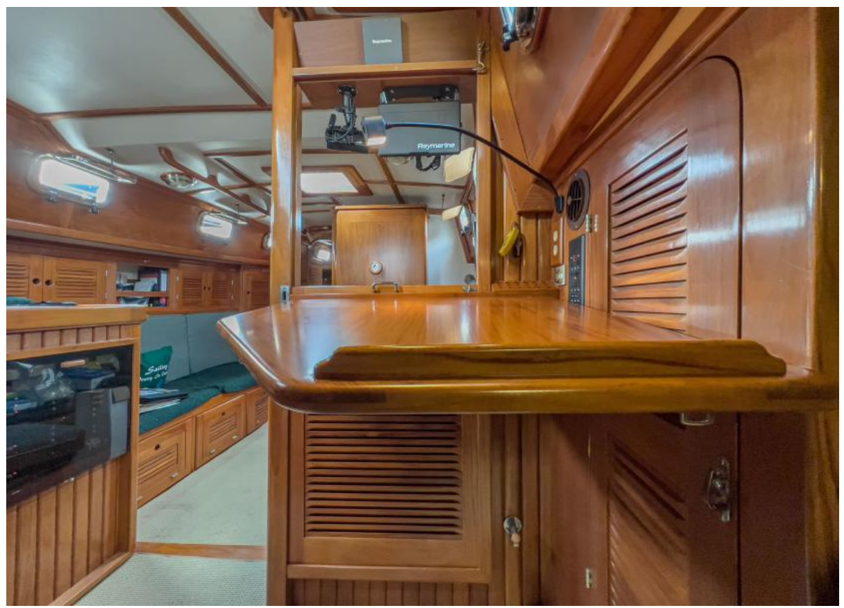
Voyager Navigation Station 2