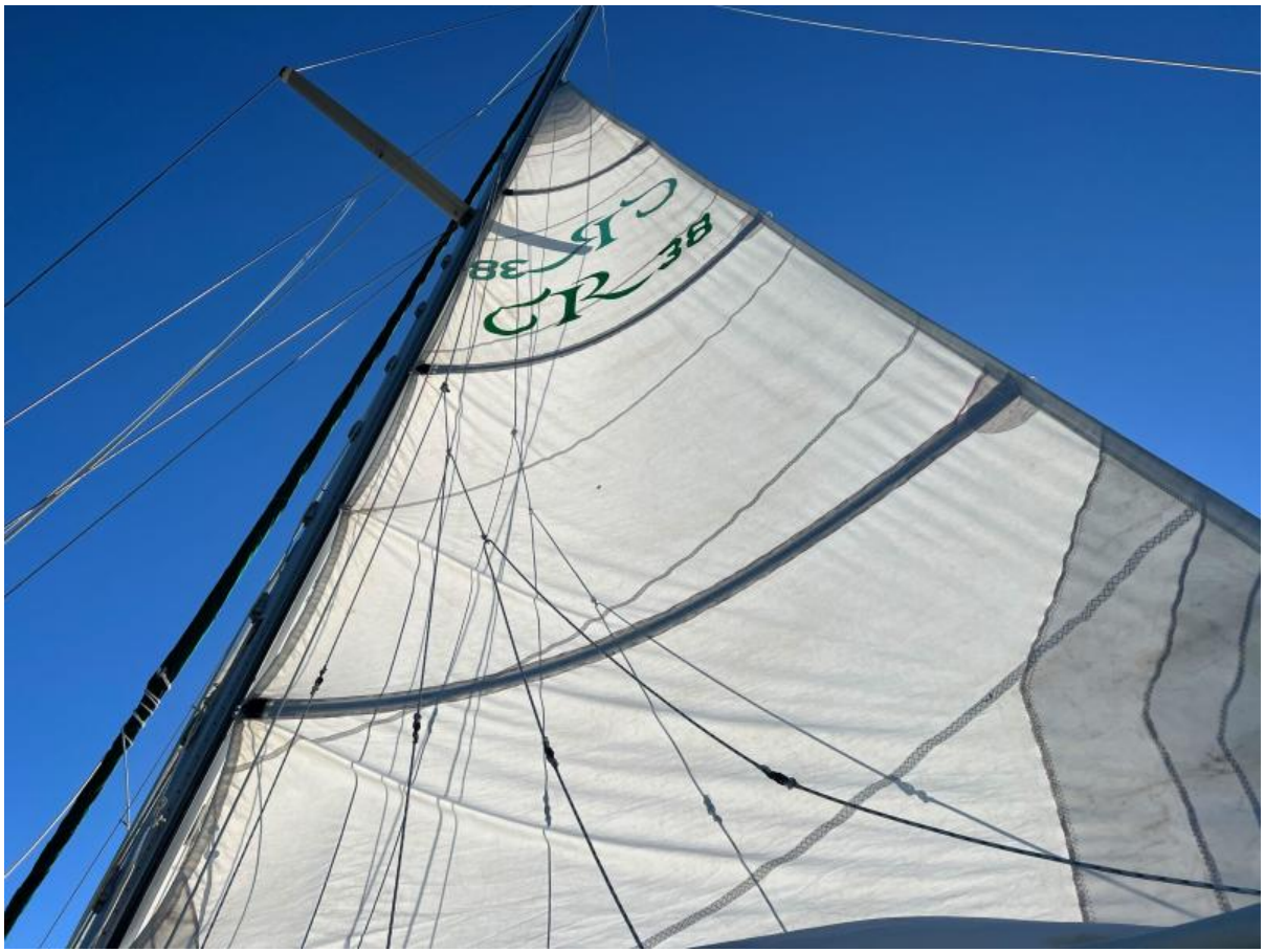
Vogager Mainsail 2023