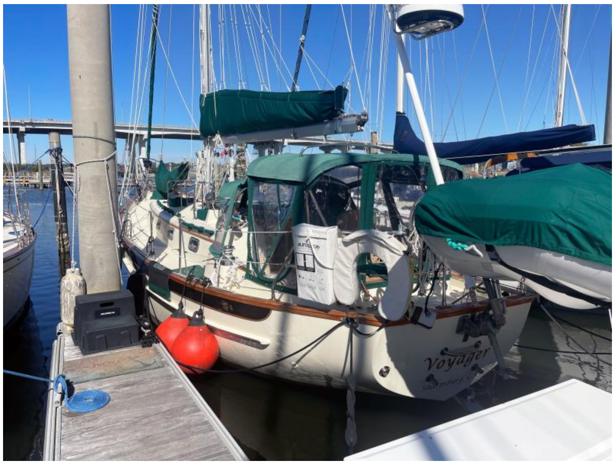
Voyager At The Dock Port Aft