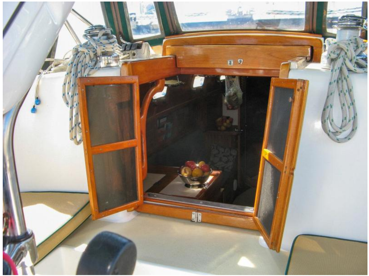
Voyager Custom Campanion Way Doors 24