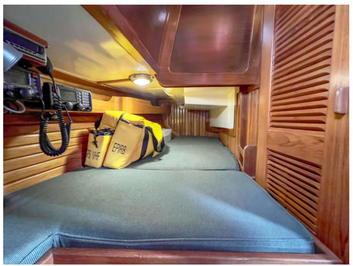
Voyager V Berth