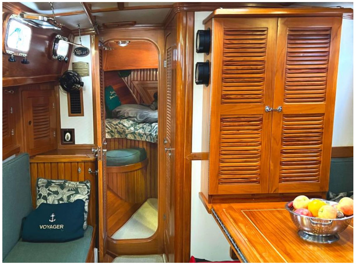
Voyager From Galley Looking Into V Berth