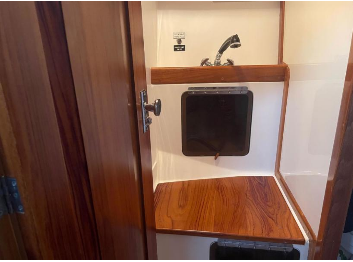
Voyager Shower 3