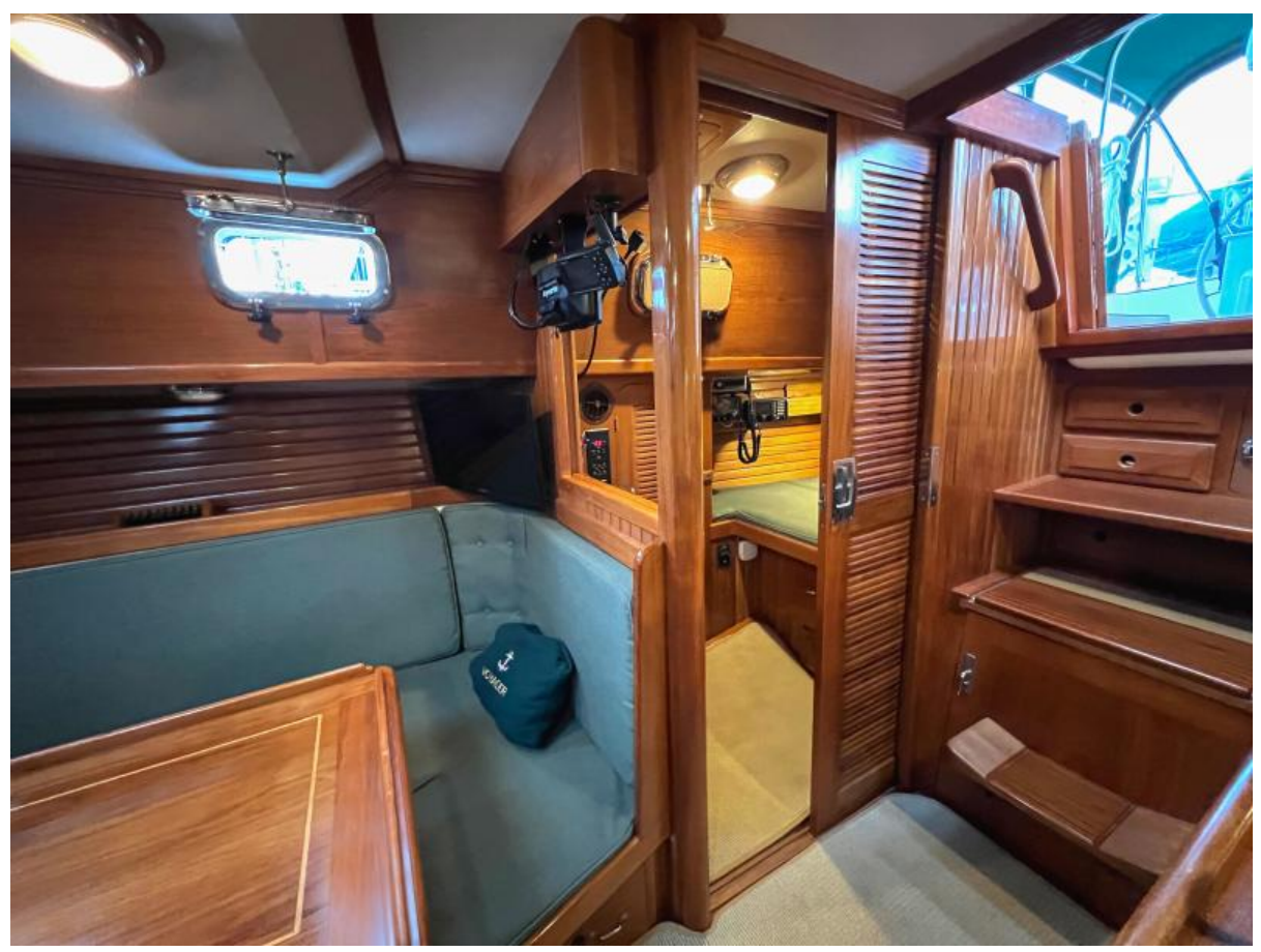
Voyager Looking Into Navigation Station And Quarter Berth