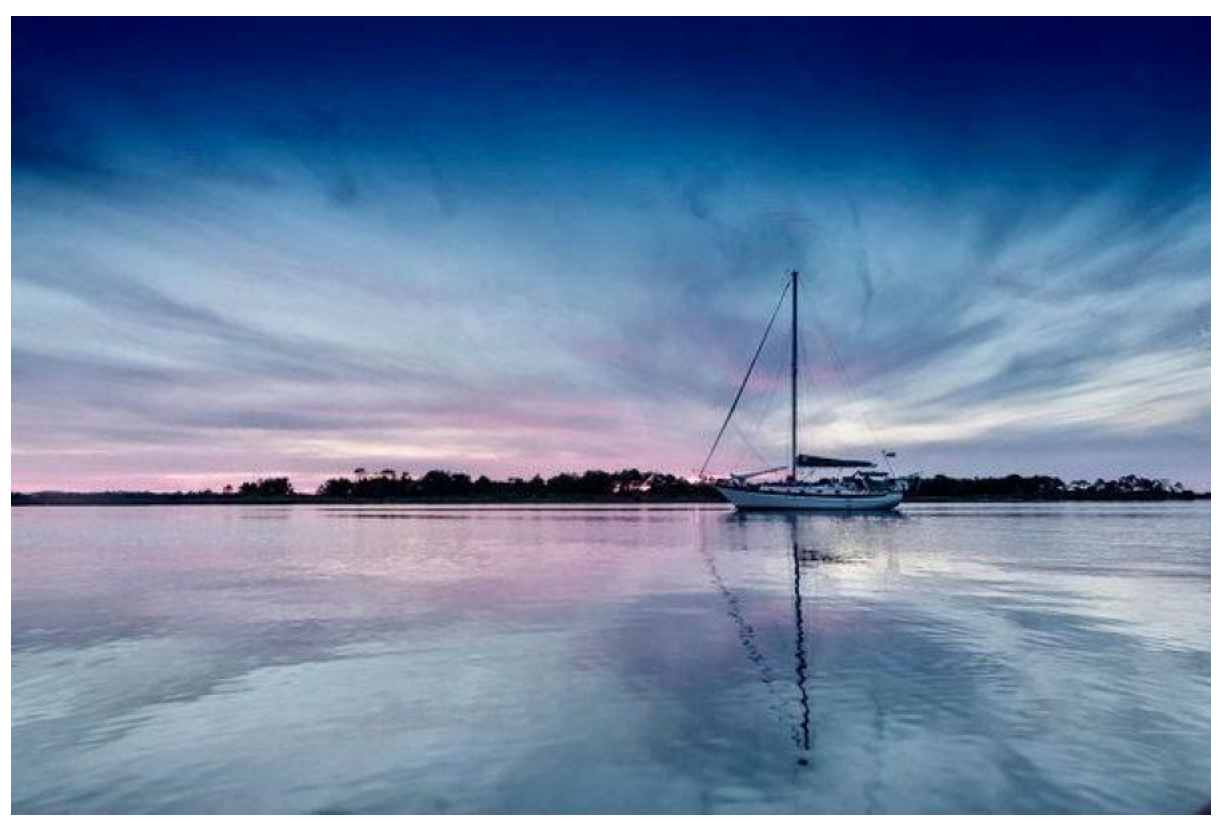
Voyager At Sunset