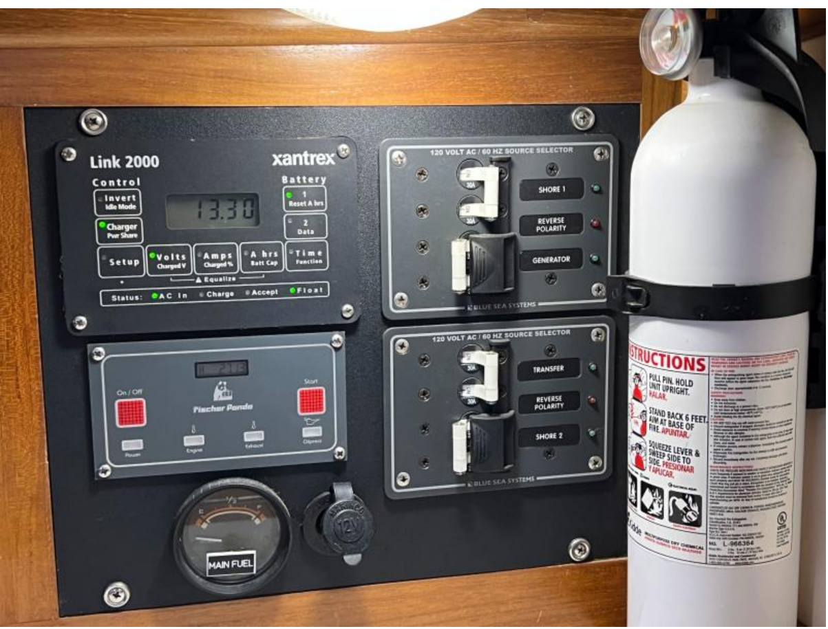
Voyager Xantrex Freedom 25 Inverter Charger