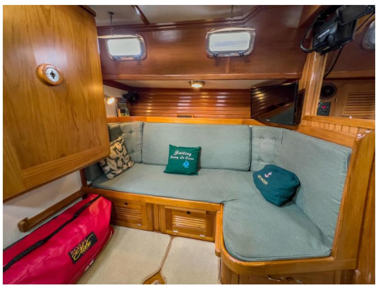
Voyager Starboard Settee