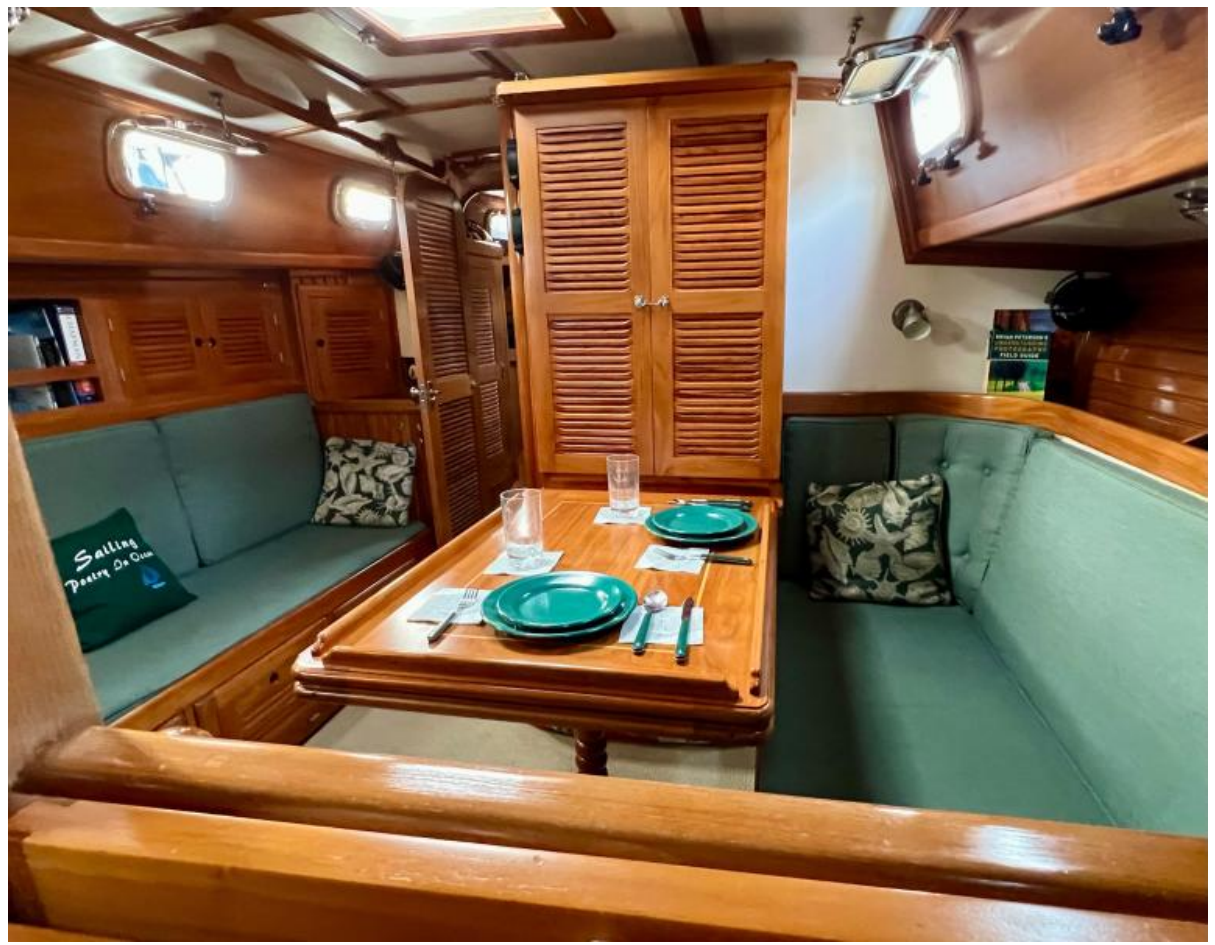
Voyager Table Setting