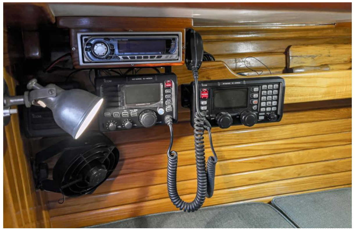
Voyager Xm_sirius Radio Cd Am Fm _vhf_single Side Band