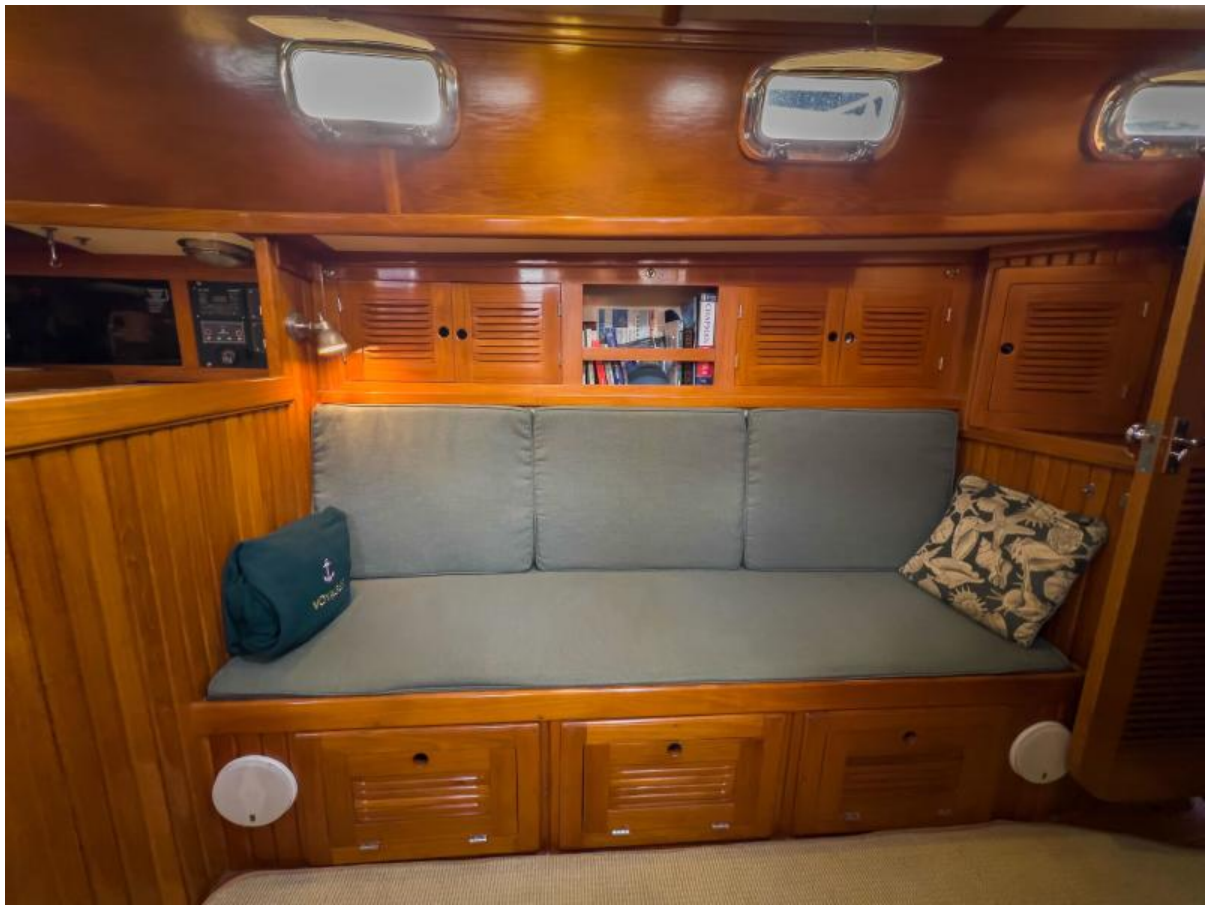
Voyager Port Settee