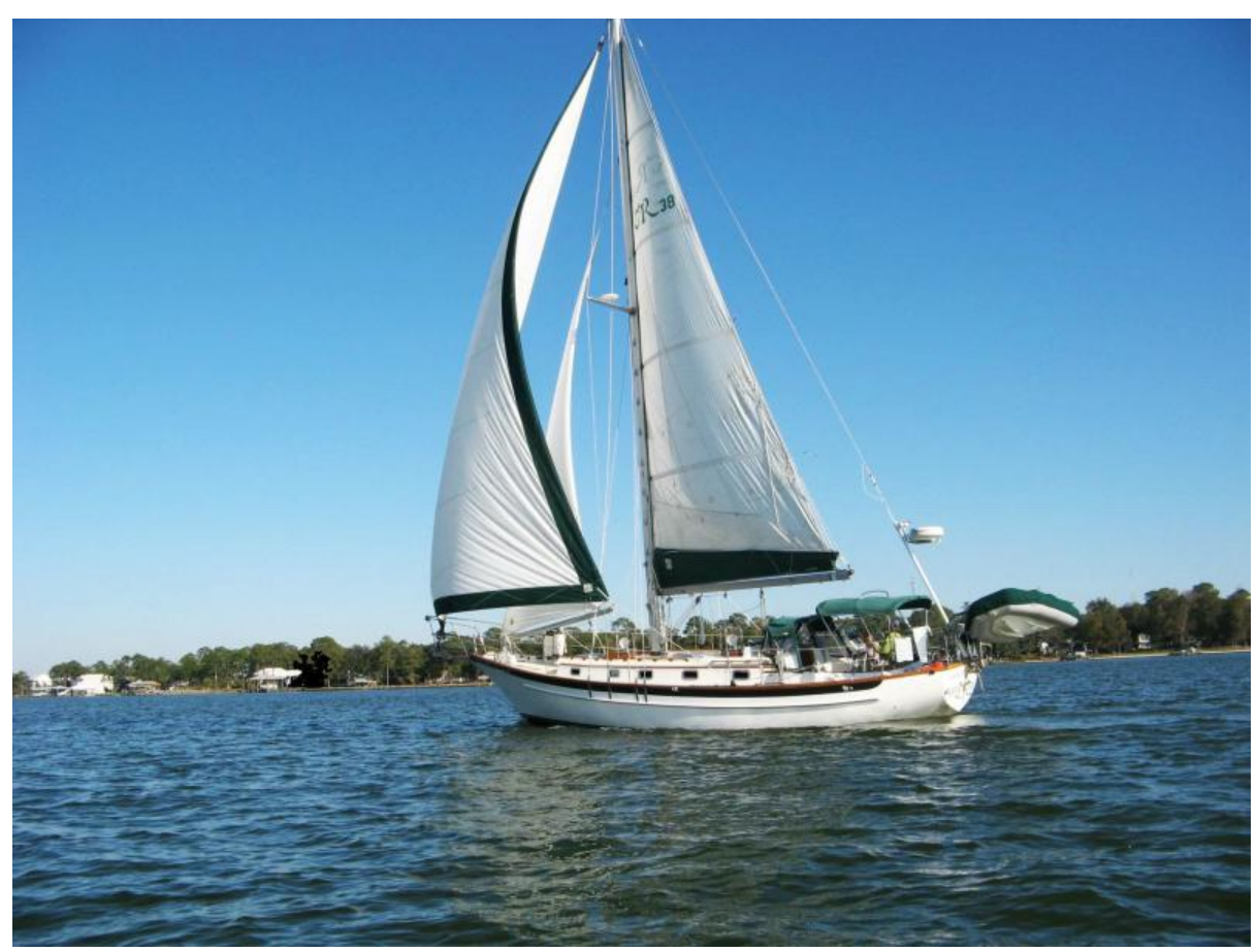
Cabo 38 Voyager Sailing