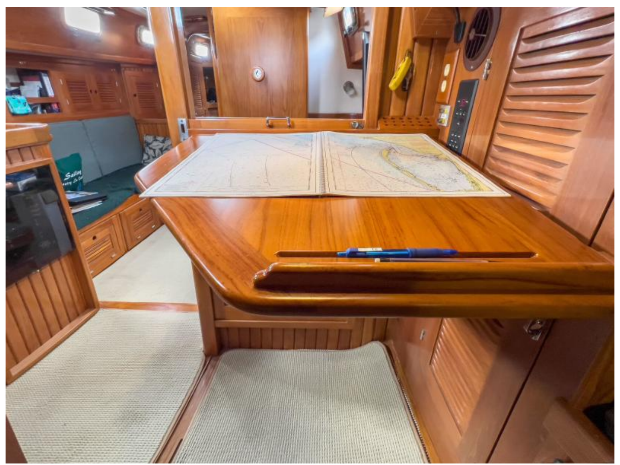
Voyager Navigation Station