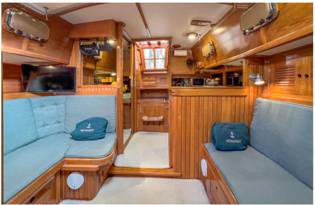
Voyager Salon With Custom Hatch Doors Closed 5