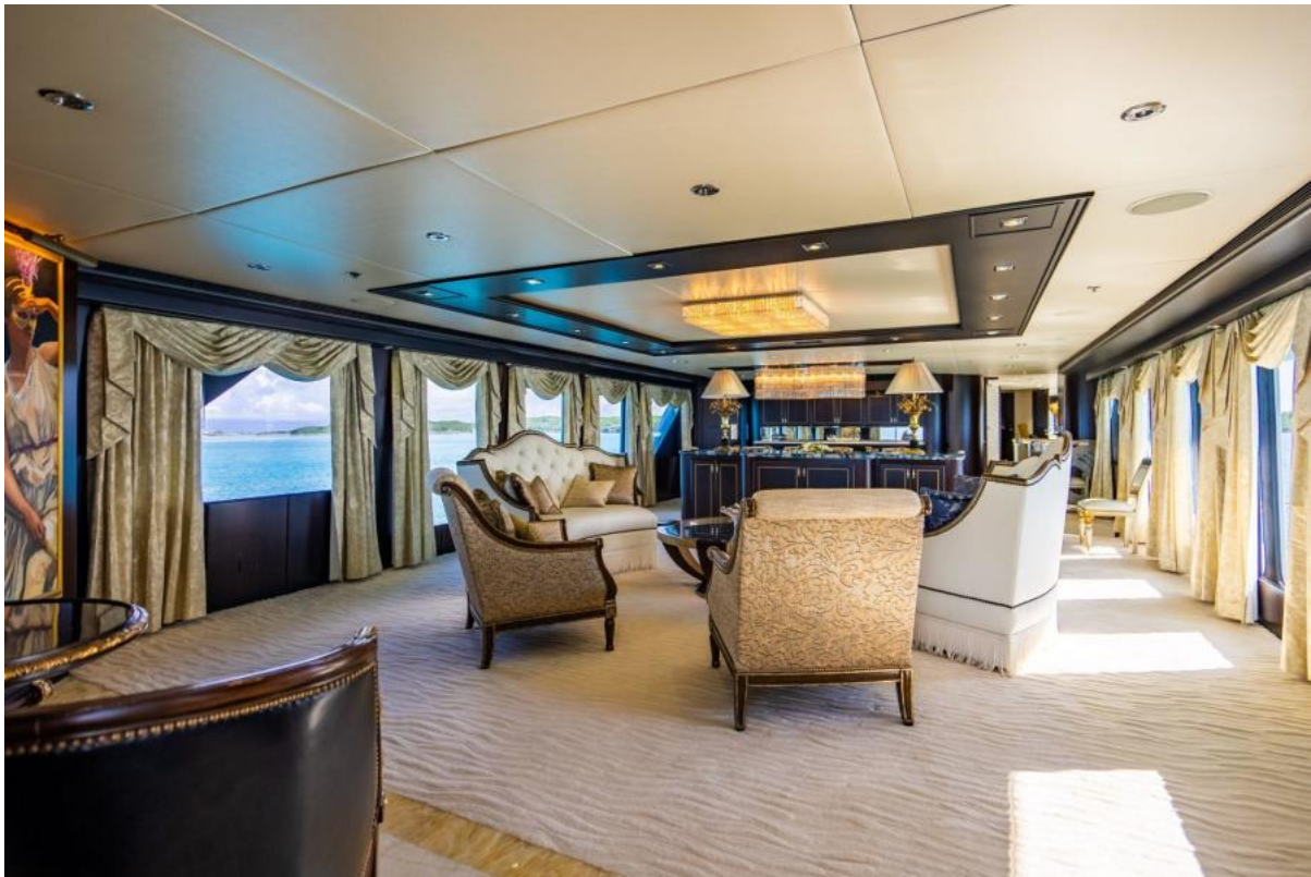
MAIN SALON (28)