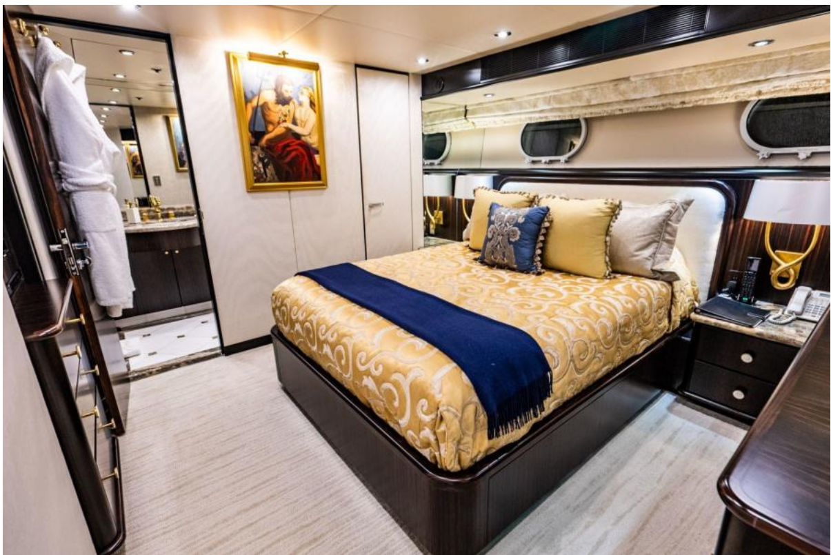
PORT AFT GUEST STATEROOM