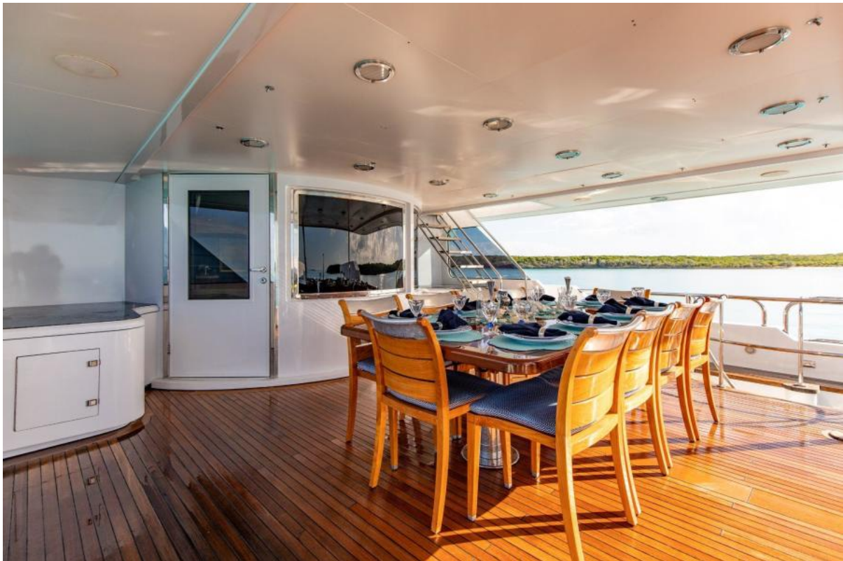
BRIDGE DECK AFT DINING