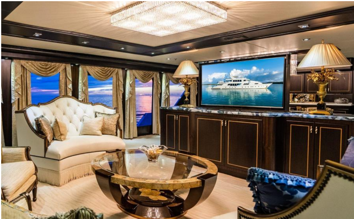
MAIN SALON TV UP