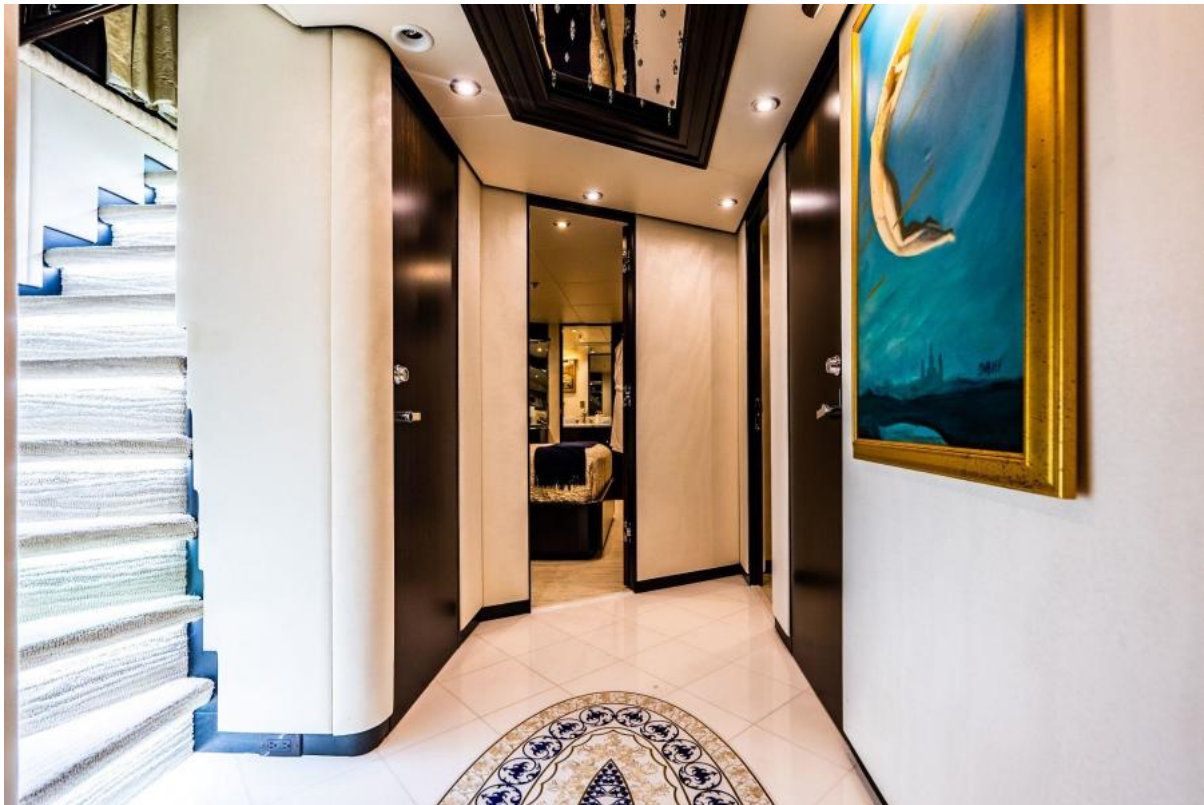
LOWER GUEST FOYER