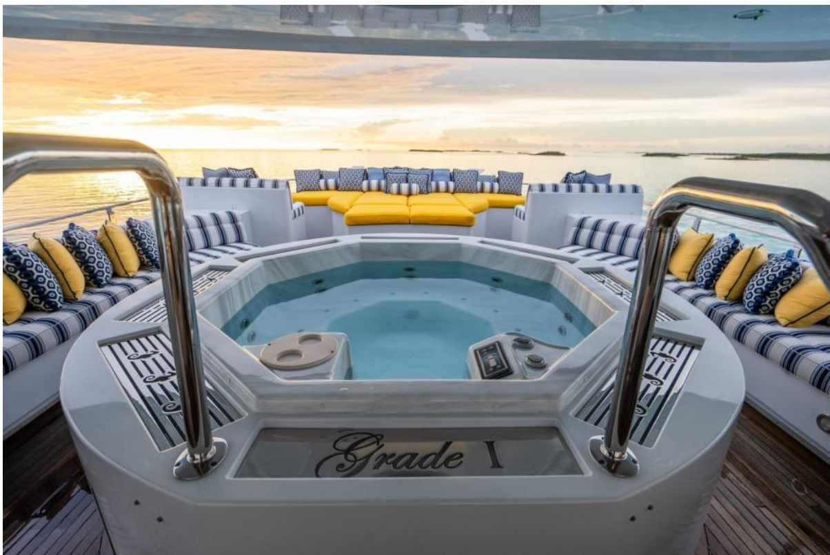
SUNDECK HOT TUB