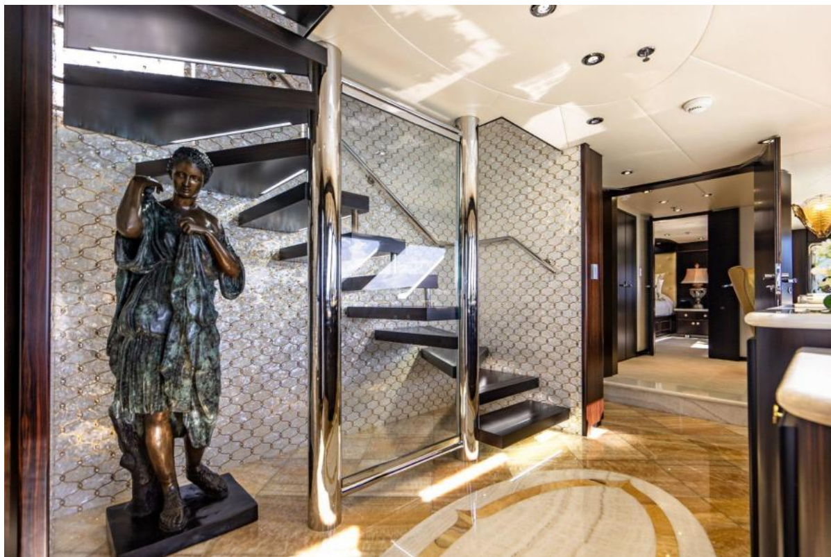
MAIN GUEST FOYER