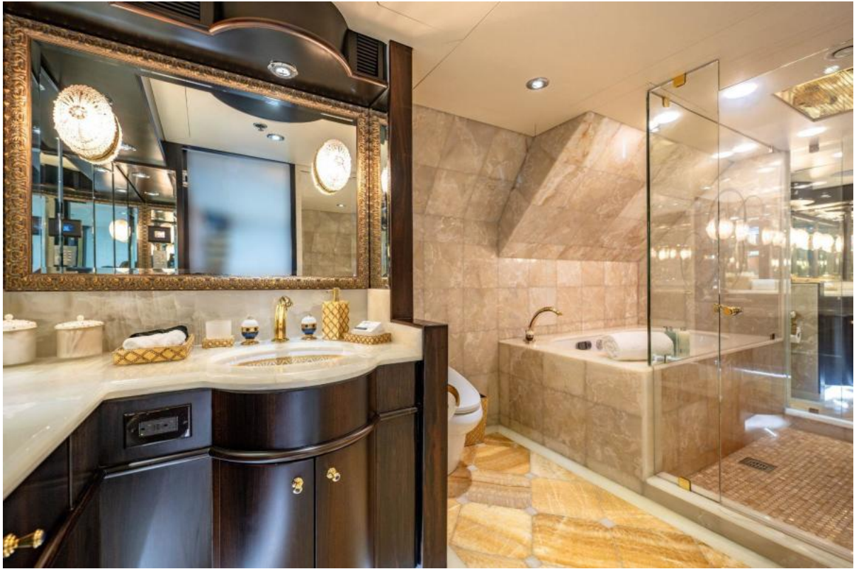
MASTER ENSUITE PORT