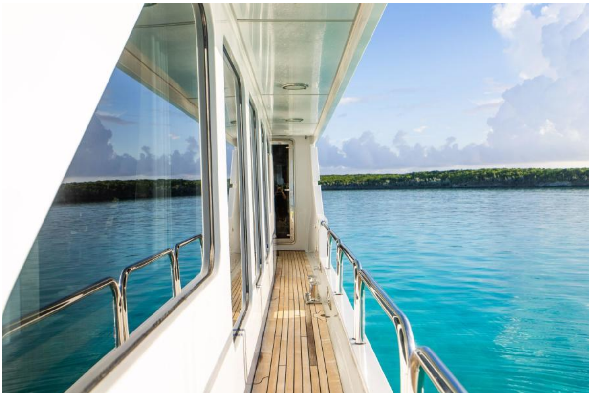
STBD SIDE DECK