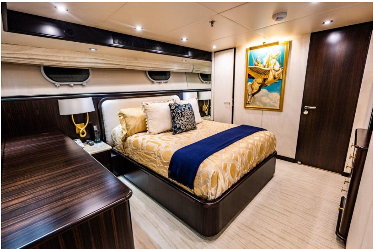
PORT FWD GUEST STATEROOM