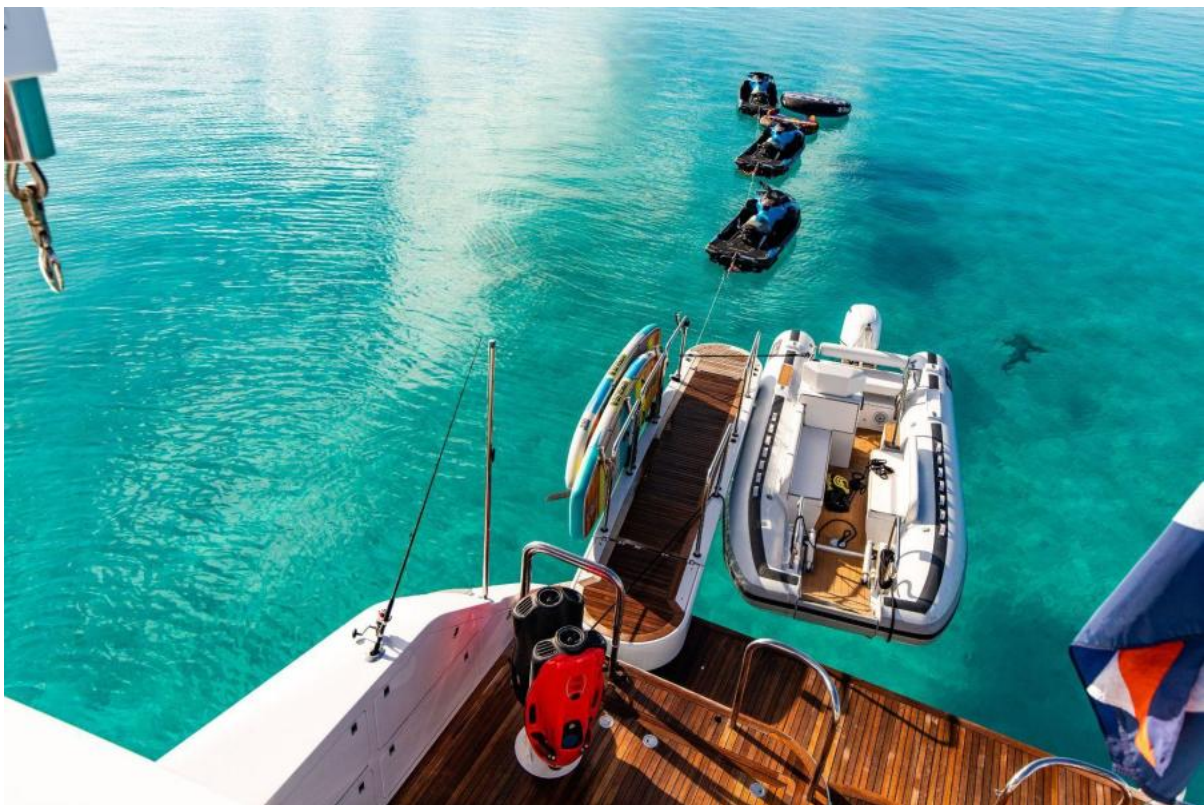
SWIM PLATFORM / TOYS