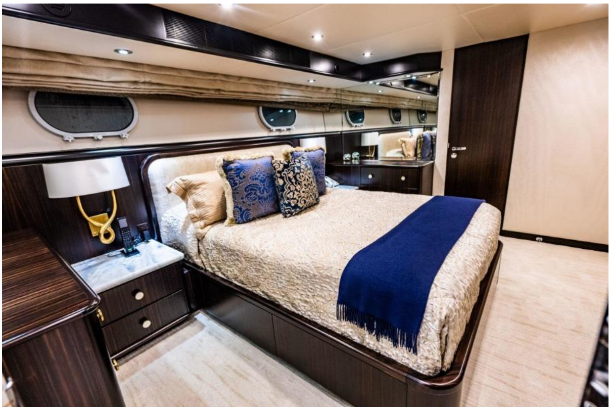
STBD AFT GUEST STATEROOM