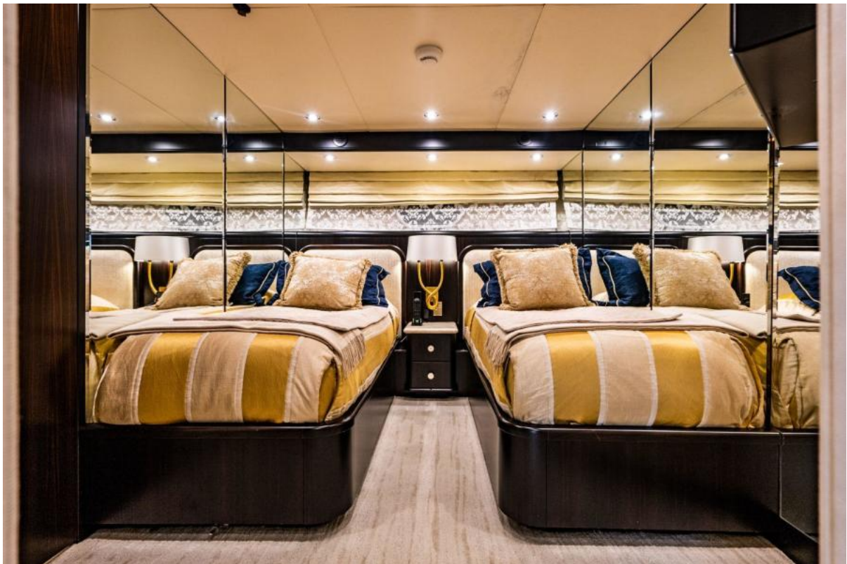
PORT MID TWIN STATEROOM