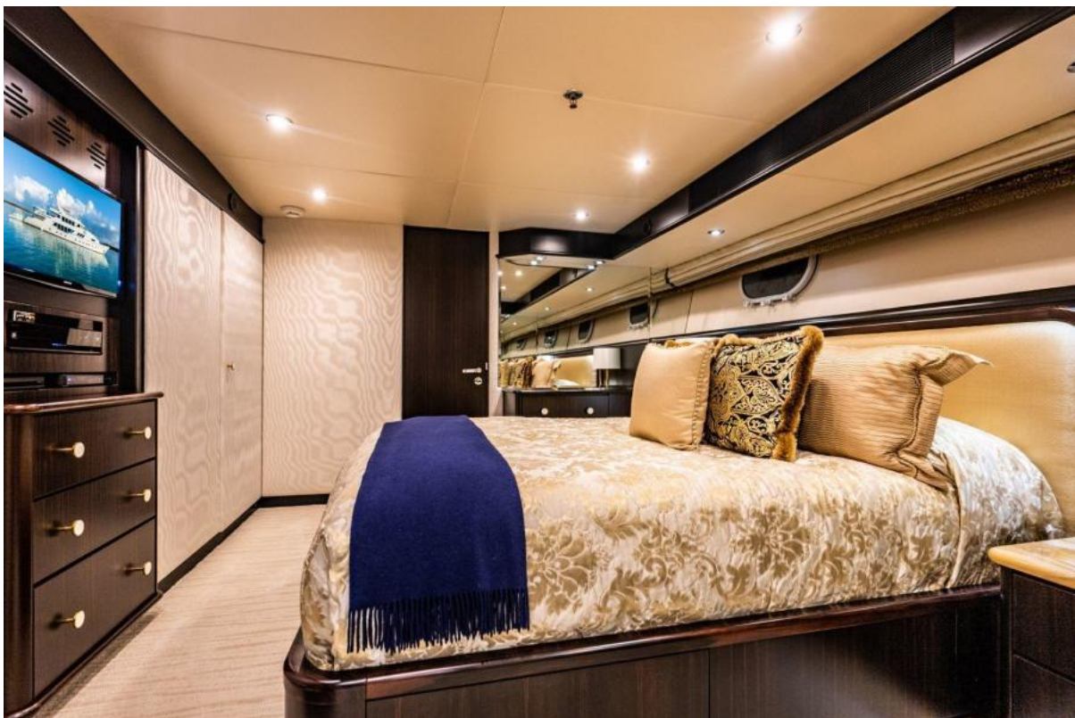
STBD FWD GUEST STATEROOM