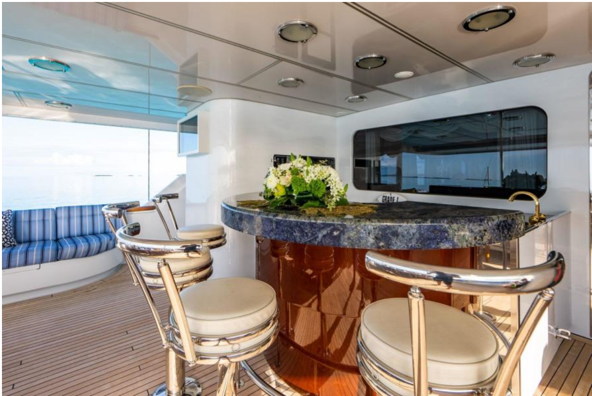
AFT DECK (18)