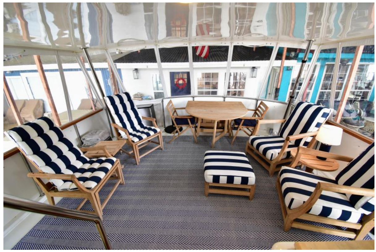
1997 Hatteras 50 Sport Deck SIROCCO