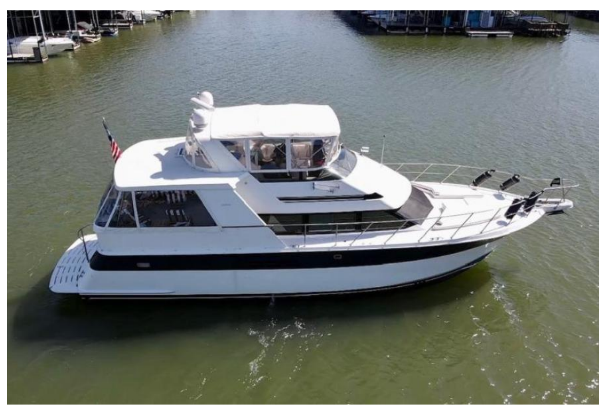
1997 Hatteras 50 Sport Deck SIROCCO