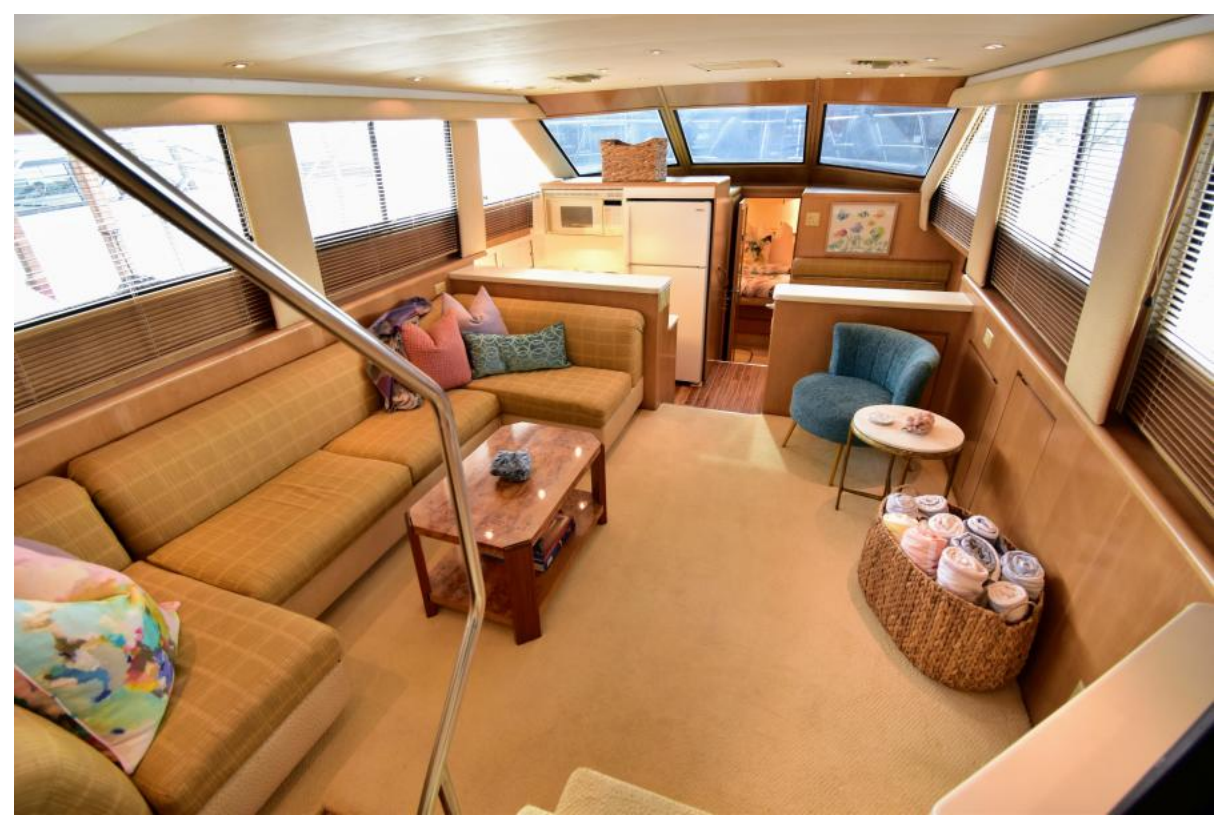
1997 Hatteras 50 Sport Deck SIROCCO