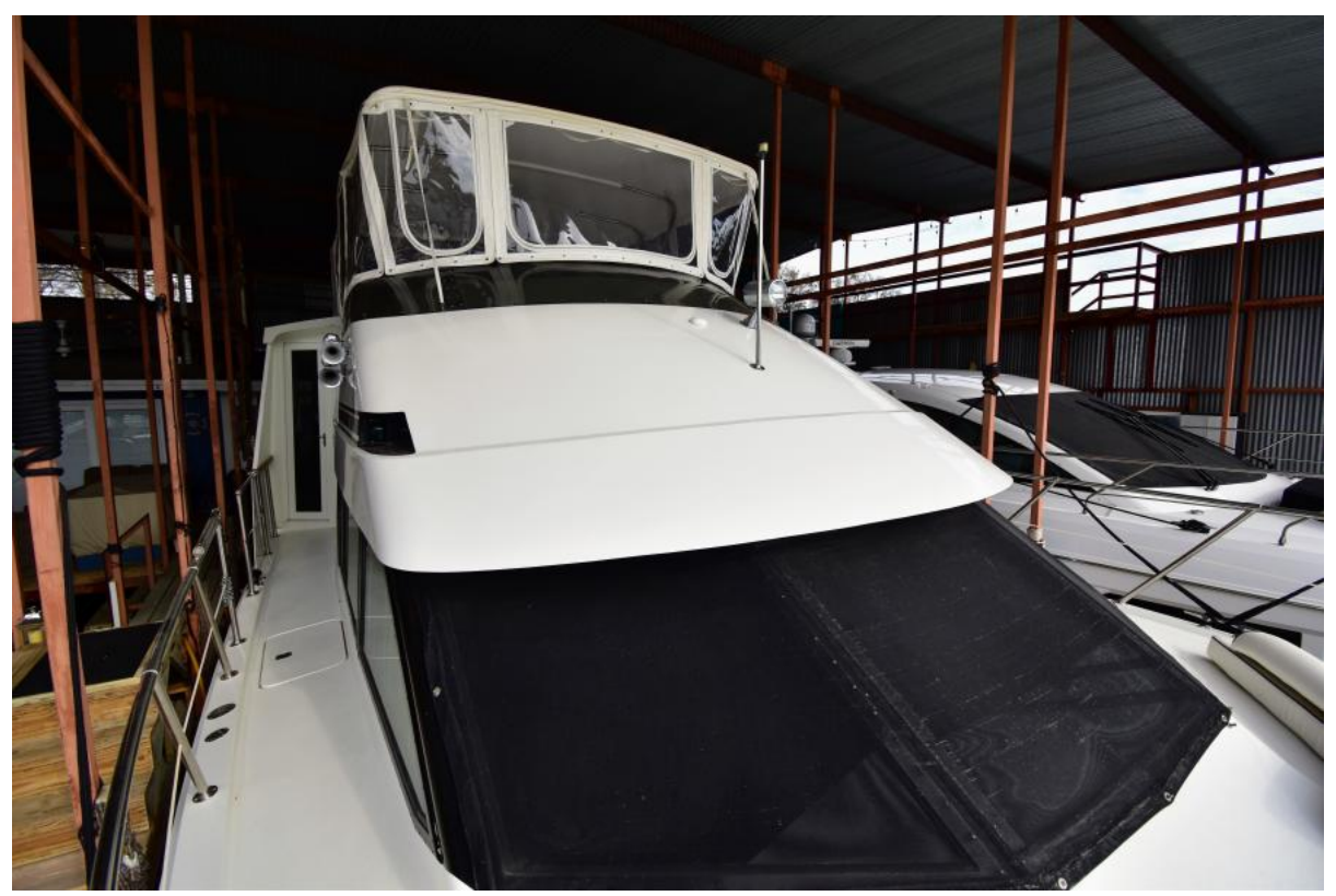
1997 Hatteras 50 Sport Deck SIROCCO