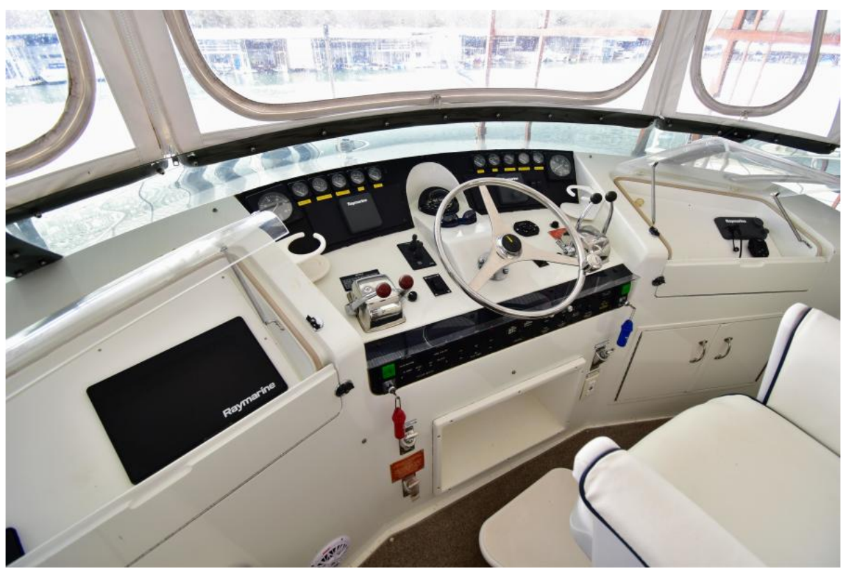
1997 Hatteras 50 Sport Deck SIROCCO