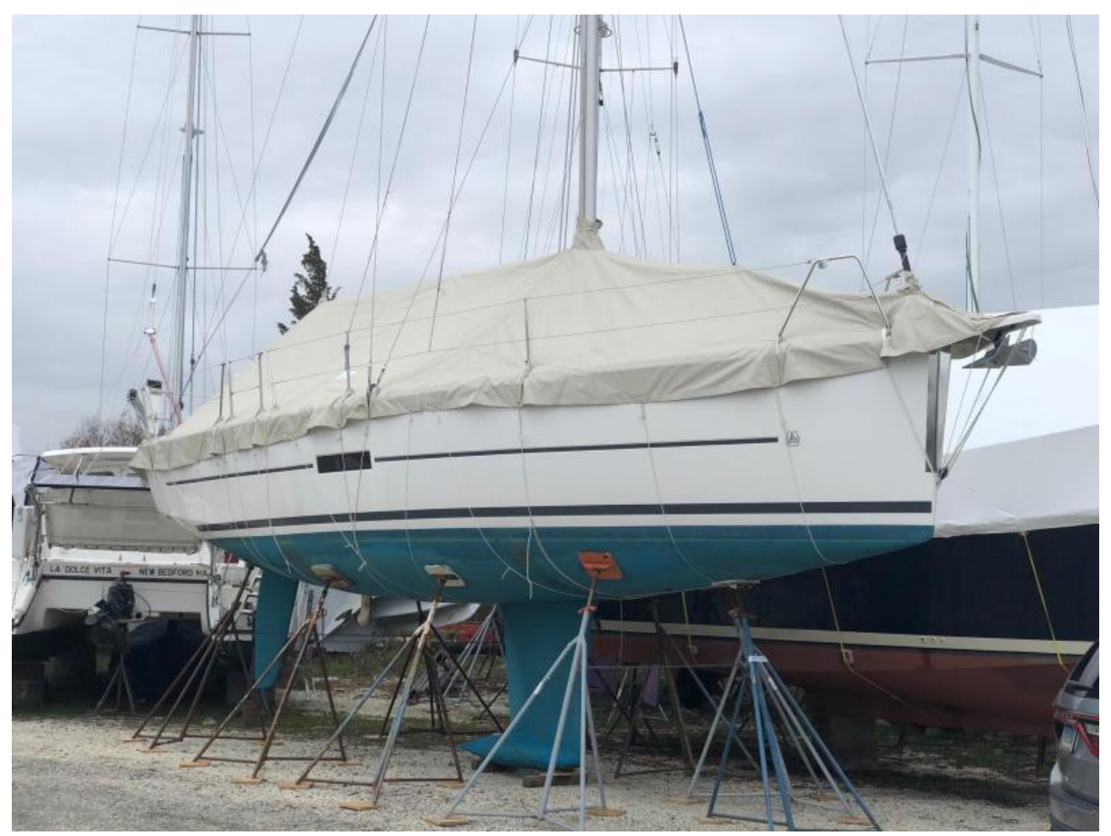
Winter Cover 2017 Dufour 350 GL Custom winter cover, offered for sale by central agent Northstar Yacht Sales