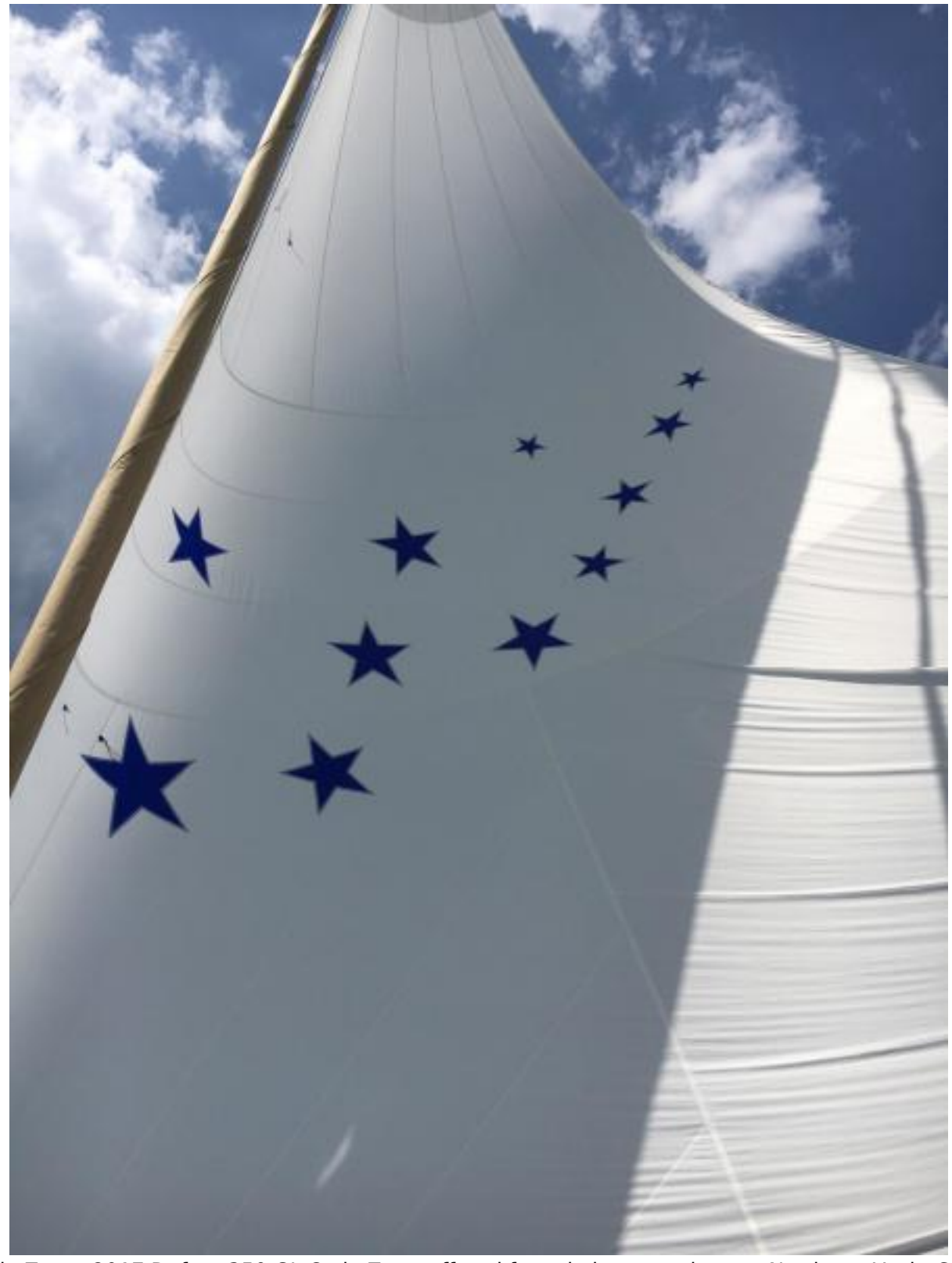
Code Zero 2017 Dufour 350 GL Code Zero, offered for sale by central agent Northstar Yacht Sales