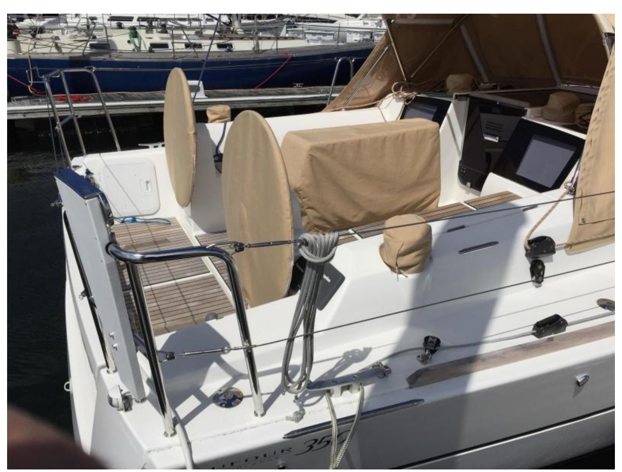
Cockpit Canvas 2017 Dufour 350 GL Cockpit Canvas, offered for sale by central agent Northstar Yacht Sales