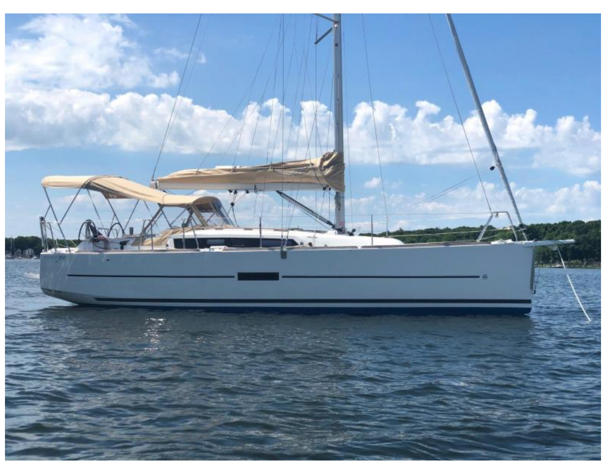
Profile 2017 Dufour 350 GL profile on the hook, offered for sale by central agent Northstar Yacht Sales