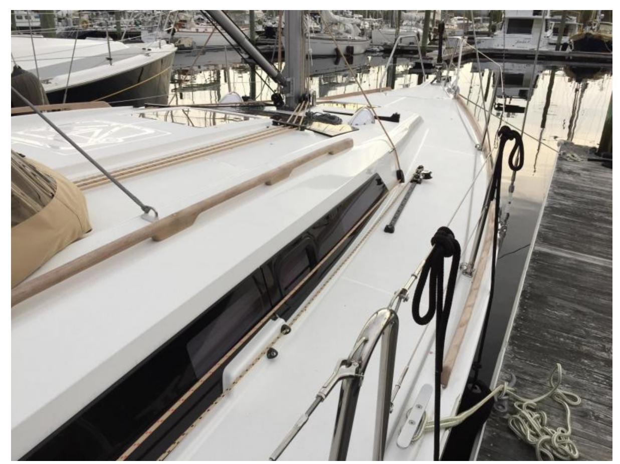
Side Deck 2017 Dufour 350 GL Side Deck, offered for sale by central agent Northstar Yacht Sales