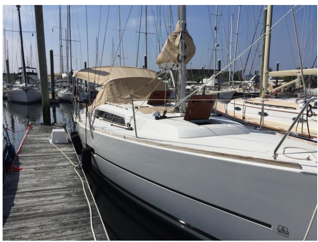
Canvas 2017 Dufour 350 GL Dodger and Bimini, offered for sale by central agent Northstar Yacht Sales