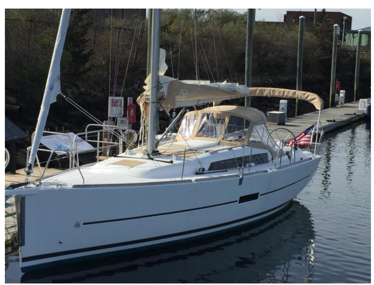
Along Side 2017 Dufour 350 GL alongside the dock, offered for sale by central agent Northstar Yacht Sales