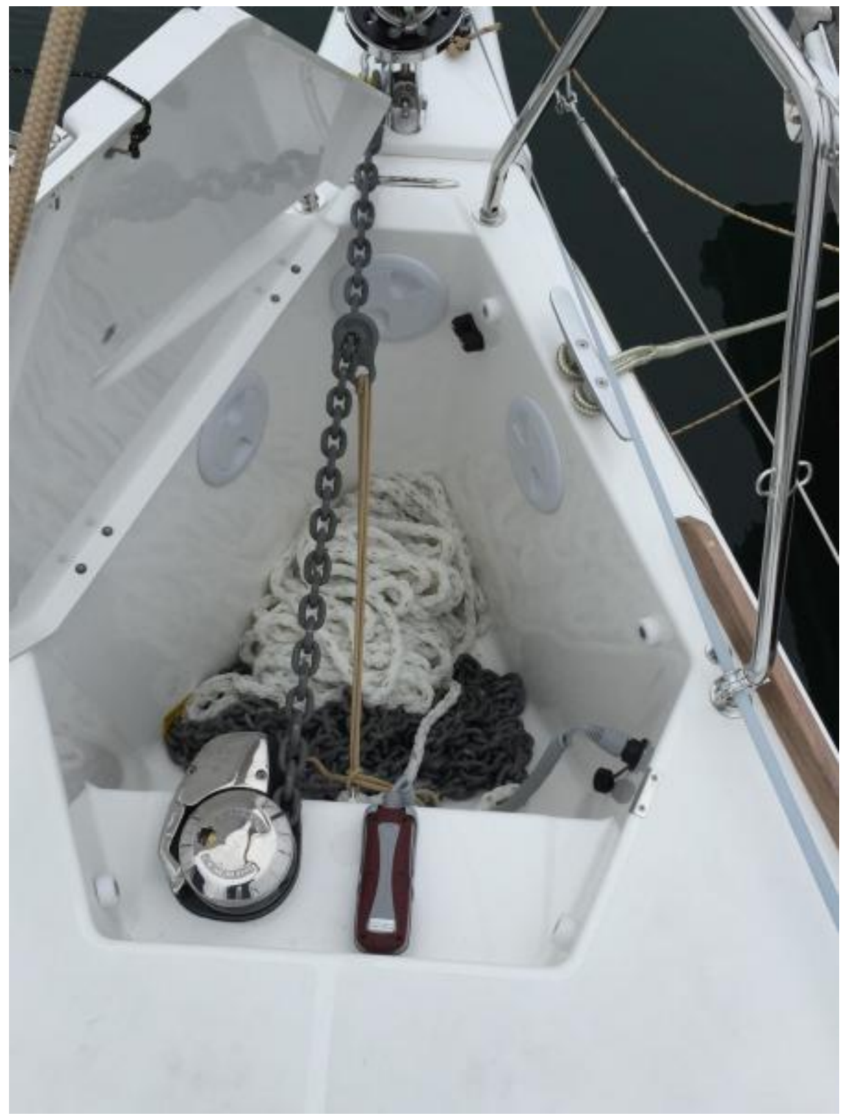
Anchor Locker 2017 Dufour 350 GL Anchor Locker, offered for sale by central agent Northstar Yacht Sales