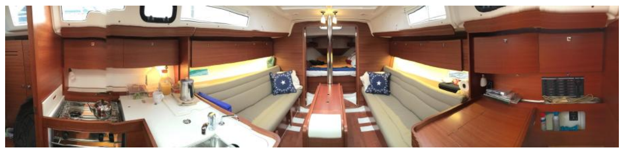
Salon 2017 Dufour 350 GL Salon, offered for sale by central agent Northstar Yacht Sales