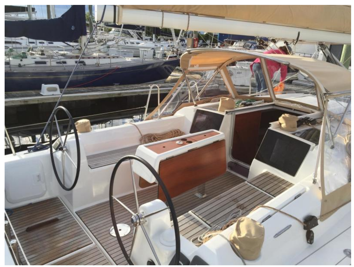
Cockpit Table 2017 Dufour 350 GL Cockpit Table, offered for sale by central agent Northstar Yacht Sales