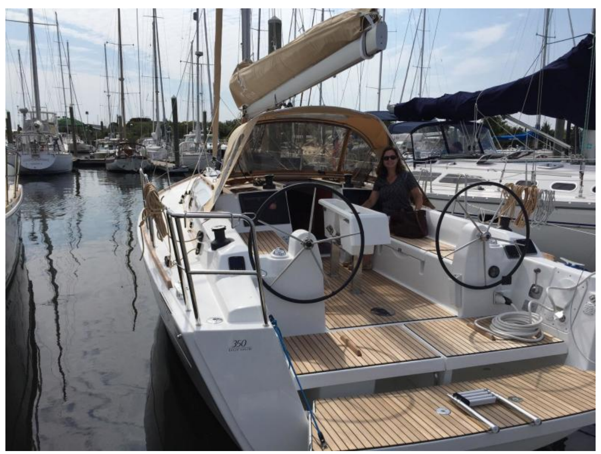
Twin Helm 2017 Dufour 350 GL Cockpit, offered for sale by central agent Northstar Yacht Sales