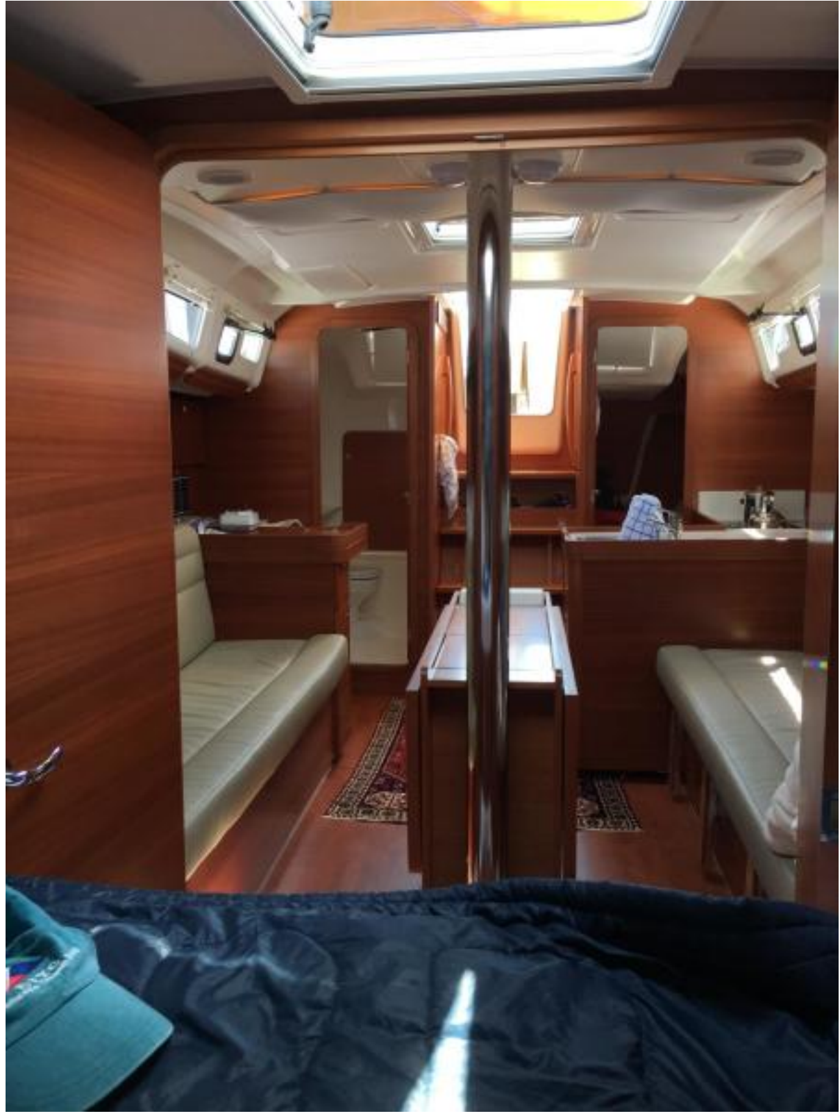
Salon Aft 2017 Dufour 350 Salon looking Aft, offered for sale by central agent Northstar Yacht Sales