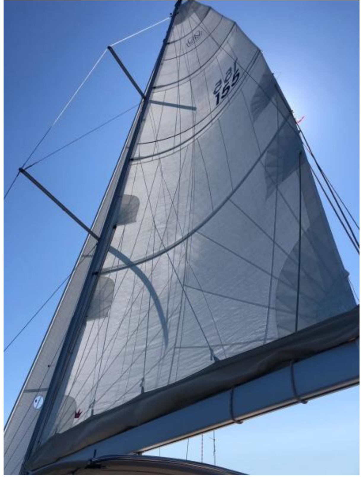
Main Sail 2017 Dufour 350 GL Main Sail, offered for sale by central agent Northstar Yacht Sales