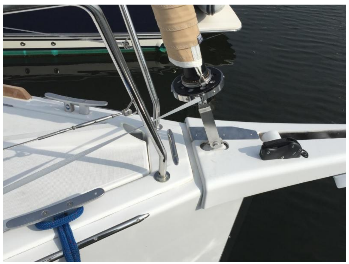
Jib Furler 2017 Dufour 350 GL Jib Furler, offered for sale by central agent Northstar Yacht Sales

2 Cabin Layout 2017 Dufour 350 two cabin layout, offered for sale by central agent Northstar Yacht Sales