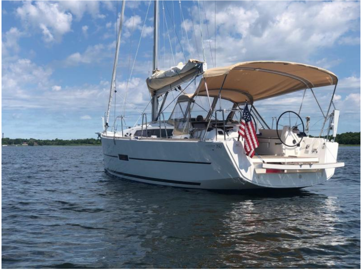
Port Qtr 2017 Dufour 350 GL Swim Platform, offered for sale by central agent Northstar Yacht Sales