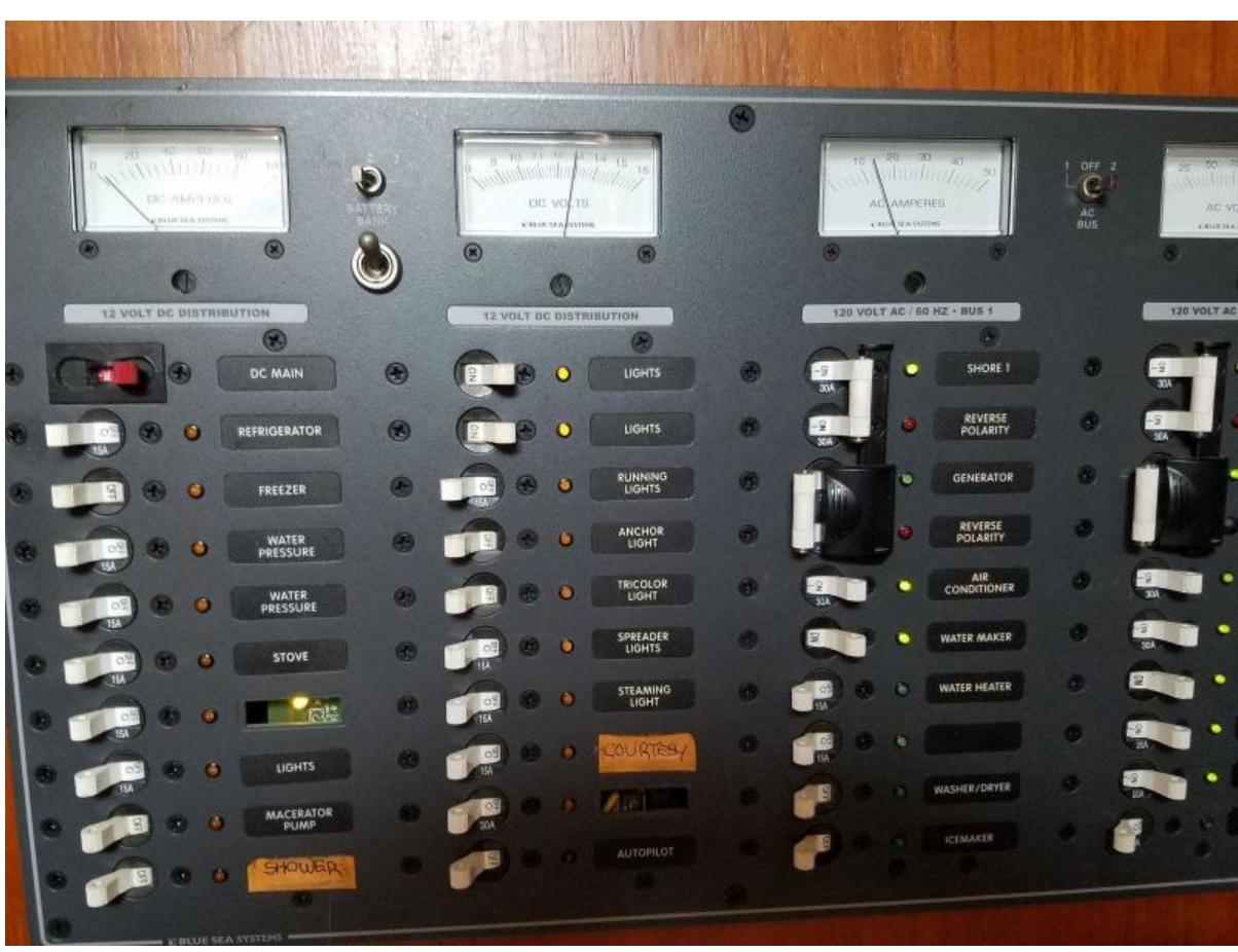
42 Endeavor 1985 (14)