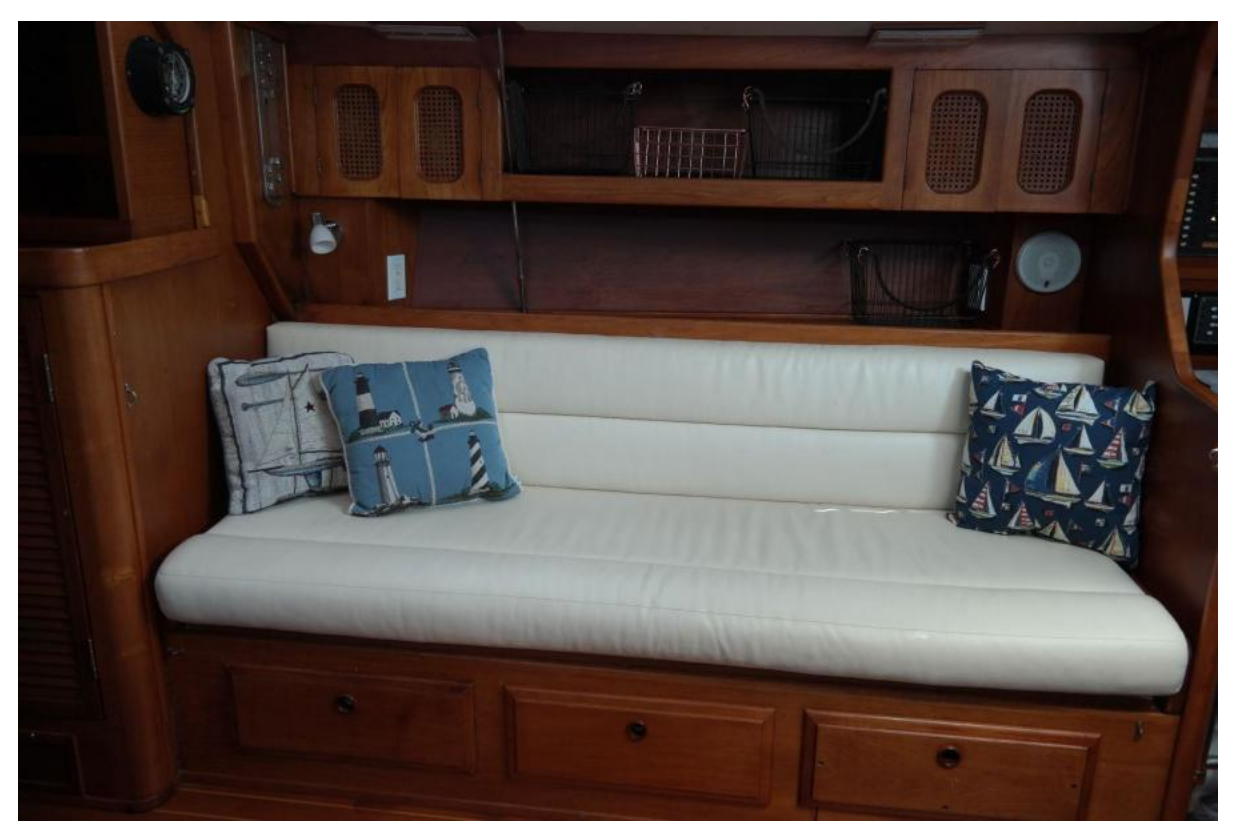
42 Endeavor 1985 (24)