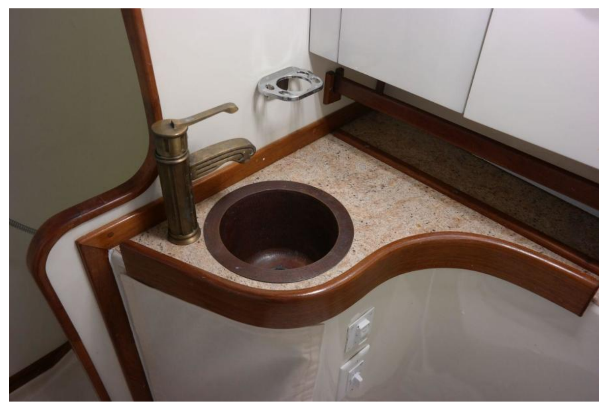
42 Endeavor 1985 (20)