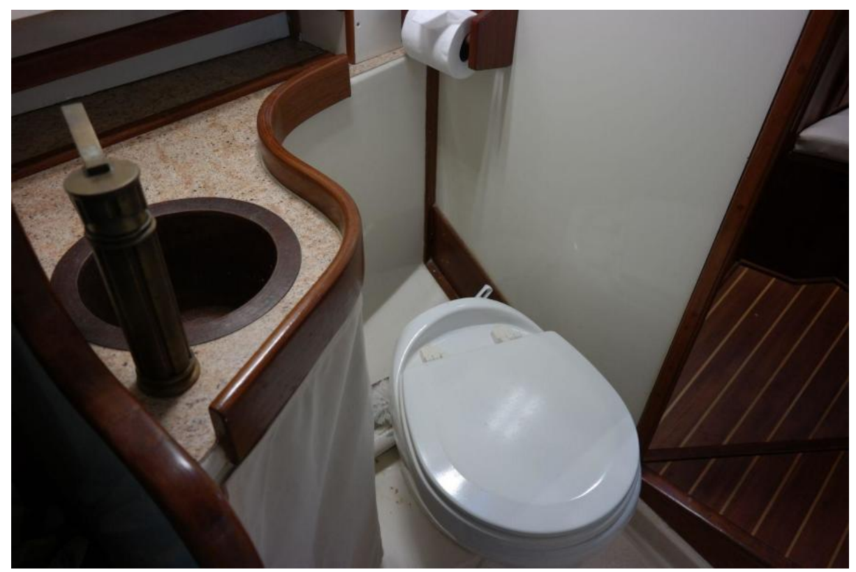
42 Endeavor 1985 (17)