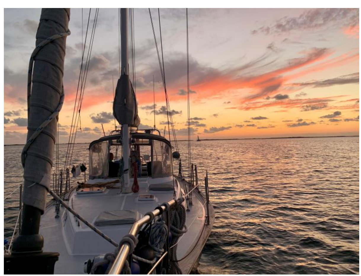
42 Endeavor 1985 (32)