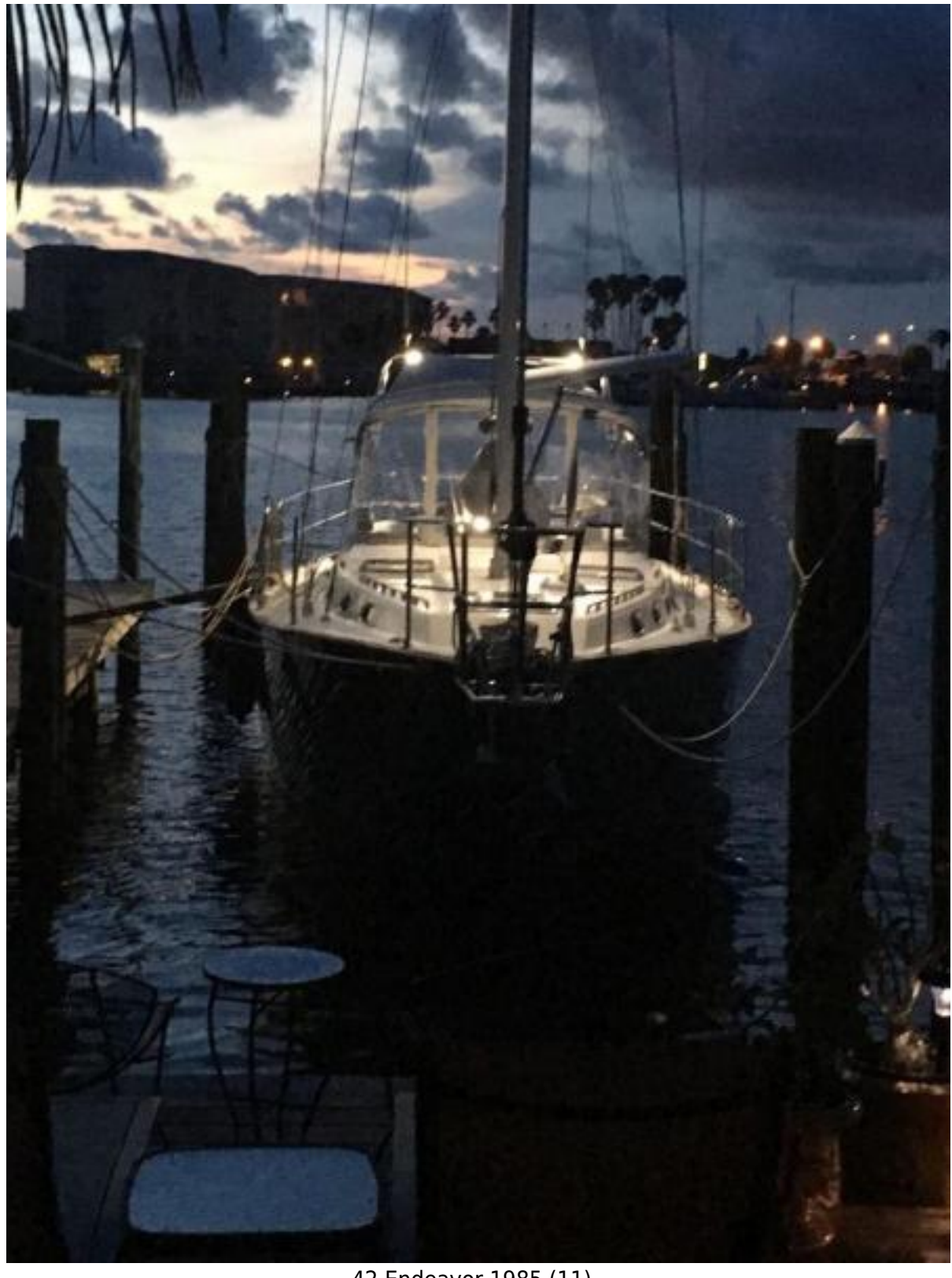
42 Endeavor 1985 (11)