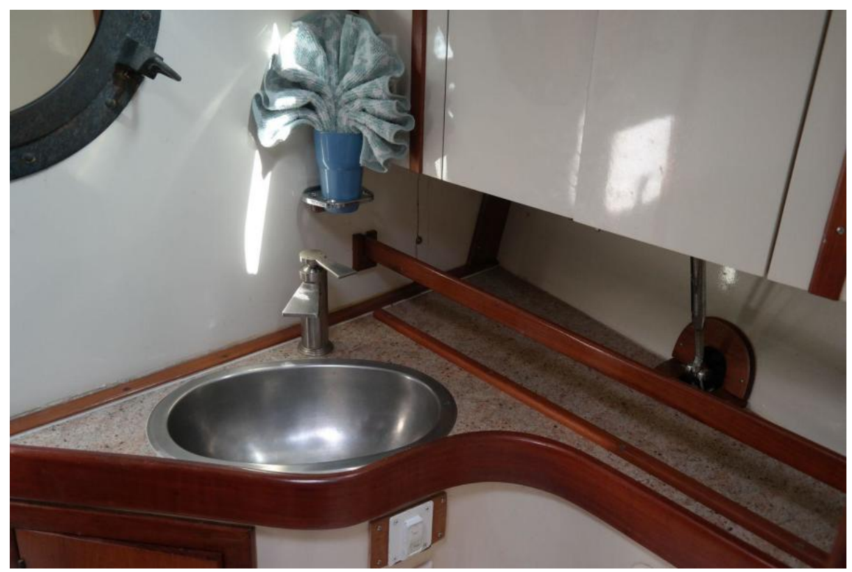
42 Endeavor 1985 (25)