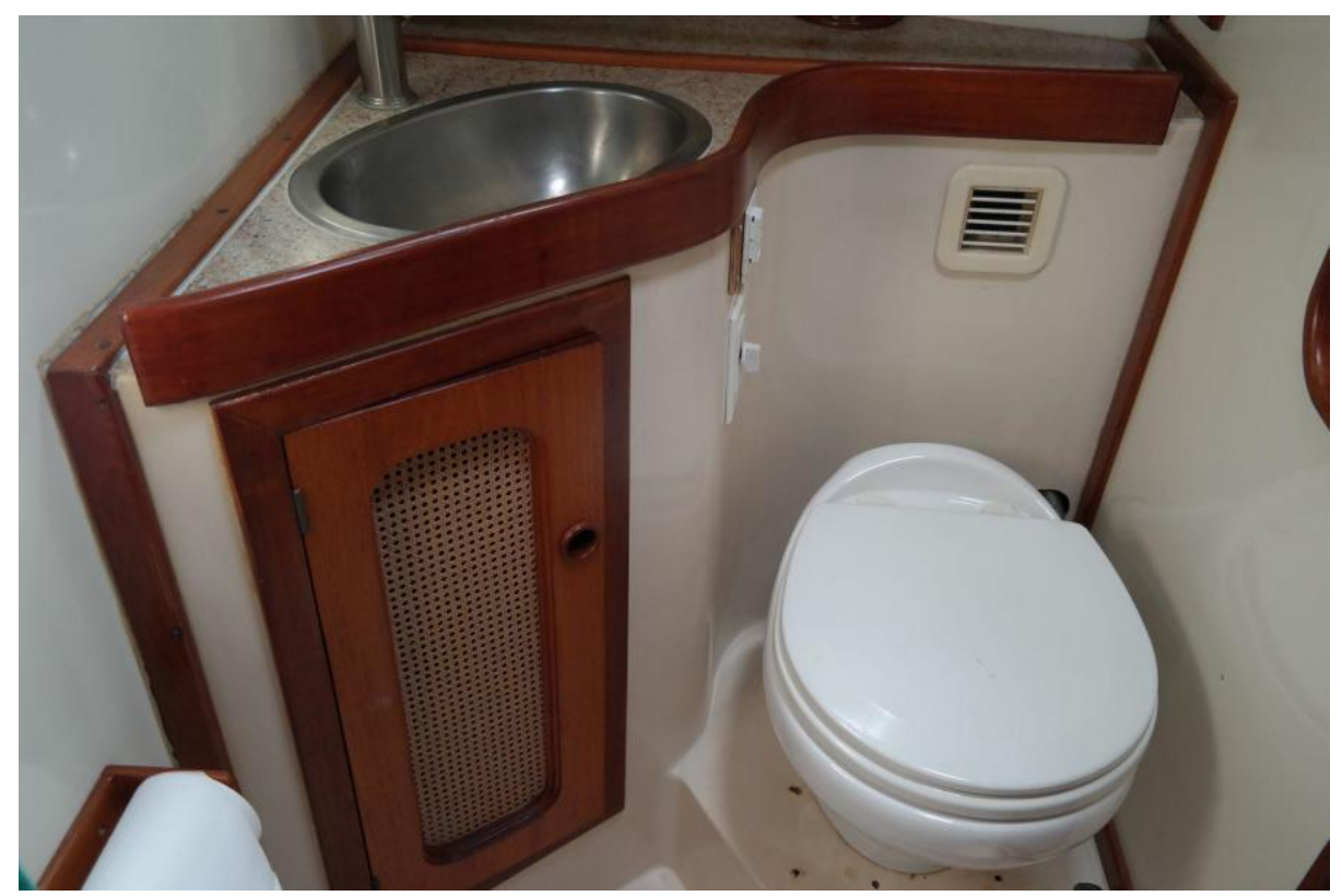
42 Endeavor 1985 (23)