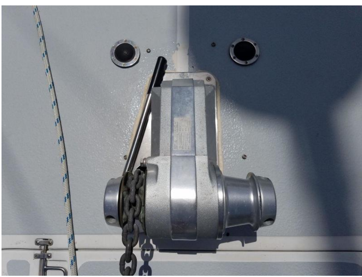
42 Endeavor 1985 (8)