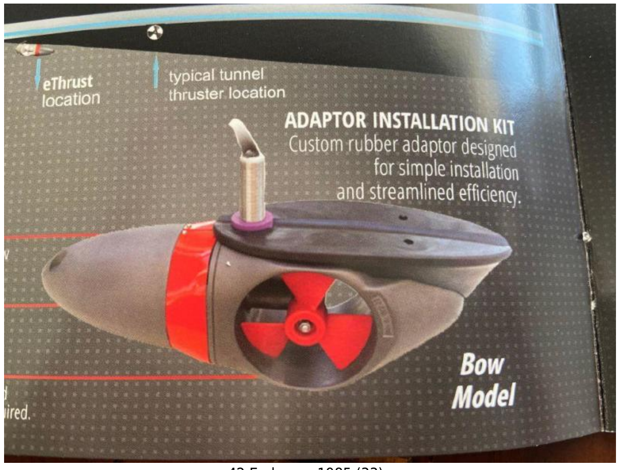
42 Endeavor 1985 (33)