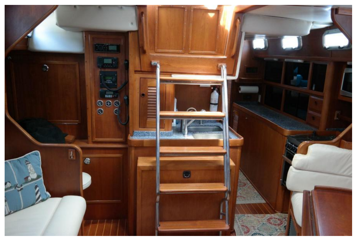
42 Endeavor 1985 (28)