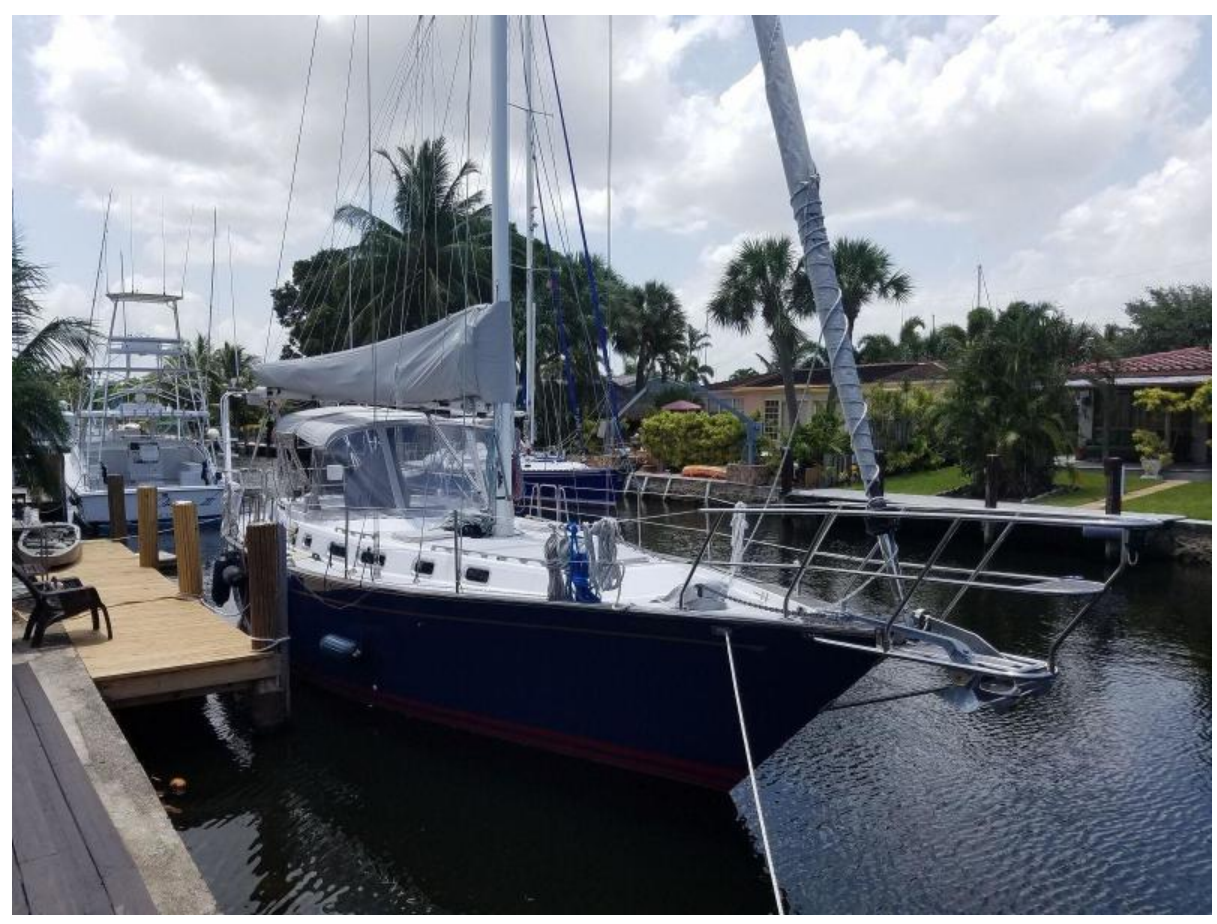
42 Endeavor 1985 (3)