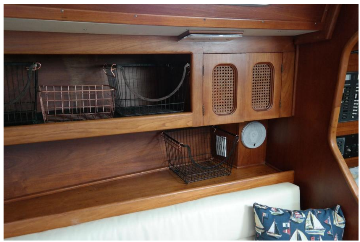
42 Endeavor 1985 (29)