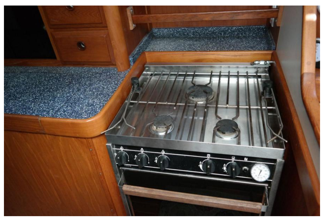
42 Endeavor 1985 (22)