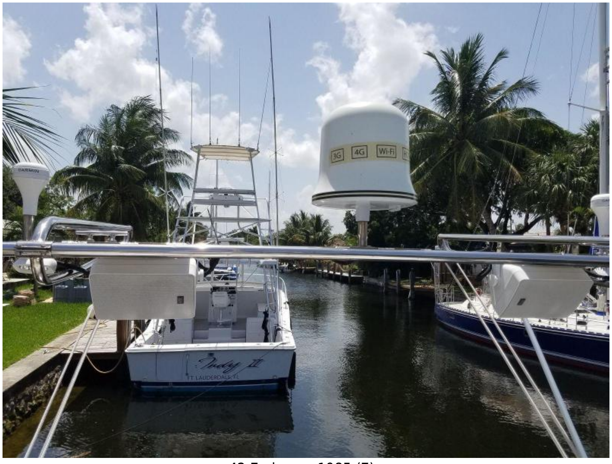
42 Endeavor 1985 (7)