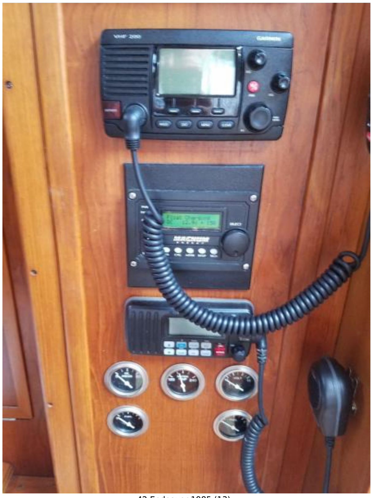
42 Endeavor 1985 (13)