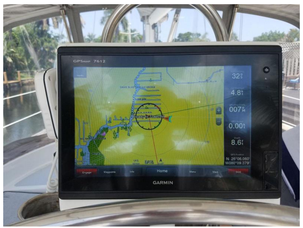
42 Endeavor 1985 (9)