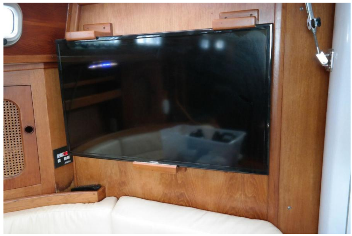
42 Endeavor 1985 (26)