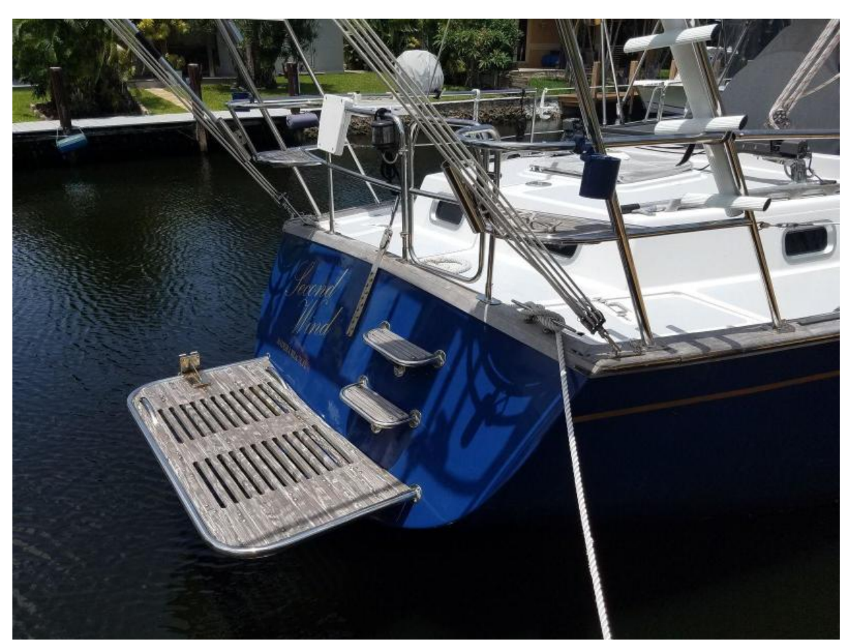
42 Endeavor 1985 (4)