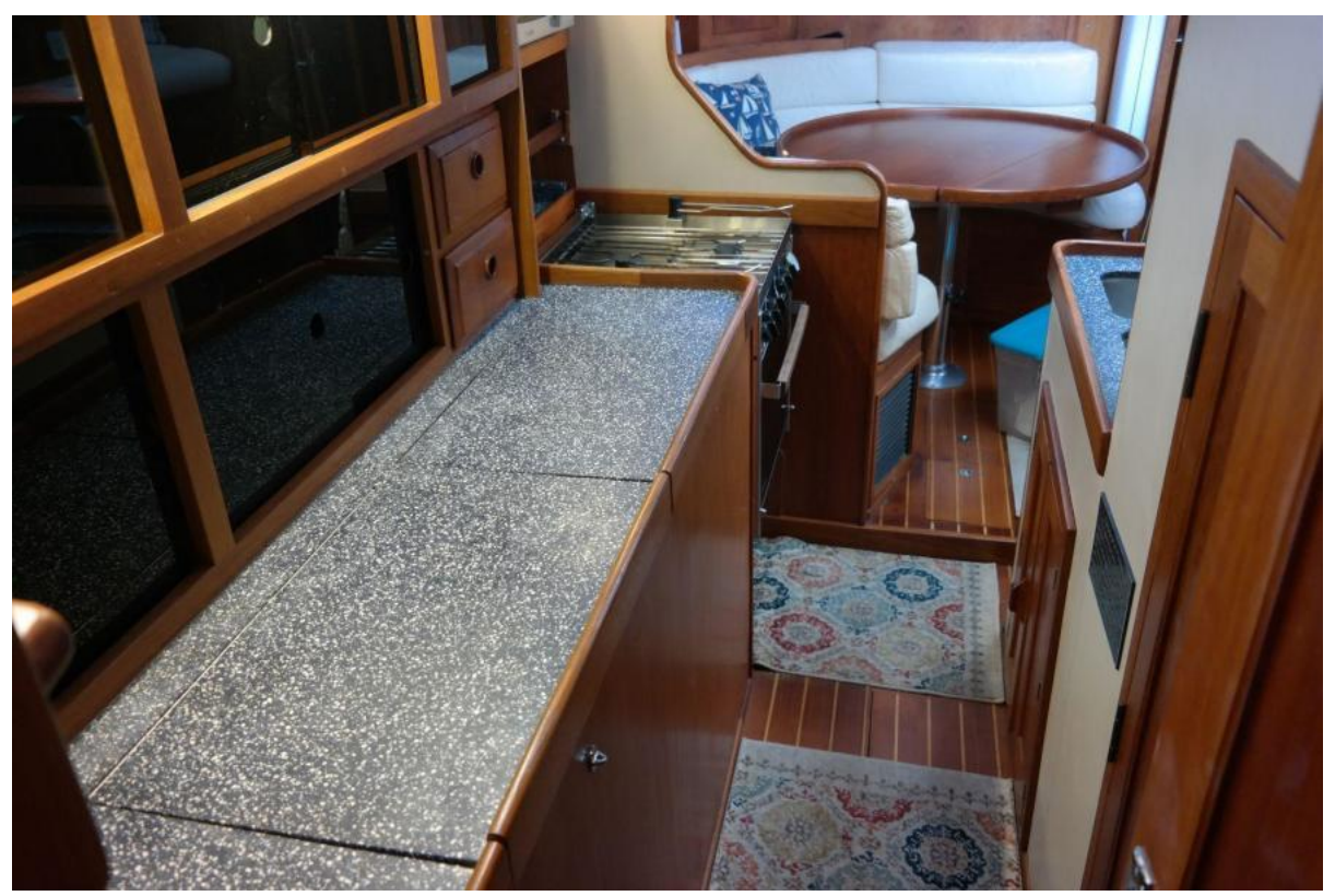
42 Endeavor 1985 (21)