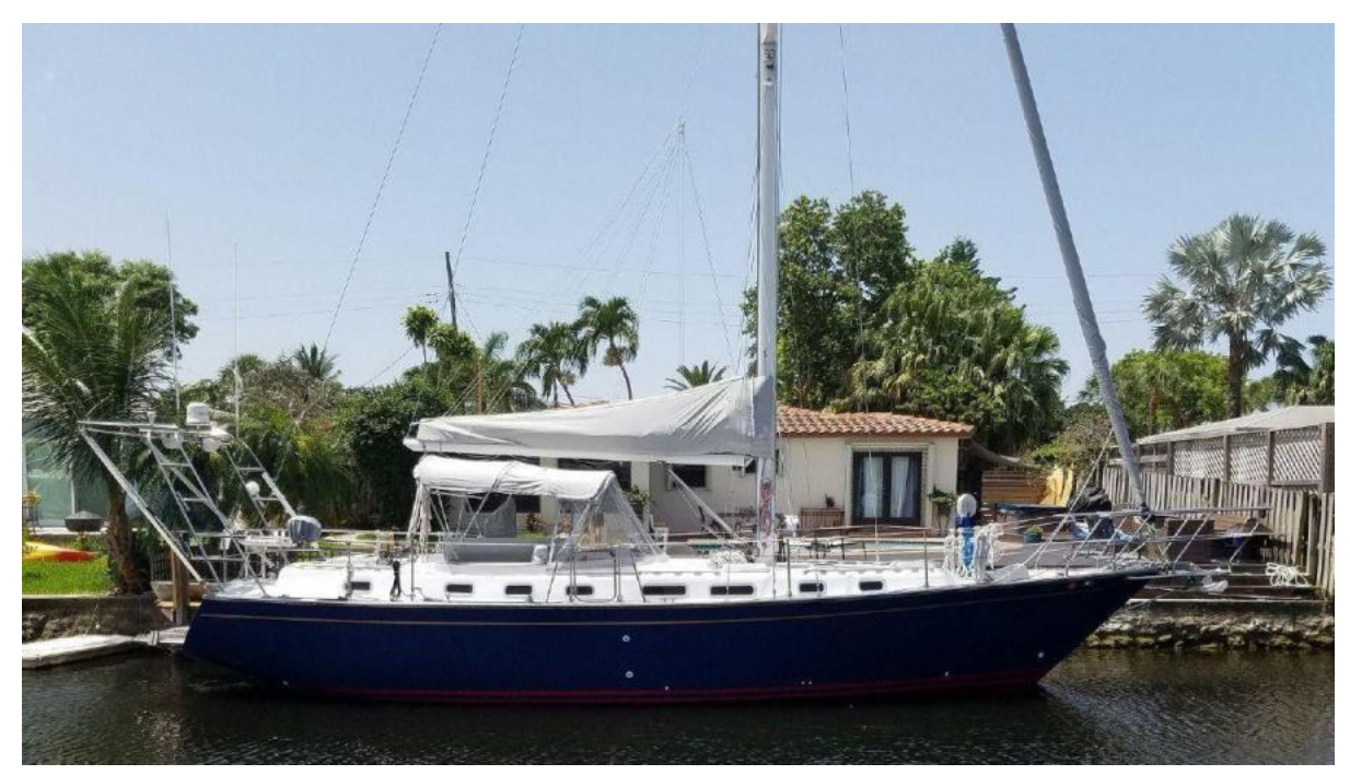
42 Endeavor 1985 (1)