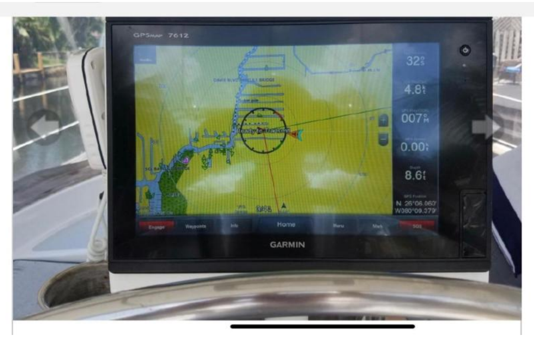
42 Endeavor 1985 (30)