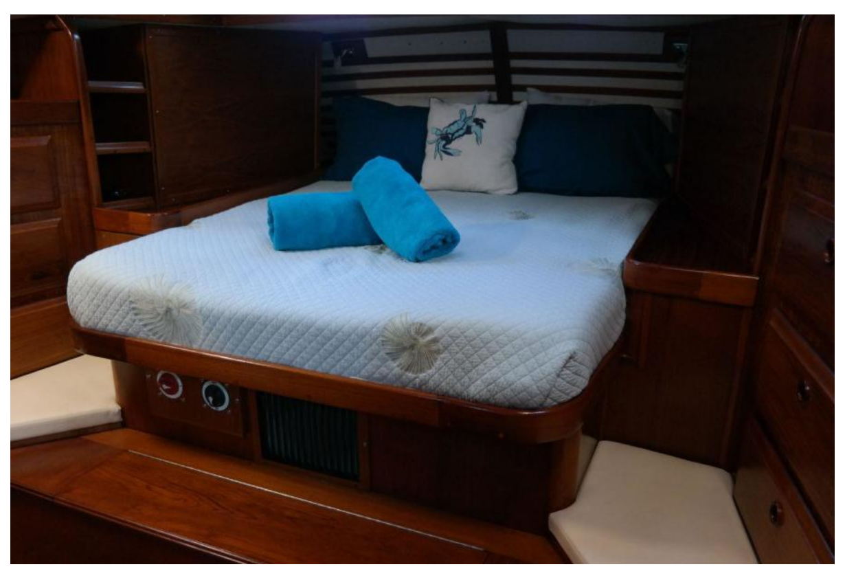
42 Endeavor 1985 (18)