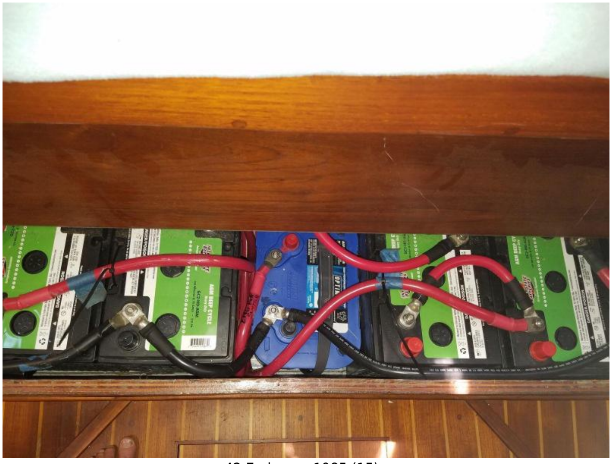
42 Endeavor 1985 (15)