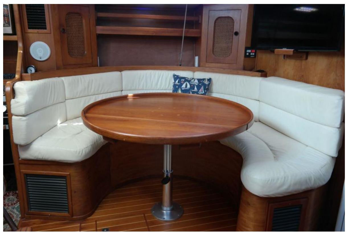
42 Endeavor 1985 (19)