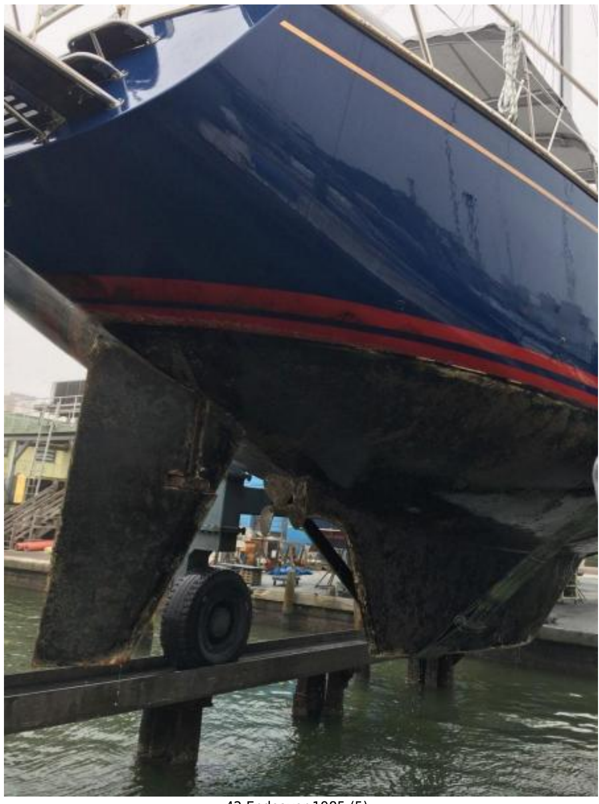
42 Endeavor 1985 (5)