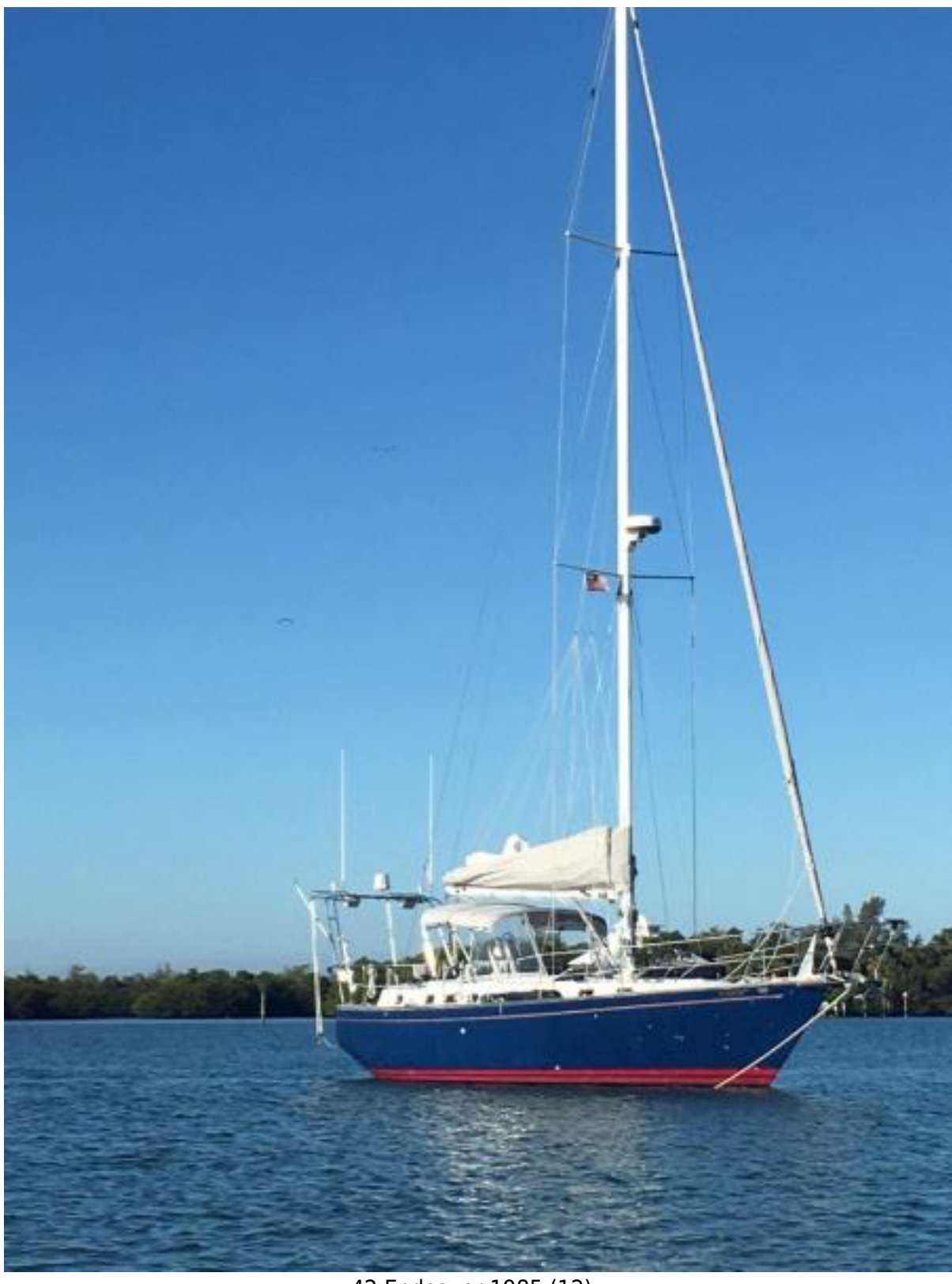
42 Endeavor 1985 (12)