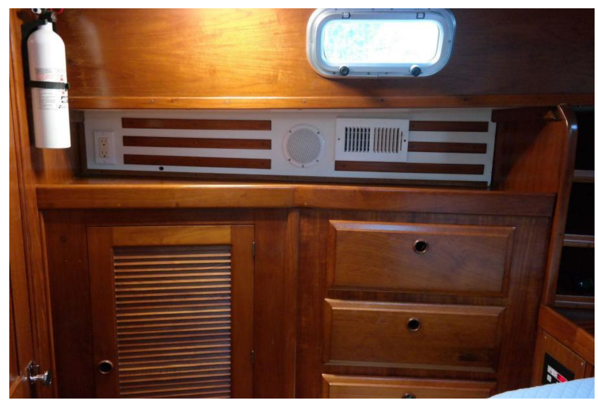
42 Endeavor 1985 (16)