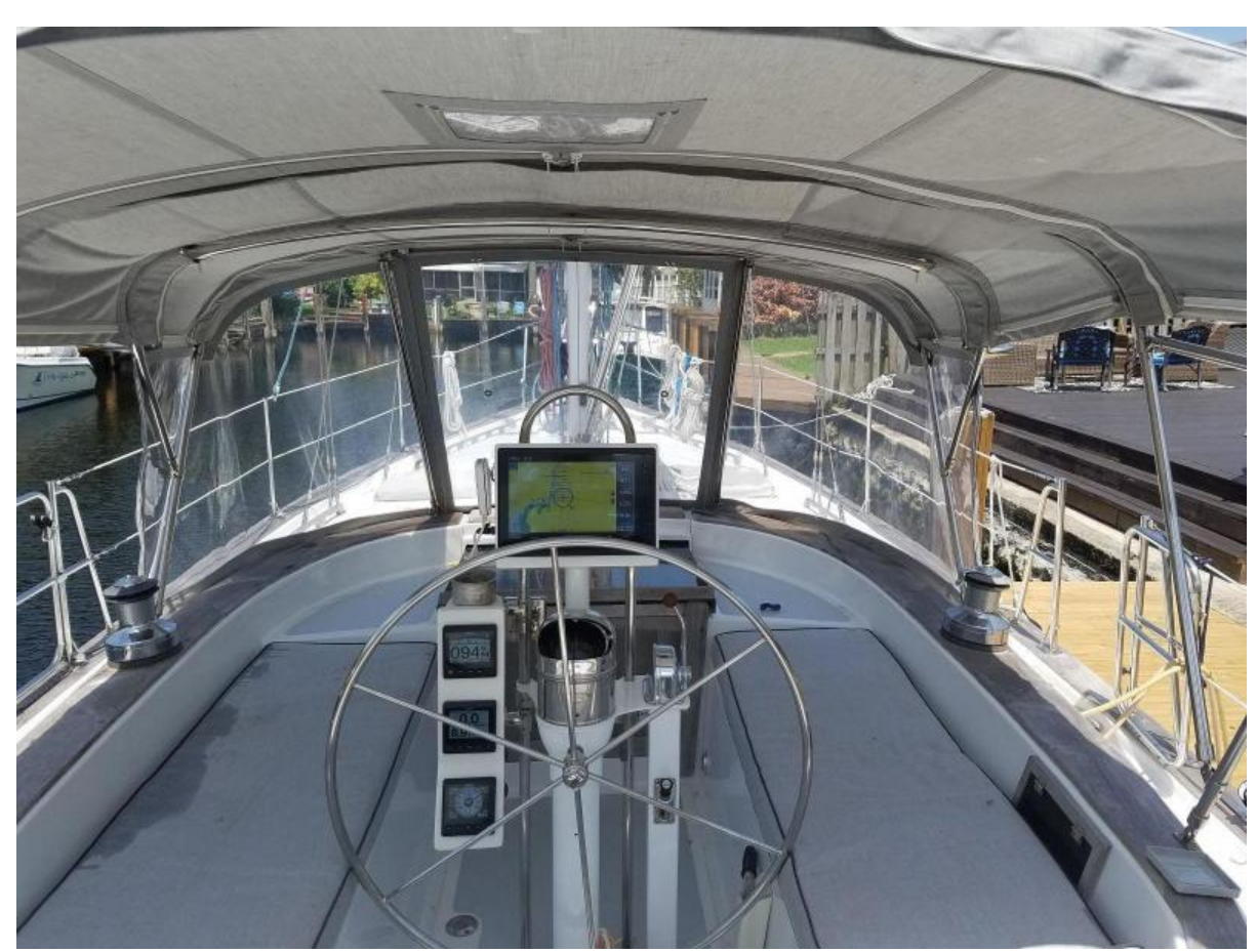
42 Endeavor 1985 (6)