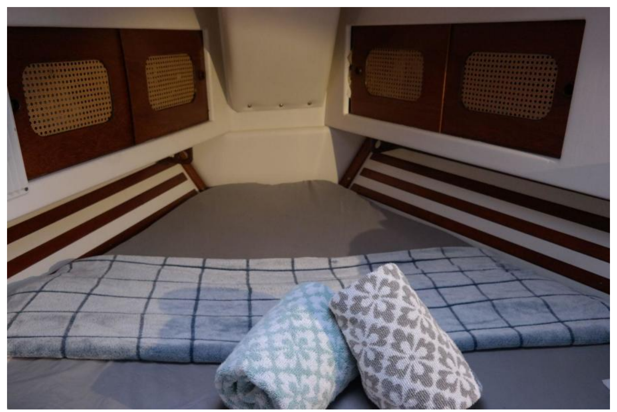
42 Endeavor 1985 (27)