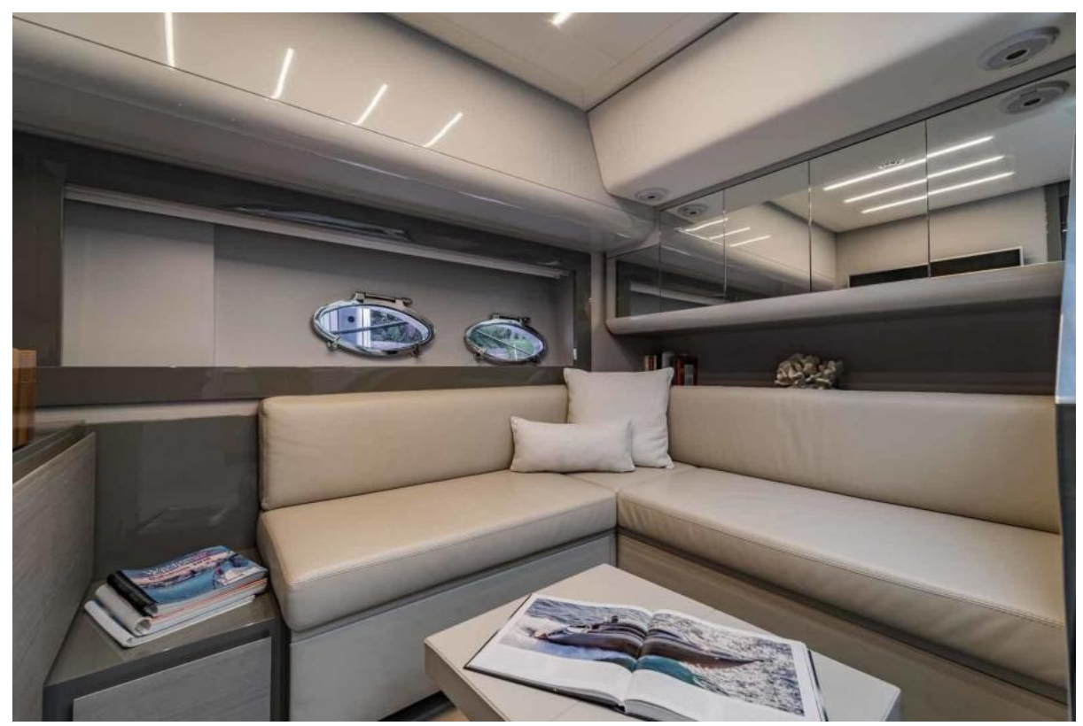
Lounge Looking Aft