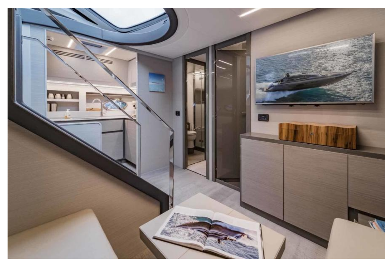
Lounge Looking Forward