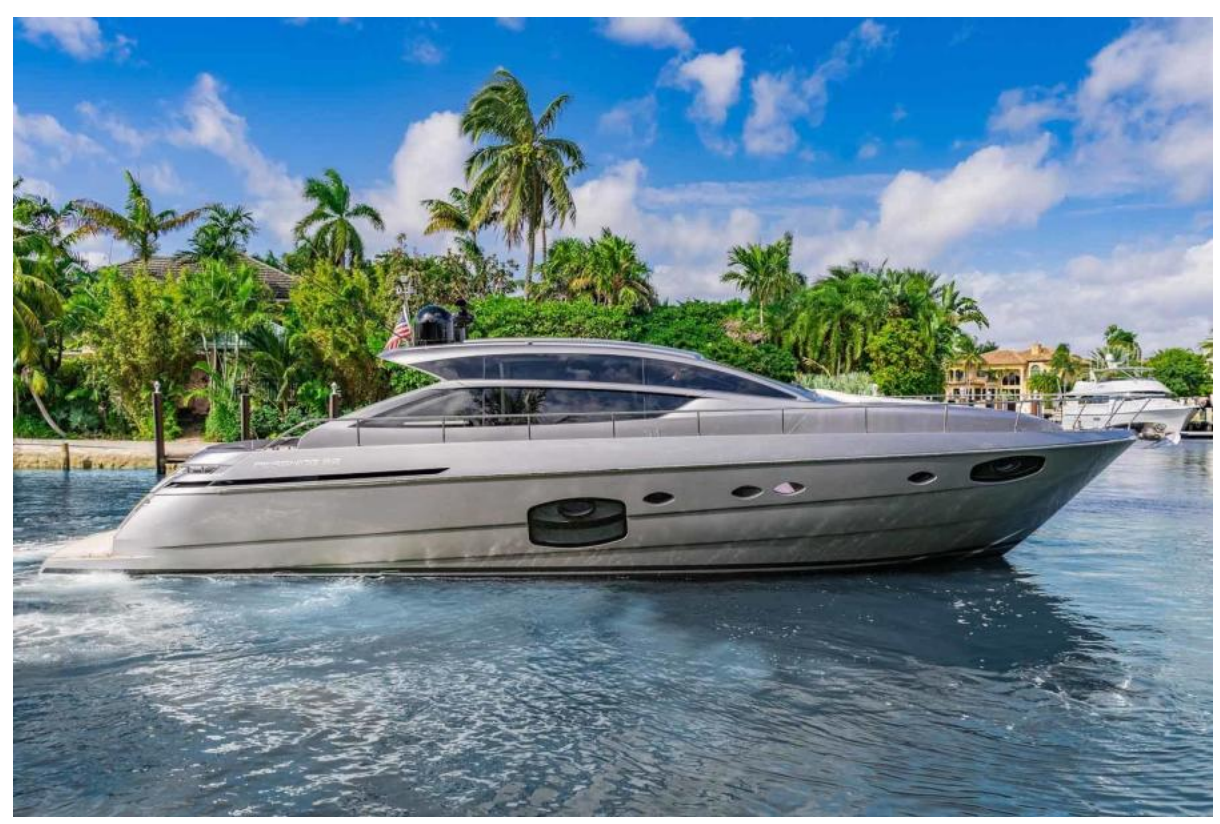
BEHIKE, 62' Pershing 2018 Profile