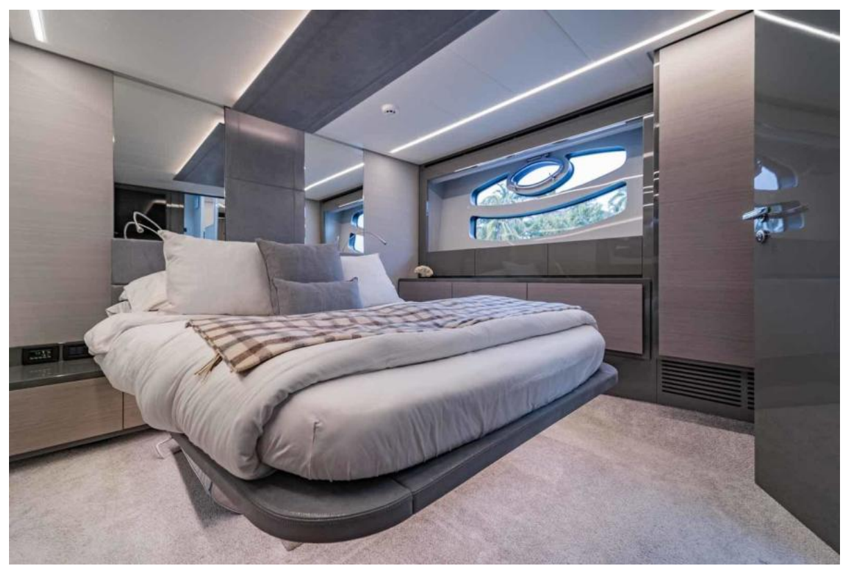
Master Aft To Port