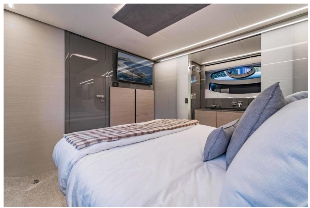
Master Looking Forward