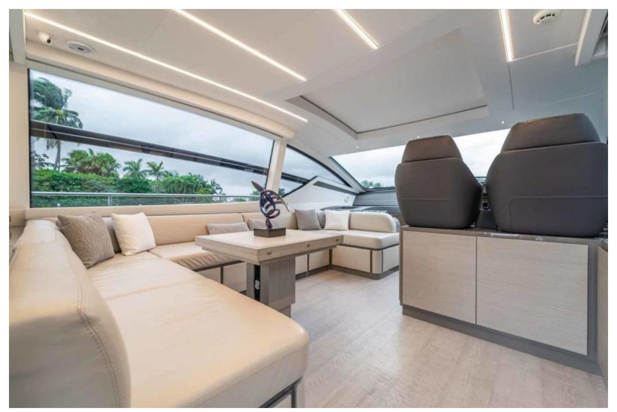
Salon Coach Roof Closed