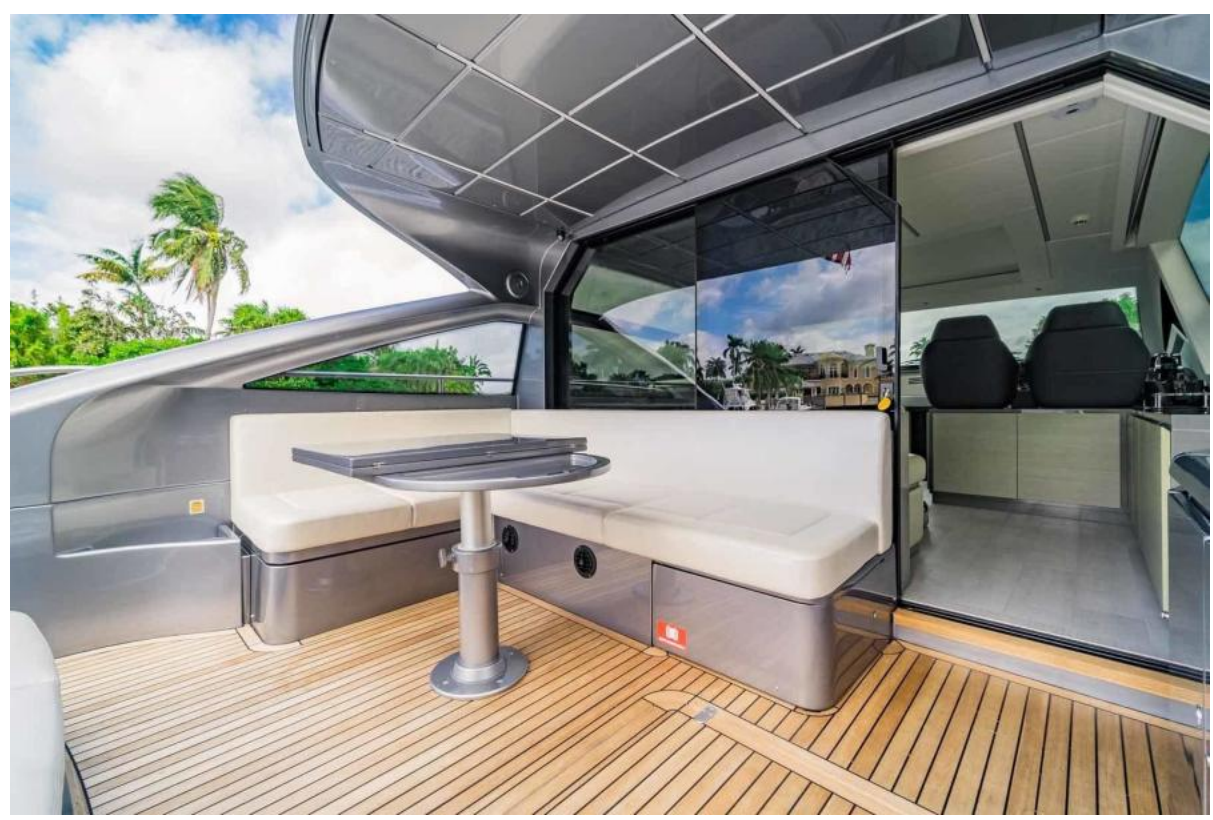
Aft Dining Area