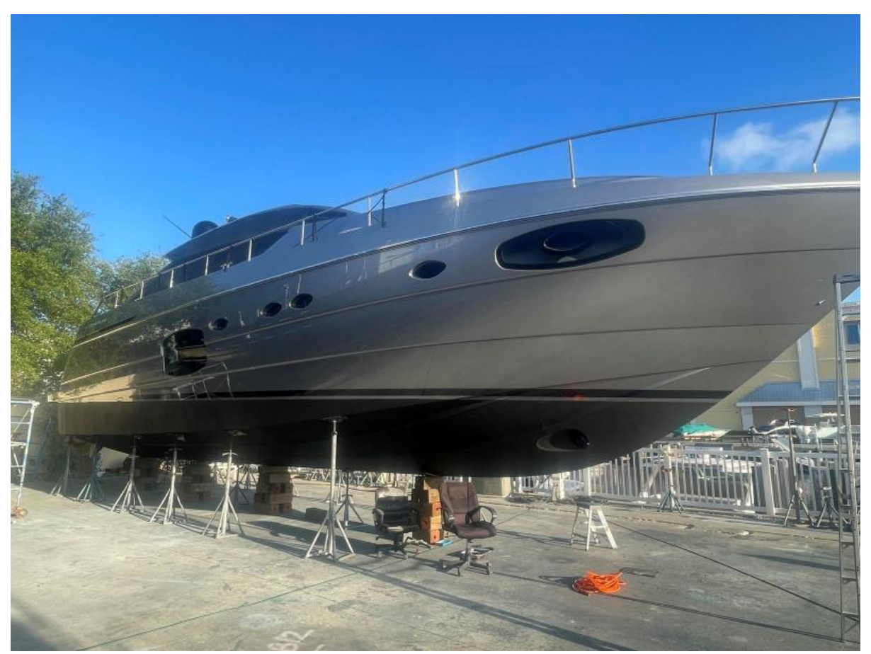
2023 Yard Visit