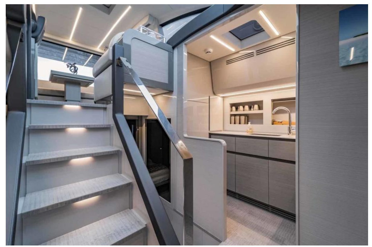
Steps To Below