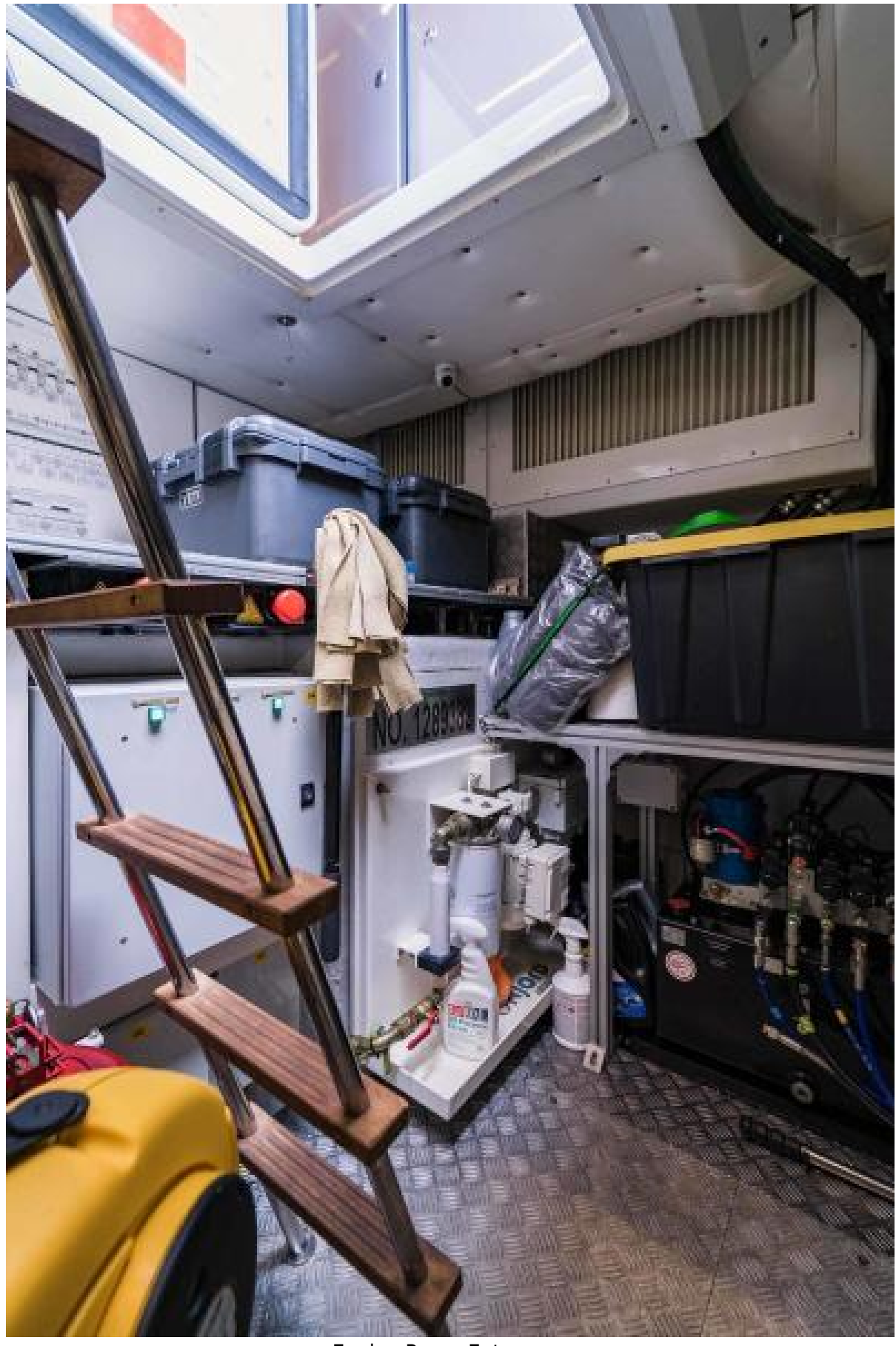
Engine Room Entrance