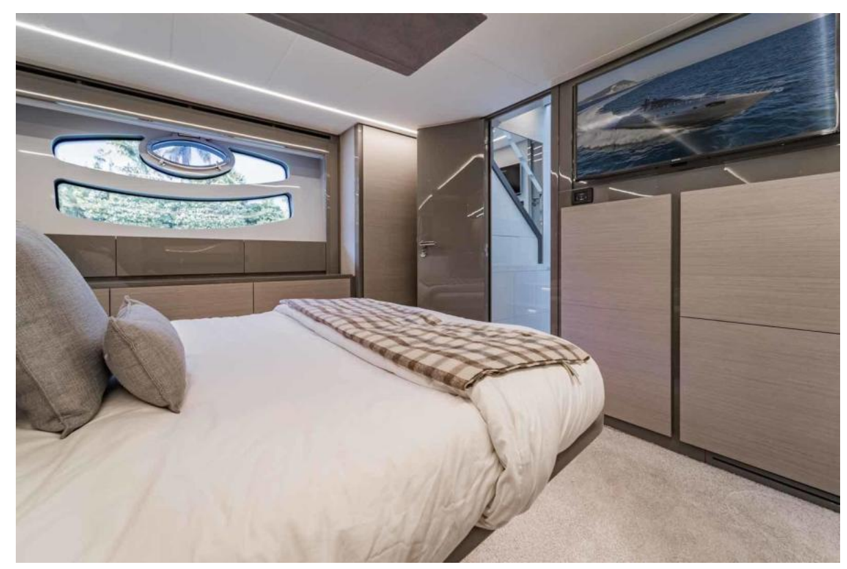
Master To Port