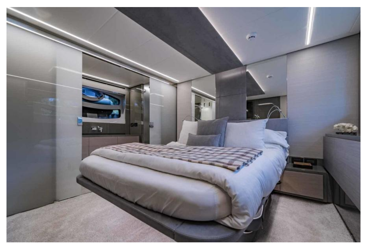
Master Aft To Starboard