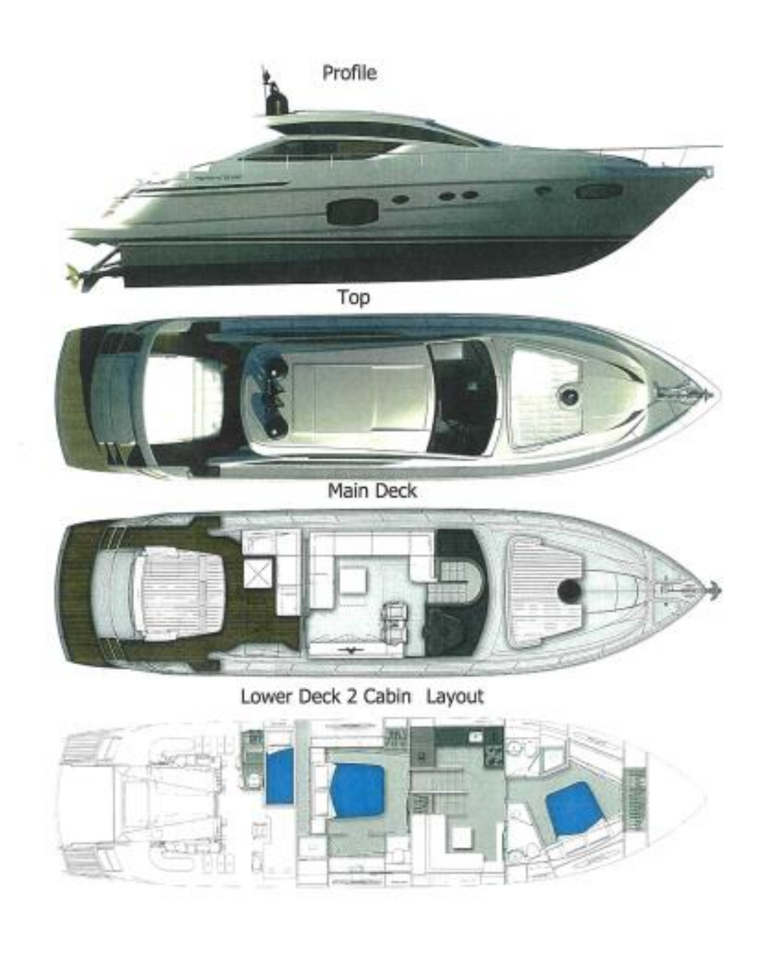
Layout 2018 62 Pershing