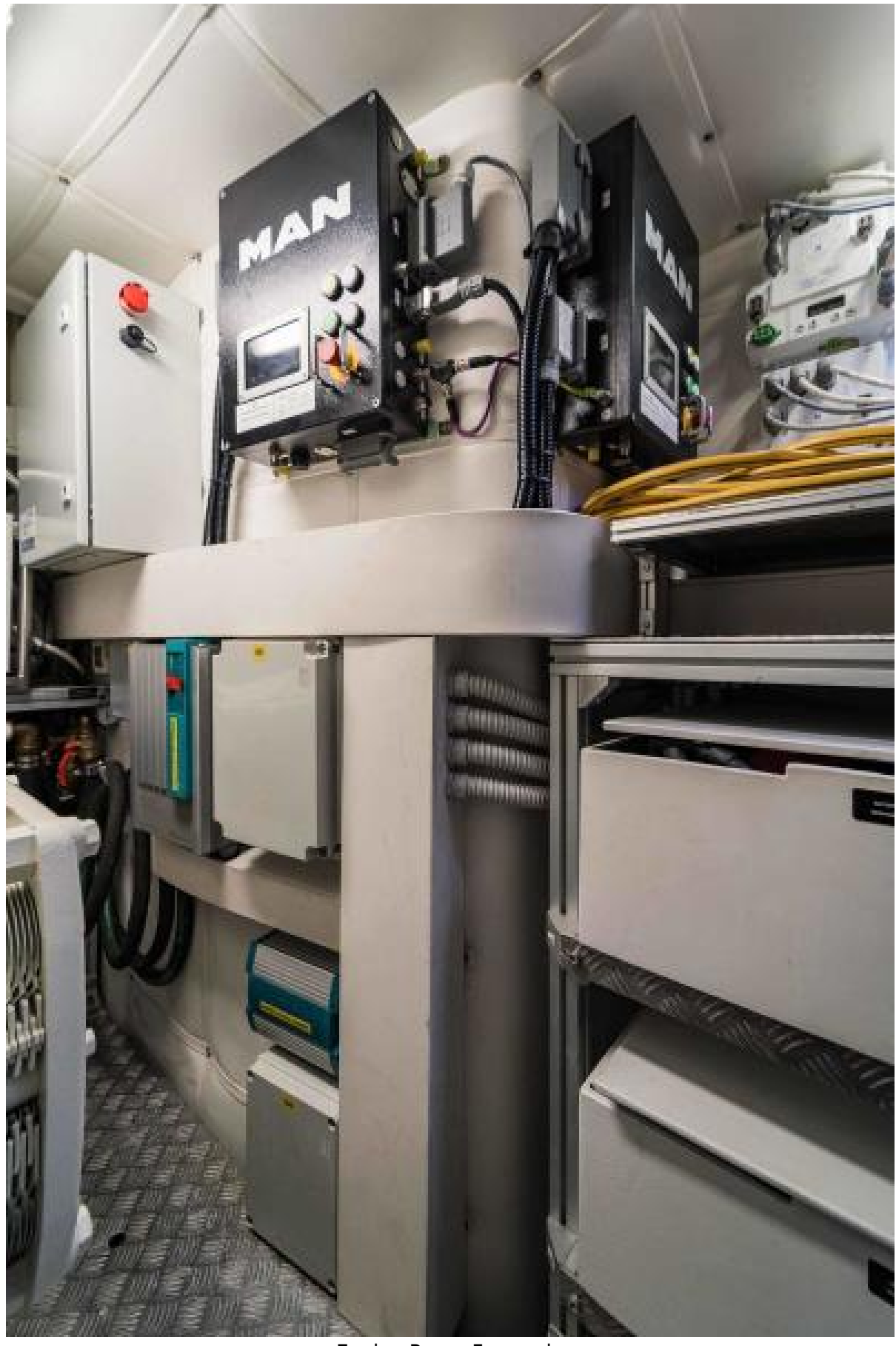
Engine Room Forward