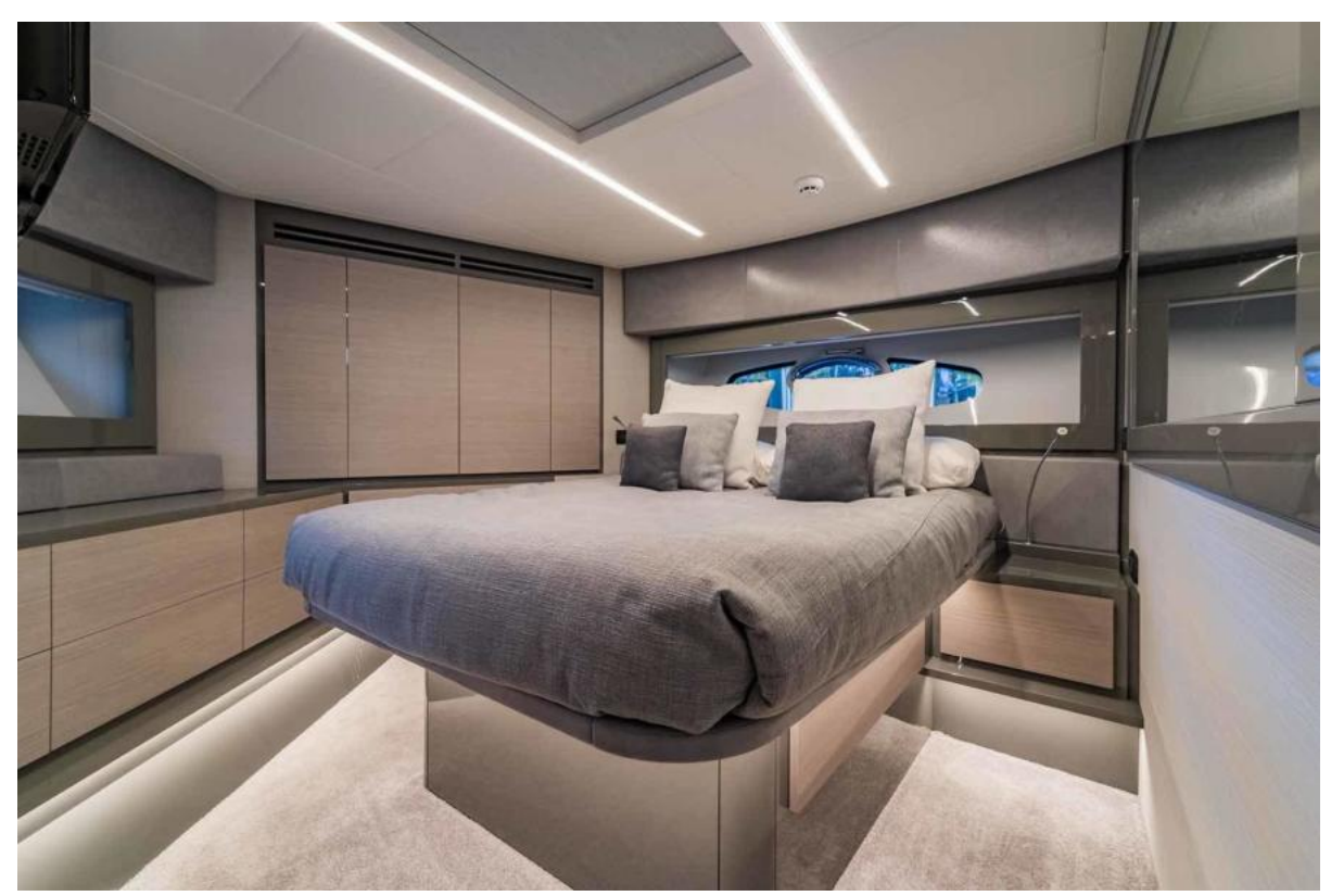
VIP Looking Forward