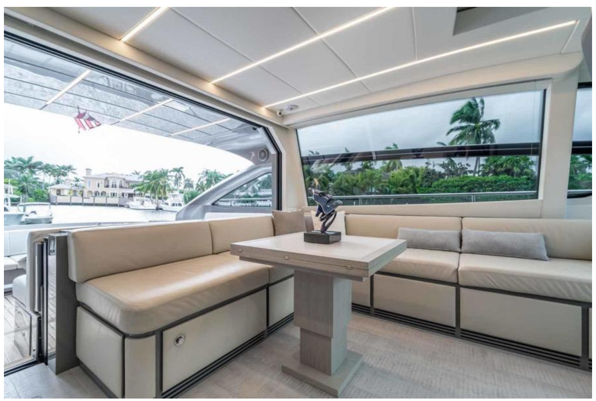
Salon Aft To Port