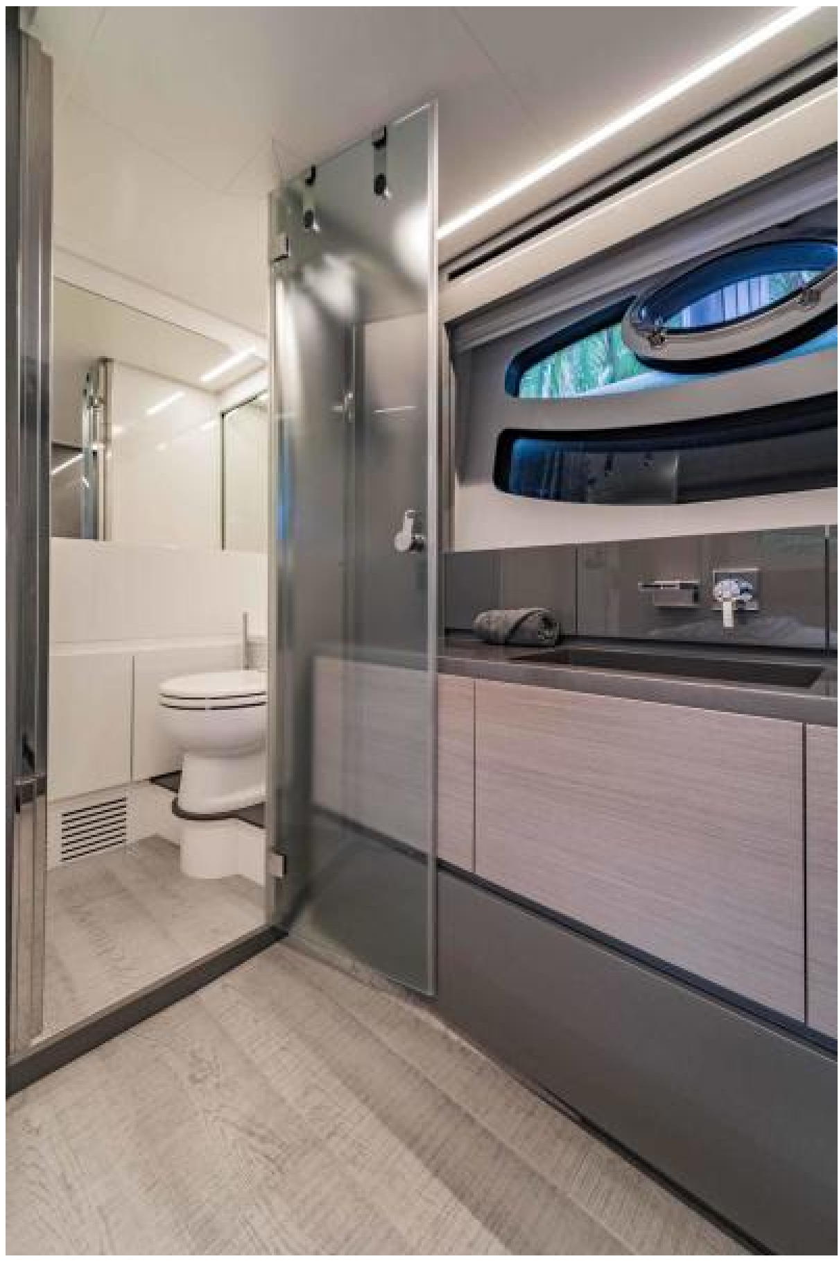
Master Head Looking Aft