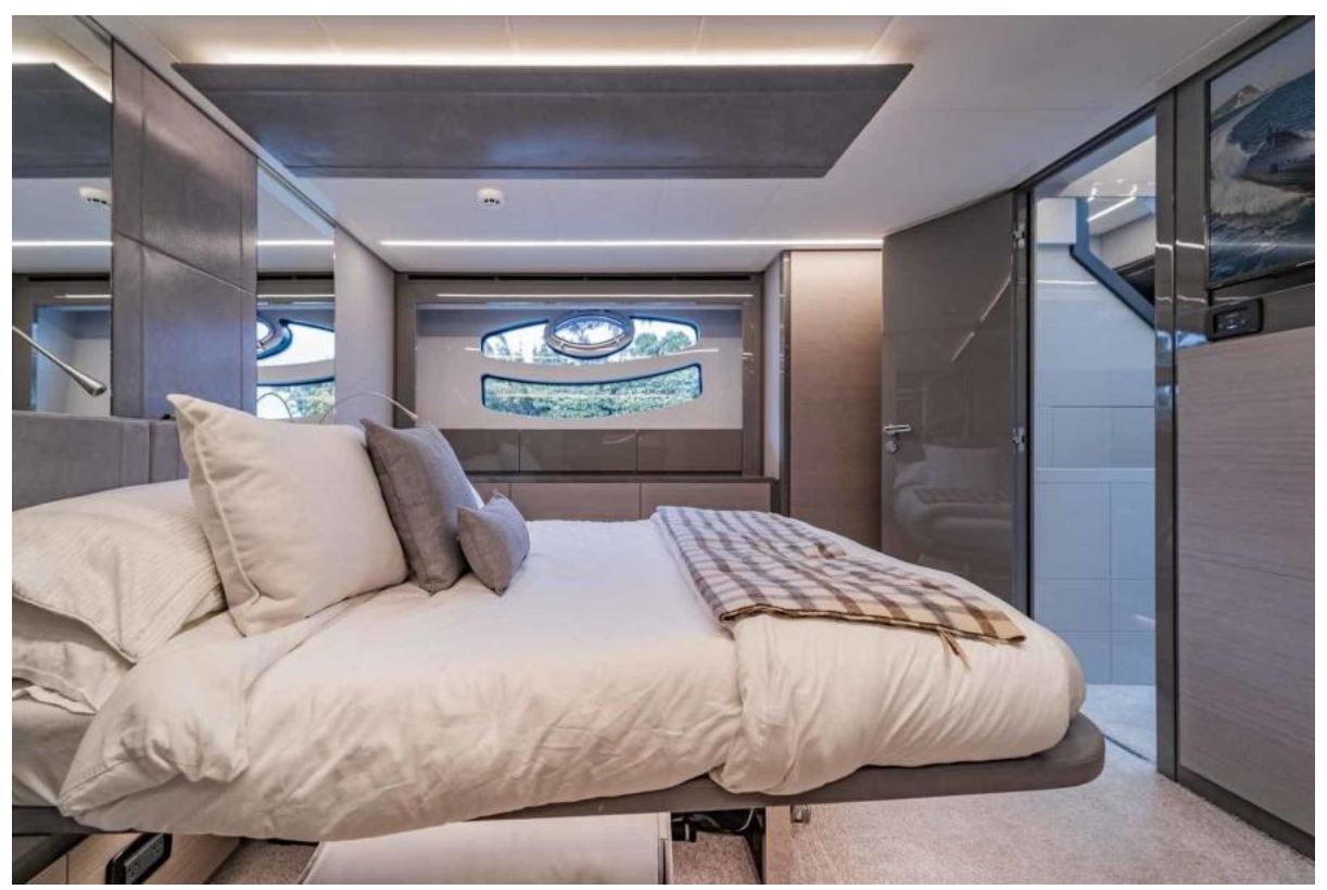
Master To Port