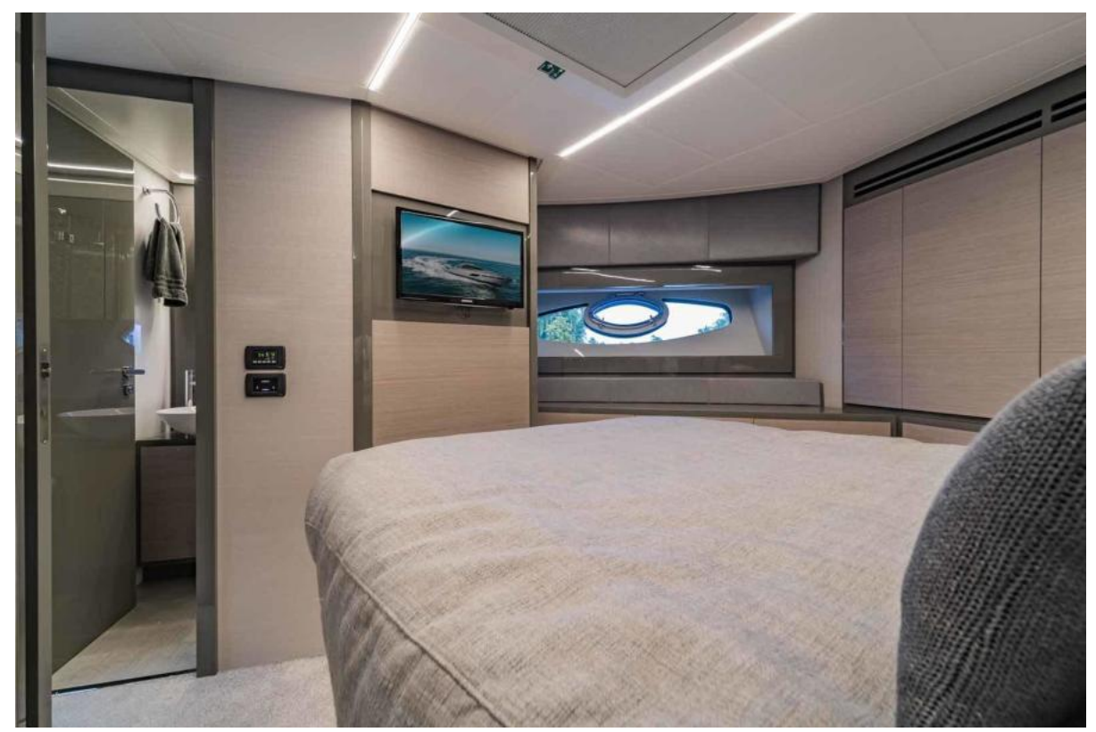
VIP To Port