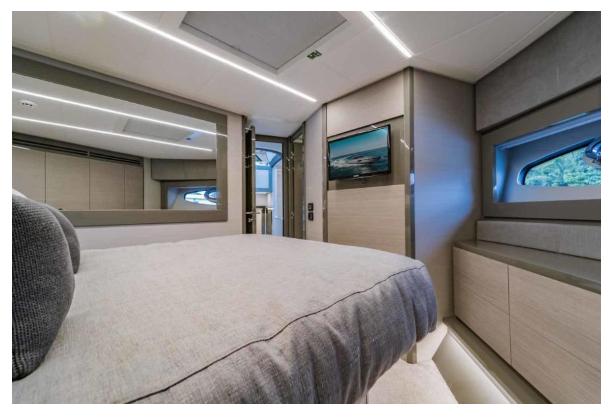
VIP To Starboard