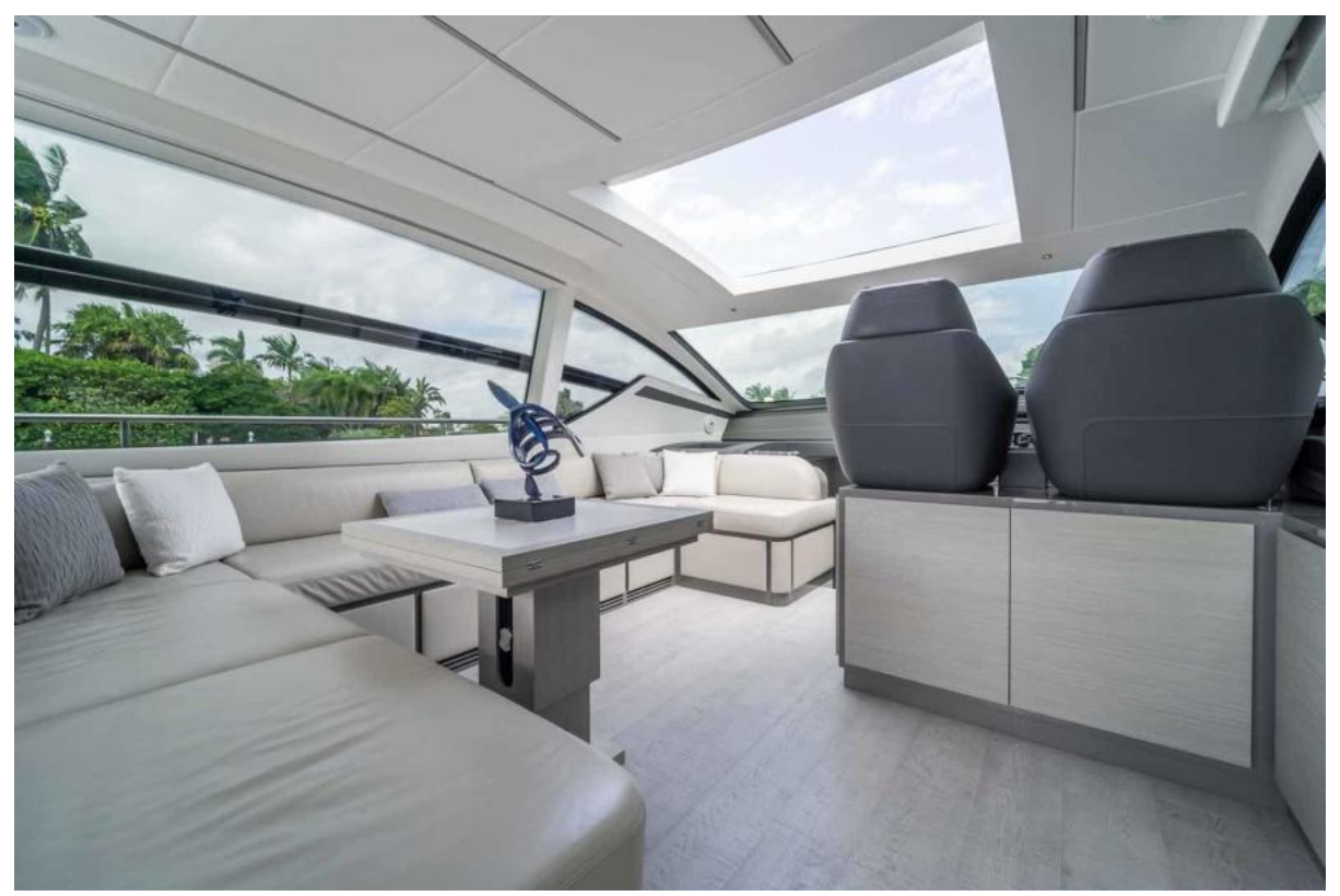
Salon Coach Roof Open