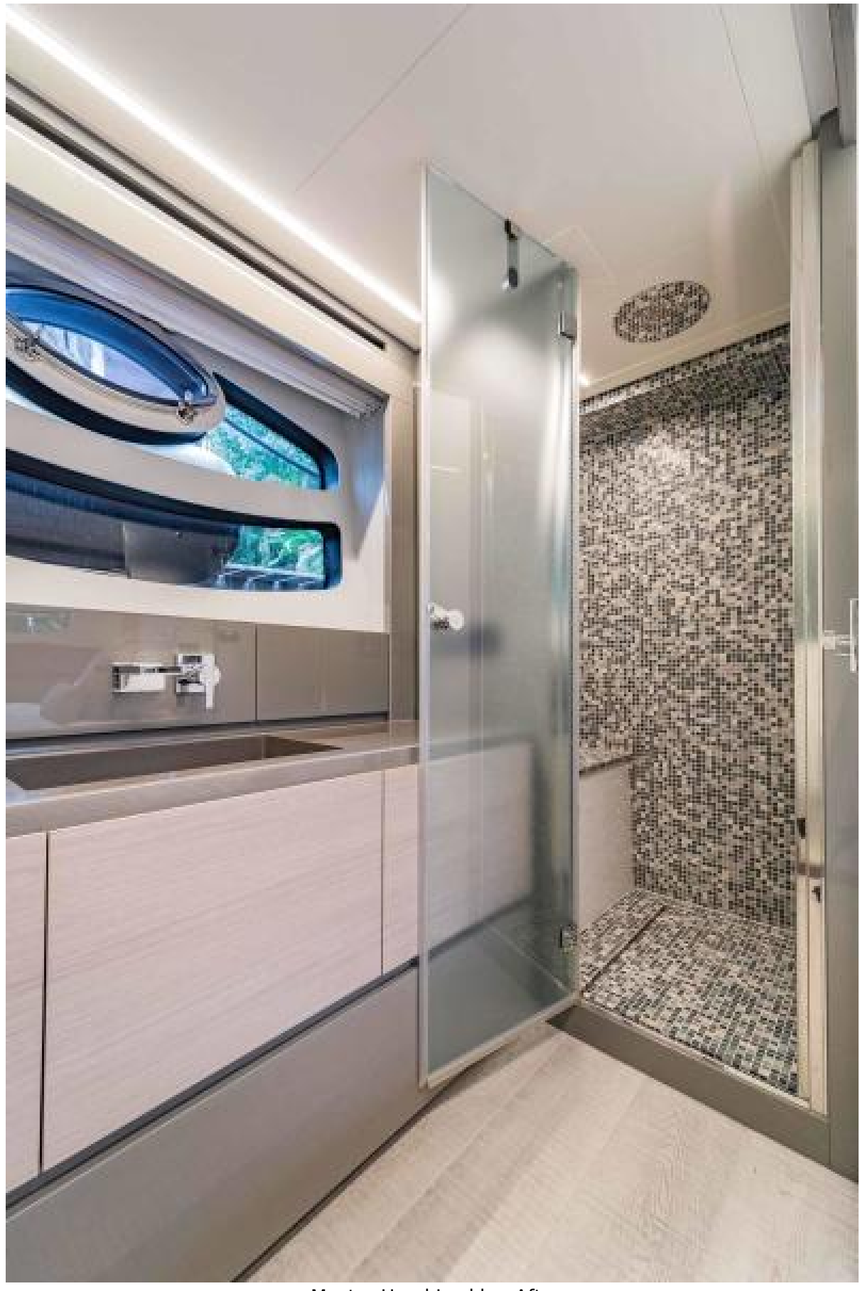
Master Head Looking Aft